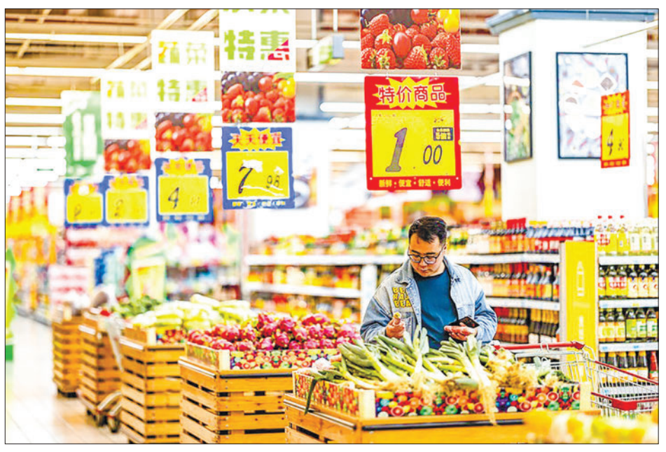
A consumer shops at a supermarket in Anshun, southwest China's Guizhou Province, 11 April 2023.

Local authorities should not unveil new measures to restrict auto purchasing, while regions that have already had restrictive measures on auto purchasing should improve