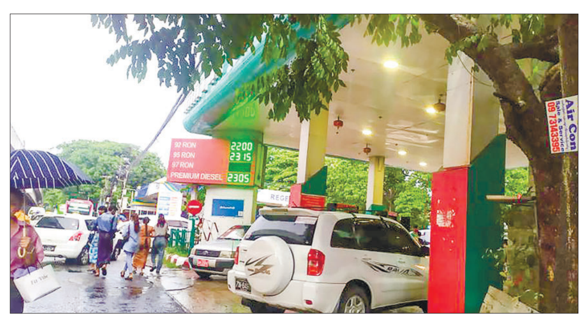
The photo taken on 26 July 2023 shows the sign displaying fuel prices at the petrol station in Yangon.

The committee is therefore steering the fuel oil storage and distribution sector effectively not to have a shortage of oil in the domestic market