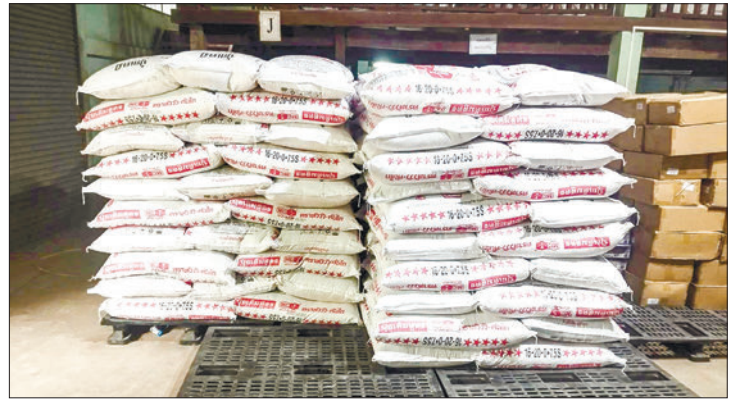
Seized illegal items in Kayin State.

THE combined on-duty teams under Kayin State Illegal Trade Eradication Task Force made inspections on 29 July and confiscated a Toyota HiAce vehicle and a Canter vehicle (approximate value of K30 million) carrying five kinds of goods worth K18.054 million including 240 packages of Dumex and 150 bags of fertilizer without official documents near Myaynigon junction in Myawady, a Scania tractor head and a trailer