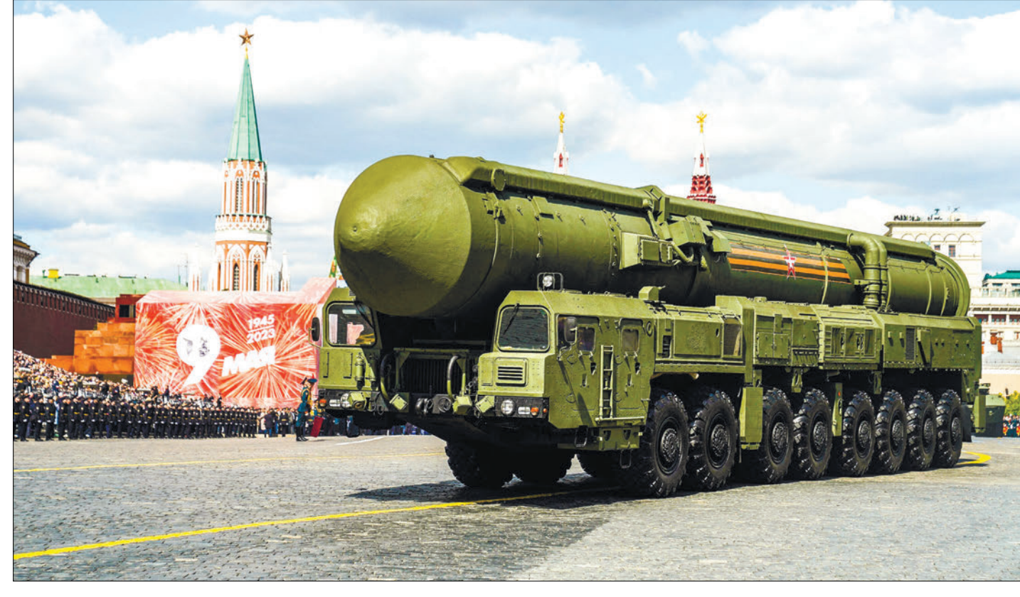
A Russian Yars intercontinental ballistic missile launcher rolls through Red Square during the Victory Day military parade in central Moscow on 9 May 2023.

Six vulnerable provinces are monitoring priorities, including South Sumatra, Riau, Jambi, West Kalimantan, South Kalimantan and Central Kalimantan.—Xinhua