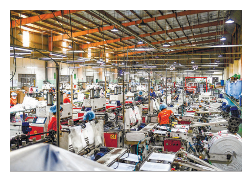
This picture taken on 2 December 2022 shows employees working inside a packaging factory of Nam Thai Son Group in Ho Chi Minh City.