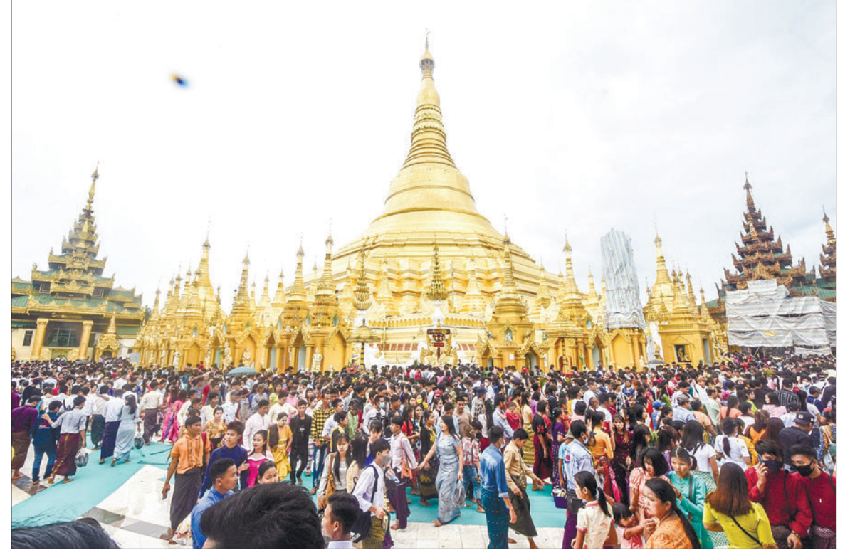
The platform of Shwedagon Pagoda is packed with pilgrims and visitors on the fullmoon of Waso on 12 July 2022.

The full moon of Waso holds immense importance in Buddhism, serving as a reminder of key events in the life of the Lord Buddha and the establishment of the Buddhist Lent. It is a time for reflection, meritorious deeds and observing the teachings of the Buddha. By adhering to the principles of peaceful coexistence and promoting the Universal Truths, individuals and nations can pave the way for a harmonious and prosperous society. The preservation of Buddhist heritage and its integration with Myanmar's cultural identity is crucial for future generations to appreciate and follow the path of the Buddha.