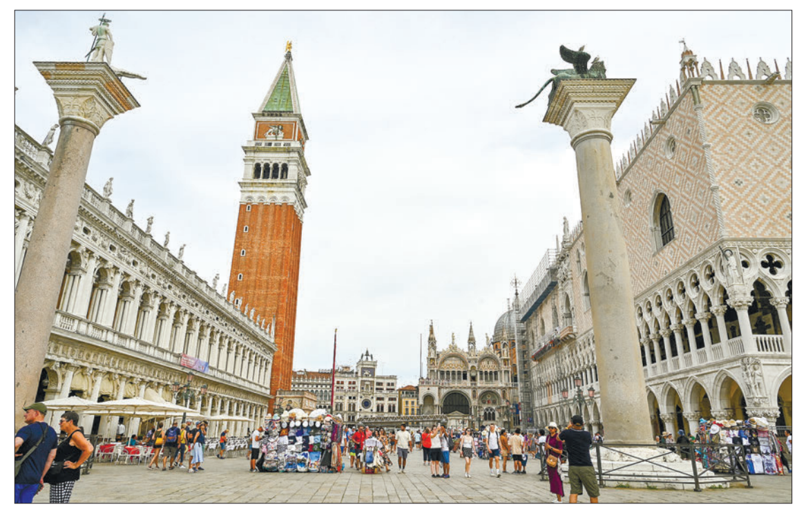
A view taken on 31 July 2023 shows St Mark's square in Venice. UNESCO is recommending that Venice be placed on the list of World Heritage in Danger, as "insufficient" measures have been taken to fight the deterioration of the site due in particular to mass tourism and climate change, according to a decision made public on 31 July 2023. UNESCO, the UN's cultural wing, put Venice on its heritage list in 1987 as an "extraordinary architectural masterpiece", but the body has warned of the need for a "more sustainable tourism management".

"Some of these long-standing issues have already led to the deterioration of the inherent characteristics of the property and its attributes," UNESCO said, warning that developments including high rise buildings risk "having significant negative