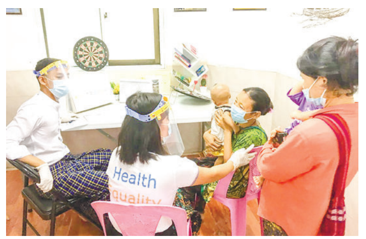
The service for public health is being carried out by the UNFPA and the collaborative team.

collaborating in the health sector, providing medicine and medical equipment for reproductive healthcare activities, organizing courses for the development of healthcare, and the situation of collaborating on maternal and reproductive health activities in areas affected by Cyclone Mocha. The UNFPA is currently working together with relevant ministries on activities in Myanmar such as reproductive health, population and development, achieving gender equality, and taking censuses. — TWA/CT