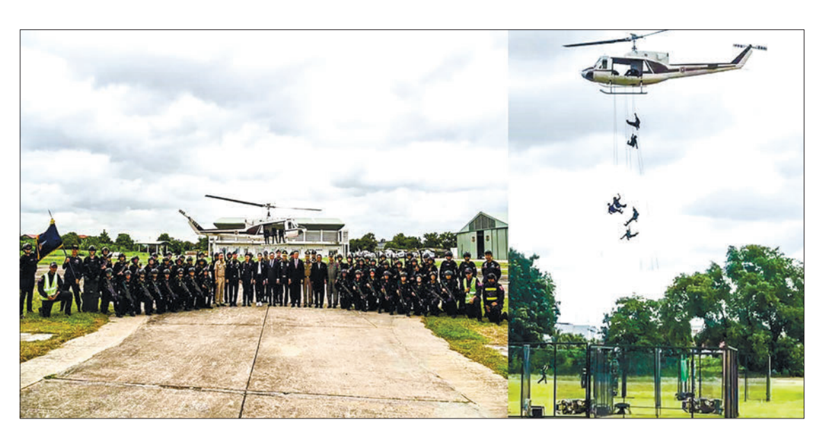
The concluding event of the Eagle 19 training in progress yesterday in Thailand.

The Myanmar delegation arrived back in Yangon on the same night.