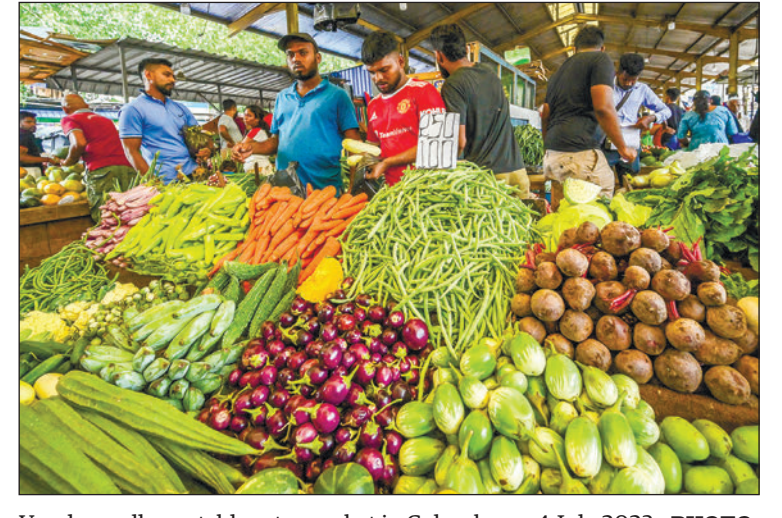
Vendors sell vegetables at a market in Colombo on 4 July 2023. PHOTO:

$46 billion foreign debt in April 2022 and many of its 22 million people endured months of food, fuel and medicine shortages.