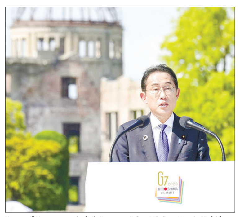
Group of Seven summit chair Japanese Prime Minister Fumio Kishida holds a press conference following the conclusion of the three-day event in Hiroshima, western Japan, on 21 May 2023.