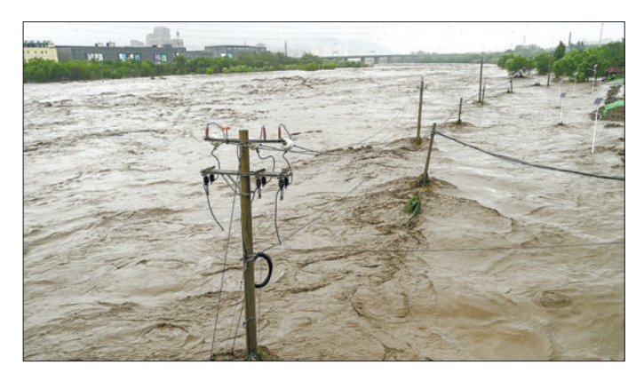
This picture shows a view of the overflooded Yongding river, after heavy rains in Mentougou district in Beijing on 31 July 2023. PHOTO: AFP

She showed AFP a video on her phone, shared among residents of the area, of workers attempting to resuscitate an unconscious man, as well as footage of a man desperately clinging to a pole with one hand as water washes over him.—AFP