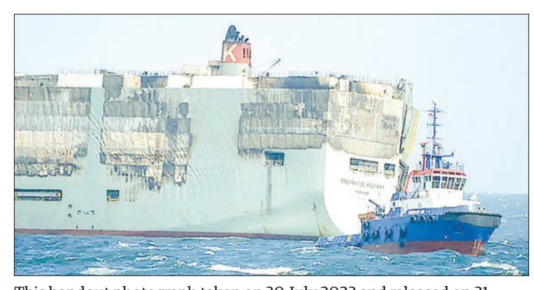
This handout photograph taken on 30 July 2023 and released on 31 July 2023 by the Dutch coastguards, shows the Panamanian-registered car carrier ship Fremantle Highway, after a fire broke out late on 25 July 2023, killing one crew member, and prompting a massive effort to extinguish the flames.

One sailor died after he and 22 others were rescued from the burning ship that had forced some crew members to jump