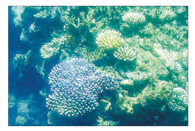
This picture taken on 7 March 2022 shows the current condition of the coral on the Great Barrier Reef, off the coast of the Australian state of Queensland.

THE UN's cultural agency UN-ESCO said Monday its experts recommended giving Australia more time to boost protection of the Great Barrier Reef which the organization's World Heritage Committee has threatened to declare "in danger".