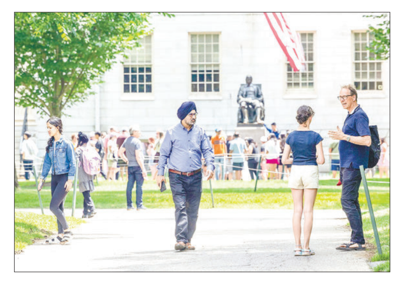
People walk through Harvard Yard on the Harvard University campus on 29 June 2023, in Cambridge, Massachusetts.

Their survey of 908 environmental scientists of eight nationalities revealed greater costs for non-native speakers in reading and writing English papers and that they even forwent attending international conferences held in English, according to an online journal published 18 July in PLOS Biology. The study conducted on-