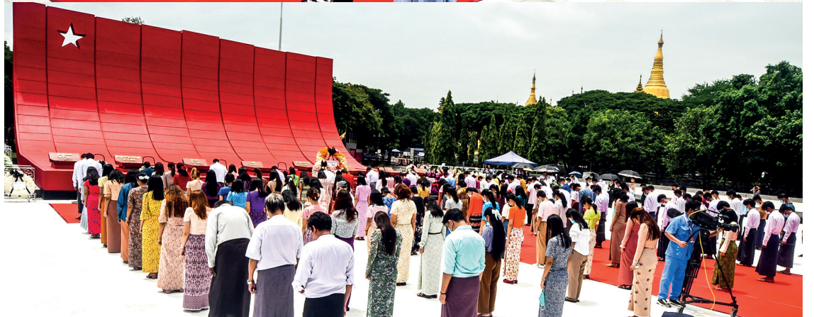
People pay tribute at the mausoleum in Yangon yesterday.