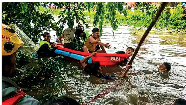
The rescue operation by the social assistance association is in progress during floods in Mawlamyine (above and left photos.)

children were reported missing after drowning in the lower part of Thirimyine 8 Street. After an extensive search by social rescue teams, their lifeless bodies were discovered after 3 pm.