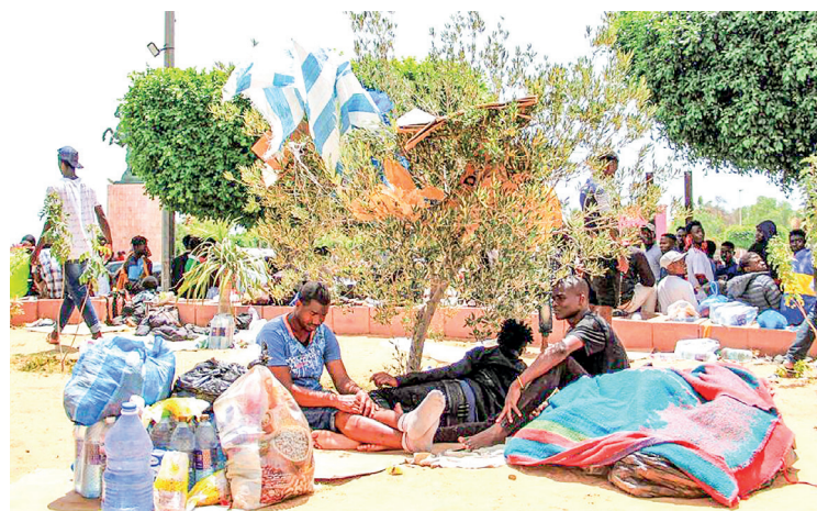
Sub-Saharan migrants rest under the shade of a tree in Sfax, Tunisia.

ported on Sunday that Libyan border guards rescued dozens of migrants who were visibly exhausted and dehydrated, and who said Tunisian authorities had taken them there. This followed testimony from NGOs and witnesses to AFP a few days after hundreds were expelled from the Tunisian port city of Sfax in early July. — AFP