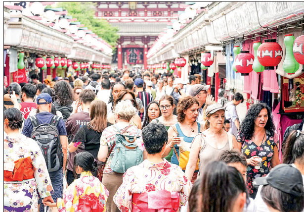
Tourists walk along the Nakamise shopping street in Tokyo's Asakusa district on 19 July 2023.

Japan saw 10.71 million arrivals in the six months, equivalent to 64.4 per cent of the level seen from January to June in 2019 and exponentially higher than the 507,630