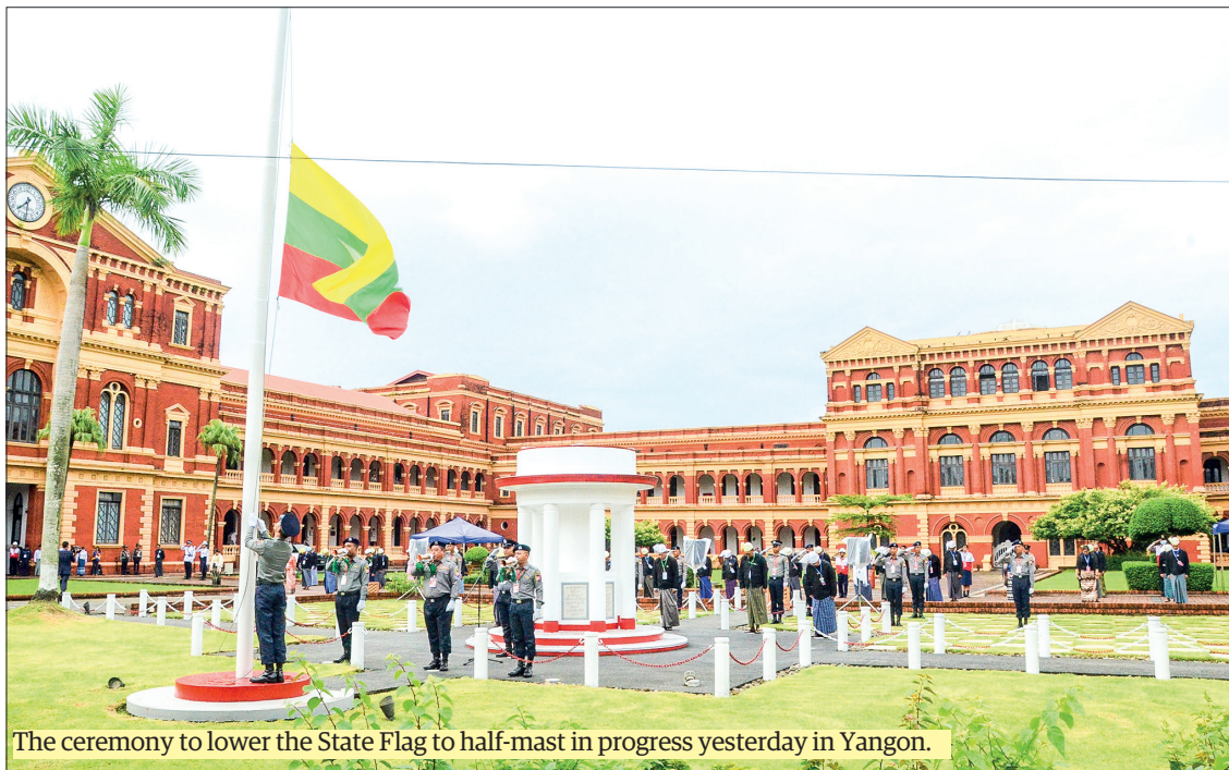
The ceremony to lower the State Flag to half-mast in progress yesterday in Yangon.

A ceremony of lowering the State Flag to half-mast was held at the Secretariat (former Ministers' Office) where General Aung San and leaders were assassinated, to mark the 76 th Martyrs' Day on the morning of 19 July 2023.