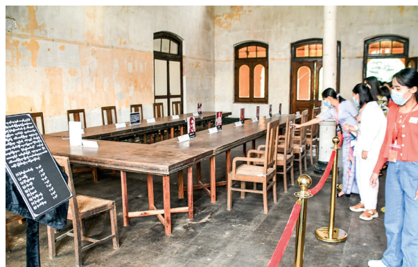
The meeting hall where the assassination took place.