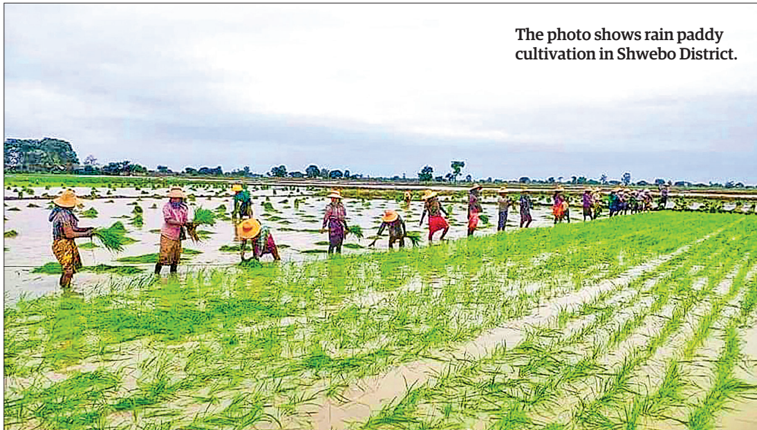
The photo shows rain paddy cultivation in Shwebo District.

EL Niño might cause less rainfall and could disrupt the rice supply across Asia, which accounts for 90 per cent of global production of rice, experts warned. However, Myanmar has had heavy rainfall in recent days and only little damage occurs.