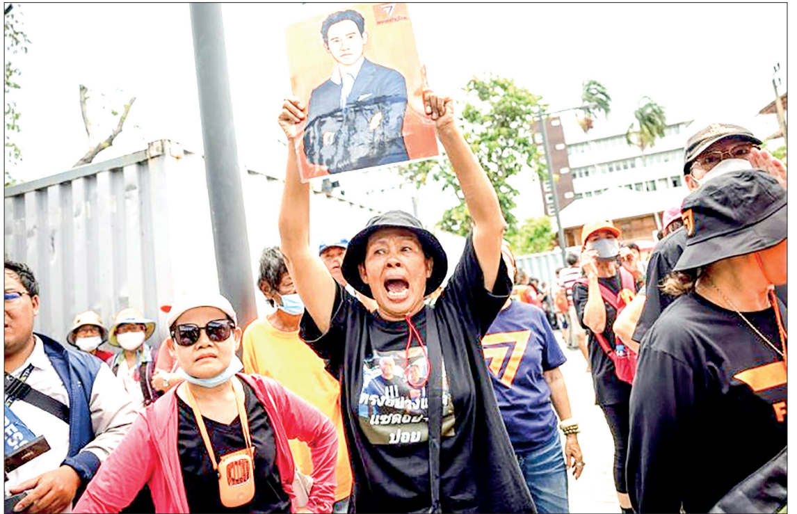
MFP supporters react after hearing about the suspension of leader and prime minister candidate Pita Limjaroenrat as they gather outside the Thai Parliament.

Pita, Harvard-educated and wealthy from a family-run agri-food business, has said the shares were inherited from his father. He has 15 days to respond to the case. After he left the parliament, lawmakers voted by a large margin to rule that he could not be considered for the post a second time. — AFP