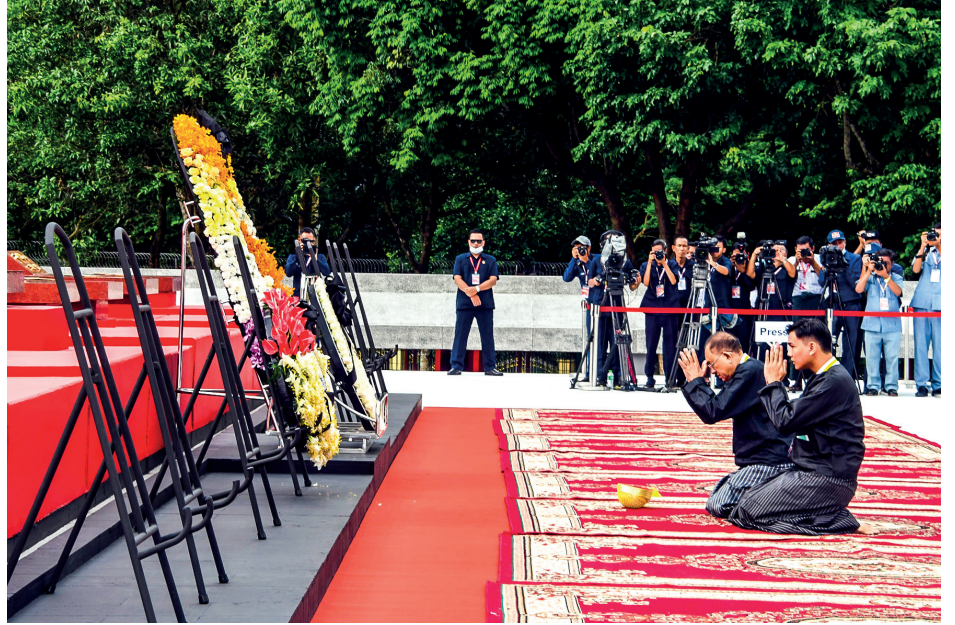
Family members pay tribute to Thakin Mya.