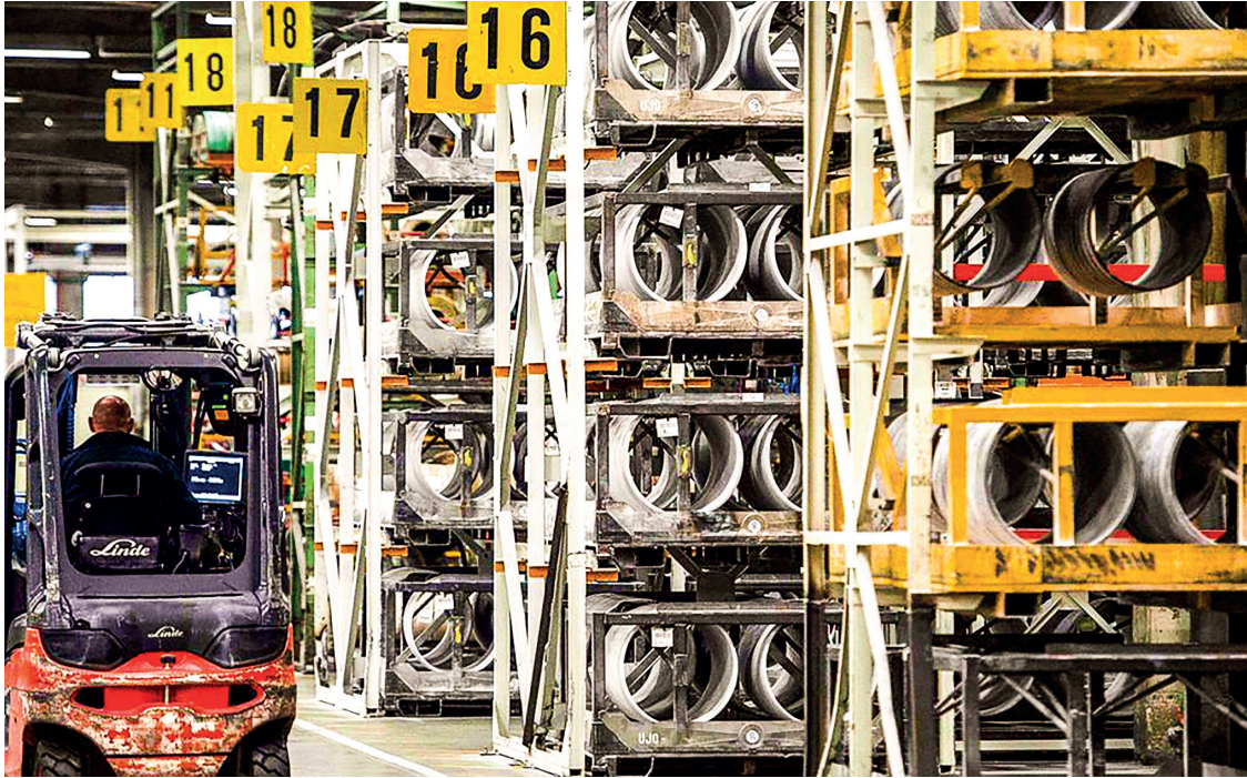
Production at US factories dropped for a second straight month in June as output of motor vehicles and a range of other goods declined, suggesting that higher interest rates were hurting the manufacturing sector.

US industrial production fell by more than analysts expected last month, the Federal Reserve said Tuesday, with a sharp contraction in output seen in consumer durables like automotive products and carpeting. June marked the second consecutive monthly decline, reversing some of the positive figures seen earlier this year and providing further evidence of slowing production as the Fed prepares to weigh another inter-