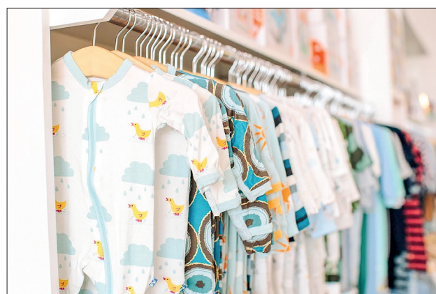
Catimini, a childrenswear brand, is going to close 44 stores in France, Belgium, and Luxembourg. This is part of a plan to help the company recover from financial difficulties.

“On 18 July, the management team presented staff representatives with a company recovery plan, which should reduce losses and allow the brand to be redeployed,” Catimini said in a press release. The plan foresees the closure