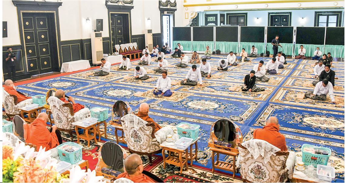
The commemoration and donation event in progress yesterday in Yangon.