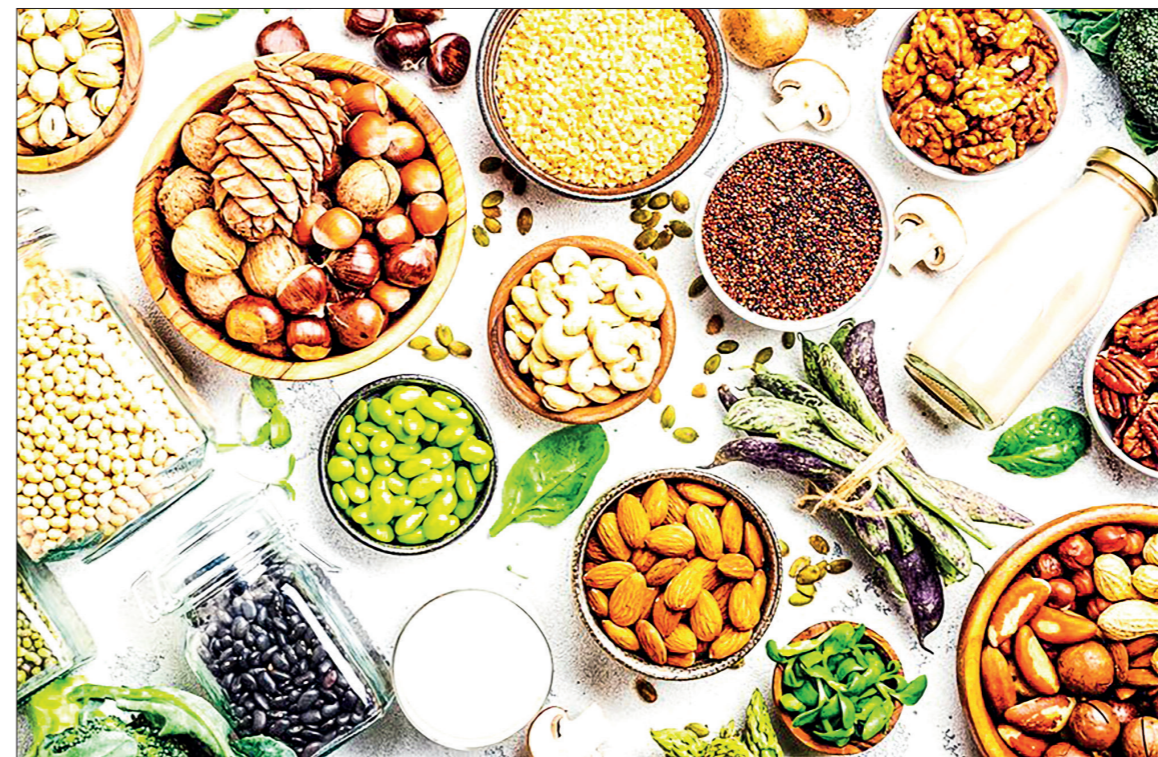
When people reduce meat, they typically eat far more plant-based foods if they can choose healthy options.