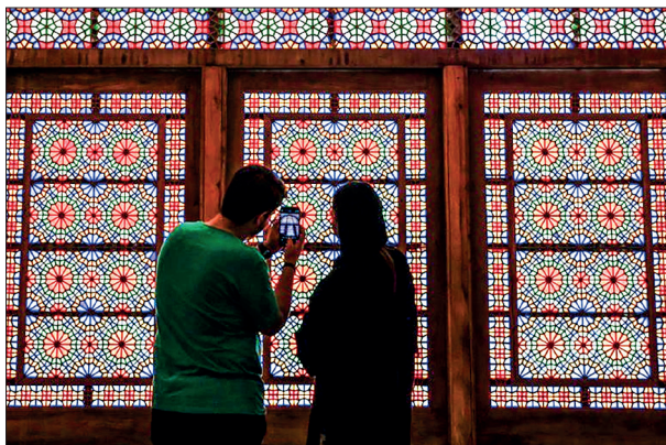
A man and a woman stand in front a stained glass window at Dowlat Abad Garden in Iran's central city of Yazd on 3 July 2023.

Iran's Beijing-brokered diplomatic thaw this year with Saudi Arabia paved the way for direct flights, and Tehran is also seeking closer ties with other countries from