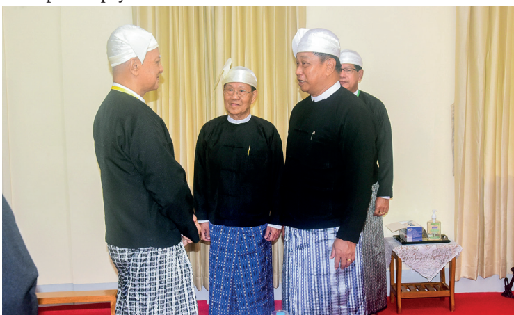
Admiral Tin Aung San warmly greets family members of martyr leaders.