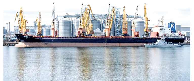
Ukraine's agriculture ministry said the grain was meant to be "sent through the grain corridor 60 days ago". PHOTO: AFP

basis of the now-lapsed grain deal, which was brokered last by the UN and Türkiye amid fears of food shortages in vulnerable nations. — AFP