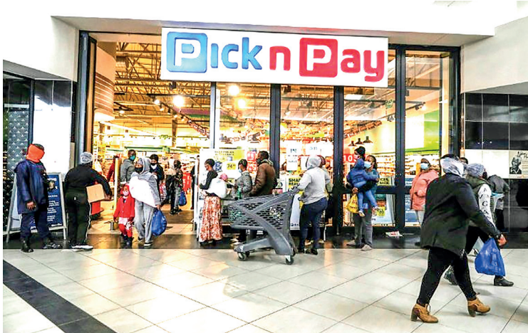
Consumer boost: Inflation in South Africa has fallen to the lowest level in 20 months. PHOTO: AFP/FILE

Prices of oils and fats also decreased for a tenth consecutive month. Wine and beer were instead on the up, pushing prices for alcoholic beverages and tobacco to 6.1 per cent from 5.9 per cent in May. — AFP