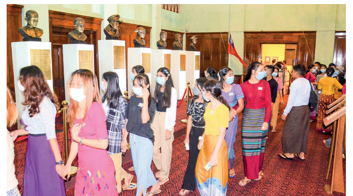
The display in the parliamentary building.