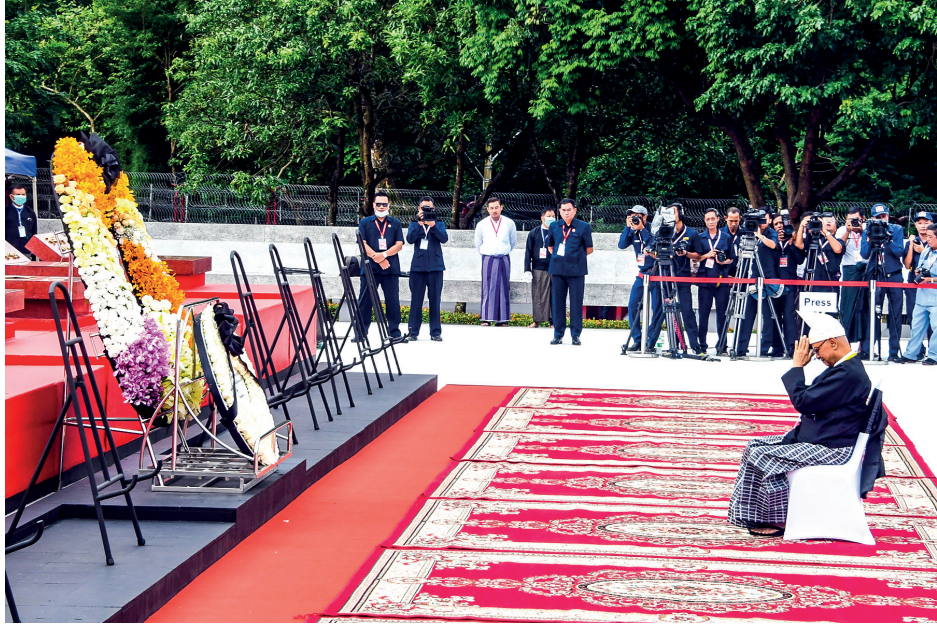
U Aung San Oo, son of General Aung San pays tribute at the mausoleum.

Many people visited the Martyrs' Mausoleum, the Bogyoke Museum and the Secretariat (former Ministers' Office) yesterday. — MNA/TTA