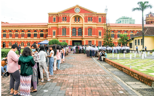
People visit the former Ministers' Office in Yangon.

People and vehicles on the road stopped and commemorated the fallen leaders by saluting and honking at 10:37 am on the 76 th Martyrs' Day.