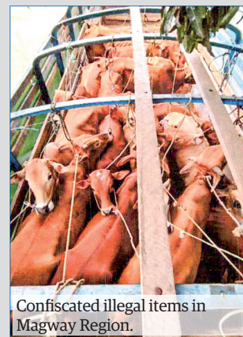
Confiscated illegal items in Magway Region.