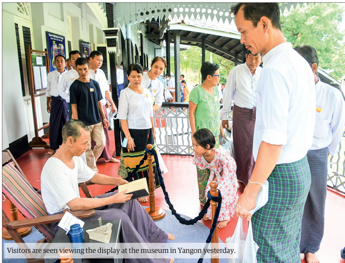
Visitors are seen viewing the display at the museum in Yangon yesterday.

reading in the deck chair. The books the general read, the lighter bearing his name and the ashtray and the cigar box are among the display items. From there on, you can see the furniture in the dining room of the family of the general. There are 5 boards depicting his childhood, his university student life, and his life as a political and military leader and state leader. Following the study in the dining room, there are two boards on which the life events of the general are described briefly in both Myanmar and English and are waiting for you. Besides, the brief history of Bogyoke Aung San Museum (Yangon) described in English, Myanmar bilingually is displayed in the exterior corridor of the museum. On the way back inside lies the settee and furniture which the family of the general used, the long coat given as a present by Mr Jawaharlal Nehru who was a great leader of India, the radio, the oil painting by artist U Ngwe Gaing which portrayed