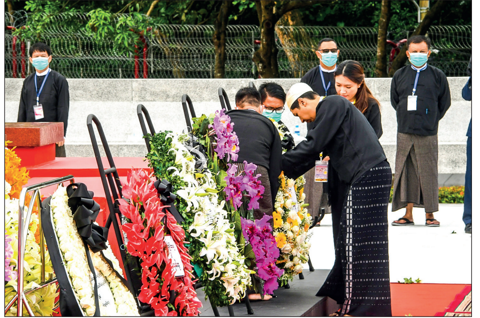
Family members lay wreaths to pay tribute to U Razak.