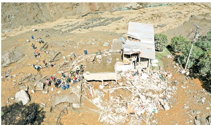
Rescue teams with drones search for landslide survivors.