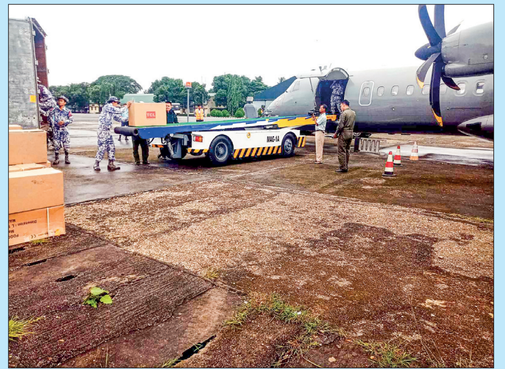
Relief supplies are seen being discharging from the Tatmadaw aircraft.

Officials in the respective areas received relief items and will distribute them to storm victims.