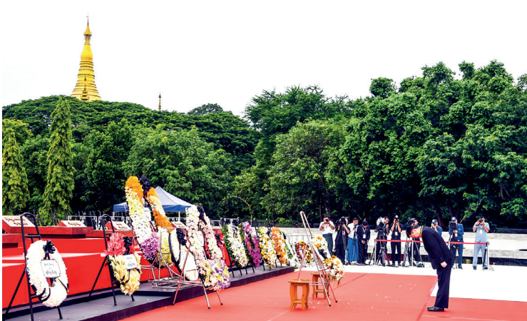
The diplomat pays tribute at the mausoleum.