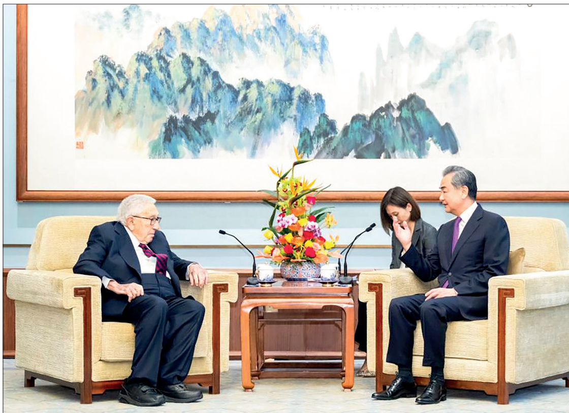
Wang Yi, a member of the Political Bureau of the Communist Party of China (CPC) Central Committee and director of the Office of the Foreign Affairs Commission of the CPC Central Committee, meets former US Secretary of State Henry Kissinger in Beijing, capital of China, 19 July 2023.

"These three principles are fundamental and long-term, and are the way for China and the United States to get along correctly as two major countries," he added.