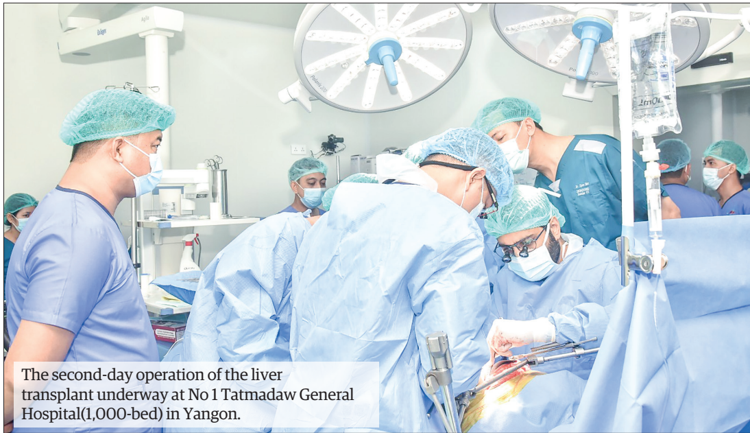
The second-day operation of the liver transplant underway at No 1 Tatmadaw General Hospital(1,000-bed) in Yangon.