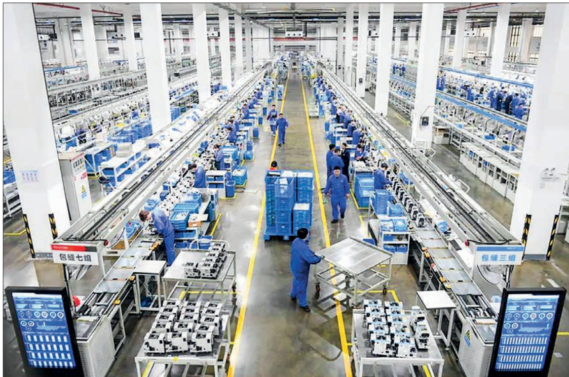
Workers work at a workshop of Jack Sewing Machine Co, Ltd in Taizhou, east China's Zhejiang Province, 23 March 2023.

tellectual property rights, the property rights of private firms, and the legitimate rights and interests of entrepreneurs as part of the legal guarantee for the growth of the private economy.