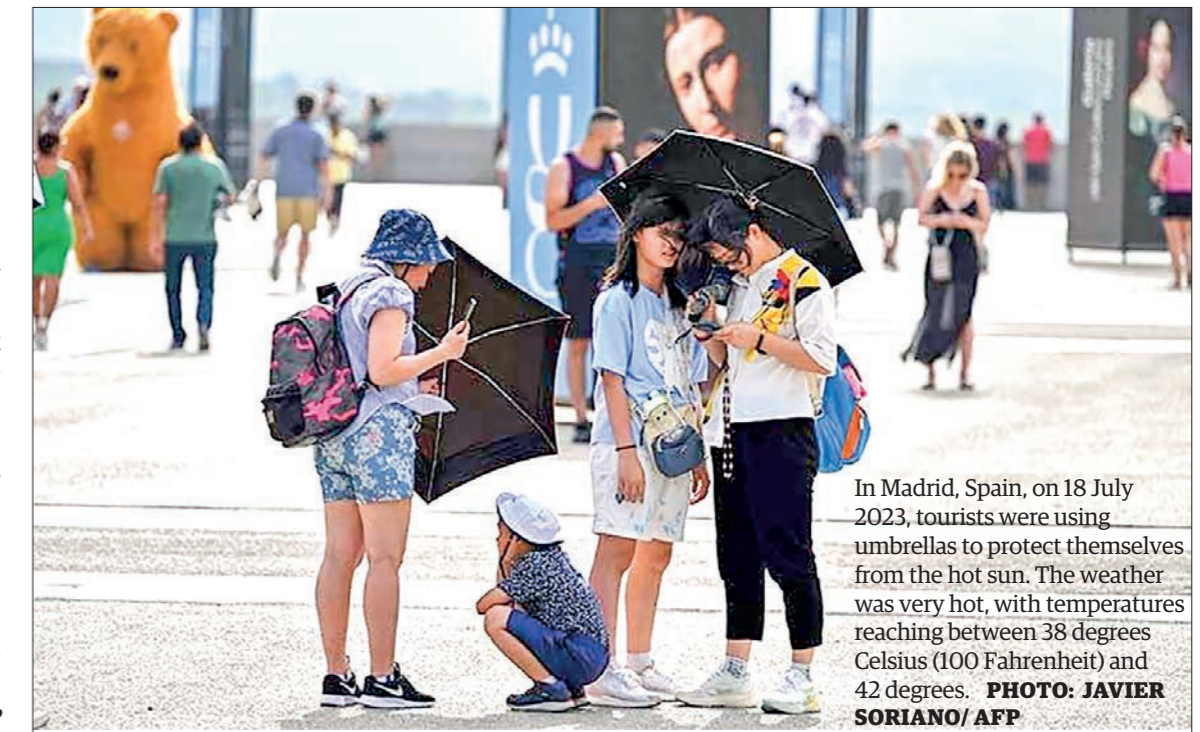
In Madrid, Spain, on 18 July 2023, tourists were using umbrellas to protect themselves from the hot sun. The weather was very hot, with temperatures reaching between 38 degrees Celsius (100 Fahrenheit) and 42 degrees.