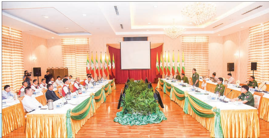
The second-day session of the peace talks between SPTT and the UWSP, NDAA and SSPP delegations in progress yesterday.