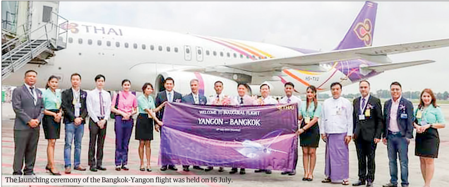
The launching ceremony of the Bangkok-Yangon flight was held on 16 July.