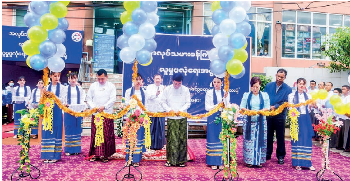
The opening event of the Social Security-Khine Metta General Clinic in progress on 21 July in Taunggyi.

SOCIAL Security-Khine Metta General Clinic (Taunggyi) for insured workers was launched in Taunggyi Township of Shan State on 21 July, according to the Ministry of Labour.