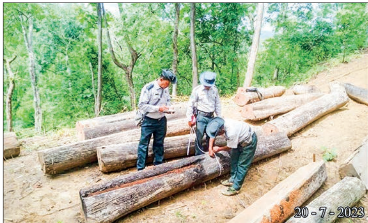
Officials check the confiscated illegal teak logs.

THE combined team under the supervision of the Yangon Region Illegal Trade Eradication Task Force nabbed a Hino Profia van (approximately K40 million) carrying 3,300 kilogrammes of Diamond Non-Woven Interlining worth K10.395 million that were not declared in the Import Declaration (ID) near the Inndaing checkpoint and an unregistered Toyota Crown (approximately K3.5 million) near the Mingaladon Police Station on Yangon-Pyay Road in Mingaladon township on 18 July. The action was taken under Customs procedures and the Forest Law.