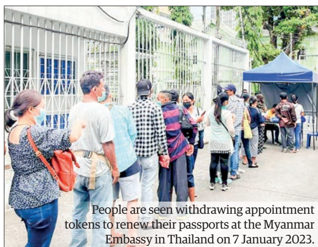
People are seen withdrawing appointment tokens to renew their passports at the Myanmar Embassy in Thailand on 7 January 2023.

Therefore, in July, the domestic edible oil market, including Yangon, was heard criticizing the fact that there was a need to investigate the retail and wholesale prices exceeding the reference price. — TWA/CT