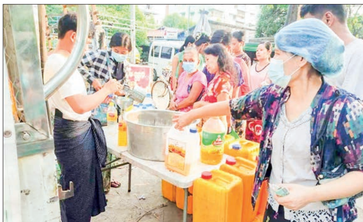
Consumers are seen buying palm oil from the mobile market truck.

An oil dealer in Htantabin Township, Daw Ama, told the GNLM that she had to purchase a few visses of palm oil from some outlets as a quota at a price range