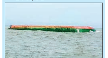
The photo shows MV Tung Sung which sank in Malaysian waters.

Malaysia is still investigating the sinking of the ship, Captain Soe Min Aung added.