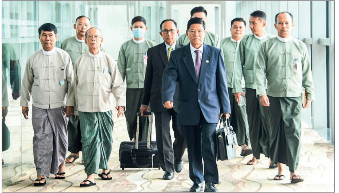
UEC Chair U Thein Soe and Myanmar delegation are seen before leaving for Cambodia yesterday.

By participating as international election observers, they will observe Cambodia's election systems, election procedures, voting process and counting process. — MNA/KZW