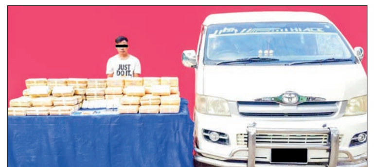
An offender is seen along with seized drugs and a vehicle.

Legal action has been taken against the offender and an investigation is underway to identify perpetrators of the crime chain. — MNA/MKKS