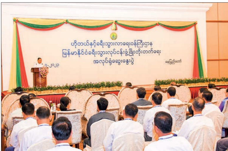
The workshop on the development of the tourism sector in progress.

After the press conference, officials conducted attendees round the Maravijaya Buddha Image and the Maravijaya Buddha Park.