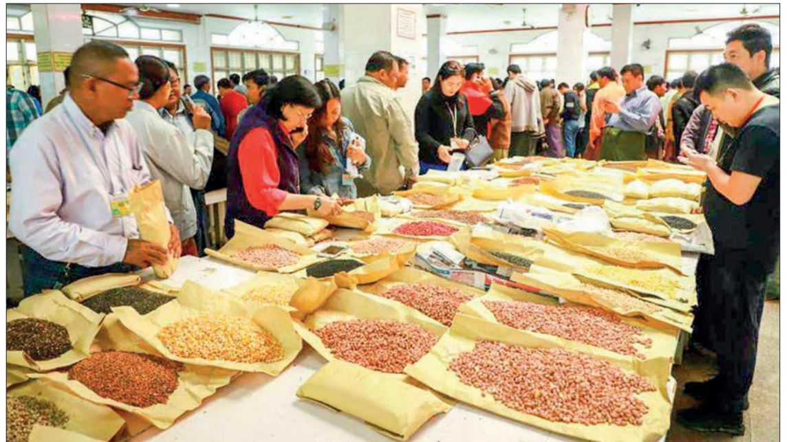
Traders are pictured evaluating various beans and pulses in the Mandalay market.

India has growing demand and consumption requirements for black grams and pigeon peas. According to a Memorandum of Understanding between Myanmar and India signed on 18 June 2021, India will import 250,000 tonnes of black gram and 100,000