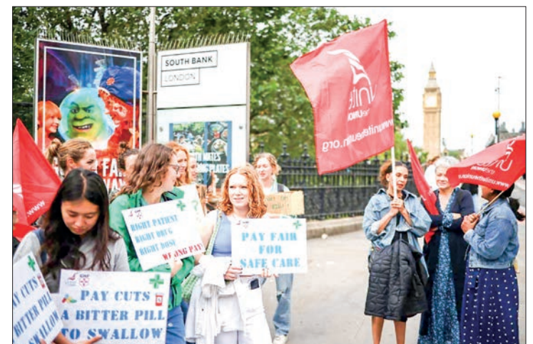
The two-day strike by consultants comes amid record patient waiting times due to a vast pandemic backlog and multiple strikes across the economy over the past year as workers battle a cost of living crisis.

vested in various assets, including foreign currencies, fixed-income instruments, domestic and foreign corporate bonds, joint ventures, mergers and acquisitions, real estate and high-impact infrastructure projects, and projects contributing to sustainable development." — AFP