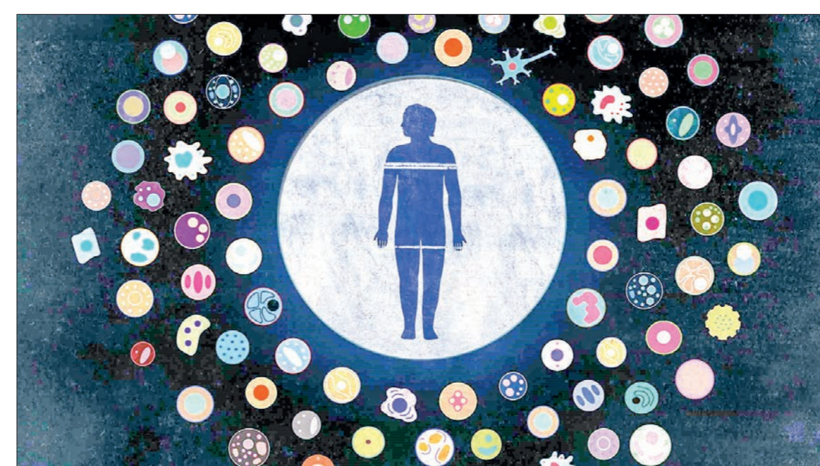
The decoding of the ageing process and the fluidity of traits highlight that self-discovery is an ongoing journey throughout life.

Research Institute. As Hampson notes, "Lack of self-control may result in behaviours that increase the probability of exposure to dangerous or traumatic situations and adversely affect health through long-lasting biological consequences."