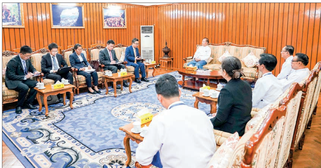
The delegation led by the ACC secretary-general calls on Union Minister U Aung Thaw yesterday.

UNION Minister for Hotels and Tourism U Aung Thaw received a delegation led by ASEAN-China Centre Secretary-General Mr Shi Zhongjun at the ministry in Nay Pyi Taw yesterday afternoon.