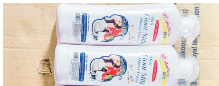
Seizure of illegal items.