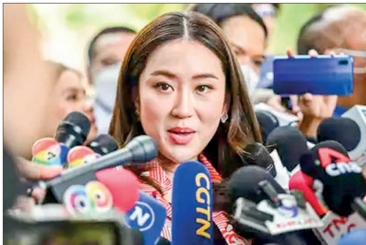
The Move Forward Party, the winner of Thailand’s recent election, will support the Pheu Thai party to lead the eight-party coalition government. Pheu Thai Party’s Paetongtarn Shinawatra speaks to the press after casting her ballot at a polling station in Bangkok on 15 May 2023.

THE reformist party that won Thailand’s recent election said Friday it would back a rival candidate to become prime minister after its own leader was blocked by the military and pro-royalist establishment.