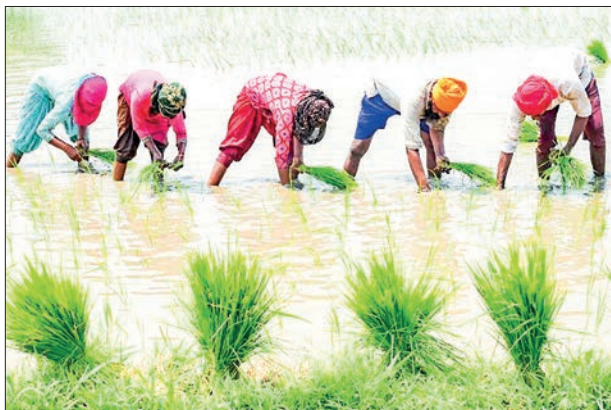
People plant rice saplings at a water-logged rice field on the outskirts of Amritsar, India, on 19 June 2023.

The move would "ensure adequate availability" and "allay the rise in prices in the domestic market", it said in a statement late Thursday. India accounts for more than 40 per cent of all global rice shipments, so the decision could "risk exacerbating food insecurity in countries highly dependent on rice imports", data analytics firm Gro Intelligence said in a note. Countries expected to be hit by the ban include African nations, Türkiye, Syria, and Pakistan — all of them already struggling with high food-price inflation — the firm added. Global demand saw Indian exports of non-basmati