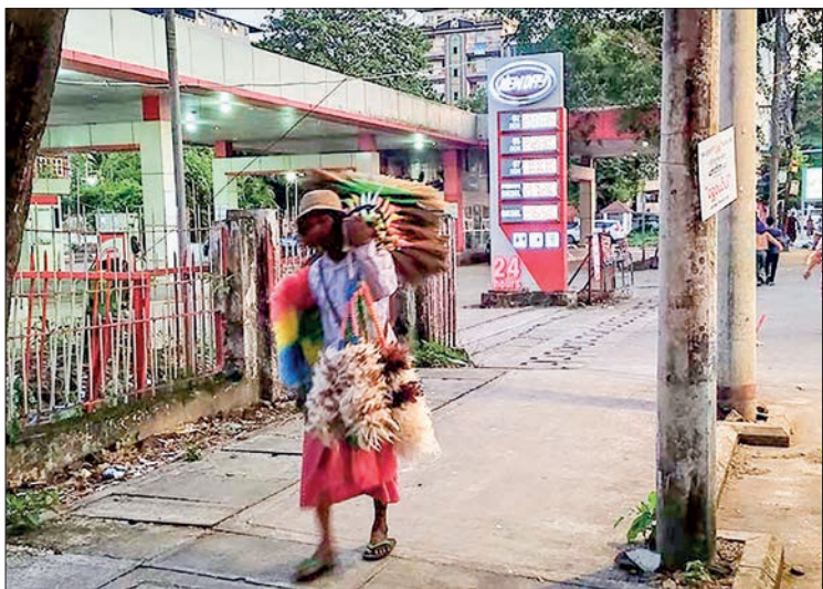
The petrol station is seen with a sign displaying fuel prices in Yangon.

THE prices of fuel oil have regained slightly in the domestic fuel oil market.