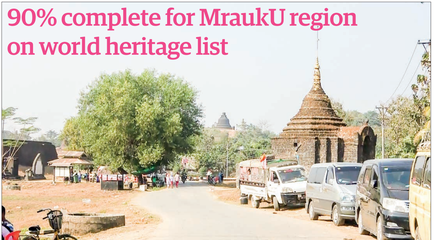
The photo shows a general view of the MraukU with some activities of people and vehicles.

ACCORDING to the Department of Archaeology and National Museum, 90 per cent of the work for MraukU of Rakhine State to be enlisted as a UNESCO World Heritage Site has been completed.