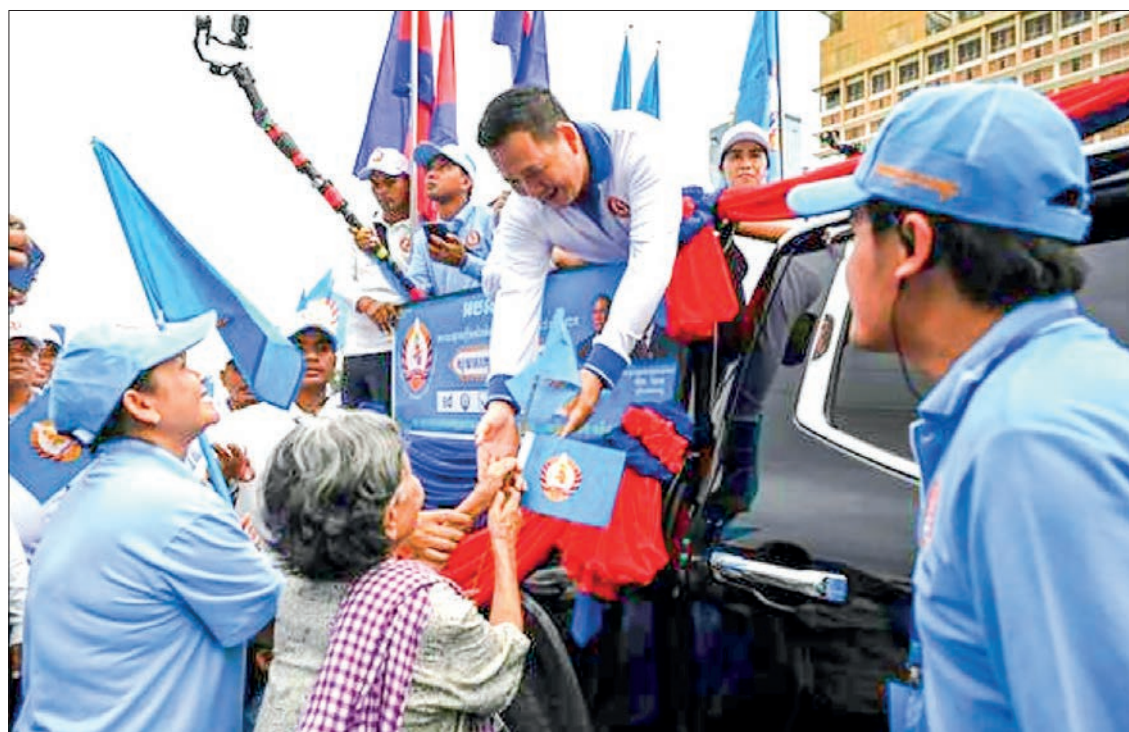
A crowd of tens of thousands on motorbikes gathered to hear Hun Manet's speech, before he roared off in a motorcade parade around Phnom Penh.

On the closing day of the election campaign, other parties, including the royalist Funcinpec Party and the Khmer National United Party, also gathered in