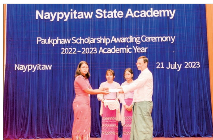
The Paukphaw Scholarship Awarding Ceremony in progress yesterday at the Naypyitaw State Academy.

The death toll from COVID-19 in the country registered 19,494 on 21-7-2023 with no new death reported from the pandemic. COVID-19 information can be browsed on the internet page moh.gov.mm of the Ministry of Health. — GNLM