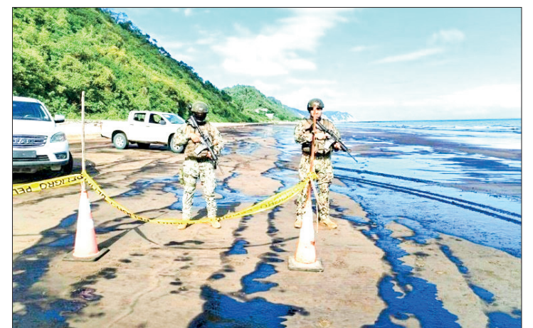
Members of the Ecuadoran Armed Forces stand guard on the shore of a beach covered with oil after a leak in Esmeraldas province on 19 July 2023. PHOTO: ECUADOREAN NAVY/AFP

The beach, in the province of Esmeraldas, has been closed to visitors as Petroecuador is engaged in a massive cleanup, nearly complete, of the sand and surrounding water.— AFP