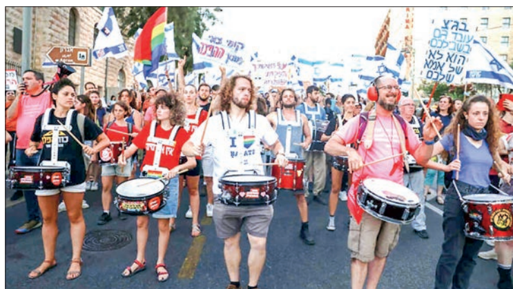
People take to the streets of Jerusalem to protest against the Israeli government's judicial overhaul bill.

ISRAEL'S Prime Minister Benjamin Netanyahu said Thursday