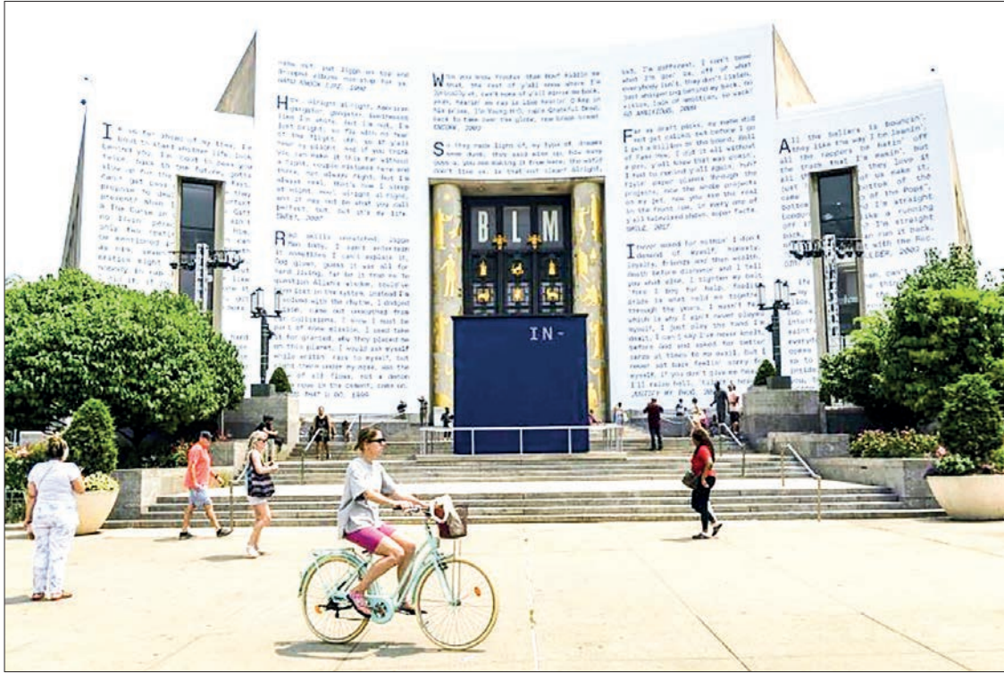
Jay-Z lyrics are displayed on the outside of the Brooklyn Library as part of a vast exhibition about his life, which coincides with the 50th anniversary of the birth of hip-hop.

FROM a display of Jay-Z lyrics on the facade of the Brooklyn Library to a concert of rap pioneers at Yankee Stadium, New York is celebrating 50 years of hip-hop, a genre born in its ghettos and now dominant around the world. Inside the library, a vast exhibition retraces the career of one of Brooklyn's most famous sons, charting his rise from "a