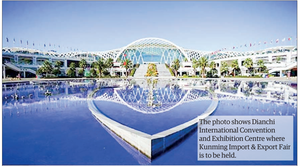
The photo shows Dianchi International Convention and Exhibition Centre where Kunming Import & Export Fair is to be held.