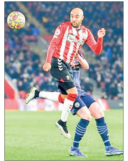
Burnley have signed Nathan Redmond on a free transfer.

NEWLY promoted Premier League club Burnley signed Nathan Redmond on a free transfer on Friday after the former Southampton winger left Turkish club Besiktas.