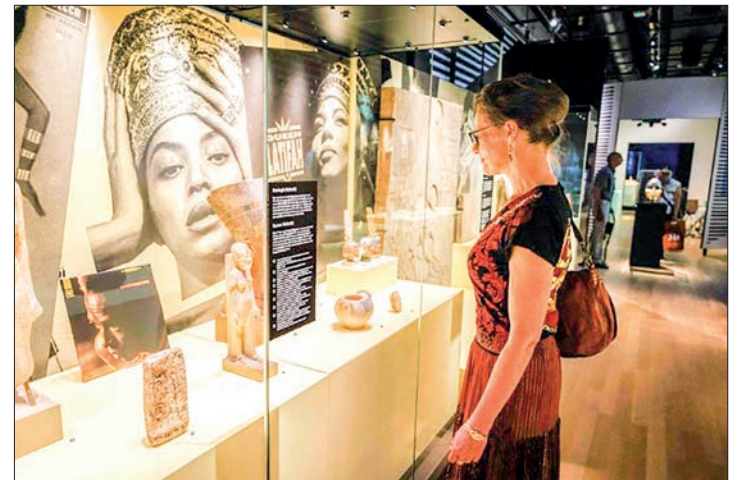
The exhibition, titled 'Kemet: Egypt in hip-hop, jazz, soul & funk', features modern black music alongside ancient sculptures.

Egypt's antiquities service said the museum is "falsifying history" with its "Afrocentric" approach, which seeks to appropriate Egyptian culture, Dutch media reported. — AFP