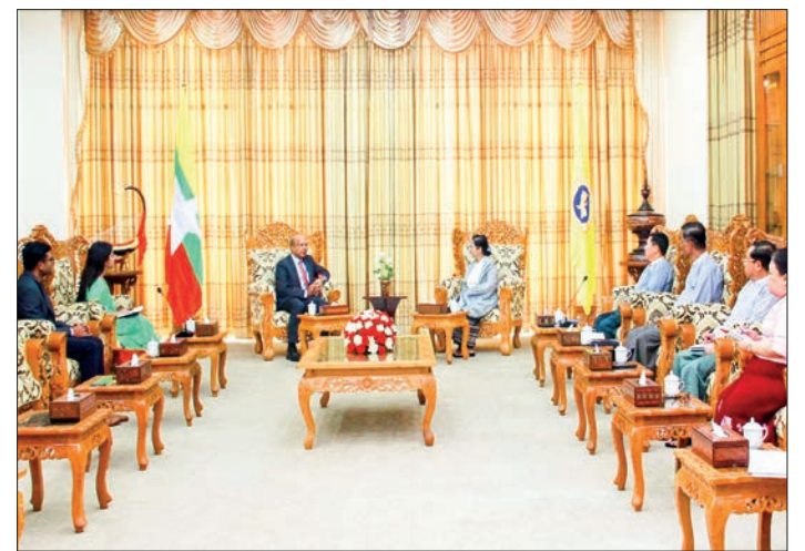
The Indian ambassador calls on CBM Governor Daw Than Than Swe yesterday in Nay Pyi Taw.

They also discussed the points of agreement between Myanmar and India to support and provide technical assistance in anti-money laundering issues. — MNA/KZW