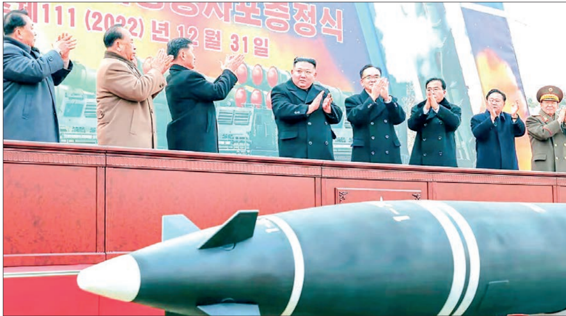
North Korean leader Kim Jong Un attends a ceremony at the headquarters of the Central Committee of the Workers' Party of Korea in Pyongyang on 31 December 2022.

North Korea last year adopted a sweeping nuclear