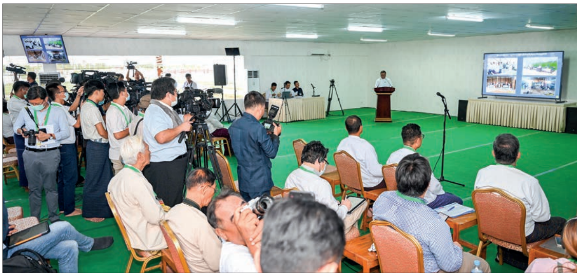
SAC Information Team Leader Maj-Gen Zaw Min Tun is pictured (at the podium) at the press conference in Nay Pyi Taw yesterday.

In his clarification, the information team leader continued to say that advice was sought from venerable members of the Sangha from the State Sangha Maha Nayaka Committee for carving the Buddha image and construction of religious buildings.