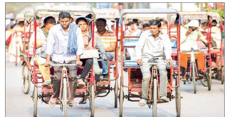
People ride rickshaws at a marketplace in New Delhi, India, on 26 April 2023.

According to the report, India registered a significant decline of 9.89 percentage points in the number of multidimensionally poor from 24.85 per cent in 2015-16 to 14.96 per cent in 2019-2021. The rural areas witnessed the fastest decline in poverty from 32.59 per cent to 19.28 per cent. — Xinhua