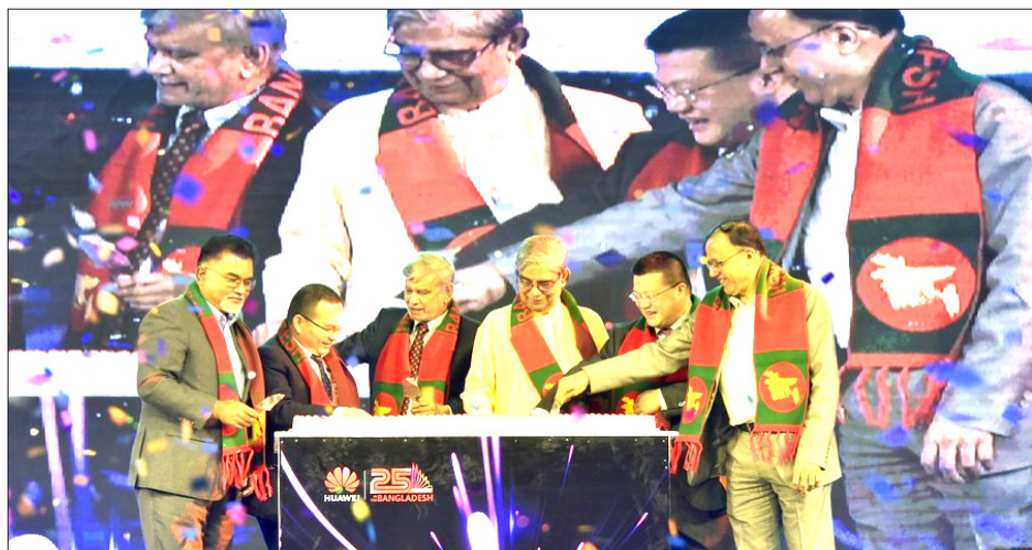
Huawei celebrated its 25 years of operation in Bangladesh with a commitment to bring advanced technologies and solutions for building a fully connected and intelligent Bangladesh.