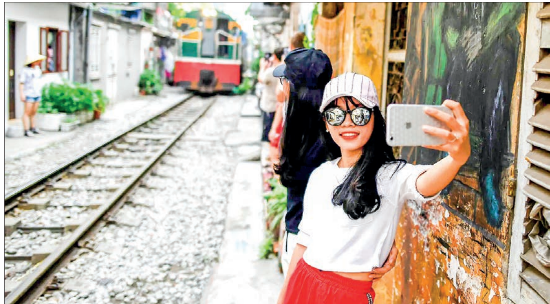
A young woman takes a selfie on 8 June 2019 while a train passes in Hanoi's popular train street.

NEARLY five billion people, or slightly more than 60 per cent of the world's population, are active on social media, according to a recent study.