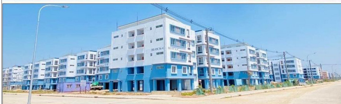
The apartments of Thukha Dagon Public Rental Housing are seen in Dagon Myothit (South) Township.