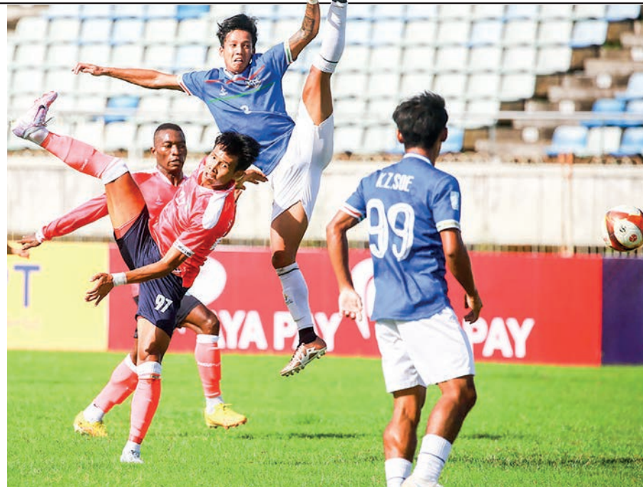
Maha United players (pink) vie for the ball with Kachin United player (blue) during their MNL Week-13 match at Thuwunna Stadium in Yangon on 23 July 2023.