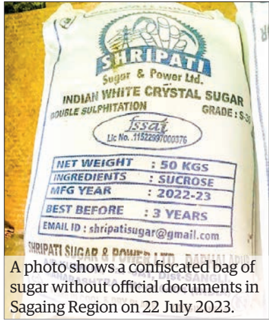
A photo shows a confiscated bag of sugar without official documents in Sagaing Region on 22 July 2023.

UNDER the supervision of the Illegal Trade Eradication Steering Committee, efforts are being made to effectively prevent illegal trade in accordance with the law.