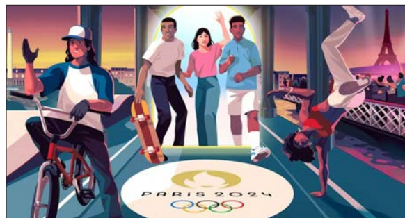
The upcoming Paris Olympic Games are causing both excitement and concern. While preparations to welcome potential Olympic visitors are being made, there are worries that the event could worsen existing problems for one of the world's most popular tourist destinations.

"At the Rio Olympics in 2016, Airbnb helped to increase accommodation capacity. And at the Athens Olympics in 2004, large cruise liners were put in the port to cover accommodation needs," he said. — AFP