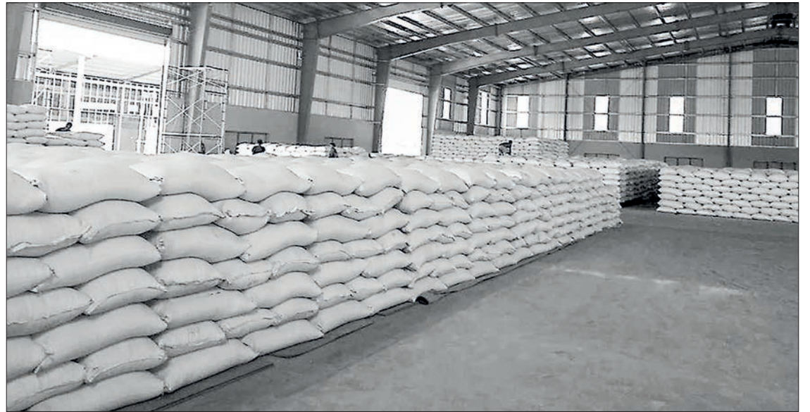
The photo shows newly supplied rice bags stockpiled at the Wahdan Rice Wholesale Centre in Yangon.

The Ayeyawady Delta regions and western Bago area primarily supply rice to the Yangon market for local consumption and foreign markets. There is an influx of about 100,000 rice bags per day to Wahdan and Bayintnaung Wholesale centres utilizing road and sea transport, the Global New Light of