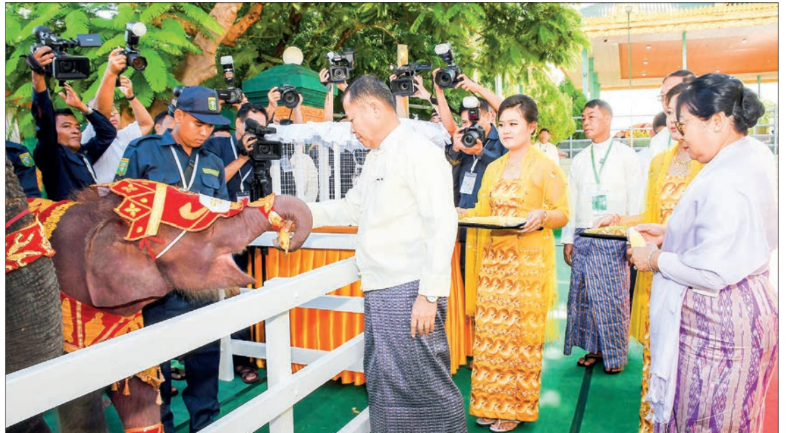
SAC Vice-Chairman Deputy Prime Minister Vice-Senior General Soe Win feeds white elephant Rattha Nandaka on 23 July 2023.