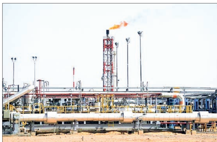
This photo taken on 11 December 2015 shows a general view of the Cairn India, Oil and Gas exploration plant at Barmer in Rajasthan, India.

The Indian government released a chair's summary, underscoring that the world has been facing the issue of energy poverty for those without adequate access to it for daily