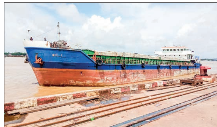
The Mawlamyine Century Logistics (MCL-3) vessel, carrying relief materials, departs for Rakhine State from Myanmar Terminal jetty on 23 July 2023.

A total of 32,812.90 tonnes of relief supplies, including construction materials, electrical appliances, medicines and healthcare products, consumer goods and foodstuff, 249,762 gallons of diesel and 199,886 gallons of Octane 92 were delivered to Sittway from 16 May to yesterday.