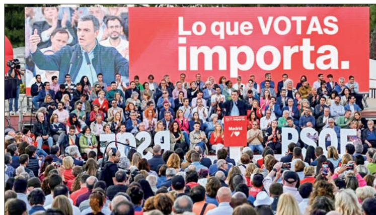
The 2023 Spanish general election took place on Sunday, 23 July 2023, to choose the 15 th Cortes Generales of the Kingdom of Spain. Voters had the opportunity to elect all 350 seats in the Congress of Deputies and 208 out of 265 seats in the Senate.

As many Spaniards are on holiday, more than 2.47 million — a record number — of the 37.5 million registered voters have cast an absentee ballot, Spain's postal service said on Saturday. — AFP