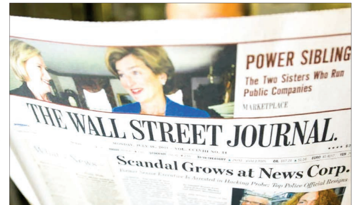
The initiative was first reported by The New York Times. Several prominent news organizations are involved in testing the new AI tool, including The Washington Post and The Wall Street Journal.