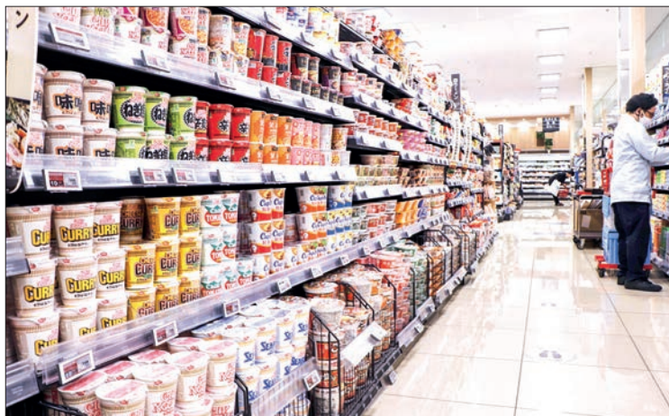
Photo taken in June 2023 shows instant noodles sold at a supermarket in Tokyo.

JAPANESE consumers will have seen price hikes on 30,009 food and beverage products by October as retailers pass on higher costs to protect their profits, according to a credit research