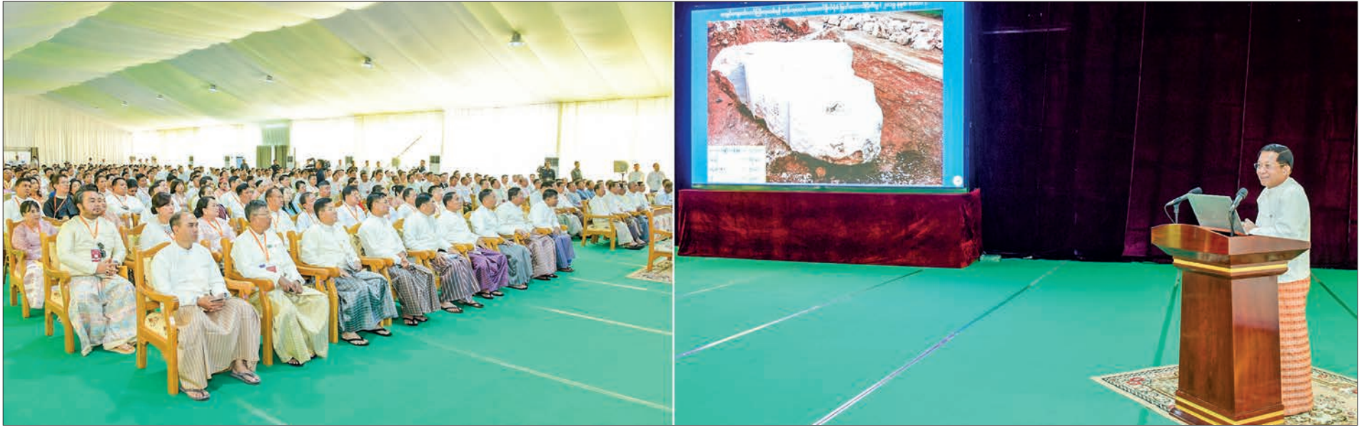
Chairman of the State Administration Council Prime Minister Senior General Min Aung Hlaing explains building of Maravijaya Buddha Image and Buddha park in Nay Pyi Taw on 23 July 2023.