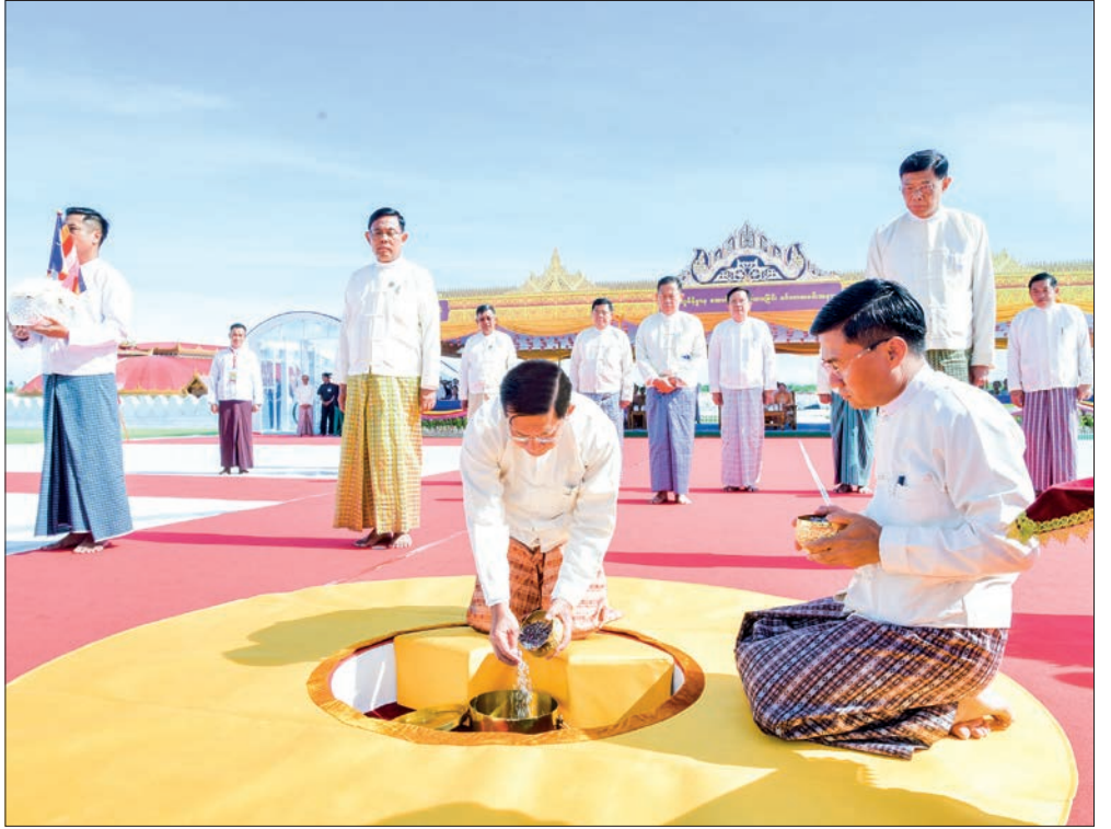
Chairman of the State Administration Council Prime Minister Senior General Min Aung Hlaing keeps soils from holy places at religious edifices in India and Myanmar on the land of victory on 24 July 2023.

A gala ceremony to build Vijayabhumi Nimmana land of victory in front of Maravijaya Buddha Image took place in conjunction with the launching of Saddadhipati Bell in the precinct of the Buddha image