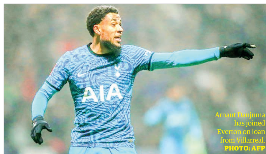
Arnaut Danjuma has joined Everton on loan from Villarreal.

EVERTON have signed Arnaut Danjuma on a season-long loan from Villarreal, just months after the Netherlands forward rejected an offer to move to Goodison Park.