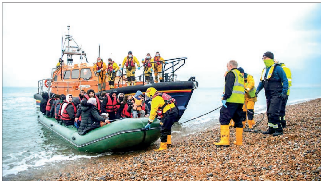
Migrants are helped ashore at a beach in Dungeness, on the south-east coast of England.