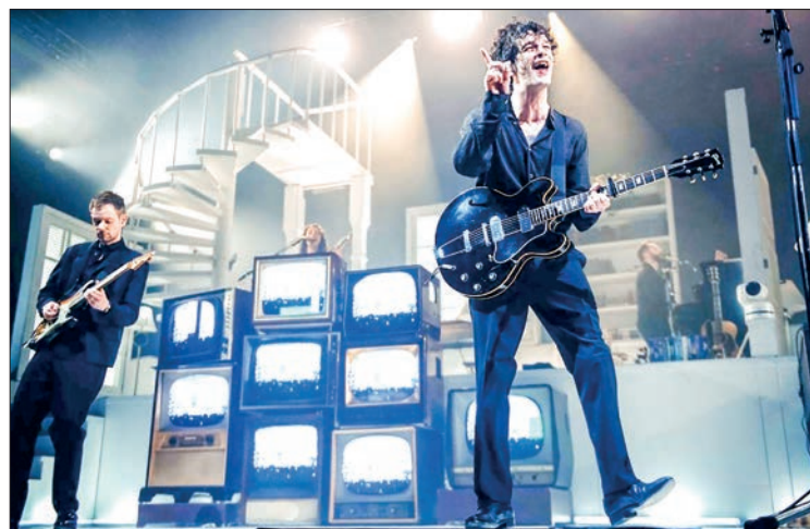
The British indie-rock band, The 1975, cancelled their concert in Indonesia following Malaysia's decision to axe a festival due to a same-sex kiss and criticism of Malaysia's anti-LGBTQ laws by the band's frontman, Matt Healy.

BRITISH indie-rock band The 1975 cancelled a concert in Indonesia Sunday, after Malaysia axed a festival over a same-sex kiss and tirade against the country's anti-LGBTQ laws by their