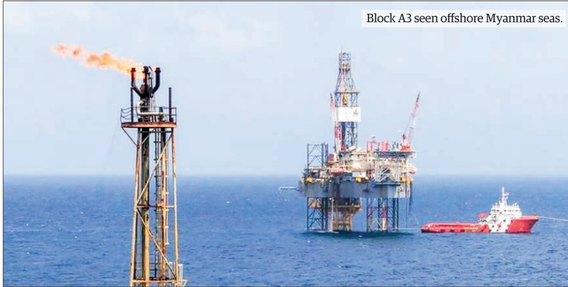
Block A3 seen offshore Myanmar seas.

THE Department of Fisheries recently announced that the preliminary survey work for construction in the offshore Block A3 in the sea of Myanmar is still ongoing and was extended until 15 August. POSCO International Corporation (Myanmar E&P), a joint venture in the oil exploration activities of the Myanma Oil and Gas Enterprise is conducting these survey activities with the vessel MV Furgo Equator.