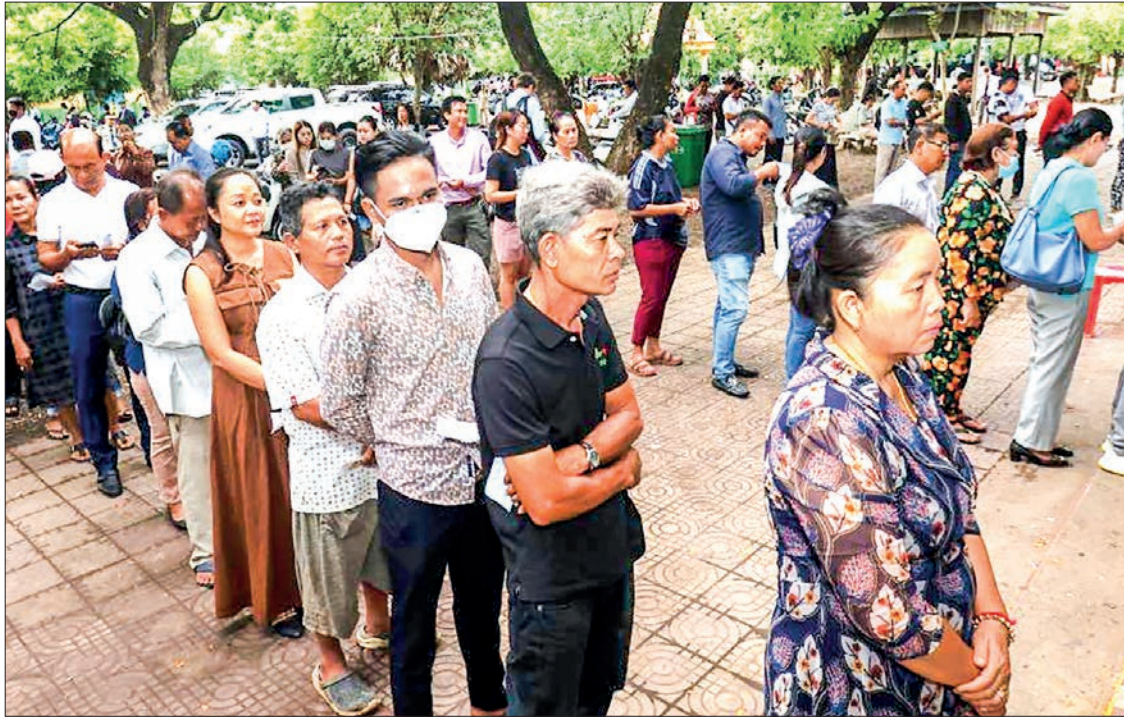
People wait for their turns to vote at a polling station in Phnom Penh, Cambodia, on 23 July 2023. The seventh general election kicked off in Cambodia on Sunday with a total of 18 political parties taking part in the race, a National Election Committee (NEC) spokesman said.