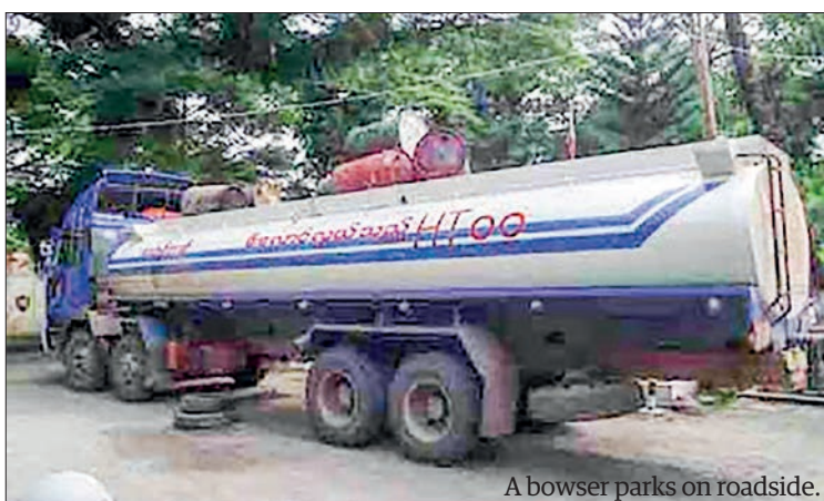
A bowser parks on roadside.

THE Mandalay City Development Committee recently announced that it will enforce measures against unruly bowser drivers in the six downtown townships, beginning last week of July. Currently, action is being taken against trailers