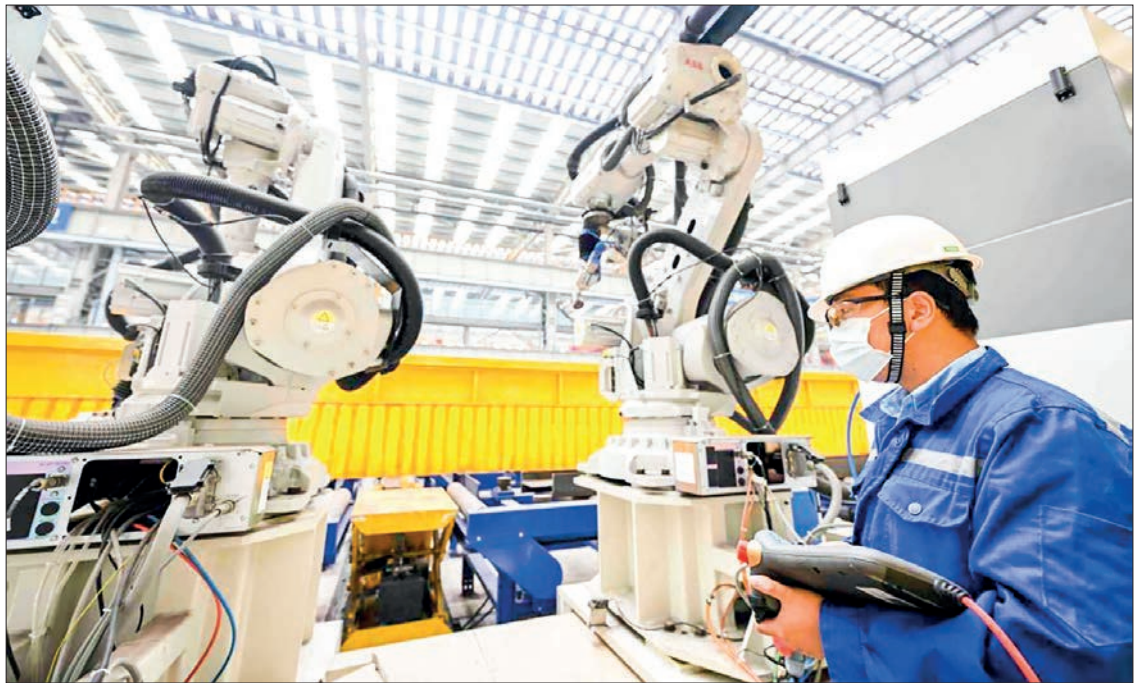
An employee works at a smart production facility in Tianjin. PHOTO: XINHUA

This survey aims to figure out the basic situation and distribution of all legal entities, industrial activity units and self-employed households engaged in secondary and tertiary industry activities in China. — Xinhua