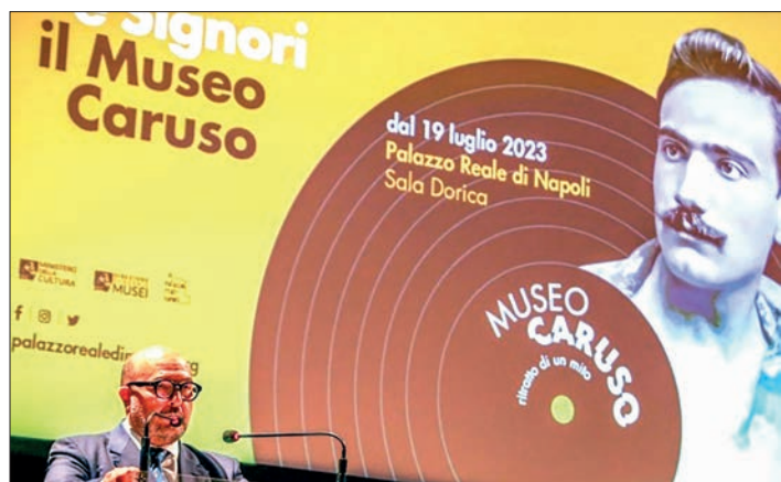
Caruso represents a 'positive image of Naples in the world', said Culture Minister Gennaro Sangiuliano at the opening.