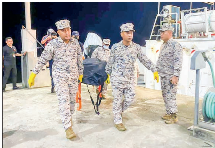
Officials carry the bodies that have been discovered onto the ship.

THE bodies of four individuals who were reported missing from the sinking of MV Tung Sung in Malaysian waters have been discovered by rescuers, as confirmed by Malaysia's maritime intelligence agency, Maritime State. However, their identities have not yet been established.