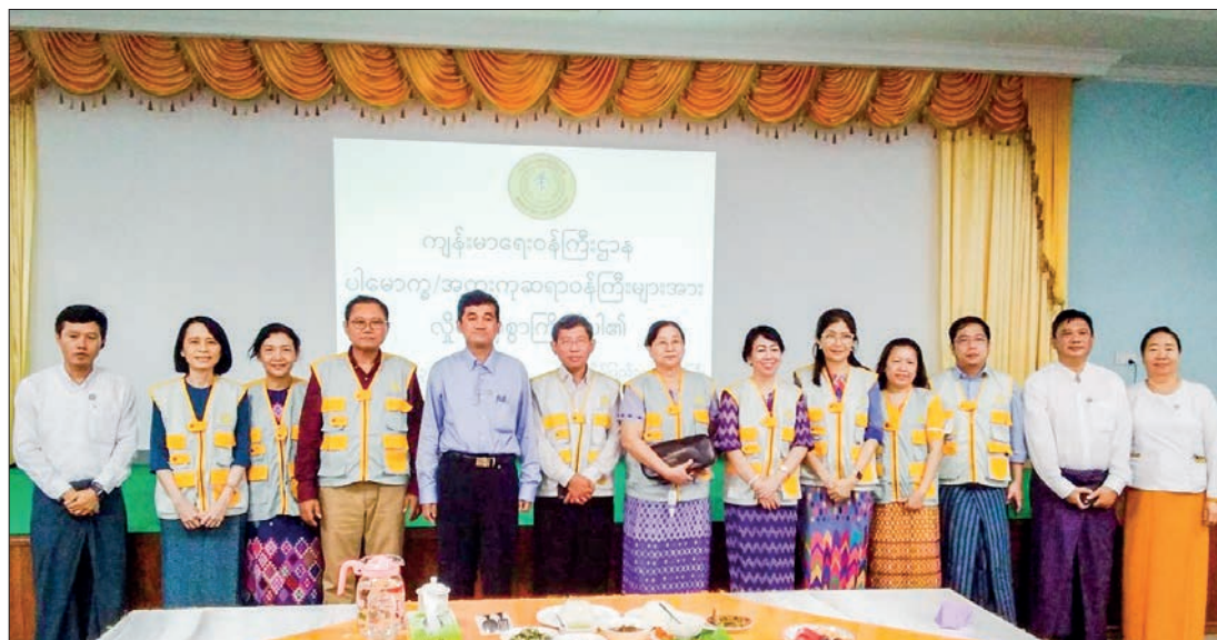
A team of specialist doctors posts for a documentary photo on 23 July 2023.

A team of specialist doctors, including experts in hematology, cardiology, gastrointestinal issues, brain and neurology, brain and neurosurgery, diabetes and hormonal conditions, and general practitioners from New Yangon General Hospital, performed medical treatments