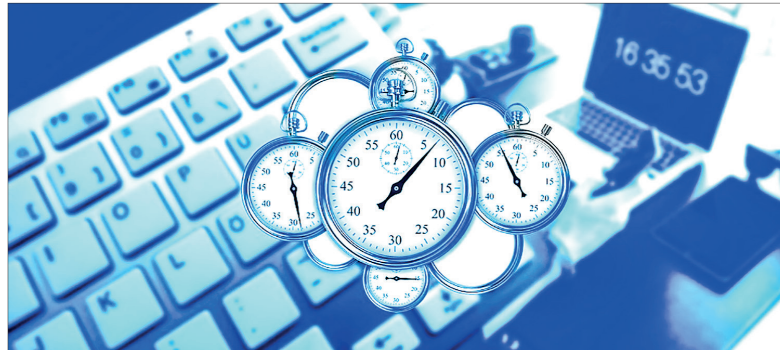
Time is considered priceless because once it passes, it cannot be reclaimed. Thus, making the best use of it is vital.