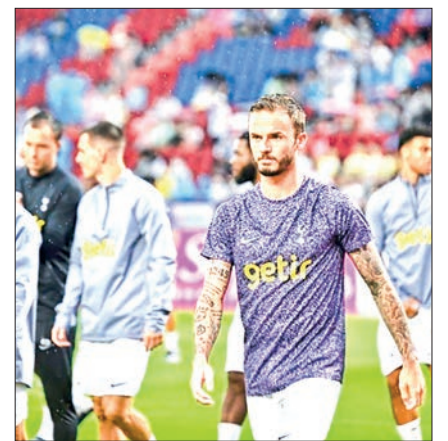
Tottenham's friendly against Leicester in Bangkok was called off because of a waterlogged pitch.

TOTTENHAM'S pre-season preparations suffered a blow on Sunday as their friendly against Leicester in Bangkok was called off because of a waterlogged pitch.