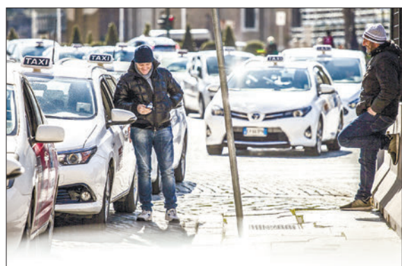
Taxi drivers wait for customers at a taxi rank on Piazza Venezia in downtown Rome on 10 March 2020.

Italy's competition watchdog said last week that it was looking into the taxi sector, which is run by a powerful lobby, amid reports of a severe shortage in major cities including Rome, Milan and Naples. — AFP