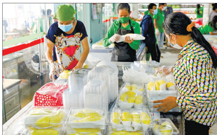
Workers prepares durian for sale at a shop in Phnom Penh on 17 June 2021.

"As rice price on the international market is soaring, Cambodia is studying strategies that can benefit the economy from this event," said Im Rachna, undersecretary of state and spokeswoman for the Ministry of Agriculture, Forestry and Fisheries. — Xinhua