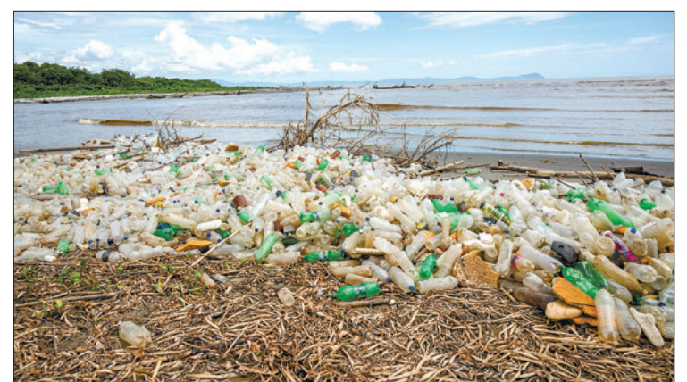
Garbage, including plastic waste, is seen at Paparo Beach in Miranda State, Venezuela, on 6 June 2023.

"Large, floating pieces on the surface are easier to clean up than microplastics," the study's co-author Erik van Sebille of Utrecht University in the Netherlands said in a statement. — AFP