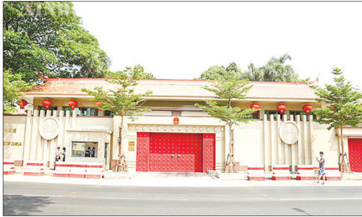
The Embassy of the People's Republic of China to Myanmar.

To facilitate the application of Chinese visas by foreigners, the Chinese Embassy in Myanmar stated that fingerprinting will be waived for business visas (M) that meet the requirements, tourist visas