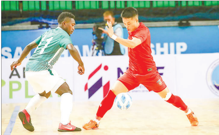
Myanmar futsal player (red) uses full strength to turn away the rival during the group match of the Continental Futsal Championship 2023 against Solomon Island on 8 August 2023.

MYANMAR futsal team has recorded one win and one loss outcome in the Continental Futsal Championship 2023 which is being held in Thailand.