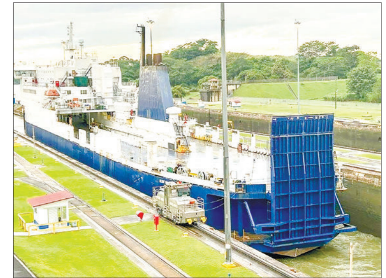
The canal relies on rainwater to move cargo ships through a series of locks that function like water elevators, raising the vessels up and over the continent between the Atlantic and Pacific Oceans.