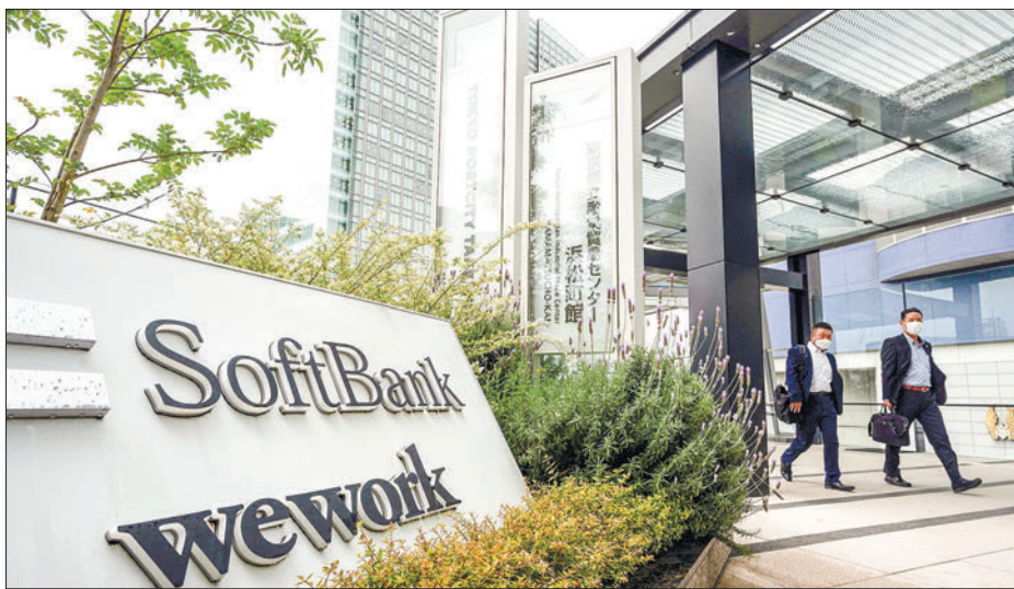
Pedestrians walk outside the headquarters for Japanese company SoftBank Group in Tokyo Portcity Takeshiba on 11 May 2023.

SOFTBANK Group Corp said Tuesday it registered a net loss of 477.62 billion yen ($3.3 billion) for the three months ended June, shrinking from the record