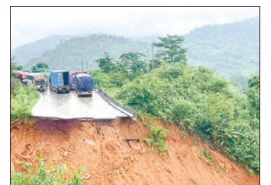
Snapshot of Asian Highway's damaged road near Tawnaw Waterfall on 7 August.

Recent days of persistent heavy rainfall have contributed to landslides on the Myawady-Kawkareik Highway in Kayin State. Similarly, a landslide occurred near the Tawnaw Waterfall on the Asia Trade Highway on the morning of 7 August, resulting in a section of the road being blocked. — TWA/MKKS