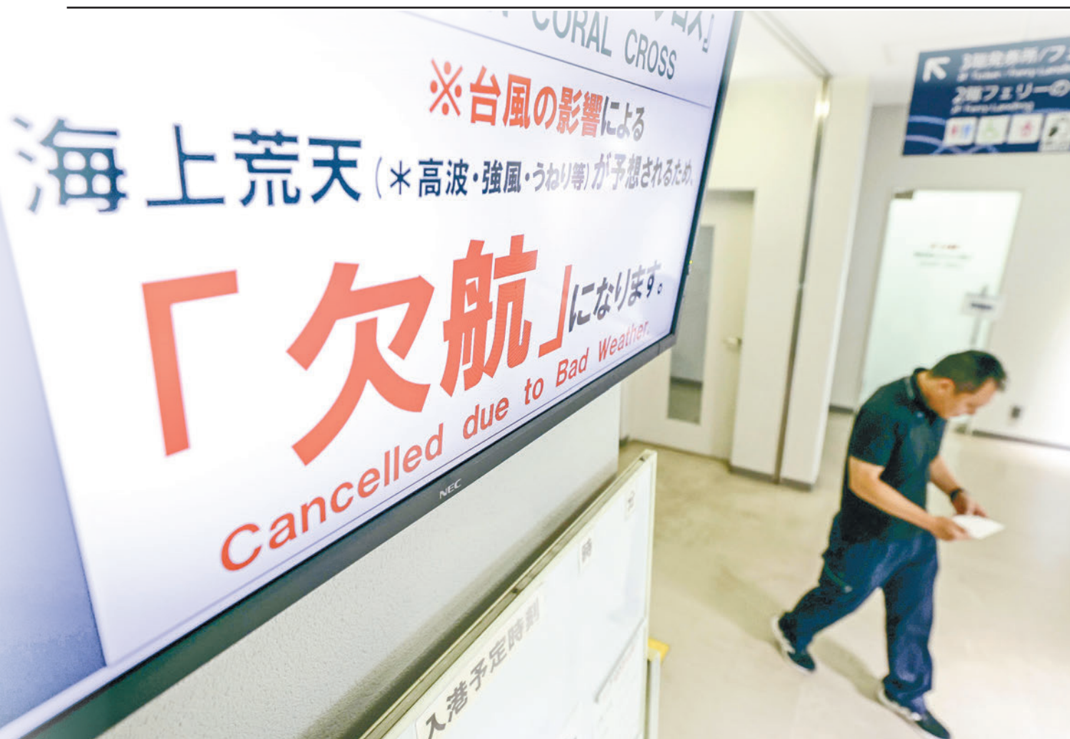
A display shows information on the suspension of ferry services in Kagoshima due to an approaching typhoon on 8 August 2023.

The weather system then swung back to the Okinawa area and on Wednesday was due to roar along the western coast of Kyushu towards South Korea, according to forecasters.