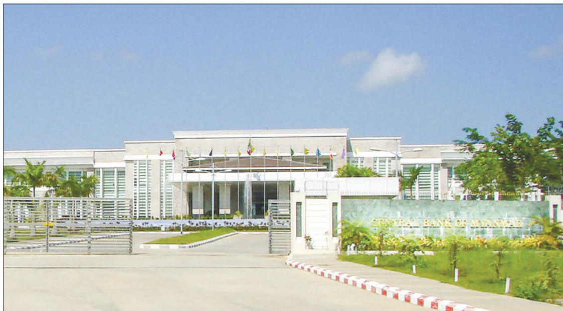
The photo shows the front view of the Central Bank of Myanmar office in Nay Pyi Taw.

The permitted transaction conditions are as follows; transactions for important goods and payment after due date, one entity is allowed to make transactions at the designated bank with the presence of import licence and overdue invoice when it