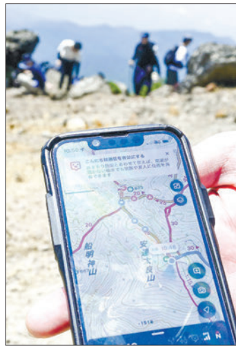
Photo taken in Fukushima Prefecture on 17 June 2023, shows a screen displaying the hiking app Yamap. PHOTO: KYODO

When informed of a stranded mountaineer, police and rescuers ask Yamap if the missing person is a user of the app. If so, the company then directly tells the rescue team the latitude and longitude of the location of the person. — Kyodo