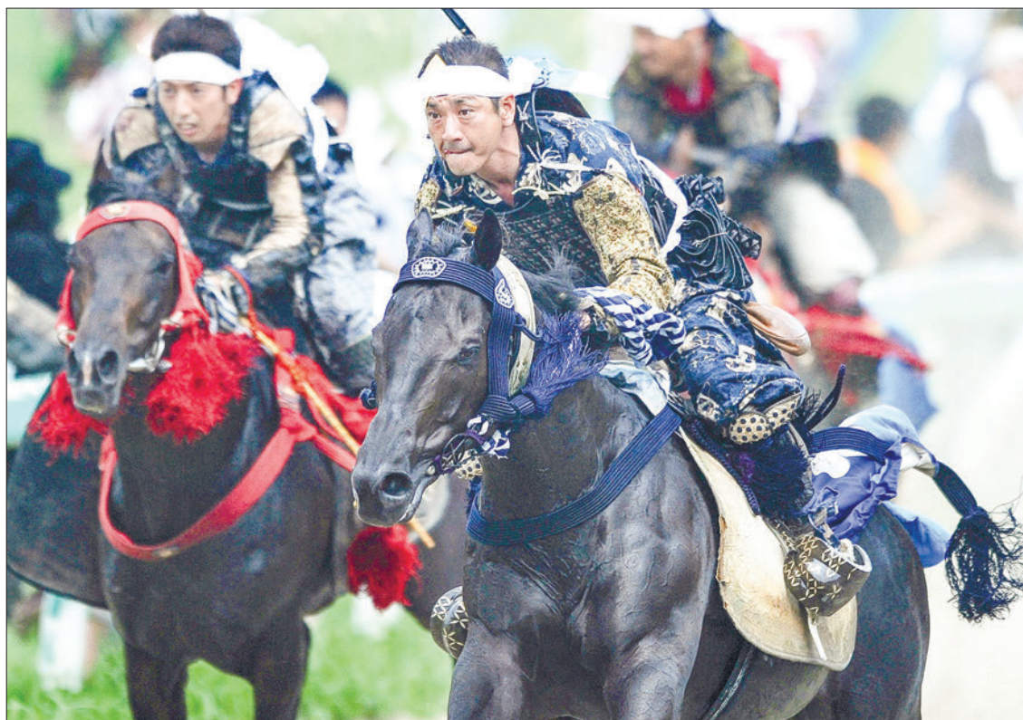
(FILES) People wearing samurai armour race horses during the annual Soma Nomaio Festival in Minamisoma, Fukushima Prefecture on 29 July 2012.

Two of the animals died, they said. The annual three-day event, which features more than 400 participants dressed as medieval samurai warriors fighting on horseback over flags that are shot overhead by fireworks, attracted more than 120,000 people, reports said. — AFP