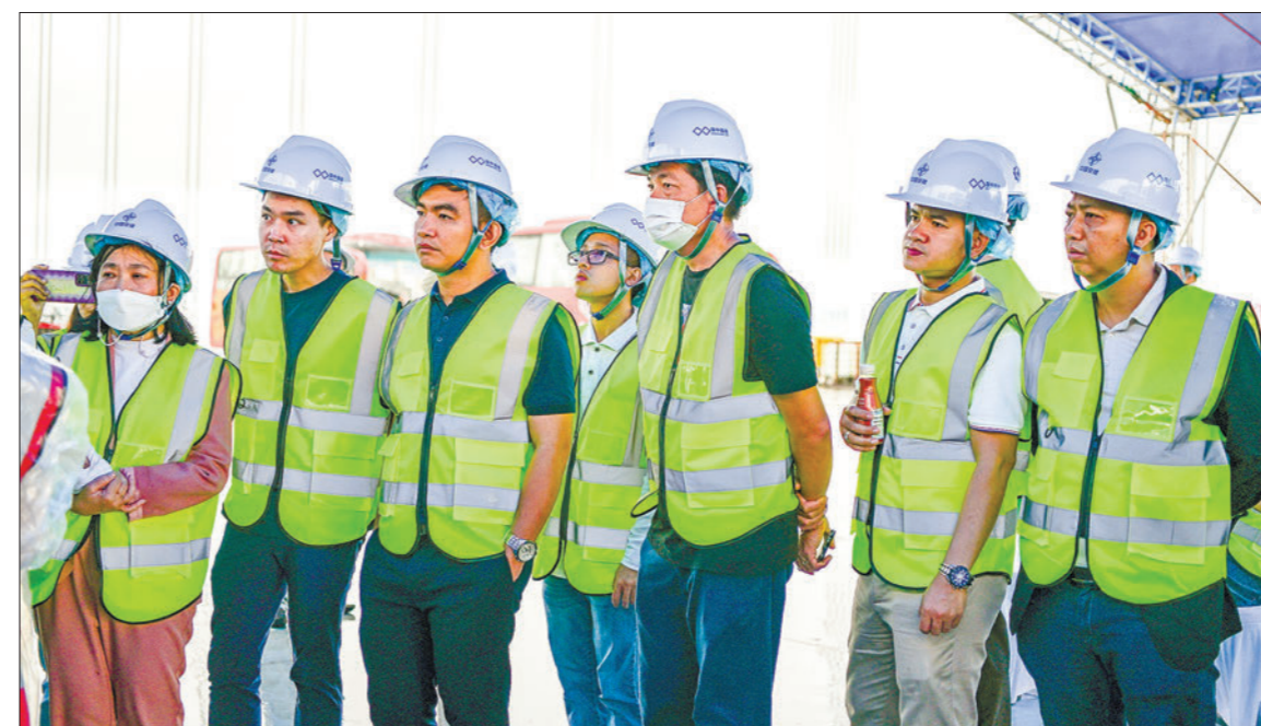
Journalists listen with interest to the explanations about the construction of the bridge.

In the Lancang-Mekong Cooperation projects, construction cooperation is key. CCCC's creativity with the help of the Chinese government will best support Myanmar's road and bridge construction. Therefore, the strengthening of this cooperation is a better move for the Lancang-Mekong Cooperation, including Myanmar.