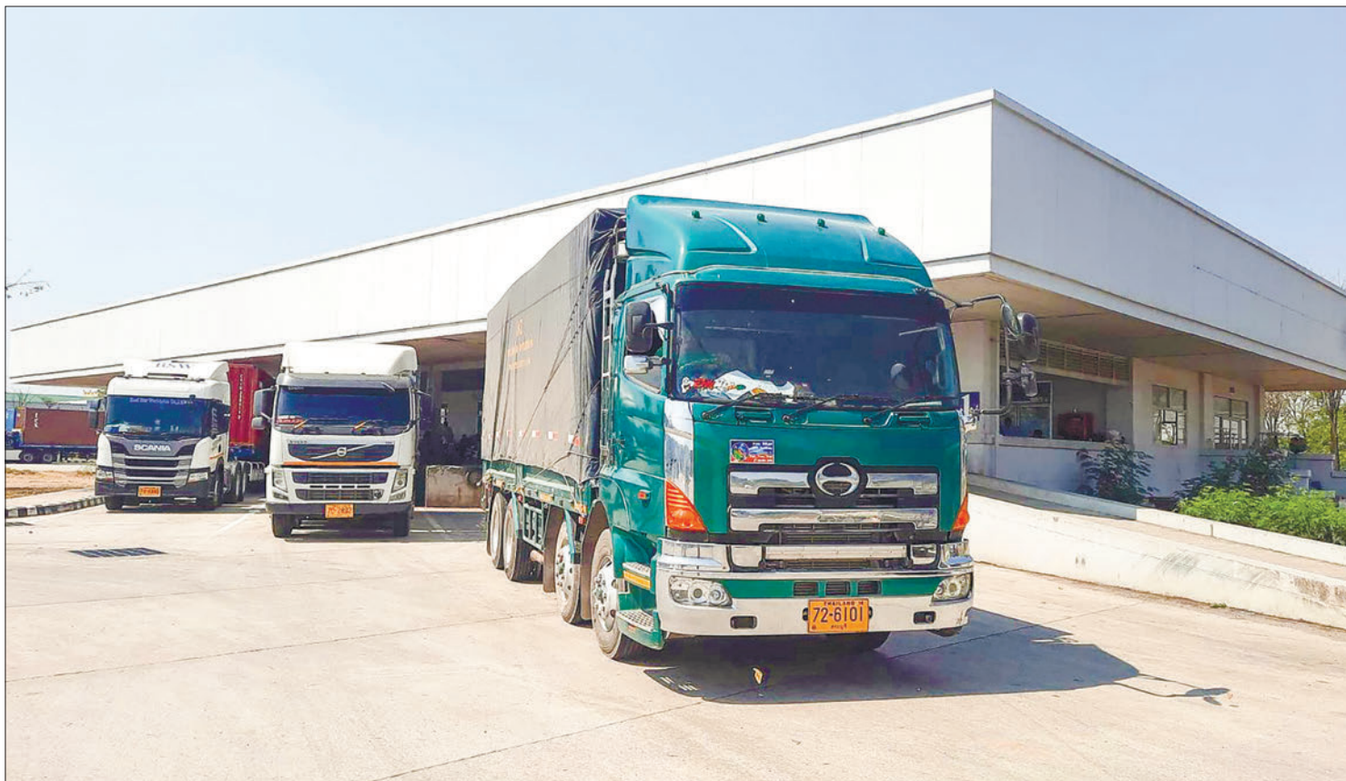
GNLM File Photo depicts loaded trucks ready to cross the border checkpoint at the Myawady-Mae Sot Friendship Bridge 2 for export shipments.

M YANMAR'S border trade with the neighbouring country Thailand amounted to US$2.127 billion in the past four months (April-July) of the current financial year 2023-2024.