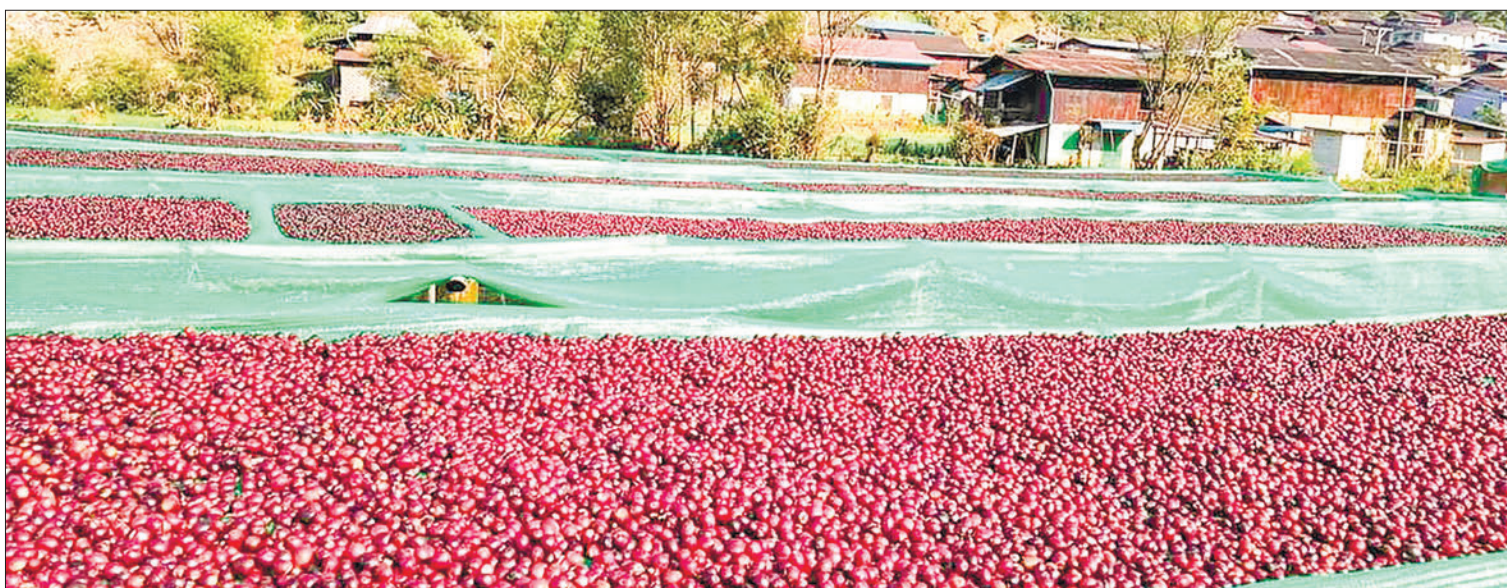
A farm worker handpicks coffee beans (top-right photo) while on the coffee farm, beans are sun-dried after being harvested (above photo).

Myanmar's coffee is harvested between December and March and distributed to the markets in late April. The coffee bean is mostly grown in Mandalay Region and Shan State and can be found in other regions and states as well.