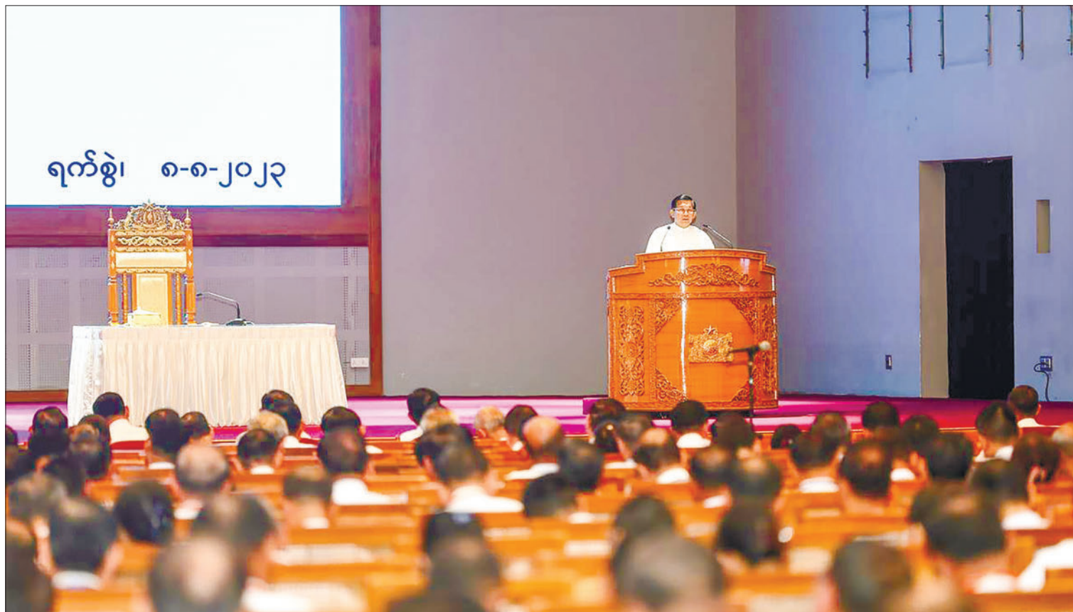
State Administration Council Chairman Prime Minister Senior General Min Aung Hlaing meets Union-level personnel and officials from Union ministries yesterday.