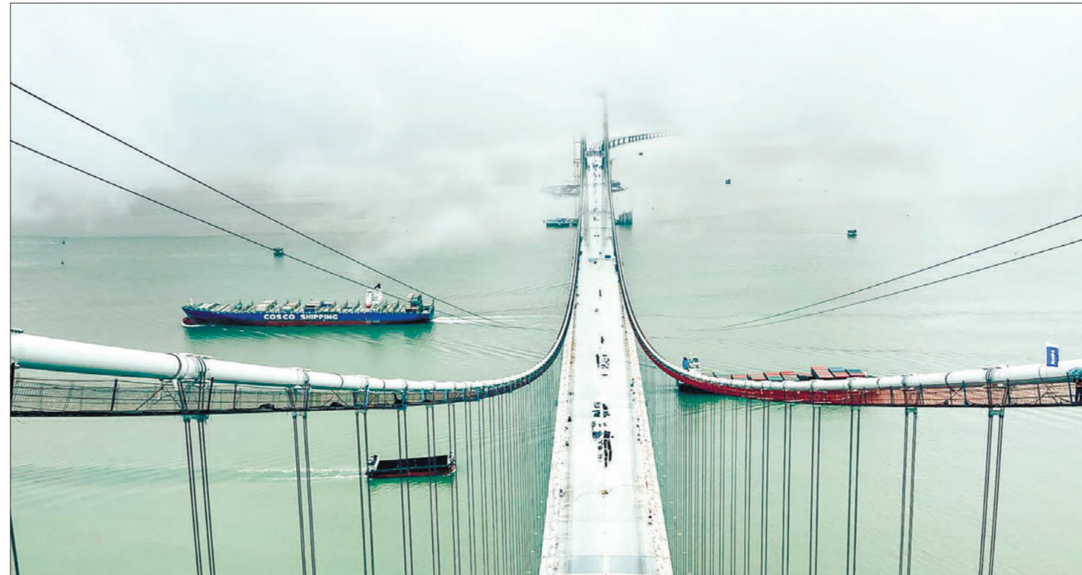
The aerial view of the Shenzeng-Zhongshan Suspension Sea Bridge.

The main cable of the bridge consists of 199 strands and each