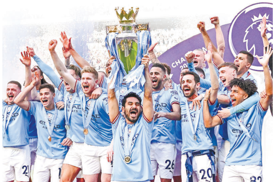
Manchester City's German midfielder Ilkay Gundogan lifts the trophy as Manchester City players celebrate winning the title at the presentation ceremony following the English Premier League football match between Manchester City and Chelsea at the Etihad Stadium in Manchester, north west England, on 21 May 2023.

The arrival of Croatian internationals Josko Gvardiol and Mateo Kovacic has softened that blow, but the champions have been quiet in the market compared to the chasing pack. — AFP