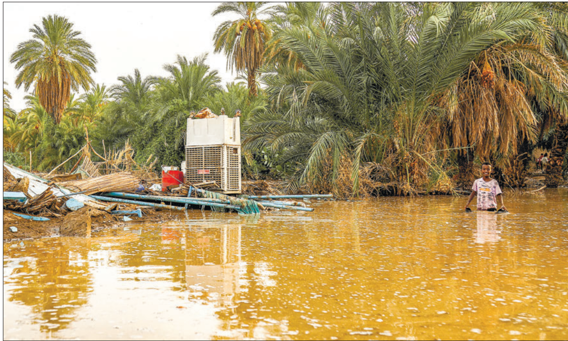
A boy walks through a flooded area in al-Sagai north of Omdurman on 6 August 2023.

WAR-TORN Sudan is at risk of major disease outbreaks, with thousands of unburied corpses remaining out in the open and the country's health and sanitation infrastructure destroyed, Save the Children warned Tuesday. Residents say Khartoum is littered with dead bodies from fighting between the forces of army chief Abdel Fattah al-Burhan and his former deputy Mohamed Hamdan Daglo, who commands the paramilitary Rapid Support Forces.