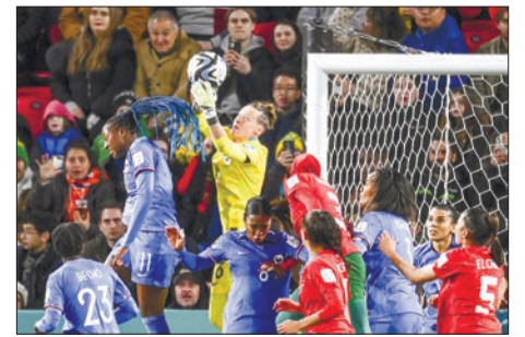
France's goalkeeper 16 Pauline Peyraud-Magnin (C) makes a save during the Australia and New Zealand 2023 Women's World Cup round of 16 football match between France and Morocco at Hindmarsh Stadium in Adelaide on 8 August 2023.

Nyein Min Soe for team Myanmar crowned the Man of the Match Award after the match against Solomon Island.