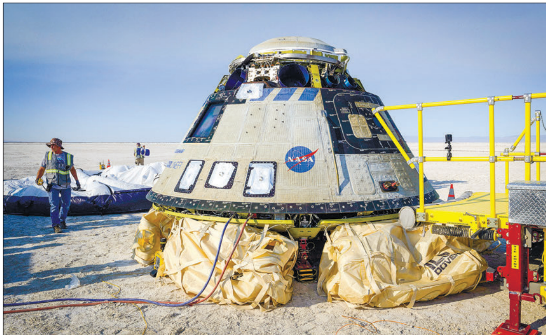
In this handout image courtesy of NASA, Boeing and NASA teams work around Boeing's CST-100 Starliner spacecraft after it landed at White Sands Missile Range's Space Harbor, 25 May 2022, in New Mexico.