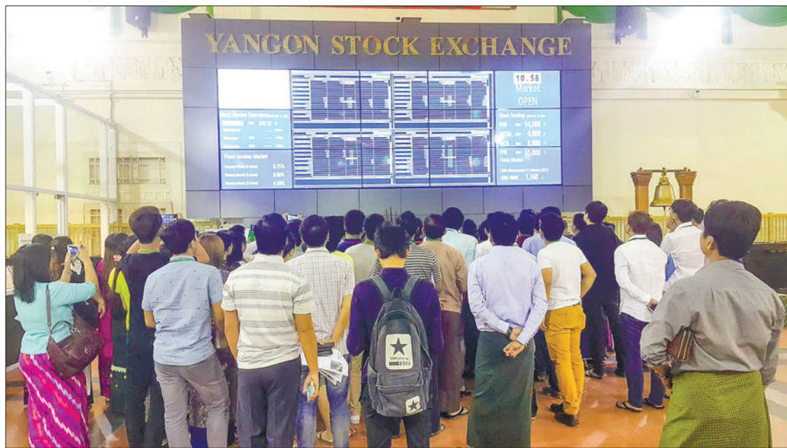
Share traders gather attentively in front of the trading index panel at the Yangon bourse.

The total trading volumes were recorded 11,678 shares of FMI worth K94.753 million, 68,043 shares of MTSH worth K193.304 million, 43,324 shares of MCB worth K311.93 million,