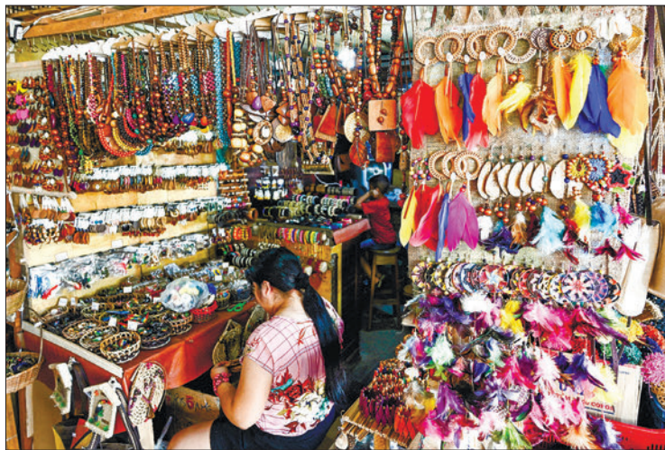
A vendor sells earrings and necklaces at a regional handicraft stall at the Ver o Peso market, the most popular tourist spot in Belem, Para State, Brazil, on 7 August 2023, ahead of the Amazon Summit in this city.

"We're calling on world leaders to work hard to promote conservation. Our struggle isn't just for Indigenous peoples, it's for the