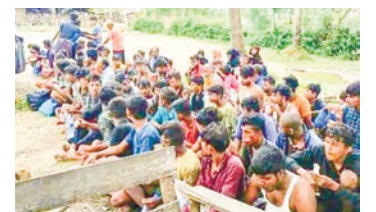
The photo shows the arrested Bengalis.

are now in the process of taking appropriate actions in response to the situation. — TWA/MKKS