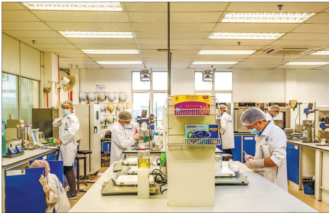
Staff of Top Glove factory works in the research and development department lab in Shah Alam on the outskirts of Kuala Lumpur on 26 August 2020. Top Glove, a Malaysian-based company is one of the world's largest rubber glove manufacturer

China remained the main destination for Malaysia's natural rubber exports which accounted for 50.6 per cent of total exports in June. This was followed by Germany (7.8 per cent), the United States (4.9 per cent), Pakistan (3.1 per cent) and Iran