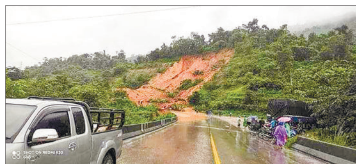
Image capturing landslide at Natsin corner and Yinkwal mountain road collapse on 8 August.

A larger landslide, roughly three times the size of the previous day's, has been reported near the site of yesterday's landslide along the Myawady-Kawkareik Asian Highway. On 8 August, around 12:30 pm, another landslide occurred close to the spot where a truck trailer had been engulfed during the previous