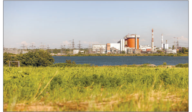
This photograph taken on 7 August 2023 shows a general view of the South Ukraine Nuclear Power Plant near the city of Yuzhnoukrainsk in Mykolaiv region on 7 August 2023 amid the Russian invasion of Ukraine.

ian nuclear power stations were not "directly affected" by the wave of Russian strikes on energy infrastructure in