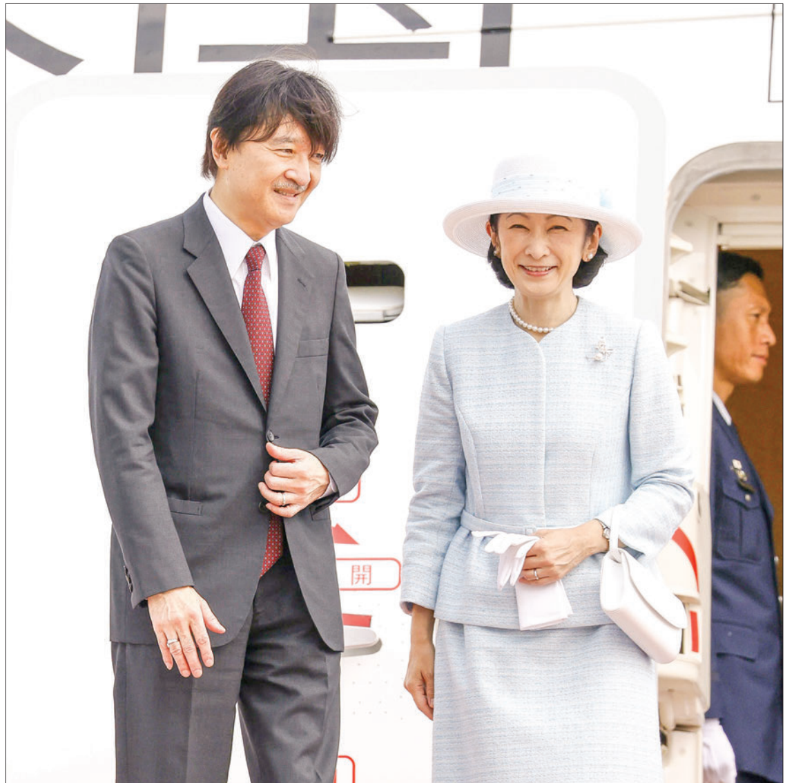
Japan's Crown Prince Fumihito and his wife Crown Princess Kiko leave for Viet Nam from Tokyo's Haneda airport on 20 September 2023, to commemorate the 50th anniversary of the establishment of diplomatic relations between the countries.

It is the couple's third official overseas trip since the May 2019 ascension of Emperor Naruhito, which made Crown Prince Fumihito — the emperor's younger brother — next in line to the throne. — Kyodo