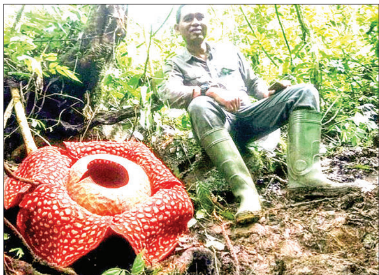
The research highlights some bright spots in existing conservation efforts.

One species of the flower is currently classed as "critically endangered", according to the International Union for Conservation of Nature. To better understand the plant and its conservation status, an international group of botanists examined 42 known Rafflesia species and their habitats – primarily Brunei, Indonesia, Malaysia, the Philippines and Thailand. — AFP