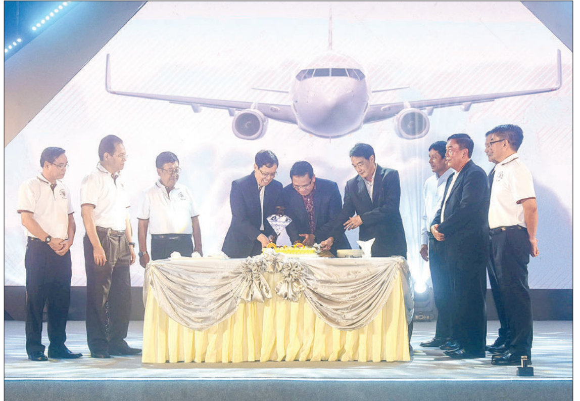
Union Minister U Maung Maung Ohn and MNA officials are pictured cutting the commemorative cake on its Diamond Jubilee occasion yesterday.

Myanmar National Airlines, the state-owned business, was originally founded as Union of Burma Airways (UBA) in 1948. Presently, MNA which marks its Diamond Jubilee on 16 September, offers scheduled