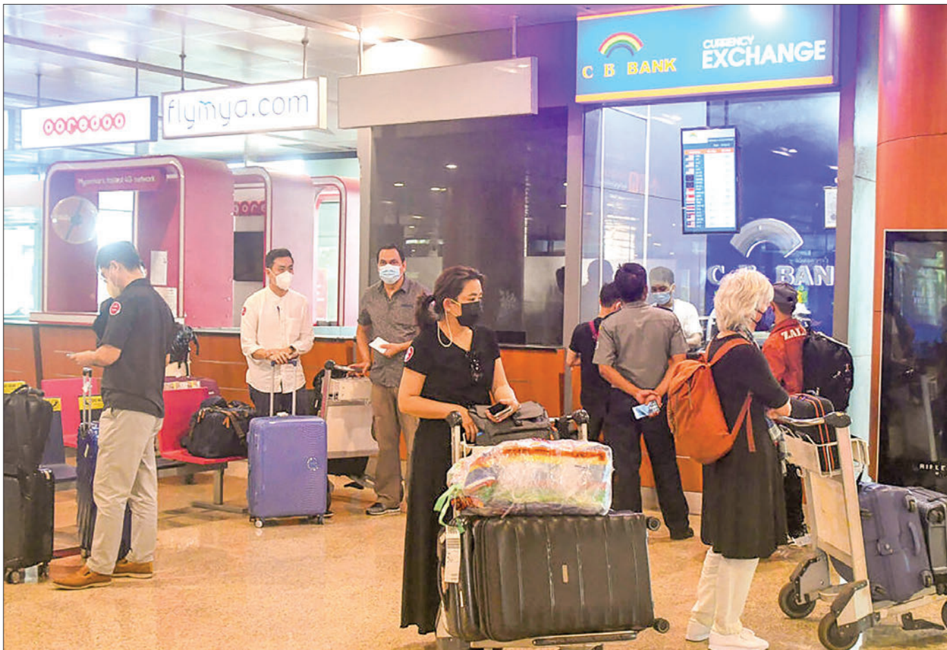
Foreign tourists at Yangon International Airport eagerly exploring Myanmar's welcoming culture and hospitality.

Myanmar expands visa-free entry to 24 nations, including four new additions.