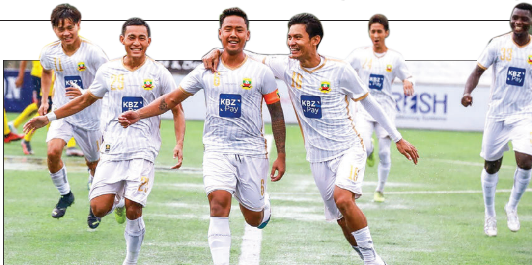
Shan United players are pictured celebrating the victory during a Myanmar National League football match.