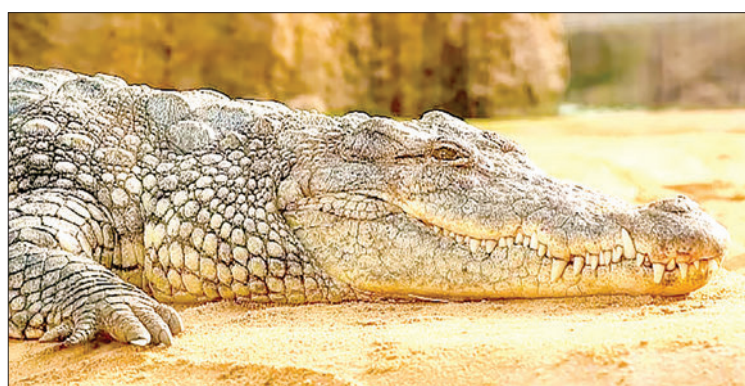
Local authorities promptly responded to the incident, mobilizing over 6,600 people to assist in the capture effort.

the supervision of Russia’s 2,000-strong peacekeeping force on the ground. — AFP