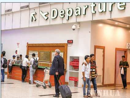
The undated photo shows passengers and their families are seen at Yangon International Airport.

It's essential to wear the temporary access card at all times while in the airport terminal's public area and adhere to the airport's security and safety regulations. Any misuse of the temporary access card will result in its revocation, and appropriate actions will be taken. — TWA/CT