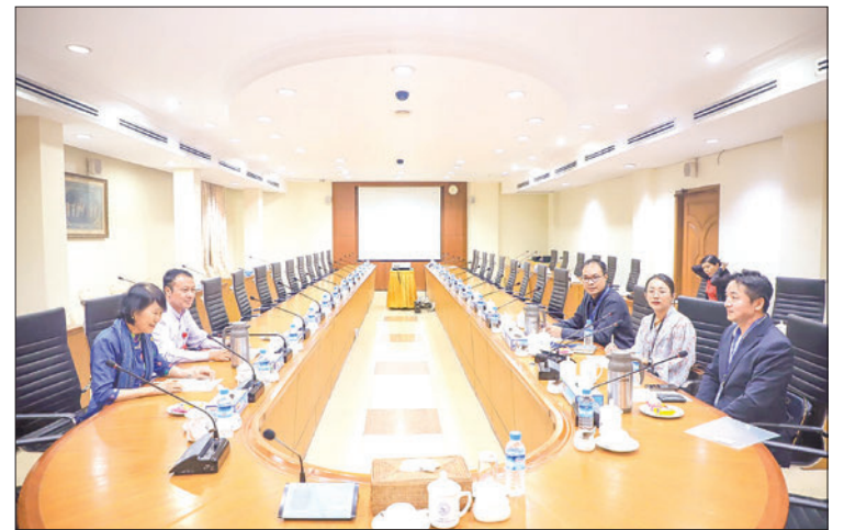
A meeting for holding the Korean Food Festival in Myanmar between CMS Korea and UMFCCI in progress on 18 September.

Around 200 small and medium-sized Korean businesses will be invited to participate in the Korean Food Festival. At the end of December this year, in Chungju City, representatives from the Chungju government and UMFCCI representatives will meet again to discuss the possibility of hosting the exhibition. — ASH/KZW