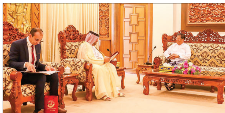
Deputy Prime Minister and Union Minister for Foreign Affairs U Than Swe meets Dr Rashid Abdulla M A Al-Kuwari, Chargé d'affaires of Qatar in Nay Pyi Taw yesterday.

DEPUTY Prime Minister and Union Minister for Foreign Affairs U Than Swe received Dr Rashid Abdulla M A Al-Kuwari, Chargé d'affaires of Qatar, in Nay Pyi Taw yesterday.