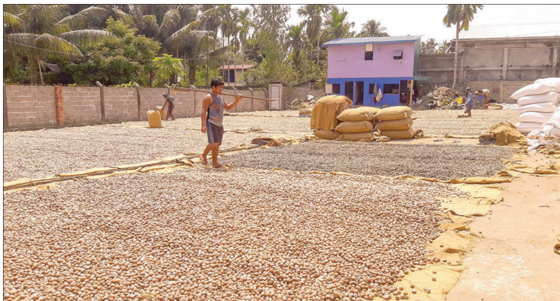
Areca nuts are seen being dried under the sun in Myeik, Taninthya Region.

The areca nut growers in the Taninthayi Region are anticipated for market return in the upcoming year. The areca nuts are produced in Launglon, Yephyu, Kaleinaung, Thayetchaung, Palauk, Palaw, Myeik, Bokpyin and Kawthoung townships. Of them, Taninthayi is the leading producer.