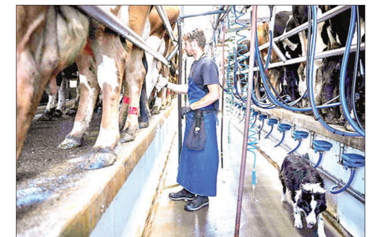
Cows belch methane, a potent greenhouse gas whose warming effect is much stronger than carbon dioxide. Cleaning cows after milking is vital for cow health, milk quality, and food safety.

The decline of life-sustaining ecosystems on current trajectories would be more than halved by 2050, the study suggested.—AFP