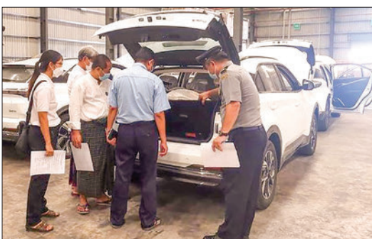
Officials from Yangon Port check the Neta U electric vehicles.

NETA U electric vehicles, imported by Grand Sirius Co Ltd, and Yadea electric motorcycles, brought in by Myanmar Arr Thit Man Motor Co Ltd, have arrived at Yangon Port recently. These imports were approved by the Steering Committee on National-Level Development of Electric Vehicles and Related Industries. The vehicles were claimed yesterday in compliance with the rules and regulations. Electric vehicles (EVs) and electric motorcycles are exempt from Customs tariffs. — MNA/KZW