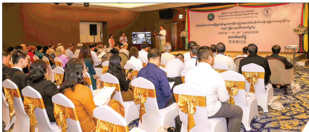
The Seminar jointly organized by the Myanmar Institute of Strategic and International Studies and the Institute of Myanmar Studies at the Yunnan University in progress on 20 September 2023 in Yangon.

the Ministry of Foreign Affairs, professors and post-graduate students from the University of Yangon and the Yangon University of Foreign Languages, officials from the Institute of Myanmar Studies, Yunnan University, professors and research fellows from the Peking University and Xiamen University China were present on the occasion.