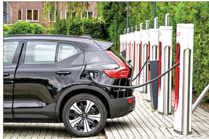
An electric car charges at a charging point reserved for Tesla cars.

Because of decades of regulations that brought about