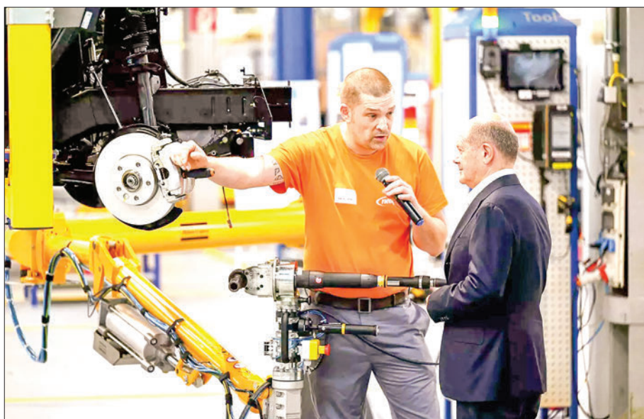
German Chancellor Olaf Scholz during a visit to the Neapco Europe plant in Düren, Germany, on 22 August 2023.

Reduced global demand for German industrial products is exacerbating the risk of a recession.