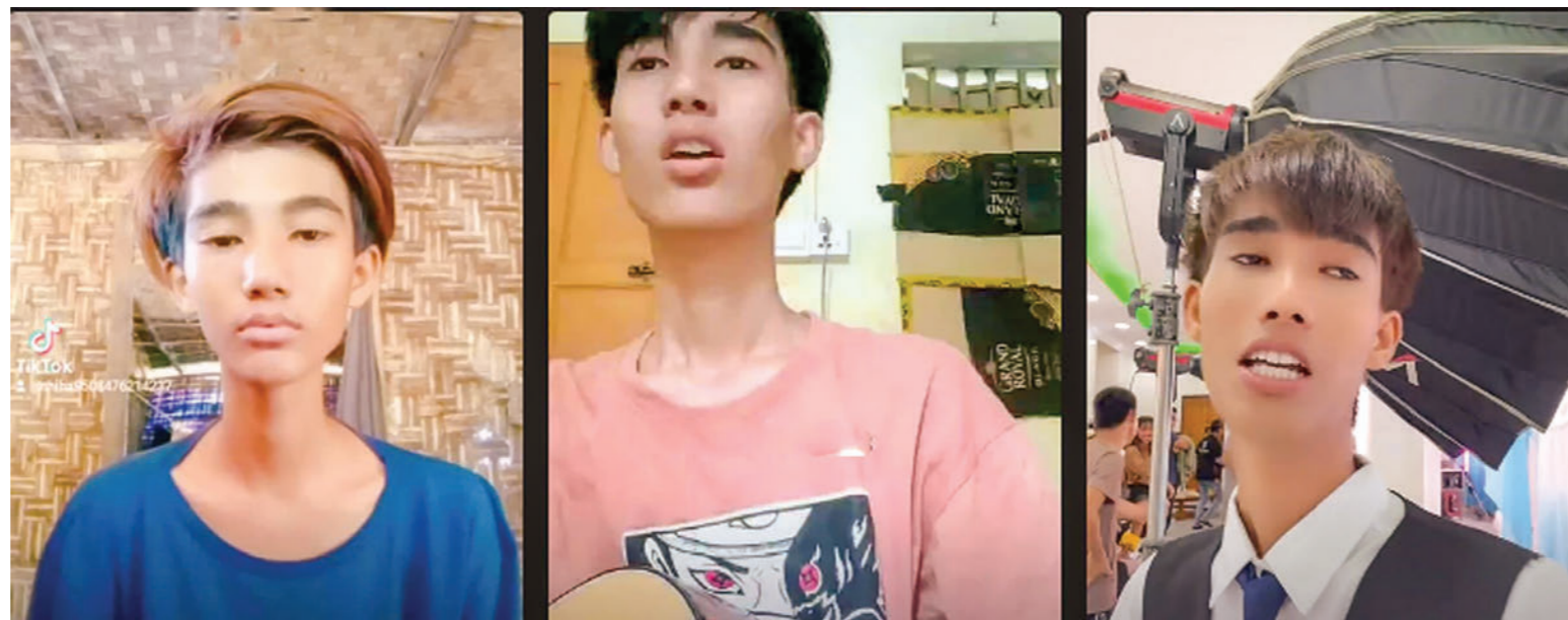
Stay open to art and creativity in life. Appreciate various forms of art, like paintings, songs, and books. Anonimus tapped into a universal desire for music that touches people's hearts all over the world.

our brains release neurotransmitters like dopamine, which are associated with pleasure and reward. This neurochemical response reinforces our connection to the object of our affection, creating a sense of joy and fulfilment.