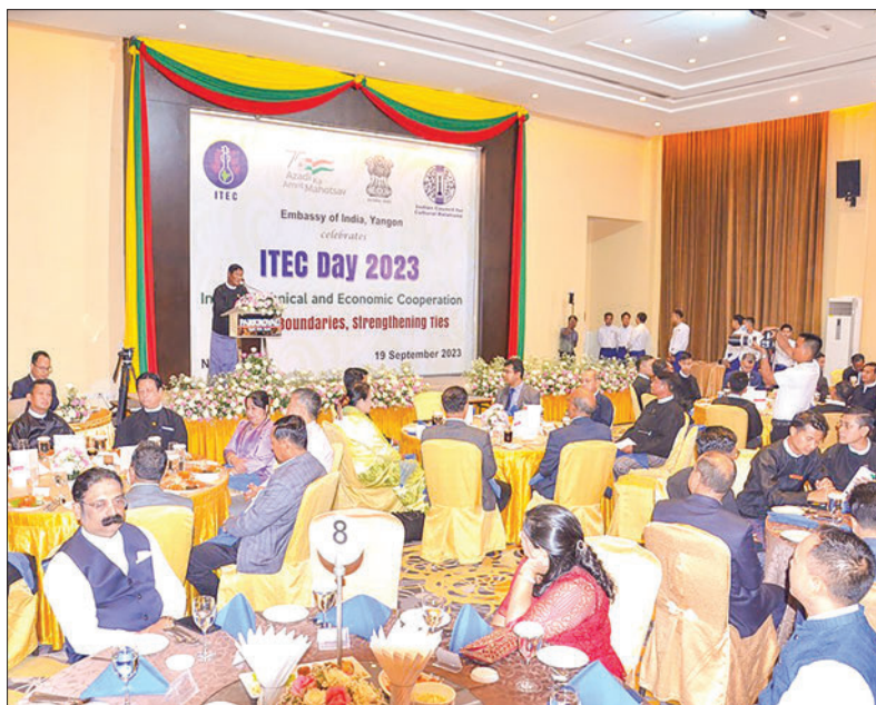
The India Technical and Economic Cooperation Day 2023 celebration in progress on 19 September in Nay Pyi Taw.

THE ceremony to commemorate the India Technical and Economic Cooperation (ITEC) Day 2023 was held at Park Royal Hotel in Nay Pyi Taw on Tuesday.