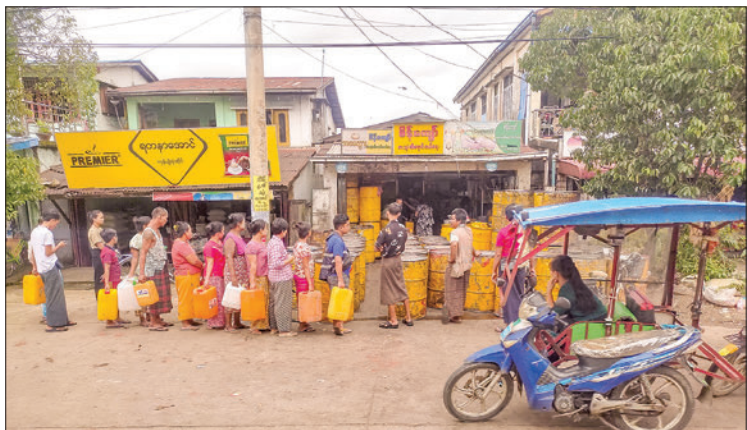
People are seen queuing up to buy palm oil from a retail outlet.

FROM 18 to 24 September, the basic reference price of palm oil is K4,440 per viss, dropping by K84 per viss compared to the previous week.