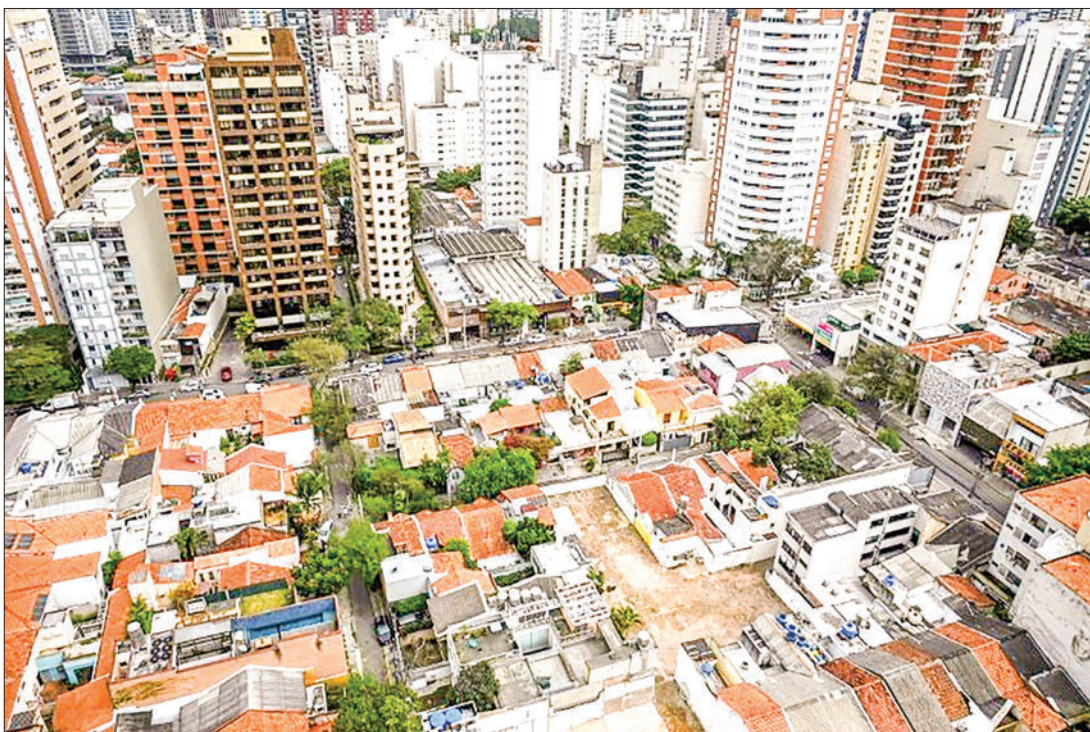
An aerial view of houses surrounded by high-rise buildings in the Pinheiros neighbourhood of São Paulo, Brazil, is seen 5 September 2023. PHOTO: AFP

That is a lot even for Sao Paulo, a cosmopolitan city built on waves of immigration throughout the 20th century that grew at breakneck pace into the sprawling, traffic-snarled, bubbling metropolis it is today. — AFP