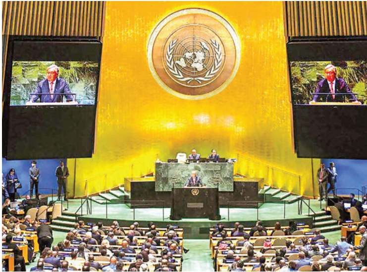
UN Secretary-General Antonio Guterres (at the podium and on the screens) speaks at the opening of the General Debate of the 78th session of the UN General Assembly at the UN headquarters in New York, on 19 September 2023.

The primary focus of this debate is centred on the critical need to restore global trust and solidarity, particularly during challenging times.