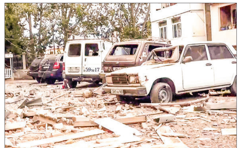
A video grab taken on 20 September 2023, from footage released by the Nagorno-Karabakh Foreign Ministry, shows wreckages littering a street around damaged cars in Stepanakert, on the first day of Azerbaijan’s renewed offensive on the region.

istry said in addition that “all weapons and heavy armaments are to be surrendered” under