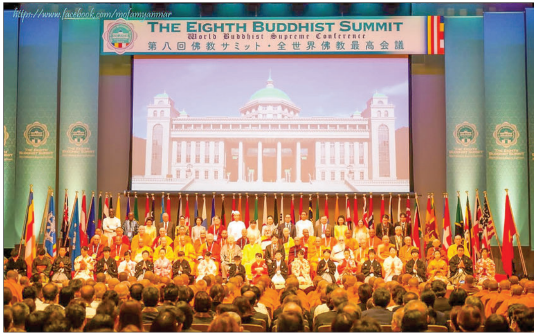
The Eighth World Buddhist Summit in progress in Tokyo, Japan, 14 September 2023.