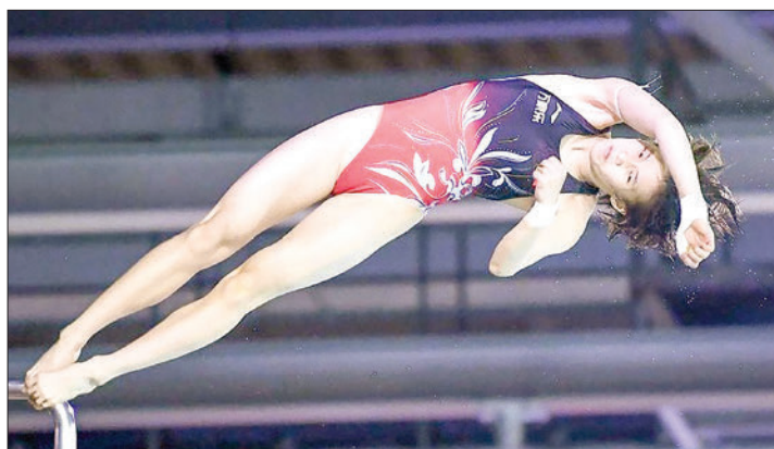
Chen Yuxi of China competes during the women's 10-metre platform final at the World Aquatics Diving World Cup 2023 Super Final in Berlin, Germany, 5 August 2023.

tle at three consecutive world championships after she triumphed in Fukuoka, Japan, in late July. Chen later retained her title at the World Aquatics World Cup Super Final in Berlin, Germany. — Xinhua