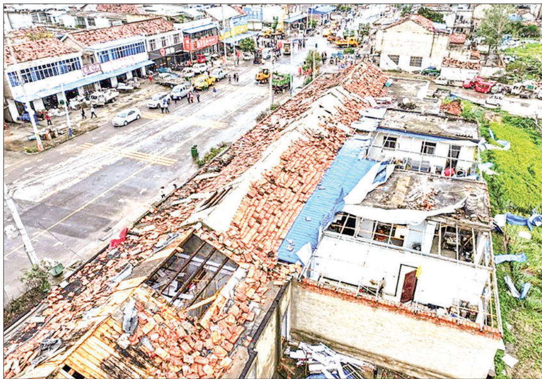
Buildings damaged by a tornado that hit China's eastern Jiangsu province, killing five people.