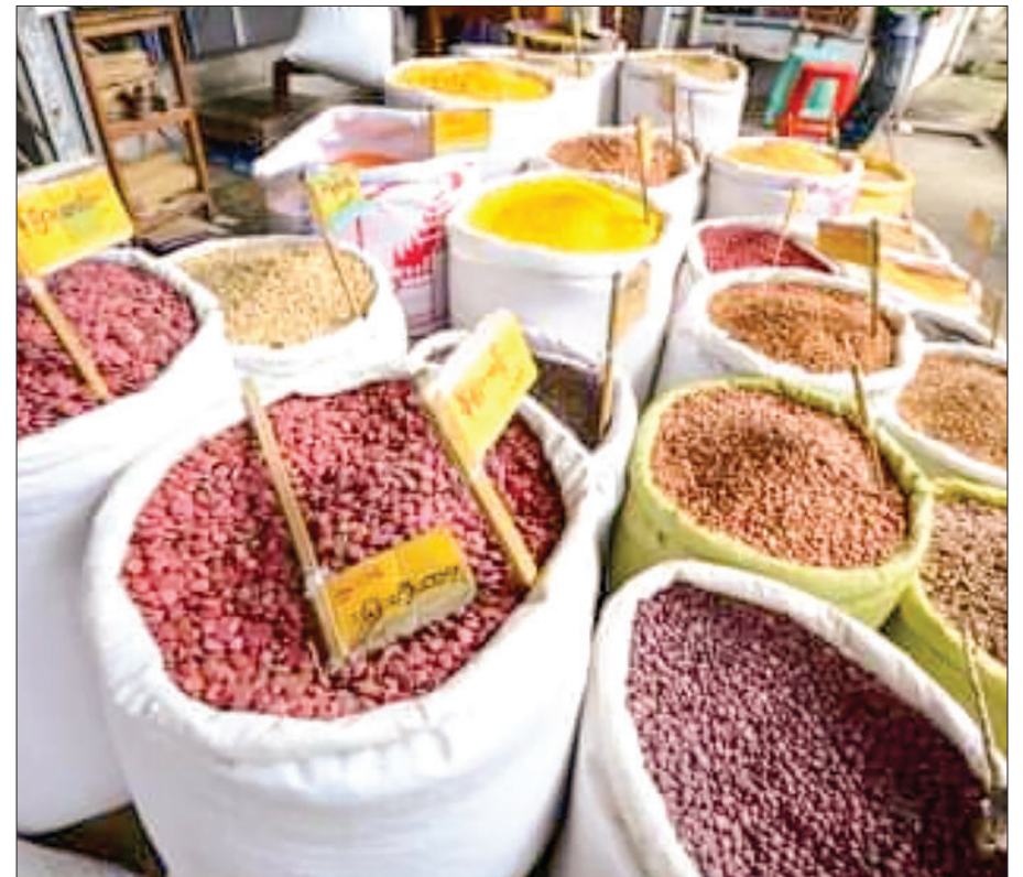
The picture shows a shop displaying various pulses for sale.

Myanmar shipped more than 720,900 tonnes of pulses, with an estimated value of over US$586 million, to foreign countries over the past five months of the 2023-2024 financial year beginning 1 April, including 279,300 tonnes of black gram worth $214 million