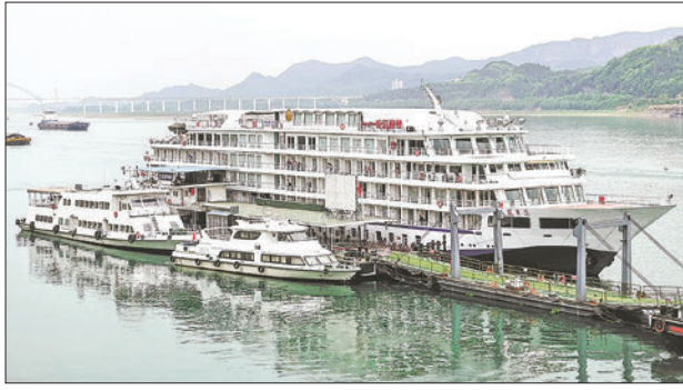
A cruise ship is seen at No 9 dock of Yichang Port on the Yangtze River in Hubei province on 2 May.