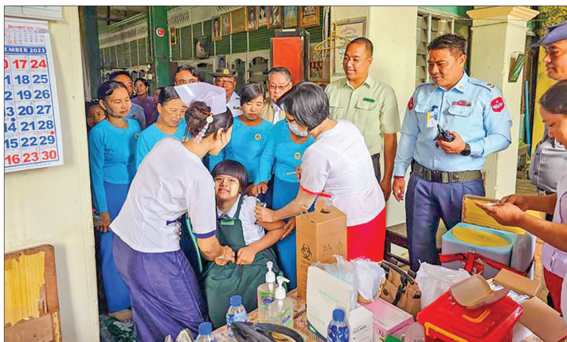
The Human Papillomavirus-HPV Vaccination Programme for girls between ages 9 and 12 is seen being conducted in Wakema, Myaungmya District in Ayeyawady Region, on 18 September.

According to HPV data published by the World Health Organization (WHO) in March 2023, the most common age group for cervical cancer in Myanmar is