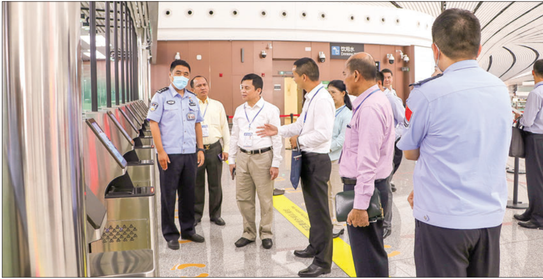
Union Minister for Immigration and Population U Myint Kyaing observes the technology-based immigration inspection systems during his study tour in China.

UNION Minister for Immigration and Population U Myint Kyaing visited Hisign Technology Co Ltd in Beijing on 18 September. During the visit, the company's Chairman, Mr Liu Xiaochun, provided insights into the company's technical products and their performance. He also explained the utilization of technology for collecting biographic and biometric information from individuals.