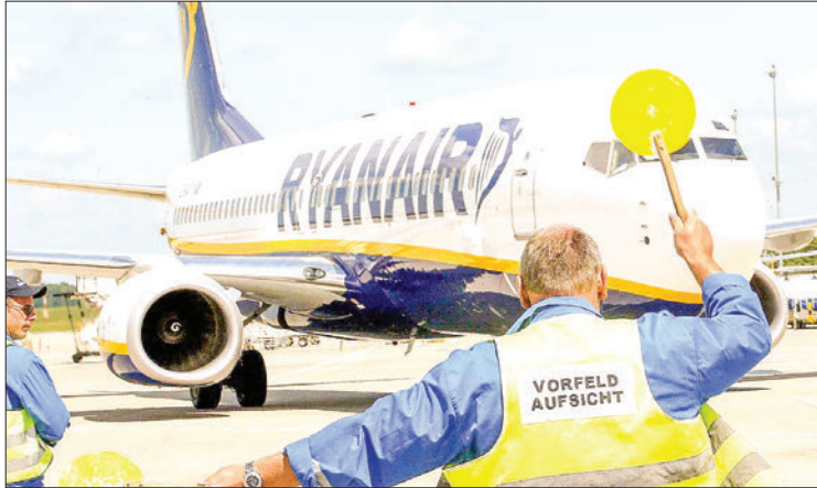
The regulator has raised concerns that Ryanair may hinder travel agencies from directly purchasing airline tickets from its website.

The Italian Competition Authority has accused Ryanair of attempting to expand its market influence by providing additional tourist services like hotel and car rental bookings.