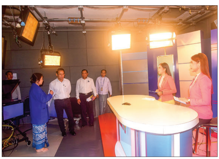
Union Minister U Maung Maung Ohn views the news programme of MRTV-HD channel at MRTV in Yangon.

In the afternoon, the Union minister talked about cooperation with foreign countries in the media sector at the