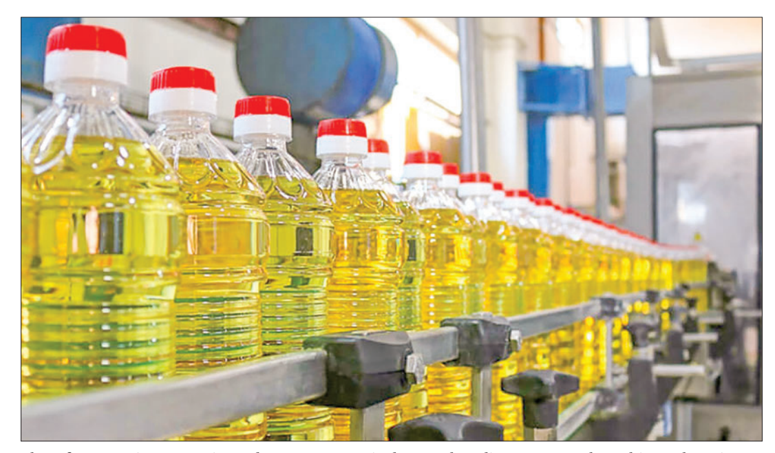
The reference price was registered at K4,440 per viss last week ending 24 September. This week's price showed a decrease of K65 per viss compared to that of the previous week.

THE wholesale reference rate of palm oil for the Yangon market was set lower for a week ending 1 October at K4,375 per viss, according to the Supervisory Committee on edible oil import and distribution.