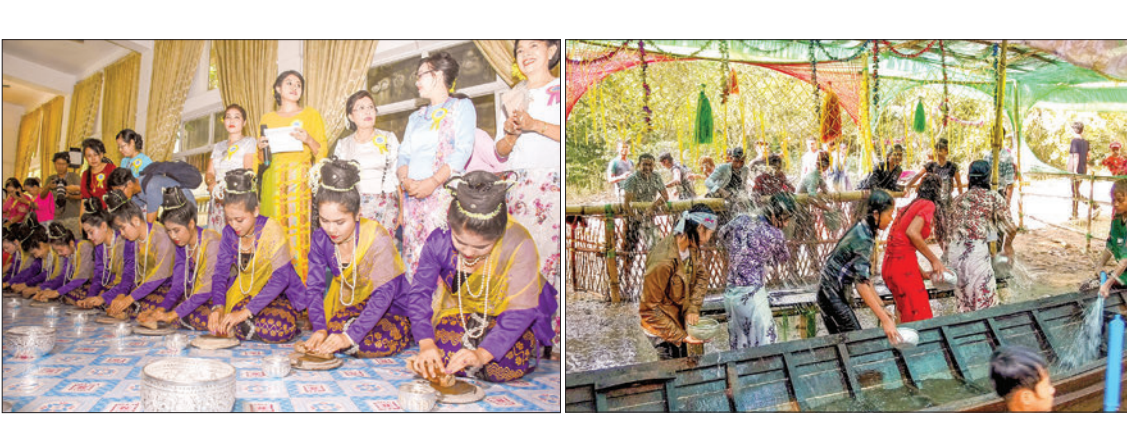
Captivating images showcase Rakhine Traditional Thingyan Festival in past years.

is offered using perfumed water obtained from the incense, starting from the third day, from 14 to 17 April, traditional boats are used for water play, and young