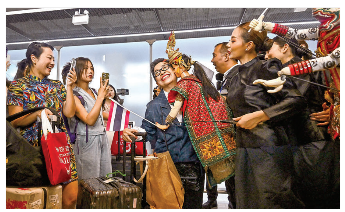
Chinese tourists are greeted by Thai dancers at the arrivals gate at Suvarnabhumi International Airport in Bangkok on 25 September 2023.