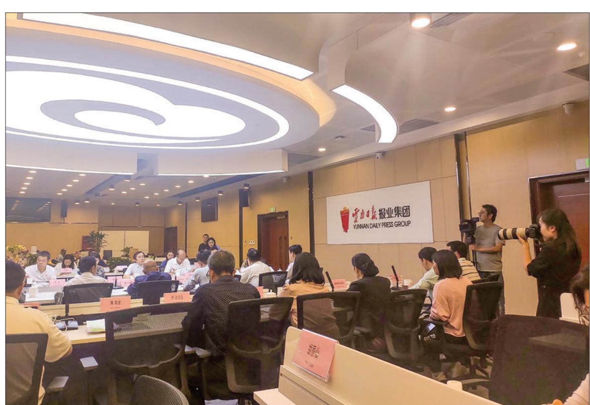
We @ Yunnan Daily (For Article).