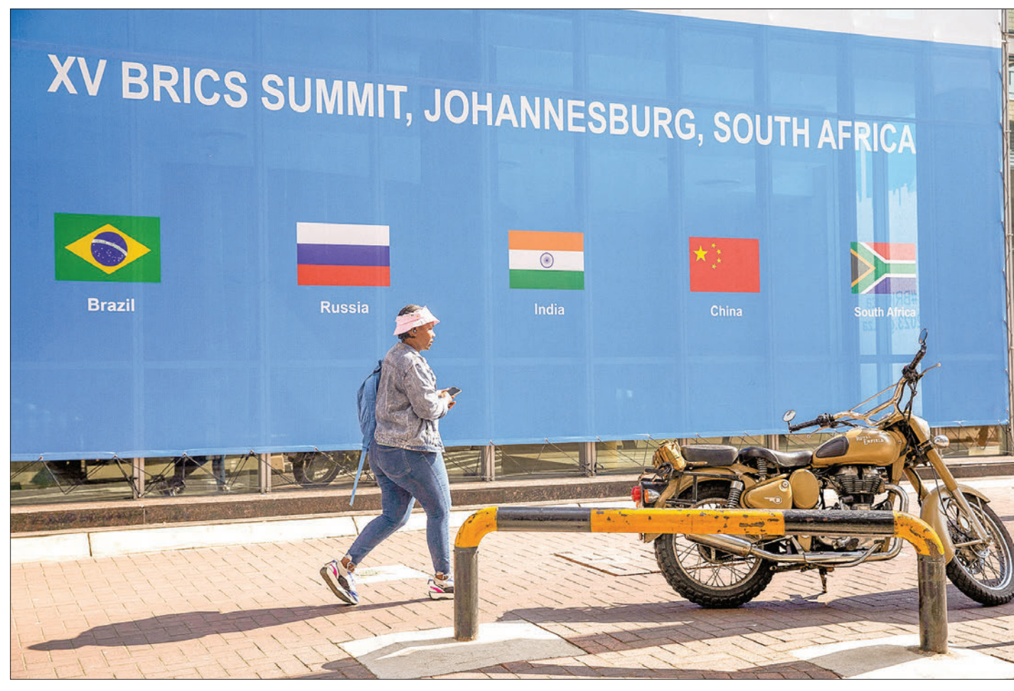
A woman walks past a banner outside the venue for the 2023 BRICS Summit at the Sandton Convention Centre in Sandton, Johannesburg, on 20 August 2023.

Venezuela and Russia will soon hold a meeting of the high-level intergovernmental commission and discuss military-technical cooperation, Venezuelan