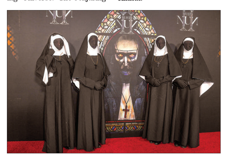
Actors dressed as nuns pose on the red carpet for a special screening of "The Nun II" at the Regal LA Live in Los Angeles, California, on 30 August 2023.

Lionsgate's action film "Expend4bles," starring Sylvester Stallone and Jason Statham, opened in second place with 8.3 million dollars this weekend. — Xinhua