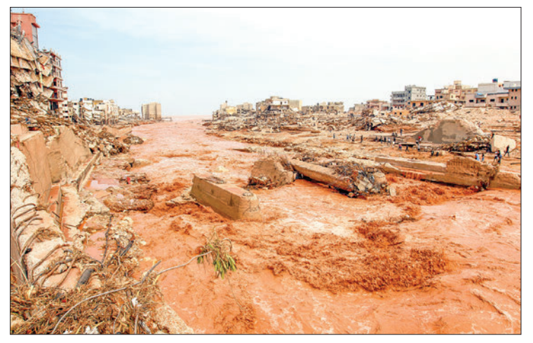
People look at the damage caused by freak floods in Derna, eastern Libya, on 11 September 2023. Flash floods in eastern Libya killed more than 2,300 people in the Mediterranean coastal city of Derna alone, the emergency services of the Tripoli-based government said on 12 September.

On Saturday the official death toll passed 3,800, and international aid groups have said