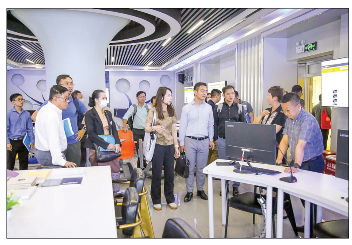
Yunnan University School of Journalism Broadcasting Faculty Studio.

More media cooperation between the two countries should be done. Journalists should also regularly attend Mainland Chinese media events and regularly exchange media and cultural information