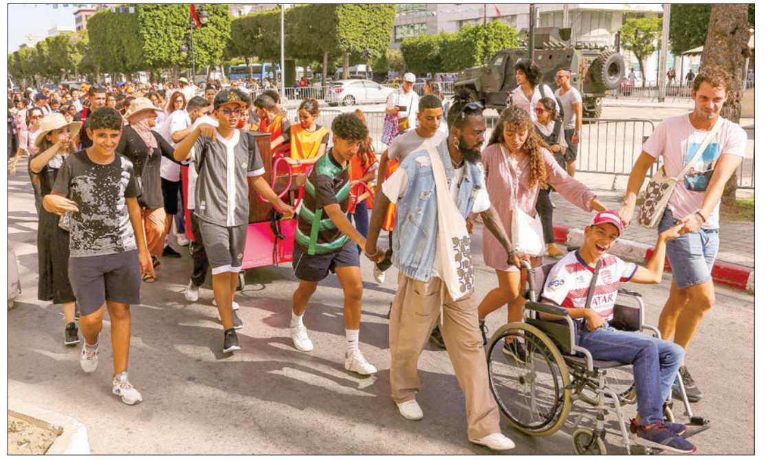
People attend a music parade, aimed at raising awareness of children with disabilities, in Tunis on 21 September 2023.

The performance comes at a difficult time for Tunisia, which recently saw a wave of racial violence mainly targeting migrants from sub-Saharan Africa. — AFP