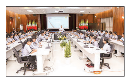
Collaborative implementation of Logistics Surveillance System (E-Lock), National Single Window