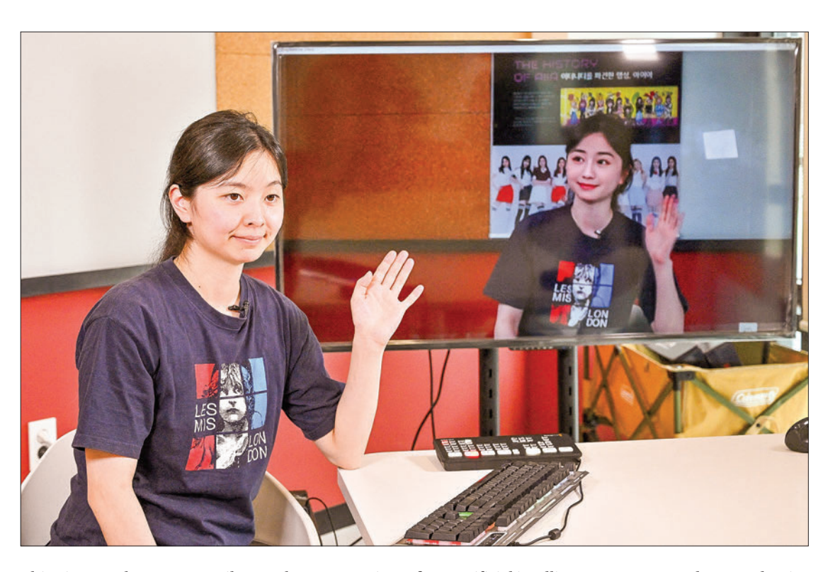
This picture taken on 24 April 2023 shows an engineer from artificial intelligence company Pulse9 conducting a demonstration as a live actor for virtual human Zaein, seen on-screen, during an interview with AFP at the company in Seoul.

HER face is a deepfake. Her body belongs to a team of similar-sized actors. But she sings, reads the news, and sells luxury clothes on TV as AI humans go mainstream in South Korea.