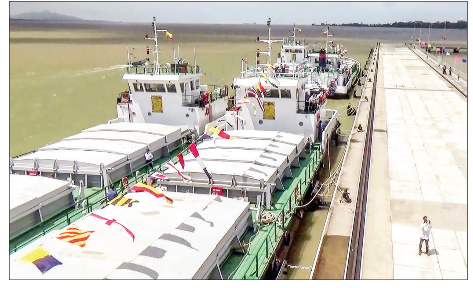
Cargo\ vessels\ are\ pictured\ docking\ alongside\ the\ Sittway\ Jetty,\ vital\ part\ of\ the\ Kaladan\ Multi-Modal\ Transit\ Transport\ Project.