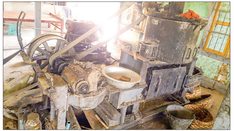
An oil production machine part from an oil mill.

Regarding the first round of oil mill loans, K50 billion has been approved by the State Economic Promotion Fund, and the loans have already been disbursed to of Agriculture, Livestock, and oil mill operators. — TWA/CT