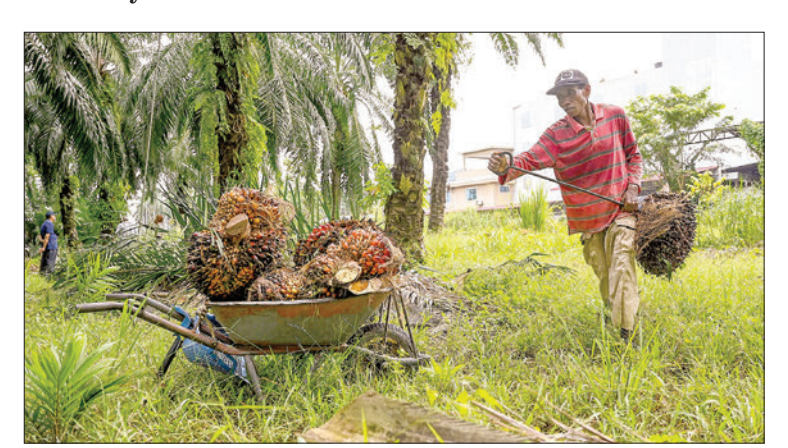
This picture taken on 30 June 2022 shows a foreign worker collecting palm oil fruits in Ijok, in Malaysia's Selangor state. Overripe palm oil fruits hang untouched in trees while others lie rotting scattered around a plantation, as Malaysian farmers reap the bitter harvest of a severe labour shortage.

It will "definitely" help Malaysia counter European curbs, he added. — AFP