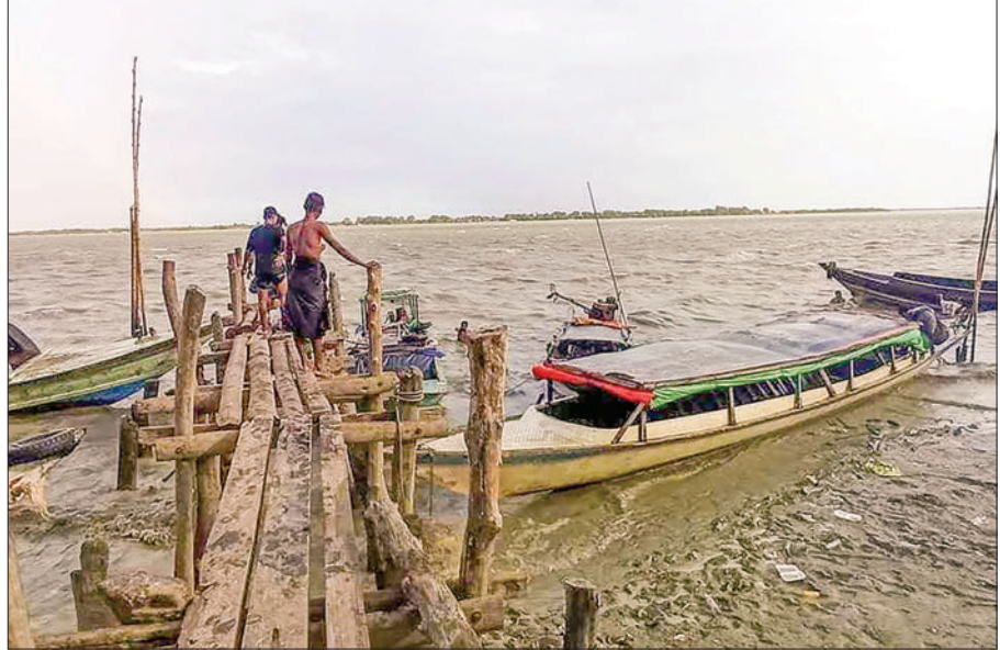
Yway River from which catching hilsa was banned for one month.

IT is known that a warning has been issued not to catch hilsa species that come from the sea to spawn for exactly one month.