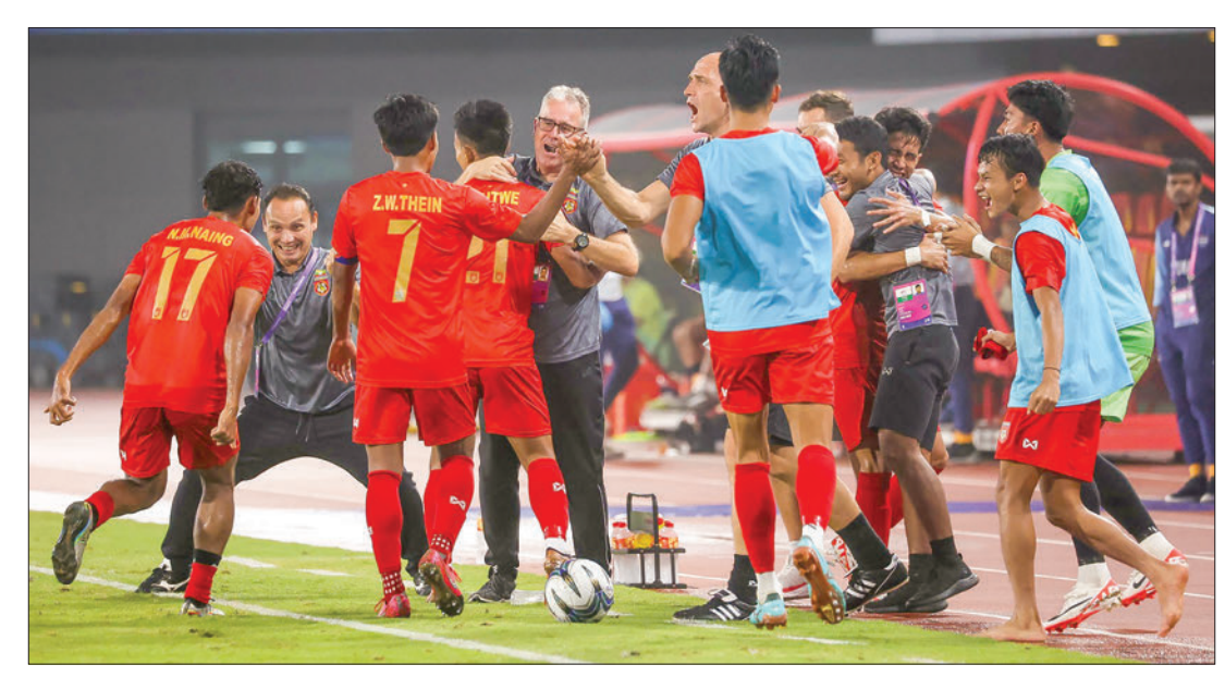
Players of Myanmar men's U-24 team celebrating their success in a 1-1 draw with India for advancing to the next stage.

Myanmar fell into Group A together with host China, India and Bangladesh. After the group matches, Myanmar sailed into the second stage of the tournament from the best third position of the group with four points in one win, one draw and one loss.