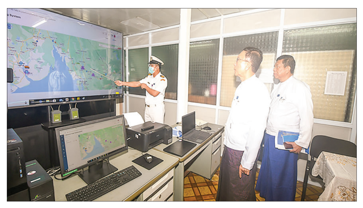
Deputy Prime Minister MoPF Union Minister U Win Shein hears the report by a customs official.

E-Lock and the National Single Window System are crucial projects that must be successfully implemented.