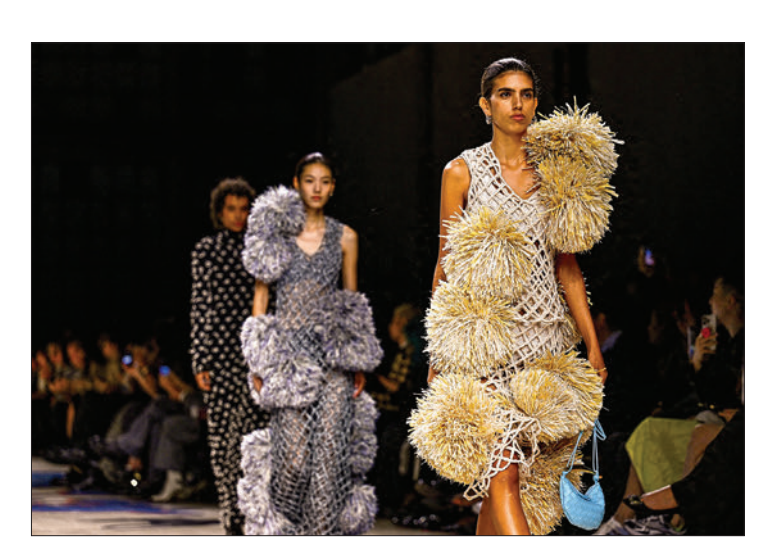
Models walk the runway of the Bottega Veneta show during the Milan Fashion Week Womenswear Spring/Summer 2024 on 23 September 2023 in Milan.

This means 95.6 per cent of outfits presented were in US size 0-4.