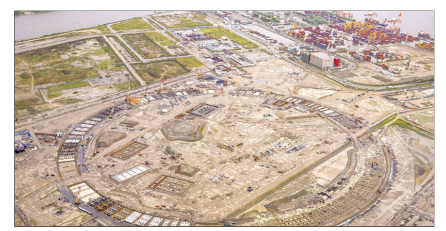
File photo taken in July 2023 shows the artificial Yumeshima island in Osaka Bay, western Japan, where the 2025 World Exposition is scheduled to be held.

The event, to be held from 13 April to 13 October 2025 on the man-made island of Yumeshima in Osaka Bay, is set to showcase technological and cultural exhibitions by around 150 countries and regions, with the number of visitors expected to reach around 28 million. — Kyodo