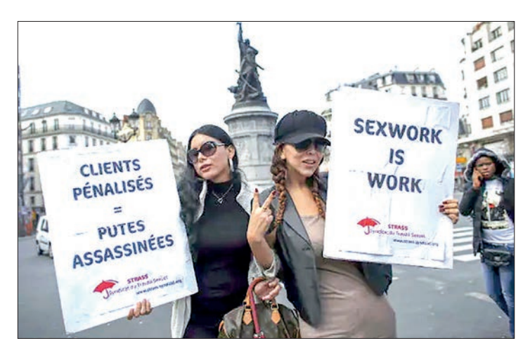
Sex workers and their associations regularly protest against the law with action days and street marches.

The Strasbourg-based court said it agreed to rule on