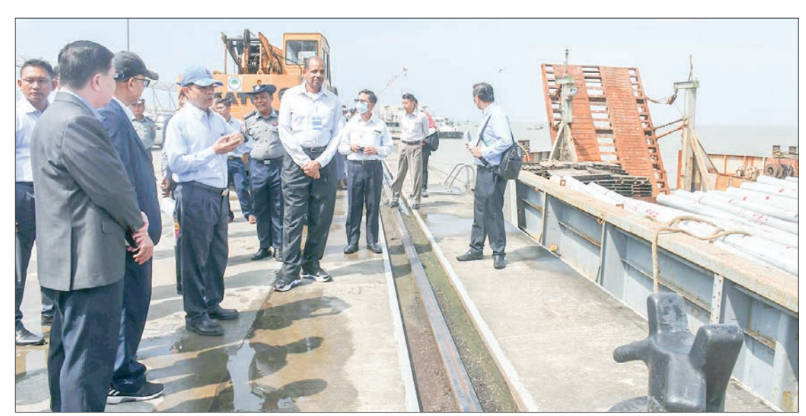
The diplomatic mission views round the Multi-purpose Port in Sittway.

Diplomats appreciate Myanmar for its effective rehabilitation processes in storm-hit areas, repatriation of displaced persons