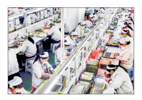
Companies in Japan to recruit around 1,200 Myanmar workers