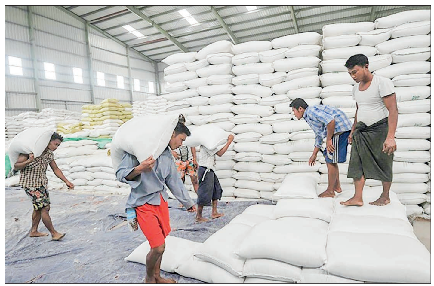
Workers busy organizing rice bags for sale and distribution at the Yangon warehouse.