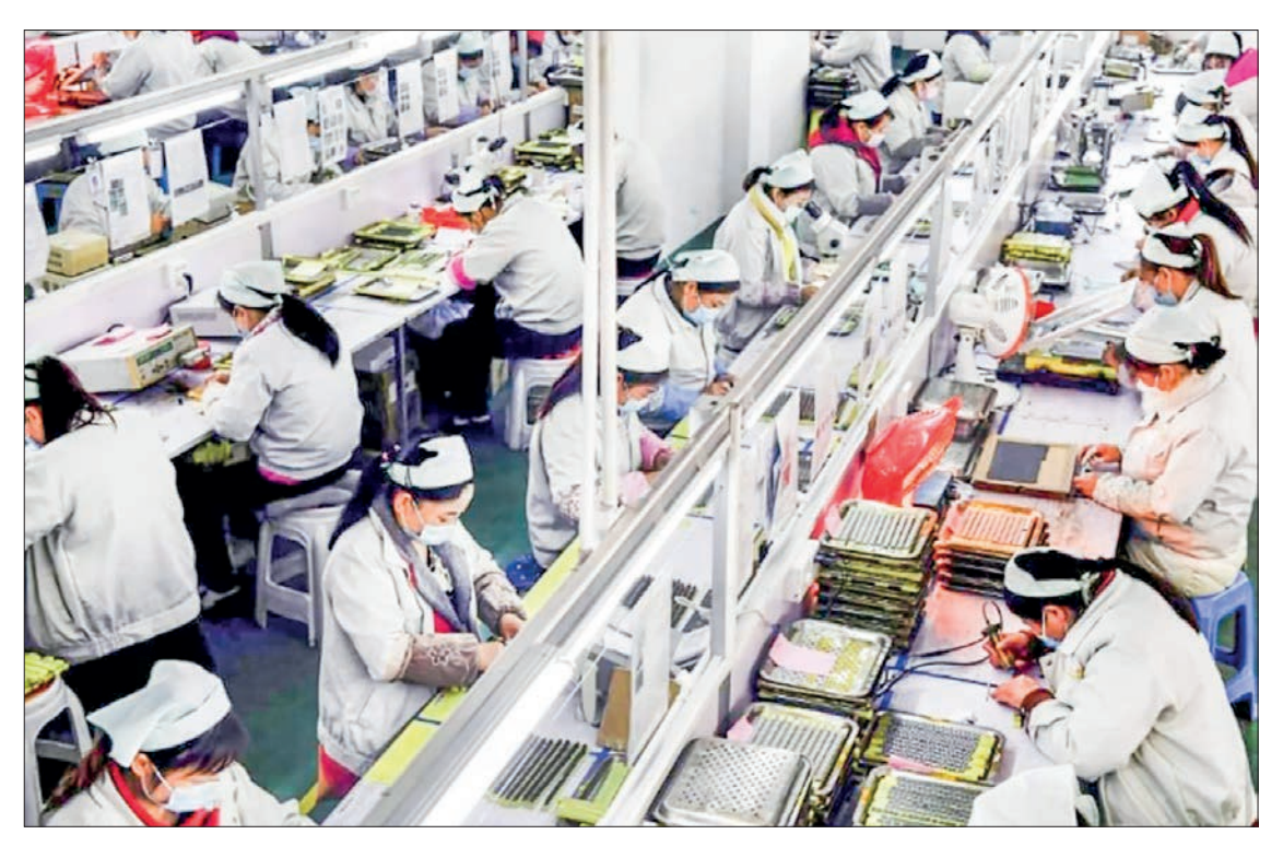
The photo shows the workers including Myanmar nationals at the electronic factory in Japan.

THE Myanmar Embassy to Japan in Tokyo announced on 31 August that a total of 1,200 Myanmar workers will be recruited again for companies in Japan.