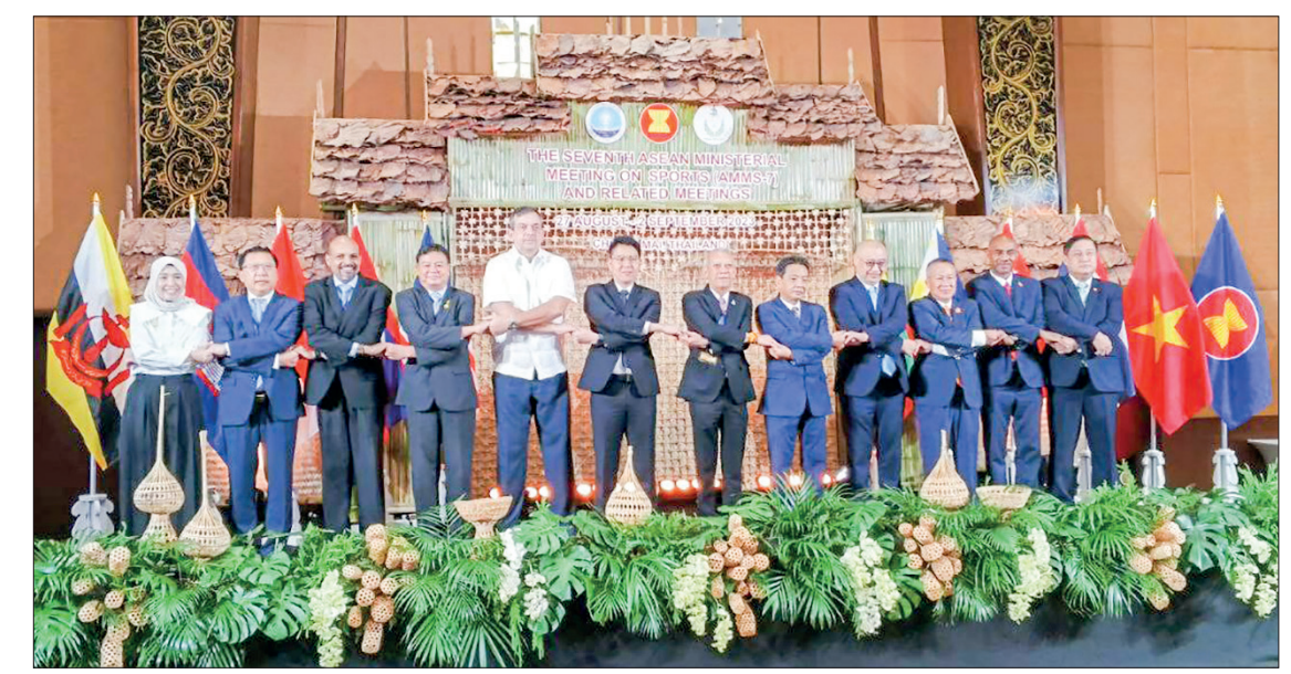
Union Minister U Min Thein Zan poses for the group documentary photo at the event in Chiang Mai, Thailand.

The representatives of the ASEAN member countries discussed the sports status plus issues related to prohibited