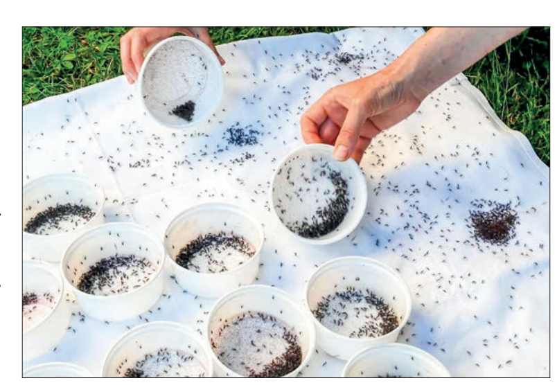
A photograph taken on 29 June 2023 shows plastic containers with sterile male Tiger mosquitoes that will be released, in Zagreb, Croatia. The purpose of releasing sterile male mosquitoes is to disrupt the natural reproductive cycle of the Tiger mosquito population.