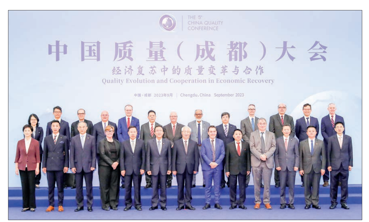
Deputy Prime Minister Union Planning & Finance Minister U Win Shein poses for the group documentary photo at the 5<sup>th</sup> China Quality Conference yesterday.

MYANMAR is stepping up its digital system in the financial sector and encouraging green business development while setting electric car import as