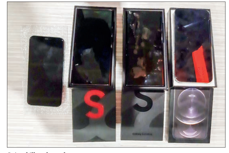
Seized illegal goods.

under the supervision of Mandalay Region Illegal Trade Eradication Task Force captured an Isuzu tractor head and a trailer (approximately K63 million), headed to Mandalay from Muse, carrying 41 kinds of goods worth K191,171,459 including 690 sets of fuel pump assembly and 3,790 kilogrammes of cleaning liquid for carburetor that were not declared in the Import Declaration (ID) at the Milepost 25/6 on Muse-Man-