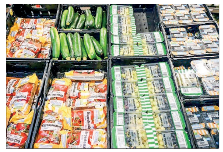
Some analysts said the inflation data would not dramatically change the ECB's trajectory on 14 September.

The figure is far higher than the ECB's two-per-cent target.—AFP