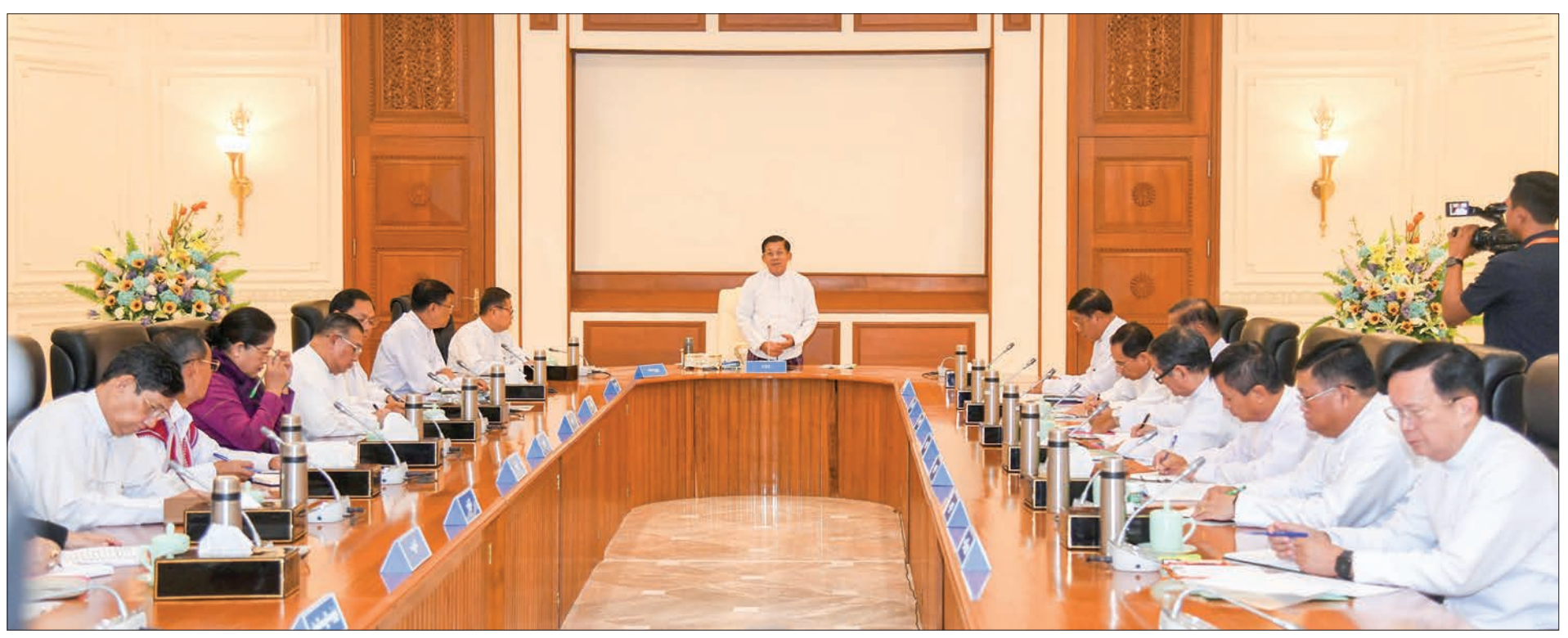
State Administration Council Chair Prime Minister Senior General Min Aung Hlaing presides over the SAC Meeting 3/2023 in Nay Pyi Taw on 1 September 2023.