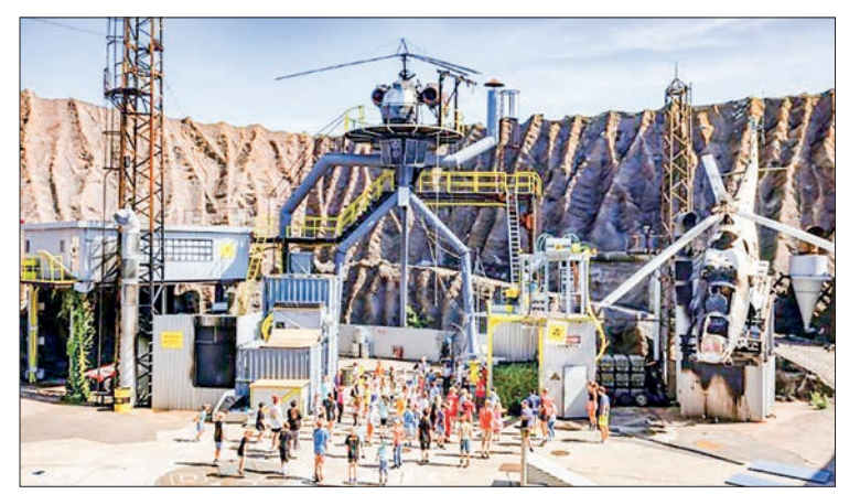
Seventy-five children between the ages of six and 16 are allowed to take part in each workshop.

While the actors' and writers' strikes in Hollywood freeze up film production around the world, stunt performers in Germany are biding their time putting on "adrenaline-packed" workshops for kids. — AFP