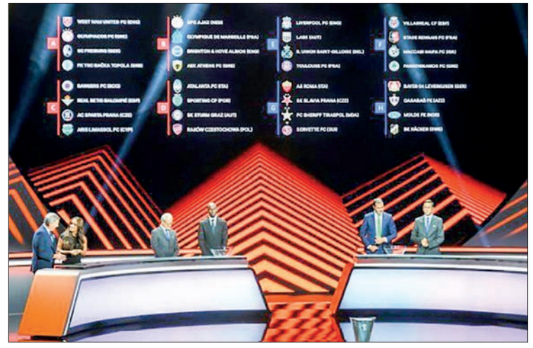
The Europa League group-stage draw was held in Monaco on Friday.

Brighton finished sixth domestically last season to qualify