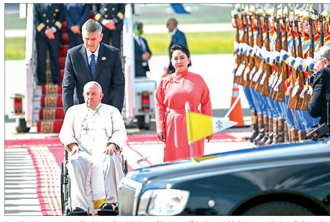
Pope Francis was received by Mongolia's Minister of Foreign Affairs Batmunkh Battsetseg (R, in red) during his arrival in Ulaanbaatar.

The papal visit is a strategic move to enhance Vatican ties not only with China but also with Russia, as Mongolia shares borders with both nations.