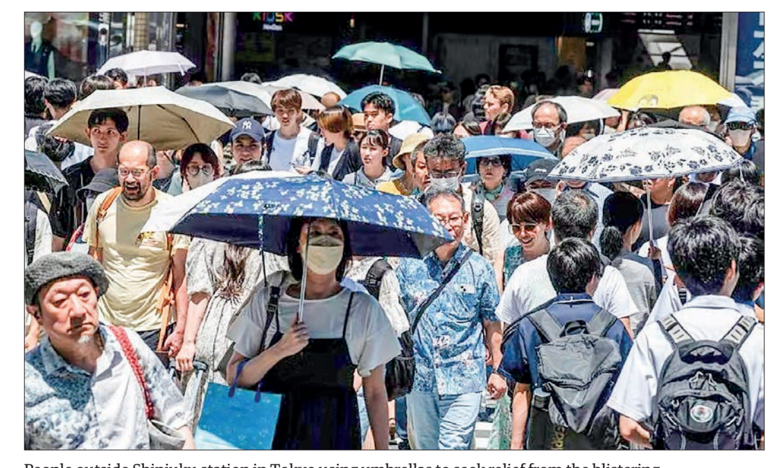
People outside Shinjuku station in Tokyo using umbrellas to seek relief from the blistering heat.

TEMPERATURE records are being toppled across Asia, from India's summer to Australia's winter, authorities said Friday. in fresh evidence of the impact of climate change.