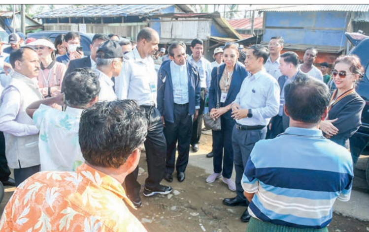
At the Thetkaepyin IDP camp

State government clarified the repatriation processes, ongoing rehabilitation processes and ar-