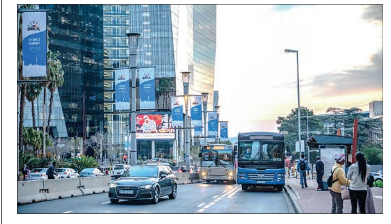
Signboards of the 15th BRICS summit are seen on a street of Johannesburg, South Africa, 17 August 2023.

Last week, the BRICS group of major emerging economies -Brazil, Russia, India, China and South Africa - announced that its membership is more than doubling. Argentina, Egypt, Ethiopia, Iran, the United Arab Emirates (UAE), and Saudi Arabia were invited to join the group. Their membership will take effect on 1 January 2024. — SPUTNIK