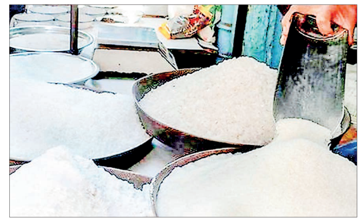
Jaggery balls and sugar are seen in the market.

Sugar export to China via the land border was conducted under the provincial-level Memorandum of Understanding. However, it came to an abrupt stop due to the COVID-19 policy of China. Therefore, the sugar industry called for a government-to-government agree-