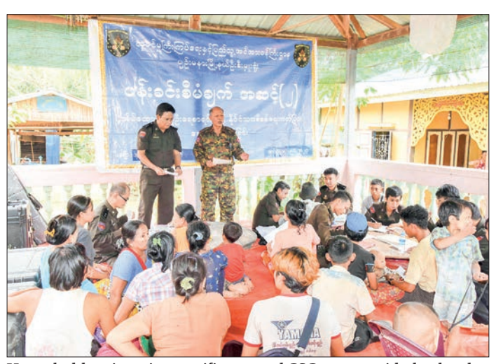
Household registration certificates and CSCs are provided to locals in Bangbar village-tract.

A collaborative team led by Nay Pyi Taw Council member Col Min Naung made a field study trip yesterday to Bangbar and Seikphutaung villages in Pyinmana township by motorcade in order to ensure regional stability and peace, security, the rule of law, education, health and local development.