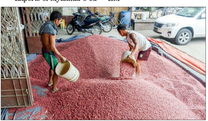
The peanut prices jumped to K11,000 per viss last 18 August on the back of strong foreign and domestic demand.

The country shipped about 90,000 kilogrammes worth US$13.851 million to foreign markets through seaborne and border trade channels over the past four months of the current financial year 2023-2024. — NN/