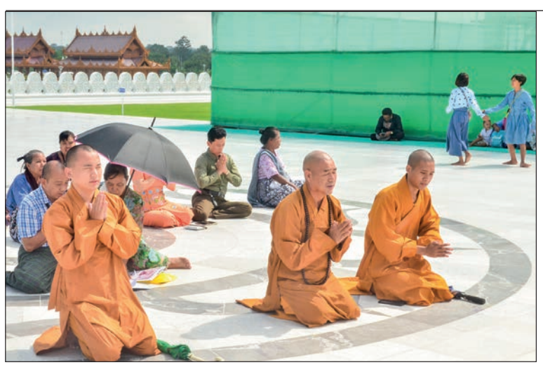
Devotees, including monks and nuns, pay homage to the Maravijaya Buddha Image at the Buddha Park in Nay Pyi Taw yesterday.