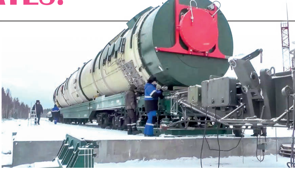
The Sarmat system is meant to replace RS-20 Voevoda missile systems. The new missile is capable of striking targets at long ranges using various flight trajectories

Russia tested the nuclear-capable Sarmat missile throughout 2022. Last December, Russian President Vladimir Putin said that Russia will maintain com-