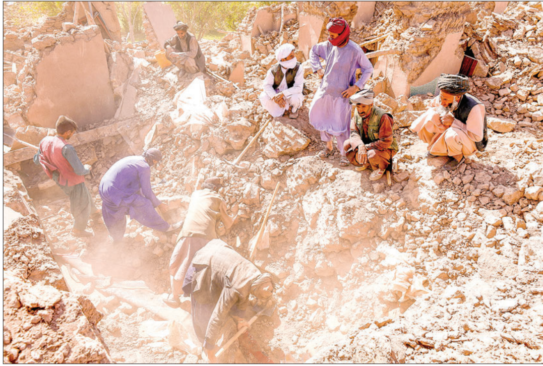
Afghan residents clear debris as they look for victims' bodies in the rubble of damaged houses after the earthquakes in Kashkak village, Zende Jan district of Herat province on 8 October 2023.