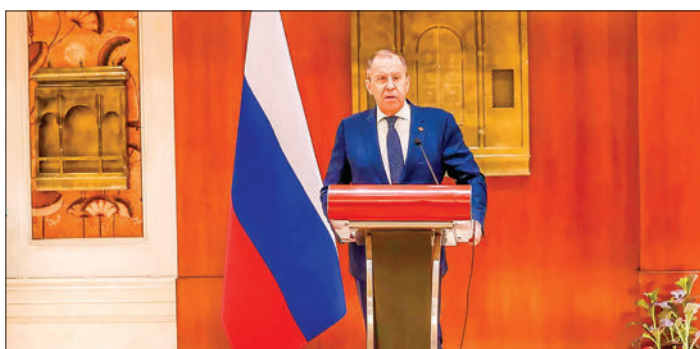
In this handout photo released by the Russian Foreign Ministry, Russian Foreign Minister Sergey Lavrov talks to the media after the G20 Foreign Ministers' Meeting (G20 FMM), in New Delhi, India. PHOTO: SPUTNIK

"It is necessary to ensure that the spirit of multipolarity enshrined in the UN Charter is realized. An increasing number of countries of the global majority are seeking to strengthen their sovereignty and defend national interests, traditions, culture and way of life. They do not want to live under anyone's dictation, they want to be friends and trade with each other and with the rest of the world only on equal terms and for mutual benefit, within the framework of an objectively emerging multipolar architecture," Lavrov said. — Sputnik