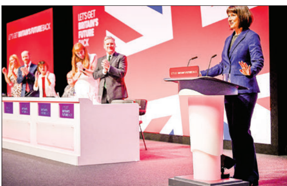
Britain's main opposition Labour Party deputy leader and Shadow Levelling Up, Housing and Communities Secretary Angela Rayner (centre L) and Britain's main opposition Labour Party leader Keir Starmer (C) applaud Britain's main opposition Labour Party Shadow Chancellor of the Exchequer Rachel Reeves after she addressed delegates on the second day of the annual Labour Party conference in Liverpool, northwest England, on 9 October 2023.

Several hundred business bigwigs met and talked to opposition leader Keir Starmer on Monday at a business forum that was sold out at the annual gathering in Liverpool, northwest England. "If we do come into government, you will be coming into government with us," Starmer said in front of