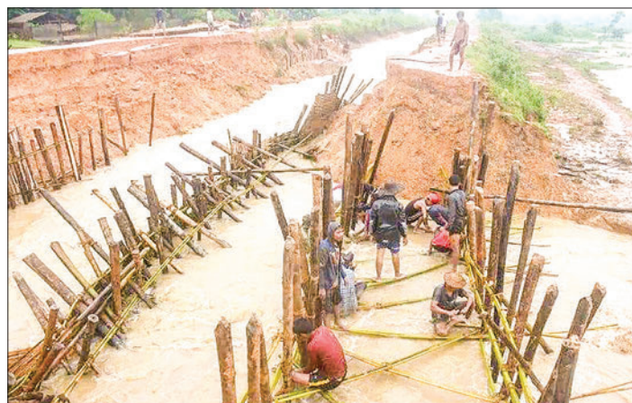
The water is overflowing at the Kalihtaw canal near Innkantlant Village, east of Kyarinn Village.

DUE to heavy rains on 7 October, the main canal of Kalihtaw Dam in Hlegu Township suffered a breach, and about 40 acres of agricultural land and homes from nearby villages, including the Kyarinn (East) Village, were flooded.