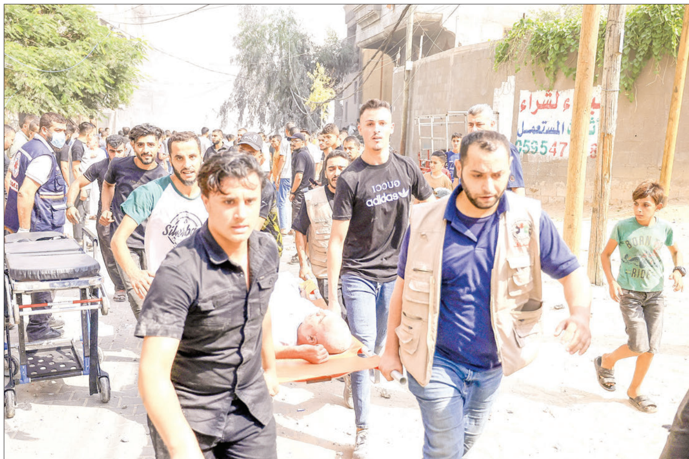
Palestinians evacuate a wounded man following an Israeli airstrike on the Sousi mosque in Gaza City on 9 October 2023.

T HE World Health Organization called Tuesday for a humanitarian corridor to be established into and out of the Gaza Strip, which has been placed under total siege by Israel.