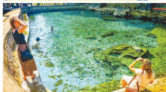
The picture captures tourists relaxing at Seittathukha Lake of Kawtkathang in Kayin State.