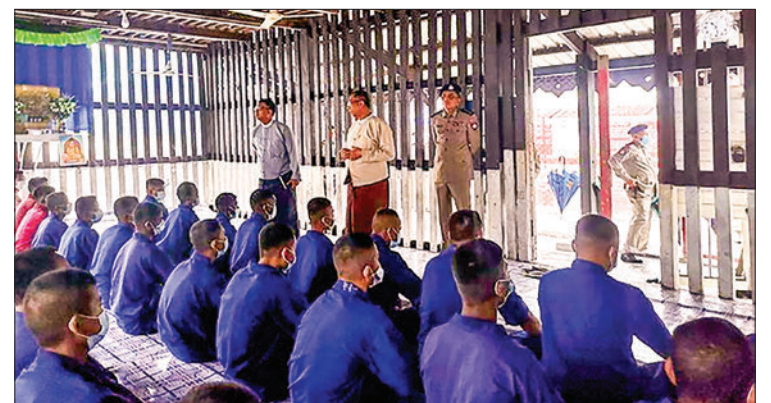
Commissioner U Kyaw Soe from the Myanmar National Human Rights Commission meets prisoners and detainees in the Maubin Prison in Maubin Township, Ayeyawady Region during his inspection tour on 10 October 2023.

Besides, MNHRC donated 50 books for the prisoners. MNHRC will send recommendations to relevant departments for the necessary action based on the findings during the inspection. — MNHRC