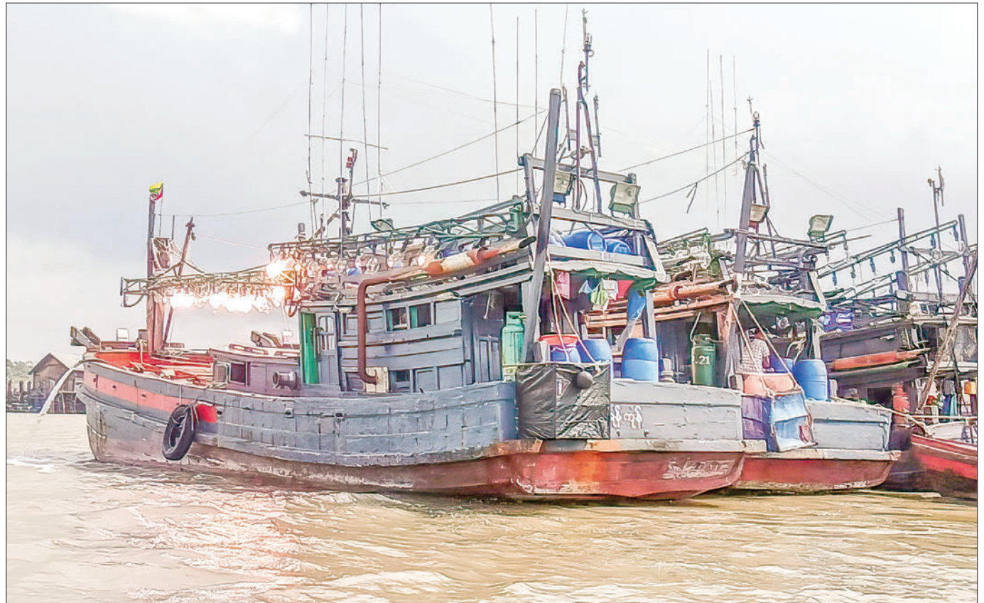
Squid fishing boats prepared for business in the upcoming open season, in Myeik, Taninthayi Region.