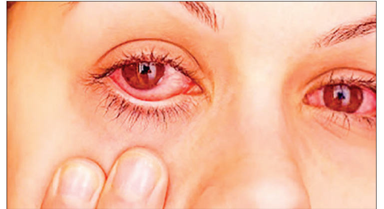
A patient with conjunctivitis shows her eye.