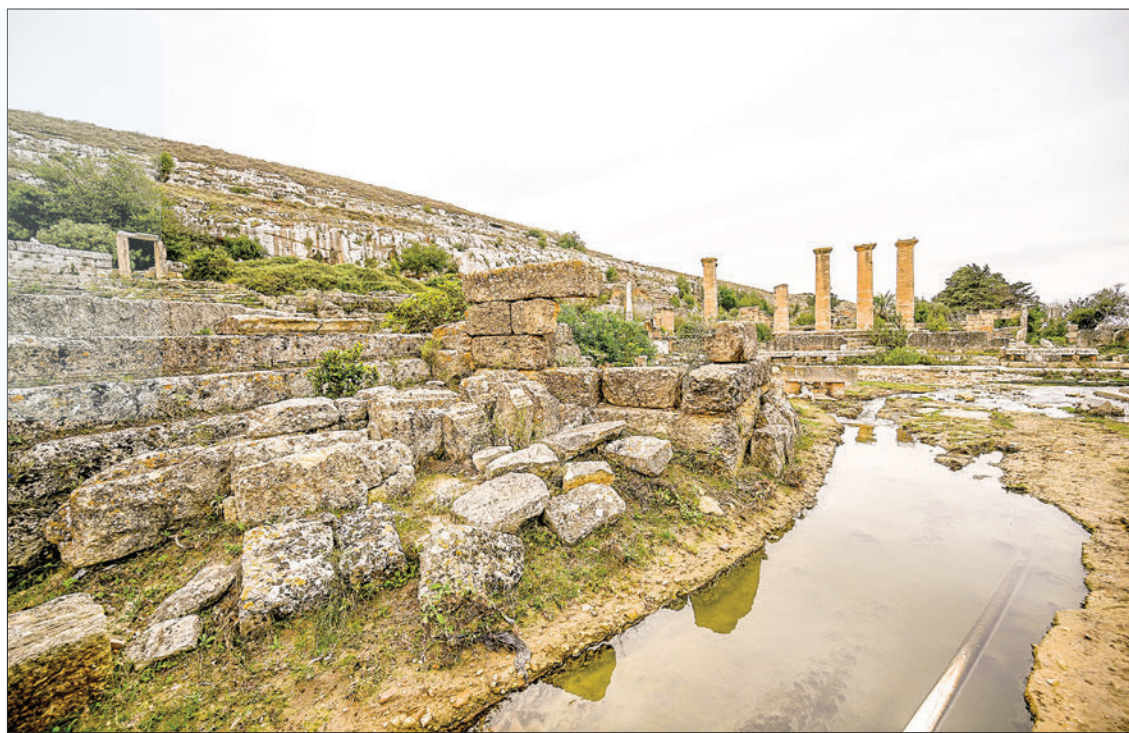
Water flows through the ruins at the site of the ancient Greco-Roman city of Cyrene (Shahhat) in eastern Libya, about 60 kilometres (37 miles) west of Derna on 21 September 2023 in the aftermath of a devastating flood. The immediate damage to the monuments of Cyrene, which include the second century AD Temple of Zeus, bigger than the Parthenon in Athens, is relatively minor but the water circulating around their foundations threatens future collapses, the head of the French archaeological mission in Libya, Vincent Michel, told AFP.

Storm Daniel caused serious damage and created a high risk of collapse in Cyrene, one of the five cities of the Hellenic period which gave its name to Libya's eastern