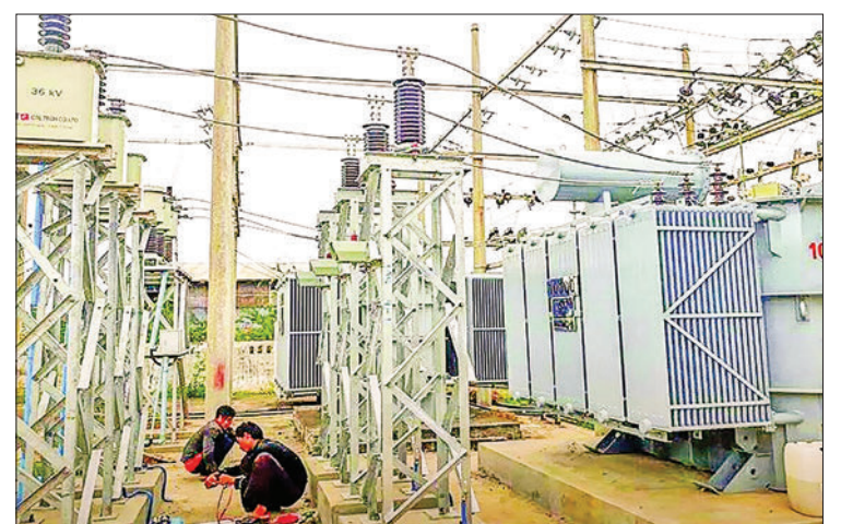
YESC staff members working at the substation in Hline Township.

Finally, the Union minister focused on increased transmission of electricity and enhancing the balance between reducing power loss and improving power system stability. — MNA/KZW