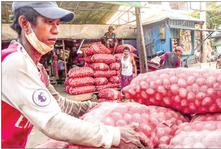
The photo shows a worker unloading onion sacks from a hand-driven cart at a warehouse in the Bayintnaung area.

The chilli pepper and garlic prices remained unchanged. Meanwhile, the wholesale price of sugar dipped to K3,770-3,790 per viss from K3,800-3,820 on 9 October. — TWA/EM