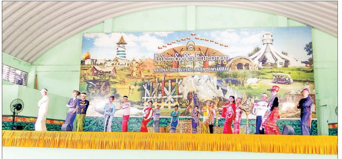
File photo shows that some ethnic troupes perform at the entertainment programme at the Union National Races Village (Yangon) in Thakayta Township, Yangon.