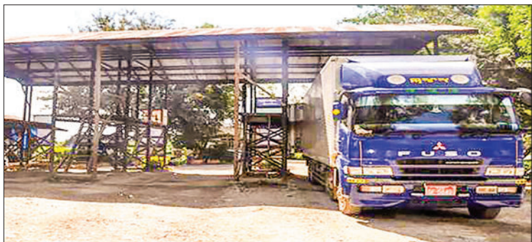
Lorries laden with export cargoes are seen at the Tachilek border.

The Tachilek border in Shan State (East) facilitates trade with various neighbouring countries. Trade is conducted between Myanmar-Thai Friendship Bridge 1 and 2 in Thailand, Tachilek-Kengtung-Wan Taping (Mongla) to China, Tachilek-Mongphyat-Mongyaung Mongyu -Special Region 4 (BP 240) to China, Tachilek (Wangpon) to Suvplui port (Special Region-4)-Mongla to China and Tachilek to Talay (Kenglat) to Laos. — ASH/KZW