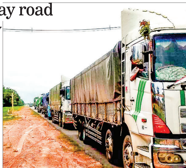
This photo shows a queue of trucks loaded with perishable goods stranded on the former Yangon-Mandalay Road.

Currently, floods have occurred due to the rise of the Bago River, and large trucks and small cars have been parked on the former Yangon-Mandalay Road (39 miles) Phayagyi Road to DaikU Road intersection. — ASH/KZL