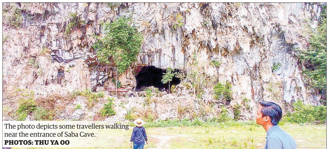
The photo depicts some travellers walking near the entrance of Saba Cave.

Kayin State is famous for its tea and coffee production. Tourists have a lot to explore in Kayin State including Mt. Zweekabin, Lumbini Garden, Thandaung, Sadan Cave and other things. From lively festivals to cultural dance shows, tourists will be pampered by the range of things Kayin has to offer.