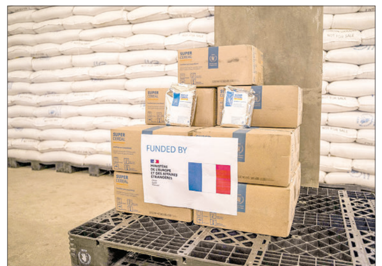
Boxes of super cereal funded by the French government are seen at a World Food Programme (WFP) warehouse in Adama, Ethiopia, on 12 January 2023.