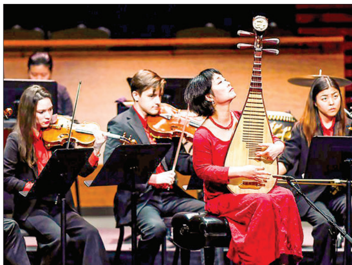
Prominent pipa virtuoso Wu Man (R, Front) performs with members of the Bard East/West Ensemble during the opening concert of the sixth annual China Now Music Festival at Rose Theater at Jazz at Lincoln Centre in New York, the United States, on 4 October 2023.

THE sixth season of the China Now Music Festival culminated in a grand finale on Sunday in a spellbinding concert at Jazz at Lincoln Centre in New York City, paying homage to three generations of composers bridging the United States