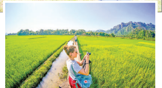
The photo shows tourists passing the Kawtkhamate bridge.