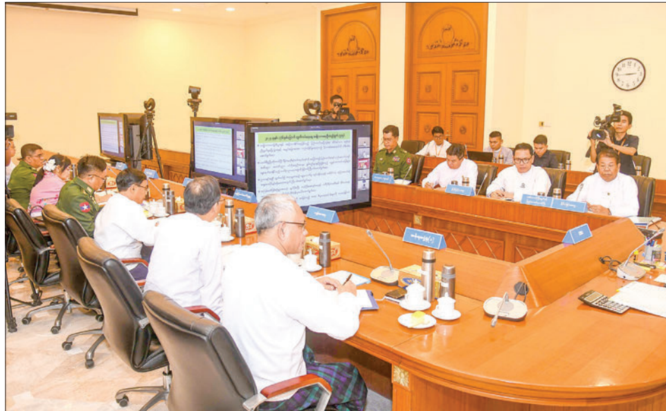
State Administration Council Vice-Chair Deputy Premier Vice-Senior General Soe Win addresses the first coordination meeting of the 76 th Anniversary of Independence Day Organizing Central Committee yesterday.

The Vice-Senior General confirmed that the commemorative day will be marked in line with the five national objectives: to maintain Our Three Main National Causes — non-disintegration of the Union, non-disintegration of national solidarity and perpetuation of sovereign-