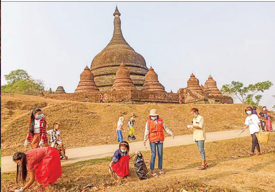
Some buddha images in MraukU cultural area are seen (left photo) and volunteers collect garbage in the MraukU cultural area in Rakhine State (right photo).

Some of the ancient buildings in the MraukU cultural area that were damaged by the Mocha storm have been restored changing original designs. Most of them were minor damage, so they were repaired with funds approved for the current financial year. — ASH/KZL