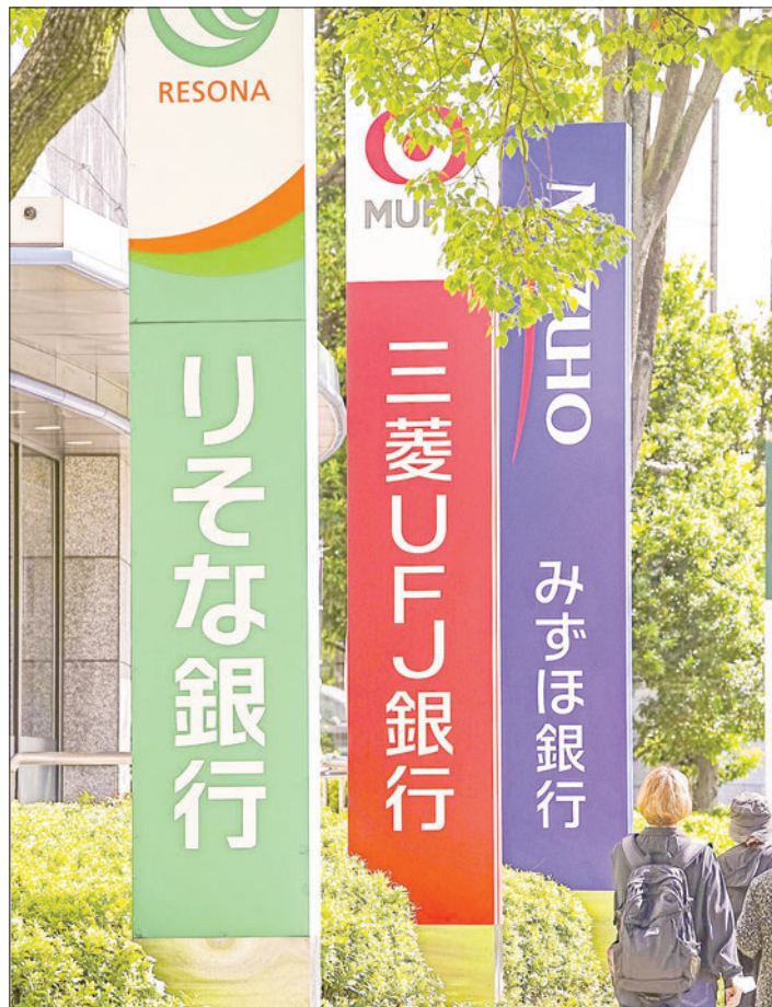
Photo taken on 10 October 2023 shows signs of (from L) Resona Bank, MUFG Bank and Mizuho Bank in Tokyo.

However, the report also noted that “growth remains slow and uneven, with growing global divergences”. — AFP