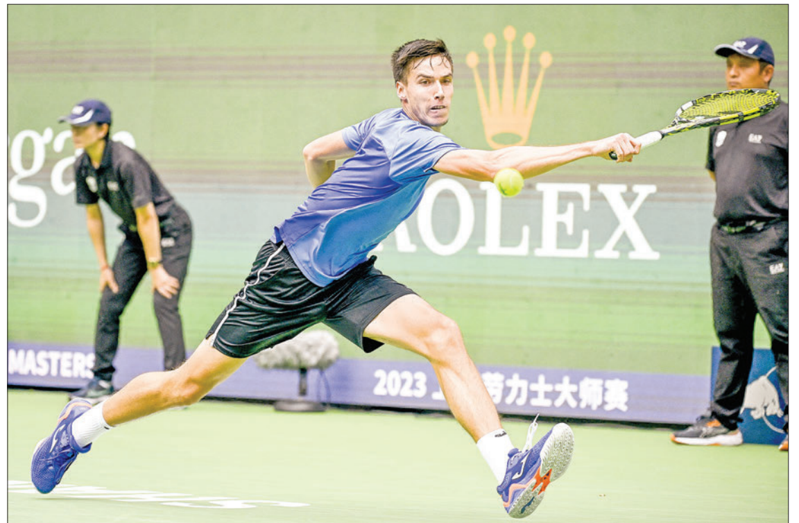
Hungary's Fabian Marozsan hits a return to Norway's Casper Ruud during their men's singles match at the Shanghai Masters tennis tournament on 10 October 2023.

Stefanos Tsitsipas, the fourth seed from Greece, lost on Monday to France's 32 nd seed Ugo Humbert in a three-set battle that stretched beyond mid-