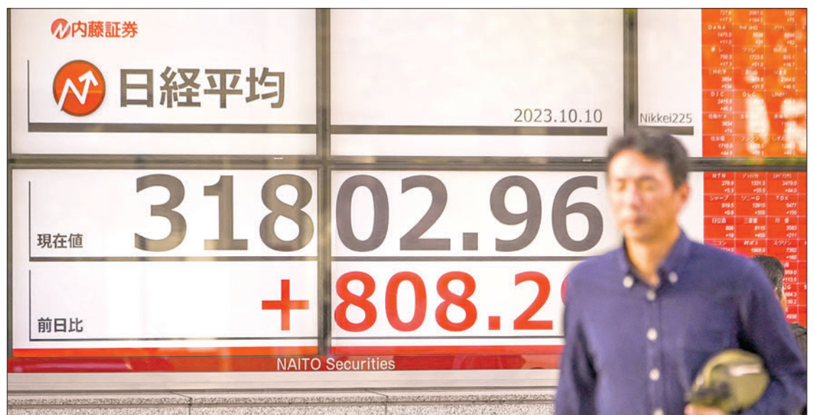
A man walks in front of an electronic board showing numbers of the Tokyo Stock Exchange along a street in Tokyo on 10 October 2023.

tensions, traders have enjoyed a positive start to the week, helped by Friday's forecast-busting US jobs report that also showed wage gains slowing—a so-called “Goldilocks” scenario in which the data was neither too weak nor too strong. The upbeat mood was boosted Monday after Fed Vice-Chair Philip Jefferson said the recent spike in US Treasury yields to multi-year highs could provide the necessary restraint on credit that would be achieved by higher interest rates. — AFP