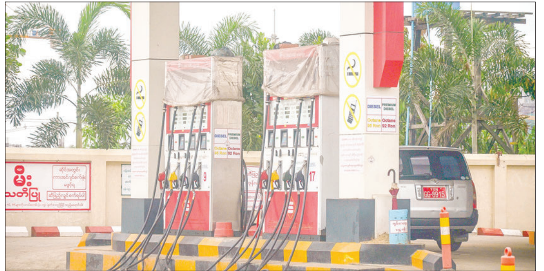
The Octane 92 price was below K2,000 per litre from 5 October. The prices gained to K2,015 per litre of Octane 92, K2,115 for Octane 95, K2,310 for diesel and K2,350 for premium diesel on 10 October. The picture shows the petrol station in Yangon.

OCTANE 92 price bounced back to K2,015 per litre in the domestic market on 10 October after a five-day fall.