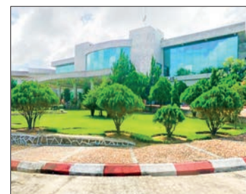
The Ministry of Commerce Office building in Ottarathiri of Nay Pyi Taw.

will grant import permits for one EV per year which is equal to five per cent of remittance if those who receive regular salaries including semen make a money transfer of US$200,000 and above in a year.