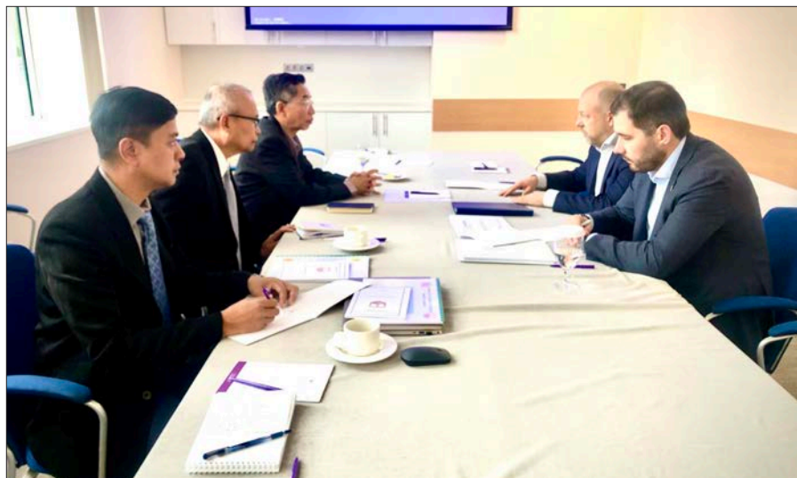
Union Minister U Ko Ko Lwin holds talks with officials from the Russian oil industry in Moscow during his observation tours.