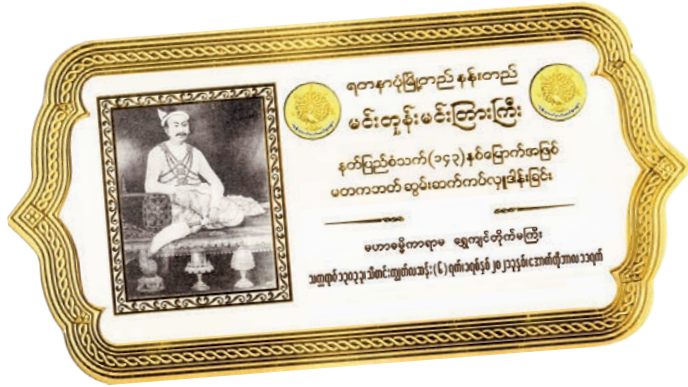
The portrait of the invitation letter for the 143 rd celebration of demise of King Mindon.

According to the plan, the second part of the ceremony will take place at the Golden Palace of Myanansankyaw Golden Palace. It has been indicated