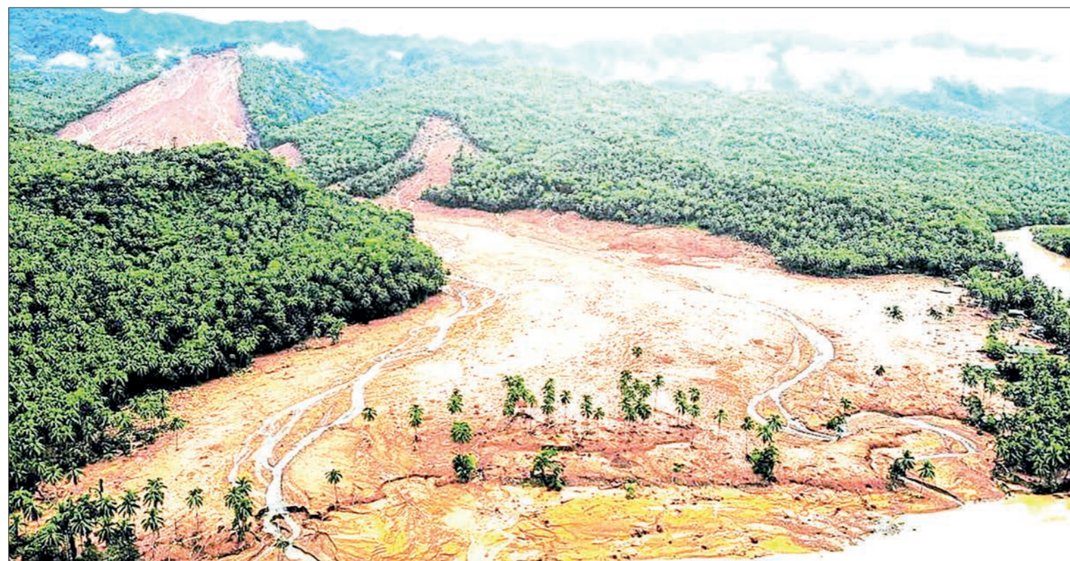
An aerial shot taken in April 2022 shows the reach of the landslide that struck a village in Baybay, Leyte after Tropical Storm Agaton whipped the province and other parts of the Visayas and Mindanao, Philippines.

Actually, the motherland of Myanmar is loyal to all citizens. So, all citizens including ethnic nationalities have to reciprocally be loyal to the motherland of Myanmar. They all have to firmly join hands in nation-building endeavours to improve generation to generation. Everybody needs to understand that peace can shape everything and the future of the nation.