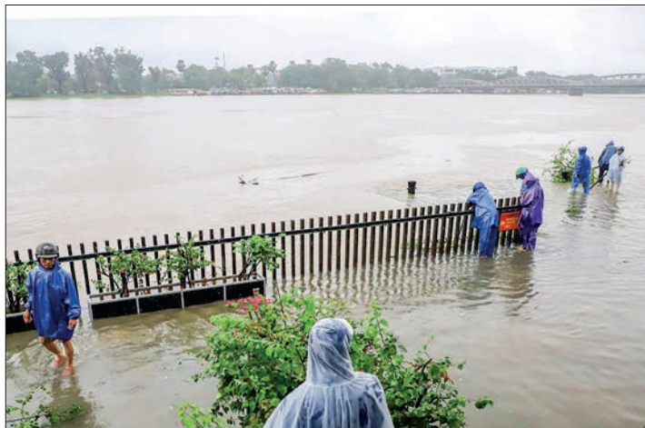
This photo taken on 13 October 2023 shows local workers removing fallen trees on a flooded road by the Perfume River in Hue city in central Viet Nam.

Scientists have warned extreme weather events globally are becoming more intense and frequent due to climate change. — AFP