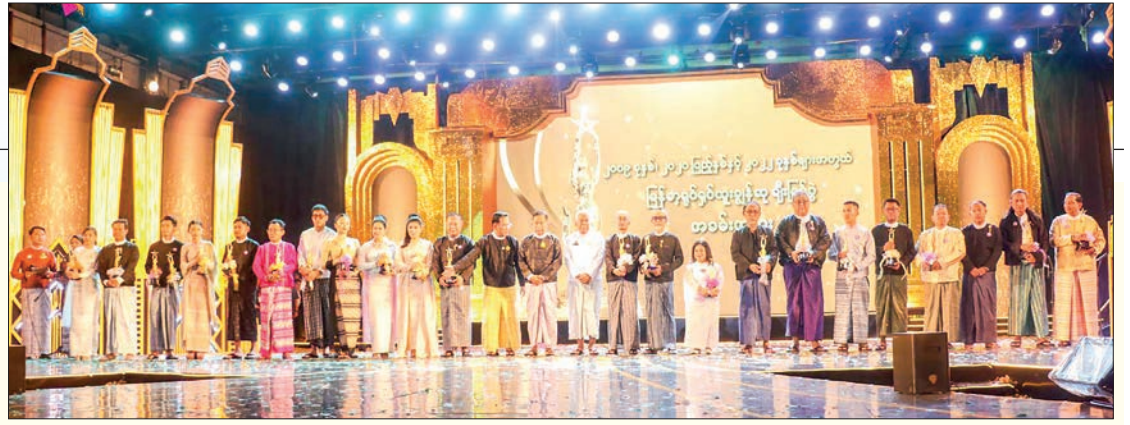
Recipients of Academy Awards for 2019, 2020 and 2021 pose for the group photo in 2022.