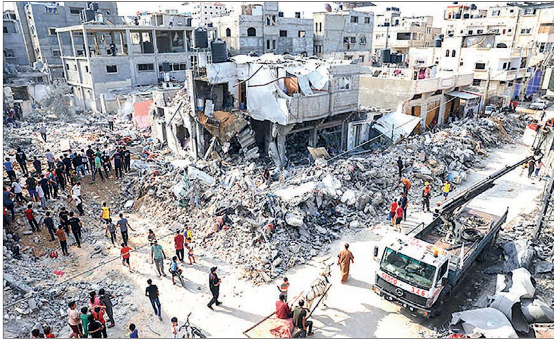
Palestinians look at destruction caused by Israeli airstrikes on Rafah in the southern Gaza Strip on 9 October.

The EU has raised concerns about online content and disinformation, emphasizing the need for tech companies, including Alphabet, to comply with the new Digital Services Act.