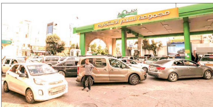
The Hamas attacks on Israel will have oil market repercussions if the conflict widens to include Hezbollah or Iran. There will likely be calls to ratchet up sanctions enforcement on Iranian oil exports, which have increased in the past six months.

It is the first time in seven meetings that the finance chiefs have agreed on a joint communique, after deep divisions among them, primarily between Western nations on the one hand and Russia and China on the other, made it difficult for the diverse group to build a consensus.