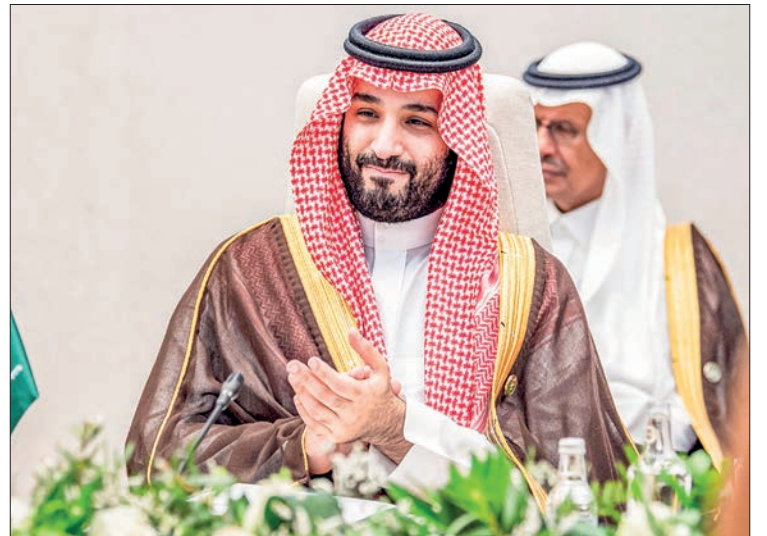
Saudi Crown Prince and Prime Minister Mohammed bin Salman.

Under de facto ruler Crown Prince Mohammed bin Salman, son of the ageing King Salman, Riyadh had laid out conditions for normalization including security guarantees from Washington and help developing a civilian nuclear programme. — AFP