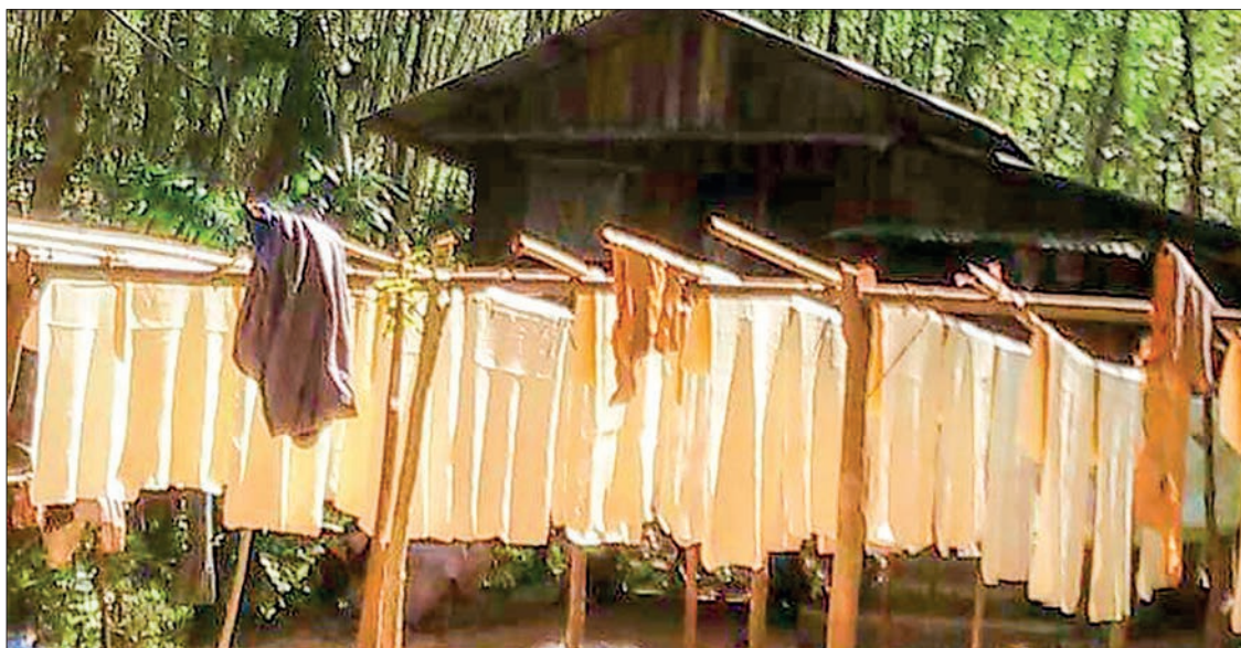
Myanmar bagged more than US$449 million in revenue from rubber exports in the previous financial year 2020-2021. The picture captures snapshot of sun-dried rubber.

rubber production in the South-east Asian nations and the market supply are contributing factors to Myanmar's rubber prices.