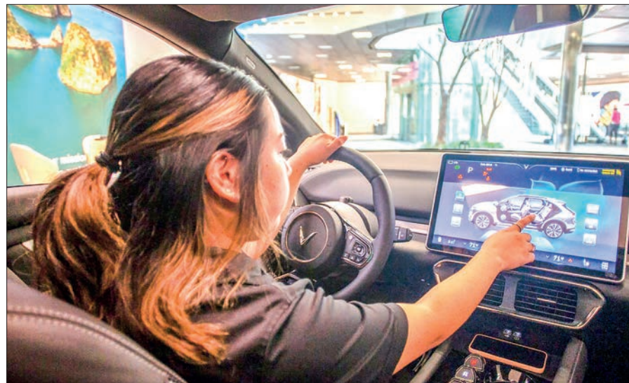
Vietnamese first homegrown car manufacturer is hoping to compete with EV giants such as Tesla, and is trying to crack international markets.