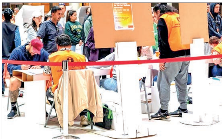
The National Party and ACT were projected to secure a majority in the 120-seat parliament.

Voters are seen as punishing the incumbent Labour government following the surprise resignation of Prime Minister Jacinda Ardern earlier in the year.