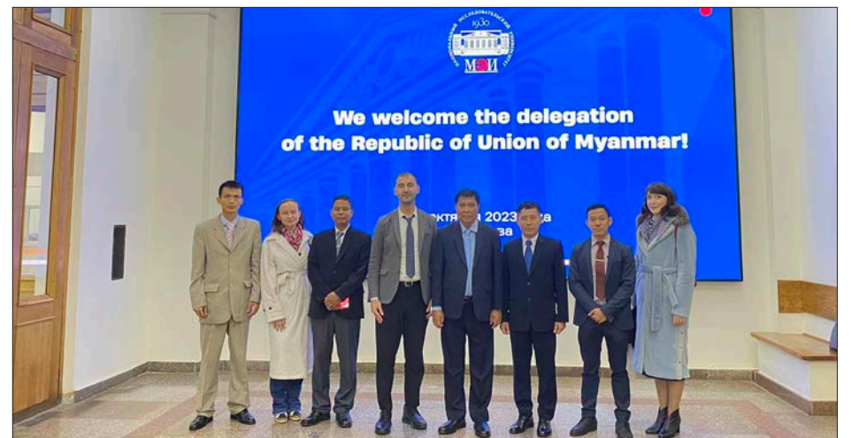
Union Minister Dr Myo Thein Kyaw poses for the group documentary photo in Moscow.