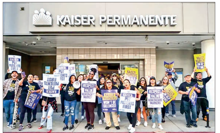
Kaiser Permanente and unions representing thousands of workers have reached a tentative deal to end industrial action, the two sides say. PHOTO: AFP/FILE

American consumers are battling inflation and a cost-of-living crisis that is shrinking real pay packets as prices for everyday staples like gas, groceries and rent continue to rise. — AFP