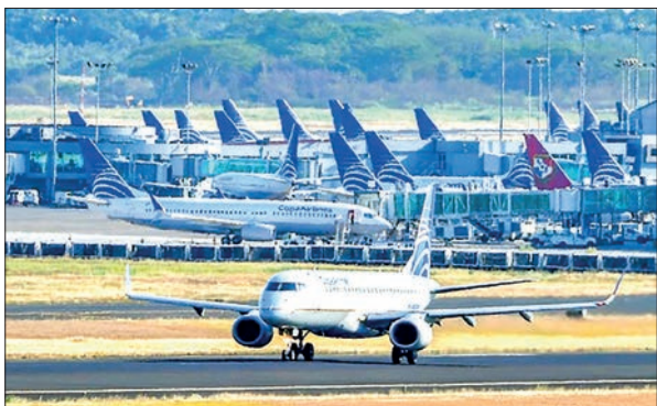
A Copa airlines plane taxis on a runway as others sit on the tarmac at Tocumen International Airport on 22 March 2020.

Panama’s civil aviation authority at first announced the Copa flight between Panama City and Tampa, Florida, had to turn around due to a presumed “bomb threat”.