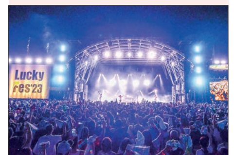
Photo taken in July 2023 shows LuckyFes being held at Hitachi Seaside Park in Ibaraki Prefecture.

T HE annual Rock in Japan Festival, one of the country’s iconic outdoor music events, was relocated last year to a new venue as the pandemic-caused cancellations wrought damage to its original host city. The city of Hitachinaka in Ibaraki Prefecture, northeast of Tokyo, missed the chance to generate significant income when the rock fest was cancelled for two years straight and moved to Chiba — an easier-to-access location from the metropolitan area. Hitachinaka, however, found its way back by launching its own music festival in 2022, hoping to keep the local culture alive. That proved successful and this year, over 40,000 people attended the three-day event named LuckyFes. And good fortune will follow as