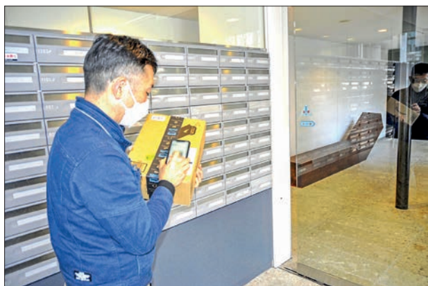
A man uses a smartphone app to unlock an automatic entrance door at an apartment in Tokyo on 2 March 2023 to deliver a parcel without making contact with the receiver.

The step is part of efforts to cope with the impact of tougher overtime regulations for truck drivers next year. It aims to halve the percentage of items redelivered when people are not at home