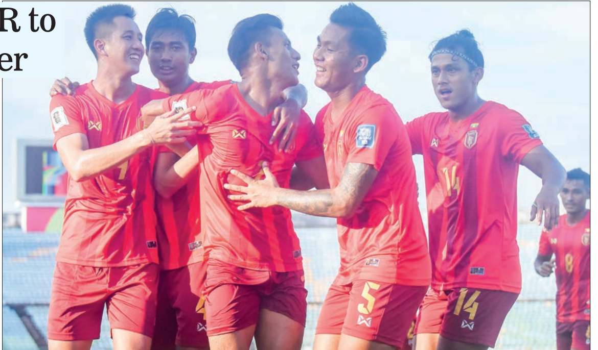
Myanmar team players are seen cheering at the previous World Cup Qualifiers.

If the Myanmar team can overcome the Macau team, they will be allowed to advance to the second round, falling in the same group as North Korea, Japan and Syria.