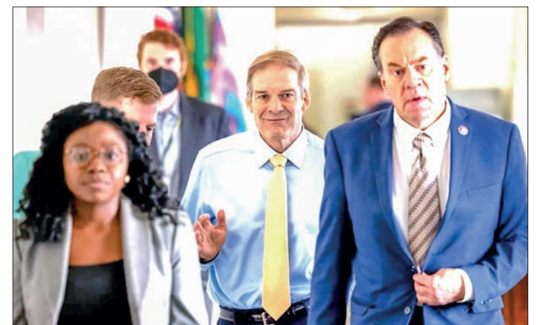
US Representative Jim Jordan (centre), Republican of Ohio, arrives for a Republicans caucus meeting at the Longworth House Office Building on Capitol Hill in Washington, DC.

REPUBLICANS nominated conservative hardliner Jim Jordan as their candidate for speaker of the US House of Representatives on Friday, as the lower chamber of Congress entered its 10 th day of a leadership vacuum that has paralyzed Washington.