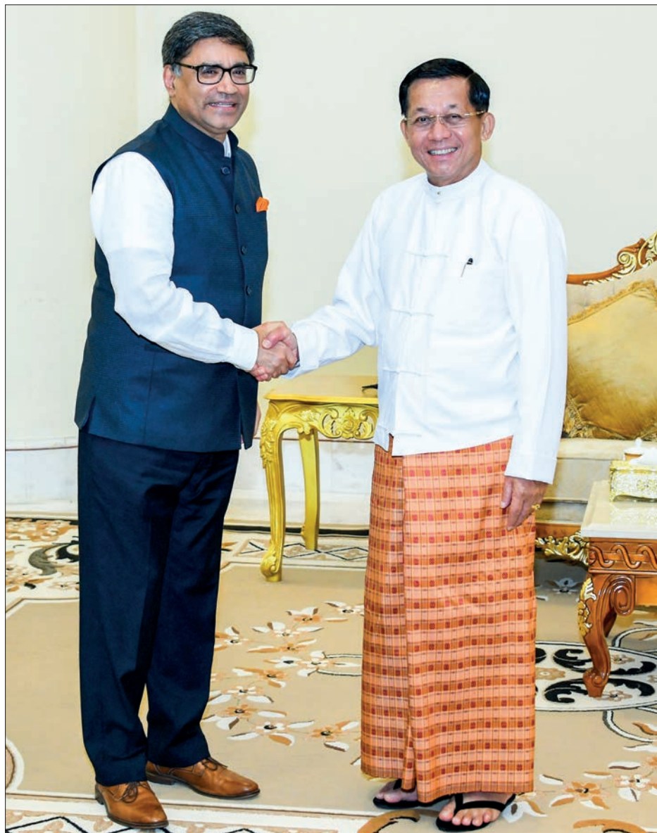
SAC Chair Premier Senior General Min Aung Hlaing and Indian Deputy National Security Adviser Mr Vikram Misri share warm handshake during courtesy call.