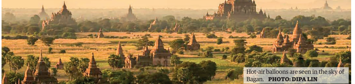
Hot-air balloons are seen in the sky of Bagan.