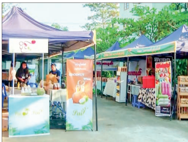
Booths showcase products from 74 registered small-scale enterprises in the Yangon Region yesterday.

THE 7 th Pre-Thadingyut Small-Scale Industrial Products Fair commenced on 14 October in a compound of the Small-Scale Industries Department (Yangon Region) in North Okkalapa township, according to Director U Thet Naing Oo of the Small-Scale Industries Department (Yangon Region).