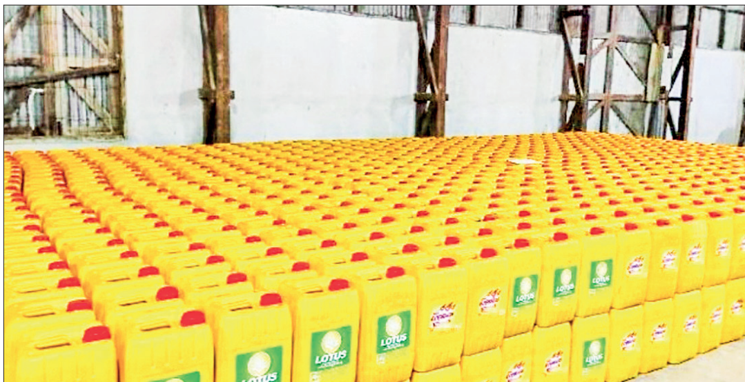
The photo shows imported jerry cans of palm oil at the warehouse in Yangon.

Meanwhile, an 18-litre jerry can of palm oil was sold at K85,000-90,000 depending on the brands. — TWA/KK