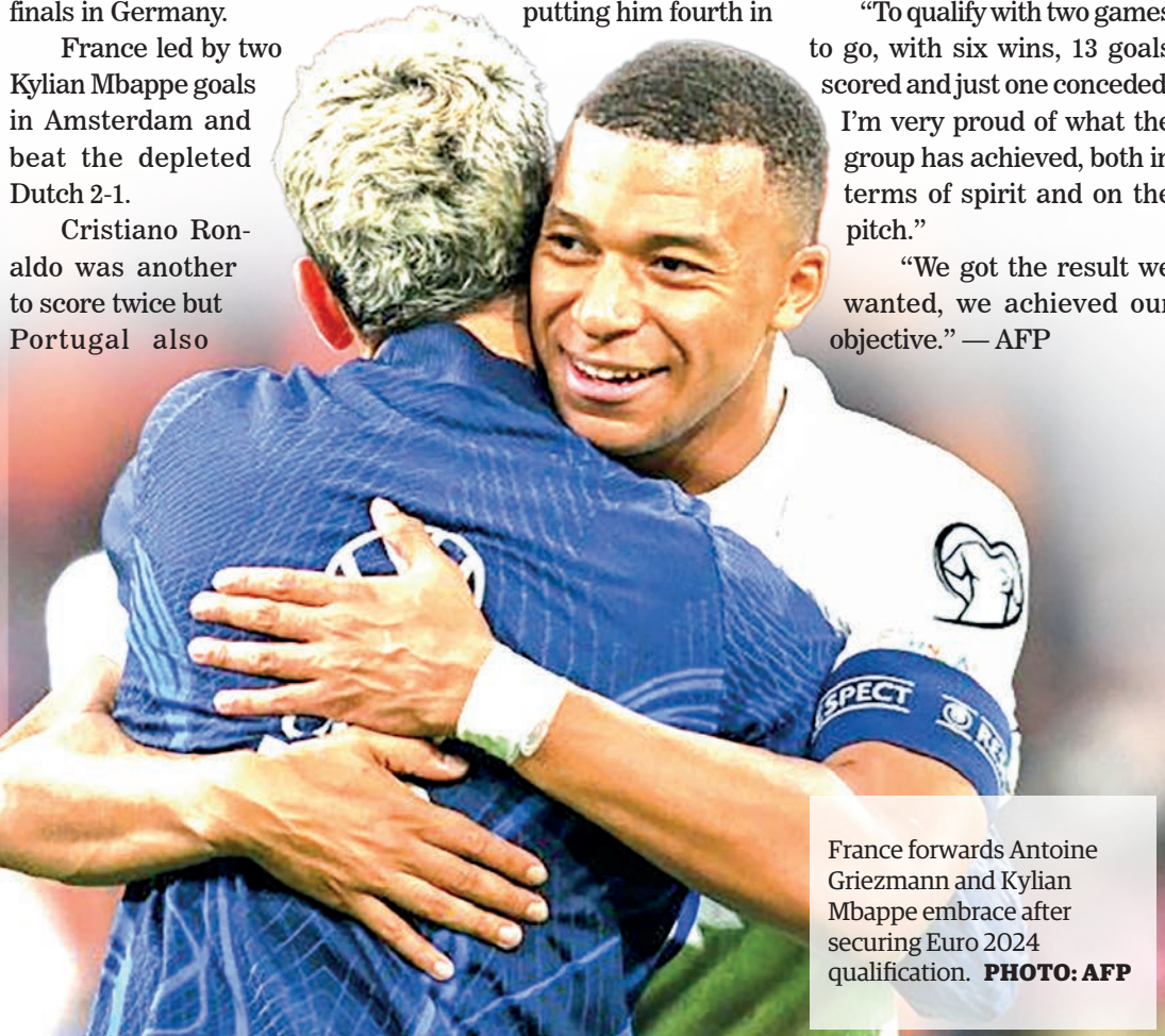
France forwards Antoine Griezmann and Kylian Mbappe embrace after securing Euro 2024 qualification.

"We got the result we wanted, we achieved our objective." — AFP