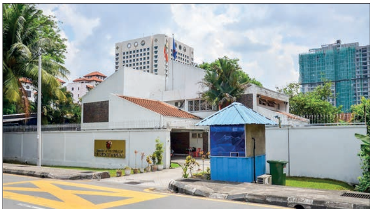
The photo shows the Embassy of the Republic of the Union of Myanmar to Malaysia.

THE Myanmar Embassy in Kuala Lumpur, Malaysia, has announced that Myanmar workers in Malaysia can withdraw their employee support savings.