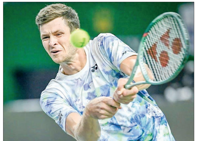
Poland's Hubert Hurkacz hits a return against USA's Sebastian Korda.

BIG-SERVING Hubert Hurkacz blasted his way into the final of the Shanghai Masters on Saturday with a ruthless 6-3, 6-4 win over Sebastian Korda of the United States.