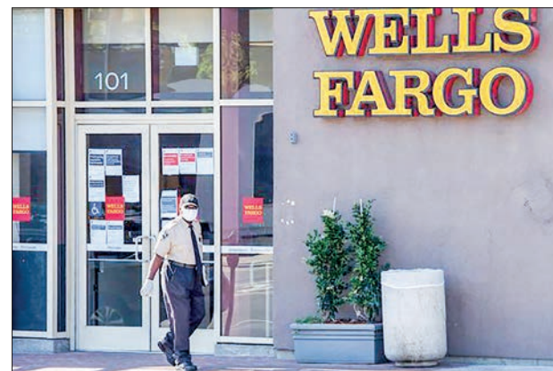
The strong profits reported by JPMorgan Chase, Citi, and Wells Fargo indicate that they are still benefiting from the impact of higher interest rates.

Executives said household balance sheets had eroded somewhat in