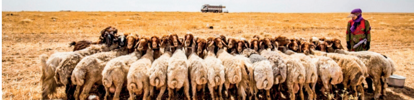
New Zealand, with a population of five million people and a remarkable 25 million sheep, is known for its unique combination of human and animal inhabitants.

New Zealanders are nicknamed ‘kiwis’ after the flightless native birds that are under threat in the wild. There are only around 70,000 wild kiwis left in New Zealand but more than 90 nationwide community initiatives are working to protect their numbers by removing invasive predators. — AFP