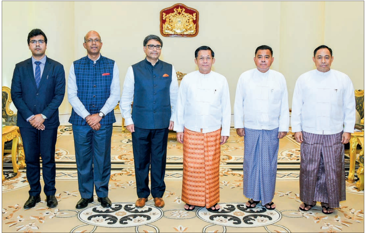
Senior General Min Aung Hlaing joins India's Deputy National Security Adviser for the group photo at the event yesterday.