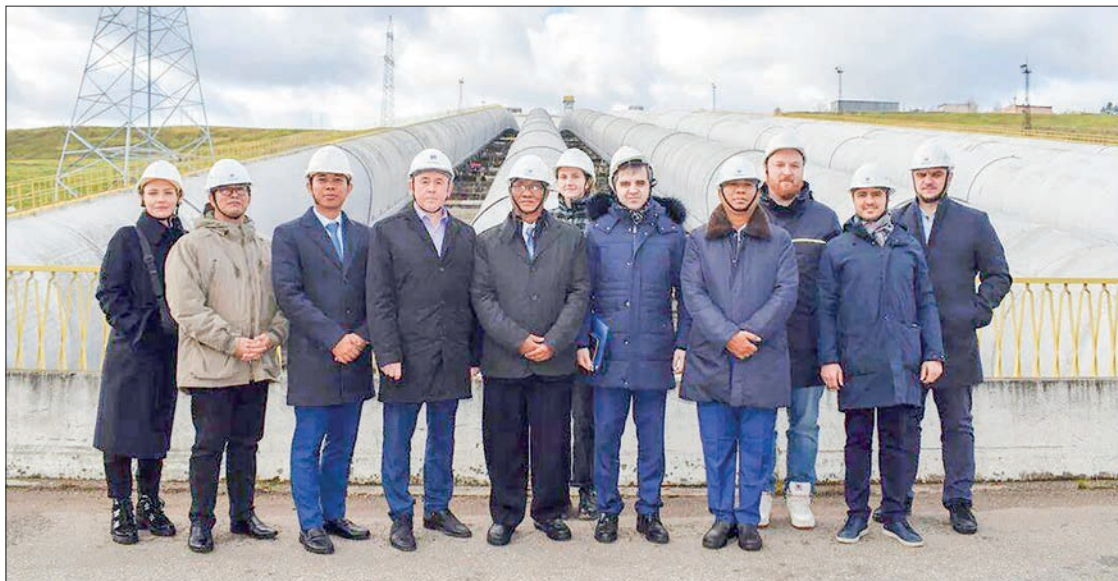
Union Minister for Electric Power U Nyan Tun and officials from Zagorskaya PSPP hydropower plant pose for the documentary group photo in Moscow, the Russian Federation, on 13 October.

The Zagorskaya PSPP hydropower plant, located near Moscow, regulates water flow from the Kunya River using sluice gates. With a catchment area of 22.4 million cubic metres (18,160 acre-feet), it generates 1,200 MW, primarily during daily peak consumption periods of about four hours. During off-peak