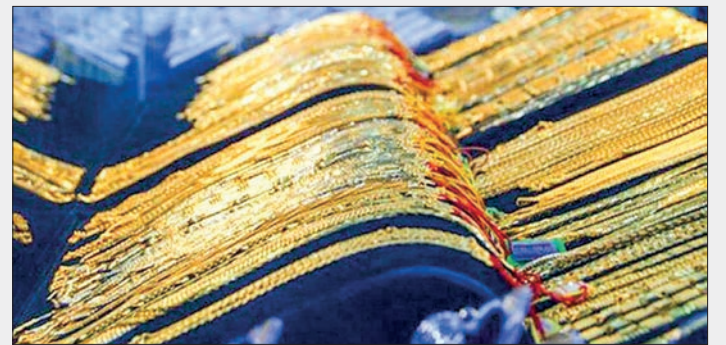
Gold ornaments is seen being displayed at the gold outlet in Yangon.