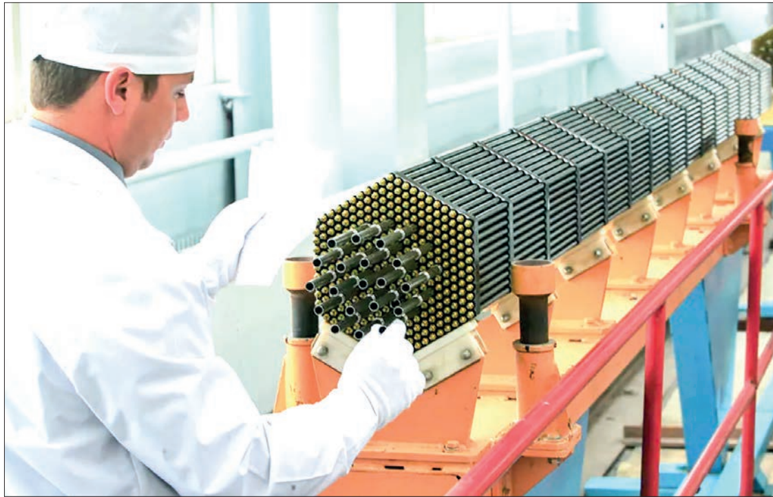
Nuclear power reactor fuel assembly at the Novosibirsk Chemical Concentrate Works.

Burkina Faso has been ruled by a military junta since last year and has sought to diversify its