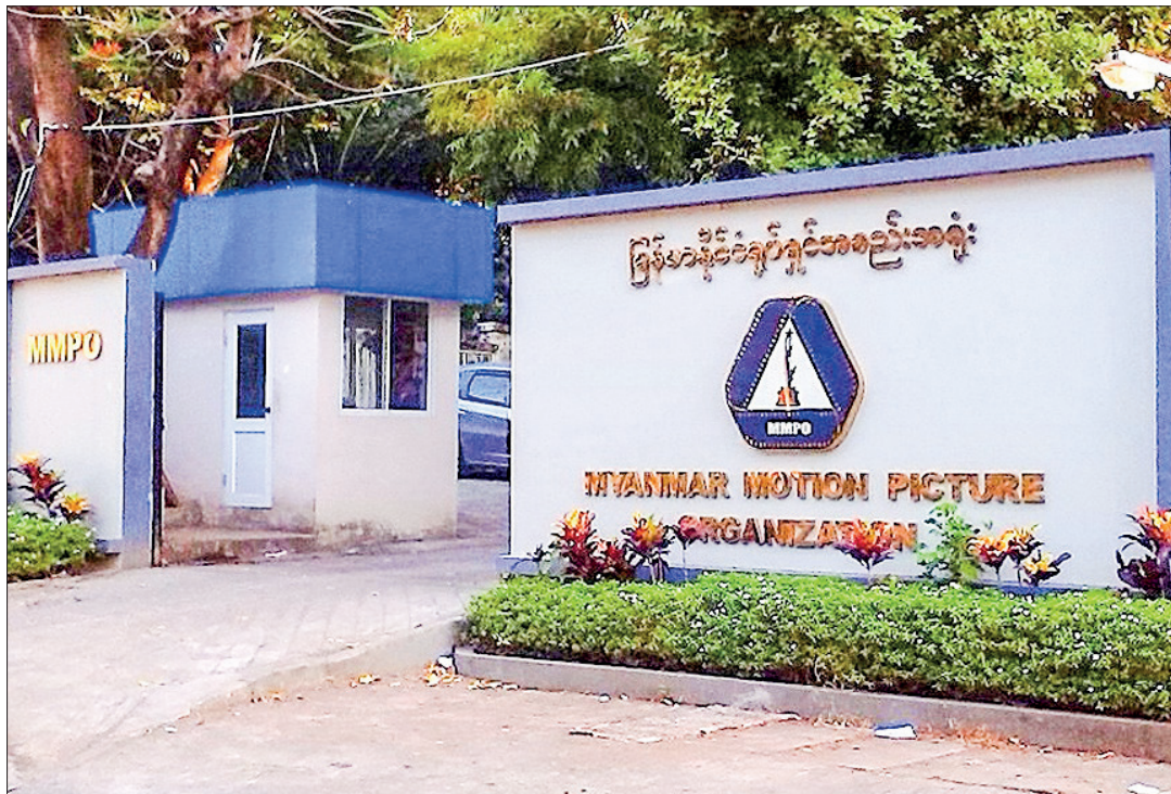
The photo shows the entrance to the Myanmar Motion Picture Organization.

THE Myanmar Motion Picture Organization announced that the application forms and competition entries for the Short Film Competition 2023 must be submitted by 15 December, according to the International Relations Committee, Myanmar Motion Picture Organization.