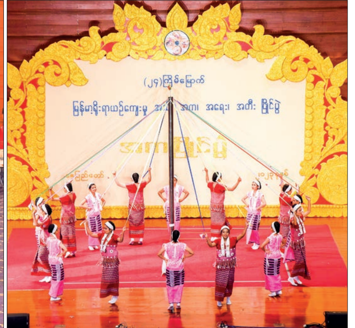
Chairman of the State Administration Council Prime Minister Senior General Min Aung Hlaing watches participation of dancing troupes from regions and states in the ethnic traditional/folk-dance open class at MICC-II in Nay Pyi Taw yesterday.