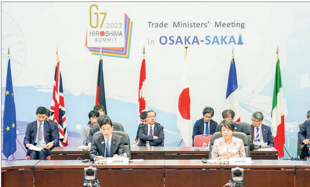
Japanese Economy, Trade and Industry Minister Yasutoshi Nishimura (front, L) and Japanese Foreign Minister Yoko Kamikawa (front, R) attend the first day of a two-day meeting of trade ministers of the Group of Seven countries in Osaka on 28 October 2023.

THE Group of Seven economies agreed Saturday to create resilient supply chains of crucial minerals such as rare earth elements used in electric vehicles with trusted partners, Japan's Economy, Trade and Industry Minister Yasutoshi Nishimura said.