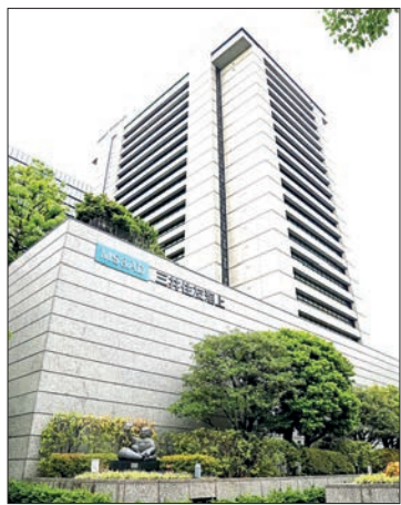
Photo taken on 1 August 2023, shows the headquarters of Mitsui Sumitomo Insurance Co in Tokyo.

JAPANESE insurance giant Mitsui Sumitomo Insurance Co. will begin offering next month