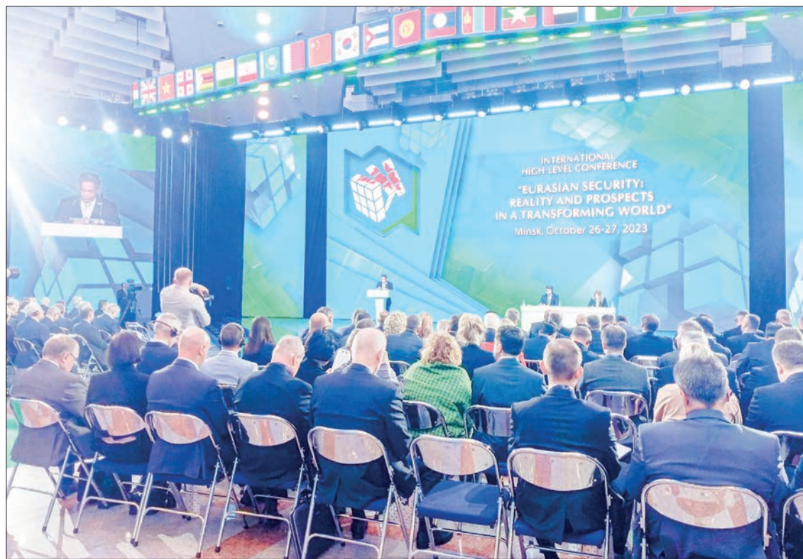
The International High-Level Conference “Eurasian Security: Reality and Prospects in a Transforming World” in progress in Minsk city of Belarus on 26 and 27 October 2023.

In the Union Minister’s statement, the Union Minister emphasized the necessity of a global security framework anchored in multilateralism. Stressing Myanmar’s unwavering dedication to peace and security, the Union Minister highlighted the transformative shifts characterizing today’s international relations. Emphasizing the vital role of dialogue and collaboration between nations, he expressed concern over deepening global conflicts. Acknowledging the significance of organizations like the SCO and CSTO in crisis resolution, Myanmar reasserted its commitment to principles of sovereignty, non-interference, and mutual respect in international relations. The Union Minister underscored Myanmar’s readiness to collaborate with regional and international partners to foster a secure, prosperous, and harmonious Eurasian region. Encouraging joint efforts for peace and prosperity, he urged the diverse Eurasian populace to unite in shaping a future defined by tranquility and