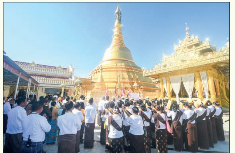
Botahtaung Kyaikdaeup Pagoda.