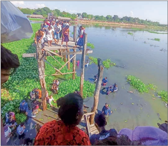
The photo shows those who fell into the water when U Bein Bridge collapsed.