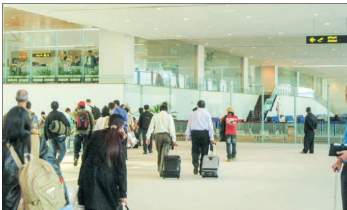
Passengers seen in the airport lounge at Yangon International Airport.

According to regulations, passengers flying from Yangon to Mandalay are required to fill out a departure card, while those arriving from Mandalay to Yangon must complete an arrival card. Additionally, passengers are advised to carry their citizenship scrutiny card