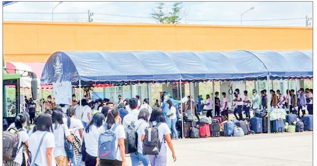
The photo shows Myanmar workers arriving at workplaces in Thailand under the 2022 MoU system.

Hence, MoU workers have been instructed to return to Myanmar through designated border gates/stations after their term expires and to obtain an exit seal from Thailand on their passports. — TWA/KZW