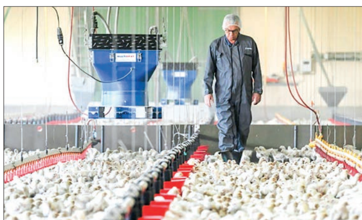
The chickens on the intensive farm are bred mostly for McDonald's nuggets.

At 20 days they already weigh one kilo (two pounds) — 20 times heavier than at birth. By the time they are slaughtered at 45 days, they will weigh over three kilos.