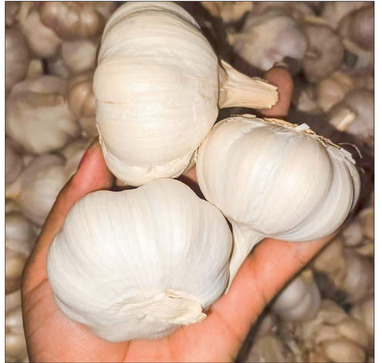
Kyukok garlic being sold in the domestic market.

The prices of rice, onions, and chilli peppers in 2022 and those of black gram, pigeon peas, half of the chickpeas, sugar, and jaggery in 2023 set new records as the highest prices in the market.