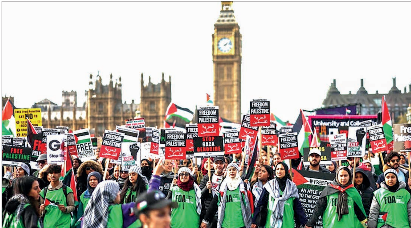
About 100,000 people joined the 'March for Palestine' in London according to British media.

In the UK, tens of thousands of pro-Palestinian protesters marched, urging a ceasefire, as Israel escalated its Gaza Strip assault.