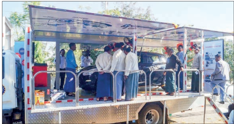
Magway Region attracts investments of US$220.269 million and K5,914.78 million from Myanmar citizens and foreigners during first half of this financial year.

ACCORDING to the Magway Region Investment Committee, 100 per cent of the investments of US$220.269 million and K5,914.78 million were made by Myanmar citizens and foreigners in the period from April to September of the 2023-2024 financial year in Magway Region.