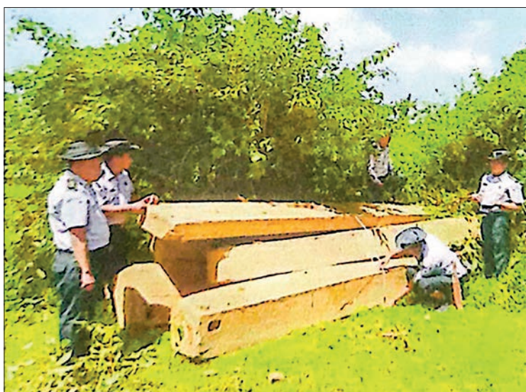
Officials seized illegal timber in Pyay District on 27 October.

On 26 October, the on-duty teams seized an unregistered Toyota Caldina (approximately K12 million) in Zabuthiri township and medications — 1,280 boxes of Timmus 1 and 10,545 boxes of Lodipam 5—worth K21,581,175 without Import