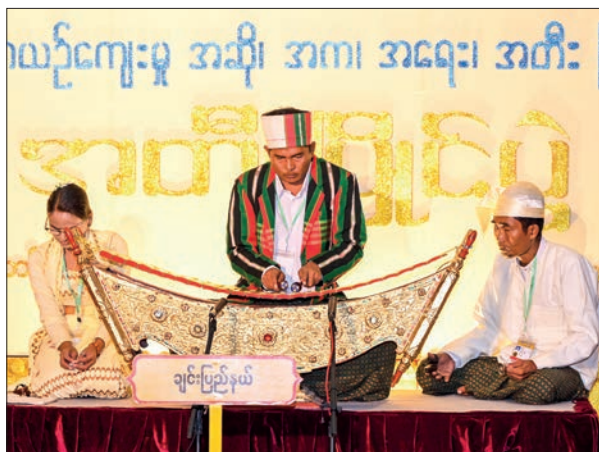
Contestant from Chin State seen at the first-class amateur (men's) xylophone competition.