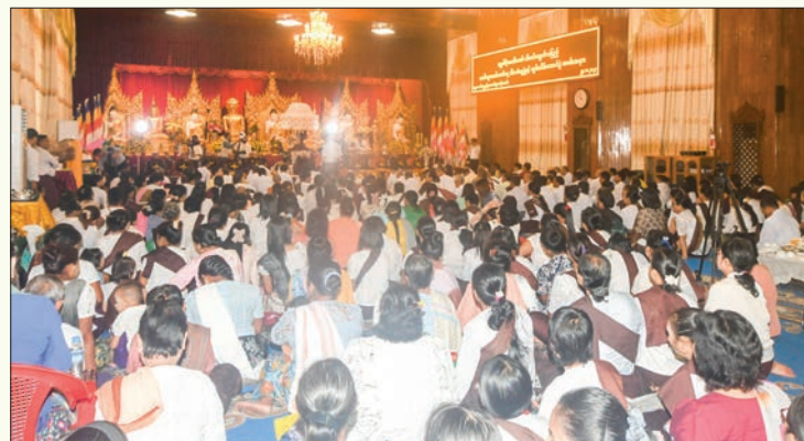
Congregation takes precepts at Shwedagon Pagoda.