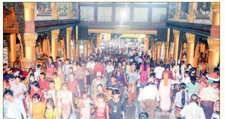
Pilgrims visit Shwedagon Pagoda on Abhidhamma Day yesterday.

venerable Sayadaws. At night, 6,500 oil lamps were lit by the worshipers in dedication to the Lord Buddha. The Botahtaung