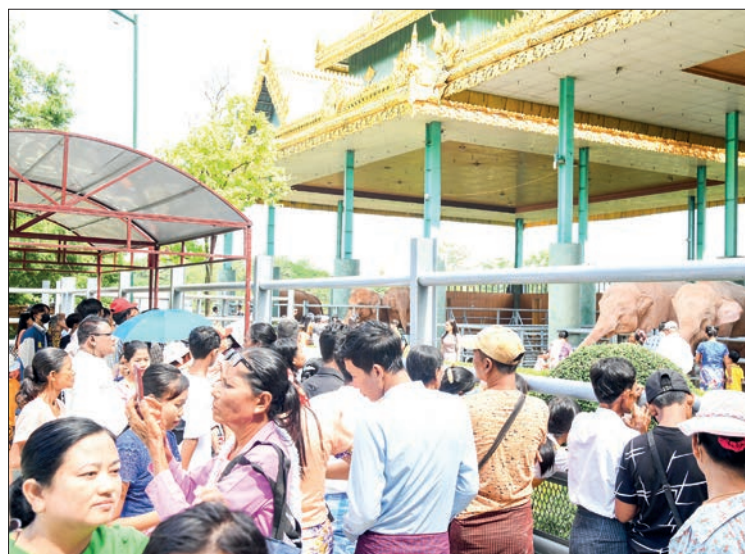
Religious monuments crowded with people from all corners of the nation on full moon of Thadingyut in Nay Pyi Taw yesterday.

in Nay Pyi Taw Council Area such as Thatta Tattaha Maha Bawdi Pagoda (Bodh Gaya-Nay Pyi Taw), Mahathakyayanthi standing Buddha image, Yanaungmyin Shwelathla pagoda, Dartusaya Datpaungsu pagoda, Perpetual Peace Pagoda, Hlaykhwintaung pagoda, Koenawin pagoda, Lawkamarazein