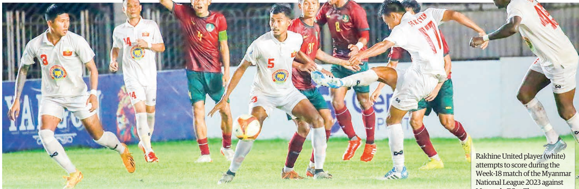
Rakhine United player (white) attempts to score during the Week-18 match of the Myanmar National League 2023 against Myawady FC at Thuwunna Stadium in Yangon on 29 October 2023.