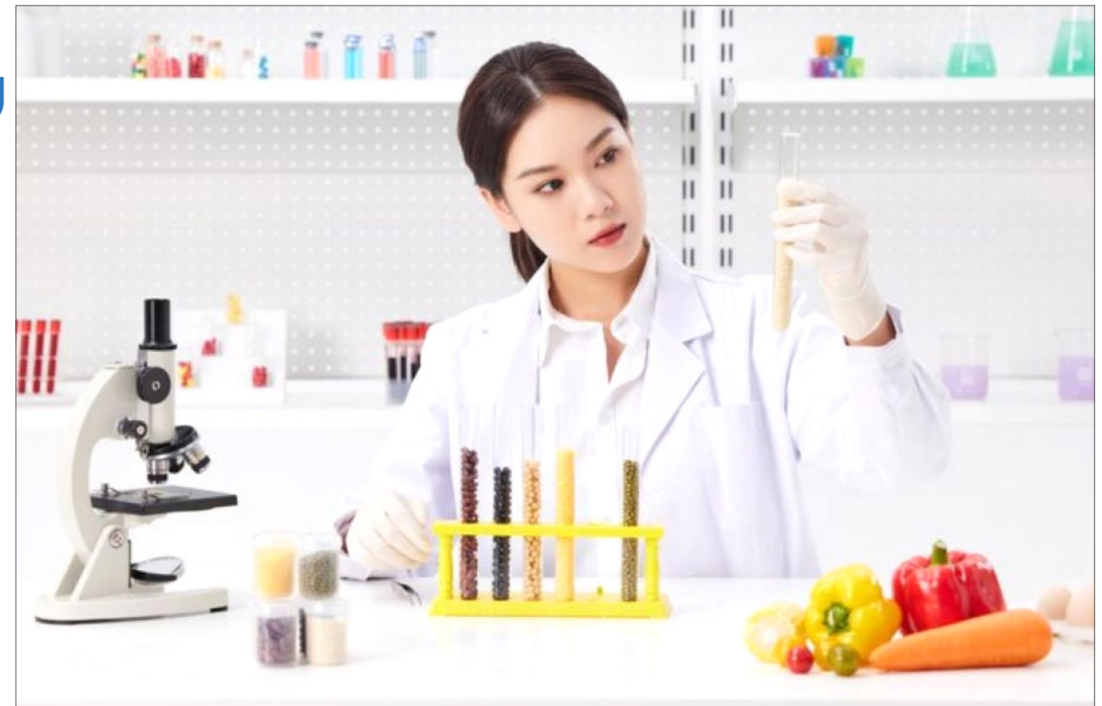
Food scientists are professionals who specialize in studying and implementing measures to enhance food safety, develop new food products, and improve food production processes.

When serving the food, there is a two-hour/four-hour rule to be simply followed. It is the cumulative time starting from the time the food is taken out of the fridge, through preparation, storage, transport and display to the time the food is consumed, whereby food is safely held between 5°C and