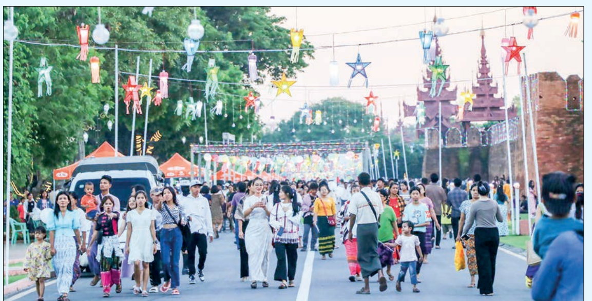
Residents enjoying lighting festival on fullmoon of Thadingyut yesterday.

Some people also made lighting events at home across the country and paid respect to the elders to mark the Thadingyut event.