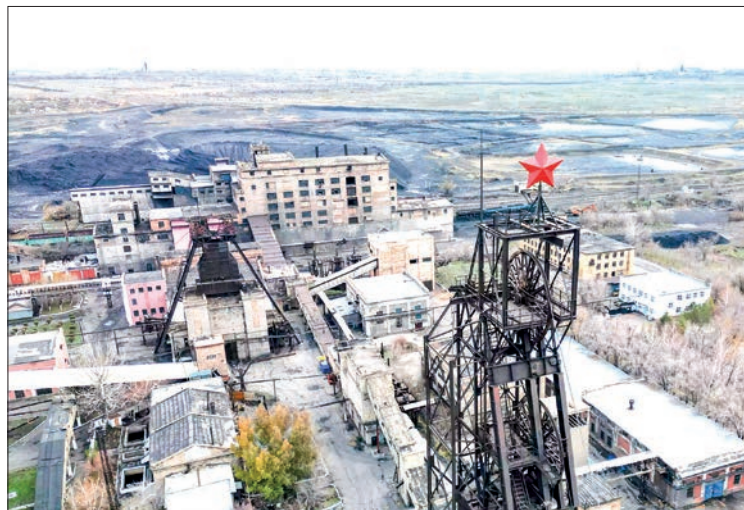
ArcelorMittal's Kostenko coal mine in Karaganda where 42 miners died in a fire.

Rescuers earlier warned that finding the remaining miners alive were "very low", due to the lack of ventilation and the force of Saturday's explosion, which spread over two kilometres (1.2 miles). — AFP