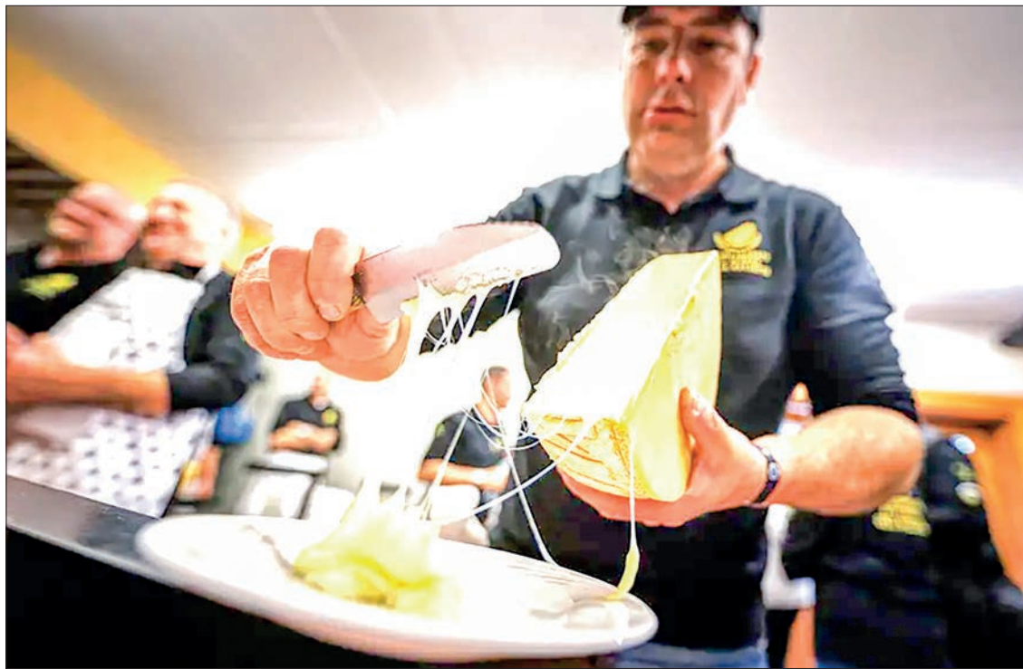
The Swiss native dish dates back centuries to a time when mountain herdsman would heat their cheese on an open fire.

In the village hall's kitchen, cheese half-wheels are grilled under electric raclette heaters. The grilling can take from 30 sec-