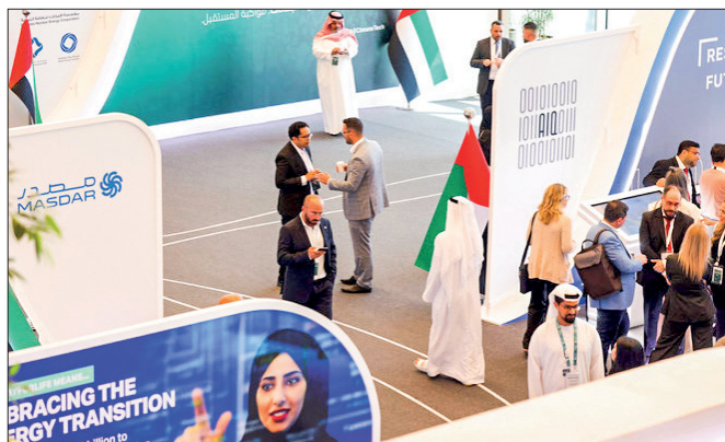
Participants to the UAE Climate Tech Forum in Abu Dhabi are shown in this picture taken on 10 May 2023.

World leaders meeting in Dubai for the COP28 summit between 30 November and 12 December will also have to respond to a damning progress report on the world's commitments under the Paris Agreement. — AFP