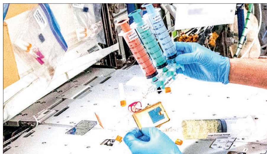
Astronauts thaw early-stage mouse embryos as part of experiments to grow them on the International Space Station.

Astronauts on the ISS thawed the early-stage embryos using a specialized device and allowed them to grow in microgravity conditions on the station for four days.