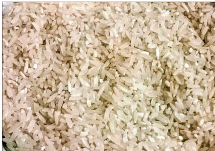
Non-premium rice is seen being organized for sale at the market.

In the first six months of the 2022-2023 FY, one tonne of rice and broken rice were $370.52 and $327.26 in the export market and the prices rise by about $141 per tonne for rice and $79 per tonne for broken rice this year. — TWA/TH