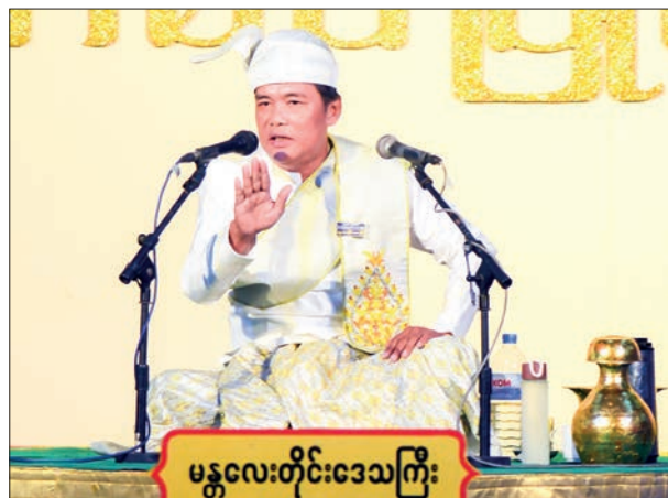
Contestant from Mandalay Region competes in the first-class amateur narration of stories competition.