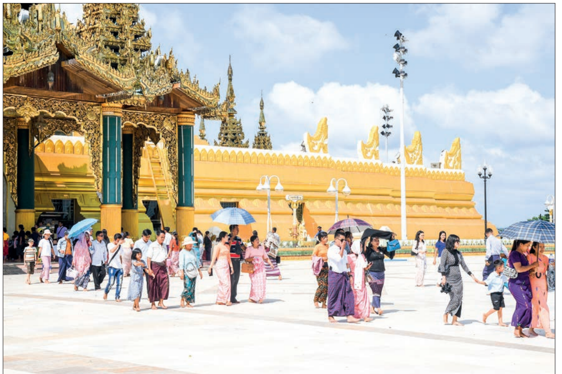
Pilgrims visiting eminent pagodas in Nay Pyi Taw yesterday.