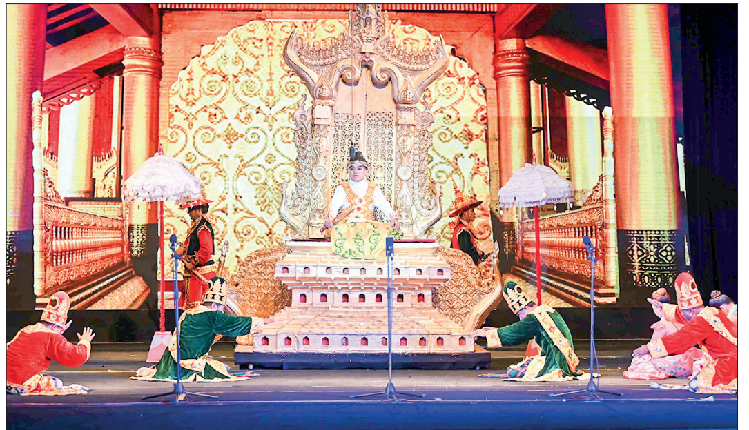
Bago Region team competes in Mahawthada drama at the training theatre of Ministry of Religious Affairs and Culture in Myanmar Traditional Cultural Performing Arts Competition in Nay Pyi Taw yesterday.