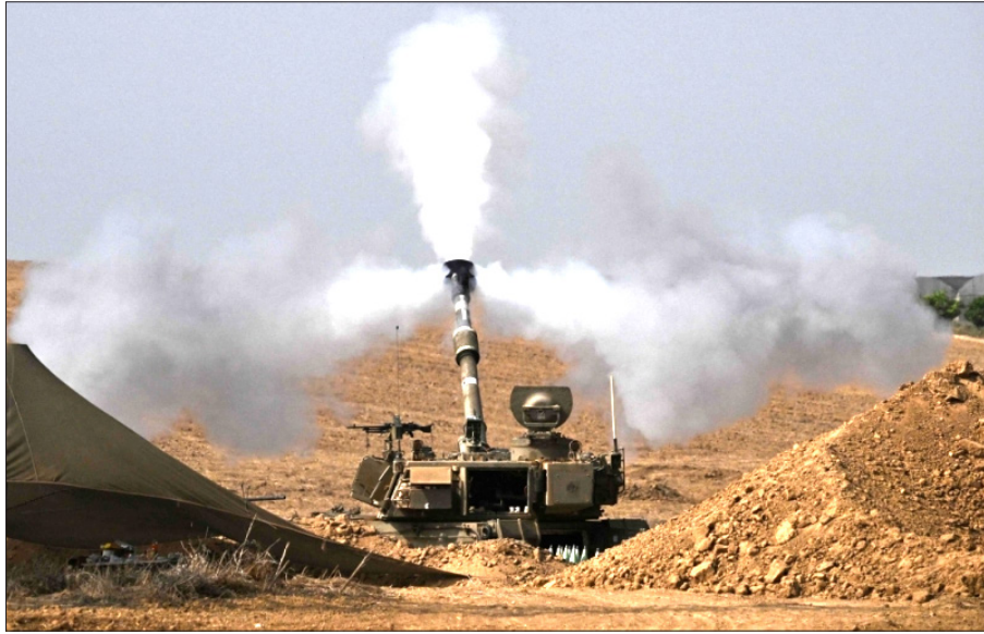
The Israeli military fires mortar shells toward the Gaza Strip on 28 October 2023.

These airstrikes are part of an intensified ground offensive in the Gaza Strip.