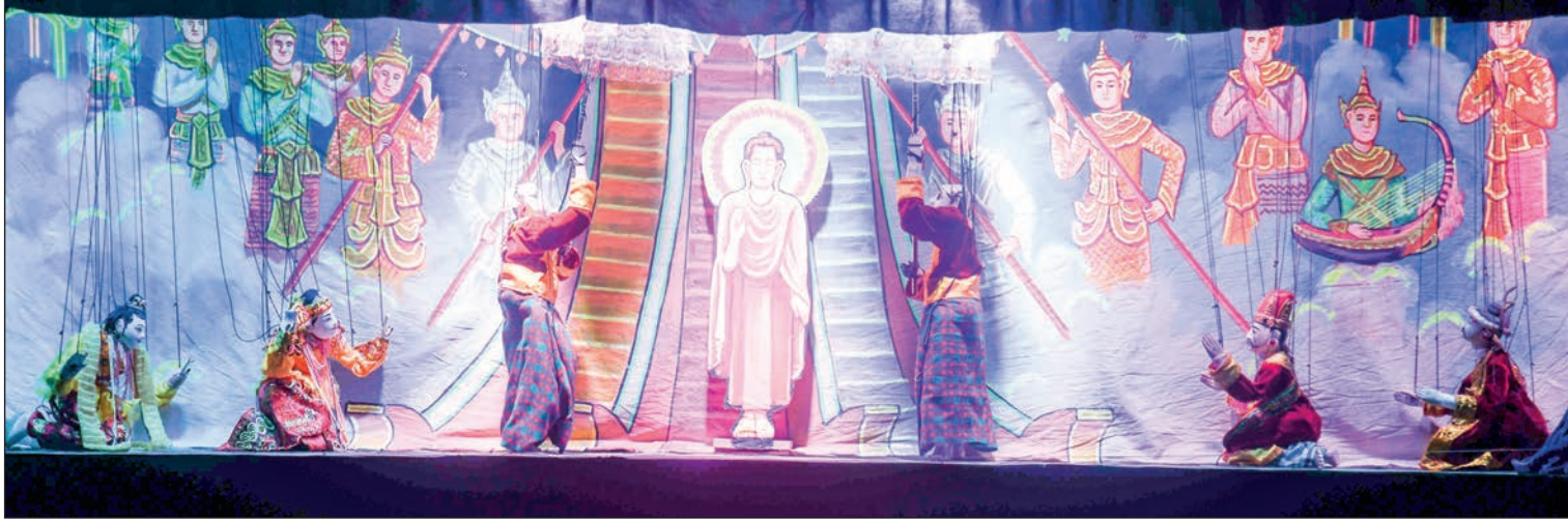
At the marionette troupe competition of Sagaing Region.

contests at News Briefing Hall. In the orchestra solo contest, contestants from regions and states, boys and girls from basic education level showed off their brilliant skills. Similarly, the xylophone contest, narration of religious or historical stories, marionette troupe and drama contests also took place at relevant venues. The competitions were enjoyed by members of the State Administration Council, Union-level officials, deputy ministers, ethnic affairs and social affairs ministers from regions and states, advocate-generals and departmental personnel as well as people. During the competition period, medics provide health-care services to contestants and audiences. — MNA/TTA