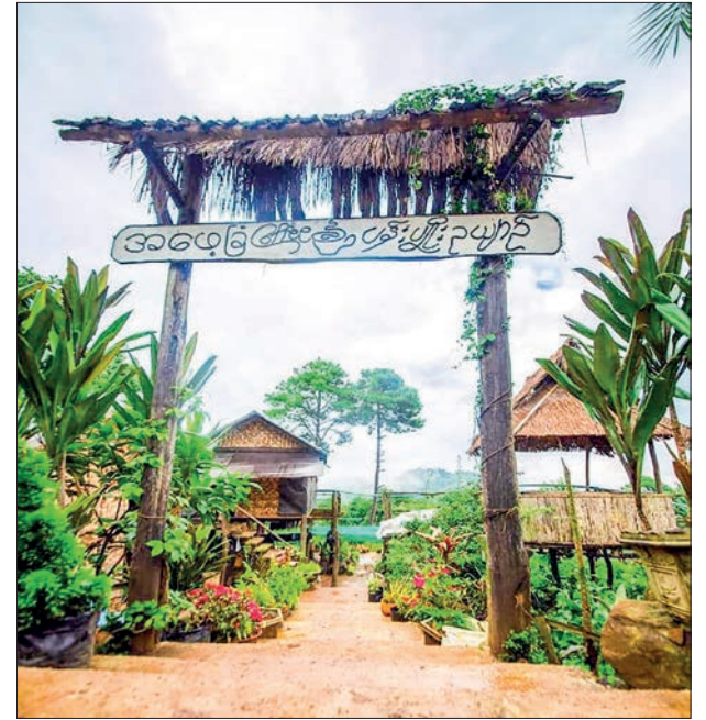
Aphaychan resort attracts travellers for enjoying scenic beauties in Kalaw Township.