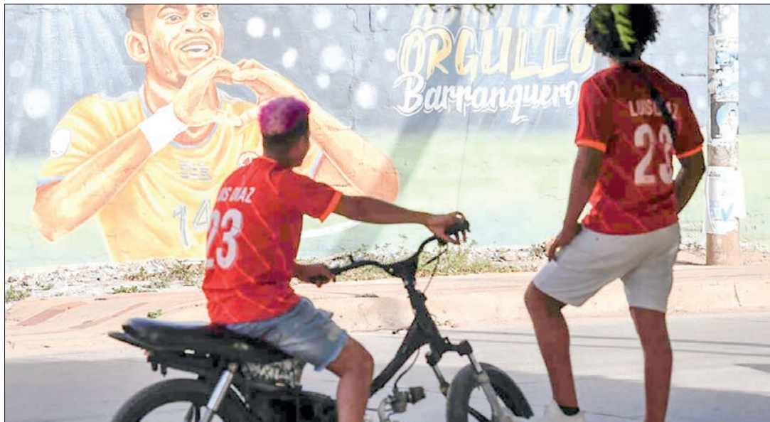
Fans of England's Liverpool football star Colombian Luis Diaz look at a mural depicting him, in Barrancas, Guajira province, Colombia, on 22 May 2022.