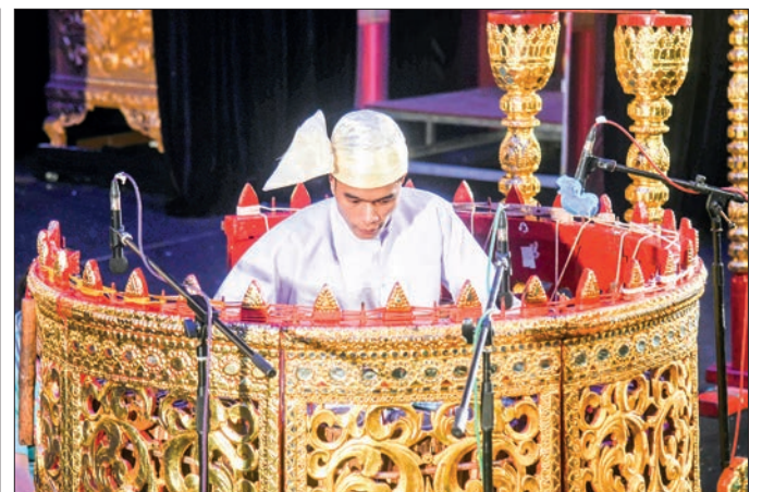
Contestant from Yangon Region competes in the second-class amateur Myanmar orchestra solo competition.