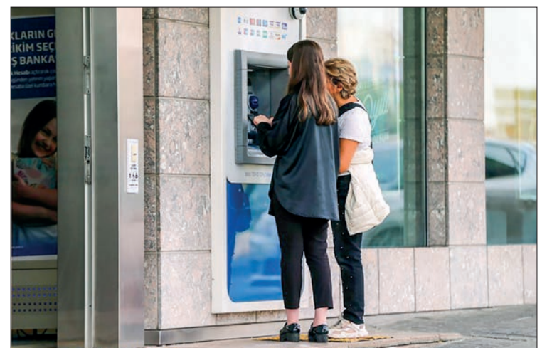
People withdraw money from an ATM machine in Ankara, Türkiye, on 26 October 2023.

Despite a U-turn in monetary policy following the general elections in May, Turkish inflation has seen a resurgence over the past three months, standing at 61.53 per cent in September. — Xinhua