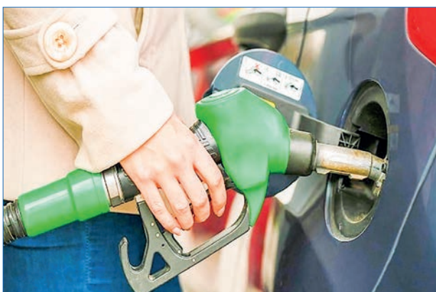
The photo shows the vehicle filling with fuel at one petrol station in Yangon.

A slight earthquake of magnitude (4.0) Richter Scale with its epicentre inside Myanmar (about (22) miles west-southwest of An), latitude 19.69°N, longitude 93.71°E, depth (51) kilometres, about (62) miles southeast of Sittway seismological observatory was recorded at (17) hr (32) min (09) sec MST on 29 October 2023.