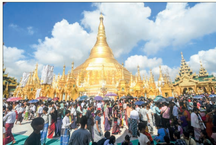
Shwedagon Pagoda.

Similarly, at the ceremony of the full moon day of Thadingyut and the Abhidhamma Day held by the Trustees of the Kaba Aye pagoda, the pilgrims received the nine precepts from