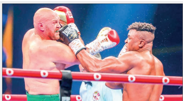
Fury, who earlier this week laughed off his opponent as a "big fat sausage", afterwards acknowledged that the 37-year-old Cameroonian had effectively kept him off-balance.

Shan United will take on Dagon Star FC at YUSC Complex today.