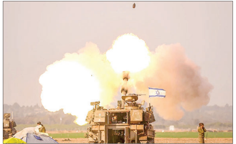
Israeli forces shell Gaza from the border area in southern Israel on 12 December.

In Khan Yunis, a centre of heavy urban combat in recent days, a family gathered to mourn the death in a strike of Fayez al-Taramsi, a father of seven. — AFP