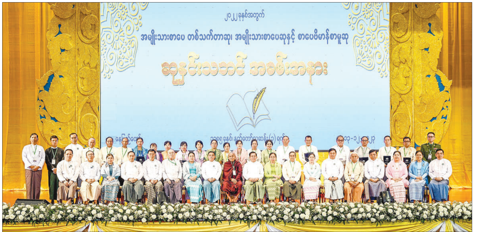
SAC Chair PM Senior General Min Aung Hlaing and wife Daw Kyu Kyu Hla pose for the group documentary photo at the event yesterday.

The Senior General and his wife presented medals, cash