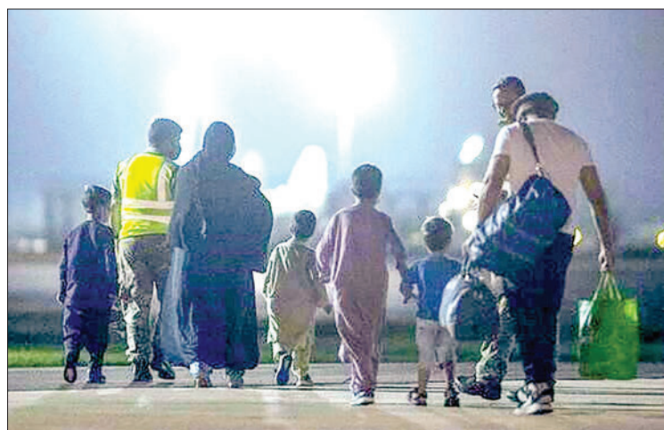
The UK's evacuation plan after the Taliban takeover of Afghanistan has been widely criticized.