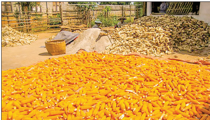
Corn spread for drying under the intense rays of the sun.

Thailand nodded corn imports under zero tariff (with Form-D) between 1 February and 31 August. However, Thailand imposes a maximum tax rate of 73 per cent on corn imports to protect the rights of their growers if the corn is imported