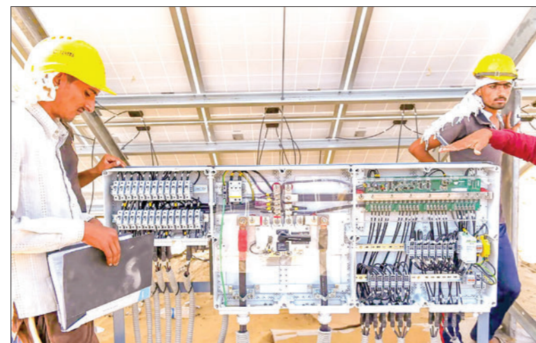
Engineers fix wires to solar panels at the Roha Dyechem solar plant at Bhadla, some 225 kilometres north of Jodhpur in the western Indian state of Rajasthan.

Travel and tour companies catering to winter destinations should tailor their offerings to suit the season. Provide comprehensive packages, including winter clothing rentals, transport for cold weather, and guides familiar with winter activities.