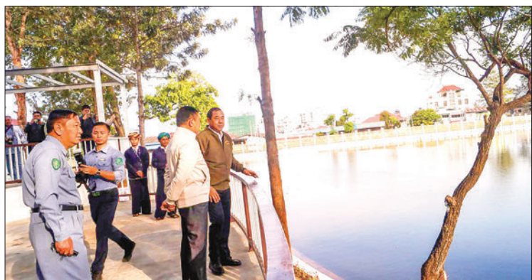
Union Minister Lt-Gen Tun Tun Naung inspects the upgrade work of Myakantha Park in Taunggyi yesterday.

THE opening ceremony for upgrading Myakantha Park in Taunggyi, Shan State, was held before the entrance gate yesterday morning.