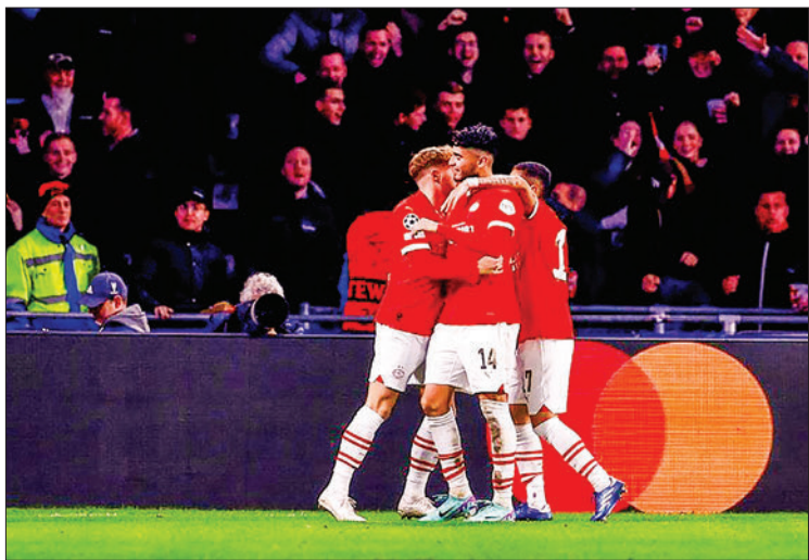
PSV Eindhoven have been the team to beat in the Dutch top flight this year.

PSV created several first-half chances with slick interplay and Belgian international striker Yorbe Vertessen hit the post with a fine header that had Arsenal goalkeeper Aaron Ramsdale beaten. — AFP