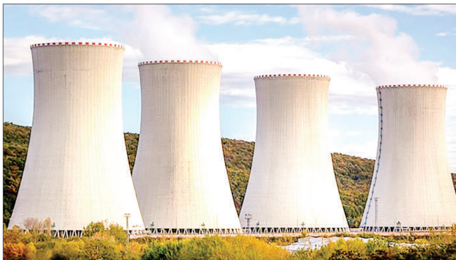
Advancements in technology and stricter regulations have made nuclear power safer than ever.

SOUTH Africa, battling crippling power blackouts, plans to add 2,500 megawatts of new nuclear generation, the government announced Tuesday.