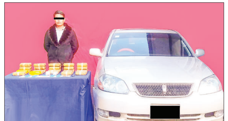
A suspect with seized stimulant tablets and a vehicle.

Legal action has been filed against him under the Narcotic Drugs and Psychotropic Substances Law.