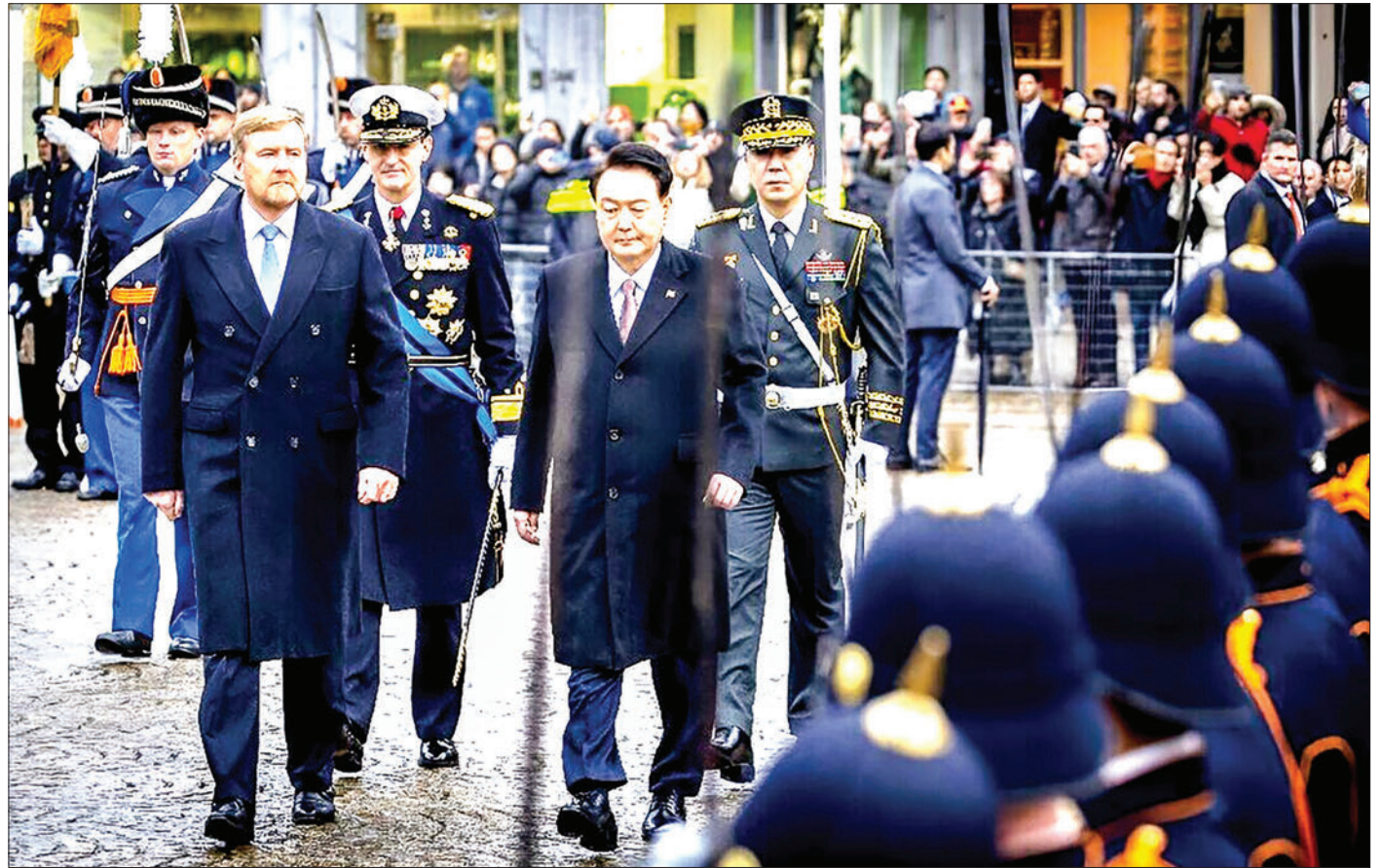
Yoon Suk Yeol has described chips as his 'top priority' during his visit to the Netherlands.

Dutch tech company ASML and Samsung have signed a 700 million euro deal to construct a semiconductor research plant in South Korea, marking a significant development during President Yoon Suk Yeol's visit focused on forming a "chip alliance" between the two semiconductor giants.