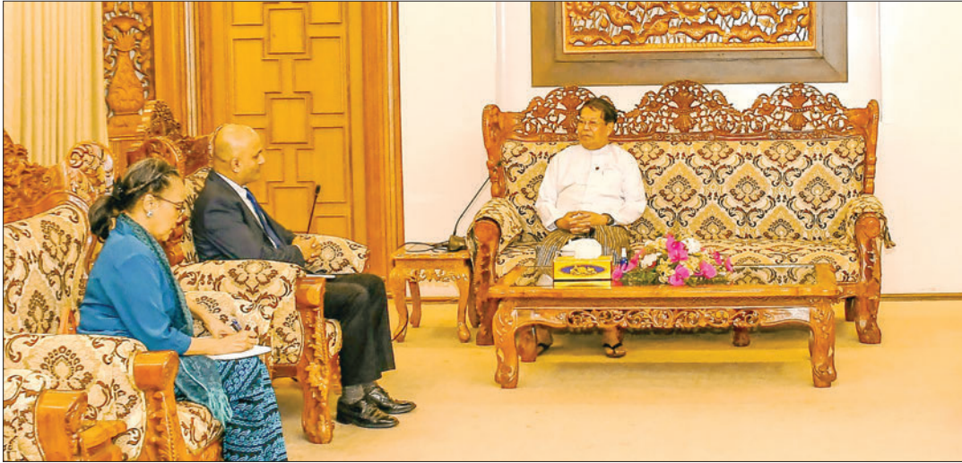
Deputy Prime Minister and Union Minister for Foreign Affairs U Than Swe receives Representative of the United Nations Fund for Population Mr Ramanathan Balakrishnan in Nay Pyi Taw yesterday.

U Than Swe, Deputy Prime Minister and Union Minister for Foreign Affairs, received Mr Ramanathan Balakrishnan, Representative of the United Nations Fund for