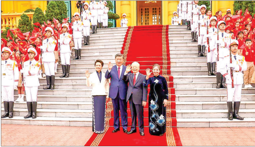
General Secretary of the Communist Party of China Central Committee and Chinese President Xi Jinping attends a welcome ceremony held by General Secretary of the Communist Party of Viet Nam Central Committee Nguyen Phu Trong in Hanoi, capital of Viet Nam, 12 December 2023. Upon Xi's arrival in Hanoi, he had a meeting with Trong on Tuesday.