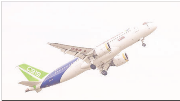
The C919 plane is scheduled to perform a fly-past over the scenic Victoria Harbour on Saturday.

The visit holds particular importance for the C919, China's inaugural large jetliner, marking its first flight beyond the Chinese mainland and highlighting its substantial order success with over 1,000 confirmed orders.