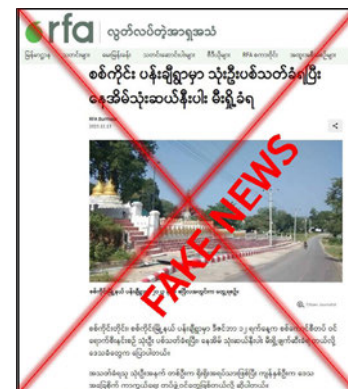
Screenshot validates false claims.

Terrorists launched destructive actions to destroy the State's stability, people's lives and property, whereas malicious media spread misinformation to mislead the people and disturb the counter-terrorism operation procedures. — MNA/KTZH