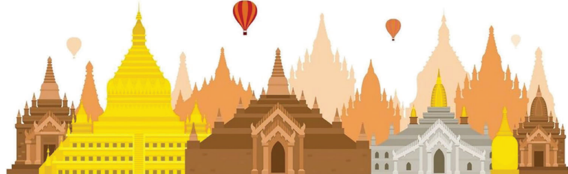
The tourism season coinciding with significant festivals offers ideal weather for exploring cultural treasures.

Tourism also involves marketing and promotion. One strategy is paid advertising, where tourism agencies create online ad campaigns targeting specific demographics to attract potential tourists. This ensures that the right people are aware of the at-