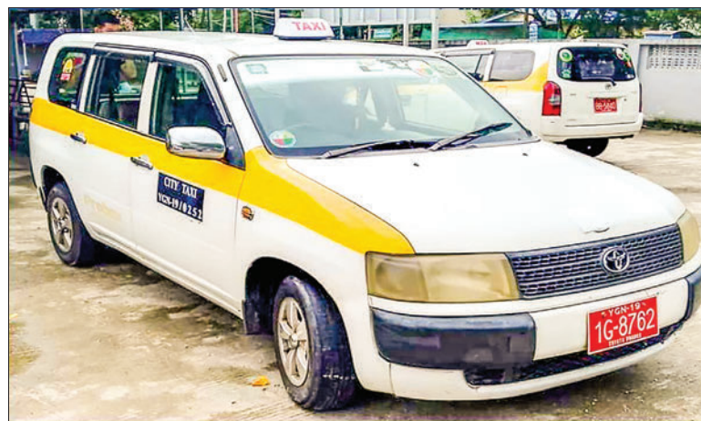
The photo depicts a taxi being installed with a yellow line sticker.

ACCORDING to the Yangon Region Public Transport Committee (YRTC), 67 per cent of City Taxi vehicles in the Yangon Region now sport sideline yellow stickers. In an effort to distinguish these taxis from other cars, authorities have mandated the installation of yellow line stickers on all City Taxi vehicles.