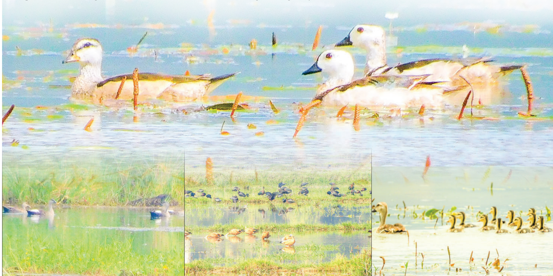
Photos depict pygmy geese and other rare bird species in the Inlay Lake Wild Sanctuary area.

Fourteen essential bird species are recorded, with 6,773 birds of 95 forest bird species, 9,938 birds of 42 water bird species, and 4,236 birds of 34 wintering bird species grazing in the Inlay Lake Wild Sanctuary area. Wintering and migratory birds migrate and feed in the regions of Indawgyi Lake, Inlay Lake, Moeungyi, Mainmahla Island, Plate Lake, Taungthaman Lake, Pyukon Lake, and Banaw Lake every year, attracting tourists and making our country proud to be a grazing country for the world's rare wintering birds. — Nyein Thu/TRKM