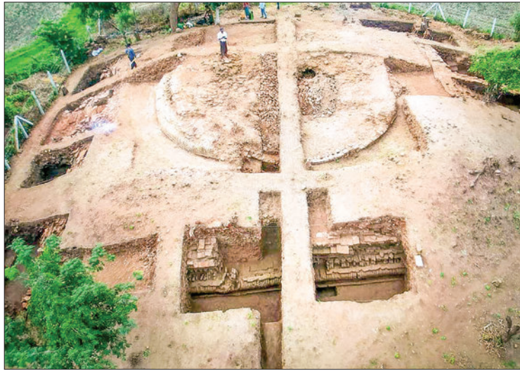
A team of archaeologists from the Department of Archaeology and National Museum (Mandalay branch) work to unearth the largest Pyu-era pagoda at the ancient Pyu city of Pinle (Mongmaw) in Myittha Township of Mandalay Region.

“According to the excavation results, we have found a Pyu-era pagoda in Pinle (Mongmaw) that is 120 feet long, 90 feet wide and 17 feet high. We have never found such a