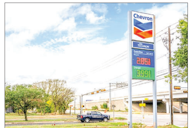
US consumer inflation ticks on the back of cooling gas prices, said the Department of Labour.

The consumer price index (CPI), a closely eyed gauge of inflation, rose 3.1 per cent from a year ago, said the Department of Labour, down from 3.2 per cent in October. The slowdown comes on the back of falling gas prices, with the gasoline index dropping 6.0 percent. But CPI rose more than expected between Oc-