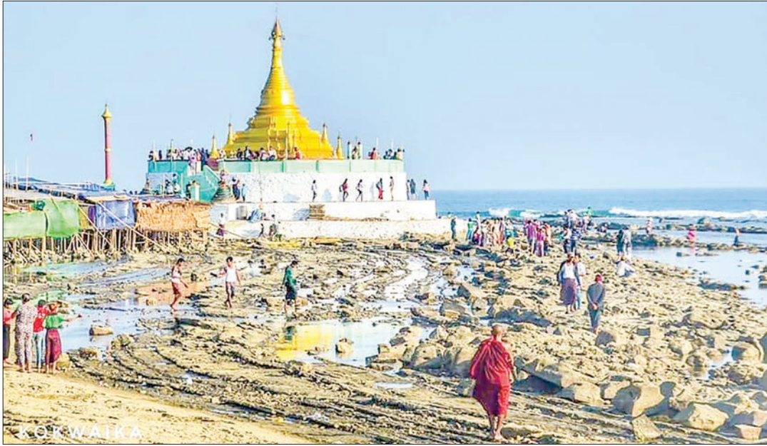
The photo shows Myat Mawtin Pagoda packed with pilgrims.