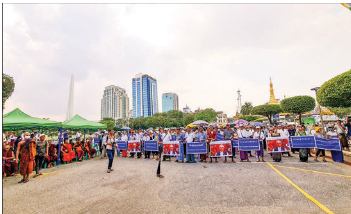
Protesters near Maha Bandula Park in front of the Yangon city hall campaign against Timor-Leste and foreign countries interfering in Myanmar's internal affairs yesterday.

Then, all those who participated in the protest started rallying with placards bearing slogans such as "Perpetuation of State's Sovereignty is our cause", "No to Timor that supports the destruction of religion", "No to Timor that supports terrorists", "No to