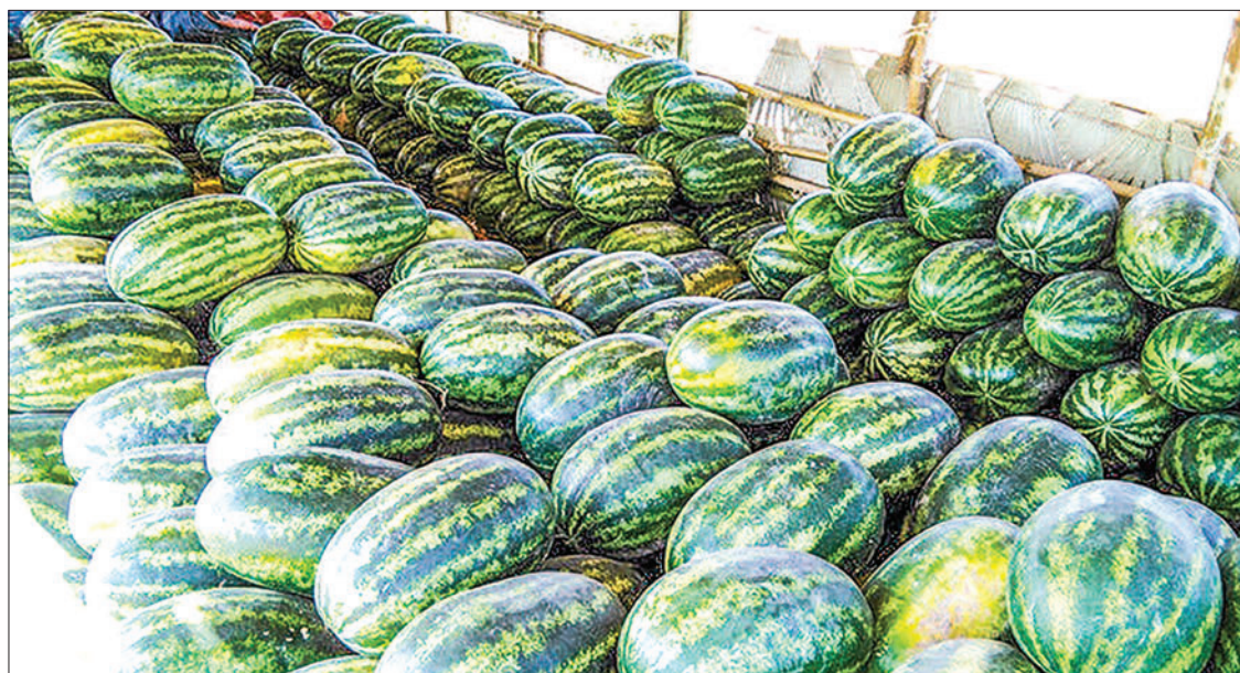
Export watermelons seen on the Myanmar-China border.

"The traders go into difficulties on each Lweje and Mongla route. It is just an option not to have an abrupt halt in border trade. When the abundant harvest season of the sugarcane, tissue-culture banana and watermelon arrives, it will slam the Lweje border. The traffic of melon trucks has eased at the Mongla border. Yet, exporters have to invest K12 million per