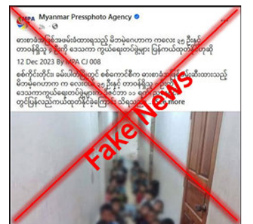
Screenshot validates misinformation.

Regional officials claimed that it was just a fake news item. Tatmadaw is constantly protecting the people's lives and property and has never abducted civilians. Only the malicious media spread such false infor-