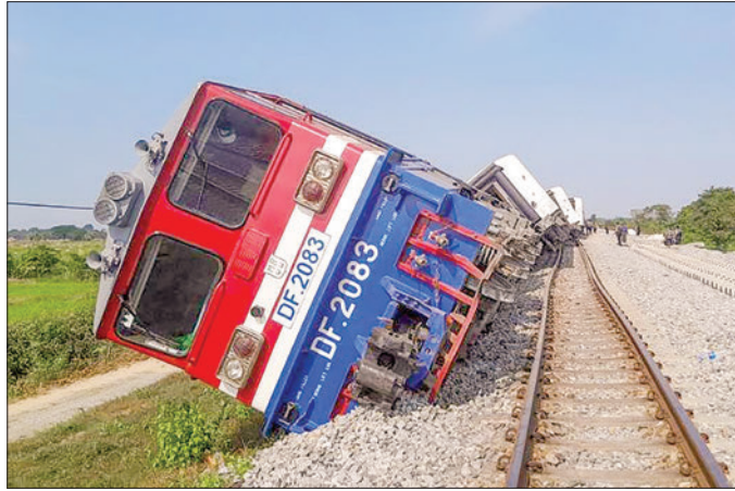
The documentary photo that No 6 express train, departing from Mandalay to Yangon, overturns due to a mine explosion at Bridge No 147 between Kyauktaga and Peinzaloke stations.

Due to the derailment, there were about 100 passengers on the passenger train, and about