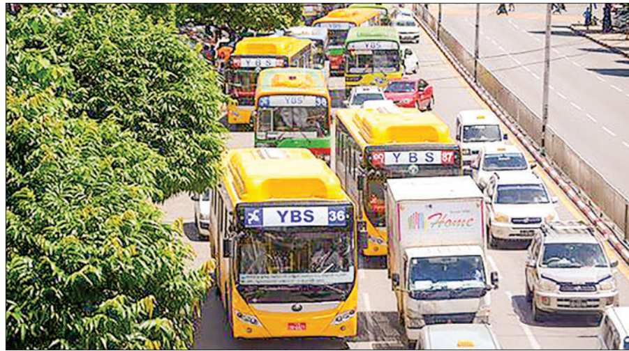
YBS buses are seen in the Yangon downtown area.

THE Yangon Region Public Transport Committee (YRTC) has reported that YBS company vehicles have been involved in 25,530 traffic rule violations during the first 11 months of 2023. The Disciplinary and Inspection