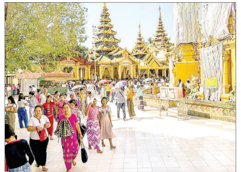
Pilgrims are seen on the Shwedagon Pagoda platform.

As of 5 December 2023, the cumulative donations for the Shwedagon Pagoda amount to K99.604 billion and US$16.18 million. — ASH/TKO