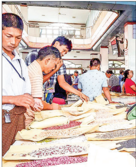
Samples of pulses seen being displayed at the Mandalay market in early 2023.

Nonetheless, the prices of green gram from the Pakokku area moved up to K2,665-2,835 per viss from K2,500-2,750 per viss. Similarly, the green gram (Shwewah) increased from K3,665 per viss on 8 December to K3,750 on 11 December.