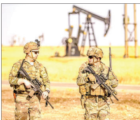
US troops patrol near an oil well in al-Qahtaniyah, Syria, 14 June 2023.

DAMASCUS expects to return oil fields that are important but remain under the