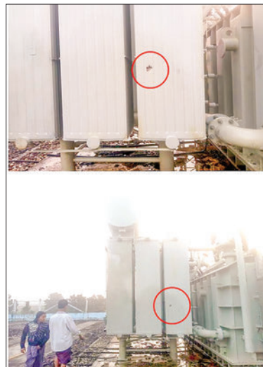
Documentary photos indicate debris in the 230 kV substation in Thingan Nyinaung.

The KNLA and PDF terrorist insurgents have caused a lot of damage to the socioeconomic life of the local people due to these acts of terrorism, and the security forces will continue to cooperate with the public in the anti-terrorism operation for regional stability. — MNA/KZL