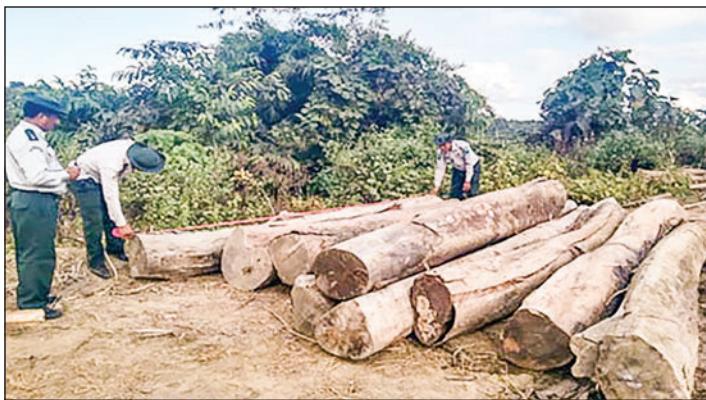
Confiscated illegal timbers in Yangon Region.

DURING inspections on 11 and 12 December, the Customs on-duty teams managed by the Customs Department impounded 17 kinds of jewellery valued at K9.575 million, including 26 rings and 16 bead necklaces (supposed to be made of jade) without official documents, from luggage at the Mandalay International Airport, 34 kinds of goods worth K39.05 million, including 600 tubes of Gano Fresh toothpaste and 216 bottles of Gano instant café powder that were different from the items in the Import Declaration (ID), at the Asia World Port Terminal container checkpoint and two kinds of goods worth K3.66 million, including 4,200 pieces of CHNT 250V 6KA breakers that