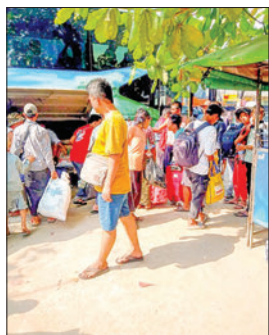
Documentary photos show distribution of lunch boxes to passengers trapped by a mine explosion (left photo) and the evacuation of passengers continuing to their destinations by buses (right photo).