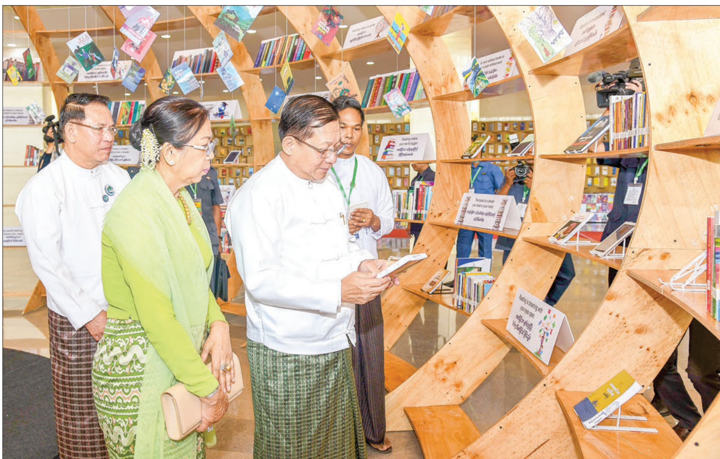
State Administration Council Chairman Prime Minister Senior General Min Aung Hlaing and his wife view the display at the event yesterday in Nay Pyi Taw.

The award presentation ceremony of the National Lifetime Awards for Literary Achievement, National Literary Award and Sarpay Beikman Manuscript Award for 2022 took place in Nay Pyi Taw.