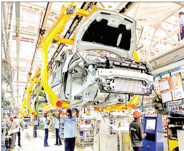
Double-digit growth in industry in India were observed during the July-September period this year.

China is forecast to post a 5.2 per cent growth this year, up from the 4.9 per cent projection in September, while India's growth outlook was raised to 6.7 per cent from 6.3 per