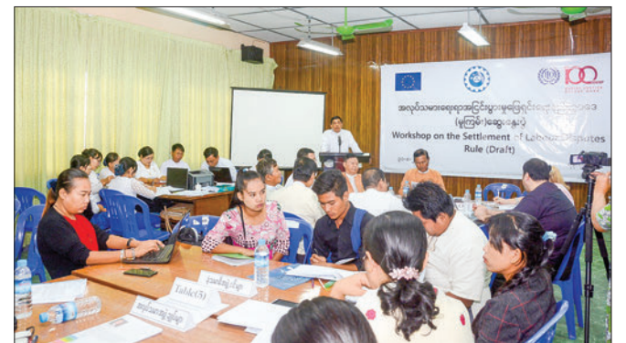
Meeting over drafting the bylaw bill for the Labour Dispute Resolution Law in 2019.

In 2022, WCCs accepted 190 disputes and resolved 160 disputes. In 2023, they received 244 disputes and settled 211 disputes. — TWA/TMT