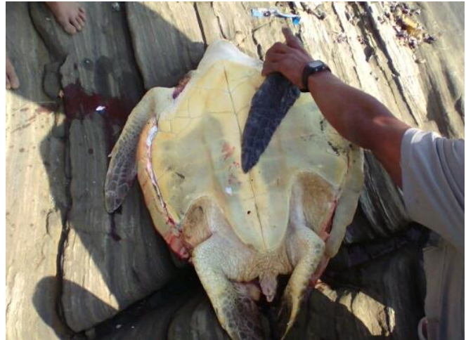
Dead sea turtles