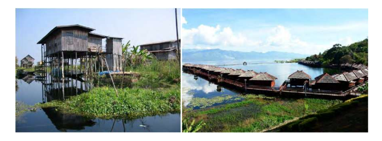
Village-houses and Resorts of the Inle lake