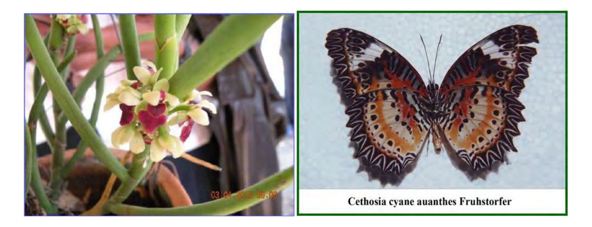
Some Orchids and Butterflies can be found at Inle Lkae