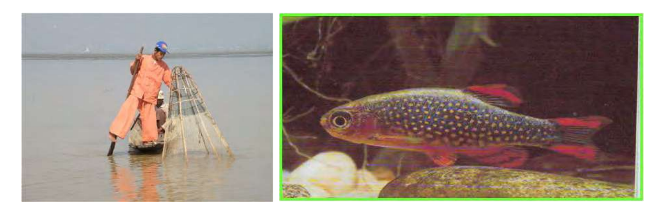
Unique Fishing Practice and a kind of fancy Fish at Inle lake