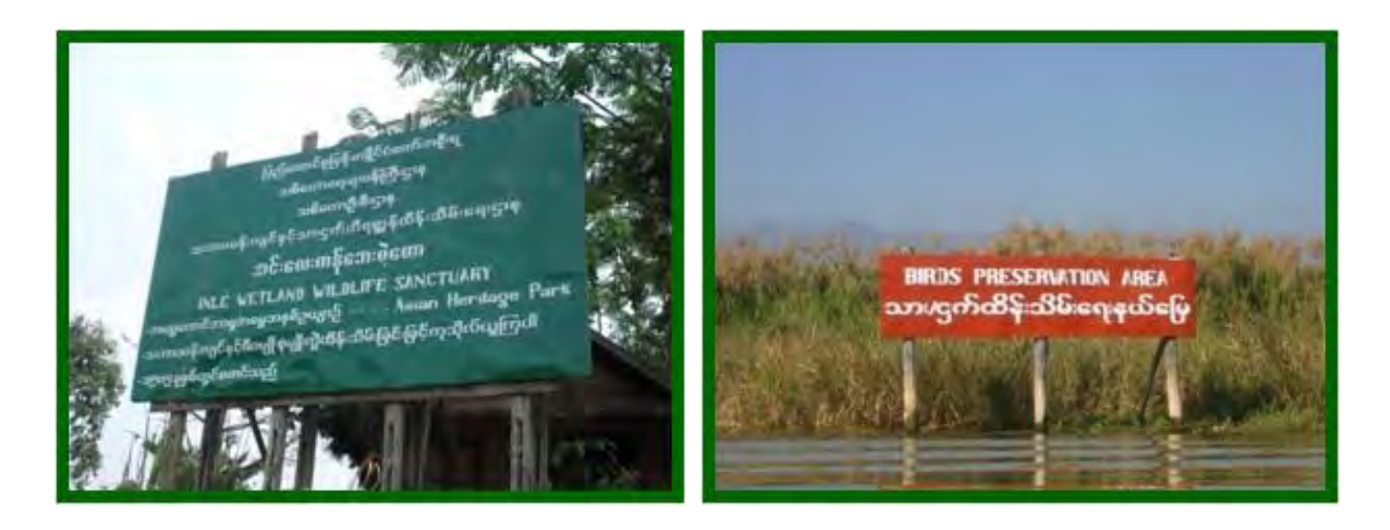
Signboards to protect misconduct in Inle Wetland Wildlife Sanctuary