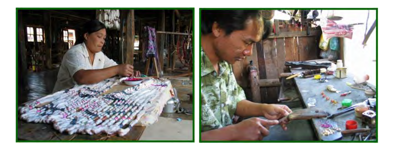
Some Clothing and Silversmith Industries at Inle Lake Area