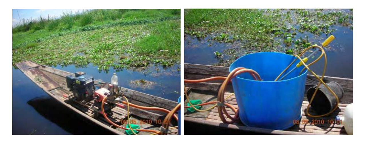
Power Spraying Apparatus used for Chemical Insecticide