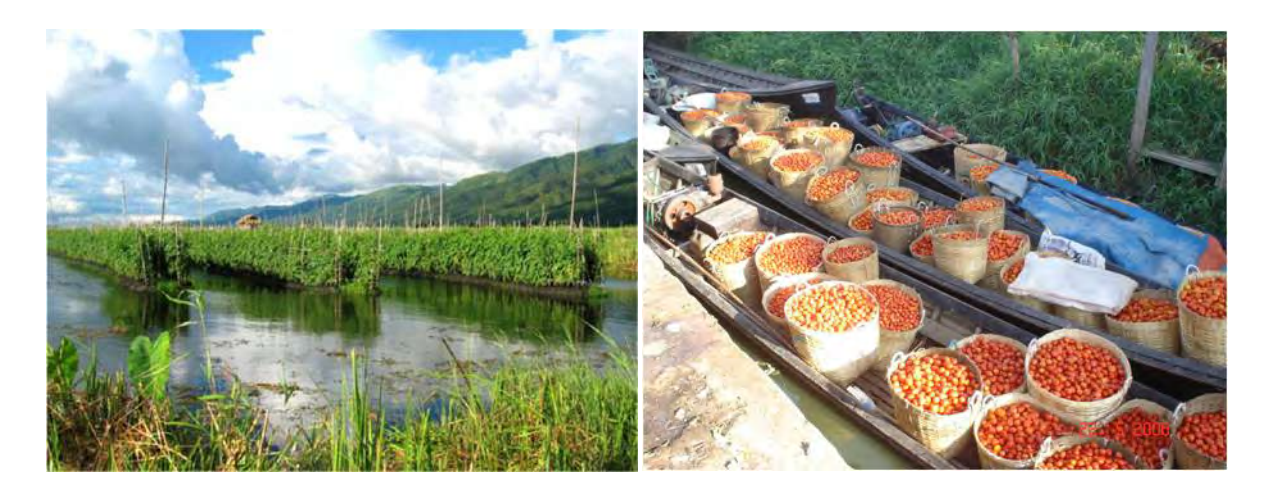
Floating Agriculture and the Tomatoes came from Inle Lake