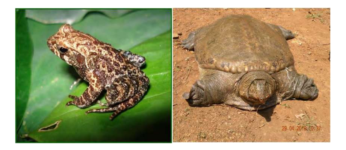
Some Amphibians at Inle lake