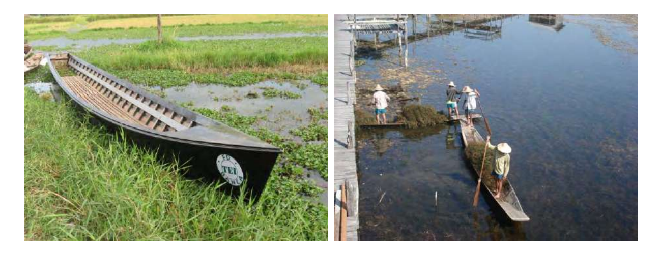
Project supported Medium Boat and Waterway Cleaning at Bird-watching Camp