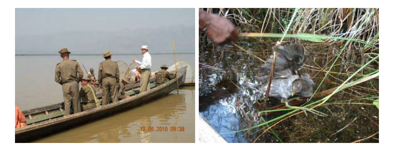
Patrolling and Seizure of Wildlife Poaching