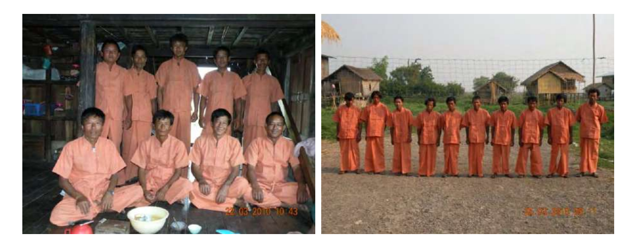
Forming of CBOs at In-U and Sitha Villages