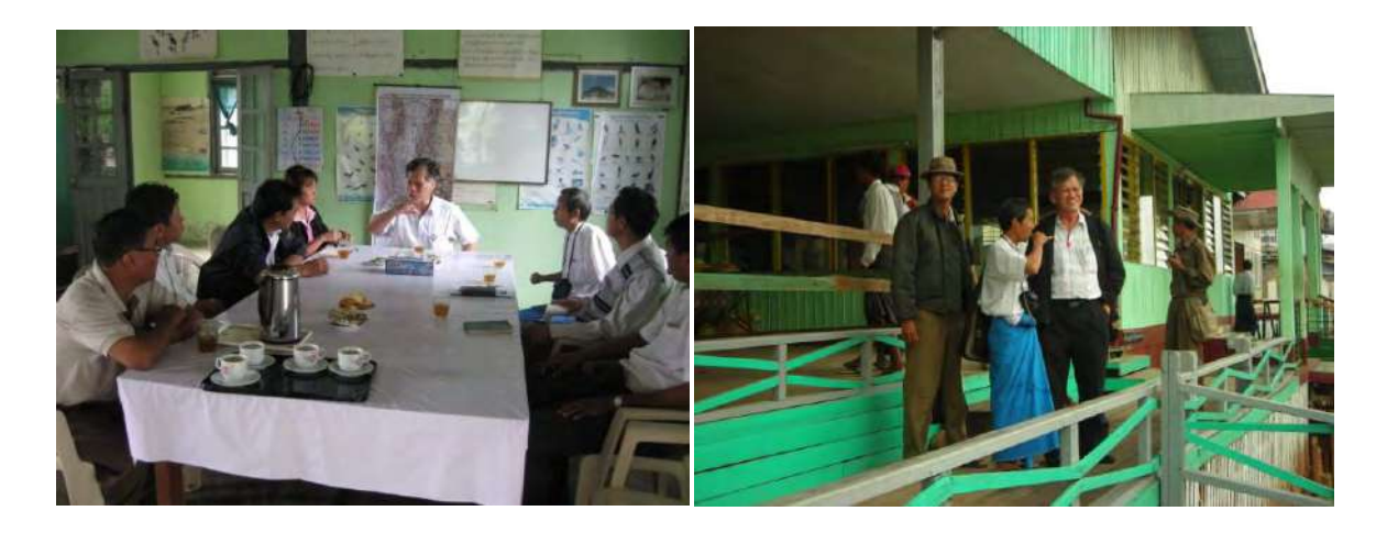
TEI Evaluation Team, BANCA and Forest Department Officials