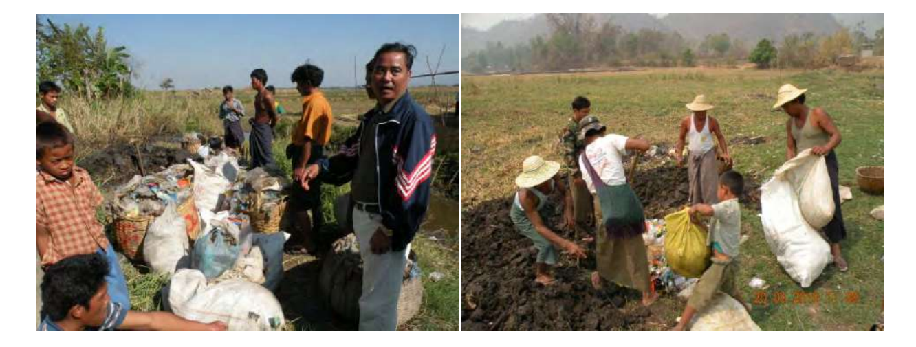
Waste Management Campaign