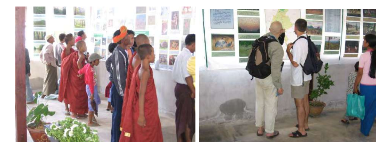
Exhibition on Environmental Education Program of Project