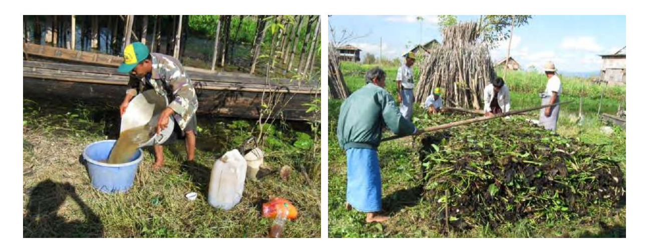
Project Introduced Organic Farming