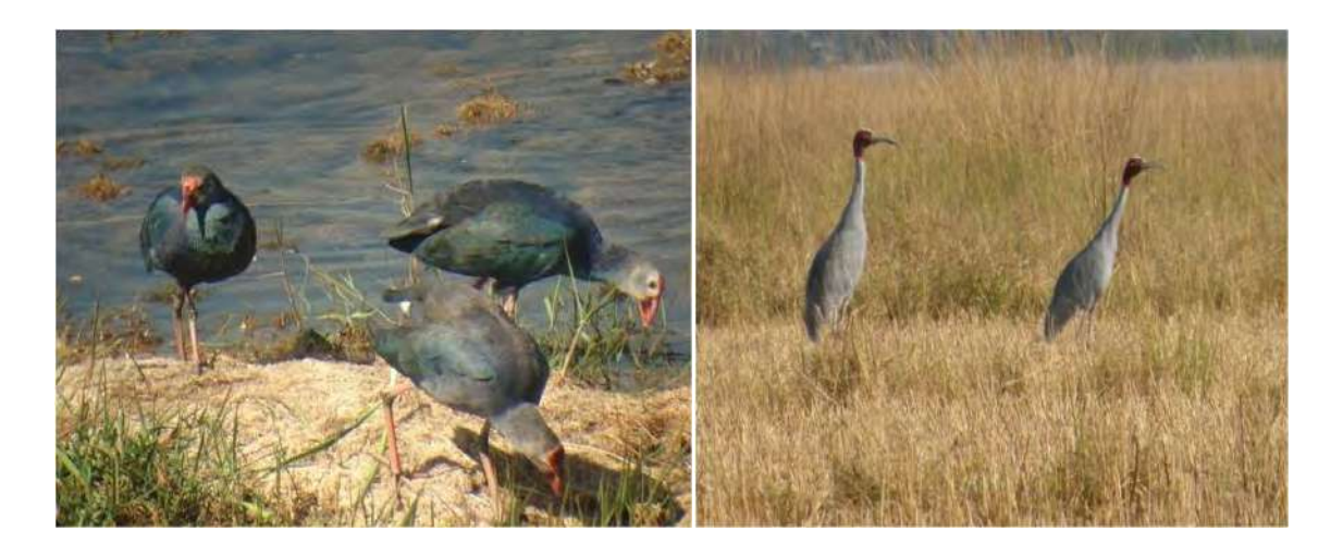
Inle lake is the Home of Water Birds