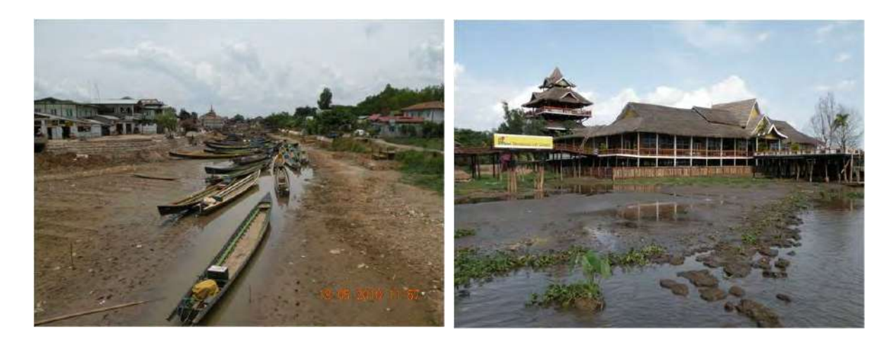
Inle is now Facing Water Pollution and Draught at Dry Season