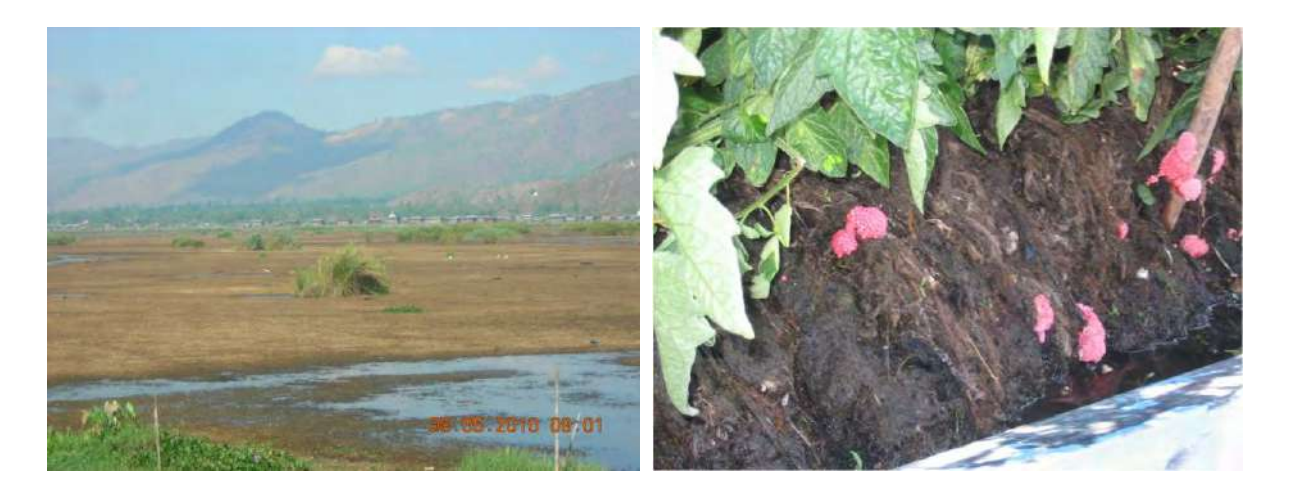
Reduced Water level and New Invasive Species in Inle Lake