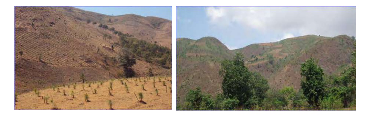
Deforestation Occurred at the Watershed area of Inle lake