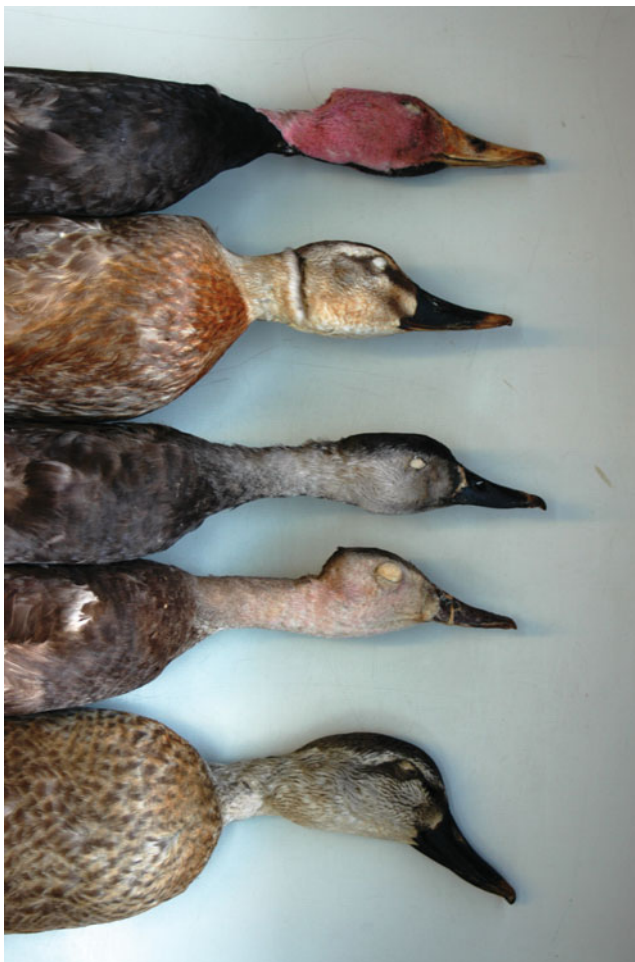
Figure 6. Comparison of heads of (from top to bottom): male Pink-headed Duck; male Spot-billed Duck subspecies zonorhyncha ; female Pink-headed Duck; juvenile male Pink-headed Duck; Spot-billed Duck subspecies zonorhyncha .