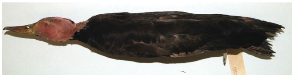
Figure 4. Skin of a male Pink-headed Duck in the collection of AMNH. The specimen was collected acquired from Mandalay bazaar on 10 February 1910.