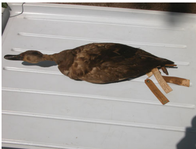
Figure 3. Skin of a female Pink-headed Duck in the collection of BNHS. The specimen was collected at Koolay, near Singu, in present-day Mandalay division, on 25 December 1908.

The second specimen from Myanmar is a male acquired from Mandalay bazaar in February 1910 and held at the American Museum of Natural History (AMNH) (Figure 4). The label of this specimen bears the following information: “♂, Mandalay bazaar, 10.02.10, H. H. Harington”. This represents the last confirmed record of the species from Myanmar. Mandalay ( 21^{\circ}58'30''\text{N} , 96^{\circ}05'00''\text{E} ; 80 m a.s.l.) is c. 60 km south of Singu town.