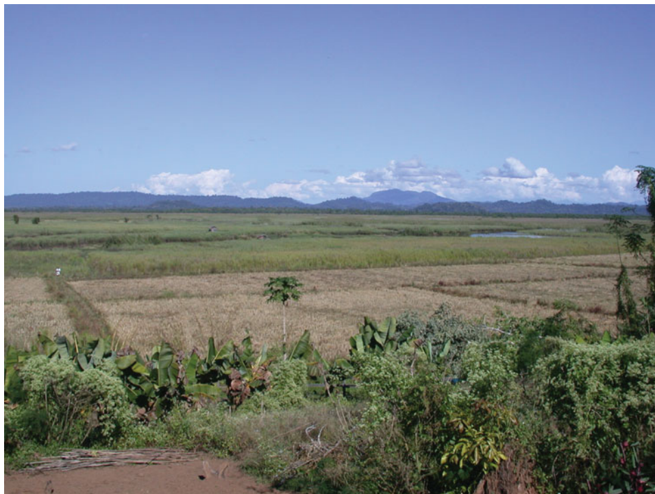
Figure 5. Nawng Kwin wetland, Kachin State. The photograph is taken from the point from where a possible sighting of Pink-headed Duck was made in December 2004.

p. haringtoni , the most widespread subspecies of Spot-billed Duck in South-East Asia. It does not, however, rule out another subspecies, A. p. zonorhyncha , which has very reduced white in the tertials, and which was recorded in the lowlands of Kachin state during the November–December 2004 survey (Tordoff et al. in press).