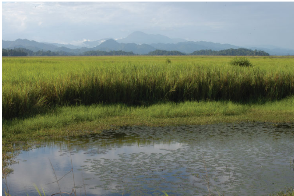
Figure 7. Kamaing area, Kachin State. The photograph shows one of the large grasslands studded with pools near the Nat Kaung river.

On 16 October, the survey team received a report from Poh Sa, a farmer along the Nat Kaung river, who reported that, in September–October 2004, while looking for rubies near Za Baw