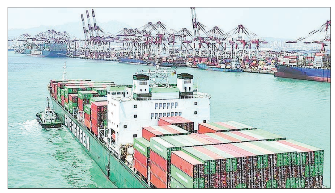
A container ship sails into the Qingdao Port on 2 June 2022.

THE booming orders at the beginning of 2023 mark a robust rebound in foreign trade in south China's Guangdong Province, a primary economic hub, injecting new impetus into the global economic recovery.