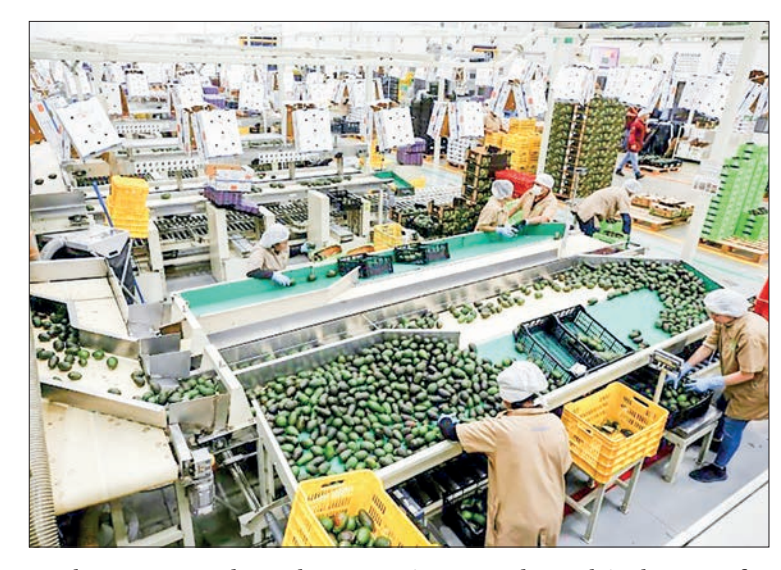
Workers sort avocados at the Los Cerritos avocado ranch in the state of Jalisco, Mexico.

But rivers of water came cascading down from higher up in the mountains surrounding his farm and scouring out ditches up to two meters deep.