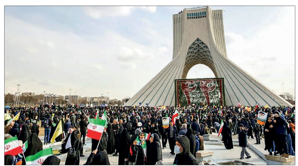
Iranians rally in front of Tehran's Azadi Tower to mark the 44<sup>nd</sup> anniversary of the 1979 Islamic Revolution.

TENS of thousands of Iranians rallied Saturday in Tehran and other major cities to mark the 44<sup>th</sup> anniversary of the Islamic Revolution, as their president said months-long protests had been defeated.