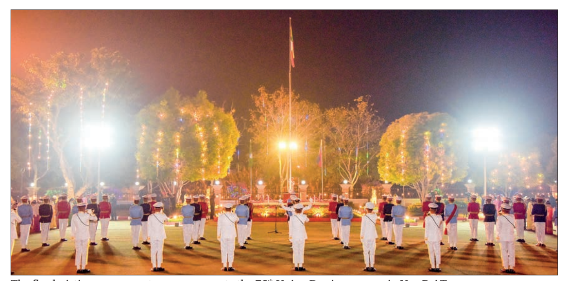
The flag hoisting ceremony to commemorate the 76th Union Day in progress in Nay Pyi Taw.

The 76th Anniversary of Union Day 2023 was held in line with the five point National Objectives with essence: to strive for the perpetual existence of national solidarity and perpetuity of the Union through the internal strength; to make collaborative efforts of all ethnic nationals to restore perpetual and durable peace; to join hands in harmony for ensuring the prosperity and food sufficiency of the nation as two national plans through the Union spirit; to help develop all regions and states on equal terms and increase employment opportunities with