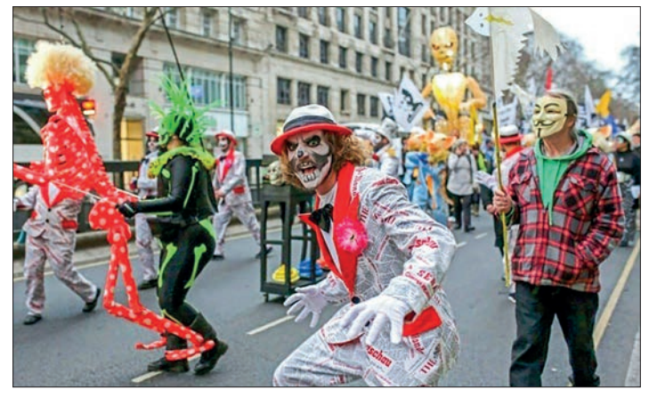
Supporters of WikiLeaks founder Julian Assange take part in a 'Night Carnival for Assange' march in London.

The Australian publisher remains in custody in Britain pending a US extradition request to face trial for divulging US military secrets about the wars in Iraq and Afghanistan. —AFP