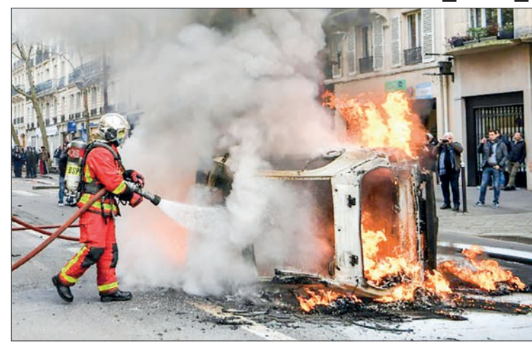
There were tensions when a car and a bin were overturned and set on fire.

HUNDREDS of thousands of people took to the streets in France on Saturday in a fourth day of action against President Emmanuel Macron's pension reform, with unions planning to ramp up strikes if the plan is not dropped.