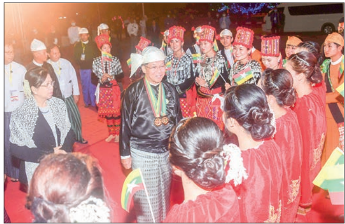
The Senior General and wife cordially greets the ethnic cultural troupes at the dinner.