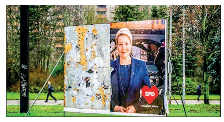
Sunday's rerun of a chaotic 2021 regional election in Berlin takes place under the watchful gaze of international election observers, invited in by the city itself to restore trust.

Any upset risks shifting the balance of power in the Bundesrat, the upper house of the federal parliament, which represents the regional states.