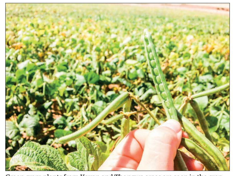
Green gram plants from Kayan and Thongwa areas are seen in the crop land.

THE prices of three types of beans and pulses are rising in the Yangon pulse market within five consecutive days, especially the price of green gram (Kayan Shwewah variety) shoot by K360,000 per tonne.