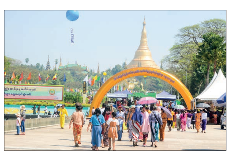
Union Day exhibition crowded with visitors at People's Square in Dagon Township on 12 February.

The exhibition to mark the 76<sup>th</sup> Union Day including traditional food galleries is being held from 9 am to 10 pm from 10 to 14 February for five days. At the celebration, 25 ministry galleries, 15 galleries of