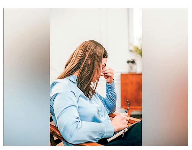
People from less affluent backgrounds are far more likely to experience mental health issues later in life than people from more affluent ones.