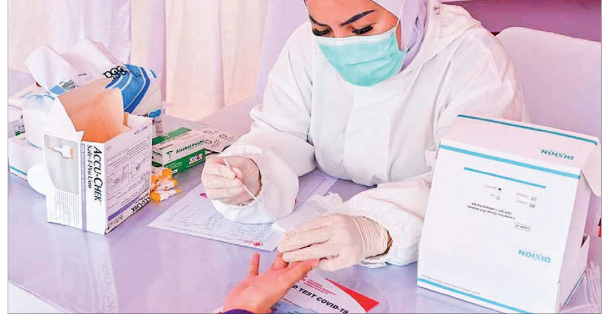
Rapid antigen tests search for protein pieces from the coronavirus.

He called for "data philanthropy", a concept which refers