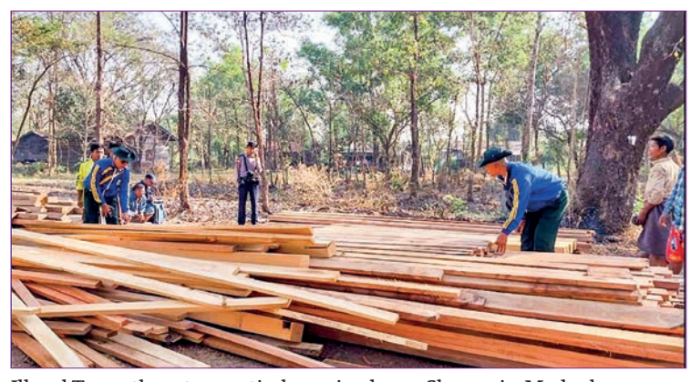
Illegal Taungthayet sawn timber seized near Shwegyin-Madauk-Nyaunglebin road on 11 February.

AN illegal special eradication task force inspected at airport cargo of Yangon International Airport on 9 February and seized 17,000 test kits of Covid-19 Ag Tests Kit estimated at K25.5 million without official documents. The action was taken under the Customs procedures.