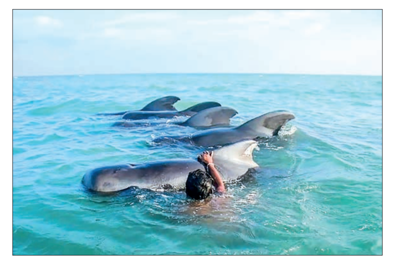
A Sri Lankan fisherman tries to push the pilot whales into deeper water off Kudawa.

It is the main ingredient in guacamole.—AFP