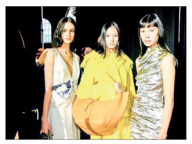
Models pose backstage at the Proenza Schouler show.

US fashion label Proenza Schouler on Saturday presented a low-key, functional collection, without its past conceptual showiness, as the brand marks its 20th anniversary at New York Fashion Week.