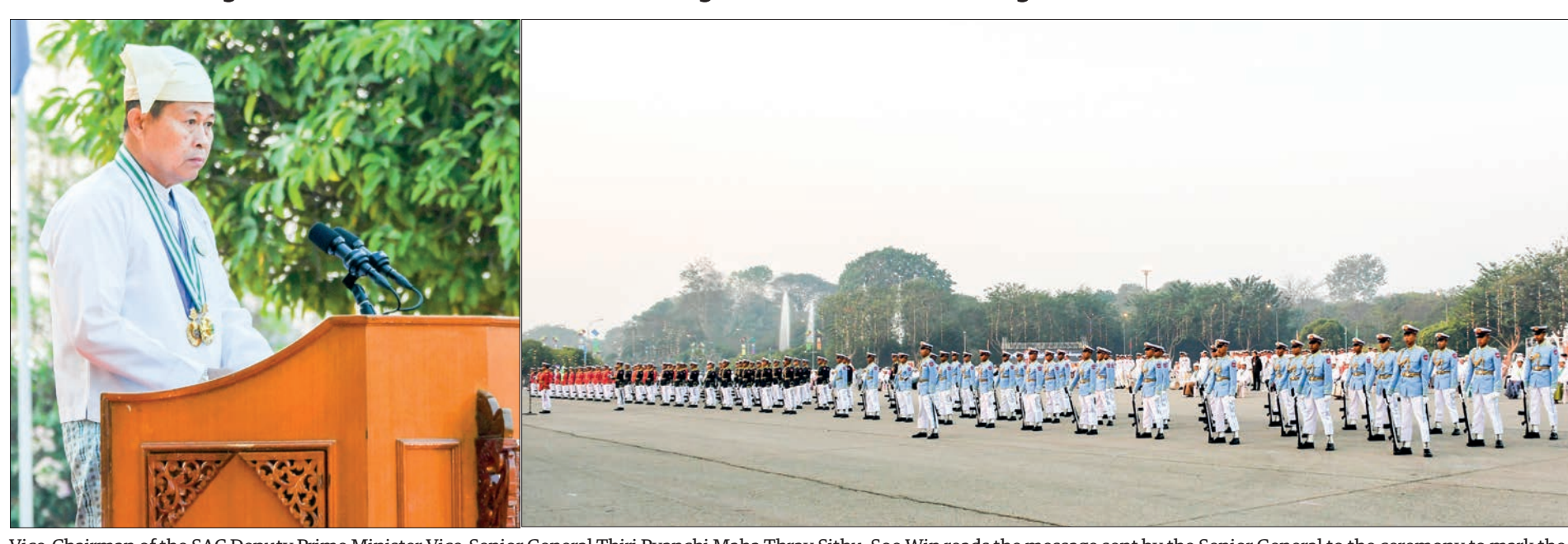
Vice-Chairman of the SAC Deputy Prime Minister Vice-Senior General Thiri Pyanchi Maha Thray Sithu Soe Win reads the message sent by the Senior General to the ceremony to mark the 76th Anniversary of Union Day 2023 at the ceremony to hoist the State flag in commemoration of the 76th Union Day 2023 on 12 February in Nay Pyi Taw.

A ceremony to hoisting the State flag in commemoration of the 76th Anniversary of Union Day 2023 was held in conjunction with the State flag saluting ceremony on the square in front of the Nay Pyi Taw City Hall yesterday morning, attended by Vice-Chairman of the State Administration Council Deputy Prime Minister Vice-Senior General Thiri Pyanchi Maha Thray Sithu Soe Win who read the Union Day message sent by SAC Chairman Prime Minister Senior General Thadoe Maha Thray Sithu Thadoe Thiri Thudhamma Min Aung Hlaing.