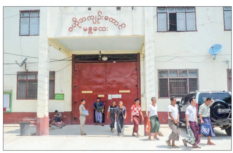
Some prisoners released from Mandalay Central Jail.

purchase the ration rice—16,308 bags for Ayeyawady Region, 32,382 bags for Bago Region, 12,210 bags for Magway Region, 17,984 bags for Taninthayi Region, 9,498 bags for Rakhine State and 17,780 bags for Kachin State. — TWA/KZW