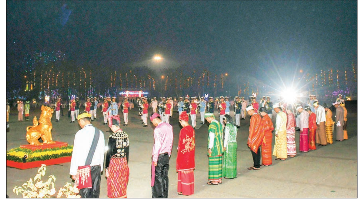
The ethnic nationals together with Guard of Honour are pictured in saluting the State Flag.

The ceremony was also attended by Union ministers, the auditor-general of the Union, the chairman of Union Civil Service Board, the chairman of Nay Pyi Taw Council, officials, cultural troupes and guests. -MNA/TTA