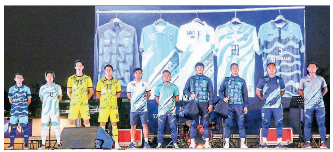
Yangon United players show off their team kits during the 2023 Kits Launching Ceremony.