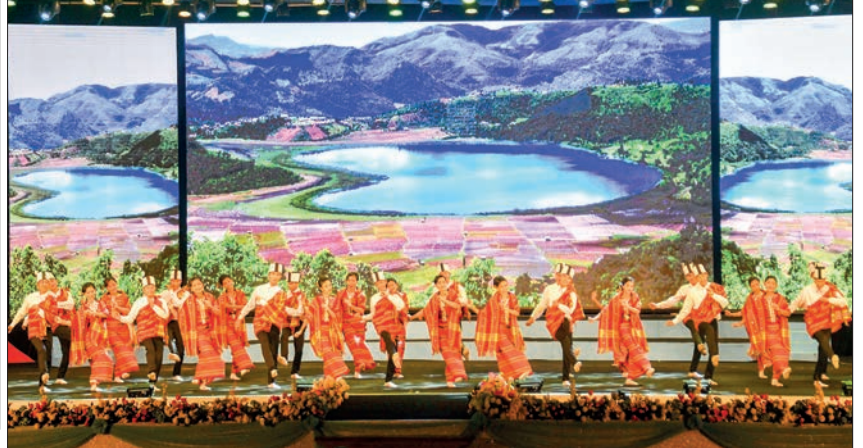
The ethnic cultural troupes perform dances at the dinner event.

General and wife viewed entertainments on ethnic traditional dances of cultural troupes and artistes of Fine Arts Department at the open-air theatre.