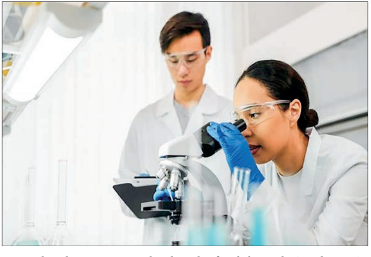
Researchers have overcome the obstacle of scale by analyzing electronic health record data.

In a new study led by Children's Hospital of Philadelphia (CHOP) and Nemours Chil-