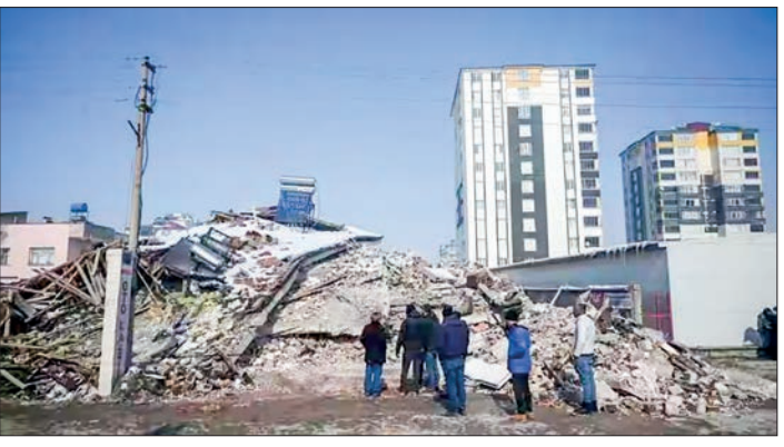
Rescue efforts underway in Türkiye.

Insured losses will be much lower, possibly around $1 billion, due to low insurance coverage in the area, it added.—AFP