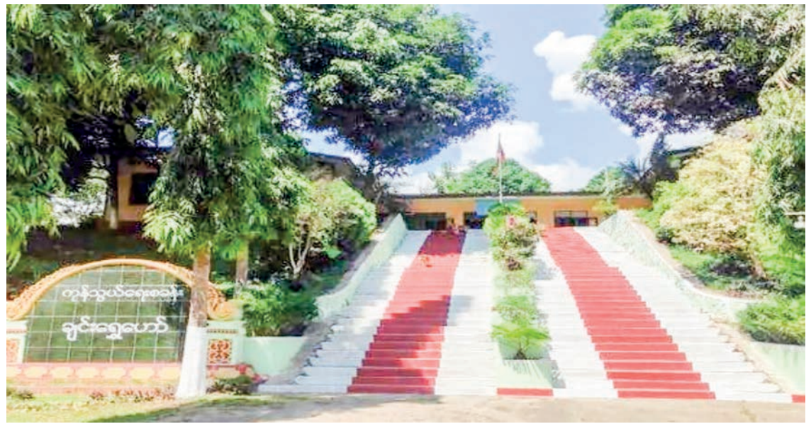
The photo shows a signboard of the Chinshwehaw border trade camp.

MYANMAR conducted trade worth US$52.455 million with neighbouring countries through the Chinshwehaw border in January 2023, statistics released by the Ministry of Commerce indicated.