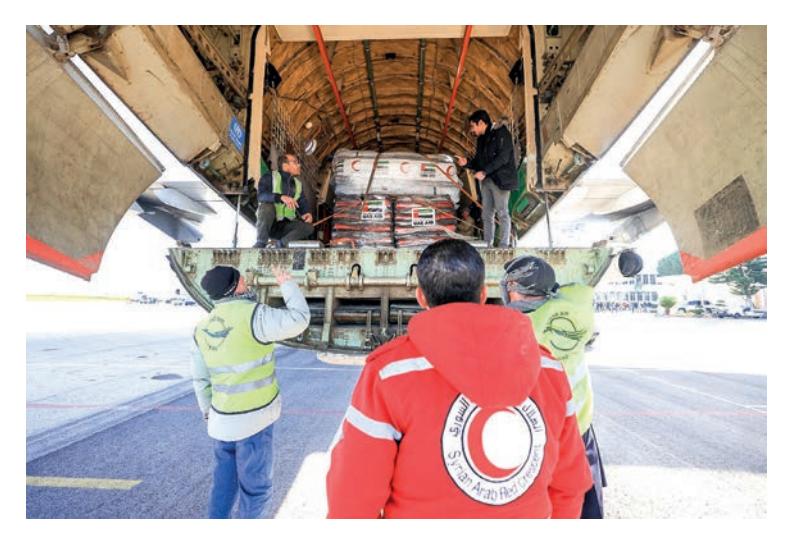
Workers unload aid from the United Arab Emirates at the Bassel al-Assad international airport in Syria's Mediterranean port city of Latakia on 11 February 2023.

"The compounding crises of conflict, Covid, cholera, eco-