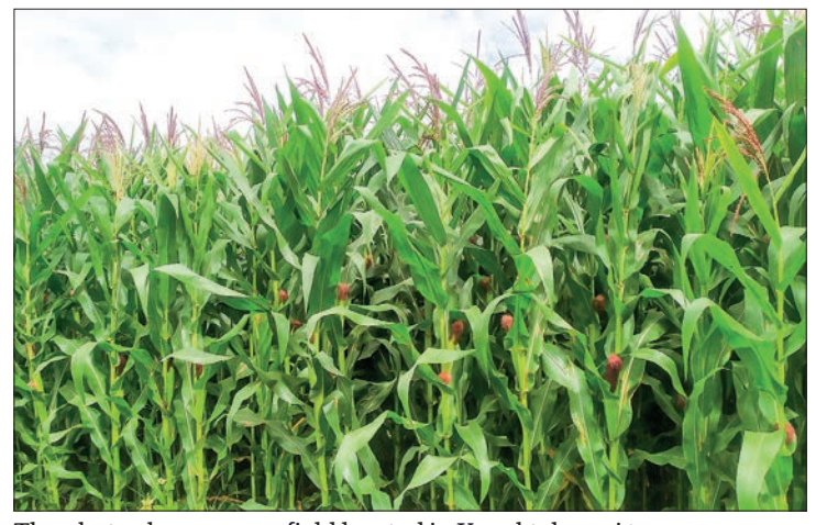
The photo shows a corn field located in Kyauktalongyi town, southern Shan State.

The overall export volumes were over 85,585 tonnes with an estimated value of $25.72 million in January 2023. The volume was down by over