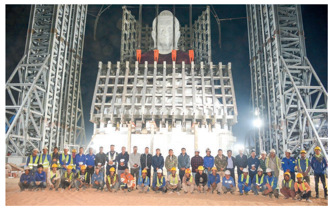
The Maravijaya Buddha Image is seen after all parts 1, 2, 3 and 4 have been placed on the jewelled throne yesterday.

Construction tasks are being carried out for a Sasana Beikman to accommodate 1,200 members of the Sangha and congregation at religious ceremonies and other religious edifices in the Buddha Park. In accord with the guidance of venerable Sayadaws, Pitaka treatises in line with the version adopted by the Sixth Buddhist Synod are being carved on the marble plaques in Pali and Romanized languages with the use of modern machinery in order to keep the stone plaques. The already-carved inscriptions on Tri Pitaka, Atthakatha and Tika treatises were posted in front of the Buddha image. Arrangements are being made for pilgrims to view the Atthakatha and Tika treatises of the Tri Pitaka treatises in the stone inscription chamber. Moreover, a plan is underway to print the Pitaka treatises in