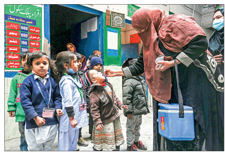
A health worker administers polio vaccine drops to a child at a school during a vaccination campaign in Lahore on 16 January 2023.

The first positive sample of 2023 was detected on 19 January and was found genetically linked to the poliovirus detected in Afghanistan's eastern Nangarhar province in November 2022, the ministry said, adding that this was the first evidence of cross-border transmission of the virus in more than a year. —Xinhua