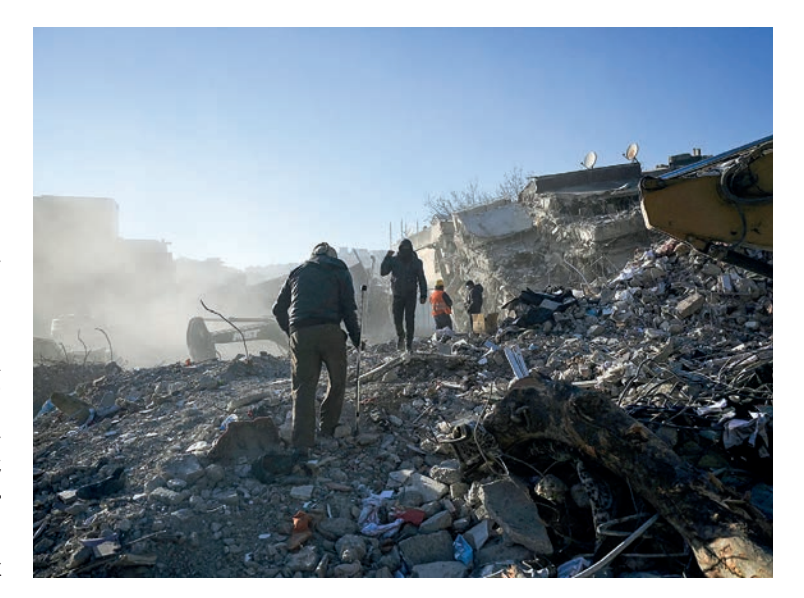
Local residents walk among rubble of collapsed buildings in Kahramanmaras on 13 February 2023 as rescue teams continue to search for victims and survivors after a 7.8 magnitude earthquake struck the border region of Türkiye and Syria.

The latest official death toll in Türkiye as of Sunday evening was 29,605 people. — Xinhua