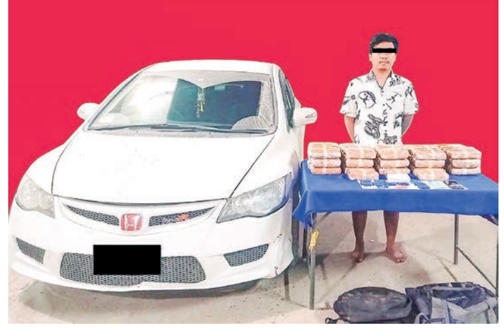
An offender is pictured along with seized drugs and a saloon.

A combined team consisting of members of the Anti-Drug Police Force searched the house