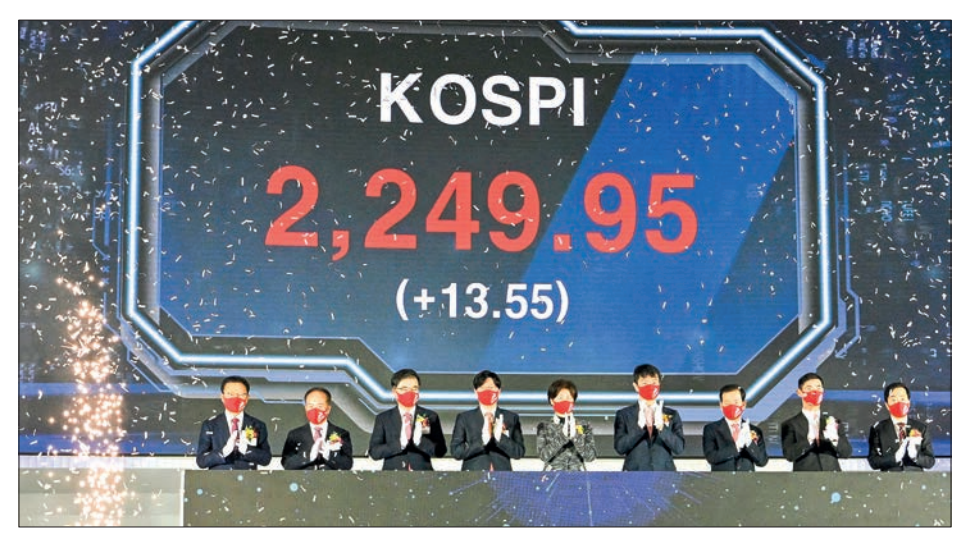
South Korean financial officers celebrate in front of a screen showing South Korea's benchmark stock index during a ceremony celebrating the New Year's opening of the South Korea stock market at the Korea Exchange in Seoul on 2 January 2023.

Offshore investors dumped a net 3.54 trillion won (2.8 billion dol-