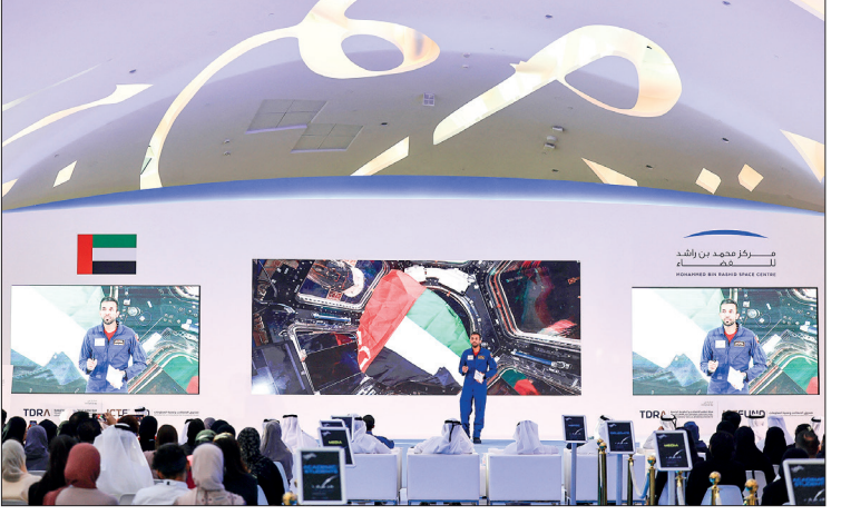
UAE astronaut Sultan AlNeyadi gives a press conference at the Museum of the Future in the Gulf emirate of Dubai on 2 February 2023.

Gulf monarchies have been seeking to diversify their energy-reliant economies through a