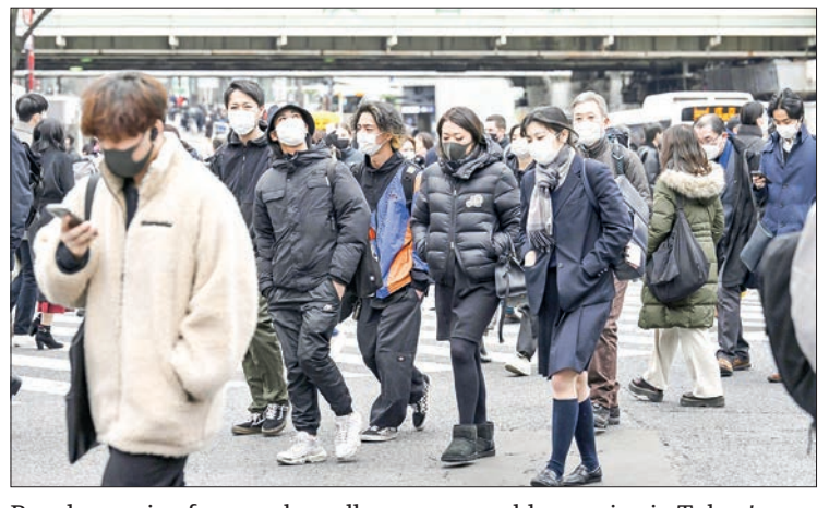
People wearing face masks walk across scramble crossing in Tokyo's Shibuya district on 27 January 2023.

THE Tokyo metropolitan government said new cases of novel coronavirus infections fell below