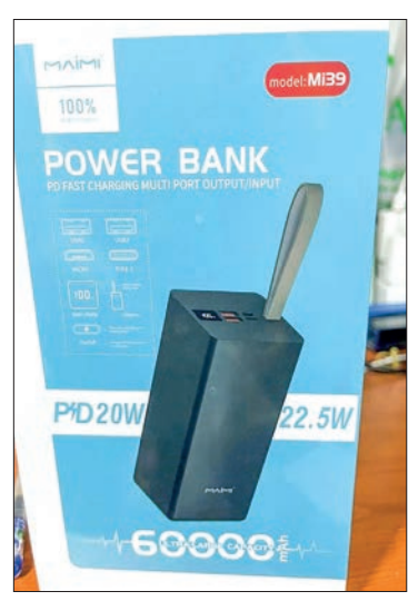
Confiscated illegal items in Mon

Therefore, 13 arrests (at an estimated value of K553,951,000) were made on 11 and 12 February, according to the Illegal Trade Eradication Steering Committee. — MNA/MKKS