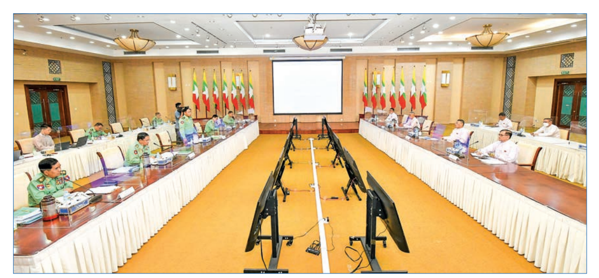
The meeting between the State Peace Talks Team and the New Mon State Party delegation is in progress.

THE meeting between the State Peace Talks Team (SPTT) and the delegation led by the Vice-Chairman of the New Mon State Party (NMSP) took place at the National Solidarity and Peacemaking Centre in Nay Pyi