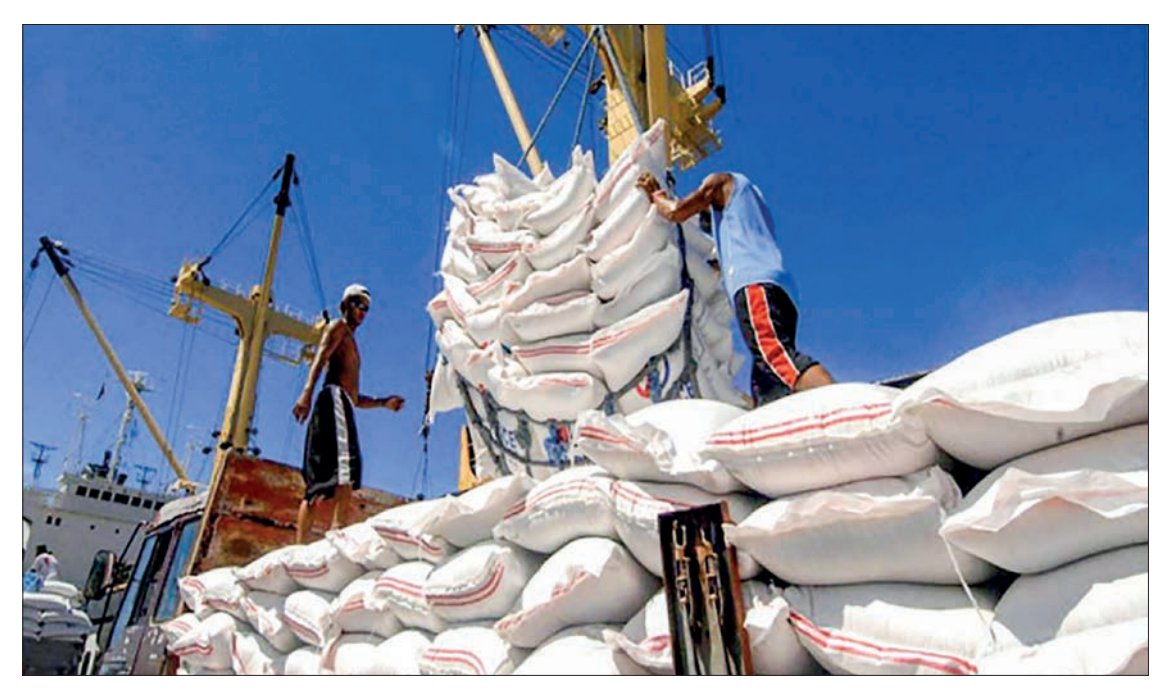
Rice bags are seen to be exported to foreign markets.

The export values were recorded at $82 million from 250,947 tonnes in April 2022, $51 million from 153,507 tonnes in May, $50 million from 146,094 tonnes in June, $66 million from 182,550 tonnes in July, $53 million from 156,893 tonnes in August, $37 million from 93,792 tonnes in September, $65 million from 163,189 tonnes in October,