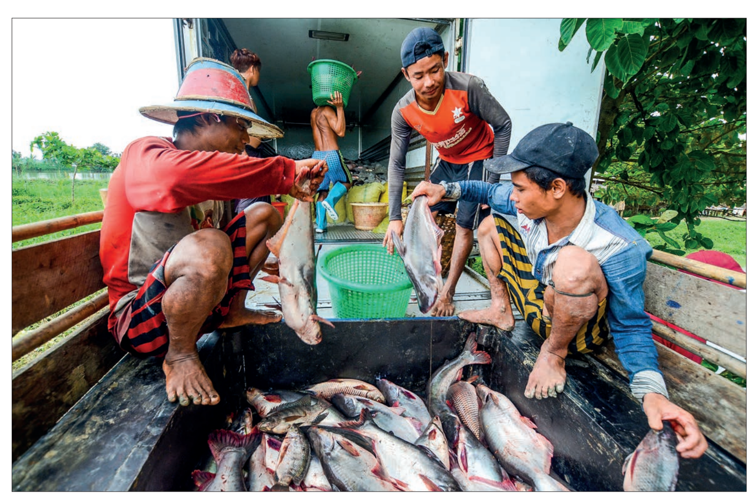
Out of Myanmar's marine products, 70 per cent of saltwater fish and prawn and 30 per cent of freshwater fish/prawn are exported and the country has 400,000 acres of freshwater farming and over 100,000 acres of saltwater farming. Varieties of fish are pictured being conveyed from fish farms to cold storage factories.

The feed is crucial in breeding farms and the by-products of winter sunflower, bean and summer paddy being cultivated