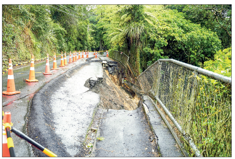
A general view of a damaged road after a storm battered Titirangi, a suburb of New Zealand's West Auckland area, on 13 February 2023. Thousands of homes in New Zealand were without power and flights were grounded Monday as a tropical storm lashed the north of the country.

metres (87 miles) per hour battered the Northland region, while Auckland's harbour bridge