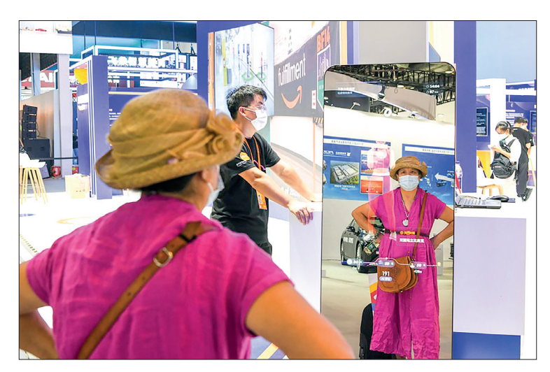
A visitor tries an AI exercise device at the China National Convention Centre during the 2022 China International Fair for Trade in Services (CIFTIS) in Beijing, capital of China, 3 September 2022.

BEIJING had 1,048 major artificial intelligence (AI) companies as of October 2022, accounting for 29 per cent of the national total, according to a report on the cap-