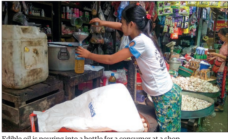
Edible oil is pouring into a bottle for a consumer at a shop.

If those edible oil retailers and wholesalers are found