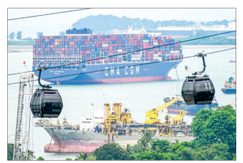
A container vessel anchored out past the Pasir Panjang terminal port is seen behind cable car cabins in Singapore on 17 June 2022.