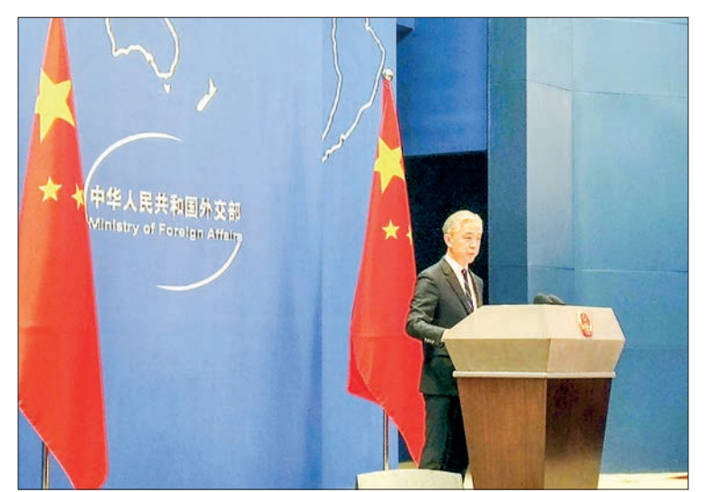
Chinese Foreign Ministry spokesman Wang Wenbin speaks at a press conference on 13 February 2023, in Beijing.

The Cambodian government accused the VOD radio of broadcasting an "intentionally slanderous" article pertinent to the country's recent relief aid to the earthquake-hit Türkiye. —Xinhua