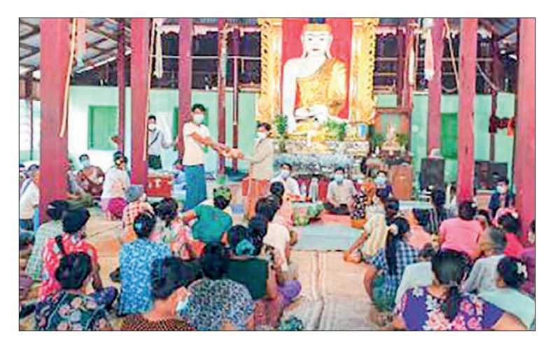
Loans from the Myaseinyaung Project fund were distributed to villagers in Kawhmu Township Yangon Region, 14 June 2022.