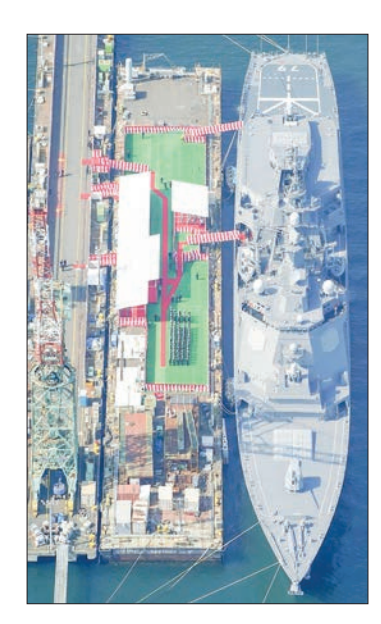
According to the Defence Buildup Programme, the Japan Maritime Self-Defence Force (JMSDF) will increase the number of Aegis destroyers (DDG) from the current eight to ten.

Currently, two Maritime Self-Defence Force ships equipped with the Aegis missile defence system are stationed at the Yokosuka naval base in Kanagawa Prefecture. Two others are based at Maizuru base in Kyoto Prefecture