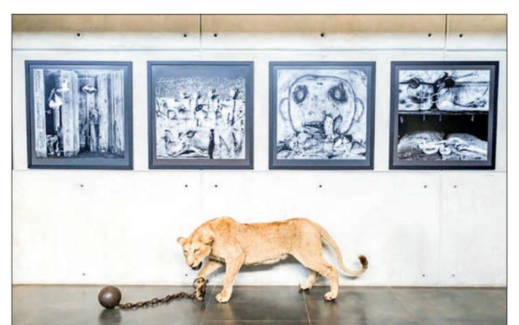
The 'End Of The Game' display is the first to be hosted in Roger Ballen's newly opened Inside Out Centre.

"If you look at the history of humanity, it's just been a destruction of nature, the destruction of wildlife," said Ballen, a New York native, who has lived and worked in South Africa for almost 40 years.—AFP