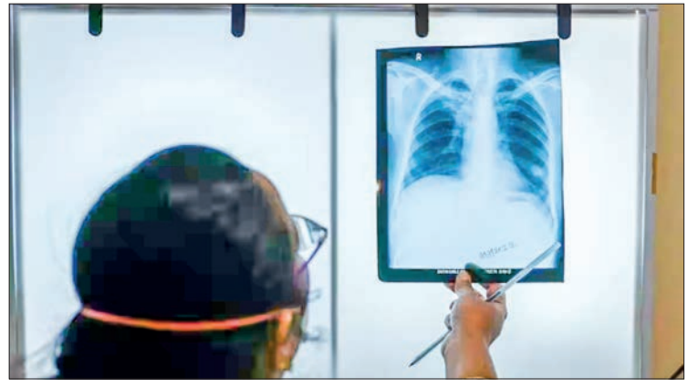
India accounted for nearly 29 per cent of 10.6 million tuberculosis cases worldwide, according to the World Health Organization's (WHO) 2022 Global TB report, a major public health problem as it struggles with drugresistant strains.

Johnson and Johnson had applied to extend its patent on the drug bedaquiline until 2027 after it was challenged by two tuberculosis survivors in Mum-