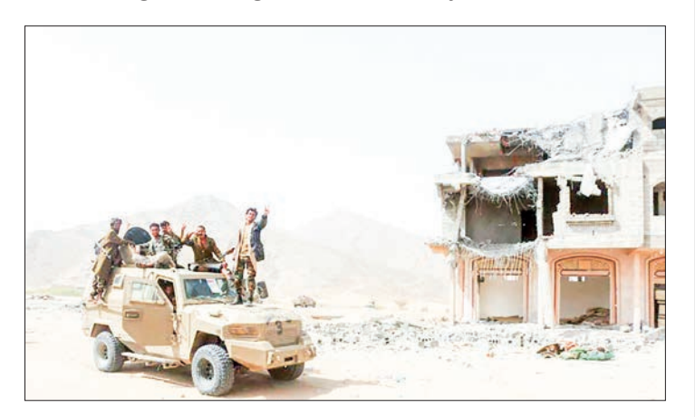
Vehicles and fighters of UAE-trained troops of the Giants Brigade patrol at the Harib junction of the Bayhan district in Yemen's Shabwa governorate, 19 January 2022.

Despite recent diplomatic efforts towards peace, heavy clashes between the Yemeni army and the Houthi militia were reignited in Marib during the past three days, with Tuesday's overnight fighting in Harib leaving 19 people from both sides killed, and several others injured. — Xinhua