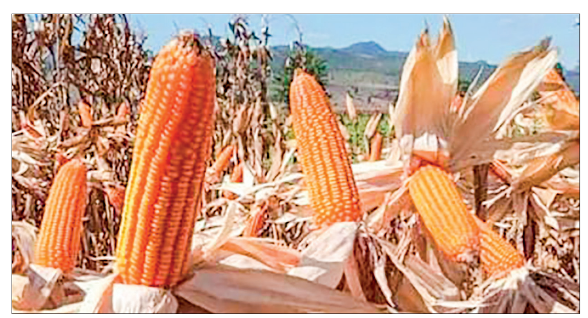
At present, corn is cultivated in Shan, Kachin, Kayah and Kayin states and Mandalay, Sagaing and Magway regions.

YANGON Region Chamber of Commerce and Industry (Bayint Naung commodity centre) saw a downward trajectory in prices of corn, according to