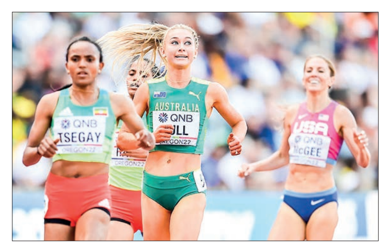
World Athletics' decision to exclude transgender women was based "on the overarching need to protect the female category".