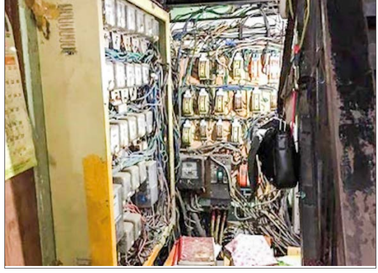
Panels of meter boxes are seen at one of the apartments.

The illegal use of power is the illegal connection to power lines, direct connection without a meter box, reduction of consumption with a meter box, using bypass circuit, the wiring on input/output cables, reverse installation of input/output cables, cable extension, using power for business from the general meter and home-use meter, using the power of small-scale industry and lump sum meter beyond the energy load limit, illegal power