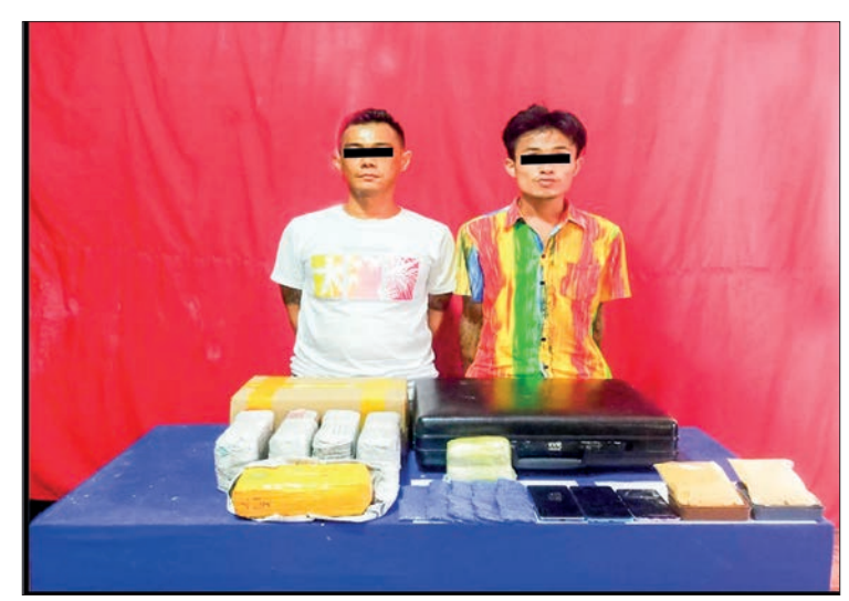
Two offenders are pictured together with seized drugs.

Offenders are prosecuted under the Narcotic Drugs and Psychotropic Substances Law. — MNA/MKKS