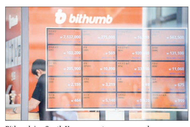
Bithumb is a South Korean cryptocurrency exchange.

cases in Montenegro – the first involving his alleged possession of forged doc-