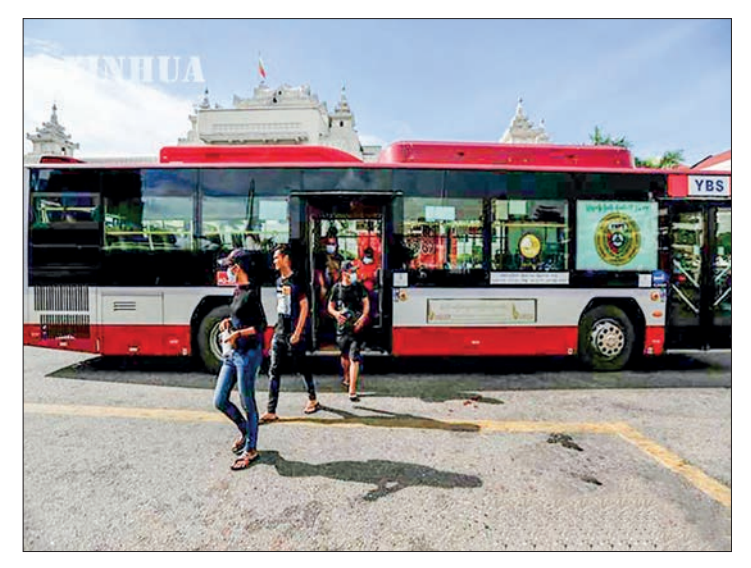
Commuters are seen getting off from the YBS bus in Yangon.

The bus line and bus line numbers that will be operated by day during Thingyan can be accessed on the website page and Facebook page of the Yangon Region Public Transport Committee-YRTC. — TWA/