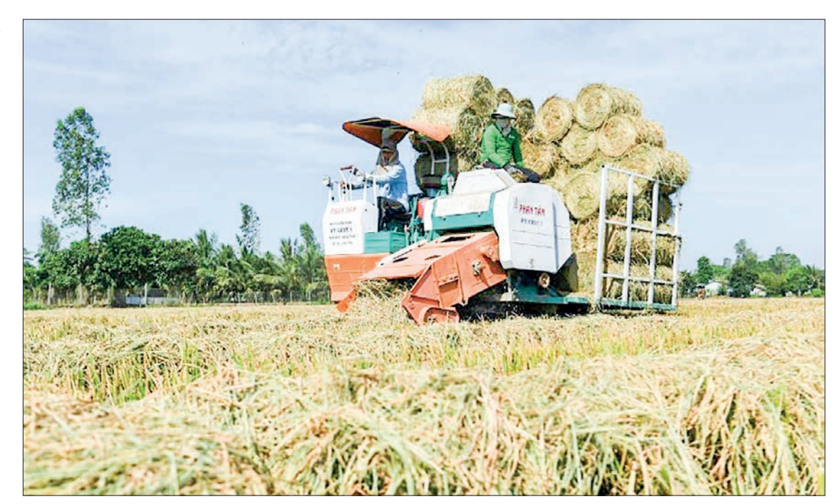
Farmers use a roller to collect straw in a field in Can Tho.

Many of the initiatives are not new but have been spotlighted since around 100 countries signed the Global Methane Pledge two years ago, agreeing to