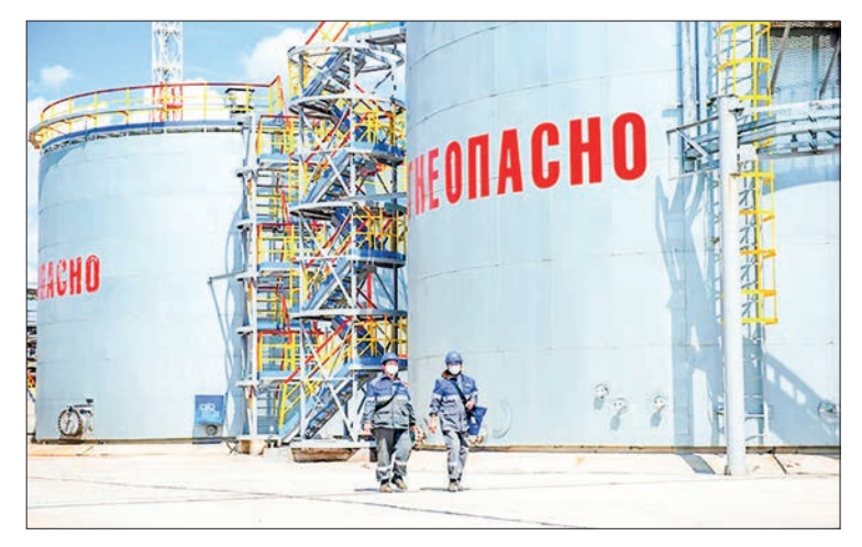
Moscow plans to cut output by 500,000 barrels per day in March in response to Western sanctions.

side pressure on Russia is not weakening," he said.