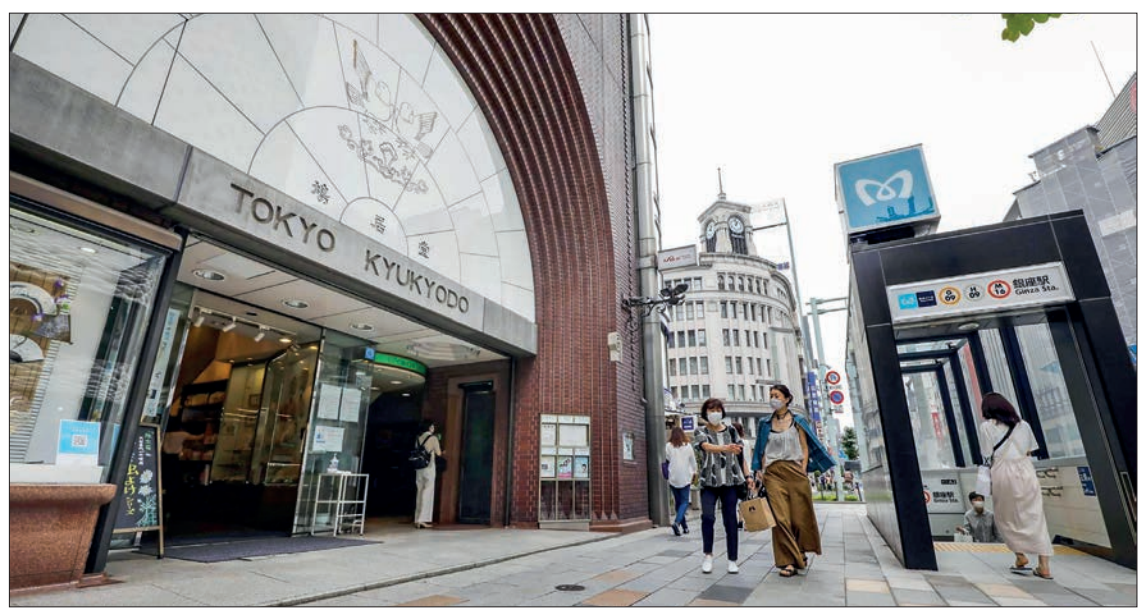
Ginza is the name of a district in central Tokyo. It is a vibrant shopping area with large department stores and several famous brands.

The 3.1 per cent rise is above the Bank of Japan's two-per cent target but remains lower than the sky-high inflation seen in the United States and elsewhere. — AFP