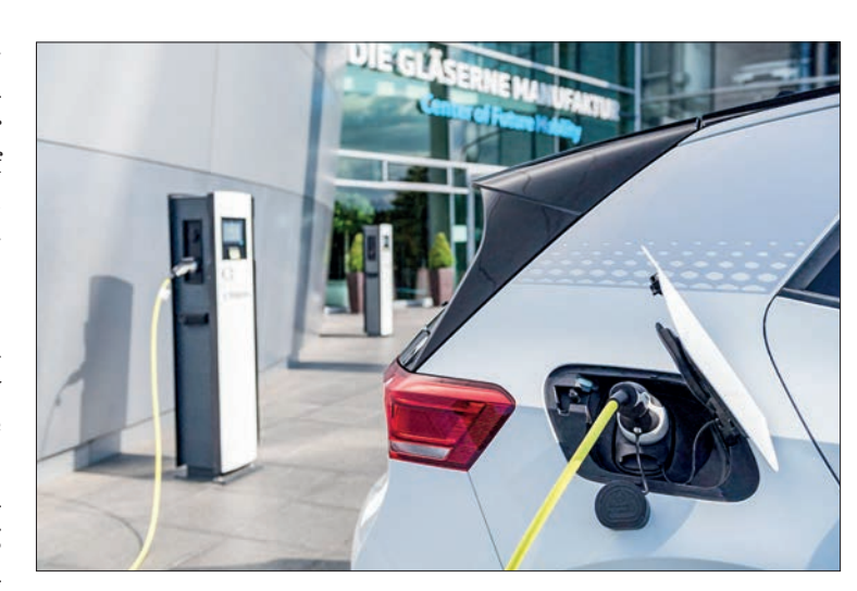
A Volkswagen ID.3 electric car being charged in Dresden, Germany, 11 September 2020.

sels provide assurances the law would allow the sales of new cars with combustion engines that