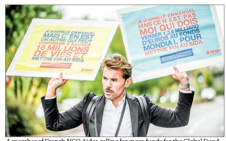
A member of French NGO Aides calling for more funds for the Global Fund to Fight AIDS, Tuberculosis and Malaria.

It is transmitted via the air by infected people, for example by coughing. It is preventable and curable. "The increase in TB deaths that we are seeing in 2021 is most likely a consequence of delay in, or lack of, TB diagnosis due to disruption to TB services during the Covid-19 pandemic, leading to increased severity of disease and an associated increase in deaths," the WHO Europe said. — AFP