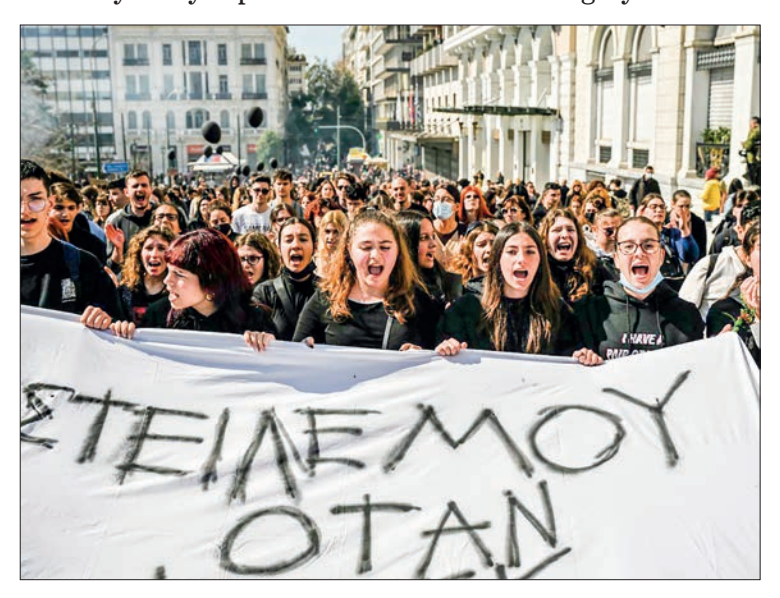
Many protesters urged the government of Prime Minister Kyriakos Mitsotakis to resign over what is the country's deadliest rail accident.

on Greek trains run by an Italian state company in the wake of last month's rail tragedy.