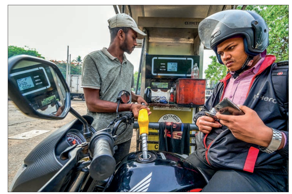
A worker fills petrol in an motorbike at a fuel station on 21 March 2023.

The foreign companies will be each allocated 150 dealer-operated fuel