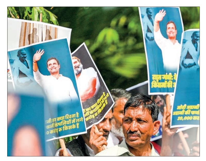
India's Congress party activists and supporters protest against conviction of Congress party leader Rahul Gandhi in a criminal defamation case, in New Delhi on 26 March 2023.

Gandhi's expulsion from the parliament was a result of an order by a court in the western state of Gujarat sentencing him to a two-year imprisonment in a defamation case wherein he had passed certain objectionable comments against the community that Modi belongs to. — Xinhua