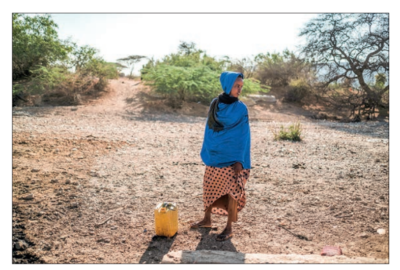
A woman stands next to a jerrycan of water at the village of El Gel, 8 kilometres from the town of K'elafo, Ethiopia, on 12 January 2023. The last five rainy seasons since the end of 2020 have failed, triggering the worst drought in four decades in Ethiopia, Somalia and Kenya.

According to the bloc, Somalia needs 1.6 billion dollars to provide food and non-food items to the drought-affected communities and the internally displaced people (IDPs); Ethiopia needs 710 million dollars to provide support to key sectoral needs in the coming four months; and Kenya requires 378