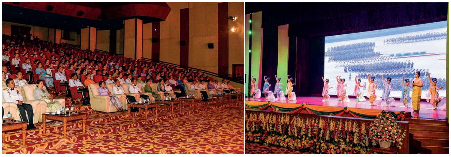
The Senior General, his wife and dignitaries watch the music and dance entertainment at the event yesterday.

After the entertainment, the Senior General and his wife presented the flower baskets to those entertainers and cordially greeted the attendees. — MNA/TTA