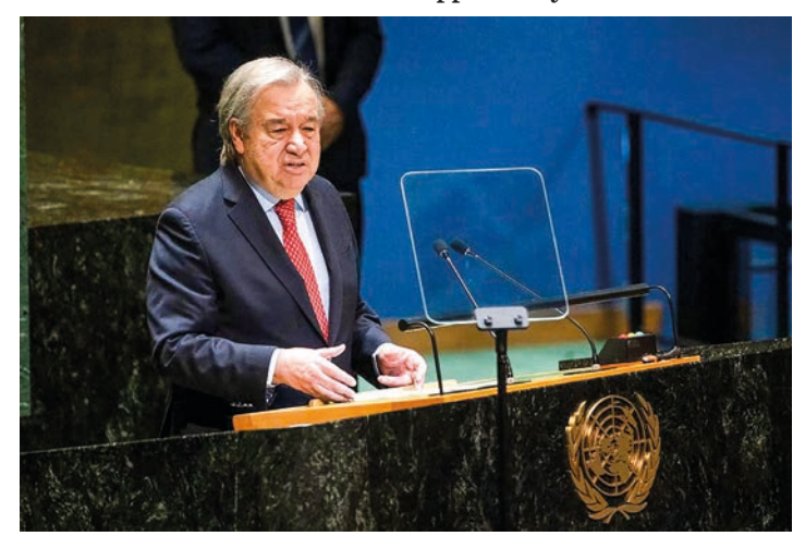
UN Secretary-General Antonio Guterres addresses a UN General Assembly event marking the International Day of Remembrance of the Victims of Slavery and the Transatlantic Slave Trade at the UN headquarters in New York on 27 March 2023.

He added that the scars of slavery are still visible in persistent disparities in wealth, income, health, education and opportunity. — Xinhua