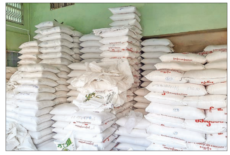
Rice bags are stacked up at the warehouse.

THE prices of rice that are mainly consumed locally spiked, according to the Wahdan Rice Wholesale Centre.