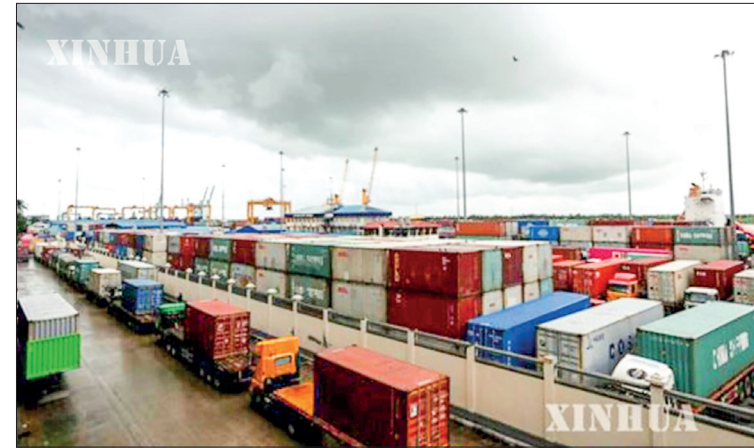
The photo shows containers piling up at the Asia World terminal in Yangon.

goods, construction materials, capital goods, hygienic materials and supporting products for export promotion and import substitution. — TWA/KK