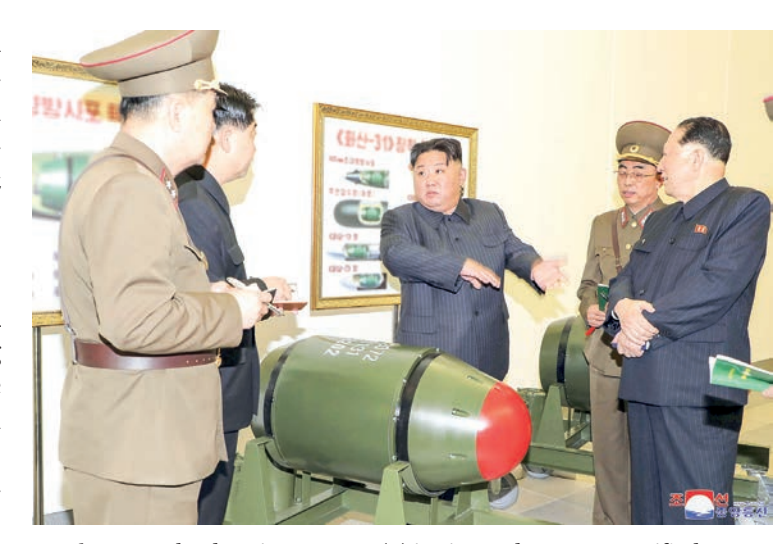
North Korean leader Kim Jong Un (C) is pictured at an unspecified location as he inspects work for mounting nuclear warheads on ballistic missiles on 27 March 2023.

Kim gave the instructions on Monday as he inspected work being done for mounting nuclear warheads on ballistic missiles, according to the official Korean Central News Agency, which released pictures of objects believed to be warheads of different types. The leader's order came as the United States and South Korea conduct joint military exercises. On Tuesday, the US nuclear-powered aircraft carrier Nimitz arrived at a port in the southern South Korean