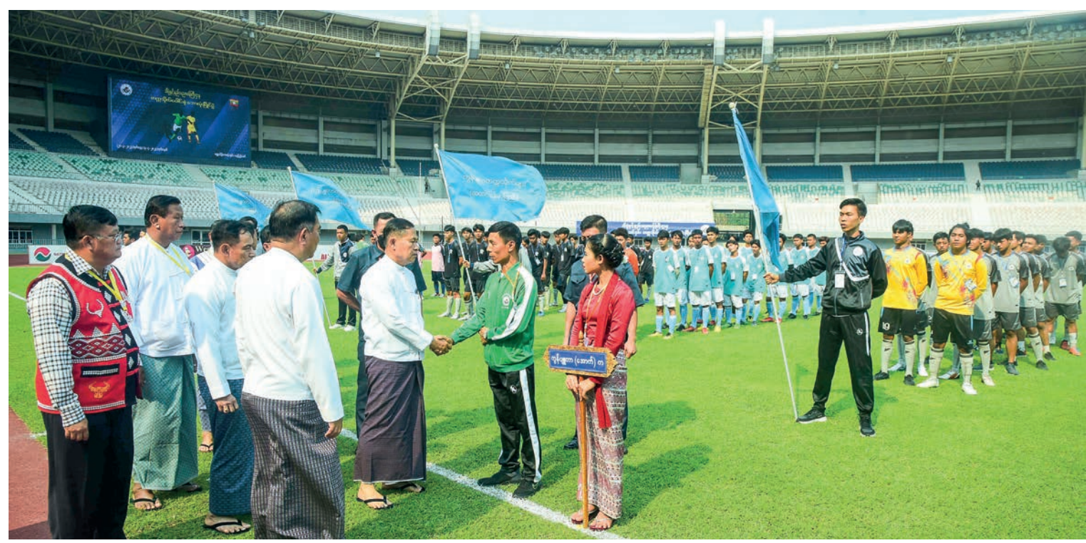
The Vice-Senior General cordially greets the contesting teams yesterday.

In Group 4, Pyay Technological University, Technological Universities (Hmawby and Toungoo) are included in the Technological University (Lower Myanmar)A team, Yangon Technological University, Technological Universities (Sittway, Pathein and Hinthada) in the B team, Technological Universities (Thanlyin, Mawlamyine