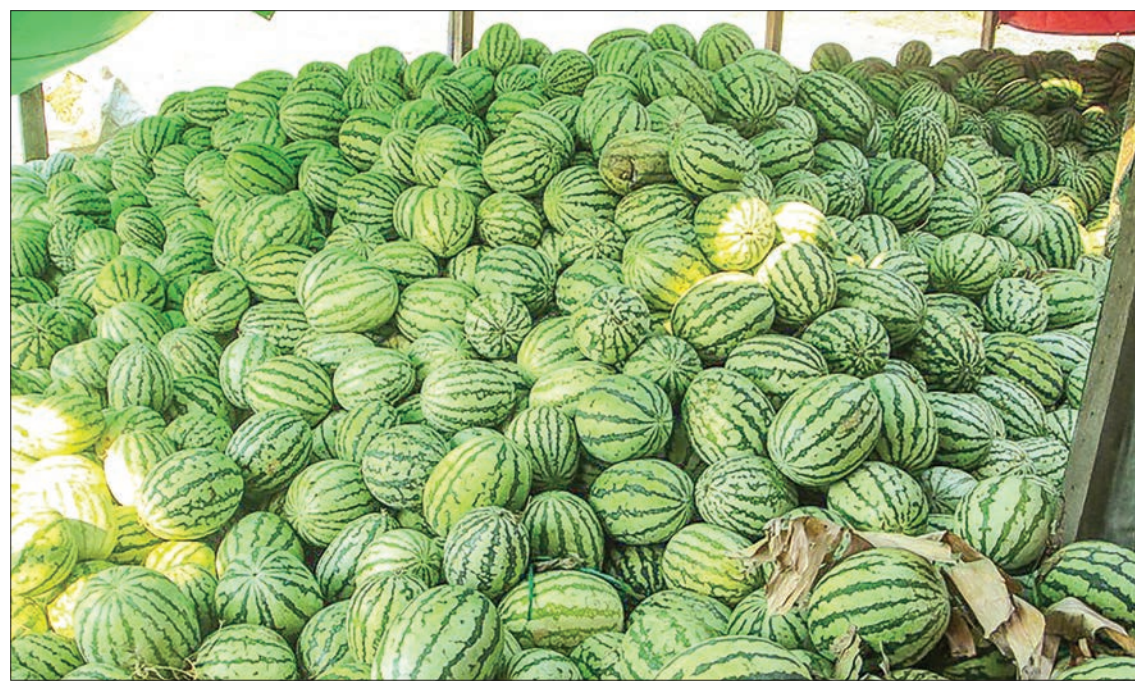
The outright purchase of a truck is estimated at over 70,000 yuan for the 855 variety watermelons and over 40,000 yuan for the Donkyithee variety.

In early February, tight inspections by Chinese Customs hindered truck transport. That being so, only 20-30 trucks were