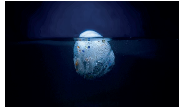
A photo taken on 8 December 2022 in Vaasa shows plastic pieces in frozen water. PHOTO: AFP

The implications are far-reaching. Like humans. birds have evolved with a vast network of microbes, including bacteria, that live in our bodies in communities called microbiomes. - AFP