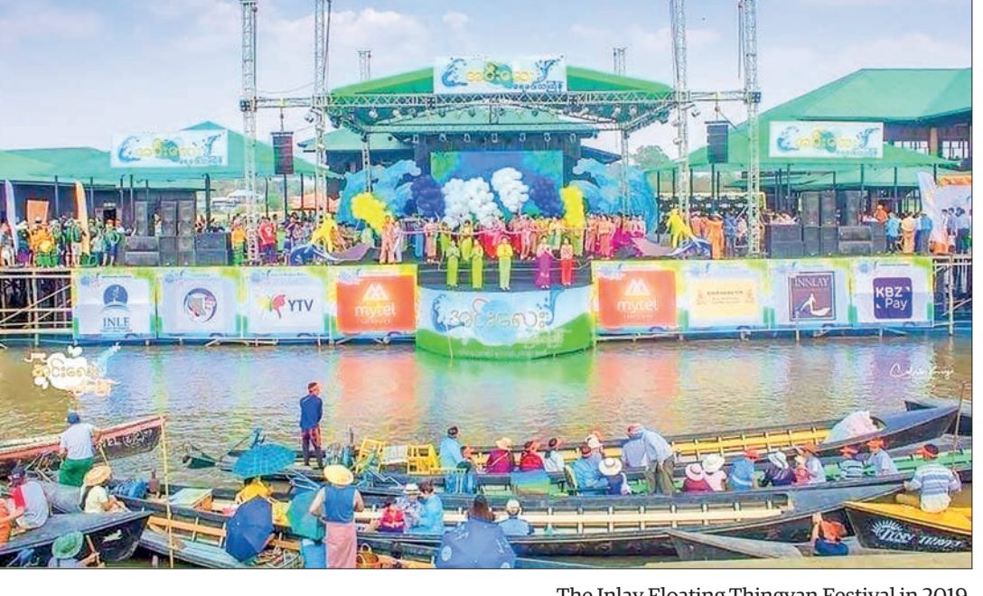
The Inlay Floating Thingyan Festival in 2019.

In addition to the floating Thingyan, the annual floating alms offering is also held from the eve of Thingyan to the first day of Myanmar New Year. — TWA/CT