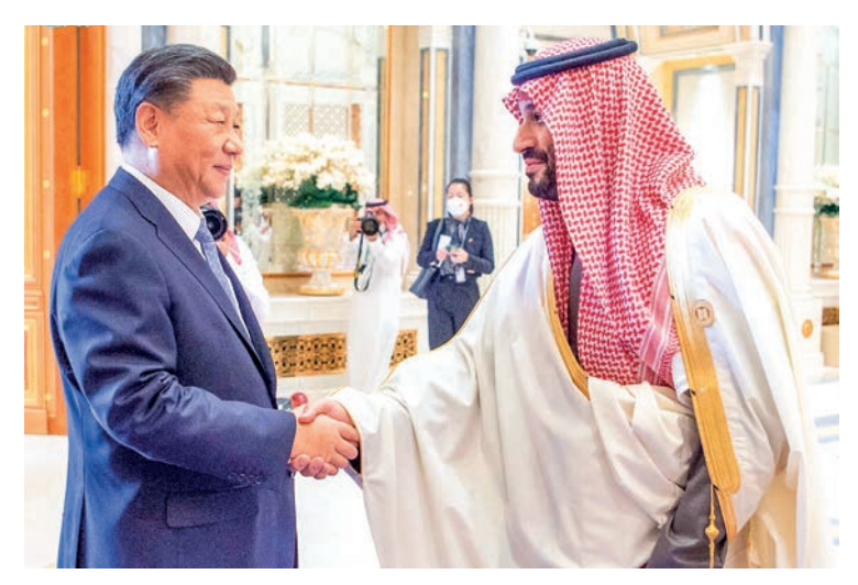
This handout picture released by the Saudi Press Agency SPA shows Saudi Crown Prince Mohammed bin Salman (R) shaking hands with Chinese President Xi Jinping during a GCC-China Summit in the Saudi capital Riyadh on 9 December 2022.

Noting that he paid a successful state visit to Saudi Arabia at the end of last year, Xi