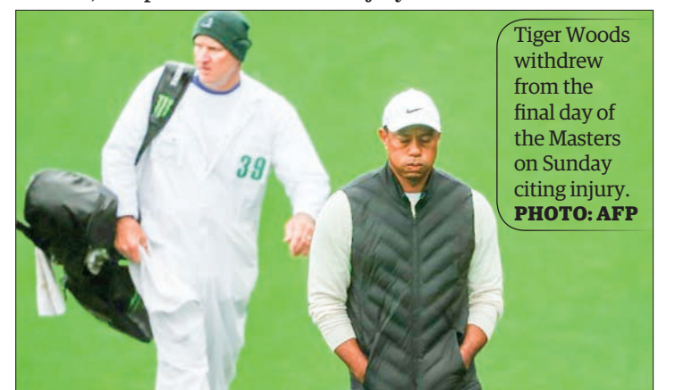
Tiger Woods withdrew from the final day of the Masters on Sunday citing injury.

"Thank you to the fans and to @TheMasters who have shown me so much love and support. Good luck to the players today!" It is the second time in the past year that Woods has been forced to withdraw from a major championship citing injury. — AFP