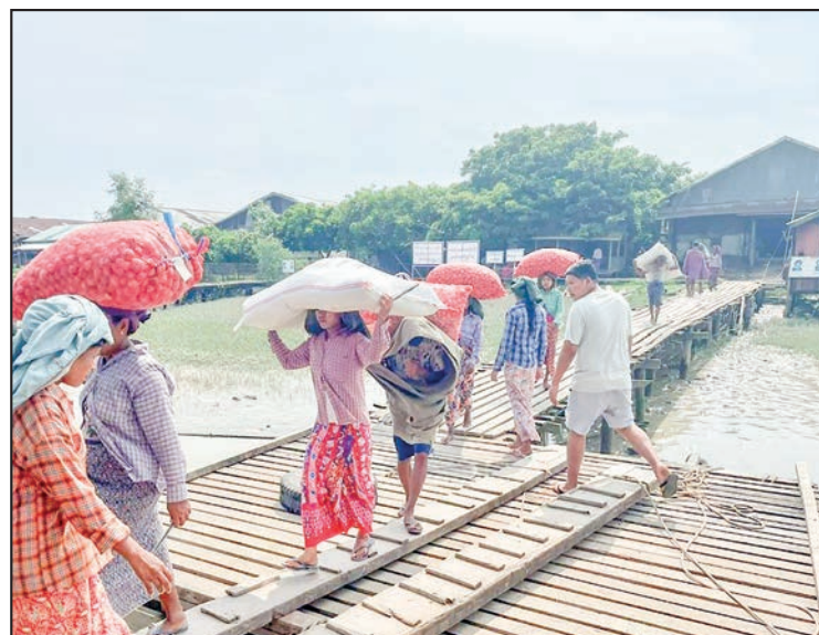
Some freight workers are seen at a port.

In the current National Planning Law, the participation ratio of the agricultural sector, the industrial sector and the service sector in the total value of gross domestic product and services in annual prices are expected to reach 2.5 per cent, 4.8 per cent and 6.7 per cent respec-