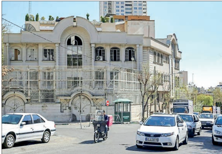
The now shuttered Saudi embassy in Tehran will soon be reopened.

The Saudi diplomatic delegation arrived in Iran to discuss the reopening of its missions after a seven-year absence,