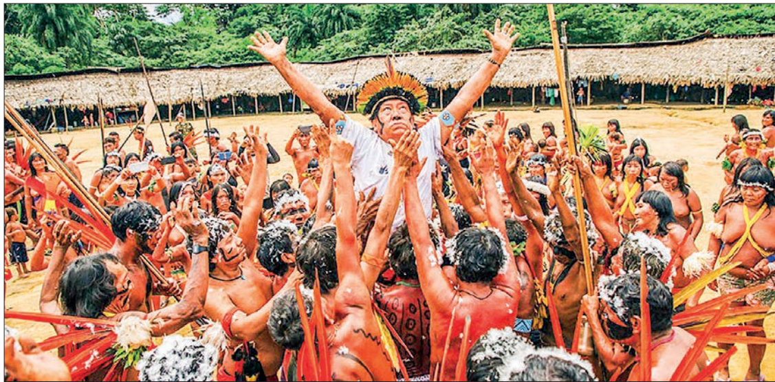
The Yanomami are a group of approximately 35,000 indigenous people who live in some 200–250 villages in the Amazon rainforest on the border between Venezuela and Brazil.

Combined analysis of 10 years of data on disease, forest cover and pollution found that each hectare of forest burned generates health costs of $2 million (1.8 million euros) a year