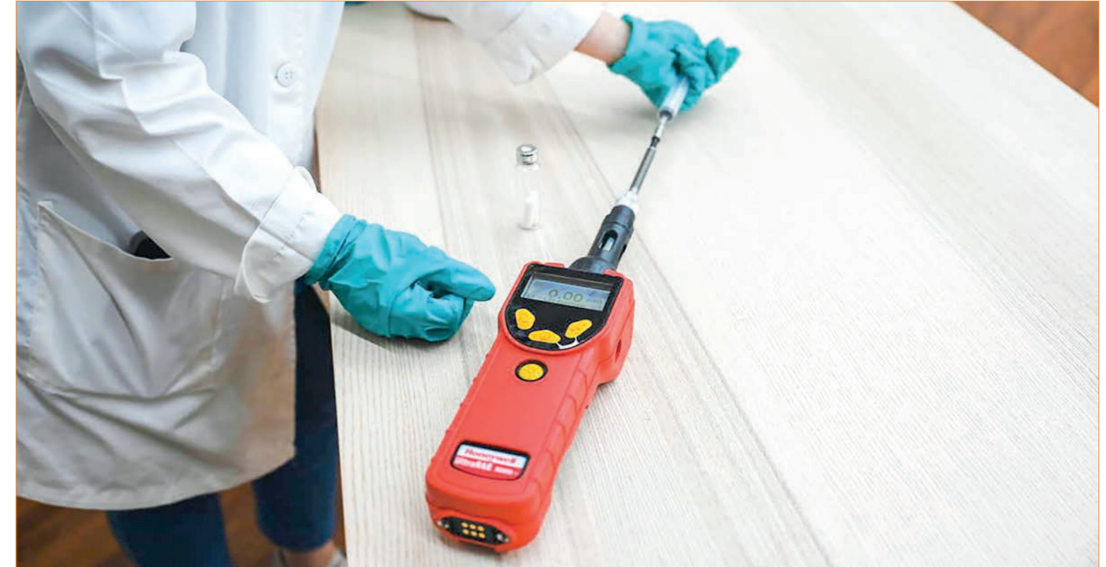
This photo taken on 1 September, 2021, shows how sweat samples are tested using a novel device that detects the COVID-19 coronavirus through specific odours, as it is being developed by Chulalongkorn University's chemistry department in Bangkok. PHOTO: FOR REPRESENTATIONAL PURPOSE ONLY/ AFP

Policy makers and programme managers must continue to implement the Region's Strategy for PHC. Of specific focus should be strengthening public health infrastructure, workforce and financing, while at the same time increasing equity for those