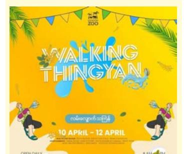
An advertisement on walking Thingyan seen at Yangon Zoological Gardens.

In addition, plans to take pictures with cute animals, game programmes and Q&A session where gifts will be awarded. Yangon Zoological Gardens will be open from 8 am to 5 pm during Thingyan period, and the entrance fee is K2,500 per adult and K1,500 per children.—TWA/KZW