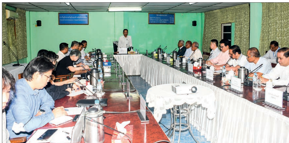
Union Minister for Information U Maung Maung Ohn speaking at the meeting to hold Myanmar motion picture outstanding awarding ceremony in Yangon on 9 April.

IT is necessary to strive for successfully holding the film outstanding awarding ceremony with goodwill, said Union Minister for Information U Maung Maung Ohn at the meeting on holding motion picture outstanding award presentation ceremony for 2019, 2020 and 2022 at the Motion Picture Promotion