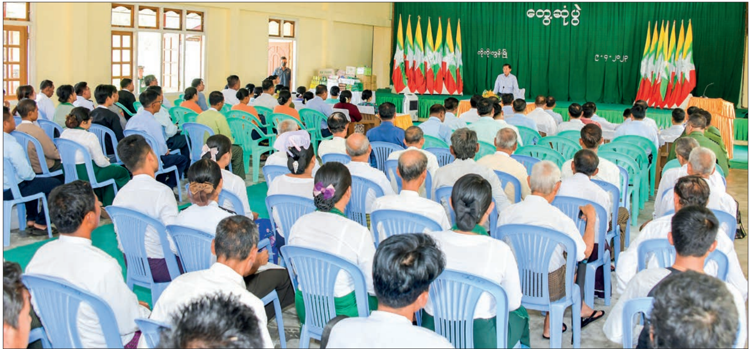
SAC Chairman Prime Minister Senior General Min Aung Hlaing meets departmental personnel, local people and town elders at City Hall of Cocogyun Township on 9 April.