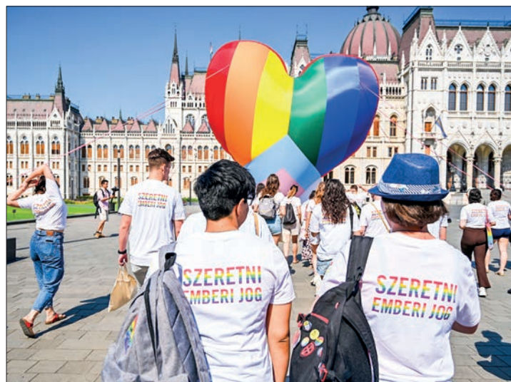
Activists wear shirts reading "Love is a human right" as they fly a giant heart balloon in rainbow colours during a flashmob in order to protest against a new law in front of the parliament in Budapest on 8 July 2021.