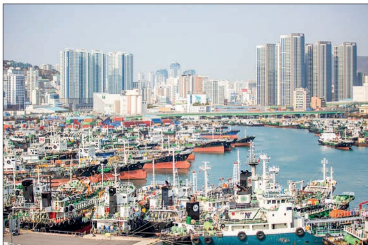
This photo taken on 7 March 2023 shows a wharf at the port of Busan, South Korea. The port of Busan is the largest seaport in the country.

from a year earlier to 50.52 billion dollars in February, while import gained 4.6 per cent to 51.82 billion dollars.