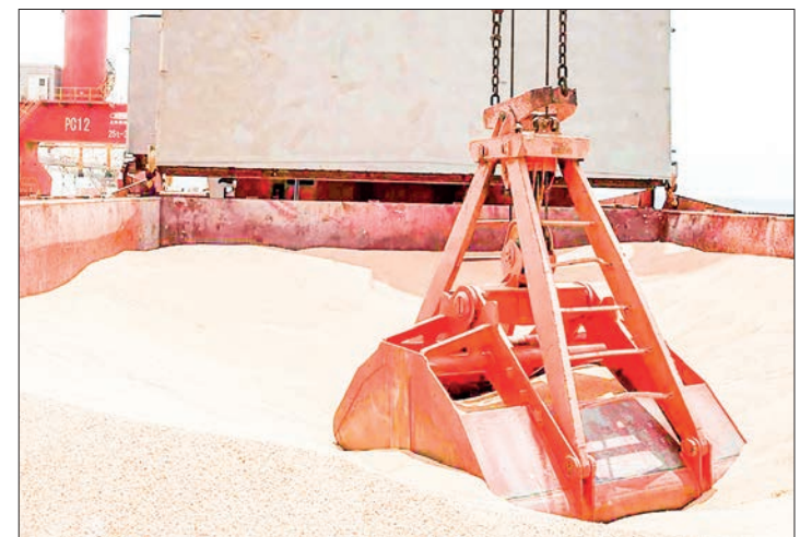
A UN-chartered ship loaded with 23,000 tonnes of Ukrainian wheat destined for Ethiopia.

"We value the continuation of the agreement which is also important in terms of reducing the global food crisis," Cavusoglu said. — AFP