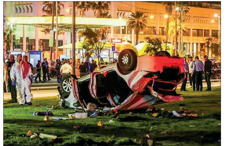
Israeli police gather next to a car used in a deadly ramming attack in Tel Aviv.

Six rockets were launched towards Israel Saturday night, with two landing in the Golan