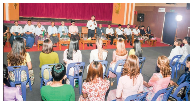
Union Information Minister U Maung Maung Ohn meets the youths who will contribute to film outstanding award presentation ceremony on 9 April.

In meeting with the youths, the Union Minister expressed his belief for emergence of famous artistes from those youths. The artistes should emphasize artistic works only, serving the interests of the State and the people. They all have to revitalize the film artistic arena. The Union Minister stressed new generation artistes have to enhance their capacity as much as possible to become successful artistes.—MNA/TTA