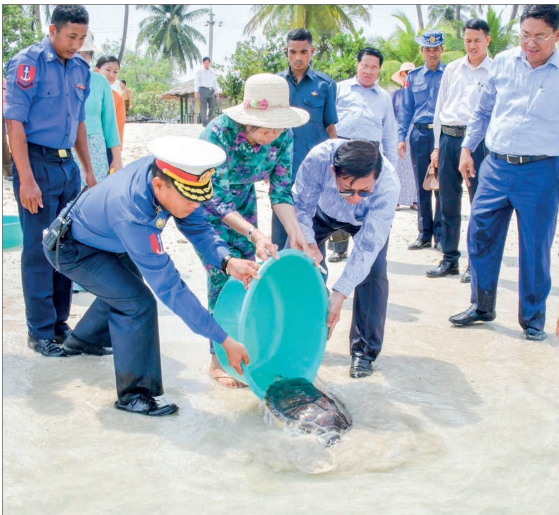
The Senior General and wife release three-year-old sea turtle into the sea in Cocogyun Township on 9 April.

local people for serving interests of the region and local people.