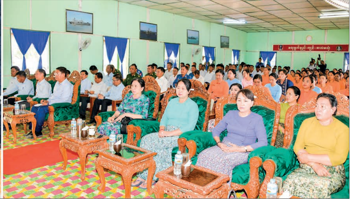
SAC Chairman Commander-in-Chief of Defence Services Senior General Min Aung Hlaing meets Tatmadaw members and families of Cocogyun Station in Cocogyun Township on 9 April.