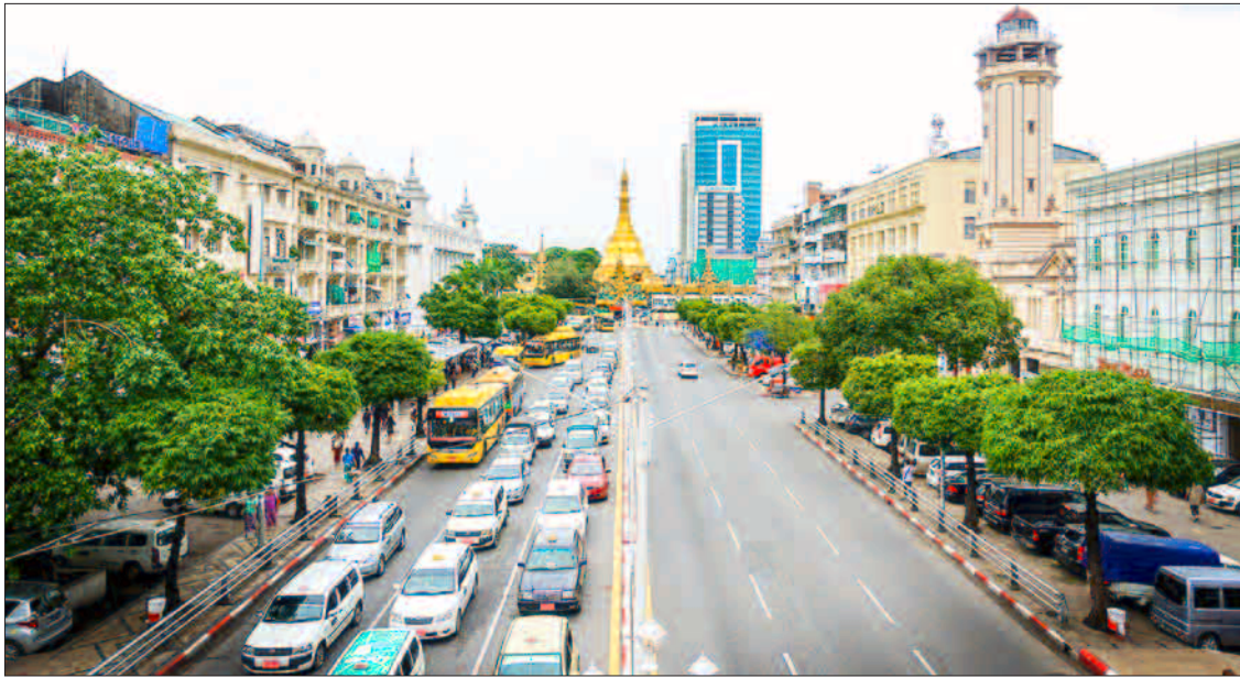
Sule Pagoda Road traffic seen on normal days.