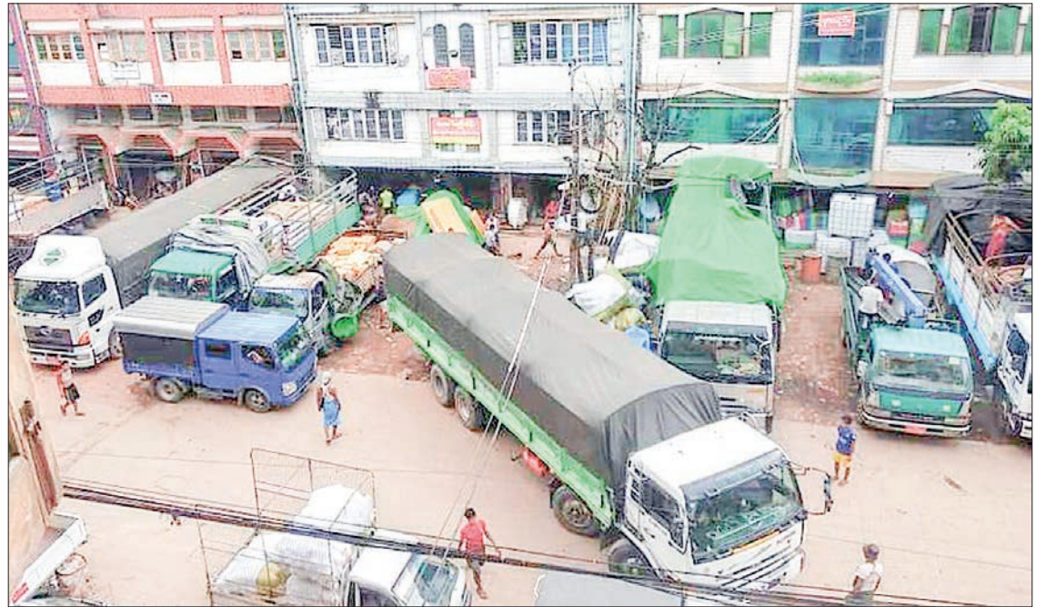
The photo shows some commodity depots at the Bayintnaung Wholesale Market.

The commodities prices are usually inflated when the Thingyan holidays approach. This year, the prices of some commodities including rice and edible oil climbed. The authorities concerned made the imports of edible oil double for food security. Nonetheless, there is a high price difference of around K2,000 per viss between the market price and the wholesale reference price. — TWA/EM