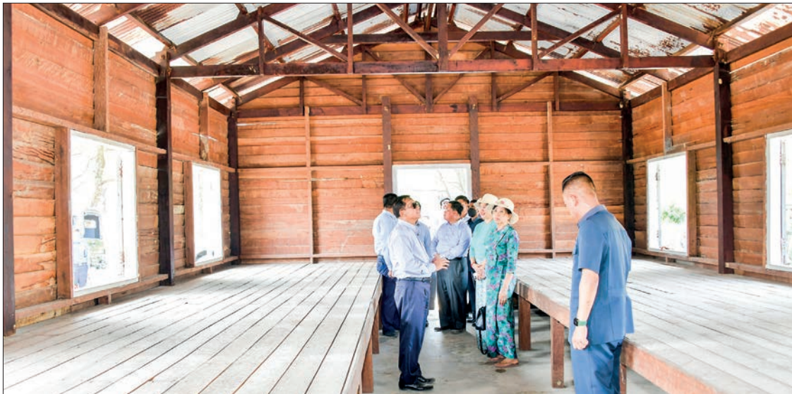
The Senior General views renovation of the old detention centre in Cocogyun in its original works yesterday.

party also viewed renovation of the old detention centre in Cocogyun in its original works.