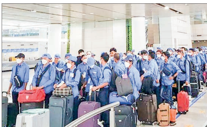
Some Myanmar workers who worked in South Korea under EPS system last year seen at Yangon International Airport.

ABOUT 280 Myanmar workers will be sent to South Korea in the last week of April, according to the Public Overseas Employment Agency (POEA).