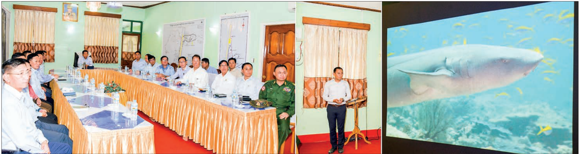
Chairman of the State Administration Council Prime Minister Senior General Min Aung Hlaing views the documentary video clip on underwater natural scenes and water creatures cast in the Myanmar seas at the local naval base yesterday.