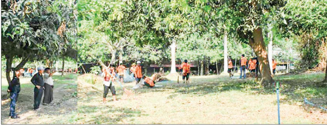
Sanitation is being carried out at People's Park in Yangon on 8 April.

YANGON City Development Committee Chairman Yangon Mayor U Bo Htay inspected the construction of pavilions, stalls, installation of sprinklers, sprinkler guns and water pipelines at the People's Square and People's Park 8 April.