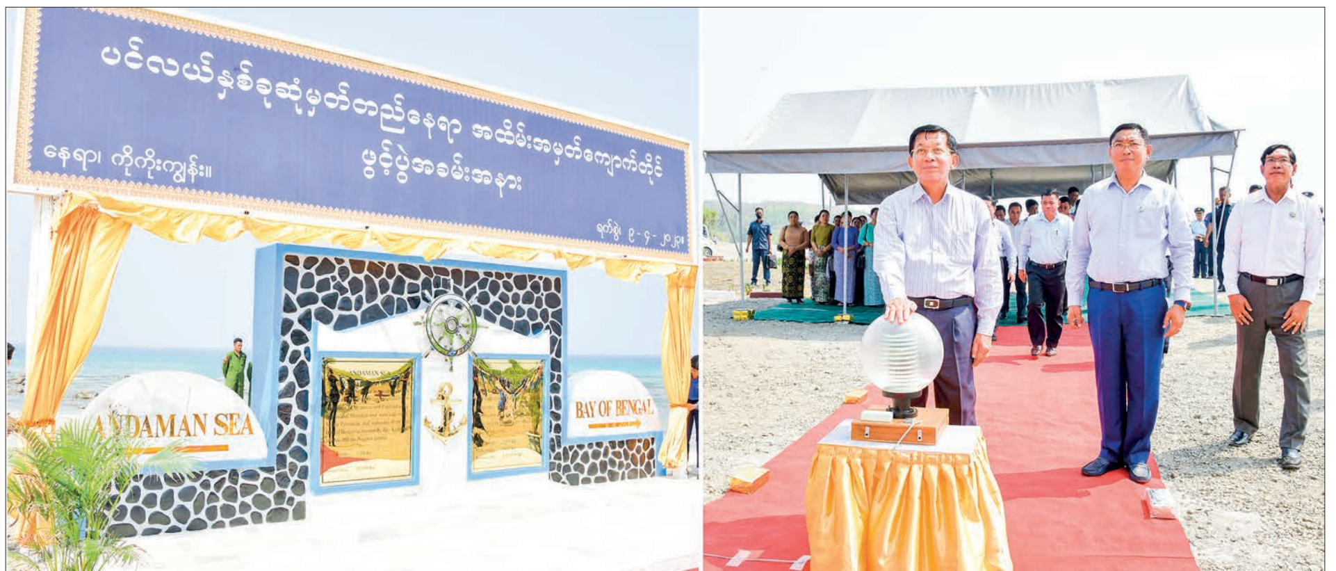
Chairman of the State Administration Council Prime Minister Senior General Min Aung Hlaing presses the button to unveil the victorious post at the focal point of the Andaman Sea and the Bay of Bengal on 9 April 2023.