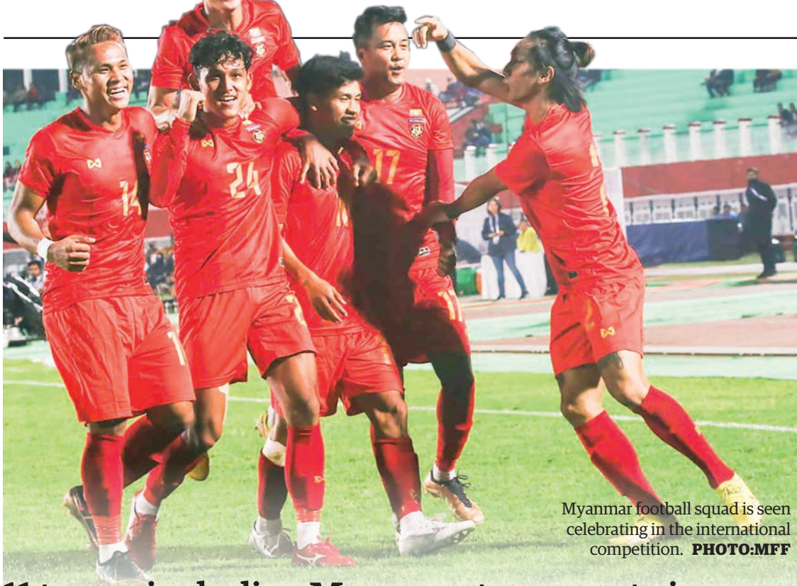
Myanmar football squad is seen celebrating in the international competition.