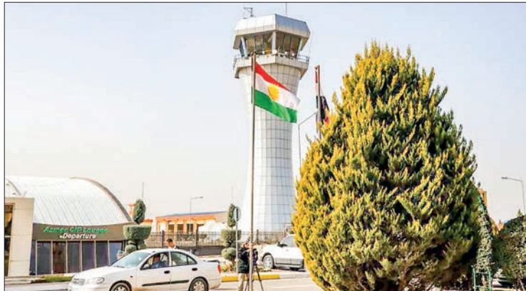
This picture shows the departure lounge and control tower of Sulaymaniyah International Airport.

"Turkish military operations against the Kurdistan region continue to take place, the last being the bombardment (Friday) against Sulaimaniyah civilian airport," Iraqi Presi-