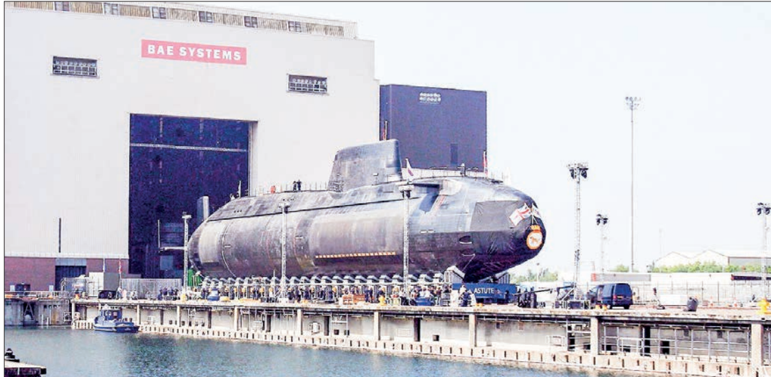
BAE Systems Submarines, is a wholly owned subsidiary of BAE Systems, based in Barrow-in-Furness, Cumbria, England, and is responsible for the development and production of submarines.

In response to a question concerning the trilateral Australia-UK-US (AUKUS) cooperation on nuclear submarines, the embassy said on Friday that such cooperation will exacerbate the resurgence of the Cold War mentality, trigger a new round of arms race, and further provoke