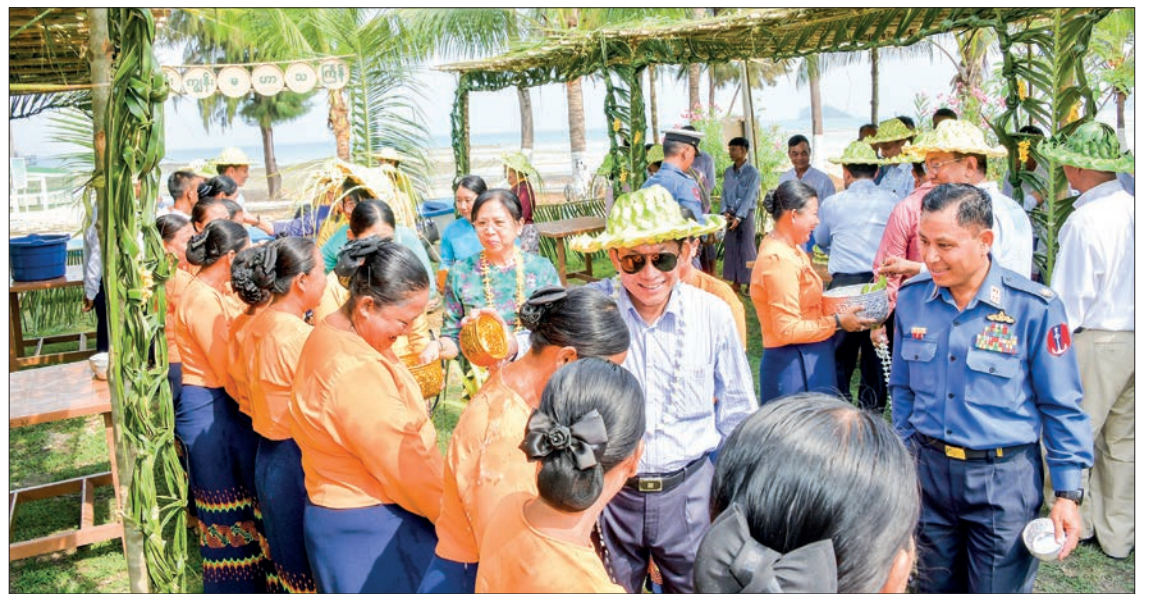
The Senior General and wife enjoy traditional Maha Thingyan festival together with Tatmadaw members and families in Cocogyun on 9 April.

The Senior General called for happily enjoying the Myanmar traditional Thingyan period and maintaining traditional culture in a systematic manner. Cocogyun region sees much progress due to concerted efforts of local people and local military units rather than assistance of the State leaders. Hence, they all have to continue further development of Cocogyun region through united strength of the