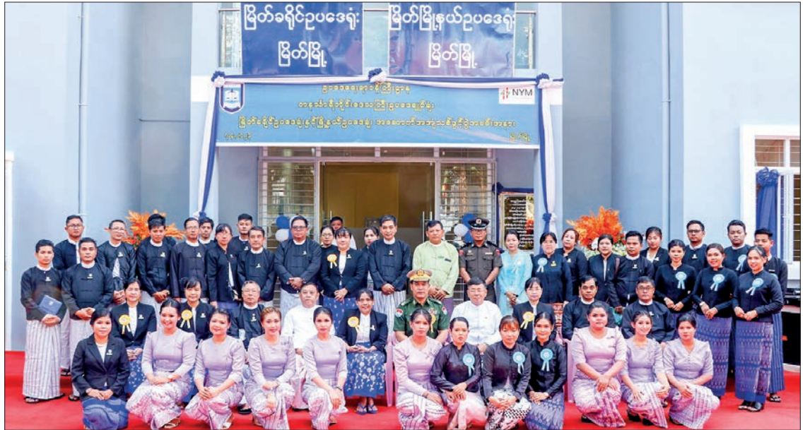
The opening ceremony of Myeik District and Township Law Office in progress on 7 April.

The Union Minister met law officers and staff in Taninthayi region, while the Regional Advocate-General explained the operations of the region. The Union Minister stressed the need for law officers to serve their duties without corruption. — MNA/KZL