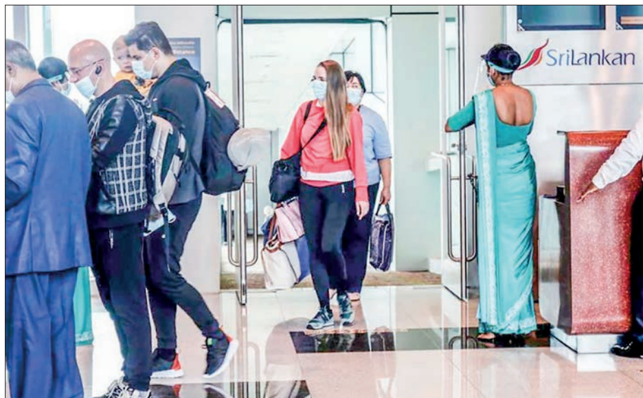
Sri Lanka earned 198.1 million dollars in March, bringing tourism earnings in the first quarter to 529.8 million dollars.

A tourism official said earlier this month that Sri Lanka's tourism industry is aiming to attract 2 million visitors in 2023, compared to the previous target of 1.5