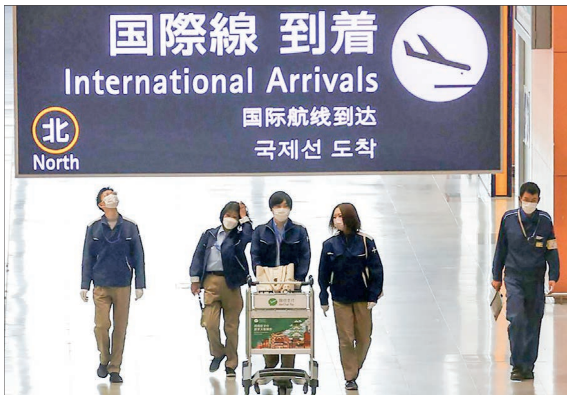
Japan will end the current border control measures on travellers from overseas on 8 May in line with its decision to categorize COVID-19 as a common disease the same day, the government said on 3 April, in a major shift toward normalizing social and economic activities.