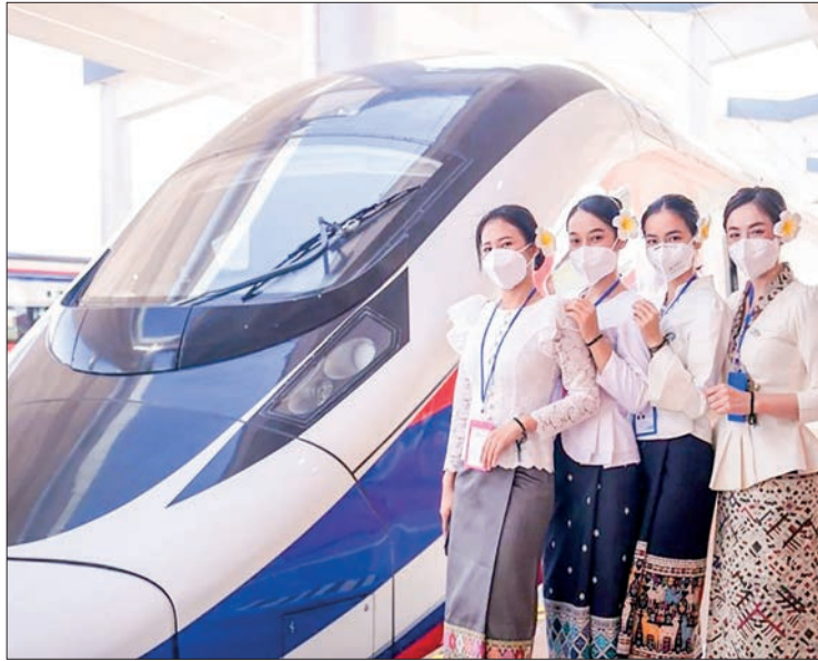
The cross-border passenger train is a great advantage for Laos because it facilitates tourist travel.

senger service between the Lao capital Vientiane and Kunming, the capital city of southwest China's Yunnan province, will be operational on 13 April ahead of the Lao New Year holiday, which falls on 14-16 April.