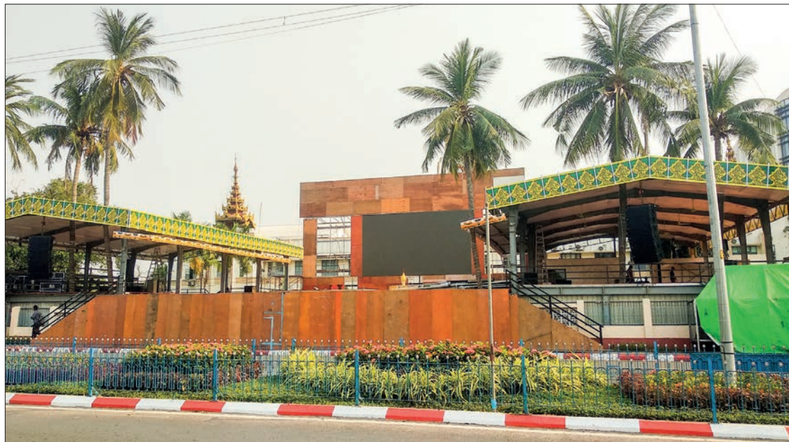
Mandalay Maha Thingyan Pavilion.

The Mingala Mandalay Myanmar Traditional Walking