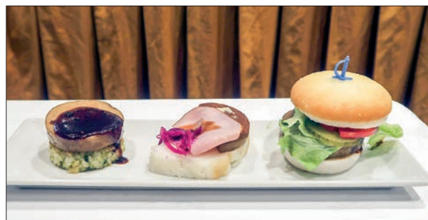
NH Foods proposes various recipes for its newly launched foie gras food alternative, made mainly from chicken liver, as seen in this photo taken 29 March 2023, in Tokyo.

well as economic and political crises in the country. —Xinhua