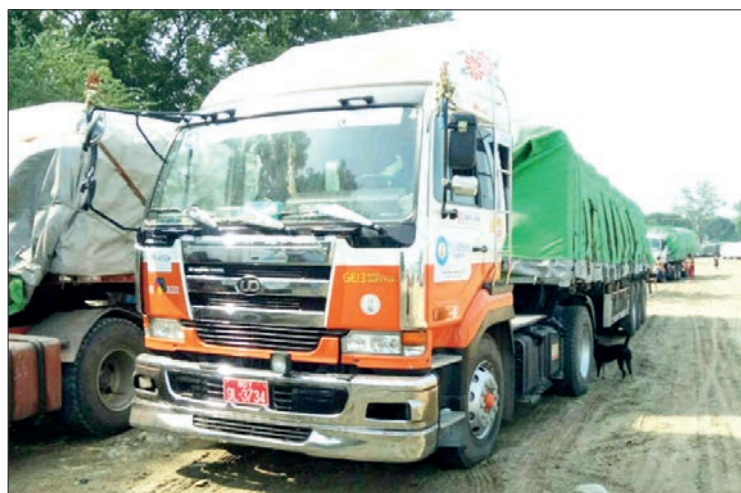
Some highway trucks are seen running to Yangon.

Although traders in Yangon have offered to pay higher fares than usual to deliver goods to