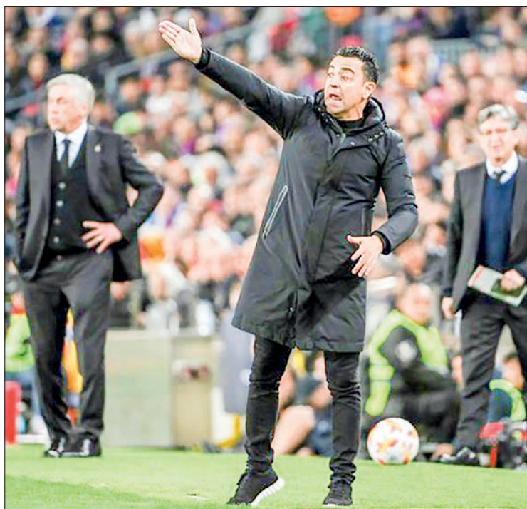
Barcelona coach Xavi during the Copa del Rey semi-final defeat to Real Madrid.

Madrid are in the Copa del Rey final and face Chelsea on