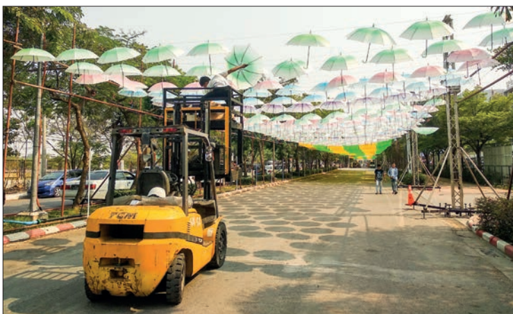
Preparations being made for holding Mingalar Mandalay Walking Thingyan festival along 26 th Street between 66 th and 78 th Street in Mandalay.

In addition, there are 11 pavilions around the Mandalay Moat including Mandalay Mayor Maha Thingyan Pavilion, five water-throwing and entertainment pavilions in downtown and 16 pavilions for refreshments around the moat. In the northern and western sections of the moat, arrangements have been made for the revellers to enjoy the festival with water pumps, and the Zaychothu water pavilion is set up near the clock tower of the Mandalay Zaygyo Market to the accompaniment of Myoma Band. — Maung Aye Chan/CT