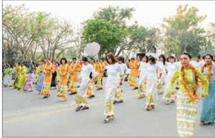
Union Minister U Maung Maung Ohn views the rehearsals and preparations for the Nay Pyi Taw Walking Thingyan yesterday.

THE opening ceremony of Nay Pyi Taw Walking Thingyan will be held along the road between Nay Pyi Taw Mayor Thingyan