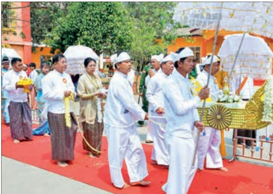
The gemmed diamond orb is seen being conveyed.

The Senior General inspected the upgrading of the airport and gave instructions