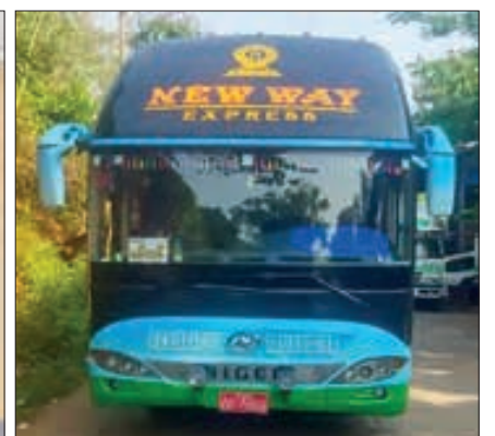
Confiscated illegal items at the Mayanchaung permanent inspection checkpoint.