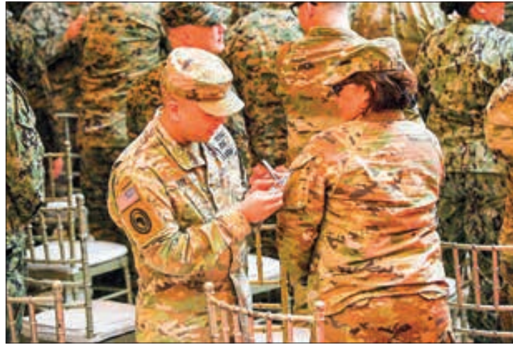
US soldiers place an exercise patch on their uniforms during the opening ceremony of the 'Balikatan' joint military exercise at the military headquarters in Quezon City, suburban Manila on 11 April 2023.

and banners denouncing the drills, urging Filipinos to oppose the joint exercises. Some activists hurled “paint bombs”, defacing the seal of the US Embassy in