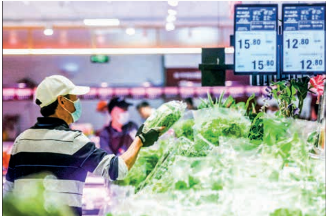
A customer shops for vegetables at a supermarket in Hangzhou, in China's eastern Zhejiang province on 11 April 2023.

“We think consumer price inflation will rebound in the coming months as the labour