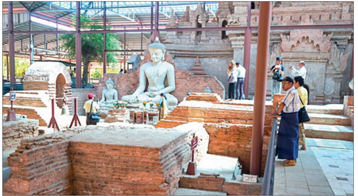
Pilgrims are seen at the Shwegugyi Pagoda.

It is one of nine cave temples built by King Anawrahta along the Panlaung River in the early Bagan period. King Narapatisithu rebuilt it as a double-storey cave temple in the late 12th century during the Bagan Period. The temple was decorated with inscriptions outside the temple (the grotesque art, animals and birds, humans, Nat, Brahma, and Kinnara characters). During the 684 ME Pinya period, a new temple was built with stupas and artefacts in the reign of King Oatsana, according to a pagoda history book noted