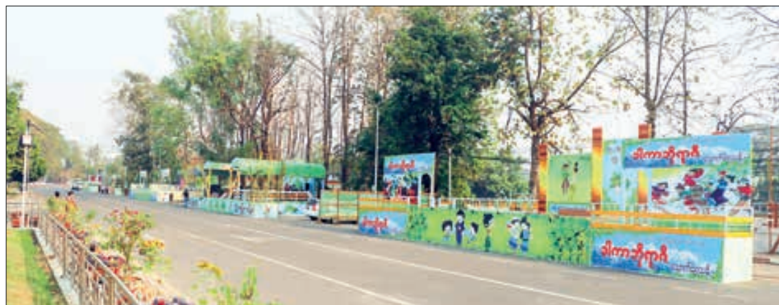
Preparations in progress for the Myanmar Traditional Thingyan Festival in Myitkyina yesterday.

The Kachin state government will hold this year's Myanmar traditional water festival, the Thingyan festival, in a more crowded manner than in previous years. During the Thingyan period, the first ordination ceremony and the opening of meditation centres were held for the employees. On the first day of Myanmar's new year, ceremony for paying respects to elders and, a fish release ceremony, will be held.