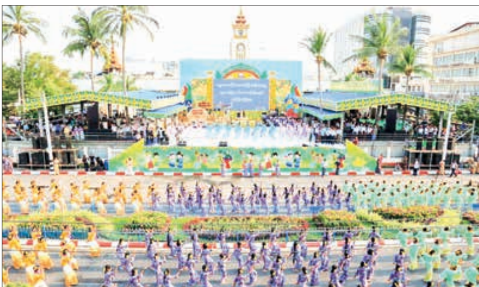
The full-dress rehearsal for the Mandalay City Maha Thingyan Pandal in progress yesterday.

THE full-dress rehearsal for the opening ceremony of the Mandalay City Maha Thingyan Pandal was held on the evening of 11 April at the pavilion on 26 Street between 71 and 72 streets in Mandalay.