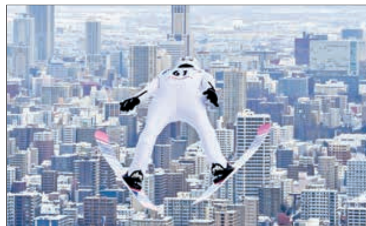
This photo taken on 20 January 2023 shows a ski jumper taking flight as the city of Sapporo is seen during the Ski Jumping World Cup competition. Japan could push its Winter Olympics bid back four years to 2034 after corruption scandals related to the Tokyo Games, the country's Olympic chief has warned.

His comments come as prosecutors investigate allegations of bribery and bid-rigging at the 2020 Summer Games in Tokyo, which were postponed to 2021 because of the pandemic. Local media reported Yamashita as saying that he would discuss the bid with Sapporo's mayor, who