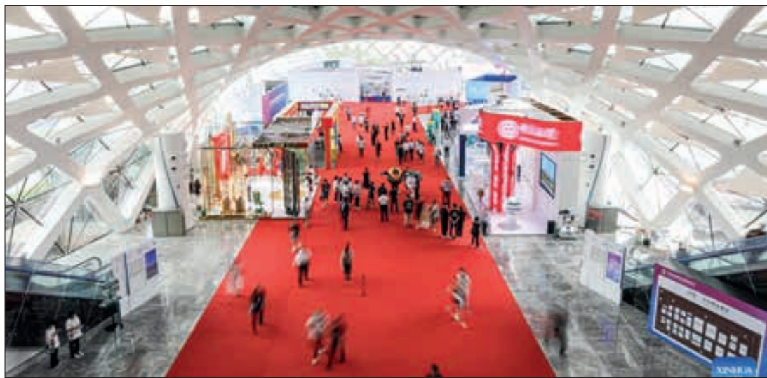
This photo taken on 10 April 2023 shows a view inside the venue of the third China International Consumer Products Expo (CICPE) in Haikou, capital city of south China's Hainan Province.