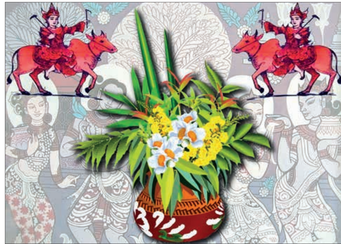
Human beings and deities existed at the same time. Thagyamin (Indra, highest spirit Nat), and Brahma argued about the events regarding weddings, donations, and charity among others every two days. This way, Sunday and Monday, Tagu-Kason seasons and one year-two years appeared. Thagyamin commanded the Calendar era as well.

people welcome Thingyan Min with an Atar pot which is filled with water and springs of seven kinds of flora representing seven days of the week on the first day of Thingyan (Akyo Day). Additionally, King Taningangwe Planet (Sun) called "Barnuyaza" is sent off. Those people born on the day that coincided with Atat Day are assigned to this. The ascending time of Maha Thingyan will fall on Sunday (16 April 2023) at 10:16:49 pm. Those people wearing clean, tidy and neat clothes offer flowers, water, candles and fragrant sticks to Buddha, do good deeds and share merit to Thingyan Min by saying, Sadhu Sadhu Sadhu (Well-Done). Consequently, it will bring success and positive outcomes to those merit makers in the shadow of angels, as per the treatise, the disclosure of the Buddha. If those born on Sunday failed to do so, they better have traditional Thingyan Rice dedicated to serving during Thingyan Atat Day and also make charity to others. Those who fail to do both actions will attract bad luck this year. Yet some Myanmar considered this as Sunday born cannot prevent ill fortune this year. Traditions, beliefs