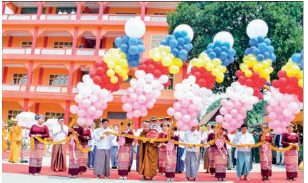
The Senior General cuts the ceremonial ribbon to open the three-storey building.

members of the Sangha, the Senior General, wife Daw Kyu Kyu Hla, entourage and local people.