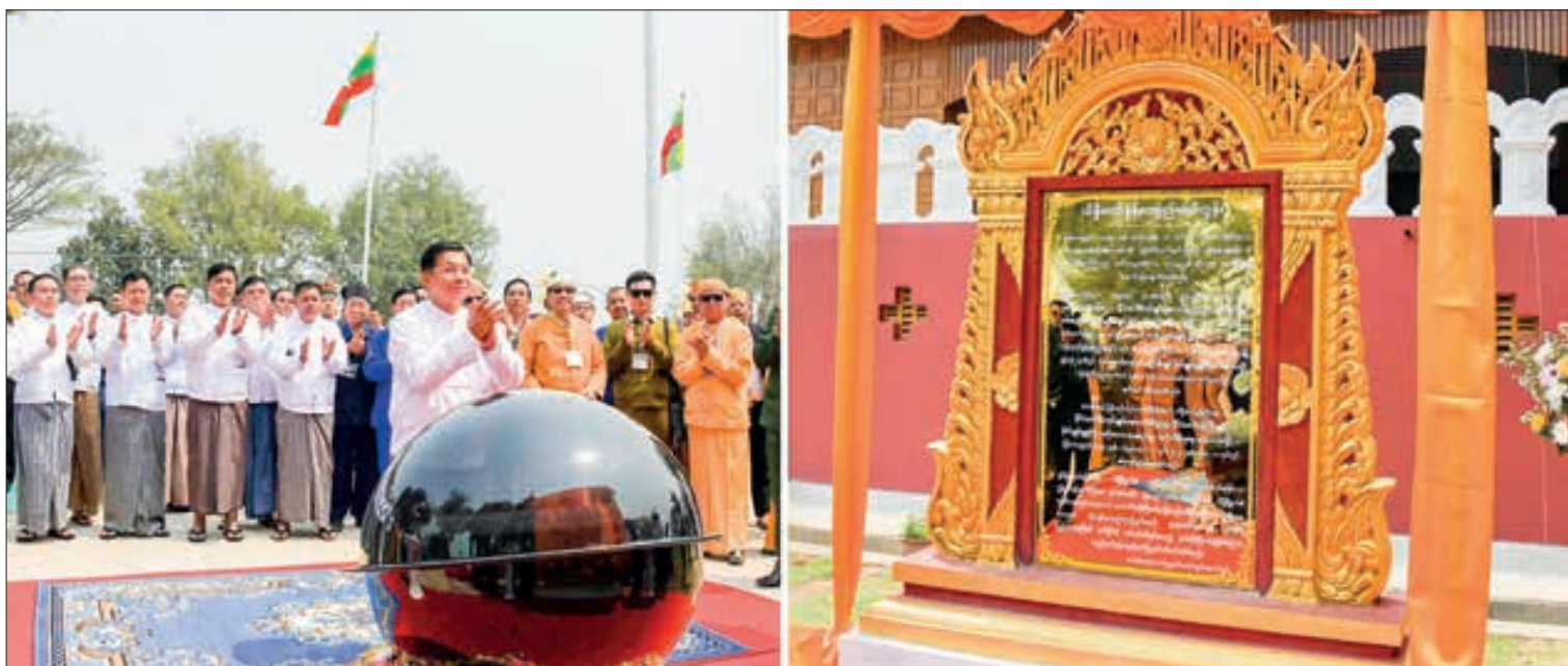
The Senior General and dignitaries are pictured after unveiling the Saopha Palace cultural museum yesterday.