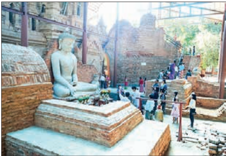
Visitors are pictured being keen in the inscriptions from the 11 th to 14 th century (Bagan to Pinya periods) of the Shwegugyi Pagoda.

from 11 to 14 AD during the Bagan-Pindaya periods are showcased at the temple. It is written to raise awareness of the history of the temple for pilgrims from various regions so that they can flock to the temple during the long holidays of the Thingyan Festival. — Thet Maung (Kyaukse)/EM