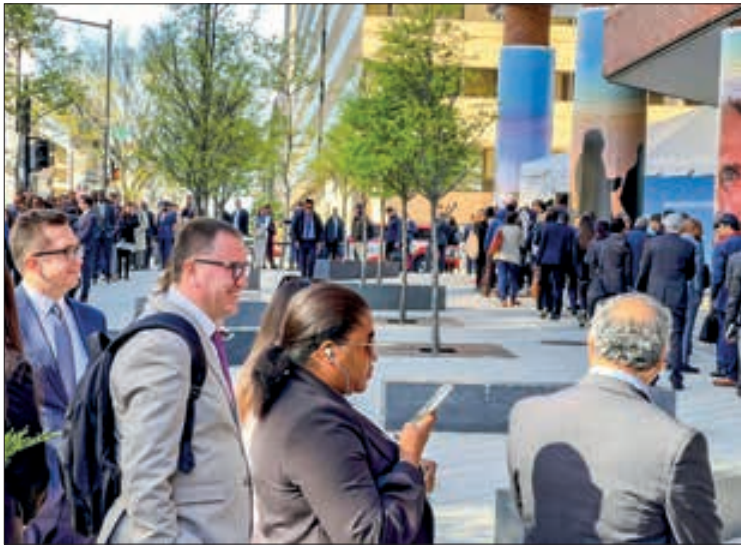
People line up outside the IMF and World Bank Spring Meeting registration office in Washington, DC, on 10 April 2023.