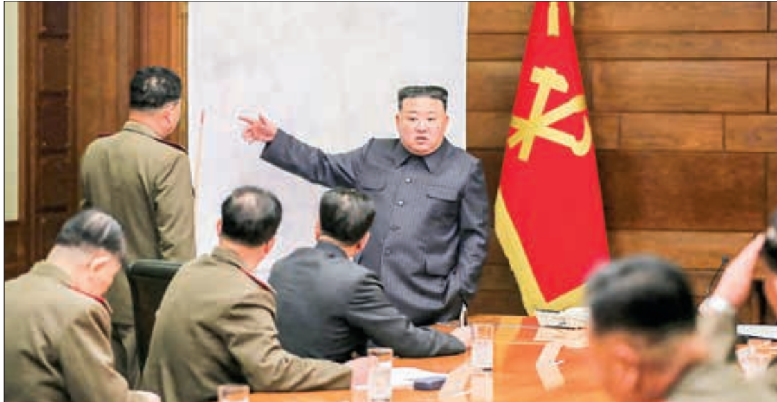
This photo taken on 10 April 2023 and released by North Korea's official Korean Central News Agency (KCNA) on 11 April shows North Korean leader Kim Jong Un (C) gesturing in front of a map (digitally blurred as received from source) while attending the 6 th Enlarged Meeting of the 8 th Central Military Commission of the Workers' Party of Korea (WPK) at the office building of the WPK Central Committee in Pyongyang.

NORTH Korean leader Kim Jong Un called for expanding the country's war deterrence capabilities in a "more practical and offensive" way, state media said Tuesday, to counter what