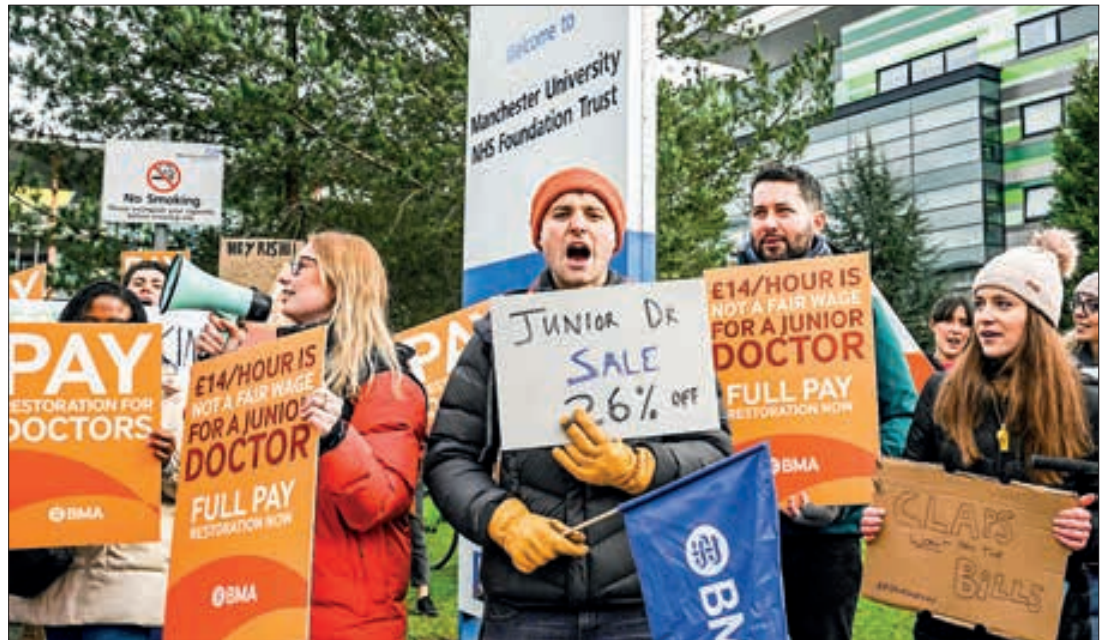
Demonstrators hold placards as they take part in a protest by junior doctors, amid a dispute with the government over pay, outside of Saint Mary's Hospital in Manchester on 15 March 2023.

THE public health service in England was on Tuesday braced for "the most disruptive industrial action" in its history as junior doctors walk out over pay and working conditions.