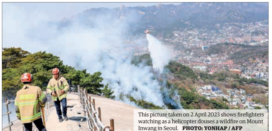
This picture taken on 2 April 2023 shows firefighters watching as a helicopter douses a wildfire on Mount Inwang in Seoul.

The forest fire rapidly spread to private houses due to strong wind and dry weather. The wind with an instantaneous maximum speed of 30 metres per second blew over the eastern coastal areas. No casualties have been reported yet, but the fire was estimated to have burned around 103 hectares of forest, or the size of about 144 soccer fields, as well as dozens of houses. — Xinhua