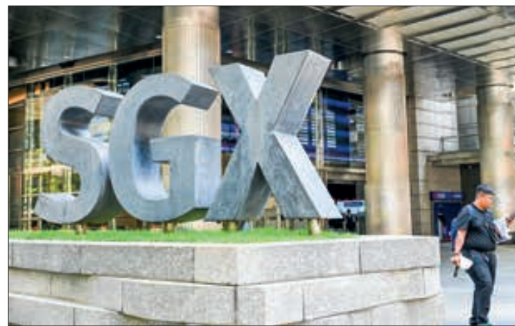
Signage of Singapore Exchange Limited (SGX) is pictured outside the company headquarters in Singapore on 23 March 2023.