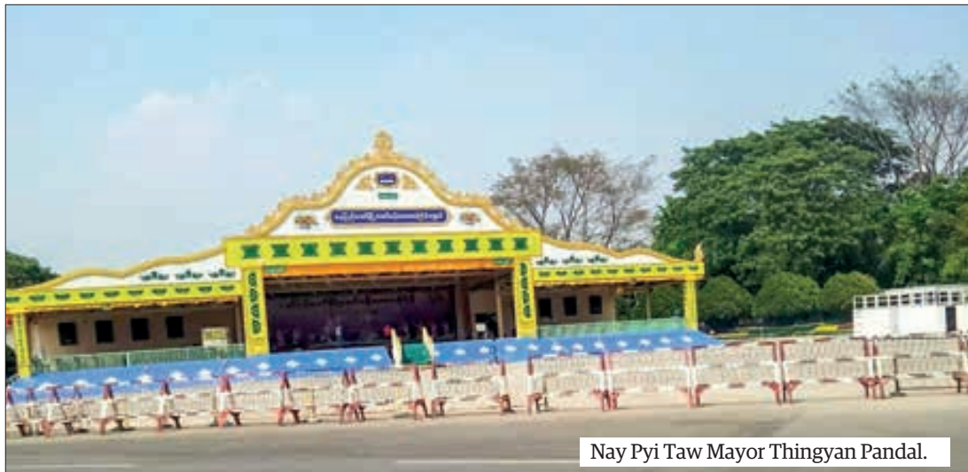
Nay Pyi Taw Mayor Thingyan Pandal.

Food stalls, pavilions to donate refreshments and entertainment programmes are also arranged at the Nay Pyi Taw walking Thingyan, and the entrance fee is set at K3,000 for adults and K1,000 for children. — TWA/CT