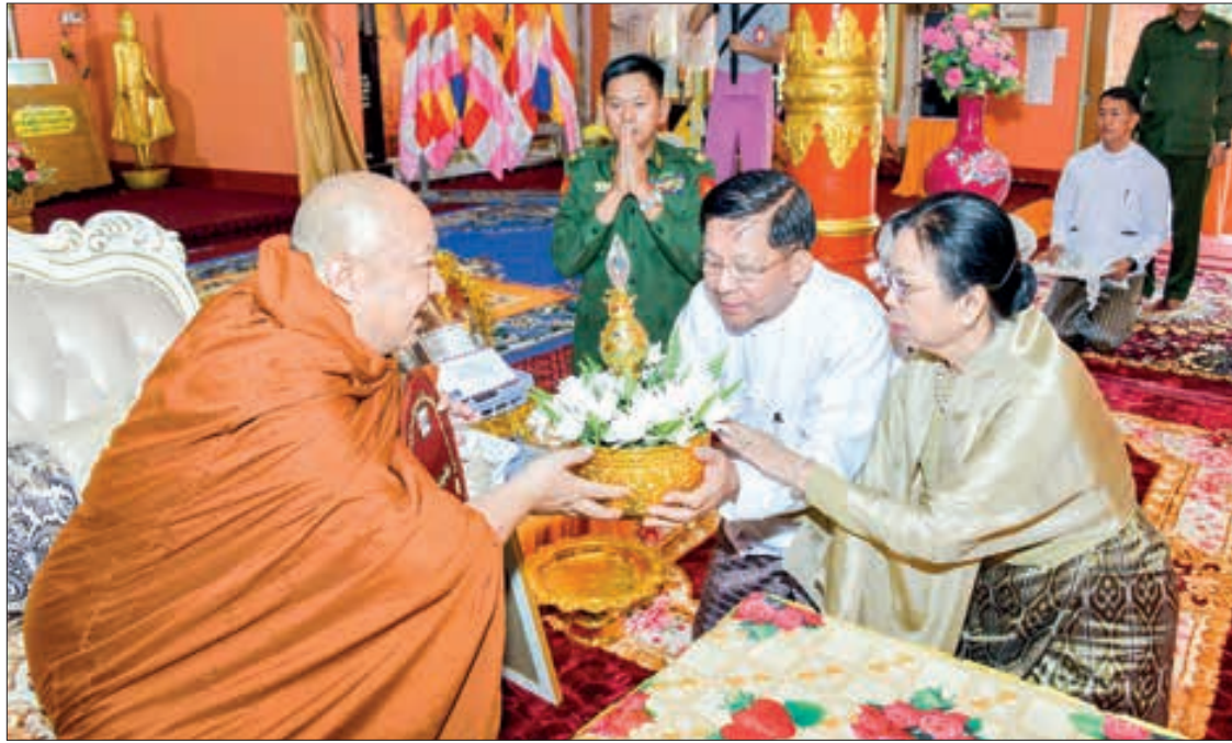
The Senior General and his wife present offerings to the Mansu Shan Monastery Sayadaw yesterday.