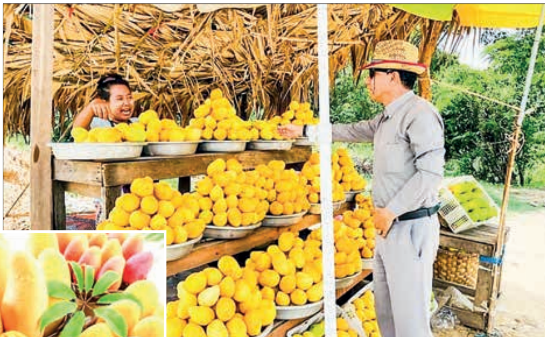
A consumer is seen shopping for mangoes.

Ayeyawady Region possesses the largest mango plantation acres, having about 46,000 acres. Bago Region is the second largest producer with 43,000 acres and Mandalay has 29,000 acres of mango. There are over 24,000 acres in Kayin State, over 20,400 acres in Shan State and over 20,000 acres in Sagaing Region, according to the association. — NN/EM