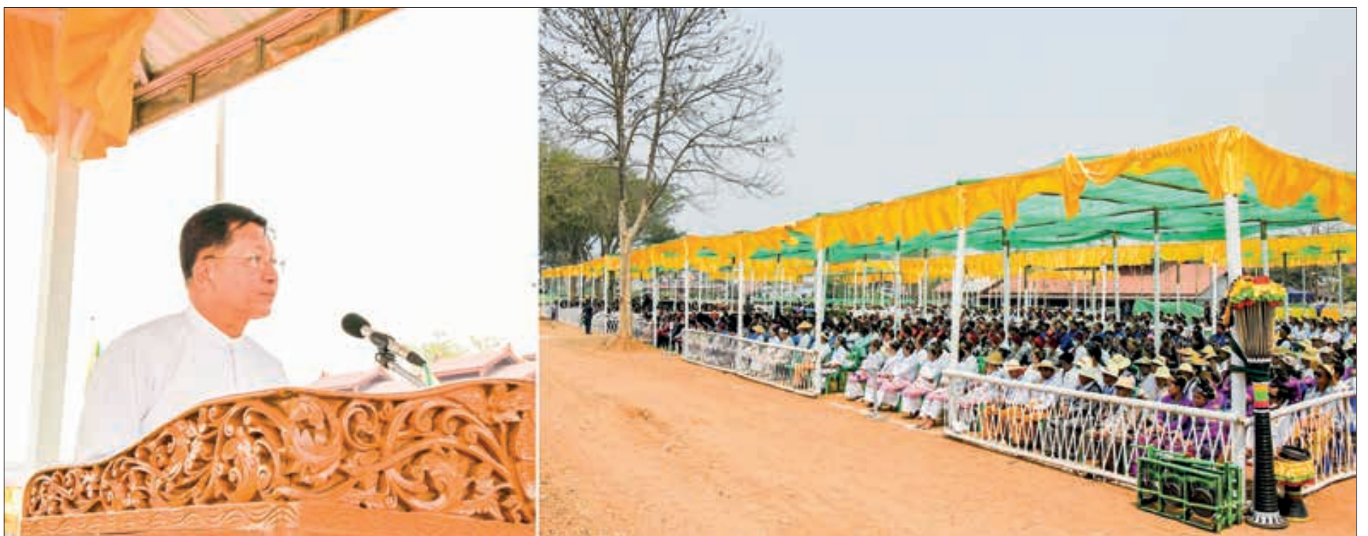
State Administration Council Chairman Prime Minister Senior General Min Aung Hlaing speaks on the inauguration occasion of the Hsenwi Saopha Palace cultural museum in Shan State on 11 April 2023.

AS part of a historical building and symbol of national unity in the Hsenwi region, the Saopha palace was renovated by the government and Tatmadaw for fulfilling the wish of the local people, said Chairman of the State Administration Council Prime Minister Senior General Min Aung Hlaing at the inauguration ceremony of Saopha Palace of Hsenwi Saopha Hkun Hsang Tone Hung as the Hsenwi Saopha