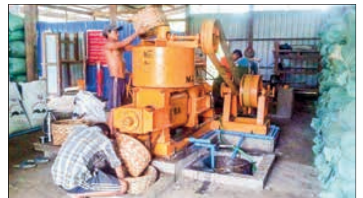
The photo shows an edible oil mill.

THE oil mills and livestock industries will have K70 billion loan from the State economic promotion fund, according to the Union of Myanmar Federation of Chambers of Commerce and Industry-UMFCCI.