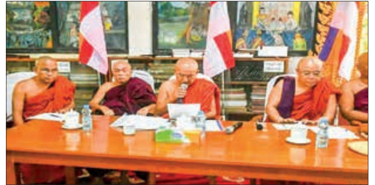
Yangon Region and Township Sangha Maha Nayaka Sayadaws are seen at the coordination meeting yesterday.