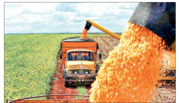
In this file photo taken on 12 May 2023, trucks harvest corn grains at a farm in Guarapuava, Brazil.

This is despite a "delay in the soybean harvest" due to a "surplus of rain" in Mato Grosso, the country's main producer of soybeans and corn, where the mild winter and the distribution of rainfall allow a second annual harvest. — AFP