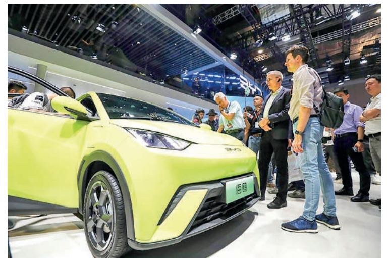
A BYD Seagull is displayed at the 20th Shanghai International Automobile Industry Exhibition in Shanghai, east China, 18 April 2023.

"I think this show marks the end of the internal combustion