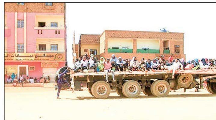
People fleeing street battle between the forces of two rival Sudanese generals, are transported on the back of a truck in the southern part of Khartoum, on 21 April 2023.

Blinken welcomed both the army's announcement and an earlier one by the RSF, a powerful force formed from members of the Janjaweed militia involved in years of violence in the western Darfur region. — AFP