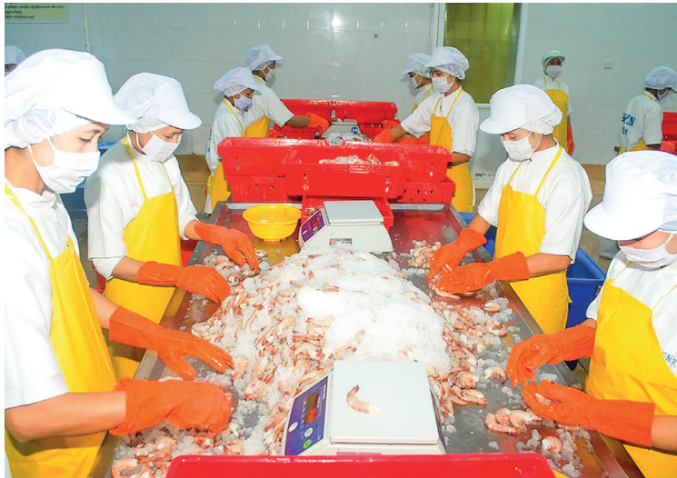
Workers are pictured in the fishery processing line. Myanmar ships fishery products to over 40 countries, mostly to Thailand and China.

MYANMAR shipped fishery exports worth over US$262 million to external markets from Taninthayi Region in the 2022-2023 financial year, according to Taninthayi Region's Fishery Department.