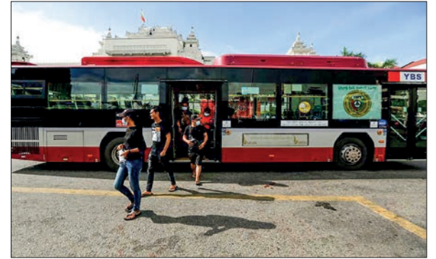
A vehicle from a bus line running under Yangon Region Transport Committee-YRTC.