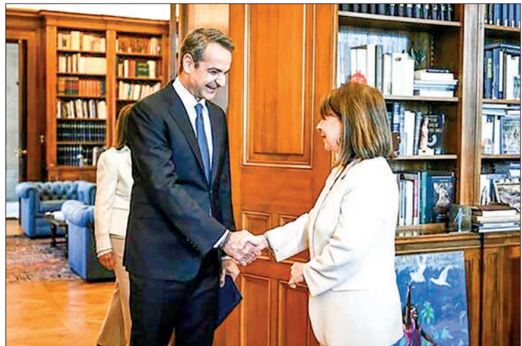
Mitsotakis met with President Katerina Sakellariou to submit the proposal from cabinet.

GREECE'S Prime Minister Kyriakos Mitsotakis called for the dissolution of parliament on Saturday, kicking off the countdown to general elections set for 21 May.