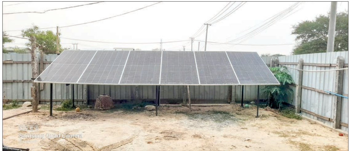
A solar panels installation.

If extra energy is linked to Yangon Distribution Grid Sys-