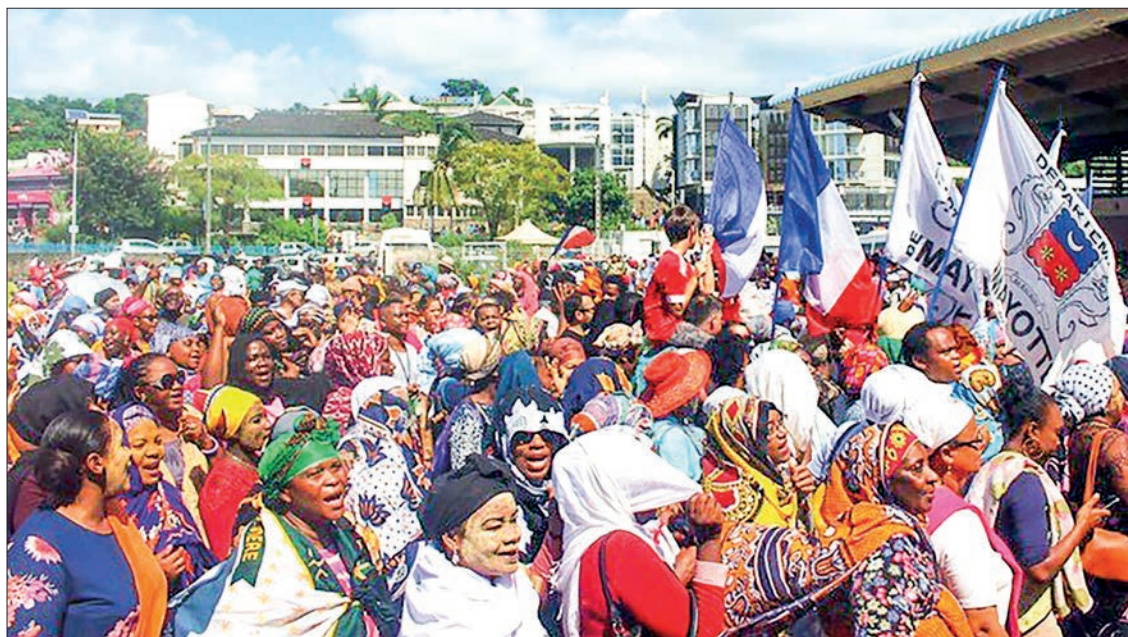
Protesters hold French and Mayotte flags as they gather on the Place de la Republique in Mamoutzou, on the French Indian Ocean island of Mayotte, in March 2018 during a demonstration against insecurity and immigration.

THE Indian Ocean archipelago of the Comoros warned Friday it would not accept migrants expelled from the neighbouring French island of Mayotte in a looming operation that has triggered a diplomatic spat.