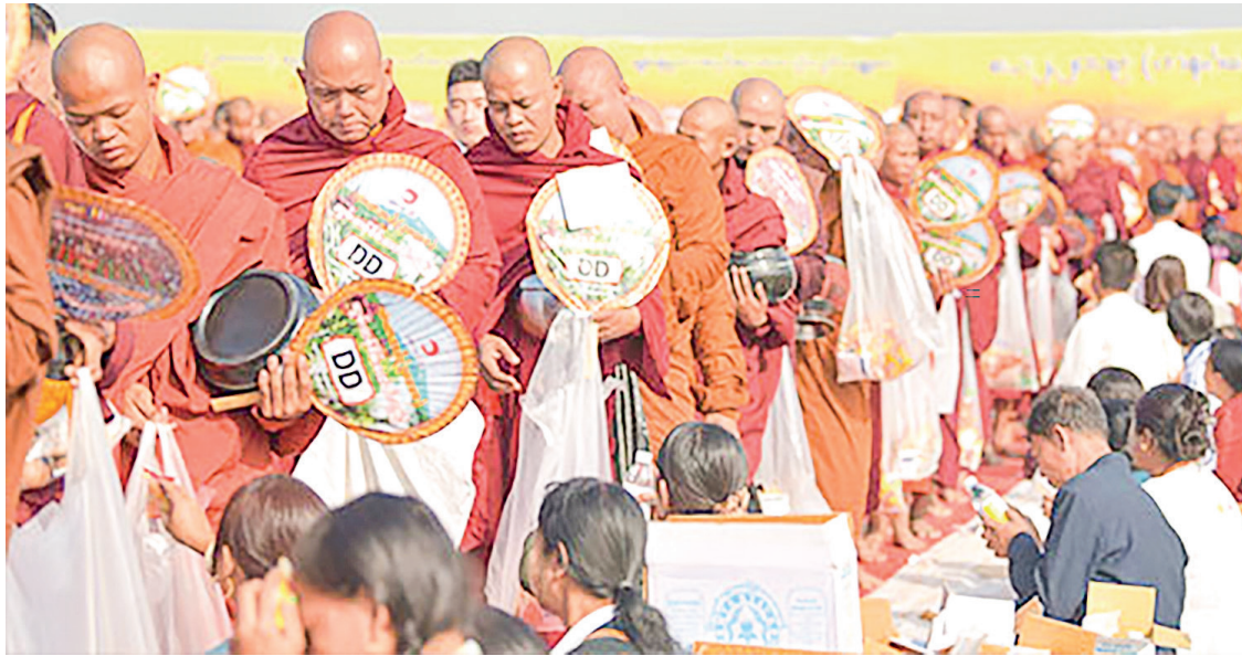
The donation ceremony for 30,000 monks is in progress in Mandalay Region in 2019.

THE food offering ceremony for more than 21,000 Buddhist monks will take place in Yangon and Mandalay on the full moon day of Kason.