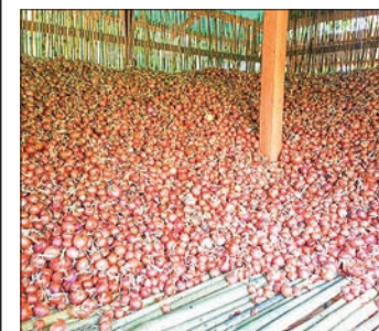
The photo shows the onions to be sent to the Myingyan depot.

The summer onion price this year is higher than that of the corresponding period last year, allowing the growers to do well financially. Those traders who store the onion stocks also make a big purchase this year. Nonetheless, there is less chance for the price to hit a record high this year like 2022's record price. — TWA/EM