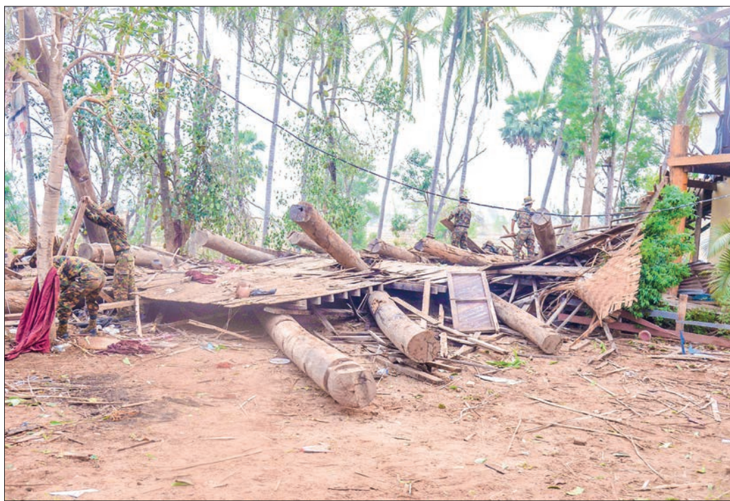
Damage and debris are seen in the aftermath of the violent storm occurred in Aungmyingon and TadaU villages of Lewe Township on 21 April 2023.