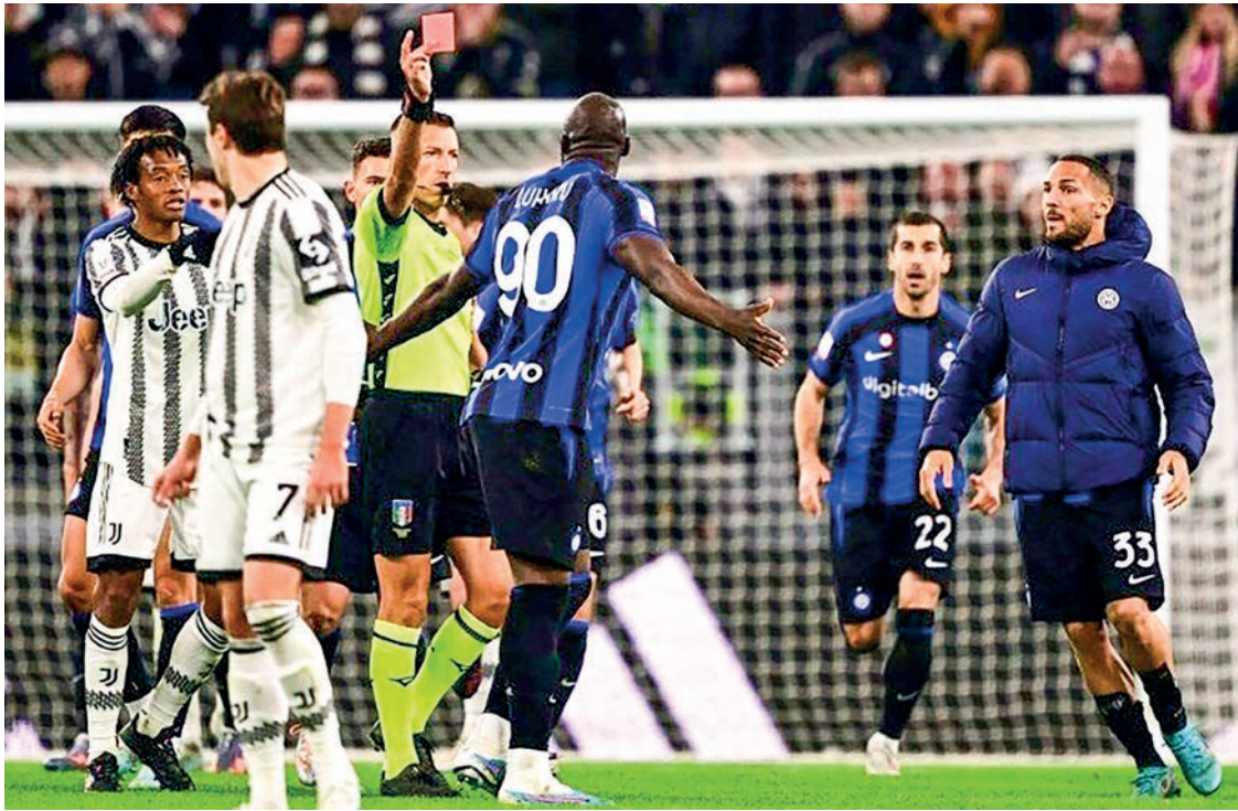
Inter Milan striker Romelu Lukaku was subjected to racist abuse after scoring a penalty against Juventus.

INTER Milan on Friday condemned striker Romelu Lukaku's Italian Cup semi-final ban saying the "victim" of racist abuse had become the "only guilty party" after Juventus won an appeal against a stand closure.