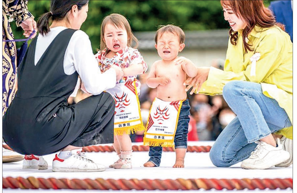
The 'crying baby sumo' ritual returned to Sensoji Temple for the first time since the Covi-19 pandemic. PHOTO: AFP

The rules vary from region to region -- in some places parents want their offspring to be the first to cry, in others the first to weep is the loser. — AFP