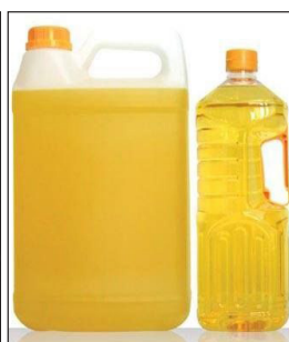
The photo shows palm oil being sold at a retail outlet.

THE price of palm oil remained unchanged at some commodity depots in the post-Thingyan period despite the inflation of other commodities' prices.