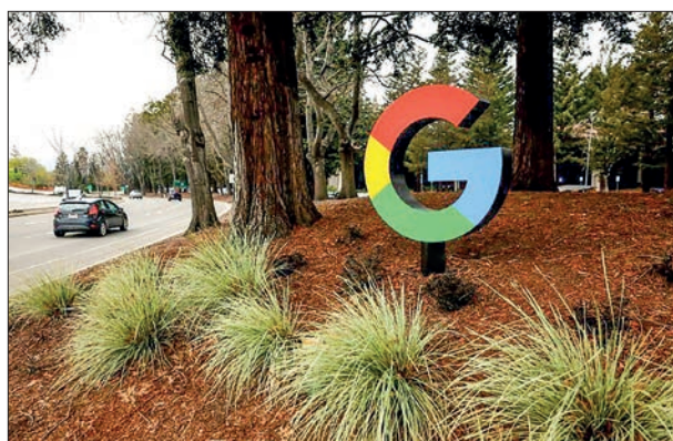
A new Google mega-campus in the Silicon Valley city of San Jose was to feature office space, housing units, and public parks.

Google's world-dominating search engine has found itself under pres-