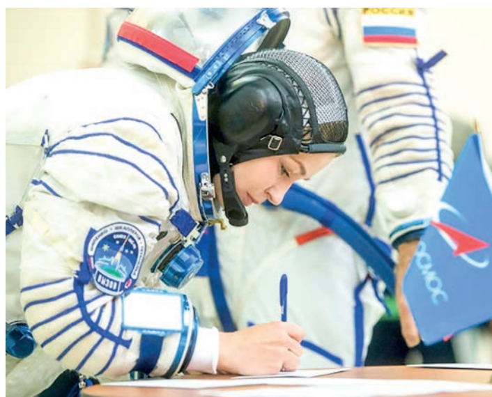
In The Challenge a surgeon played by Yulia Peresild, 38, is sent to the ISS to save a cosmonaut injured during a spacewalk.

In "The Challenge" a surgeon played by 38-year-old Yulia Peresild -- one of Russia's most glamorous actresses -- is sent to the ISS to save a cosmonaut injured during a spacewalk.