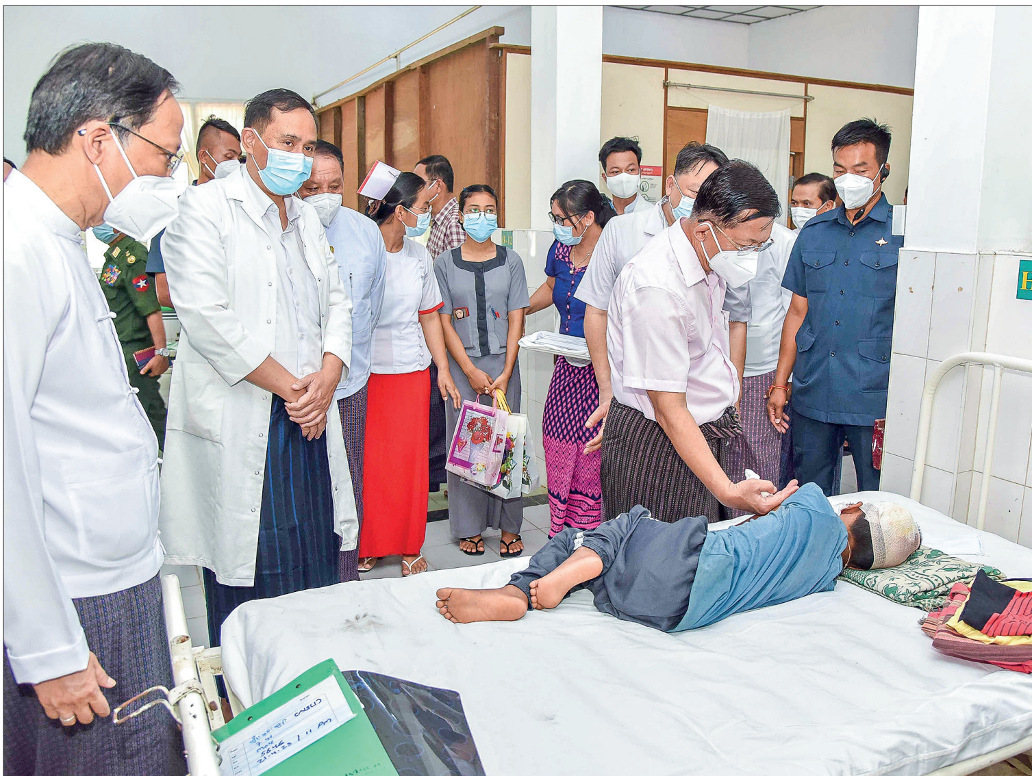
State Administration Council Chairman Prime Minister Senior General Min Aung Hlaing comforts the injured at Nay Pyi Taw General Hospital (1000-bed) yesterday.

S TATE Administration Council Chairman Prime Minister Senior General Min Aung Hlaing met residents at Aungmyingon and TadaU villages in Lewe Township victimized by a tornado, comforted and provided cash assistance and relief items yesterday.