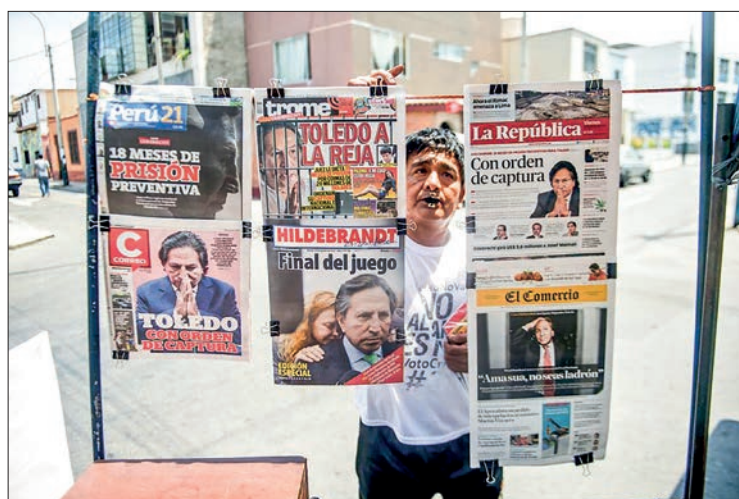
Newspapers with the portrait of former Peruvian President (2001-2006) Alejandro Toledo on their front pages, are displayed for sale in Lima in 2017.

PERUVIAN ex-president Alejandro Toledo surrendered to US authorities in California Friday,