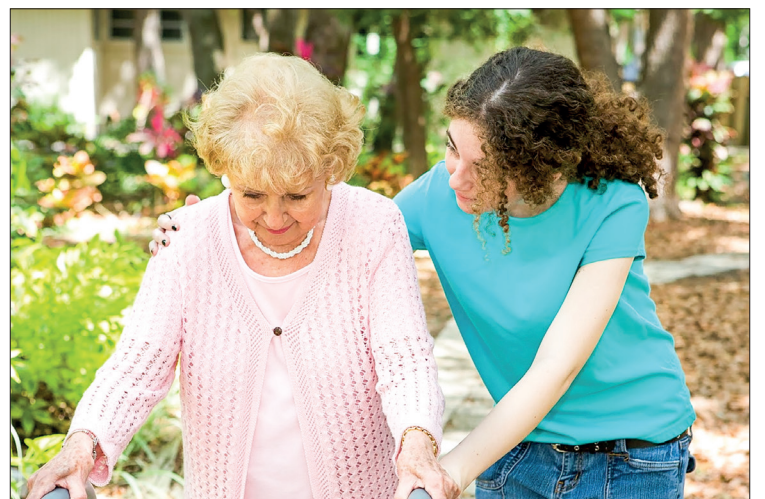
While everyone loses some neurons as they age, people with dementia experience far greater loss.

poral Dementia Research in the Feil Family Brain and Mind Research Institute and a member of the Helen and Robert Appel Alzheimer's Disease Research Institute at Weill Cornell Medicine. — ANI