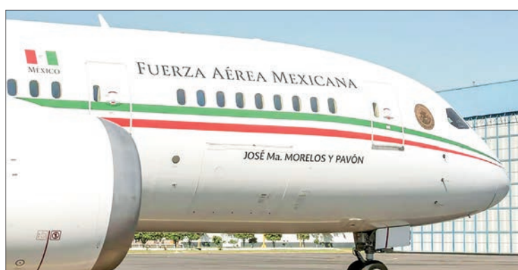
Mexico's presidential airplane is seen at the Benito Juárez International Airport in Mexico City in December 2018.

He denies all charges, which could see him jailed for up to 20 years if convicted in Peru. — AFP