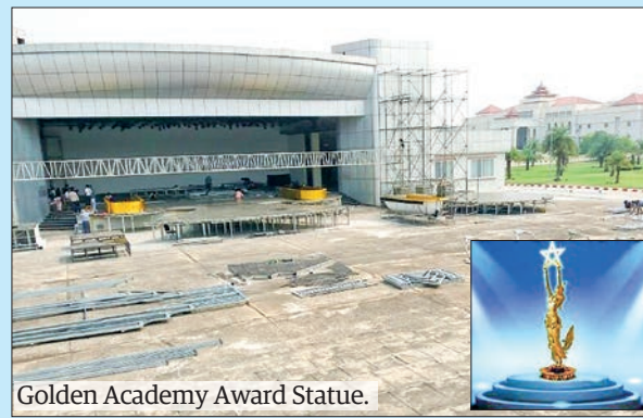
Golden Academy Award Statue.

The association will bear the cost of gold brooches. The film academy awards presentation event will be held in Nay Pyi Taw on 6 May.