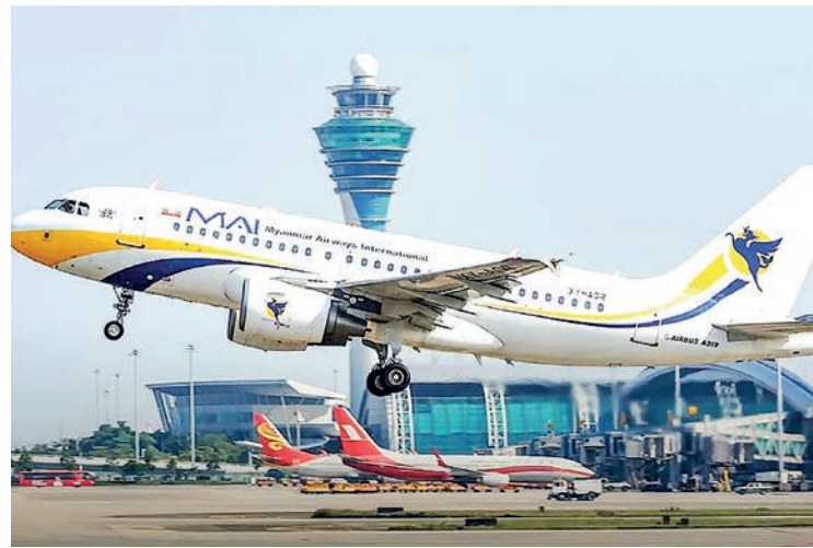
One aircraft of the MAI fleet.

MYANMAR National Airlines (MNA) will extend the Yangon-Dubai-Yangon flight commencing on 1 May. The Yangon-Dubai-Yangon flight is operated every Sun-