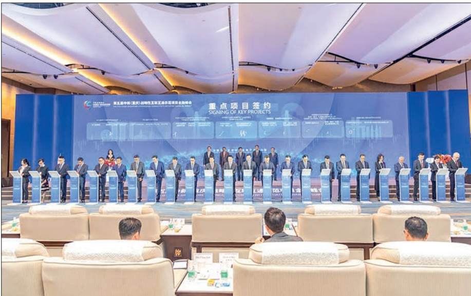
This photo taken on 20 April 2023 shows the signing ceremony of key projects during the fifth China-Singapore (Chongqing) Connectivity Initiative Financial Summit in southwest China's Chongqing.

Focused on new missions for financial centres and new momentum for financial opening-up, the summit aims to provide forward-looking views and policy guidelines for quality financial cooperation between China and Singapore, as well as new areas