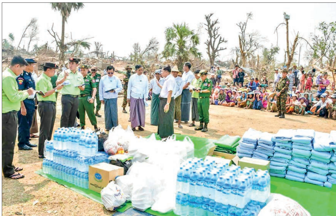
The Senior General views the relief items for the victims.

He also cordially encouraged the victims who are under medical treatment at Nay Pyi Taw General Hospital (1000-bed) and provided foodstuffs to them. — MNA/KTZH