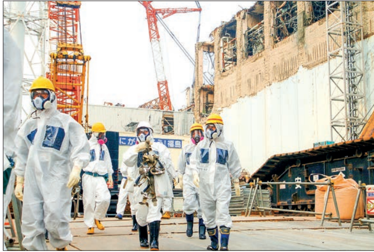
In this 17 April 2013 file photo, IAEA experts depart Unit 4 of TEPCO Fukushima Daiichi Nuclear Power Station as part of a mission to review Japan's plans to decommission the facility.

In the Japan-US Dialogue on Sustainable Agriculture, the