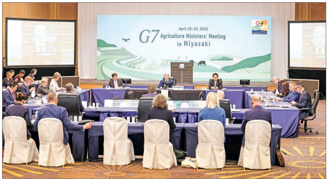
Group of Seven agriculture ministers and representatives from various international organizations meet in Miyazaki, southwestern Japan, on 22 April 2023.

Discussions will focus on beefing up agricultural productivity to increase output while