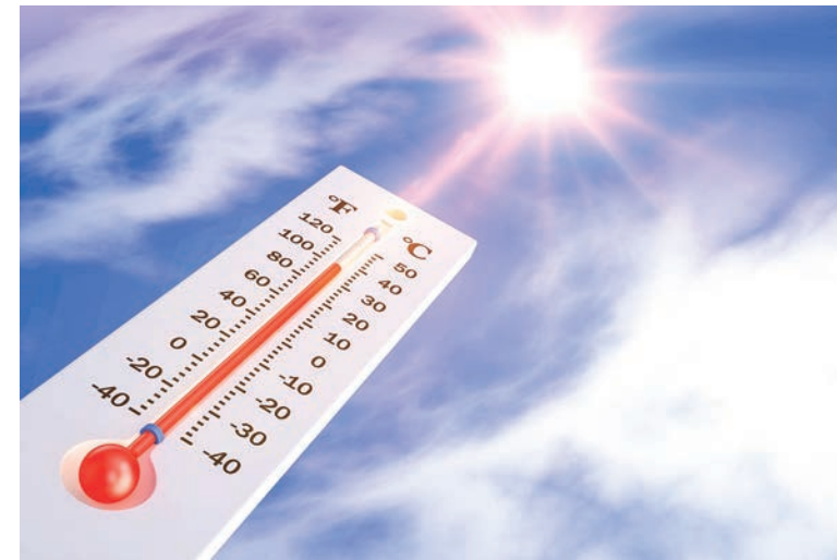
It is crucial to be aware of the signs of heat stress and heat exhaustion as well as heat stroke, which can be life-threatening.

which can be life-threatening. If left untreated, it can progress to heat stroke, which can cause confusion, seizures, and loss of consciousness. If you or someone you know experiences any of these symptoms, it is impor-