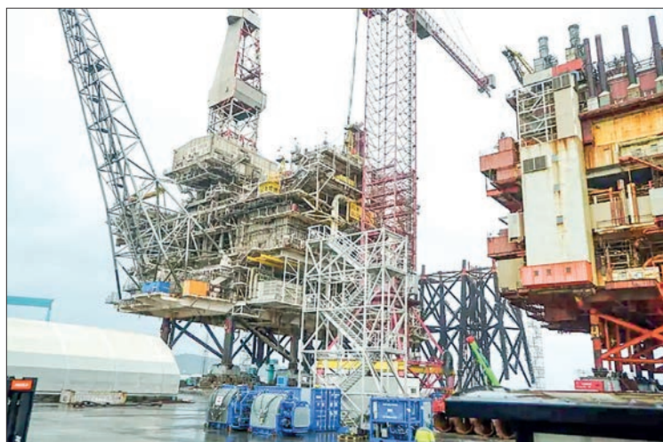
Fuelled by revenues from Norway's state-owned oil and gas companies, the fund is aimed at financing future spending in the generous welfare state.

The fund has stakes in more than 9,200 companies worldwide, representing 1.5 per cent of the total market capitalization. — AFP