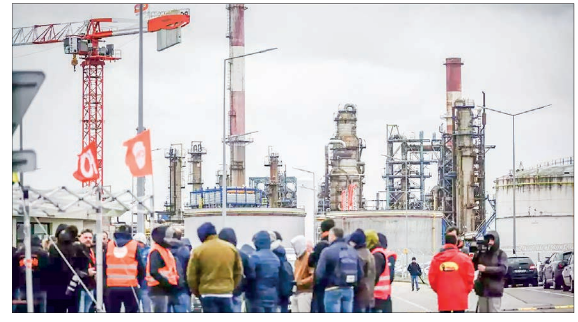
Neste, the largest global producer of SAF, uses cooking oil and animal fat at this Dutch refinery.

Sustainable aviation fuels are being made from different sources such as municipal waste, leftovers from the agricultural and forestry industry, crops and plants, and even hydrogen.