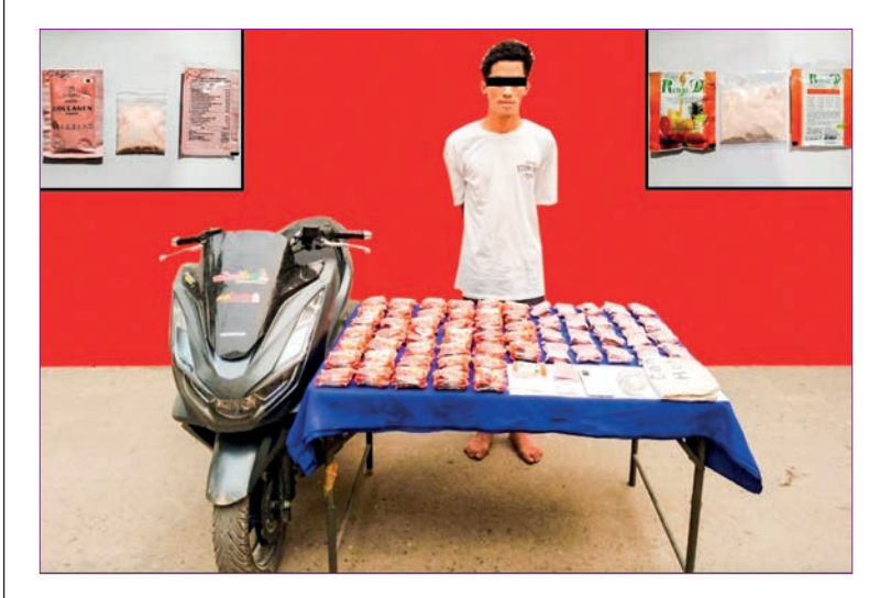
A suspect seen with seized Happy Water and a motor cycle in Tachilek

According to the investigation, it was found that the seized Happy Water was brought from Tahley city in eastern Shan State to Tachileik City and distributed to young people during the Myanmar traditional Thingyan festival. The crime offenders are under investigation.—MNA/KZW