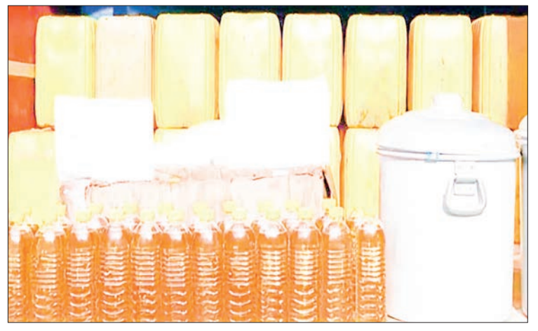
Palm oil in various packaging system seen in the market.

THE delivery order (DO) price of palm oil is still high even with the massive arrival of imported oil before Thingyan holidays, according to the oil dealers.