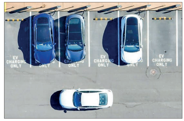
Guidelines released Friday by the Treasury Department spell out battery requirements for electric vehicles to qualify for a full consumer credit.

The rule "could include newly negotiated critical minerals agreements," said the Treasury Department in a statement.—AFP