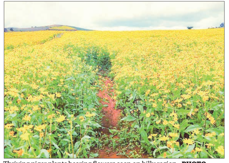
Thriving niger plants bearing flowers seen on hilly region.

"Compared to the last year's price, the prices of niger doubled this year, but the seeds