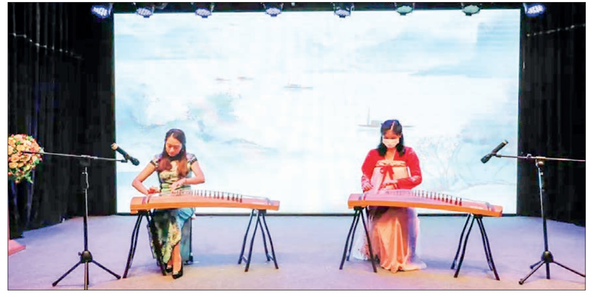
Female students from Chen Guang Training School perform harps in entertainment at Yangon Chinese Culture Centre on 28 March.

IN collaboration with Yangon Chinese Culture Centre and Myanmar Chinese Calligraphy and