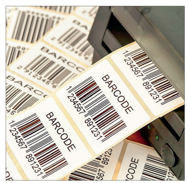
A barcode or bar code is a method of representing data in a visual, machine-readable form. Initially, barcodes represented data by varying the widths, spacings and sizes of parallel lines.

It provides companies with a unique "global trade item number" for each product, which is then translated into the barcode. Each firm must pay an annual fee based on their sales, up to nearly $5,000 per year. — AFP