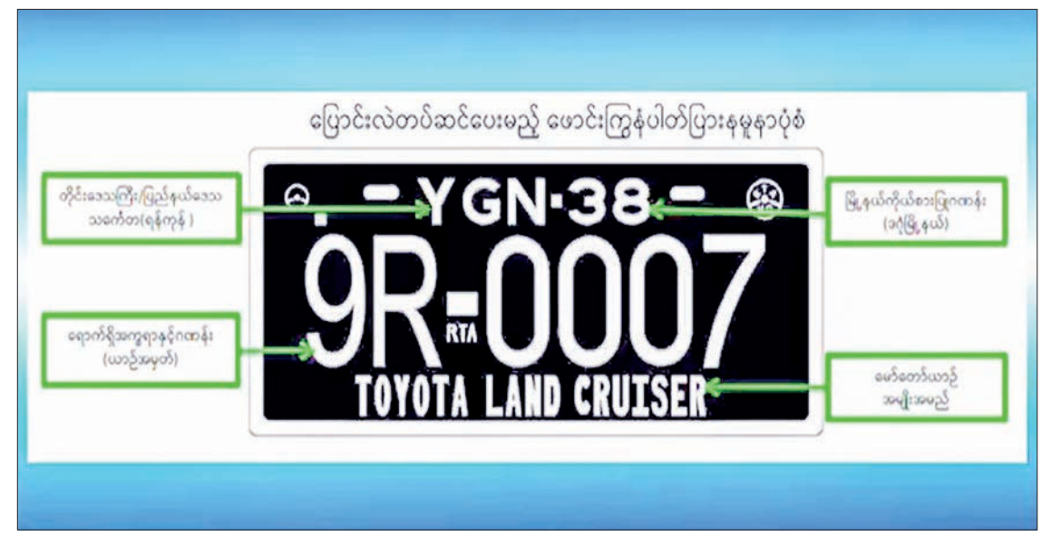
A sample of the embossed number plate that will be installed on vehicles.

over, vehicle owners have to contact the relevant offices of the Road Transport Administration Department and install new embossed number plates as soon as possible.