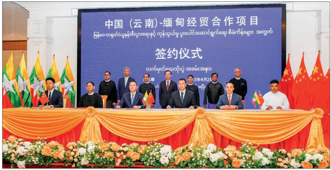
The signing ceremony of agreements and MoUs between Myanmar and Yunnan in progress on 2 April.

During the visit, while in Nay Pyi Taw yesterday at Horizon Lake View Hotel, the Union Minister for International Cooperation of the Republic of the Union of Myanmar and the Member of CPC Central Committee and Secretary of CPC Yunnan Provincial Com-