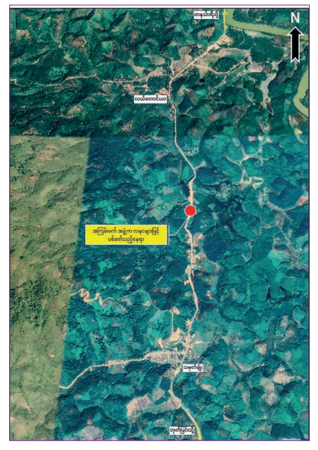
A google map shows the site where PDF terrorists attacked a passenger bus between Taninthayi and Kanmalaing village in Taninthayi Region at 8 pm on 1 April.

SO-CALLED PDF terrorists under NUG and CRPH fired on a bus unrelated to the military at around 8 pm on 1 April.