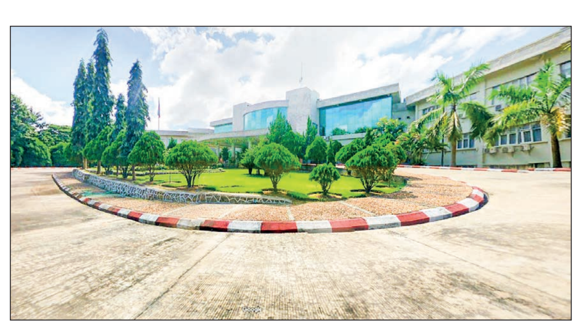
The Ministry of Commerce in Ottarathiri Township, Nay Pyi Taw.

Furthermore, K300,000 for the application for renewal of trademark registration (TM-11), K100,000 for the application to