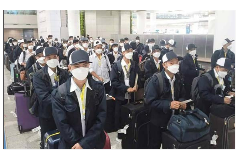
Some Myanmar workers seen at Yangon airport through EPS system in 2022

On the e-People system web page, Myanmar employees can choose anything of 14 languages, including My-