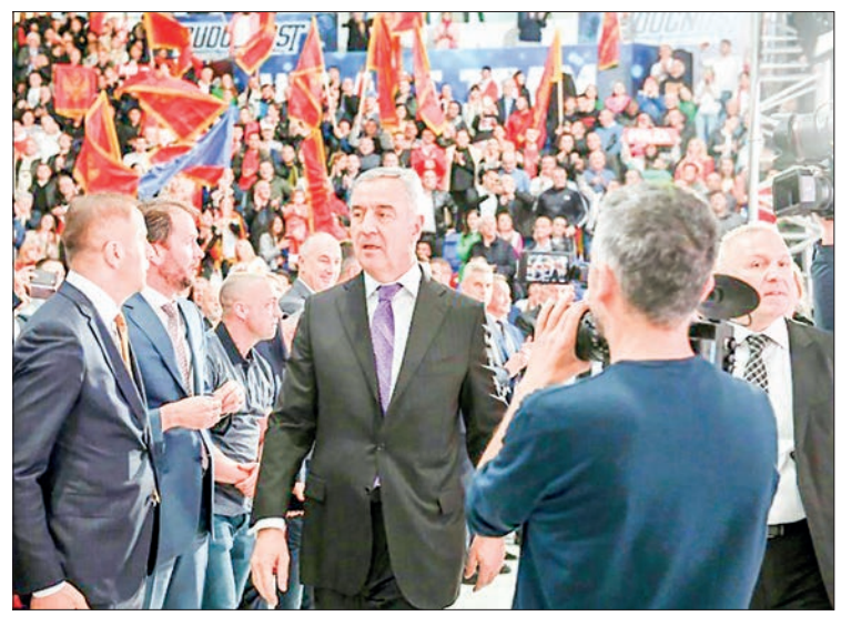
Montenegro President Milo Djukanovic is facing a stiff election challenge from a rising political star.

Montenegro's president, elected for a five-year term, has a mostly ceremonial posi-