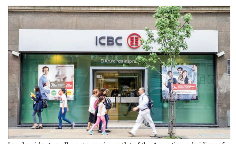
Local residents walk past a service outlet of the Argentine subsidiary of the Industrial and Commercial Bank of China in Buenos Aires, capital of Argentina.

THE Industrial and Commercial Bank of China (ICBC), China's biggest commercial lender, reported a net profit increase of 3.5 per cent last year.