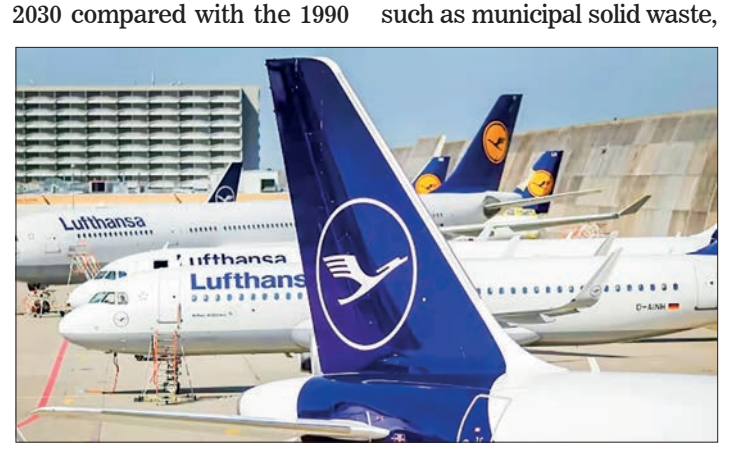
European airlines fear losing out to rivals based outside the EU that can ignore the bloc's emissions-reduction rules to become carbon neutral by 2050.

SAFs come from sources such as municipal solid waste,