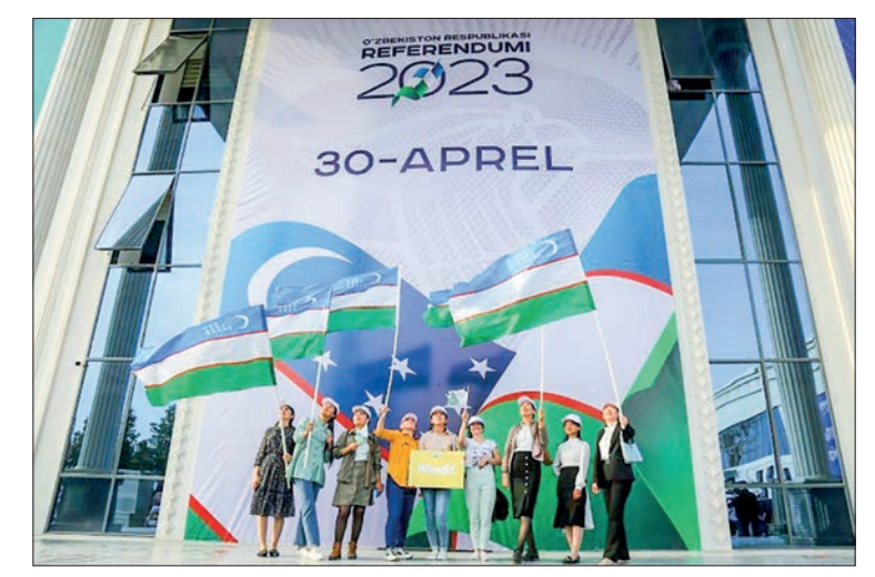
Few doubt the outcome of the referendum, billed as ushering in an 'era of development'.

the referendum, billed as ushering in an "era of development".