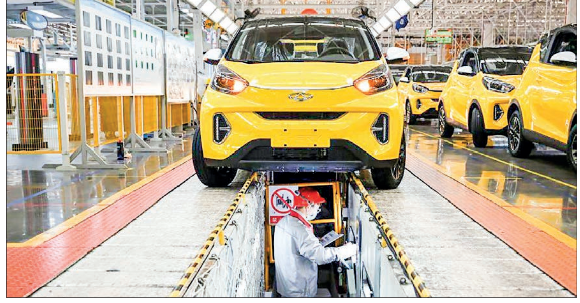
A worker is busy on the production line of new energy vehicles (NEVs) at a factory of Chinese automaker Chery Holding Group Co, Ltd in Wuhu City, east China's Anhui Province, 12 October 2022.

One reason for the increase is that unlike European manufacturers, Chinese car makers are not struggling to regain competitiveness after the pandemic, said the Federation of Automotive Dealers Associations