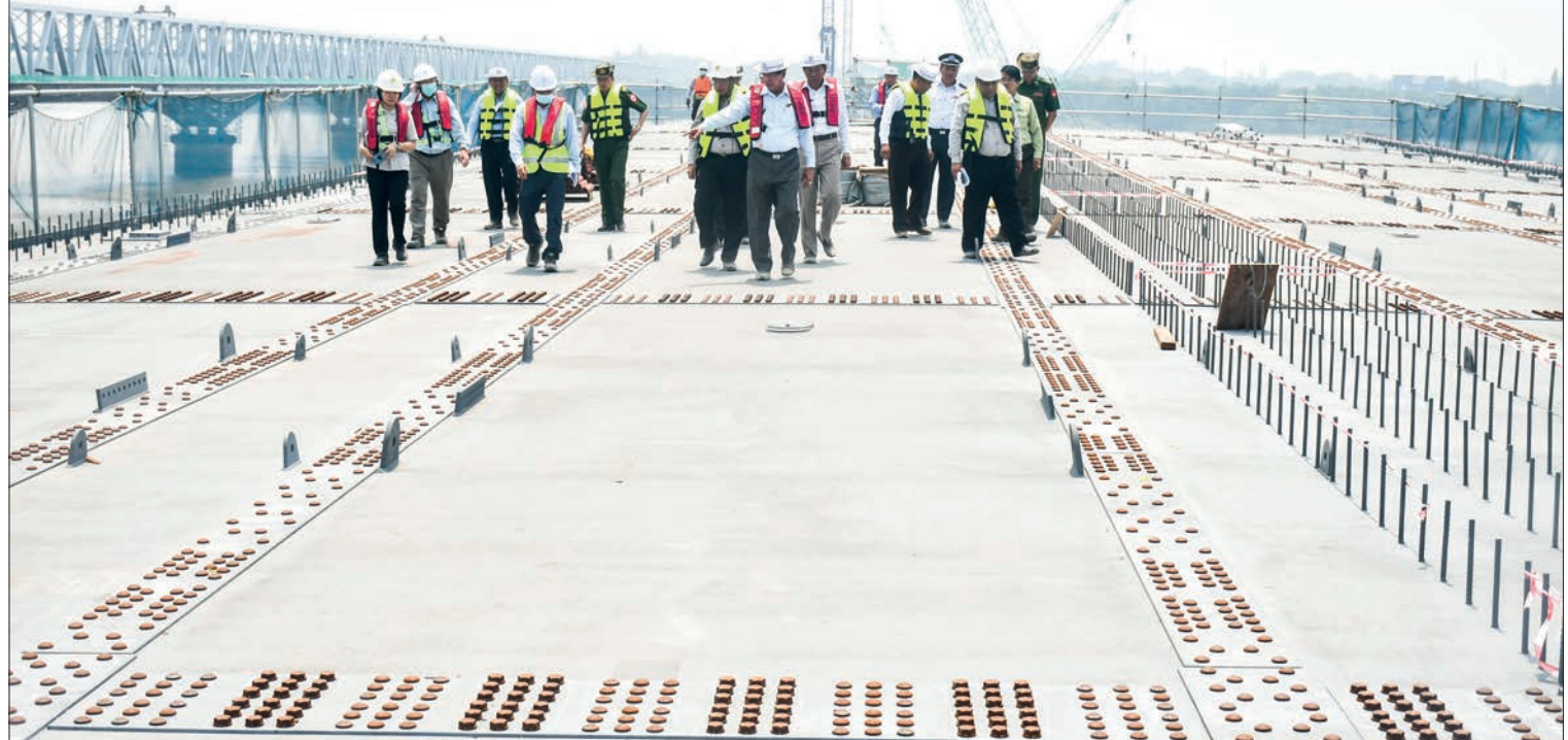
Photo shows the construction site of the Bago River crossing Thanlyin Bridge-3.

THANLYIN Bridge-3 crossing Bago River is under construction as the more important transport facility for smooth and swift flow of commodities along the route of Yangon-Thanlyin-Thilawa Special Economic Zone in Yangon Region.