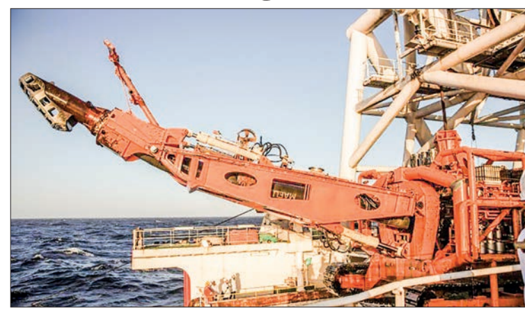
NGOs fear industry may soon be given the green light for undersea mining in the absence of solid environmental rules.

OCEAN advocates warned on Friday that the door may fly open for undersea mining in the near future in the absence of solid environmental rules that more and more nations