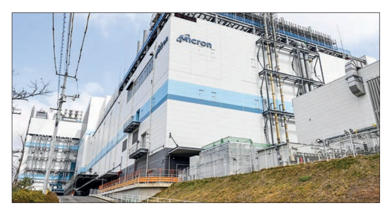
Photo taken on 22 March 2023, shows a semiconductor factory of Micron Memory Japan K.K., a subsidiary of US chip giant Micron Technology Inc, in Higashihiroshima in the western Japan prefecture of Hiroshima.

The US administration is providing huge subsidies to expand its domestic chip industry,