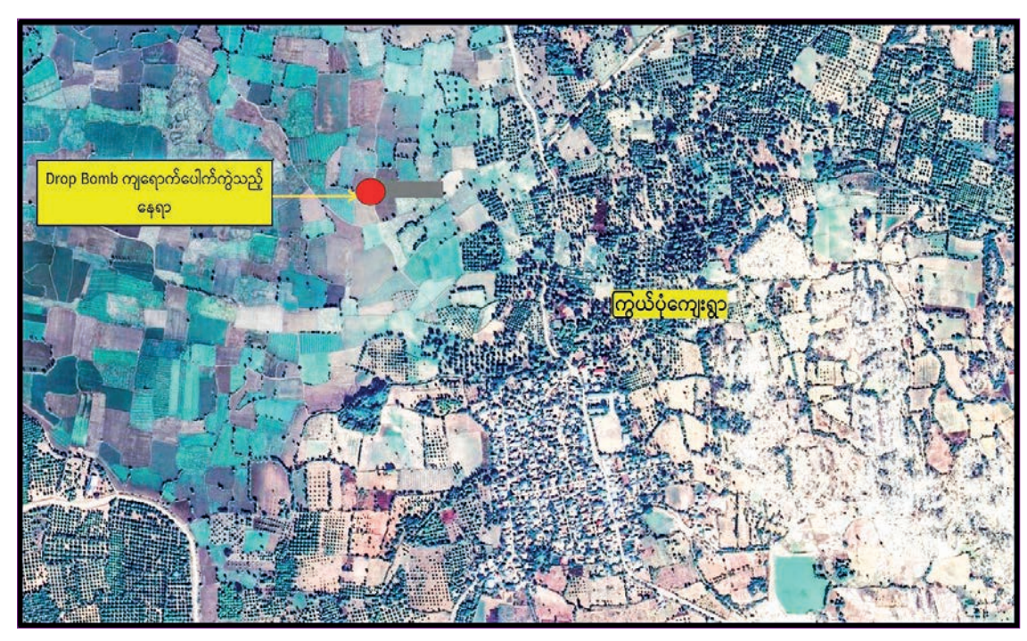
A google map shows the site where a drop bomb exploded, 800 metres northwest of Kywepon Village in Sagaing Township at 2 pm on 29 March.

It is reported that the security forces are continuing to take security measures in order to take effective action against the PDF terrorists, who commit intention of instilling fear in the innocent civilians who are peacefully working and doing their own business. — MNA