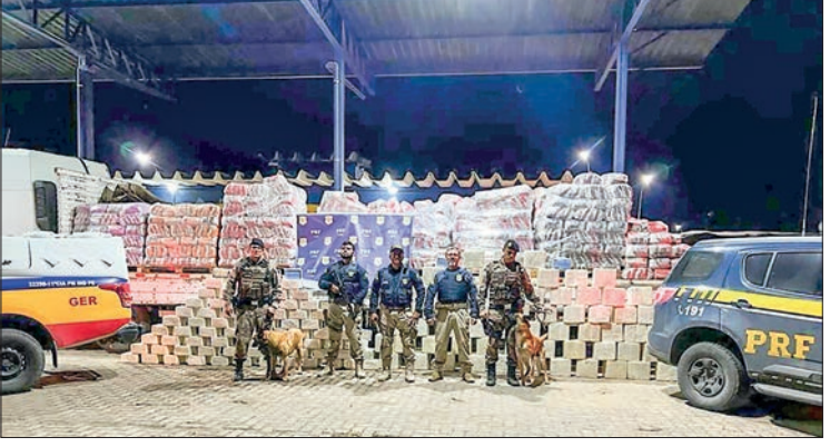
Brazil's Minas Gerais State Federal Police stand in front of a seizure of more than a ton of cocaine, which was concealed in a truck carrying cat litter, on 7 October 2022.

BRAZILIAN and European police have busted a drug-trafficking ring that shipped more