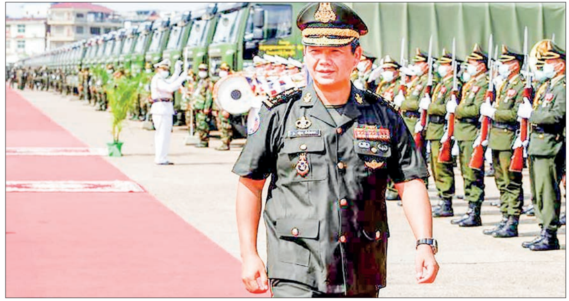
In this file photo taken on 18 June 2020, Cambodian Armed Forces deputy commander-in-chief Lieutenant General Hun Manet walks past the honour guard during a ceremony to deploy 290 purchased Chinese military trucks to its security forces at the National Olympic stadium in Phnom Penh.

Hun Sen, who has ruled the country since 1985, has hinted at stepping down but repeatedly said that he will stand again as the only candidate for prime minister in the