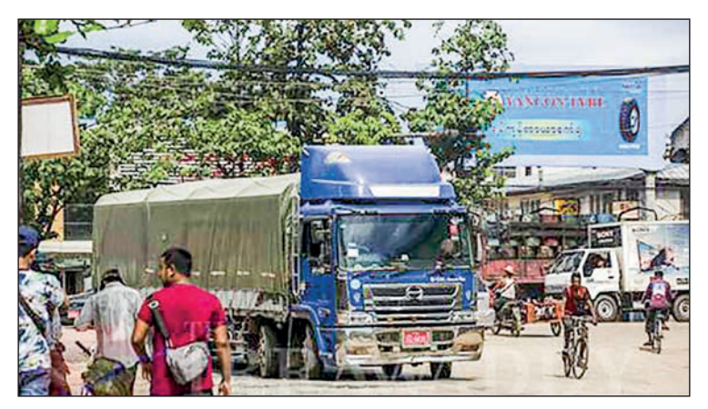
The picture shows trucks rolling near Bayintnaung wholesale market.