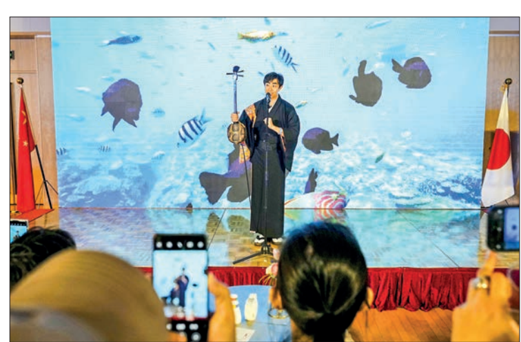
Photo taken 31 March 2023, shows Okinawan "sanshin" string instrument performance at a tourism promotion event hosted by the Japanese Embassy in Beijing.

The gathering featured a Japanese Awa Odori dance and Okinawan "sanshin" string instrument performance as well as sampling of the country's