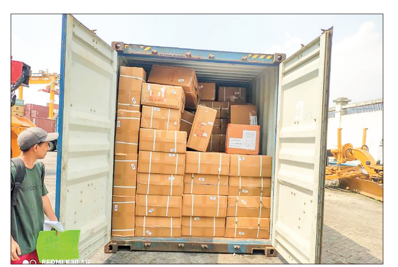
Confiscated illegal goods at Asia World Port Terminal.

THE Muse District Illegal container checkpoint confiscat- in Bamauk township. The action Trade Eradication Task Force inspected the vehicles that entering from China at the Sinphyu checkpoint in Muse township and captured 15 kinds of goods including 512 kilogrammes of cotton fabric roll worth K18,664,331 that were duty-free not paid custom duties by the side of the road over the Sinphyu checkpoint on 30 March. The action was taken under Customs procedures.