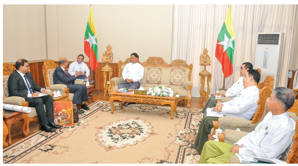
The Indian ambassador calls on Deputy Prime Minister MoTC Union Minister Admiral Tin Aung San yesterday.

The meeting was attended by the deputy minister for Transport and Communications and relevant departmental officials.