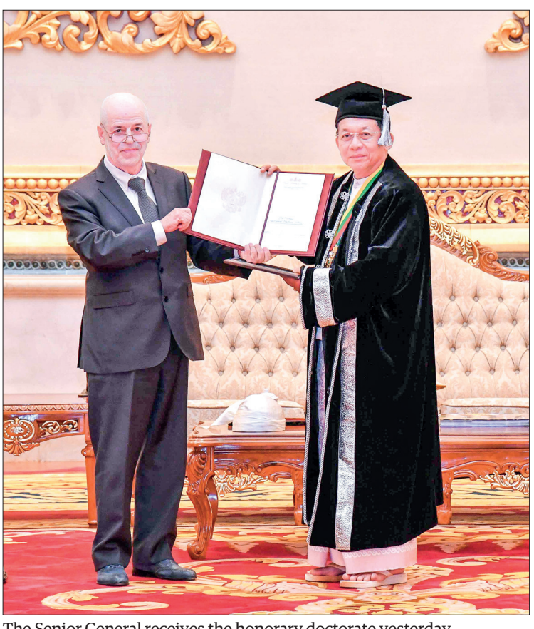
The Senior General receives the honorary doctorate yesterday.