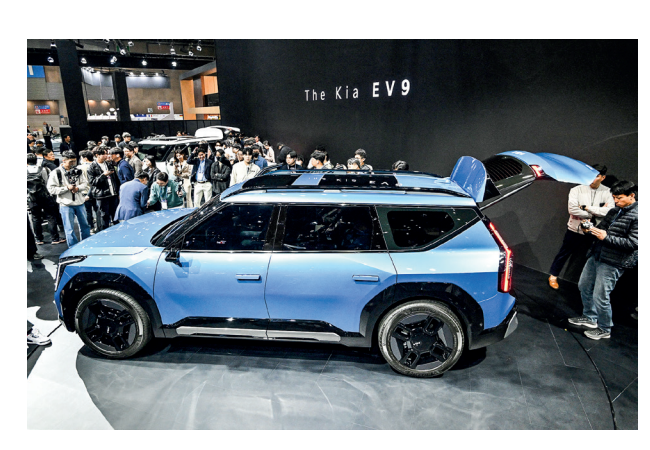
Visitors look at a Kia EV9 during a press preview of the 2023 Seoul Mobility Show at the KINTEX exhibition hall in Goyang on 30 March 2023.

SOUTH Korean carmakers' global automotive sale grew in double digits last month thanks to solid demand both at home and abroad, industry data showed on Monday.