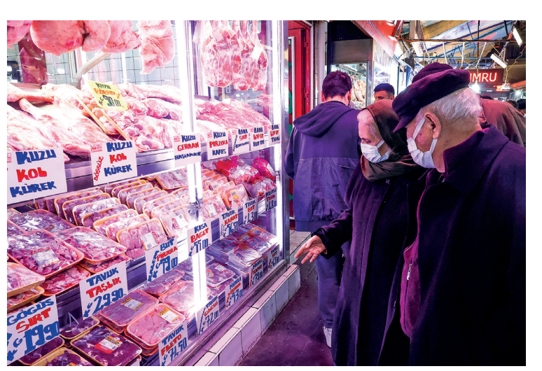
A couple of elderly look at high meat prices at a butcher in the historic Ulus district in Ankara on 27 January 2023.

delivering another boost for President Recep Tayyip Erdogan ahead May elections.