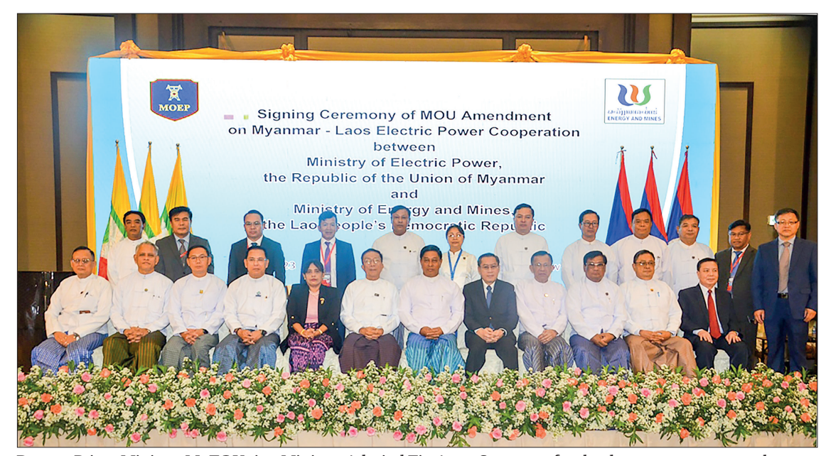
Deputy Prime Minister MoTC Union Minister Admiral Tin Aung San poses for the documentary group photo at the signing event yesterday.

After that, Laos Minister of Energy and Mines Phoxay Sayasone said the two countries approved extending the MoU on electricity cooperation for five years at the 5th Joint Working Committee (JWC) meeting and the 6th Joint Working Group (JWG) meeting. The MoU in-