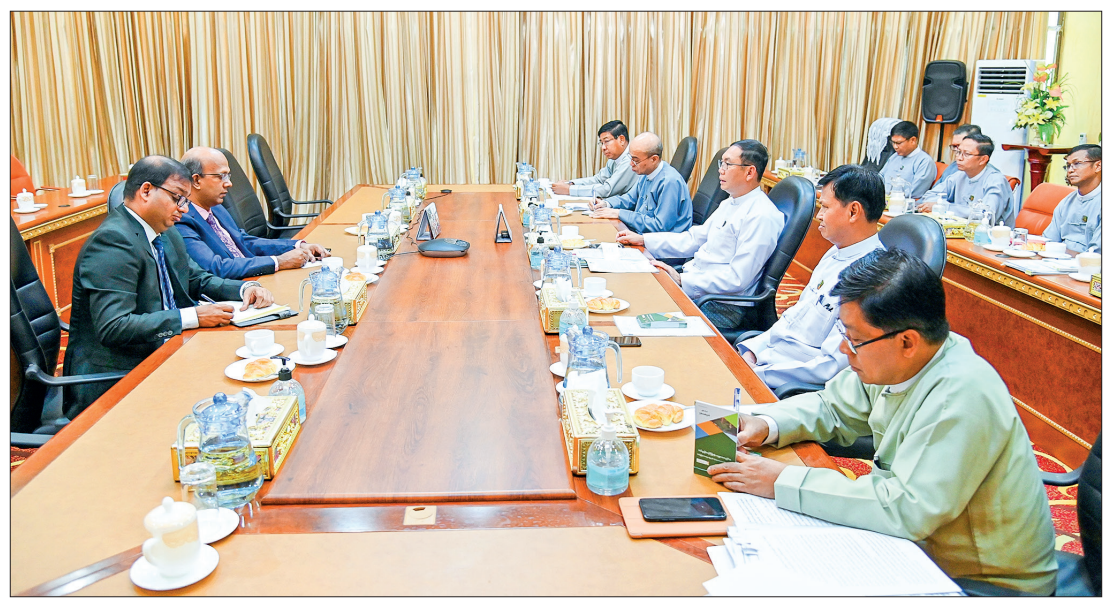
Union Minister U Khin Maung Yi meets Indian Ambassador Mr Vinay Kumar in Nay Pyi Taw yesterday.

UNION Minister for Natural Resources and Environmental Conservation U Khin Maung Yi met Mr Vinay Kumar, Indian ambassador to Myanmar, at the lounge of the ministry in Nay Pyi Taw yesterday morning.