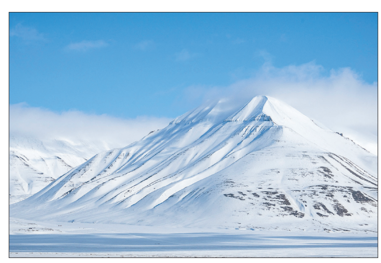
(FILES) This file photo taken on 4 May 2022 shows a view of mountains near Longyearbyen, located on Spitsbergen island, in Svalbard Archipelago, northern Norway. A team of researchers will start digging ice on 4 April 2023, in the Arctic archipelago of Svalbard, in a race against time to extract centuries of climate and environmental data before they disappear due to climate change, the Ice Memory foundation. announced on 3 April 2023.

Ice scientists "are seeing their primary material disappear forever from the surface of the planet", Jerome Chapellaz,