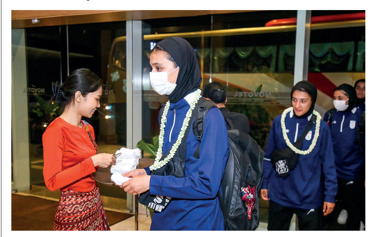
Iranian women footballers are welcomed by the young Myanmar woman (left) at the Yangon International Airport on 2 April 2023.

THE Iranian women's national football team, which will compete with the Myanmar women's national football team in the qualifiers for the 2024 Paris Olympics women's football tournament (Asia Zone), arrived in Yangon on the evening of 2 April.