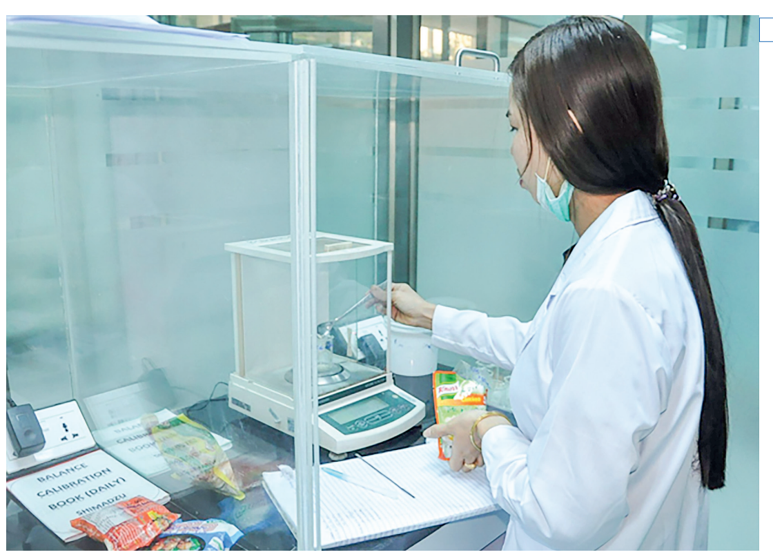
The test for a ready-to-eat food product is running in an FDA laboratory.

IN order to encourage and promote micro, small and medium-sized enterprises (SMEs), the amount to be paid for applications for food production approval has been changed by the Food and Drug Administration Department under the Ministry of Health starting from 1 April.