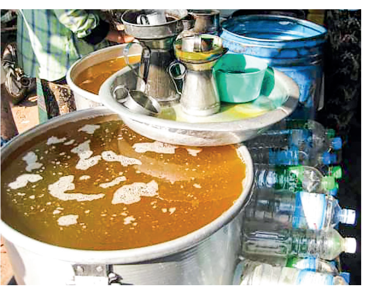
The domestic consumption of edible oil is estimated at a million tonnes per year. The local cooking oil production is just about 400,\!000 tonnes.

The death toll from COVID-19 in the country remained unchanged at 19,490 on 3-4-2023 with no new death reported from the pandemic. — GNLM