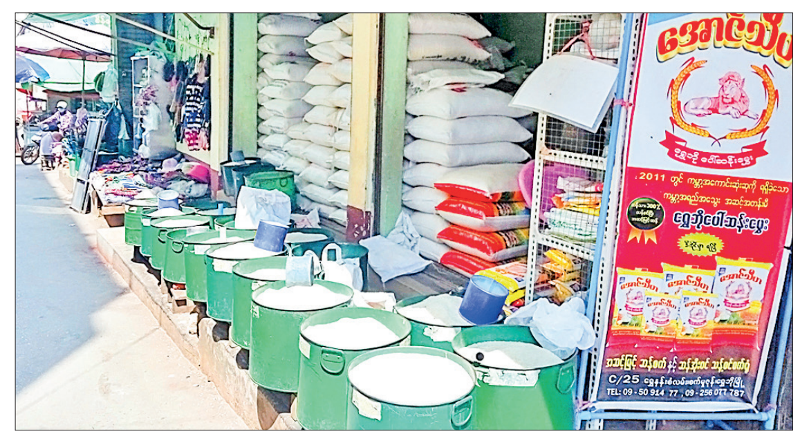
One of the rice retail outlets in Yangon.

The prices of Pawsan rice climbed up to K75,000-93,000 per bag on 3 April. The prices of various rice varieties were up