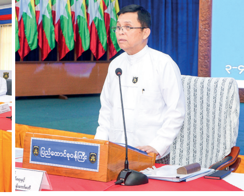
Union Minister U Myint Kyaing chairs the Immigration and Citizenship Verification Work Committee meeting 2/2023 in Nay Pyi Taw yesterday.

agreement. It also verified the lists sent by Bangladesh until the end of February 2023 and made replies for over 87,000 persons - over 56,000 who used to live in Myanmar, about 900 who are on the lists of terrorists by the Ministry of Home Affairs