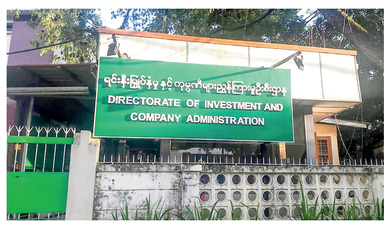
The photo shows an office building of Directorate of Investment and Company Administration-DICA.

This move is to support the anti-money laundering and counter-terrorism financing law. According to Section 97 of the Myanmar Companies Law, all