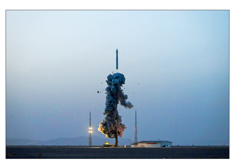
A Long March-11 carrier rocket carrying the Shiyan-19 satellite blasts off from the Jiuquan Satellite Launch Centre in northwest China, 15 March 2023.