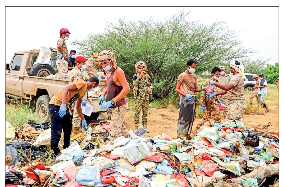
Security forces of the Saudi-backed and internationally recognized Yemeni government prepare to incinerate packages of what is reportedly believed to be narcotics on 5 October 2021.

Ports on the North Sea like Antwerp, Rotterdam, and Hamburg, meanwhile, have eclipsed traditional entry points in Spain and Portugal, for cocaine arriving in Western Europe. Traffickers are also diversifying their routes in Central America by sending more and more cocaine to Europe, in addition to North America.