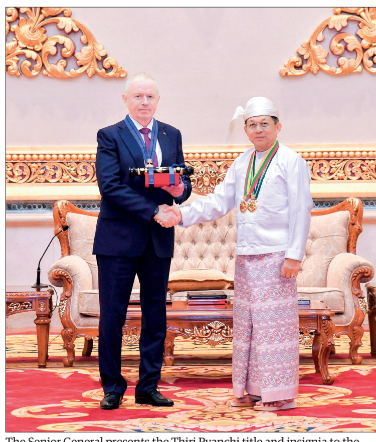
The Senior General presents the Thiri Pyanchi title and insignia to the Colonel General.