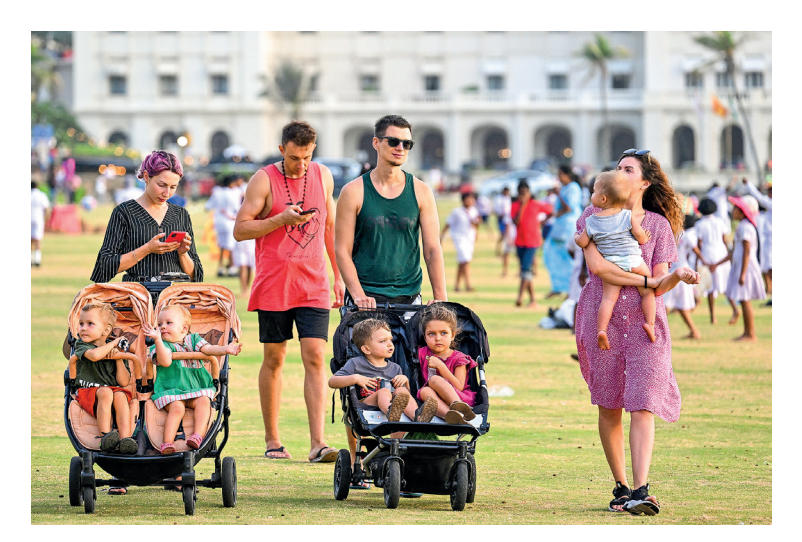
Tourist visit the Galle Face Green promenade in Colombo on 13 January 2023.