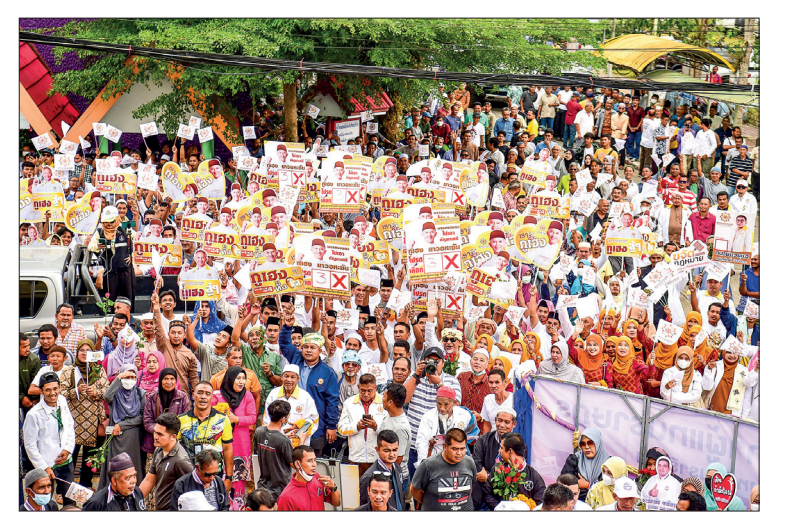
Supporters of Prachachat party hold placards during the first day of the constituencies candidates registration for the upcoming general election, in southern Thai province of Narathiwat on 3 April 2023.