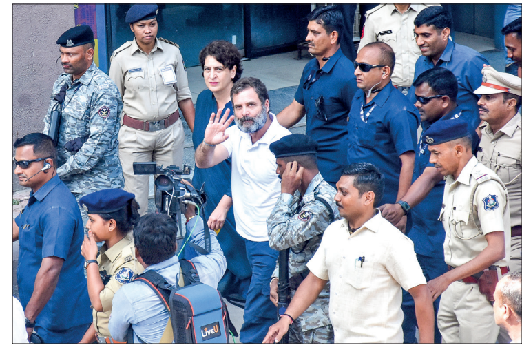
India's Congress party leader Rahul Gandhi (C) arrives at a court in Surat on 3 April 2023. India's parliament was adjourned twice on 3 April after lawmakers held rowdy protests and threw paper at the speaker following the expulsion from the house of top opposition figure Rahul Gandhi.

Modi's government is widely accused of using the defamation law to silence critics, and the case in the premier's home state of Gujarat is one of several