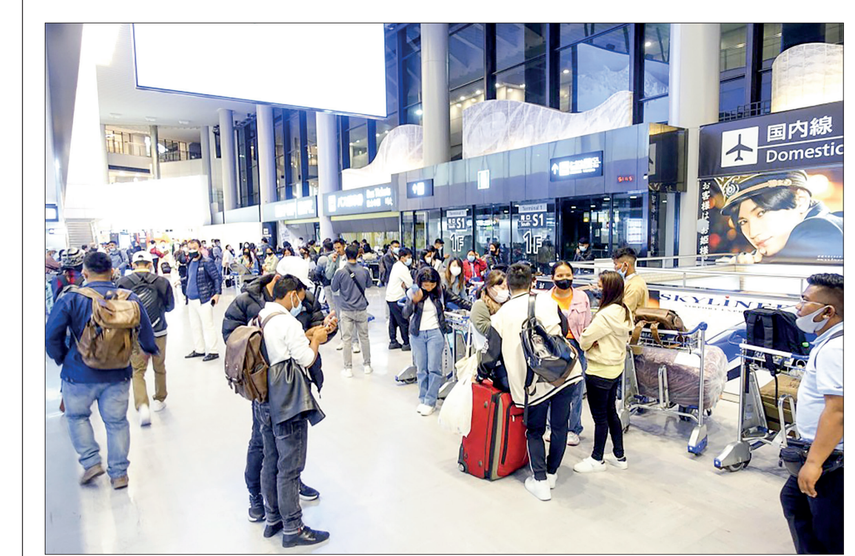
Travellers gather in the international arrivals lobby at Narita airport near Tokyo on 7 April 2022.

According to the relaxed restrictions, which may go into effect in early April, as long as they have received at least three doses of a Covid-19 vaccine, passengers from mainland China will no longer be required to produce documentation of a negative coronavirus test done 72 hours or less before departure.