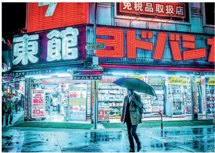
The social withdrawal phenomenon affects a broad swathe of society, from teens to the elderly.

"It seems that some people happened to meet our definition of hikikomori because they were discouraged from going outside by Covid and so ended up having less contact with society," Cabinet Office official Koji Naito told AFP on Wednesday.—AFP