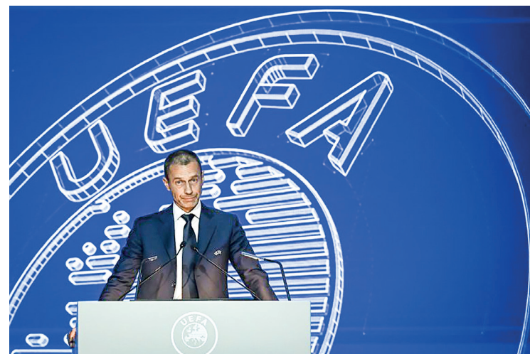
Aleksander Ceferin delivers a speech at the UEFA Congress in Lisbon on Wednesday.

"It is a great honour but mainly it is a great, great responsibility, towards you and towards football."