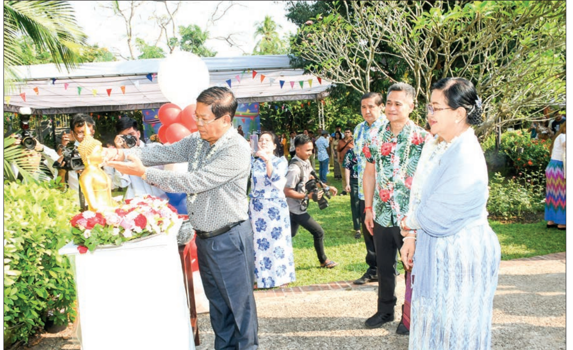
Union Minister U Than Swe sprinkles the water on the Buddha image at the Thai traditional Songkran Festival yesterday.

Then, the MoFA Union minister, the MoRAC deputy minister, the Thai ambassador, the Chinese ambassador, the Cam-