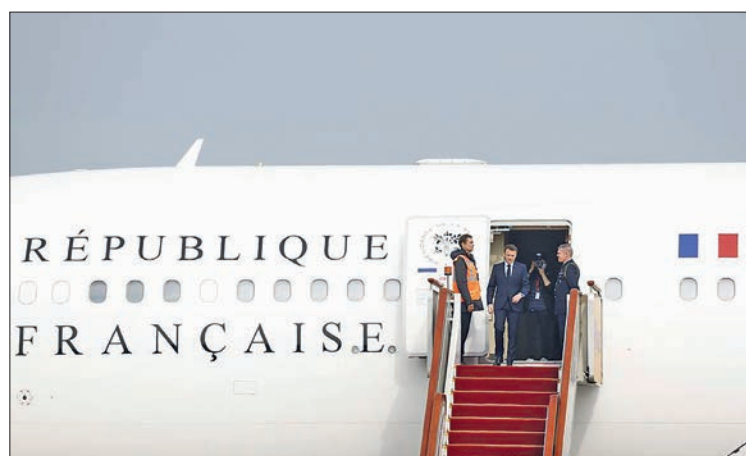
French President Emmanuel Macron landed in Beijing at around 3:15 pm.

France to take this visit as an opportunity to produce new outcomes in the close and enduring comprehensive strategic partnership between the two coun-