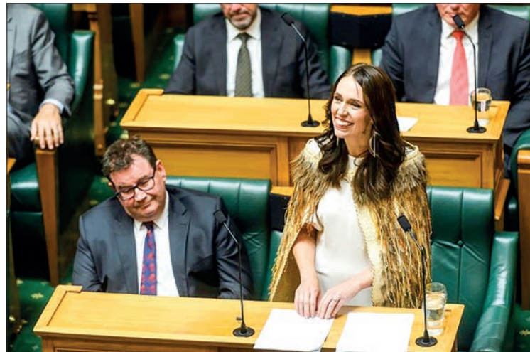
Outgoing New Zealand Prime Minister Jacinda Ardern gives her valedictory speech in parliament in Wellington on 5 April 2023.

"It was a cross between a sense of duty to steer a moving freight train... and being hit by one," she quipped during her valedictory address.