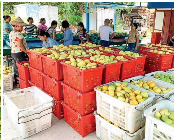
There are over 200 mango varieties grown in the country, covering over 257,000 acres. The commercially valued mangoes are Seintalone, Shwe Hintha, Padamyar Ngamauk and Maethi.