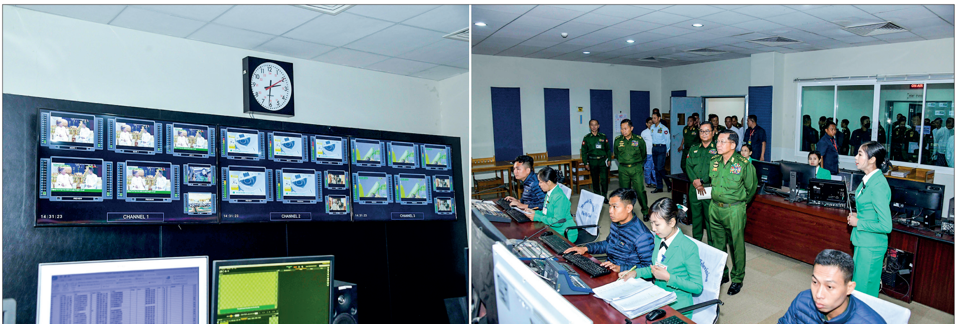
State Administration Council Chairman Commander-in-Chief of Defence Services Senior General Min Aung Hlaing views the work process of the Myawady TV station in Nay Pyi Taw yesterday.

E VERYBODY can see that Myawady TV, a part of the Tatmadaw, has dutifully served its assignment as the fourth estate in successive eras, said Chairman of the State Administration Council Commander-in-Chief of Defence Services Senior General Min Aung Hlaing on the 28 th anniversary of Myawady TV at No 2 Tatmadaw TV Broadcasting Unit under the Directorate of