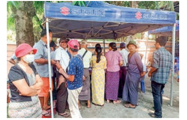
The Myanmar Motion Picture Organization is providing food commodities to industry-based members on 5 April 2023.