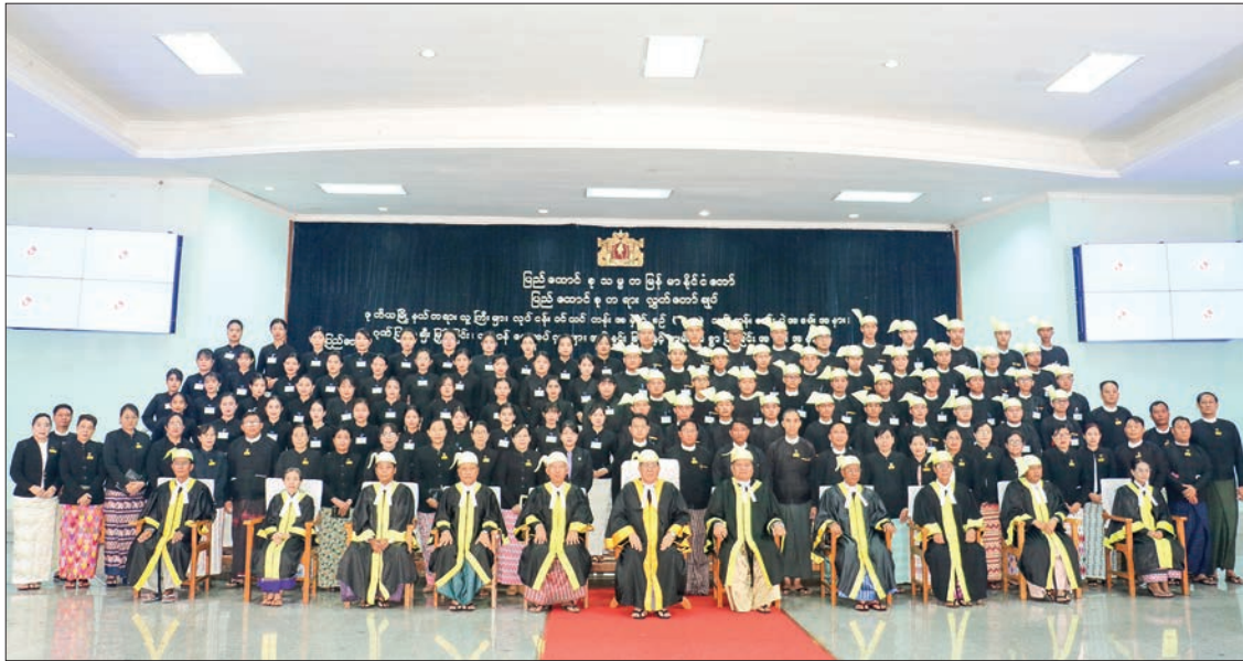
The documentary group photo of the Township Deputy Judge Training Course No 31 held at the Union Supreme Court yesterday.

Speaking at the ceremonies, Union Chief Justice U Htun Htun Oo said the outstanding trainees can uplift dignity individually in addition to personal skills such as talent, endeavour and studying. The remaining judicial officials should look up to these outstanding trainees and try hard to be skilful in judiciary processes. They should apply the experience in practical sections and make the decision based on their critical thinking as per procedural guidelines with