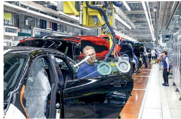
Germany had a surprise jump in factory orders in February.

New orders, seen as an indicator of future industrial activity, surged by 4.8 per cent on the previous month thanks to strong domestic and eurozone demand.—AFP