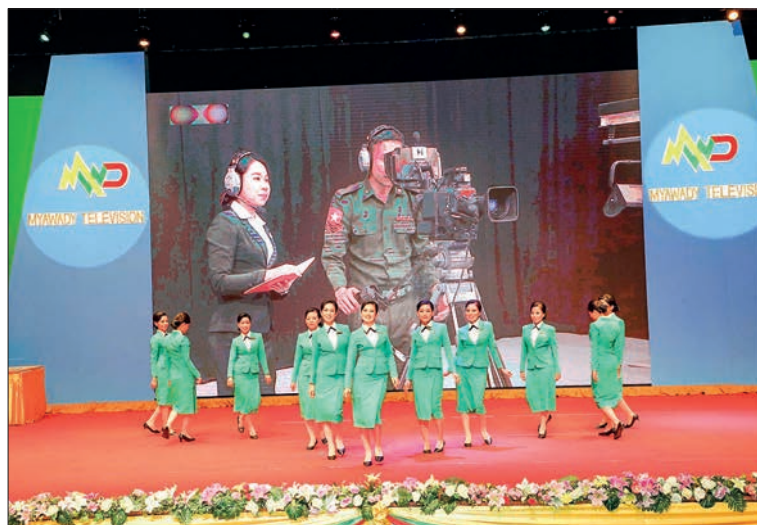
The Senior General watches the song performance of the Myawady TV staff yesterday.

Some media do not follow media ethics and present information with bias and unfairness. They attempt to tarnish images of the Tatmadaw and its efforts for proper public re-