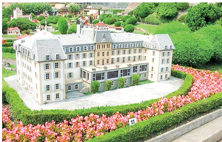
In this file photo the headquarters of the International Committee of the Red Cross (ICRC) is seen in Geneva. PHOTO: WIKIMAPIA.ORG

The ICRC has 20,000 staff spread across more than 100 countries. ICRC initially appealed to donors for 2.8 billion Swiss francs for its work this year.— AFP