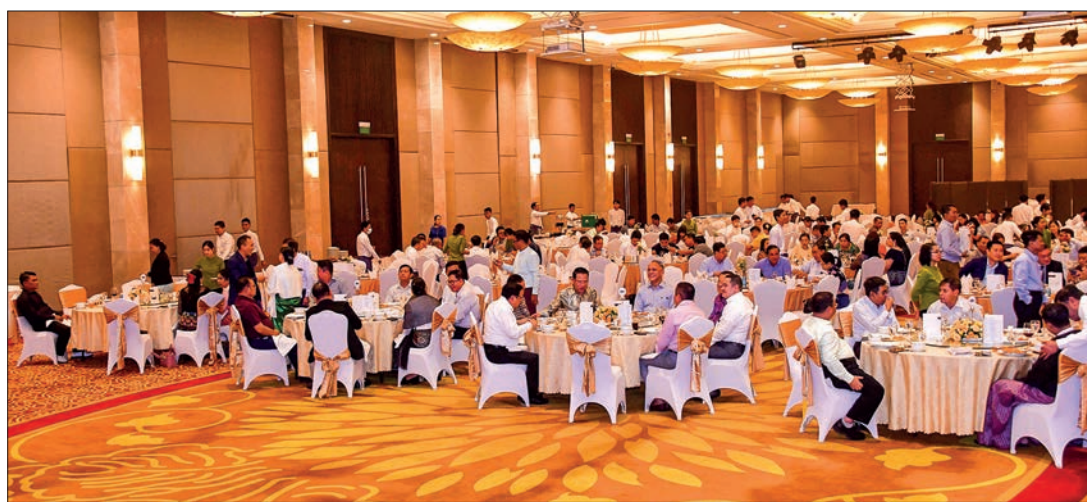
The honorary dinner held yesterday in Nay Pyi Taw to mark the successful export of high-quality rice to Bangladesh.