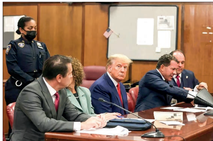
Former US president Donald Trump appears in court at the Manhattan Criminal Court in New York.

Manhattan District Attorney Alvin Bragg is prosecuting Trump for cooking his company's books to hide payments he arranged to adult film actress Stormy Daniels days before the 2016 election, to cover up an alleged sexual encounter a decade earlier.—AFP