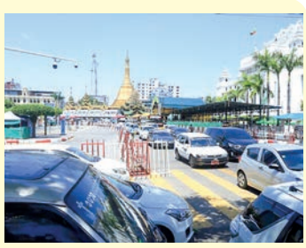
Traffic congestion was seen on Maha Bandula Road in the hub of Yangon in 2022.