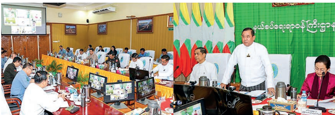
Union Minister Lt-Gen Tun Tun Naung addresses the coordination meeting yesterday.

Then, members of the committee and officials discussed the progress that had been made in the re-admission of displaced persons and the activities that should be undertaken in the future. — MNA/KZW