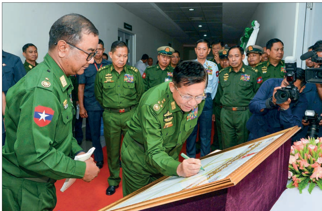
The Senior General signs the booth of the Myawady TV anniversary occasion and the guest book of the No 2 Tatmadaw TV Broadcasting Unit.

Myawady TV was commissioned into service on the Golden Jubilee (50 th Anniversary) Armed Forces Day on 27 March 1995. No 2 Tatmadaw TV Broadcasting Unit was established on 19 June 2009 and successfully commissioned into service by the SAC Chairman Commander-in-Chief of Defence Services on 26 March 2012. Myawady TV is standing tall as a dutiful media for the State, the people and the Tatmadaw with the aim of informing, educating, performing and organizing in order that the Tatmadaw and the people have a sense of oneness with each other.