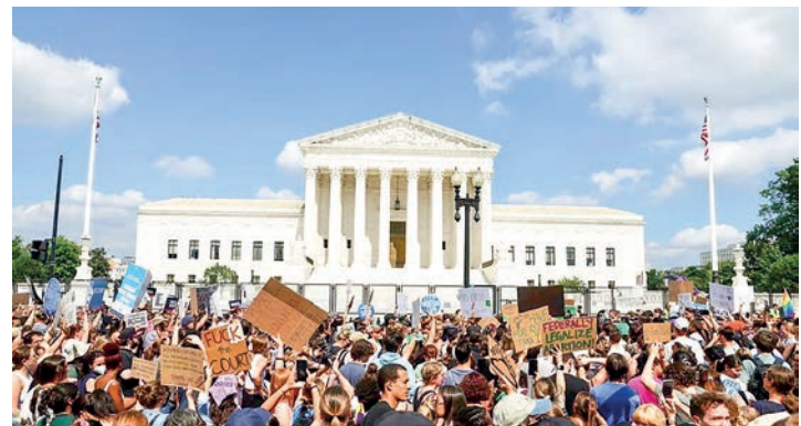
The US Supreme Court last year overturned its landmark Roe v. Wade ruling, striking down the nationwide right to an abortion and leaving the decision on whether to allow the procedure up to individual states.

US abortion rights advocates were overjoyed Tuesday, after media projections showed a liberal judicial candidate winning a closely-watched election in Wisconsin, flipping the northern state's supreme court from conservative control.