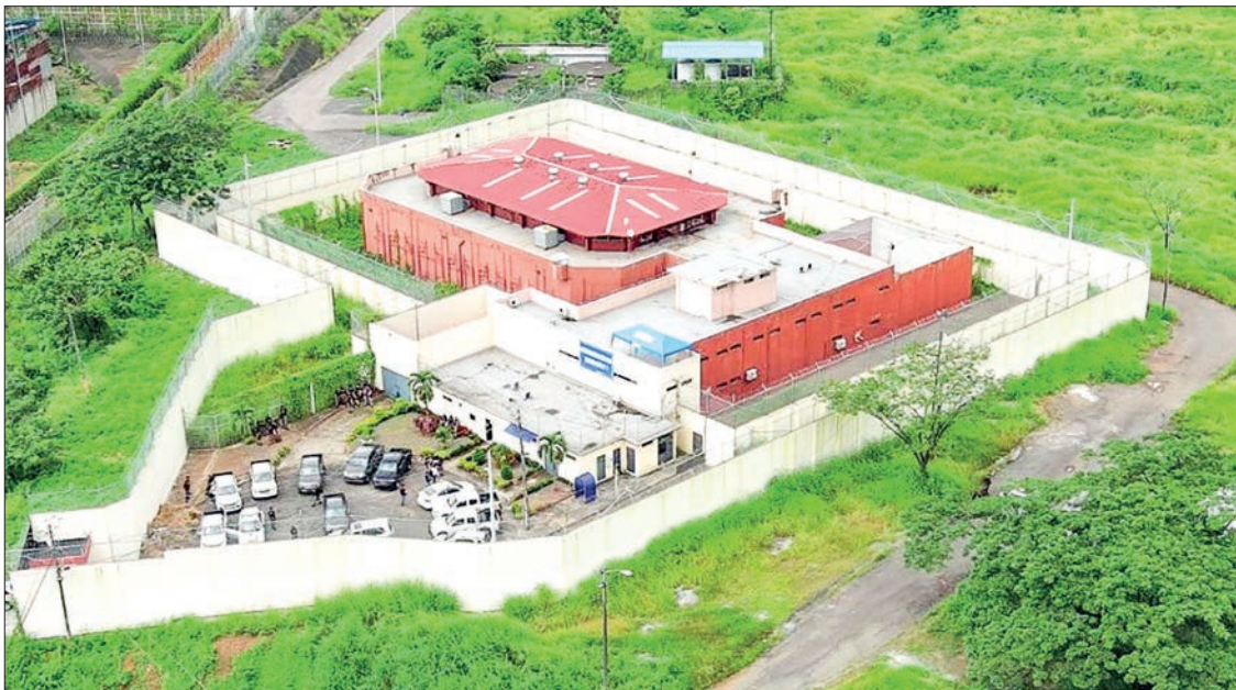
Aerial view of the La Roca maximum security prison in Guayaquil, Ecuador.

The maximum security facility has a capacity for some 150 inmates and was housing 23 prisoners at the time, most of them leaders of drug trafficking gangs engaged in a bloody struggle for power inside the prisons and on the streets.—AFP