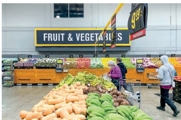
People shop at a supermarket in Wellington, New Zealand, 18 July 2022.

New Zealand's economic growth is set to ease through 2023, the central bank said, citing