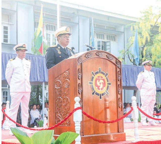
SAC Member Deputy Prime Minister MoTC Union Minister Admiral Tin Aung San speaks on the 14 th graduation occasion of the Myanmar Mercantile Marine College in Yangon yesterday.

He also delivered a graduation speech adding the glorious history of MMMC over 50 years and explained job opportunities for the graduate officers in the water transport sector under the ministry or by linking with foreign shipping companies and the need to make efforts in worksites based on the skills and to become