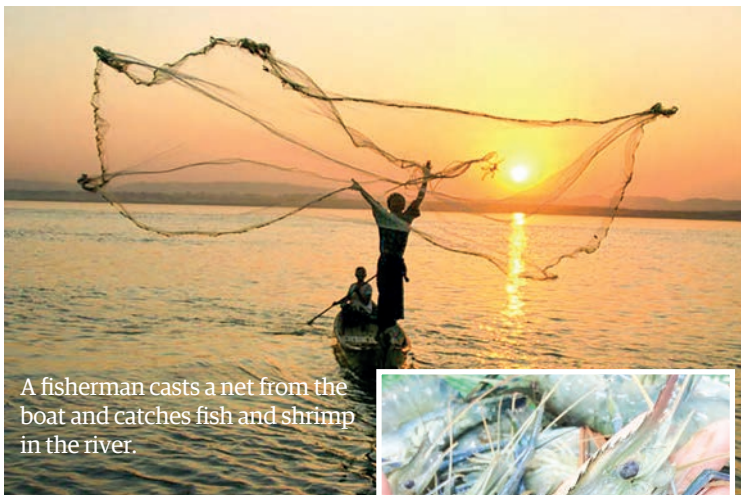
A fisherman casts a net from the boat and catches fish and shrimp in the river.