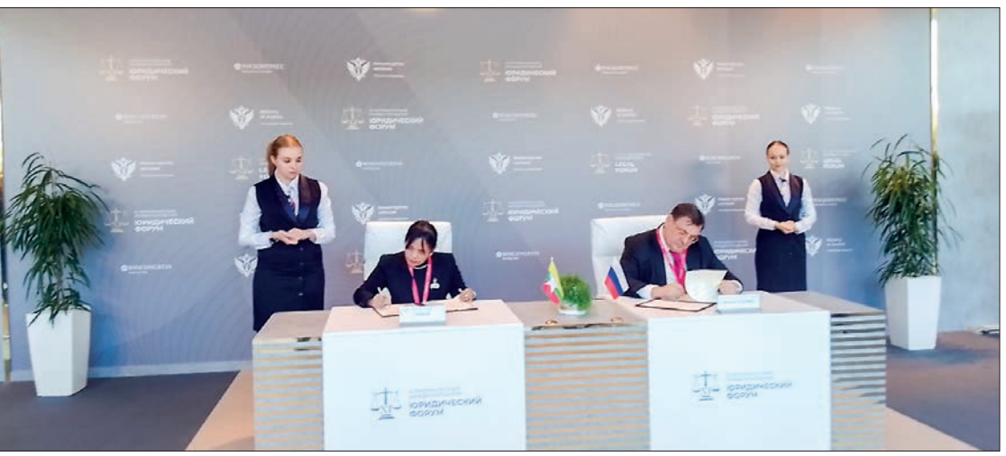
Union Minister for Legal Affairs Union Attorney-General Dr Thida Oo signs MoCs with the Russian Prosecutor-General Office and the Ministry of Justice.

Under the topic of Interaction between Ministries of Justice: New Trends and Approaches, the Union minister said the ministry conducted training sessions for legal officers and their qualifications and skills are recorded in the digital system. Only one country cannot prevent cybercrime, digital crimes and human trafficking but with cooperation with other countries. Therefore, international cooper-