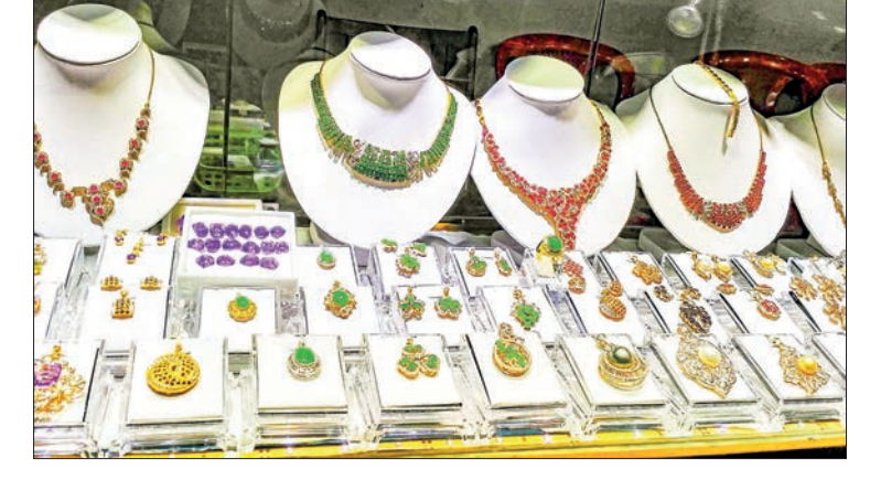
Gold jewellery is seen at one gold outlet in Yangon.

YGEA calculated the price depending on the Central Bank of Myanmar's reference exchange rate of K2,100, with some addition, while the US dollar is exchanged at K2,860 in the unofficial forex market. The US dollar exchange rate weighs on domestic gold prices. The YGEA requested sellers to make gold transactions below K2.9 million per tical on 27 April when the gap between the reference price and the market price is wide. Following the bankruptcy of the US bank, the gold price soared. Despite the gold gain in the global market, Myanmar's forex market sees no movement at all. Consequently, YGEA requested its members not to buy them competitively, tracking the