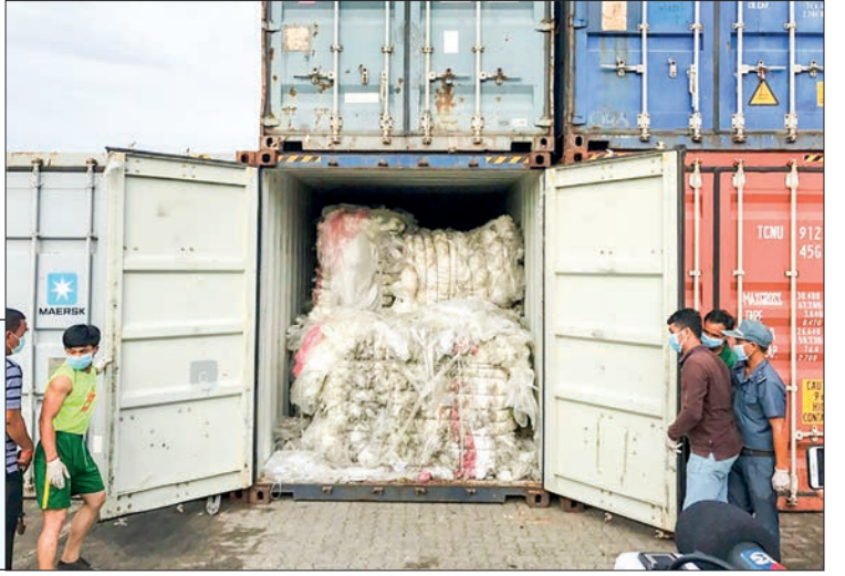
Photo taken on 16 July 2019 shows containers filled with plastic waste at the Sihanoukville Autonomous Port in Preah Sihanouk Province, Cambodia.

2030," Cambodian Deputy Prime Minister and Interior Minister Sar Kheng said in the statement. — Xinhua