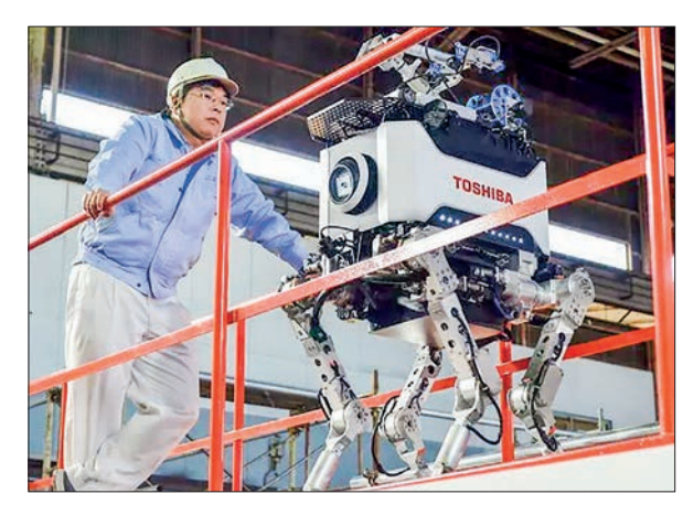
Toshiba Machine offers robot models. Toshiba unveiled a remote-controlled robot resembling a headless dog.

JAPANESE conglomerate Toshiba on Friday said full-year net profit fell by more than a third due partly to weak sales in electronic devices and other one-off factors.