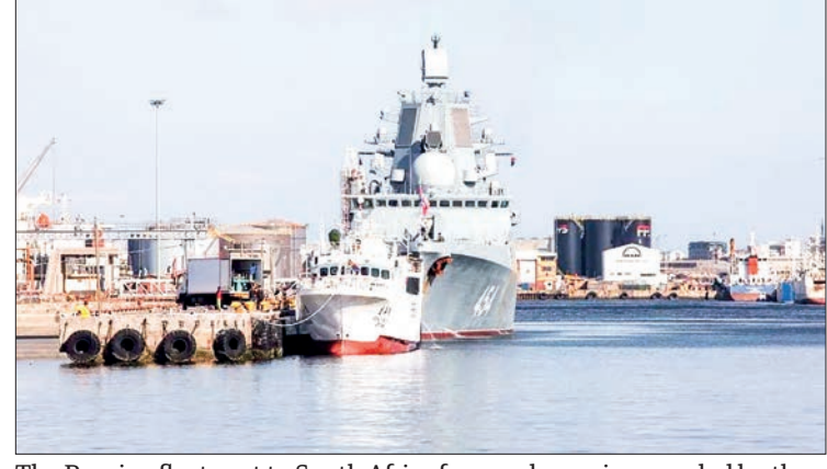
The Russian fleet sent to South Africa for naval exercises was led by the Admiral Gorshkov warship, seen here in Cape Town in February.

The country has strong economic and trade relations with the United States and Europe. Trade with Russia is much smaller, but Pretoria has ties with Moscow dating back decades, to when the Kremlin supported the ruling African National Congress (ANC) party in its struggle against apartheid. The announcement of a probe was welcomed by the United States but met with ridicule and bewilderment at home. - AFP