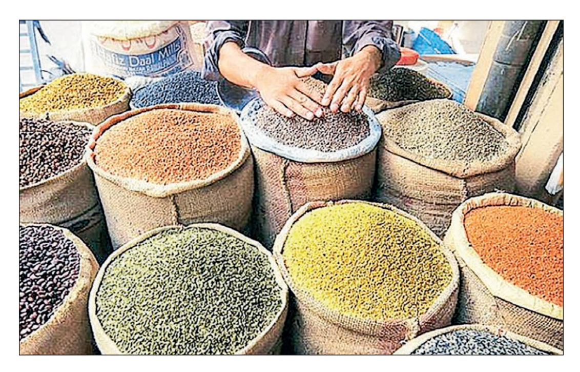
A grocery is seen displaying baskets of various pulses in the Yangon market

THE pigeon pea price surged to K2.52 million per tonne when the black gram price touched the highest of K2.215 million per tonne, reaching an eight-month high in mid-May 2023.