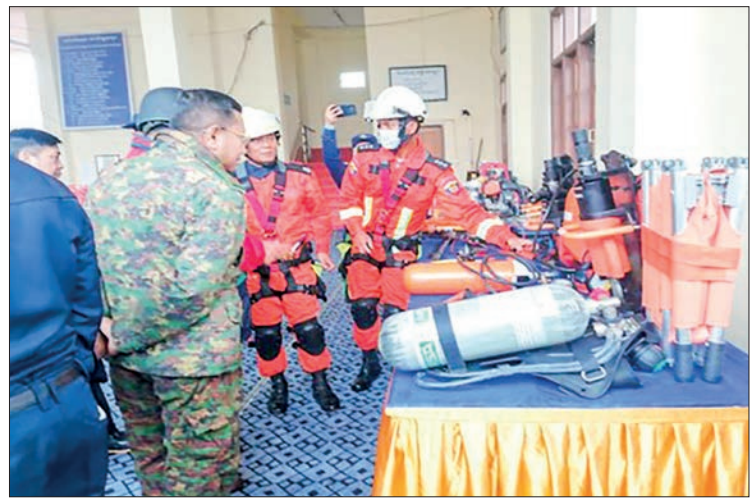
Role-playing exercises for rescue and rehabilitation operations are being conducted.

The chief minister delivered a speech and coordinated the necessary actions based on the presentations of those who attended the meeting. — MNA/ KZL