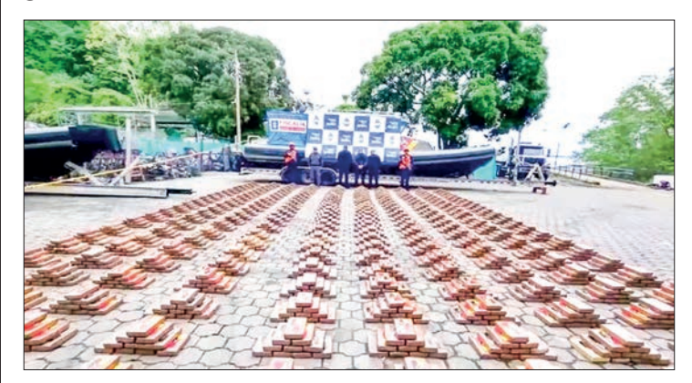
The semi-submersible vessel was intercepted Tuesday on its way to Central America. PHOTO: AFP

guard and other authorities. tonnes. — AFP