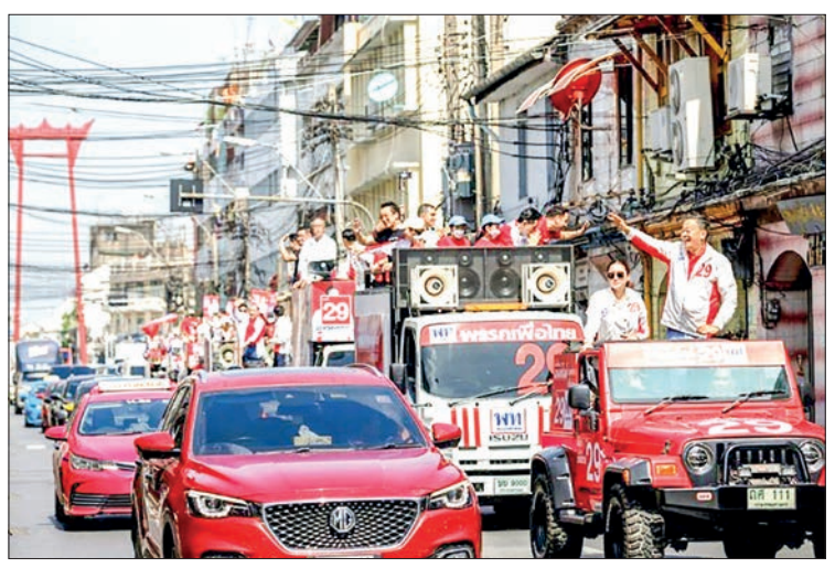
The Pheu Thai party's prime ministerial candidates Paetongtarn Shinawatra (2<sup>nd</sup> R) and Srettha Thavisin (R) ride an open-top jeep during campaigning in Bangkok.

But in a country where coups and court rulings have often overturned election results, there are fears the military could seek to cling on -- despite the army chief insisting there would