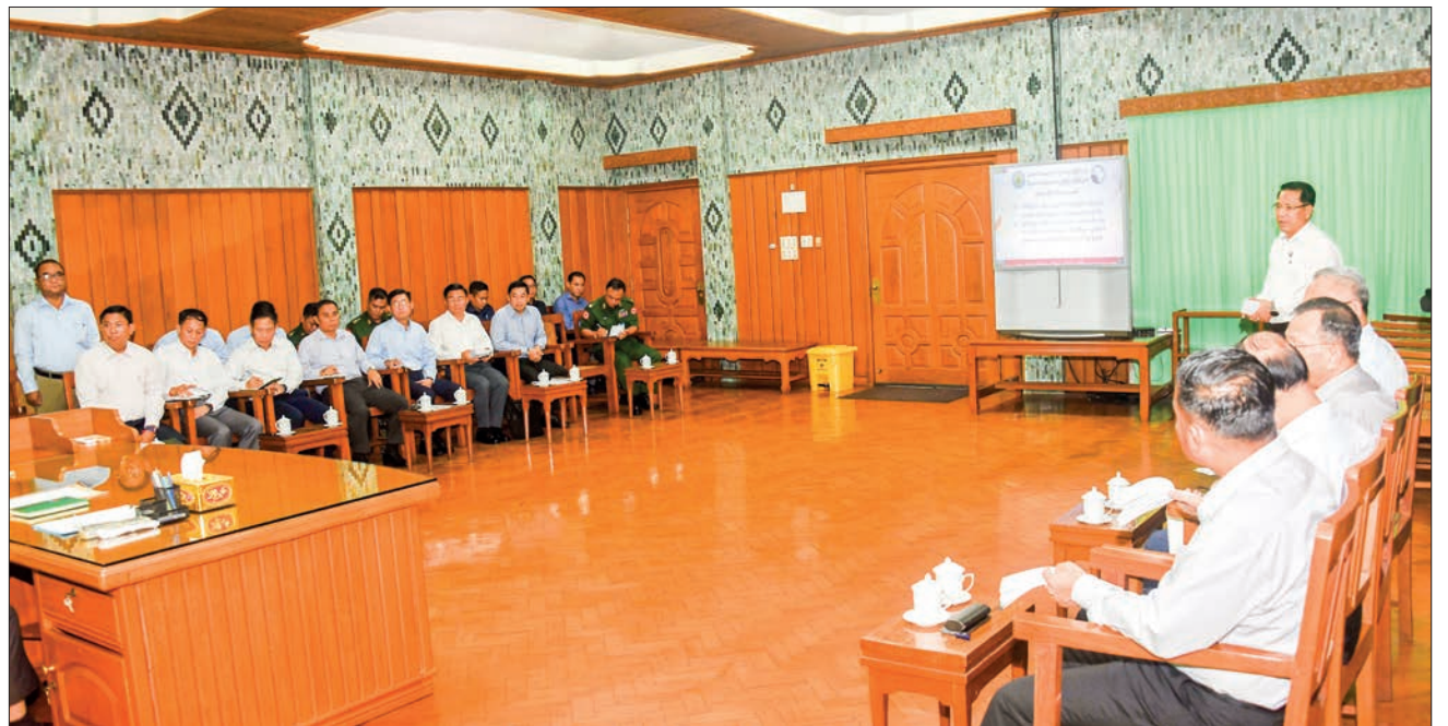
Chairman of the State Administration Council Prime Minister Senior General Min Aung Hlaing attends the natural disaster management emergency meeting at the hall of the Commander-in-Chief on 14 May 2023.

CHAIRMAN of the State Administration Council Prime Minister Senior General Min Aung Hlaing attended the natural disaster management emergency meeting at the hall of the Commander-in-Chief yesterday morning in order to assign the duties of emergency management, response, rescue and cooperation and readiness with grouping and rehabilitation as cyclonic storm Mocha may enter Myanmar.