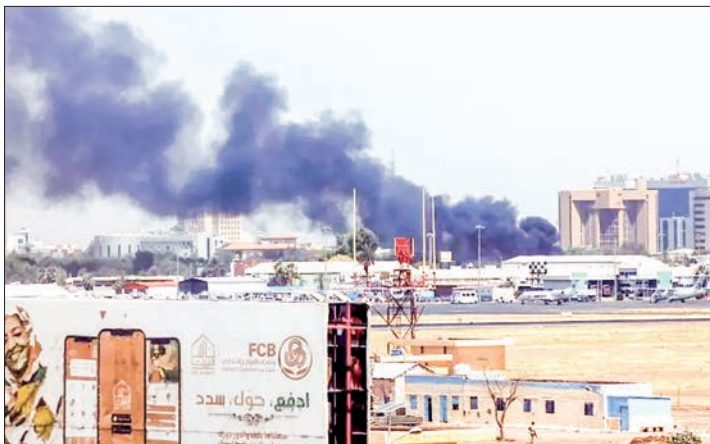
Video clips on social media showed the damage to the Khartoum International Airport due to the fighting between the warring sides. Heavy smoke bellows above buildings in the vicinity of the Khartoum's airport on 15 April 2023, amid clashes in the Sudanese capital.

Since the outbreak of the clashes on 15 April, the country's airspace has been closed as air navigation systems at Khartoum International Airport have been affected by the clashes between the two warring sides in the vicinity of the airport, according to the authority.