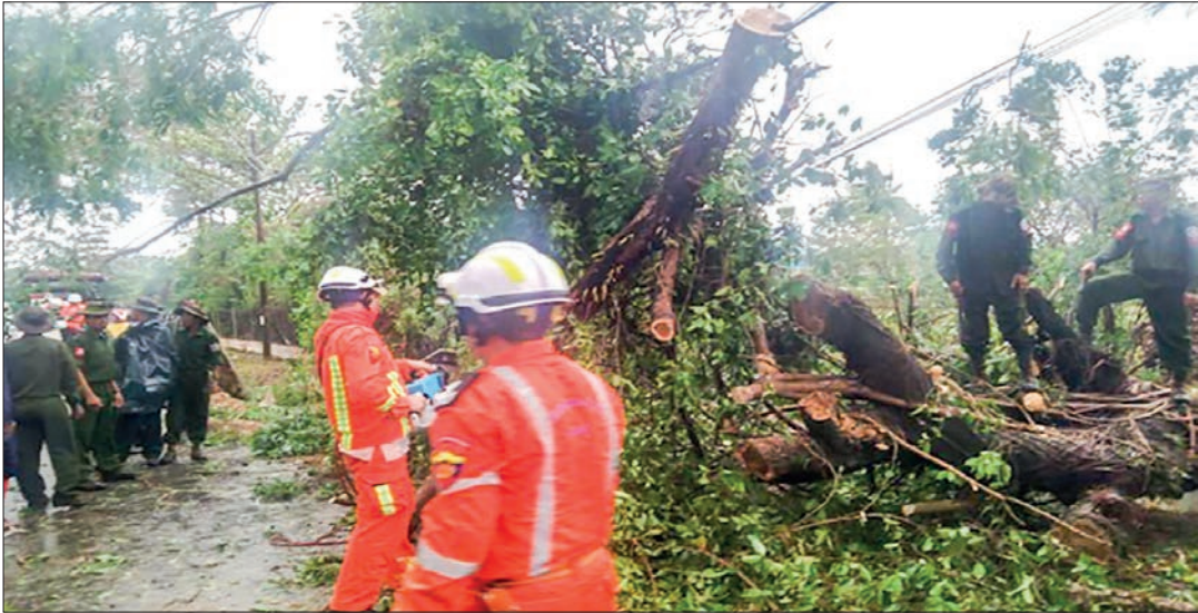
Personnel and volunteers clear debris of broken branch from road in Kyaukpyu on 14 May.