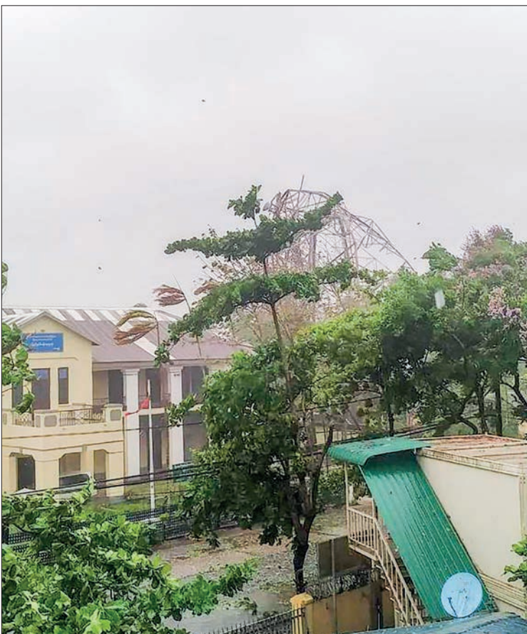
Photo shows broken tower triggered by Cyclone Mocha in Sittway of Rakhine State on 14 May.