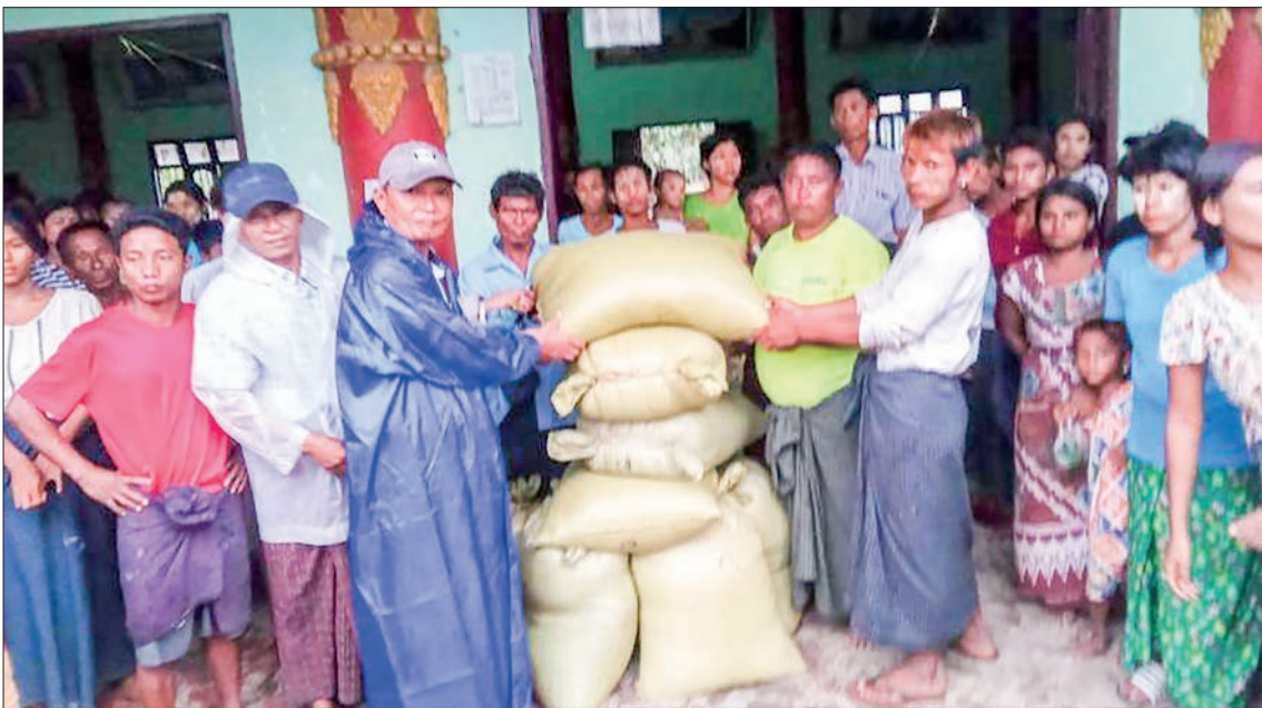
Local authorities present bags of rice and cooking oil to locals in Pauktaw and MraukU townships on 14 May.