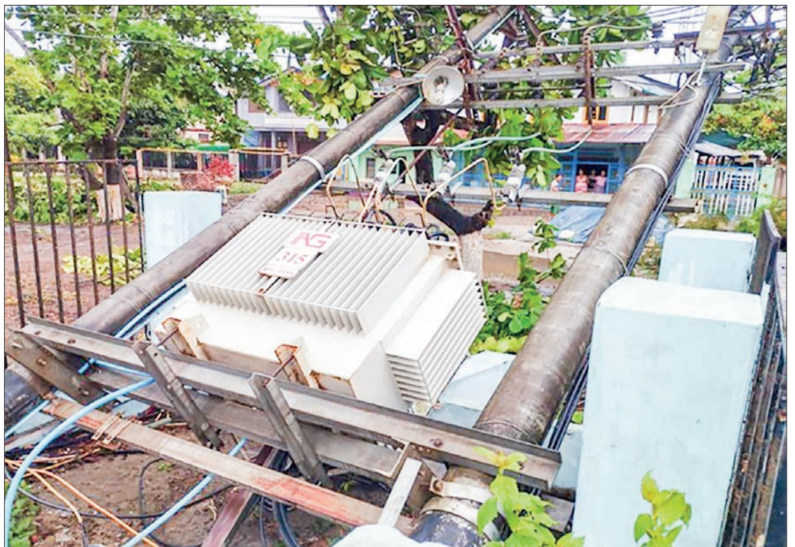
A transformer fell in residential ward in Gwa Township of Rakhine State on 14 May.