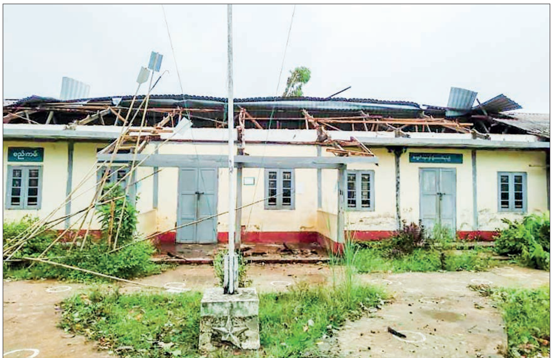
Roofs blown off at a basic education school in Einme in Ayeyawady Region on 14 May.