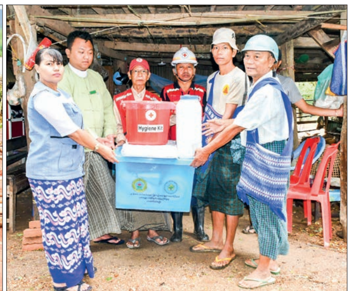
Storm-affected people being served with foods, relief supplies in Bogale, Kyauktalonggyi and Pyay townships on 14 May.