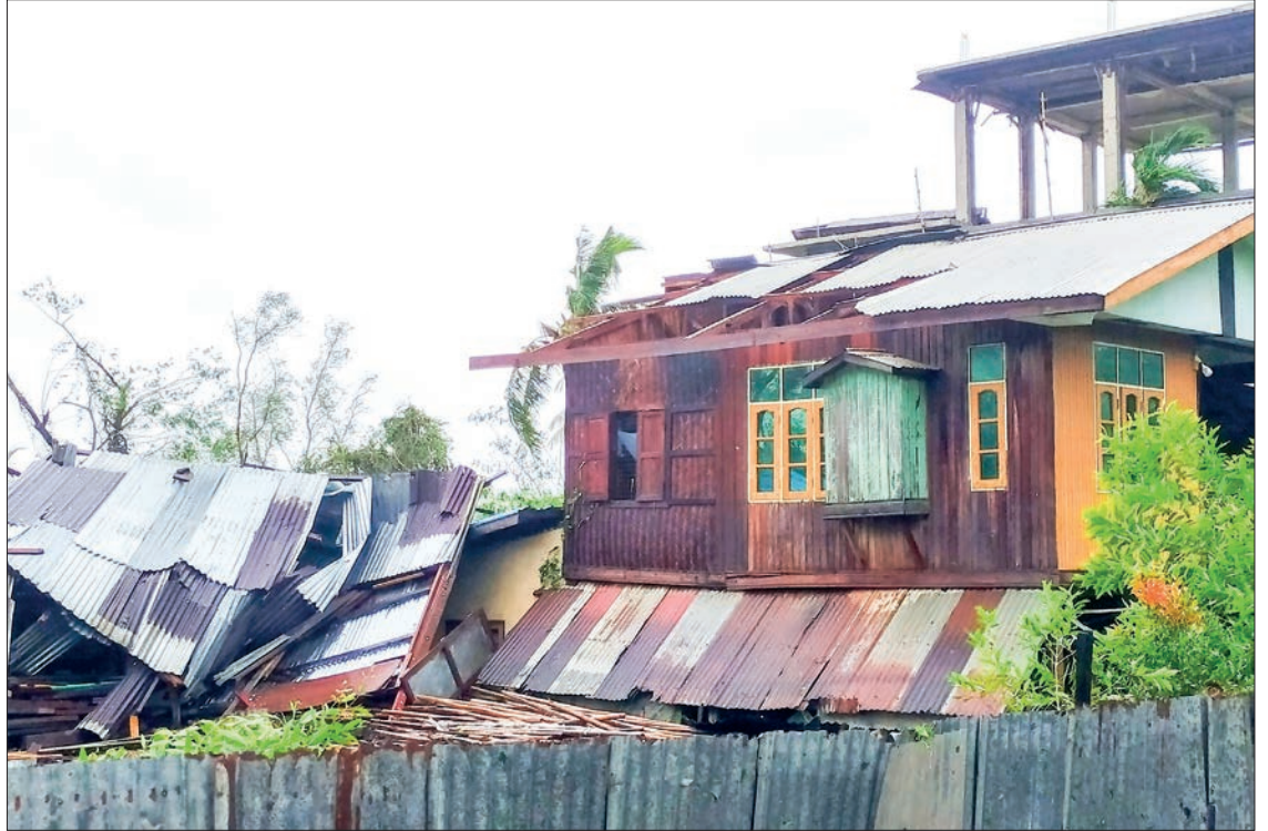
Broken trees, damage buildings and collapsed houses in MraukU Township of Rakhine State on 14 May.