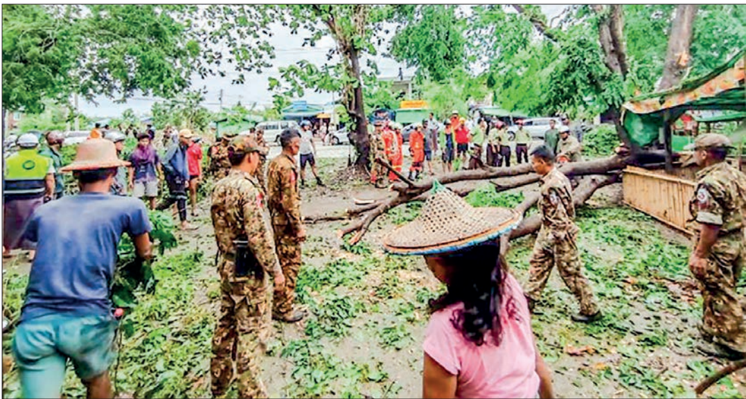
Tatmadaw members and local people clear debris in residential ward in Taungup Township on 14 May.