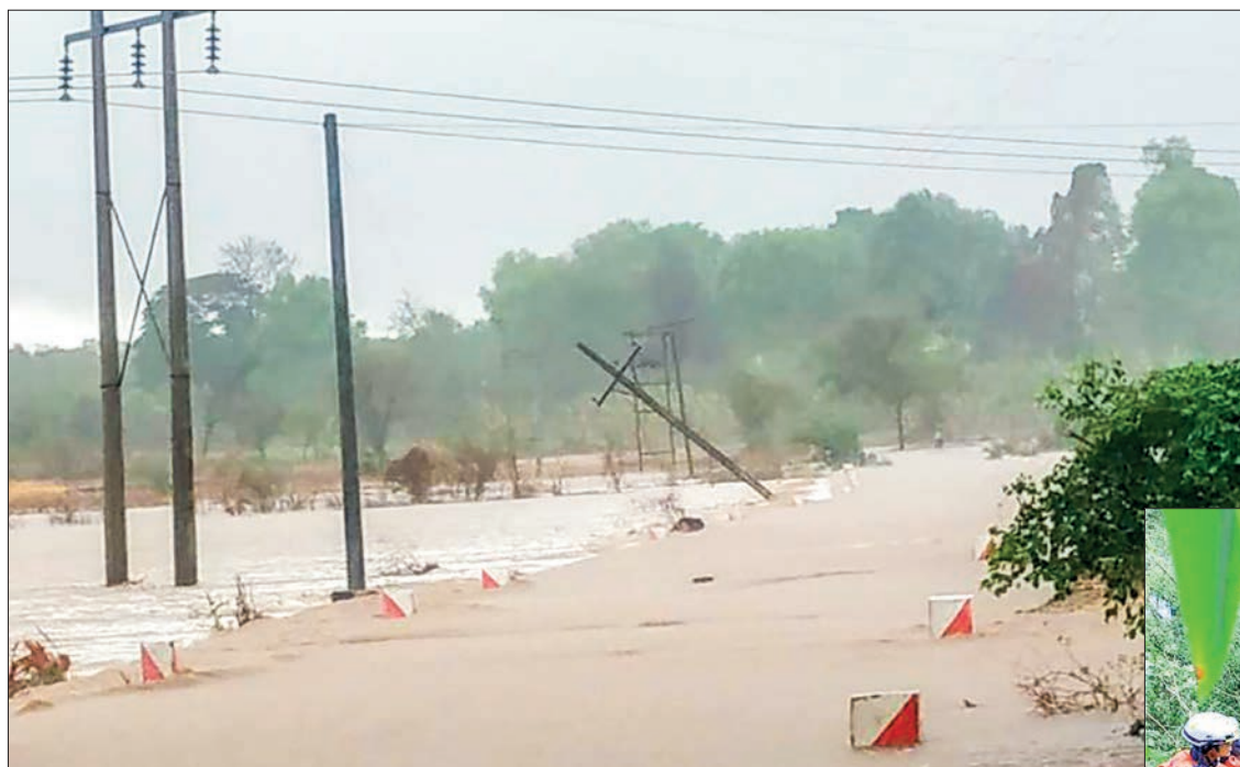
Lamp-post falls on the road in flooding triggered by Cyclone Mocha in Minbu Township on 14 May.

CYCLONE MOCHA, which is extremely powerful in the Bay of Bengal, is causing high tides, strong winds, heavy rains and flash floods.