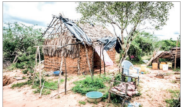
An abandoned house in the forest that buried bodies have been exhumed in Shakahola, outside the coastal town of Malindi.

The 50-year-old founder of the Good News International Church turned himself in on 14 April after police acting on a tip-off first entered Shakahola forest. — AFP