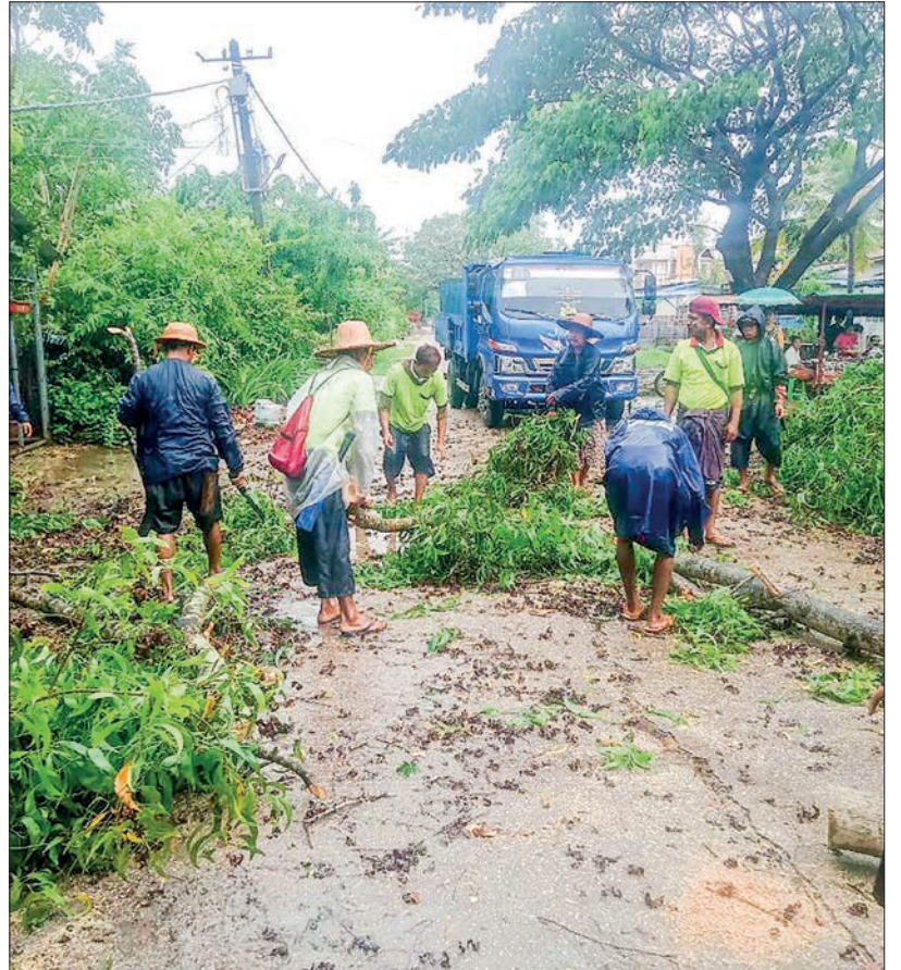
Volunteers remove fallen trees from road in Dagon Myothit (North) Township on 14 May.