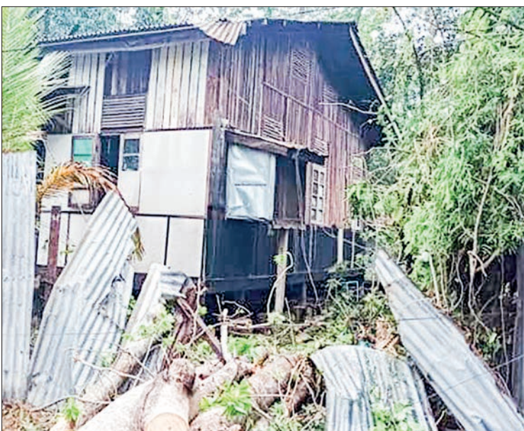
Cyclone Mocha causes damage to houses in Yangon on 14 May.