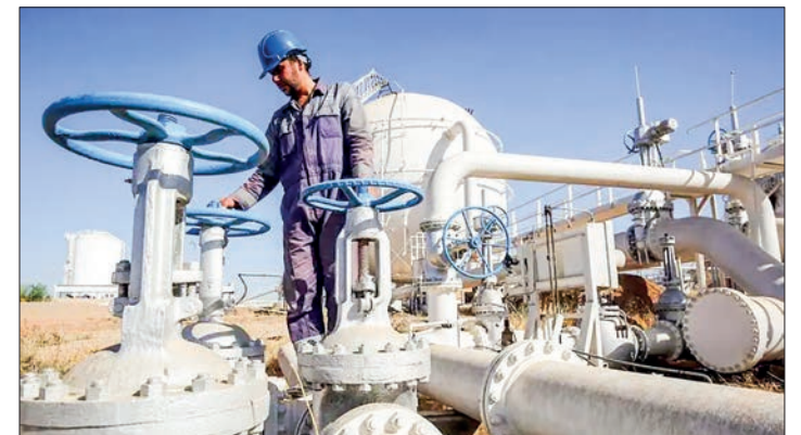
An Iraqi oil employee checks pipelines at the Bai Hassan oil field, west of the multi-ethnic northern Iraqi city of Kirkuk.

“Iraq is ready to resume exports,” he said, noting that Iraq had sent a letter on Wednesday informing Turkey of the decision to resume exports and was awaiting a response on the date. — AFP