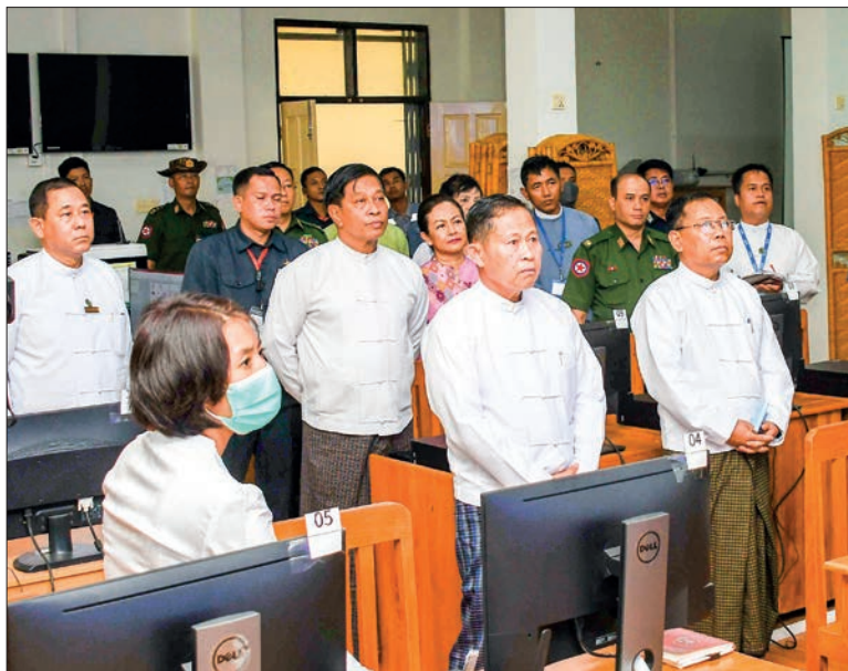
Chairman of Natural Disaster Management Committee SAC Vice-Chairman Deputy Prime Minister Vice-Senior General Soe Win views moving of storm Mocha to Myanmar in map presented by an official at SWRR Ministry in Nay Pyi Taw on 14 May.

Speaking on the occasion, the Vice-Senior General said that cyclonic storm Mocha was at 80 miles west-southwest of Sittway and 85 miles from Maungtau according to the observation of the Department of