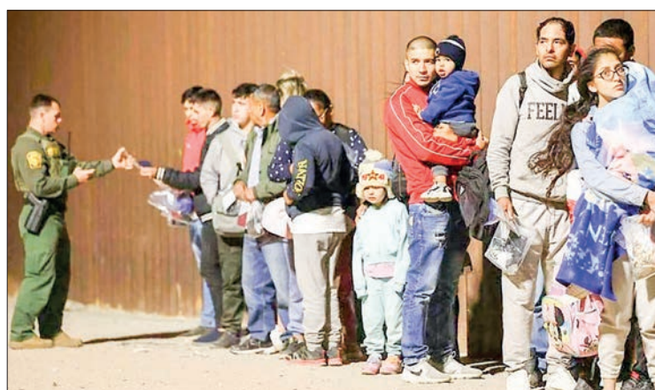
Immigrants seeking asylum in the US stand in line for processing by Border Patrol agents after crossing into Arizona from Mexico.

The state would mobilize an additional 500 National Guard members, as around 1,000 Na-