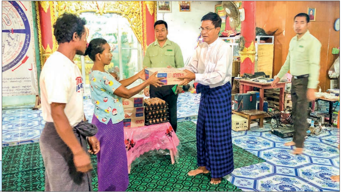
Deputy Minister for Information U Ye Tint presents aid to storm-affected people in Kyeintali of Rakhine State on 13 May.

Three monasteries and Ale Village Basic Education Middle School accommodate 338 people from 83 families living in the wards and seashore in Gwa Township. It is reported that the state government as well as relevant departments and social organizations provide aid to those disaster-hit people. —MNA/KZW