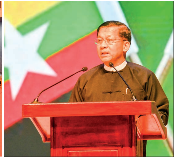
Chairman of the State Administration Council Prime Minister Senior General Min Aung Hlaing addresses at the 75 th anniversary (Diamond Jubilee) ceremony of founding bilateral relations and diplomatic relations between Myanmar and India at the National Theatre in Yangon on 14 May 2023.

CHAIRMAN of the State Administration Council Prime Minister Senior General Min Aung Hlaing attended the ceremony to mark the 75 th anniversary (Diamond Jubilee) ceremony of founding bilateral relations and diplomatic relations between Myanmar and India organized by the Myanmar-India International Business Federation and the Myanmar-India Friendship and Development Association at the National Theatre in Yangon yesterday evening.