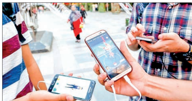
As many as 89 million people have signed up to Iranian messaging apps including Bale, Ita, Rubika and Soroush, the government says, but not everyone is keen on making the switch.

BANNED from using popular Western apps, Iranians have been left with little choice but to take up state-backed alternatives, as the authorities tighten internet restrictions for security reasons following months of protests.