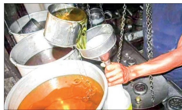
Sale of cooking oil seen at a retail oil shop.

The CIF price of imported palm oil at Yangon Port was US$1,088 per tonnes in the second week of April 2023, US$1,063 by the end of April, US$1,038 in early May, and only US$1,022 in the second week of May. Similarly, the wholesale reference price per viss decreased from K4,790 in the second week of April to K4,500 in the second week of May. However,