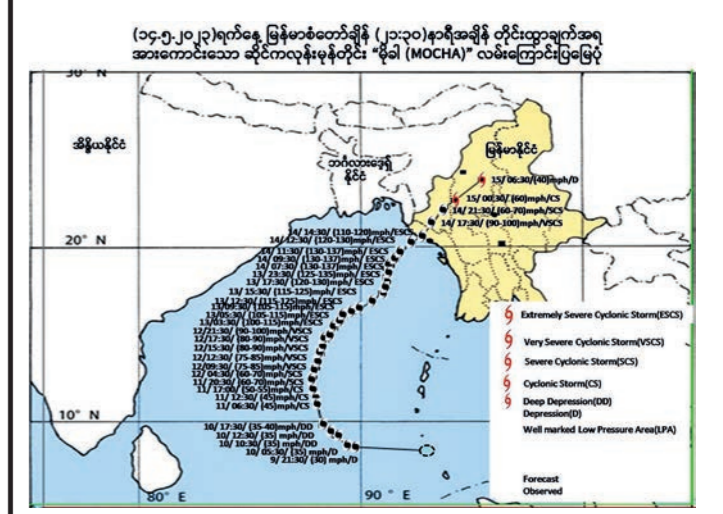
The direction map of Cyclone Mocha.