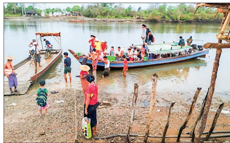
People from beach areas are being evacuated to temporary shelters in Taungup Township on 12 May.

The WFP has additionally reported that humanitarian partners have established transportation and communication systems have been created by humanitarian partners for use during storm readiness and response. — TWA/KZW