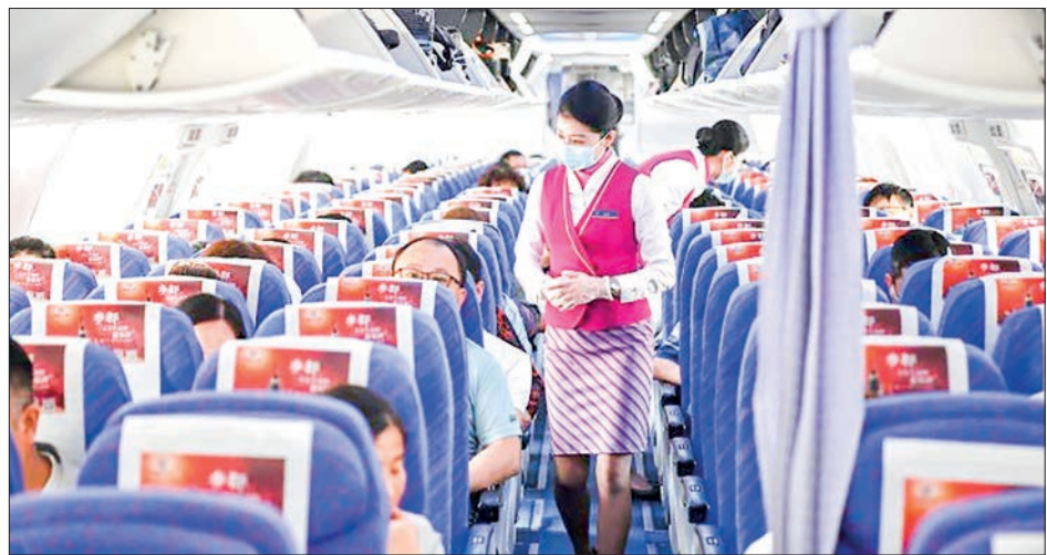
Flight attendants conduct safety inspections before the first passenger flight of the Xi’an-Urumqi-Ashgabat route takes off in Xi’an, northwest China’s Shaanxi Province, 13 May 2023.

For the Xi’an-Urumqi-Ashgabat route, flight CZ5085 will depart from Xi’an at 17:30 Beijing time (0930 GMT) every Saturday and arrive in Ashgabat at 23:10 local time (1810 GMT). On the return journey, flight CZ5086 will depart from Ashgabat