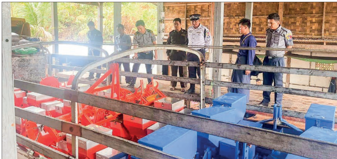
Officials check illegal goods in truck.

UNDER the supervision of the Illegal Trade Eradication Steering Committee, effective action is being taken to prevent illegal trade under the law. On 11 May, inspections were carried out by joint task forces under the management of the Kayin State Illegal Eradication Trade Task Force at the Thanlwin Bridge Combined Checkpoint, and 1,650 Raypower banks (approximately K31.2 million) without any offi-