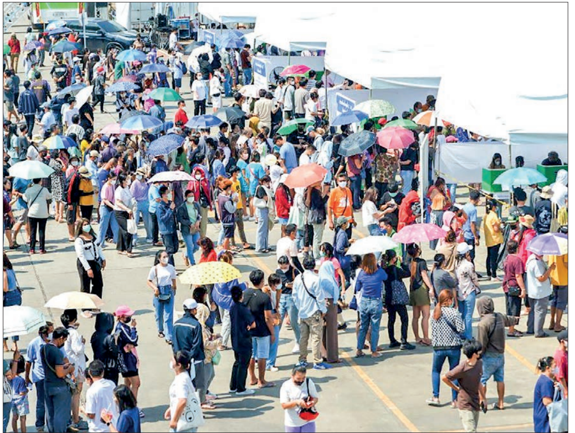
People wait to cast their votes at a designated polling station in Bangkok, Thailand, 7 May 2023.

The Election Commission is expected to announce an unofficial result late Sunday. — Xinhua