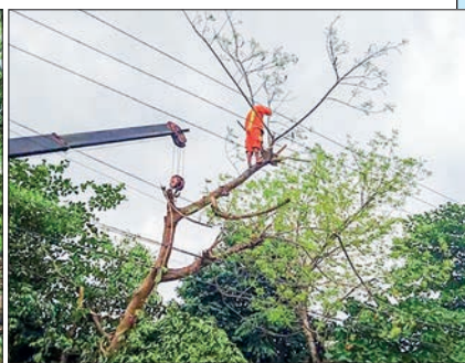
Fire brigade members clear debris of fallen trees in townships of Yangon Region on 14 May.

ON the morning of 14 May, heavy rain and strong winds hit the majority of townships in Yangon region due as the speed of cyclone Mocha caused some road blockages with fallen trees. Clearing of debris was carried out according to the statements of the Myanmar Fire Brigade.