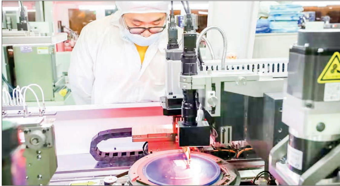
Chipmakers have been overwhelmed by the sharp increase in demand across the car, medical devices and consumer electronics industries.

THE G7 plans to launch a partnership scheme to diversify supply chains this year, ministers from the group said Saturday following finance talks in Japan ahead of a major summit next week.