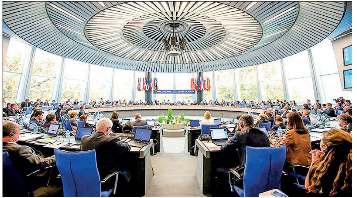
Iceland is hosting a Summit of Heads of State and Government from the organization's 46 member states on 16 and 17 May in Reykjavik. This is the 4 th Summit of the Council of Europe since its creation in 1949.

"I will be travelling from Reykjavik to Hiroshima to drive global action on our most pressing priorities," he said in a statement.