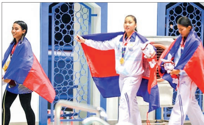
Cambodia has clinched a total of 192 medals - 59 gold, 53 silver and 80 bronze - at the 32 nd SEA Games as of May 13 at 10:00 pm, ranking thus third on the Medal Table.

In the XXXII SEA Games, Myanmar has so far collected 81 medals: 17 golds, 16 silvers, and 48 bronzes. — MNA/KZL