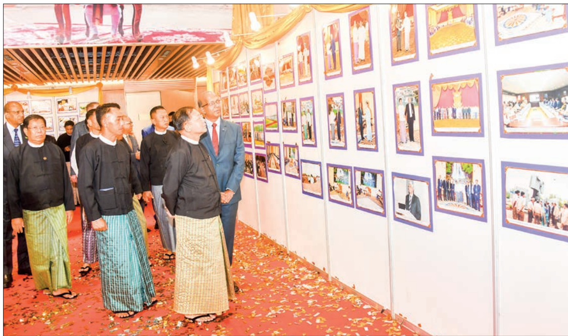
Chairman of the SAC Prime Minister Senior General Min Aung Hlaing views round the photo gallery to mark the ceremony on 14 May.

Speaking on the occasion, the Senior General said that Myanmar and India established the diplomatic relations on 4 January 1948 when Myanmar regained independence. So, it turned 75 years. Before the diplomatic relations, both countries have been preserving the traditions on religious, culture and social affairs for hundreds of years and both countries are sharing long borders.