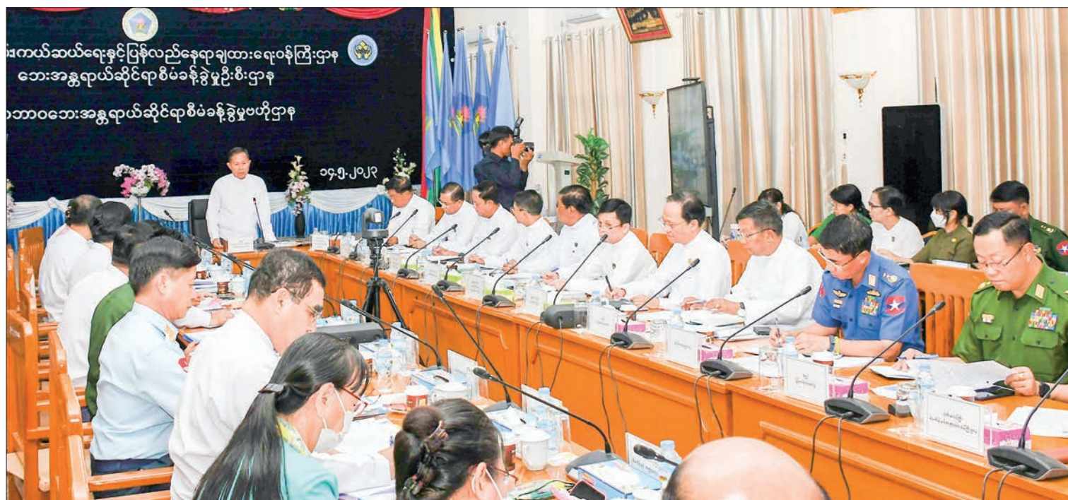
SAC Vice-Chairman Deputy Prime Minister Vice-Senior General Soe Win seen at the second emergency meeting of National Natural Disaster Management Committee on 14 May.

Meteorology and Hydrology. Its wind speed hit 130-137 miles per hour. Storm tidal may reach 20 feet high in minimum.