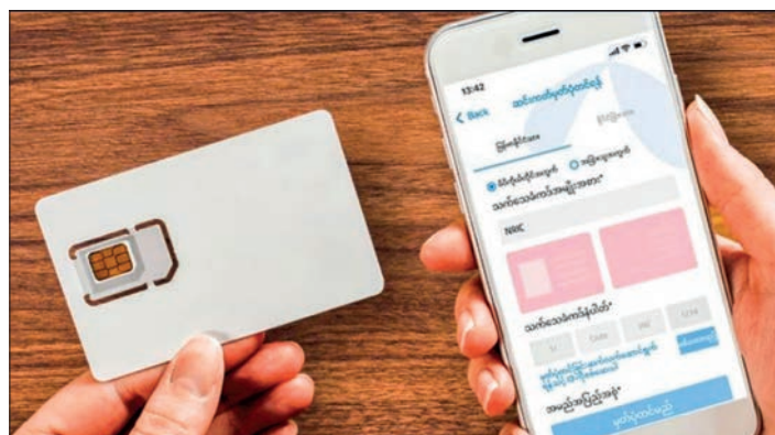
Photo shows registration process of a mobile phone in progress.

THE Department of Post and Telecommunications notified that the filling data such as name and citizenship scrutiny card-CSC number when registering SIM cards are checked