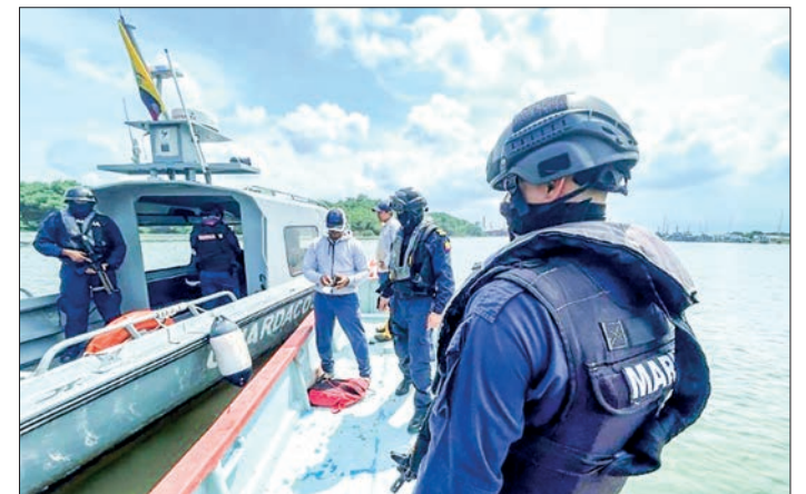
Ecuadoran naval police check the documents of the crew of a small boat intercepted near the port of Guayaquil on 11 May 2023. PHOTO: AFP/FILE

A fisherman who said he was afraid to give his name said he and his counterparts are at the mercy of the criminal gangs navigating the Gulf of Guayaquil, at the entrance to Ecuador's main commercial port. — AFP