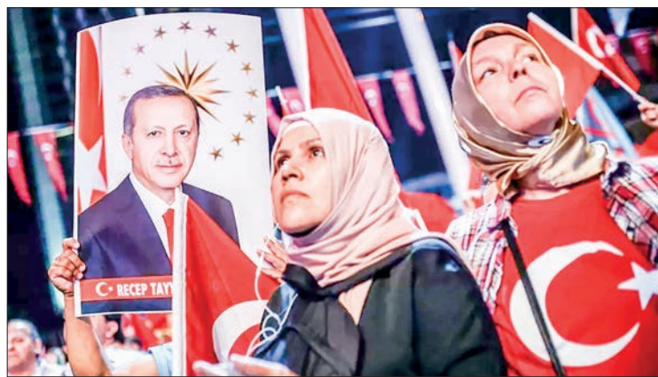
A pro-Erdogan rally: Türkiye's ruling AKP has its roots in political Islam.

Türkiye has grown into a military and geopolitical heavyweight that plays roles in conflicts stretching from Syria to