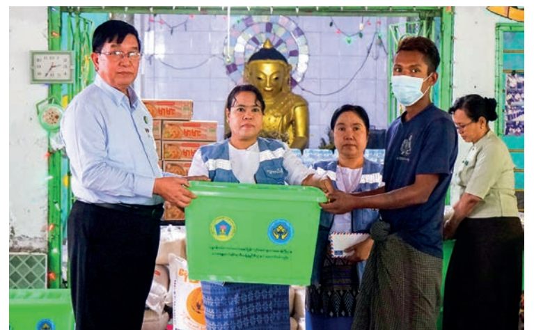
Disaster-affected households receive relief items from the Magway Region chief minister yesterday.

The chief minister and officials provided foodstuffs, cash, and relief items worth K4.7 million in total to four flood-affected households.