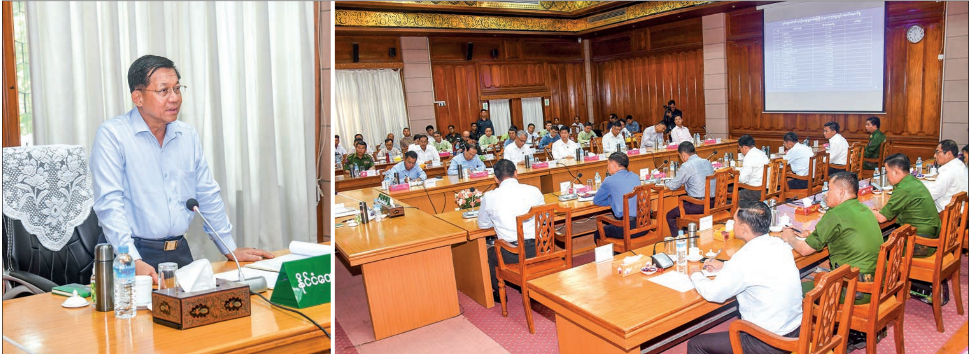
State Administration Council Chairman Prime Minister Senior General Min Aung Hlaing holds the meeting on the loss and damage caused by natural disasters in NyaungU District yesterday.

PRESERVATION must be done in Bagan ancient cultural zone as it is an irreplaceable heritage for the country, said Chairman of the State Administration Council Prime Minister Senior General Min Aung Hlaing at the meeting on damage in natural disaster in NyaungU District at the Bagan cultural museum in Bagan ancient cultural zone of NyaungU District yesterday morning.