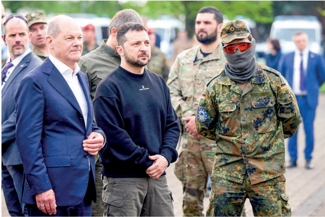
This handout photograph taken and released by the Ukrainian Presidential Press Service on 14 May 2023, shows German Chancellor Olaf Scholz (L) and Ukrainian President Volodymyr Zelensky (C) visiting a military base in Aachen, western Germany, where Ukrainian servicemen are being trained.