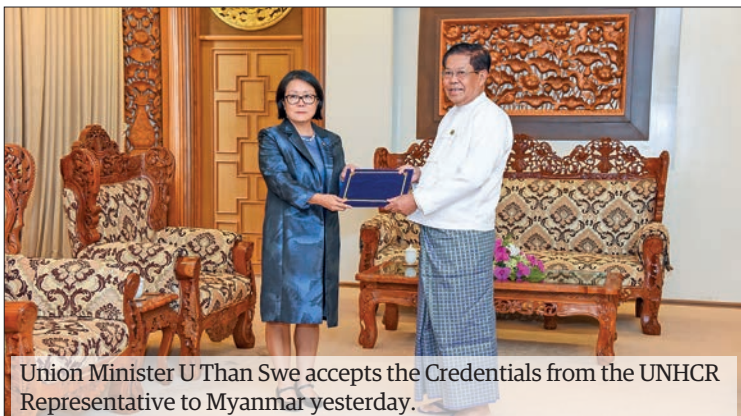
Union Minister U Than Swe accepts the Credentials from the UNHCR Representative to Myanmar yesterday.

Also present at the meeting were senior officials of the Ministry of Foreign Affairs. — MNA