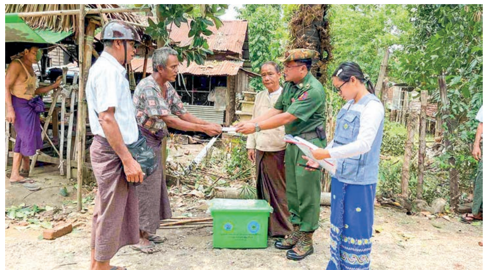
Nyaungdon Township, Maubin District of Ayeyawady Region.