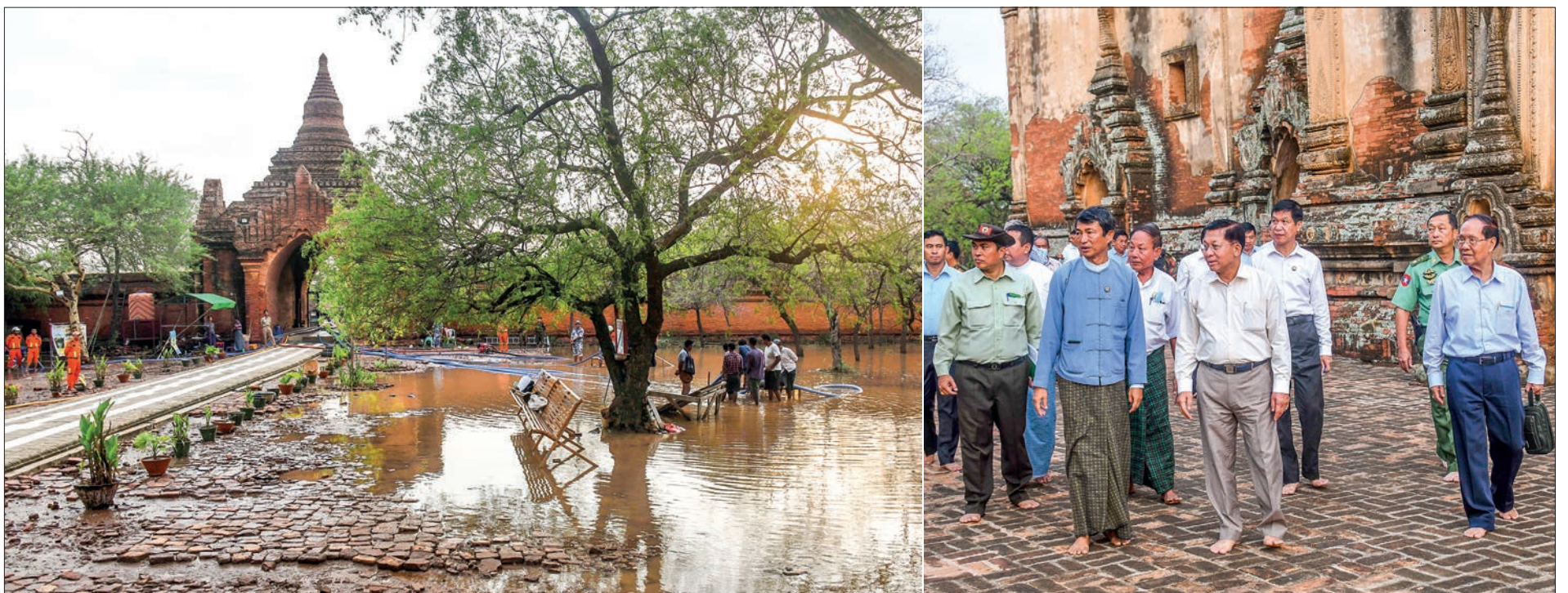
State Administration Council Chairman Prime Minister Senior General Min Aung Hlaing views round the inundation, loss and damage at the Sulamani Temple in the Bagan Ancient Cultural Zone on 15 May 2023.

C HAIRMAN of the State Administration Council Prime Minister Senior General Min Aung Hlaing, accompanied by his wife Daw Kyu Kyu Hla and officials, inspected inundation, loss and damage caused by the natural disaster in Bagan ancient cultural zone in a motorcade and gave necessary guidance on the afternoon of 15 May.