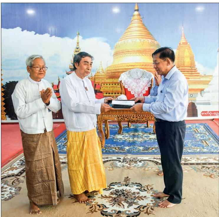
The Senior General presents cash donations at the Shwezigon Pagoda.