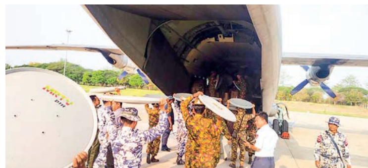
Foodstuffs and relief items are loaded onboard Tatmadaw planes to transport them to Rakhine State (above and left photos).

along with other relief aid generously contributed by the families of the Tatmadaw (Army, Navy and Air), were transported for the first time from Nay Pyi Taw Airport to Sittway Airport. And 100 bags of rice, water bottles, canned goods, and food items produced by Tatmadaw factories, along with personal goods and medical supplies, were