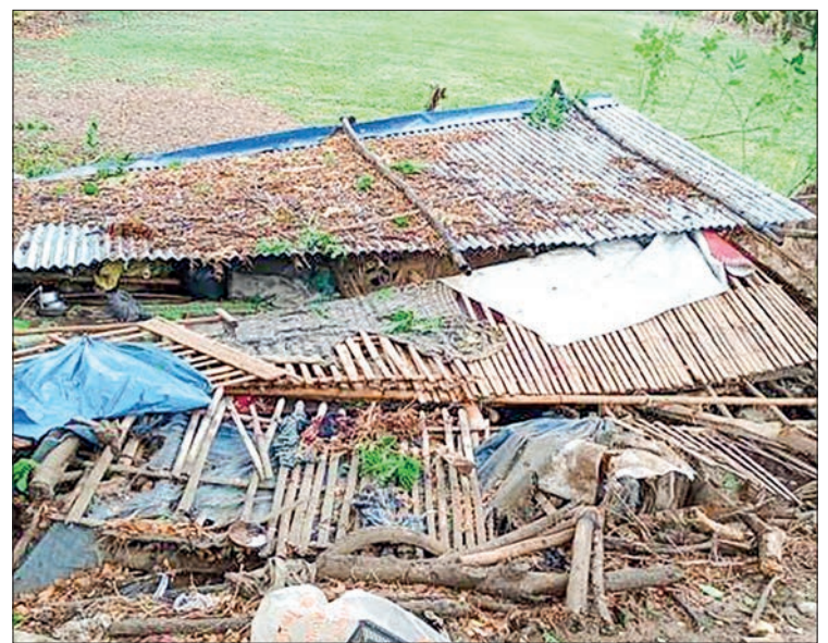
Debris in the aftermath of Cyclone Mocha.