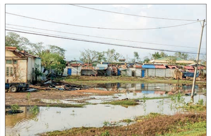
Collective clear-up of the fallen trees and debris in disaster-affected areas of states and regions (top and above photos).