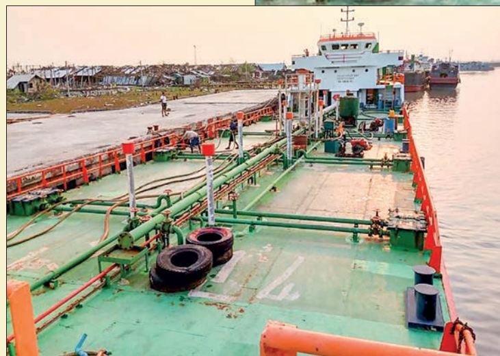
Fuels are loaded onto the tanker to transport them to Sittway.