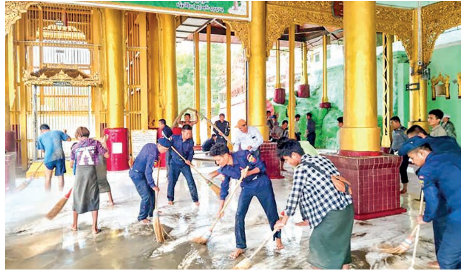
Collective cleaning in the platform of lower Settawya in Sagu, Minbu Township (above left of and right photos).