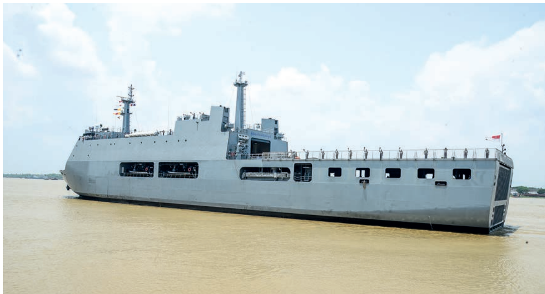
A navy vessel is seen transporting relief items to Sittway, Rakhine State.

On the morning of 16 May, the navy ship Maha Bandoola left No 4 Navy Port Terminal, carrying a pair of satellite phones, 113 packs of noodles, 50 packs of flour noodles, 8,800 sachets of electrolyte drinks, 14,300 eggs, 30 visses of chicken, 10 packs of water bottles, 100 visses of fish paste, 200 visses of fish, 800 visses of dried fish, five bags of rice, vegetables, one generator, 12 airbags (weighing 15 tonnes) donated by the Office of Commander-in-Chief (Navy), 10,000 eggs, 2 landscaping rolls, one carton and two packs of medicine (1ton) by Yangon Region Command, 500 bags of rice,