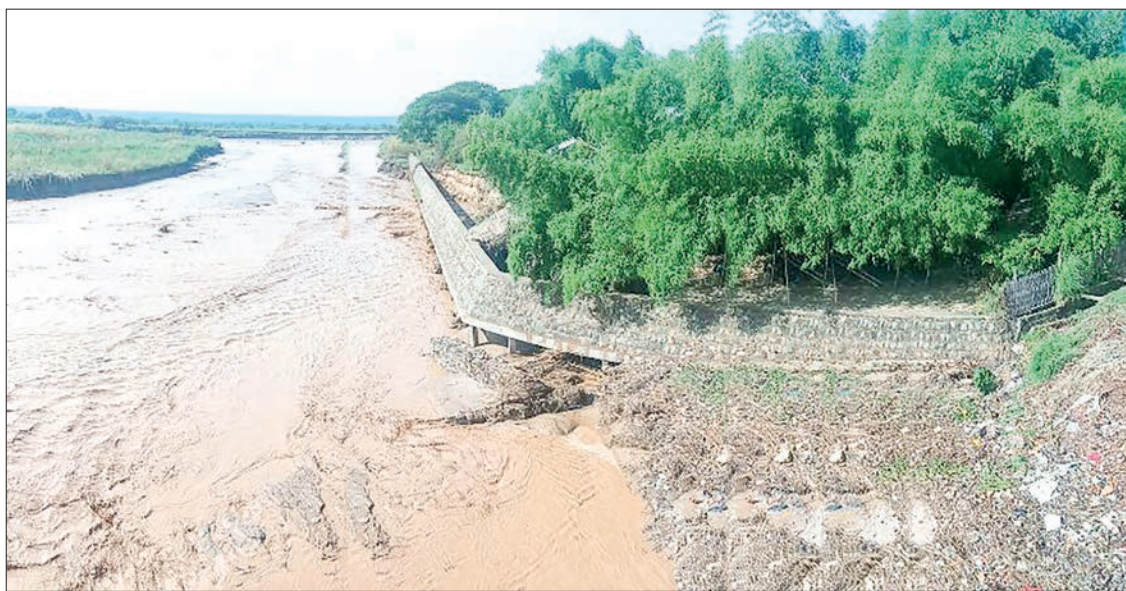
The photo shows erosion of creekbank wall in Shwechaung, Pakokku.