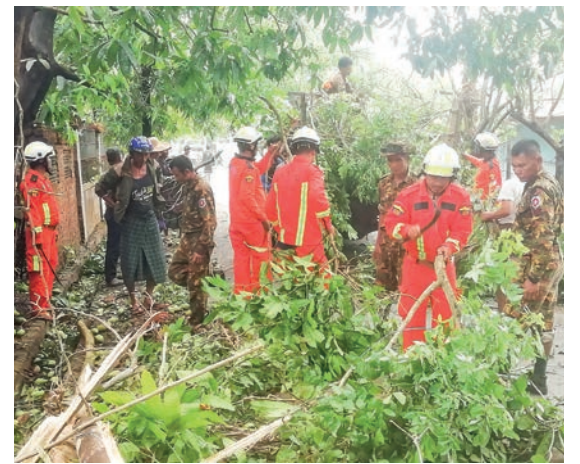
Collective clear-up in Manaung Township (above centre and far right photos).