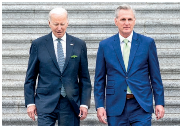
(FILES) In this file photo taken on 17 March 2023, US President Joe Biden and US Speaker of the House Kevin McCarthy, Republican of California, depart after the annual Friends of Ireland luncheon at the US Capitol in Washington, DC.

EQUITIES were mixed Tuesday as traders grew increasingly concerned that US lawmakers remain far apart in talks to