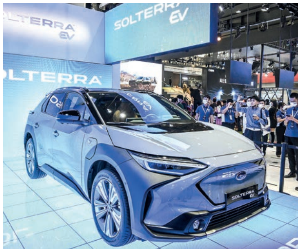
File photo taken in Guangdong, China in November 2021 shows Subaru Corp's all-electric Solterra sport utility vehicle.

The new vehicle for the domestic market will be based on the two EVs they had jointly developed earlier — Toyota's bZ4X and Subaru's Solterra. It