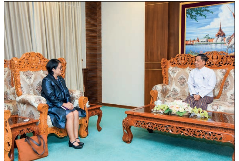
The UNHCR Representative to Myanmar calls on Union Minister U Ko Ko Hlaing yesterday.

During the meeting, UNHCR Representative to Myanmar discussed matters relating to the willingness of UN agencies to support and assist the population affected by Cyclone Mocha in Myanmar as well as the repatriation and resettlement of displaced persons from Rakhine. Subsequently, the Union minister deliberated the importance of collaboration between UN