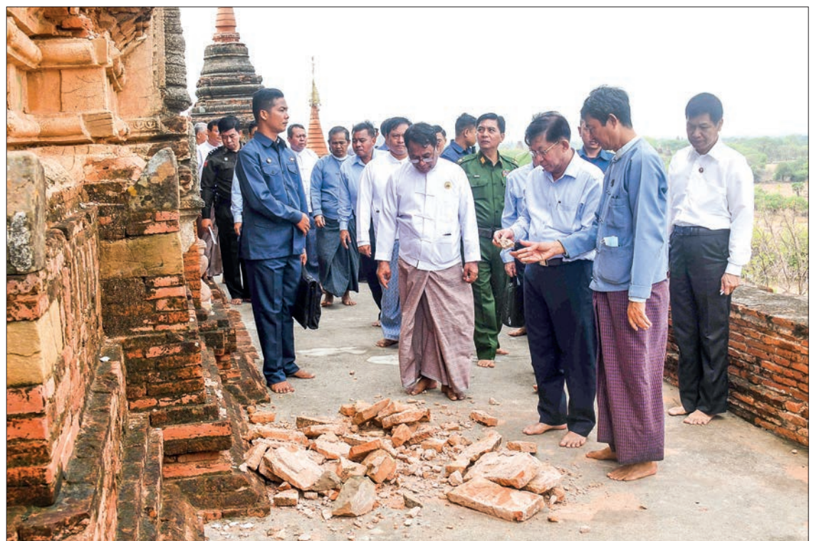
The Senior General looks into the damage at the Htilominlo Pagoda.