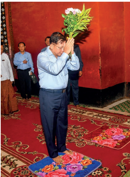
The Senior General pays homage to the Ananda Pagoda.