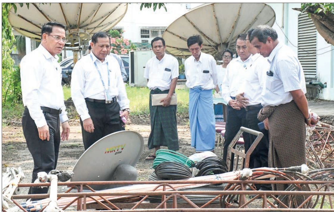
Union Minister U Maung Maung Ohn views the broadcasting equipment for the Sittway retransmission station yesterday.

Next, the Union minister met the staff from the Music