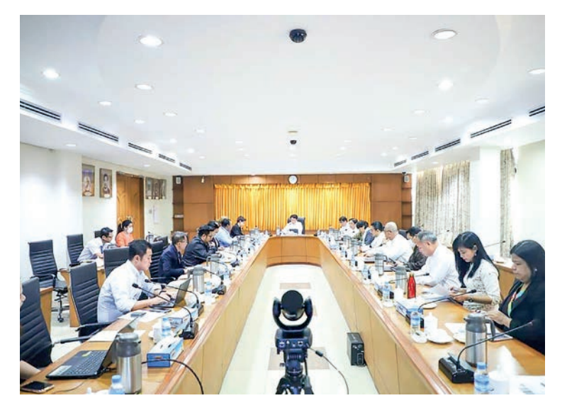
EuroCham Myanmar and UMFCCI officials discuss the issues encountered in various business sectors.

EuroCham Myanmar has more than 140 member companies that are investing and operating in Myanmar.