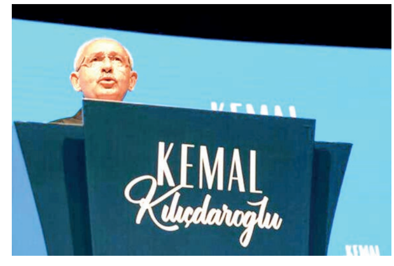
Opposition leader Kemal Kilicdaroglu intends to run a more hard-edged campaign ahead of the second round.

TÜRKIYE'S opposition tried on Wednesday to recover from a crushingly disappointing election performance and launch a new attack aimed at beating President Recep Tayyip Erdogan in a 28 May runoff.