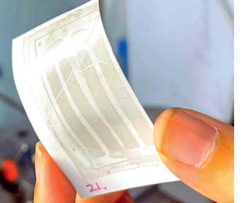
The implant is thin and flexible enough to conform to the heart's delicate contours as well as stretchy and strong enough to withstand the dynamic motions of a beating heart. Graphene tattoo patch.

Known as cardiac arrhythmias, heart rhythm disorders occur when the heart beats either too