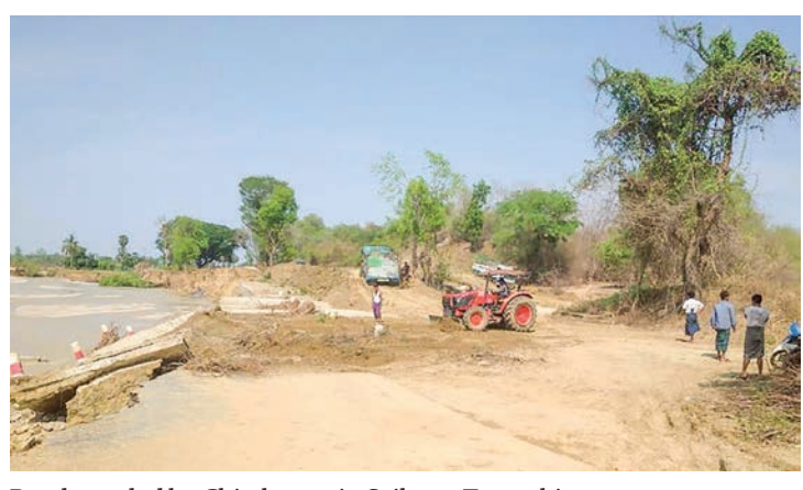
Roads eroded by Chitchaung in Seikpyu Township.