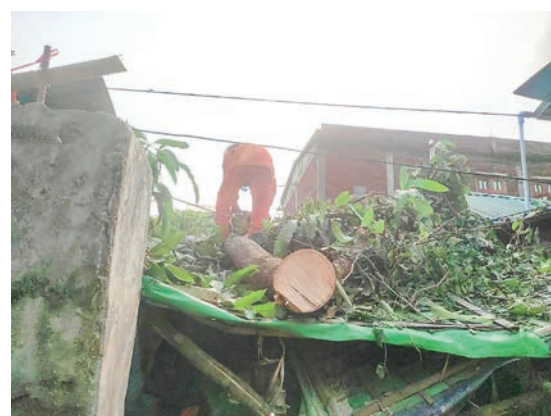
Clear-up work in Minbya.

The people are urged to receive vaccination of Covid-19 without fail as full-time vaccination of Covid-19 and receiving booster shots can effectively mitigate infection of the virus, severe suffering from the disease and increasing of death rate based on the disease.