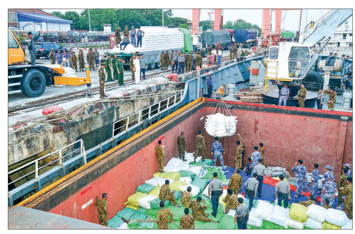
Relief items and donated supplies are seen being loaded onto the Tatmadaw Navy ship (above and left below photos.)