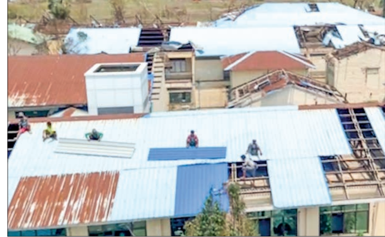
Union Health Minister Dr Thet Khaing Win inspects the status of repairing the damaged Sittway General Hospital.