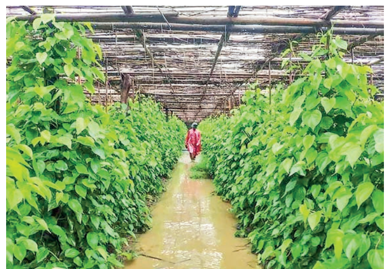
The price of betel leaf at the farm is estimated at K16,000 per viss. Yet, low production. The picture shows a betal farm.

The price of betel leaf at the farm is estimated at K16,000 per viss. Yet, it surged to K35,000-40,000 per viss in the retail market following the low production.