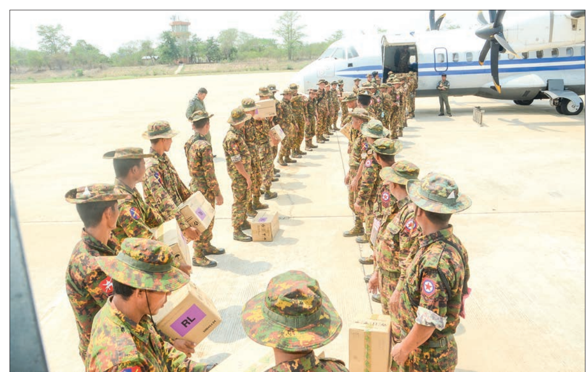
Relief goods are loaded onboard the Tatmadaw aircraft to transport them to Rakhine State.

They also transported 400 bags of necessary items from Nay Pyi Taw Airport to Sittway Airport for the second time, 250 bags of relief items for the third time, 150 sacks of rice, 19 packages of water purifier tablets, and 169 packages of various medicines for the fourth time.