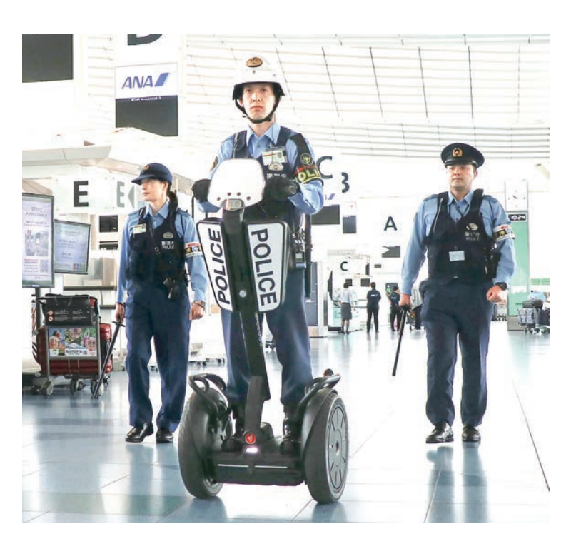
Police officers patrol at Tokyo's Haneda airport on Friday, ahead of the Group of Seven summit in Hiroshima from 19 to 21 May.

In Hiroshima, signs across the city and in hotels remind locals and tourists alike that the summit will cause disruption, including the closure of streets and access to the island of Miyajima, which leaders are expected to visit.—AFP