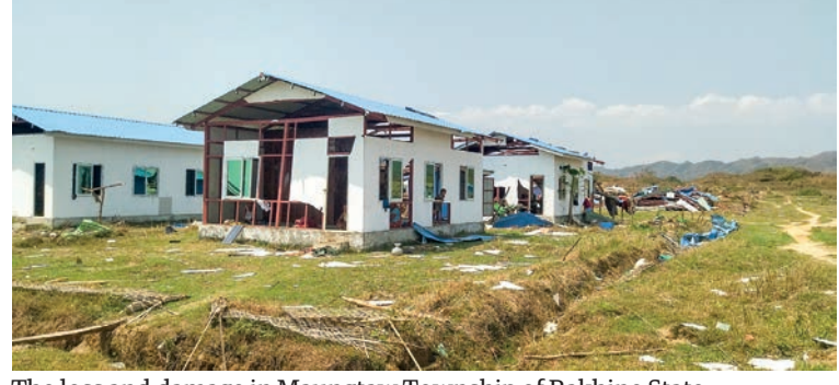
The loss and damage in Maungtaw Township of Rakhine State.

In the cyclone-affected areas, the rescue teams in respective regions and states are undertaking rescue measures together with volunteer organizations, and officials concerned went to the sites and provided necessary assistance.