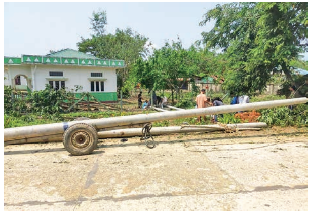
The re-erection of the fallen lamp post in Buthidaung Township.