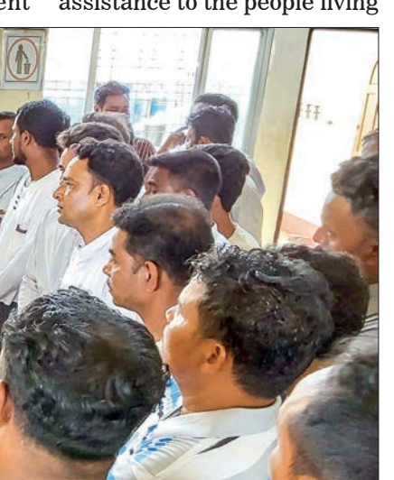
Union Border Affairs Minister Lt-Gen Tun Tun Naung provides foodstuffs to storm-affected Bengalis in Sittway yesterday.

with the support of the government and donors, further assistance to the people living