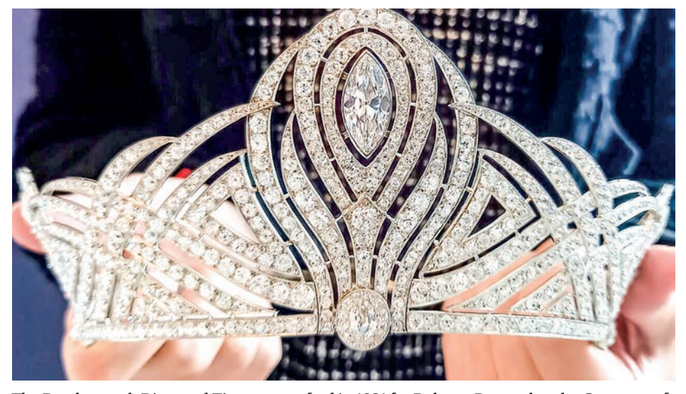
The Bessborough Diamond Tiara was crafted in 1931 for Roberte Ponsonby, the Countess of Bessborough.

A dazzling tiara worn at two British coronations and the Star of Egypt diamond purportedly once belonging to King Farouk are among the historic jewellery items being auctioned Wednesday