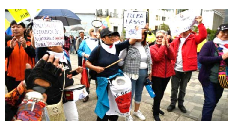
The trial comes at a tumultuous time, with some protesters demanding the president be ousted.

taking place amid a spike in violence related to drug trafficking in the South American country and widespread anger over the rising cost of living.