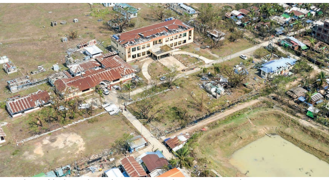
An aerial view of the damaged Township People's Hospital in Ponnagyun Township.

According to the investigation until 17 May noon, 12 houses, three religious buildings, one monastery, three schools, one airport building, eight lamp posts, one transformer, one departmental building, one wall were damaged and destroyed in 44 wards and villages of Nay Pyi Taw while 129 houses, one religious building, two monasteries, one school, two hospital/ clinic, four lamp posts, 30 departmental buildings and one football field in 24 wards and villages of Chin State, three houses, six telecom towers, two lamp posts, one transformer, 26 walls and three bridges in 23 wards and villages of Sagaing Region, 113 houses, two telecom towers and one lamp post in 72 wards and villages of Bago Region, four houses, 14 lamp posts, 67 walls, 156 seasonal crop cultivation fields and one bridge in 34 wards and villages of Magway Region, four religious building in one village of Mandalay Region, one house, one monastery, one school and 14 lamp posts in four wards and villages of Mon State, 44,502 houses, 366 religious buildings, 48 monasteries, 394 schools,