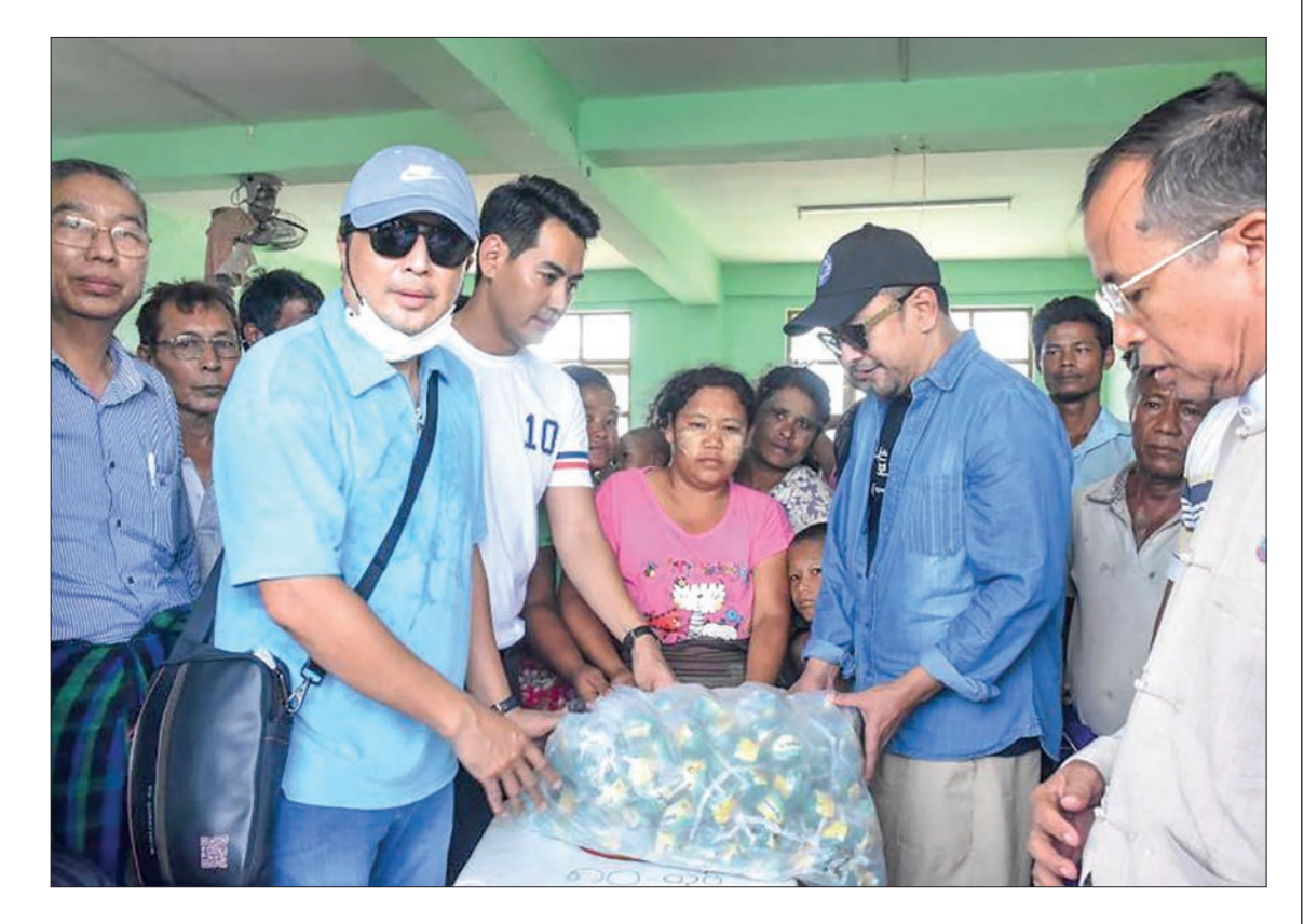
Artistes are seen providing foodstuffs and relief items to storm victims in Sittway yesterday.

A team of artistes from the Myanmar Motion Picture Organization and the Myanmar Music Association (Central) yesterday morning arrived in Sittway, Rakhine State, which was devastated by Cyclone Mocha, to encourage and support the local residents.