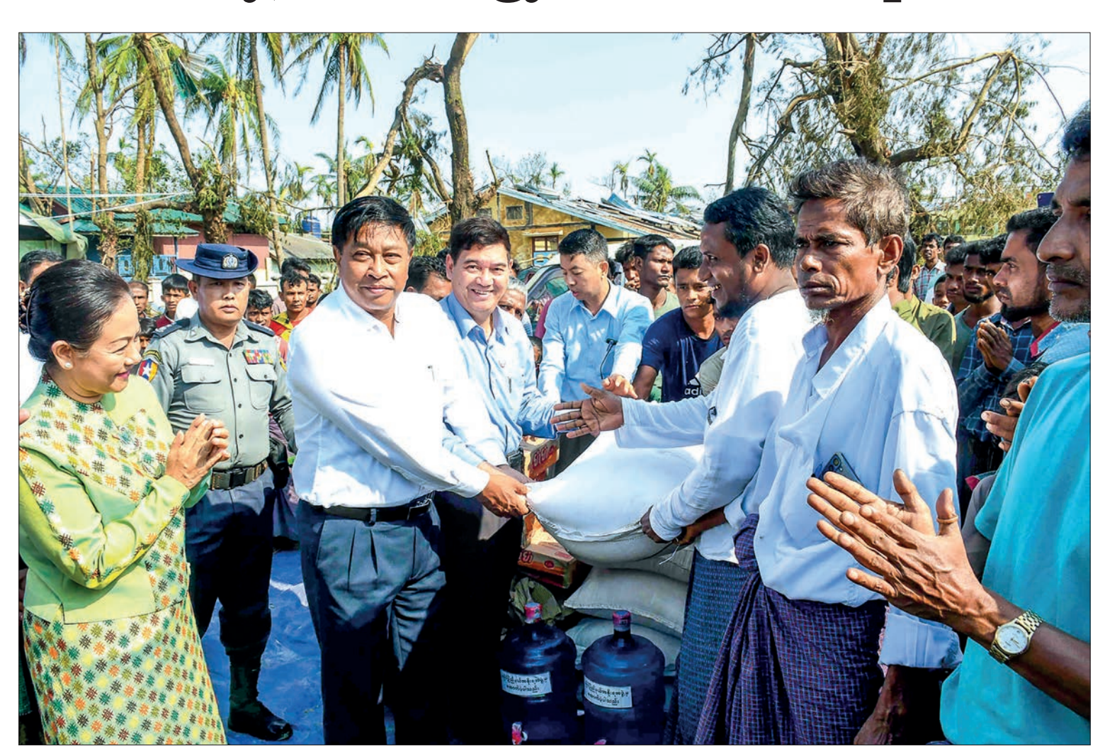
Deputy Prime Minister Union Transport and Communications Minister Admiral Tin Aung San presents rice bags to storm victims at the BEHS 10 Thetkaepyin Village of Sittway Township in Rakhine State on 17 May 2023.

The Deputy Prime Minister and party left Sittway Township for Ponnagyun by Tatmadaw aircraft and inspected the damaged BEHS (Ponnagyun), Uyazmingala suspension bridge, township hospital and township administration office and gave necessary instructions and fulfilled the needs to do repair work as quickly as possible.