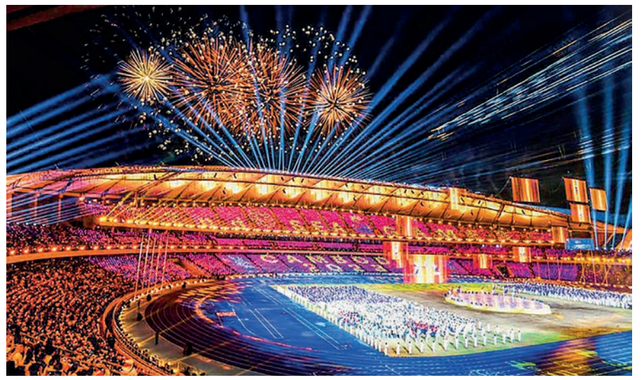
The view of XXXII SEA Games closing ceremony at the Morodok Techo National Stadium in Phnom Penh, Cambodia on 17 May 2023. PHOTO: SEA GAMES 2023

Timor Leste is in the eleventh with eight bronzes. — Shine Htet Zaw/KZL