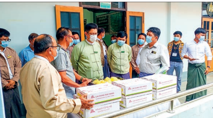
The handover ceremony of GAP certificates to 20 fruit growers was held on 17 May 2023 in Kanbalu and Kyunhla Townships.

trate more external markets and the international markets prefer the fruits produced under the GAP system.