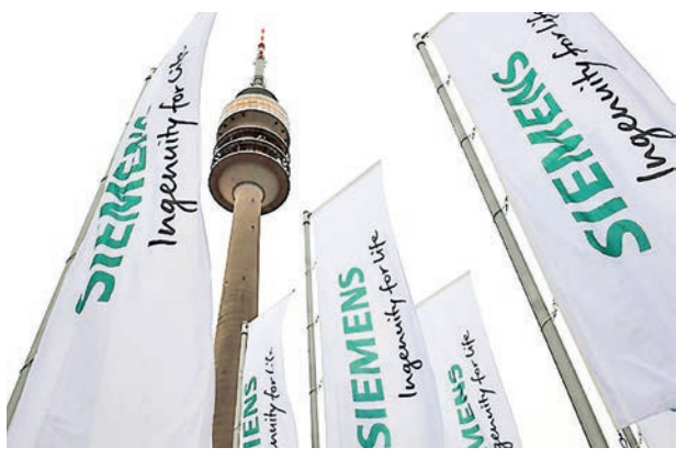
German industrial conglomerate Siemens raised its outlook for 2023 on Wednesday after second-quarter profits nearly tripled on higher orders.

Siemens, which runs its financial year from October to September, said it had won a record 2.9-bil-