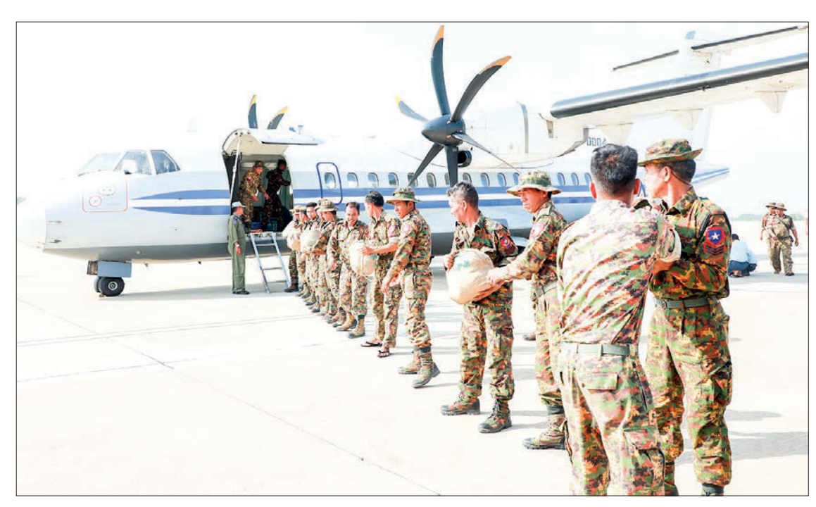
Tatmadaw members carrying relief items on board the military aircraft leading to Sittway Airport on 21 May.

Officials in the respective areas received relief supplies and will continue to distribute them to storm victims. – MNA/KZW