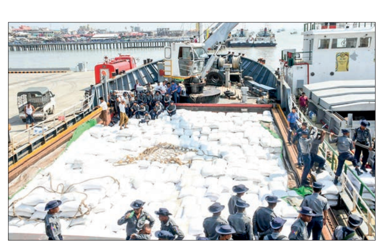
Bags of rice are being unloaded from warship Pyi Taw Aye-2 at Sittway Port on 21 May.