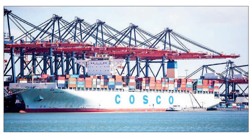
A cargo ship of COSCO Shipping Lines docks in Dutch Port of Rotterdam, 20 April 2013.

Headquartered in Qingdao, east China's Shandong Province, the SPG operates four major ports in China — Qingdao Port, Rizhao Port, Yantai Port and Bohai Bay Port.