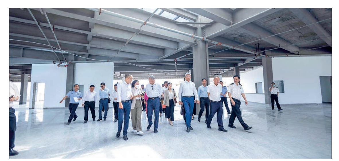
Union Minister for Commerce U Aung Naing Oo visits Kunming City of Yunnan Province on 21 May.

MYANMAR delegation led by Union Minister for Commerce U Aung Naing Oo attended a business lunch hosted by Secretary of CPC Yunnan Provincial Committee Mr Wang Ning at the Haigeng Garden Convention Center, Kunming, yesterday afternoon.