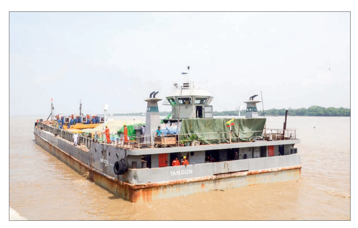
A landing craft carrying staft from ministries, relief supplies and vehicles leading to Sittway on 21 May.

VESSEL Chindwin carried 685 members of Myanmar Police Force, and 107 civilian employees from the Directorate of Military Engineers, along with relief materials and food, left Yangon on 19 May, and arrived at Essar Jetty, Sittway yesterday to carry out relief works for Mocha-hit Sittway, Rakhine State.