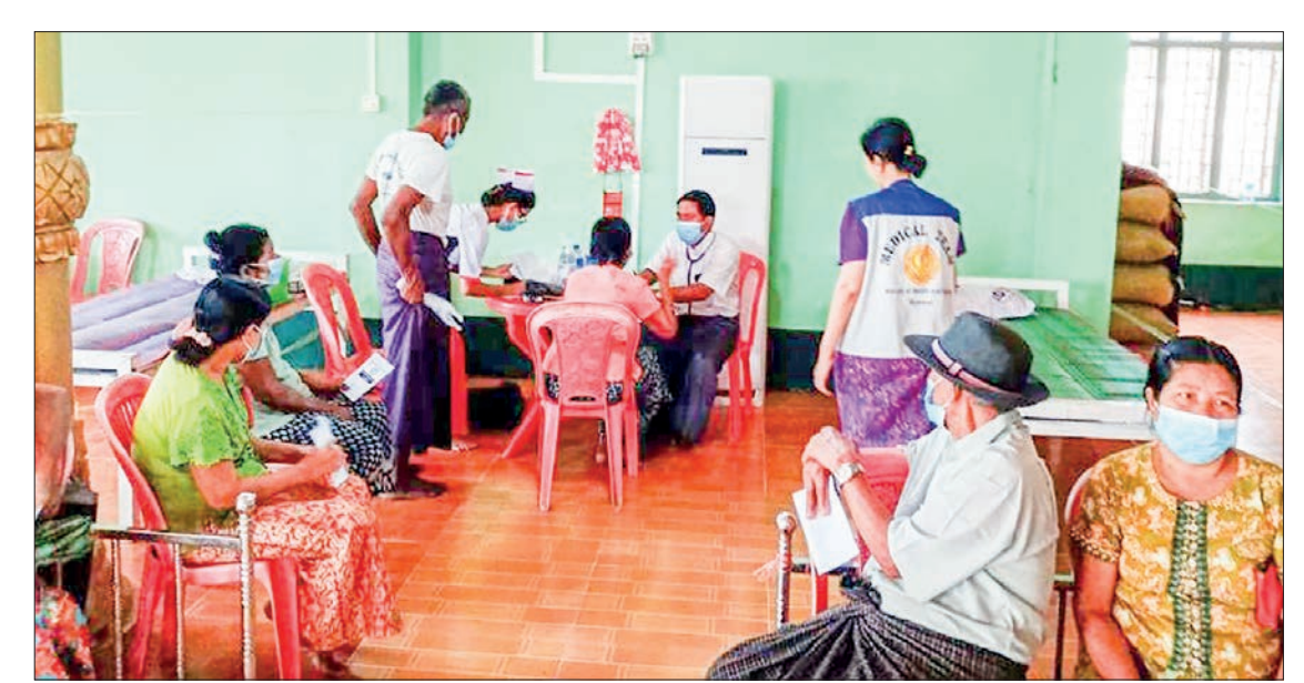
A mobile medical team giving healthcare to locals in Ponnagyun on 21 May.

Similarly, a mobile medical team consisting of six specialists from Maungtaw Township Hospital visited Indin, Kyaukpandu, and Aungthukha villages in