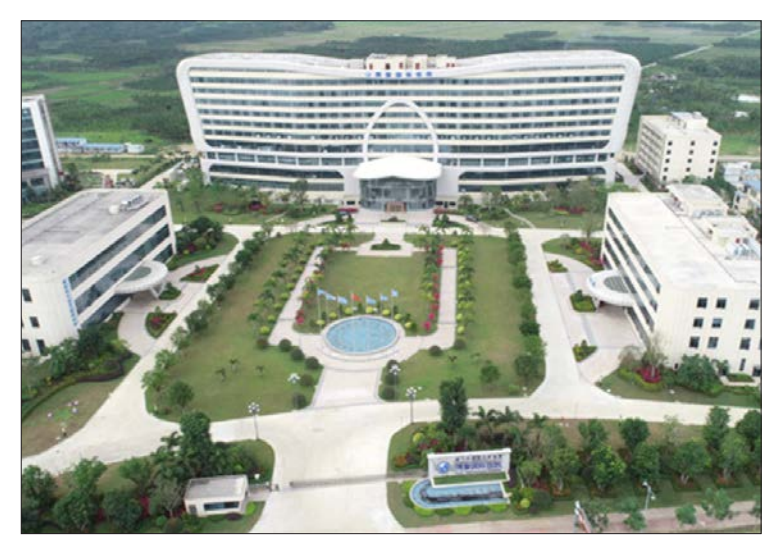
Aerial photo taken on 3 April 2020 shows a view of Hainan's Boao Lecheng pilot zone of international medical tourism in south China's Hainan Province. The pilot zone includes a number of medical institutions, including hospitals, clinics, and medical research centers.

A special medical zone in south China's island province of Hainan is rising as a medical magnet as it seeks high-quality develop-