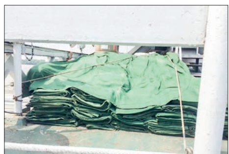
Contruction materials, drinking water, bags of cement, tants and tarpaulin sheets and others are aboard the vessels bound for Sittway.