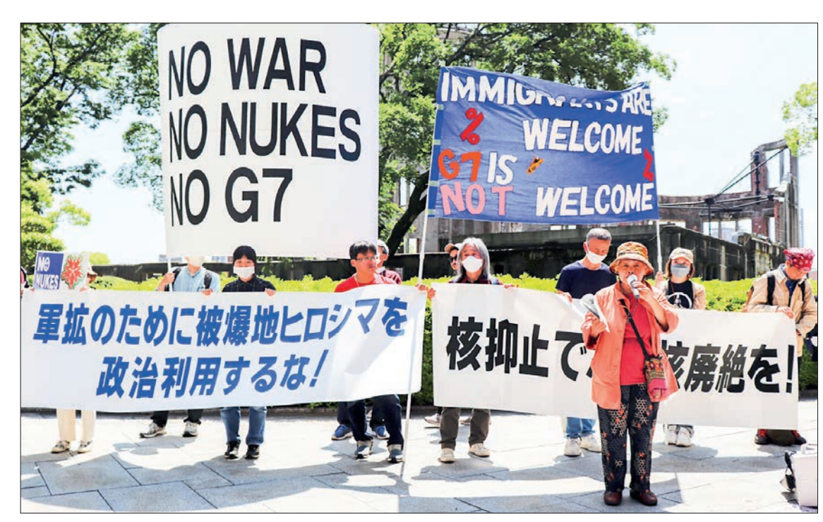
Hundreds of Japanese citizens take to the streets on 14 May in the Japanese city of Hiroshima to protest against the upcoming Group of Seven summit.

Despite China's serious concerns, the G7 used issues concerning China to smear and attack China and brazen-