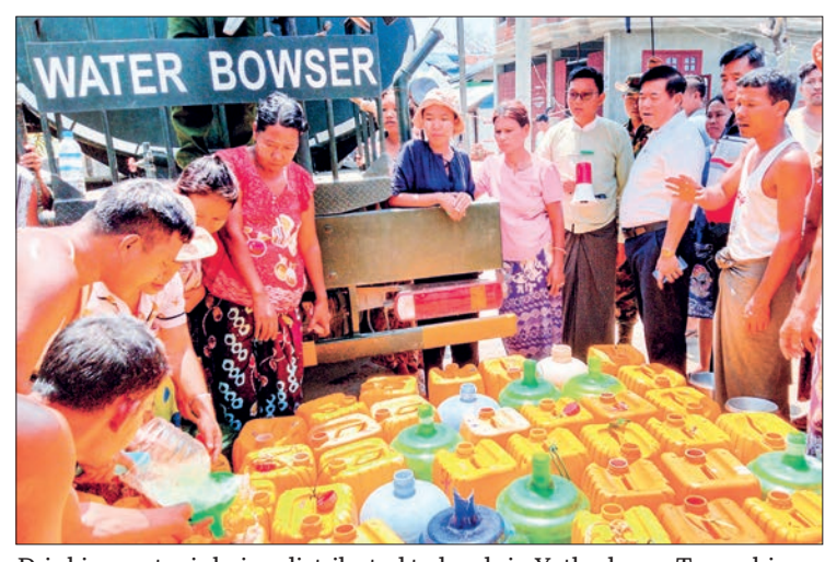
Drinking water is being distributed to locals in Yathedaung Township on 21 May.

They also looked into distribution of relief supplies to the storm-affected families at No 2 Myoma BEHS in Yathedaung and preparations to open high schools in urban areas as well as healthcare services being provided by Tatmadaw medic teams.—Yathedaung IPRD/KZW