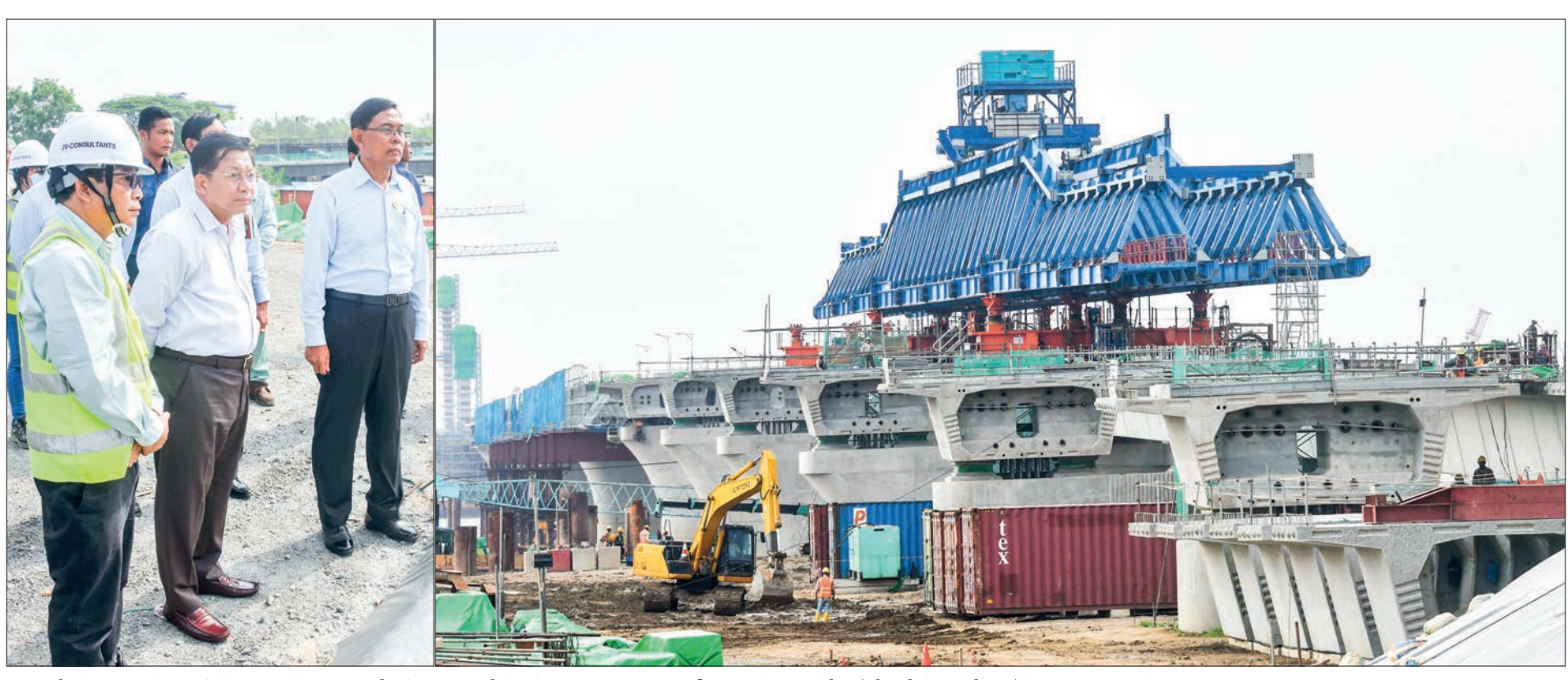
SAC Chairman Prime Minister Senior General Min Aung Hlaing inspects progress of Bago River Bridge (Thanlyin Bridge-3) in Yangon Region on 21 May.

CHAIRMAN of the State Administration Council Prime Minister Senior General Min Aung Hlaing inspected progress in implementation of Bago River Bridge (Thanlyin Bridge-3) project and Myanmar-Korea friendship (Dala) bridge project in Yangon Region yesterday morning.