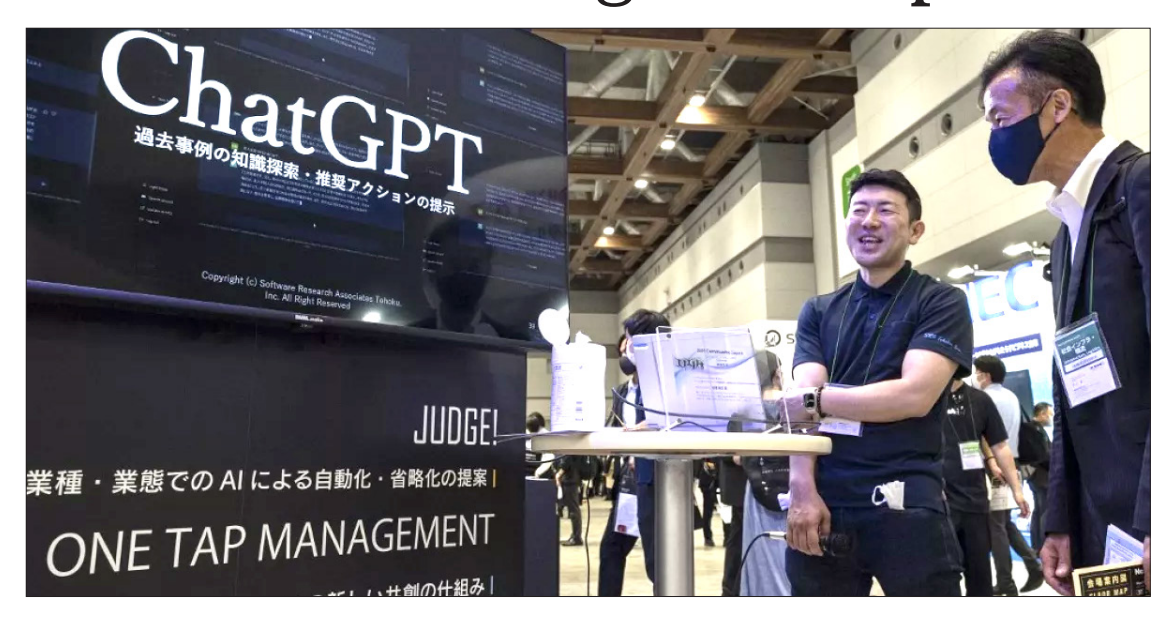
A man speaks with a booth representative next to a digital display (L) promoting ChatGPT, during the threeday 7th AI Expo, part of NexTech Week Tokyo 2023, at Tokyo Big Sight international exhibition center on 10 May.

gence bot that became a global sensation for its powers to churn out human-like content and provide answers on all subjects, is now available in the Apple app store.