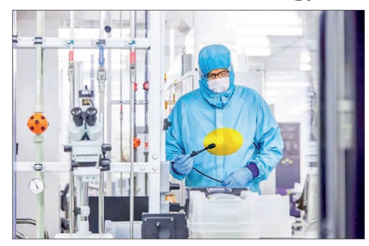
The British government is investing a lot of money to protect technology from risk and keep the chip supply chain running smoothly.

BRITISH government on Friday unveiled a new £1 billion semiconductor strategy to invest in infrastructure, research and security as the UK tries to diversify its chip supply chain.