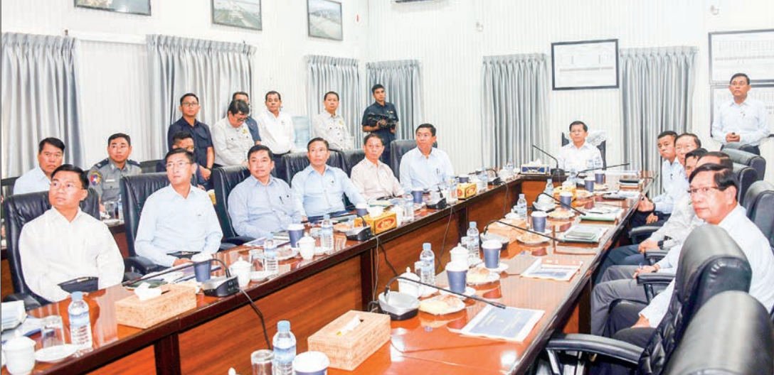
SAC Chairman Prime Minister Senior General Min Aung Hlaing views progress of implementing Myanmar-Korea friendship (Dala) bridge project on 21 May.