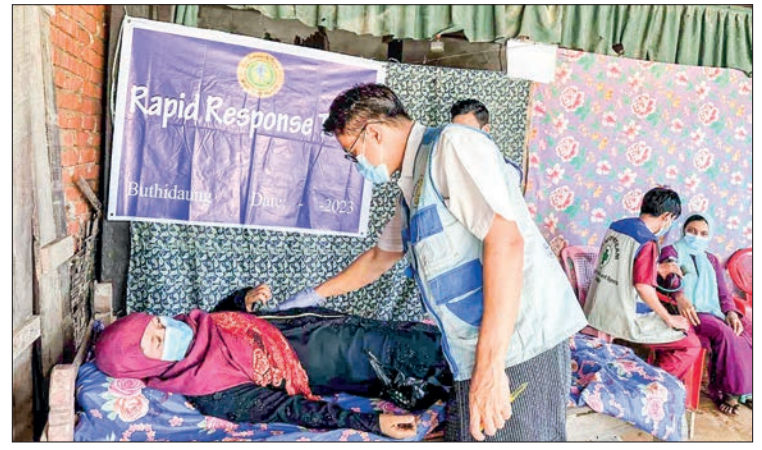
A specialist giving treatment to a local in Buthidaung on 21 May.

Maungtaw Township yesterday to provide healthcare to the lo-