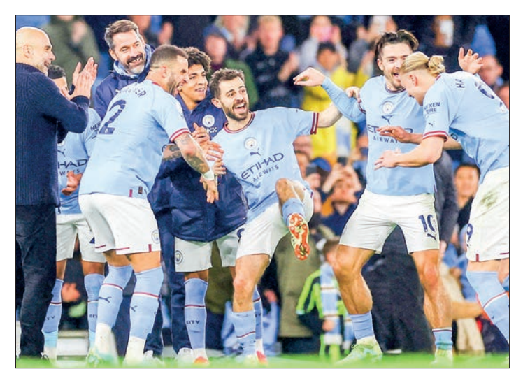
Manchester City win Premier League title after Arsenal lose at Nottingham Forest. Manchester City have secured the 2022-23 Premier League title without playing after closest rivals Arsenal lost 1-0 at Nottingham Forest.

Only United under Alex Ferguson had previously won five titles in six years, between 1995/96 and 2000/01.—AFP