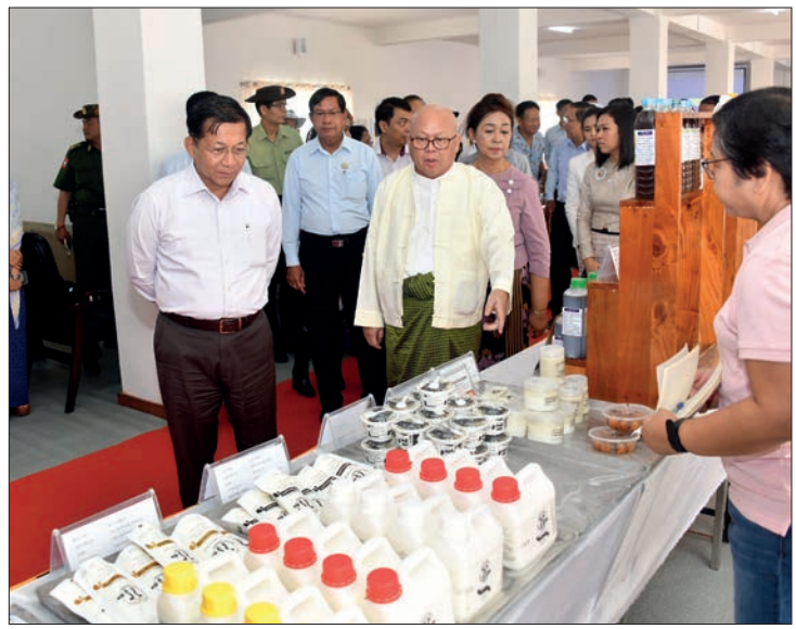
Senior General Min Aung Hlaing looks into products of Wah Wah Win Agriculture and Livestock Company in Nyaungdon Township on 21 May.

duction of milk and dairy products, fish based products and running of cold storage.