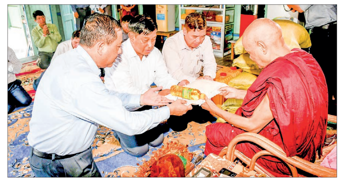
SAC member Deputy Prime Minister Union Minister for Transport and Communications Admiral Tin Aung San offers alms to a Sayadaw in Sittway on 21 May.

STATE Administration Council Member Deputy Prime Minister Union Minister for Transport and Communications Admiral Tin Aung San, Union Minister for Border Affairs Lt-Gen Tun Tun Naung, Rakhine State Chief Minister U Htein Lin, and Deputy Ministers donated offertories to the monasteries in Sittway yesterday morning.