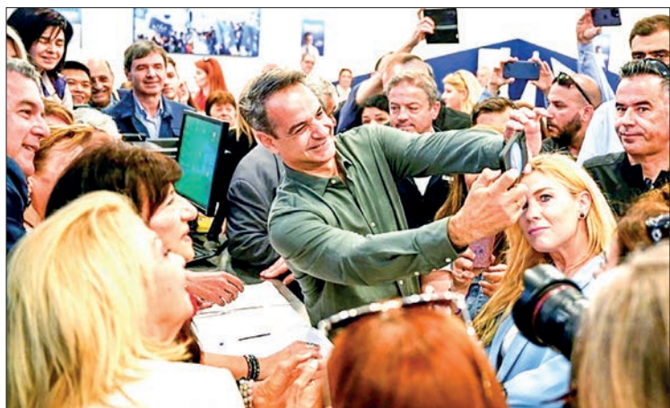
Greek Prime Minister Kyriakos Mitsotakis took to posting behind-the-scenes clips from his campaign on TikTok.

KYRIAKOS Mitsotakis, whose party scored a thumping win at Sunday's election, is a conservative political dynasty scion credited with putting the debt-ridden