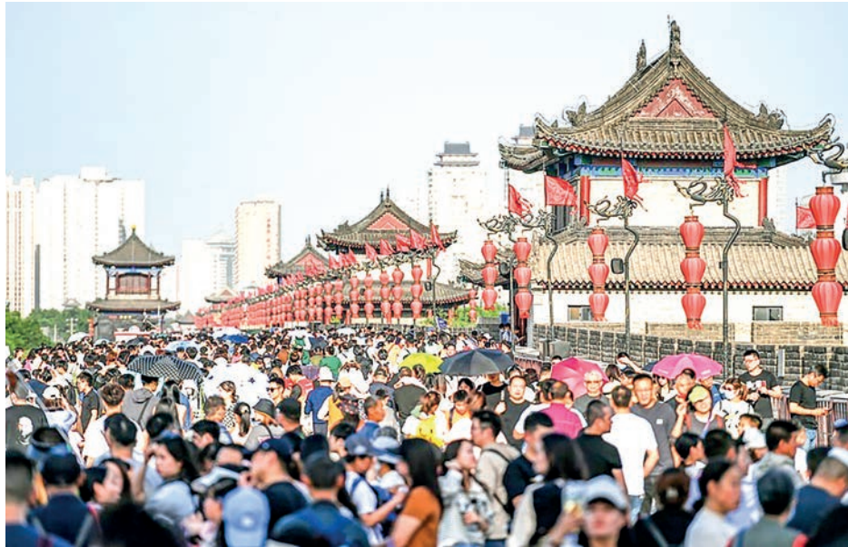
People visit the ancient city wall scenic spot in Xi'an, northwest China's Shaanxi Province, 30 April 2023.

Xinzhou ancient city in Shanxi, with a history of more than 1,800