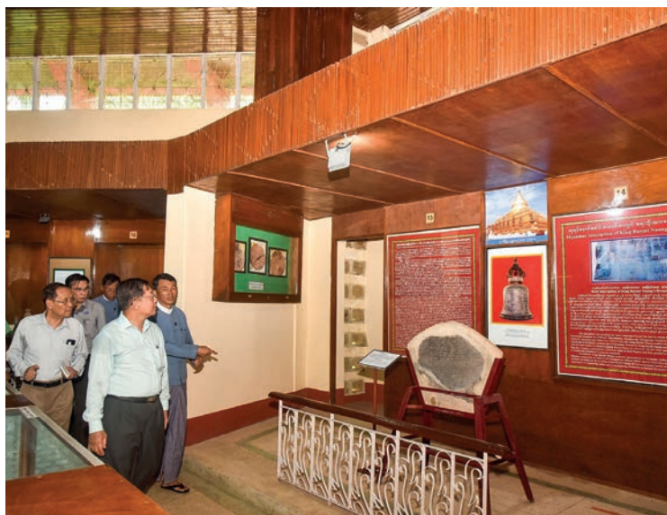
The Premier views the display at the Hanthawady archaeological museum.

King Bayintnaung built 3,400 square metres of Kanbawzathadi Palace with 20 gates in Hanthawady region in 915 ME (1553 AD). The king passed away at the age of 66 in 943 ME (1581 AD). In the reign of his son King Nanda, Kanbawzathadi Palace was set on fire. The Department of Archaeology excavated the lost palace from early 1990 to 1997. The excavation started on 13 December 1993 for the ground tier-roofed hall and then the foundations of the ground tier-roofed hall, Sanu Hall, left-wing hall and right-wing hall were found. The remaining teak posts were also found there, and some teak posts were impressed with donor names. The buildings of the palace were rebuilt as a replica in line with the foundations and records. And, the palace is crowded with visitors. — MNA/TTA