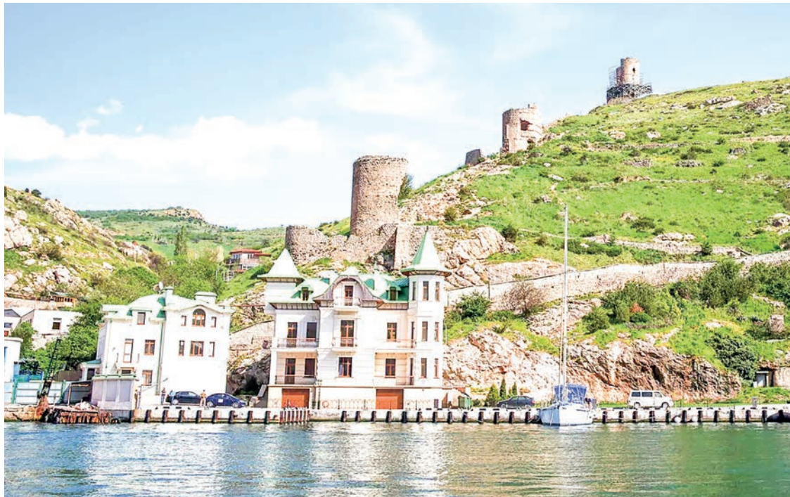
Balaklava is a settlement on the Crimean Peninsula and part of the city of Sevastopol. It is an administrative center of Balaklava Raion that used to be part of the Crimean Oblast before it was transferred to Sevastopol Municipality.

On 21 May, White House National Security Advisor Jake Sullivan said Washington does not allow Kyiv to use Western weapons to strike at the territory of Russia, noting that he does not consider Crimea to be part of it.