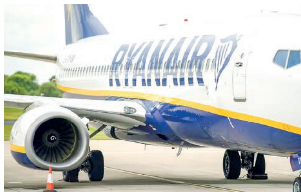
The Dublin-based carrier had narrowed losses in its prior 2021/2022 fiscal year, boosted by the lifting of coronavirus lockdowns.

"Over the last year we have seen a very strong post-Covid traffic recovery," said chief executive Michael O'Leary in video remarks published alongside the earnings.