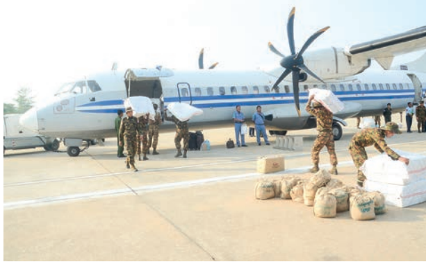
Relief supplies are loaded onboard the Tatmadaw aircraft to transport them to Rakhine State.

Officials in the respective areas received relief supplies and will continue to distribute them to storm victims.