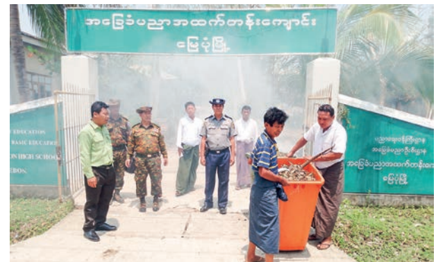
Brig-Gen Kyaw Kyaw Soe and party inspect the cleaning activities in Myebon.

In addition, Brig-Gen Kyaw Kyaw Soe and party