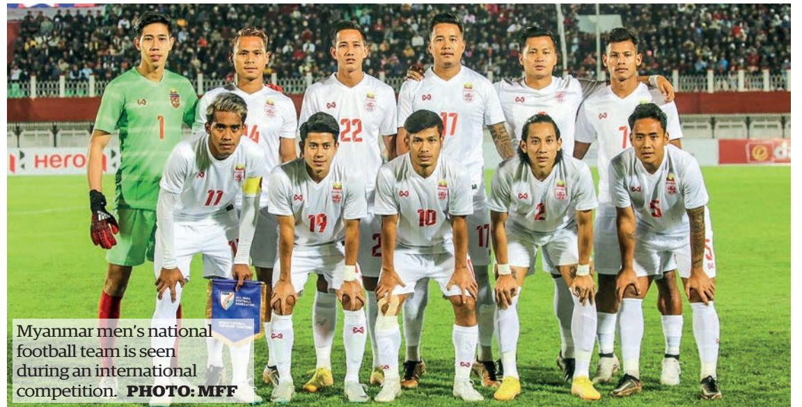
Myanmar men's national football team is seen during an international competition.

Team Myanmar travelled to India in the international week of March to play friendly matches and lost to the Indian national team 1-0 and drew with the Kyrgyz national team 1-1. — Ko Nyi Lay/KZL