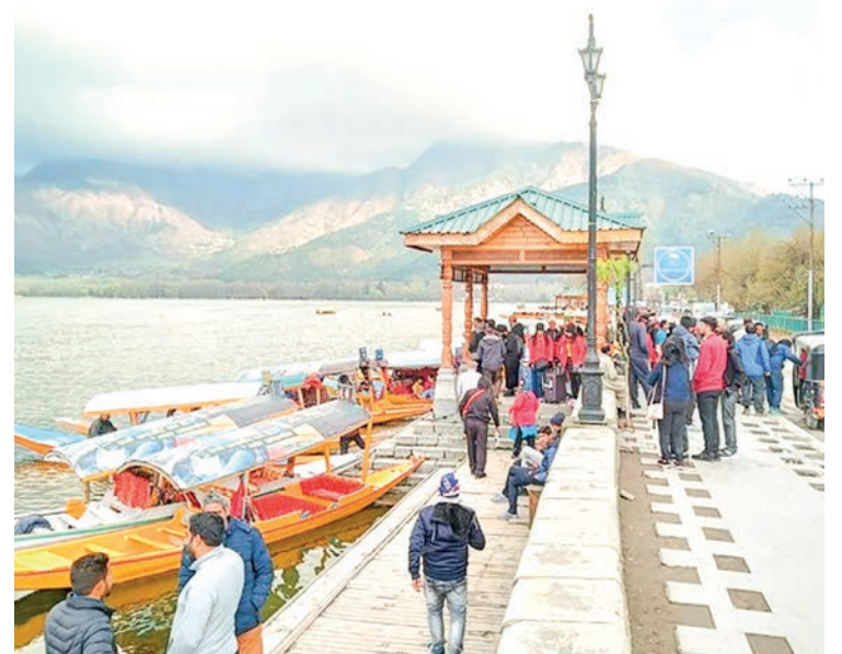
A Group of 20 (G20) tourism meeting is being held in Indian-administered Kashmir amid high security, with China and Pakistan condemning holding the event in the disputed region. India wants people to know that the region is peaceful.

tourism in the region, with its spectacular mountain scenery and signs at the airport declaring it "paradise on earth".