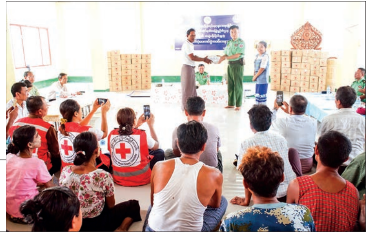
Maj-Gen Soe Naing Oo provides cash assistance and foodstuffs to disaster victims.

Officials provided a total grant of K3,347,800 to the village administrator for 67 households in the Singaung village-tract.