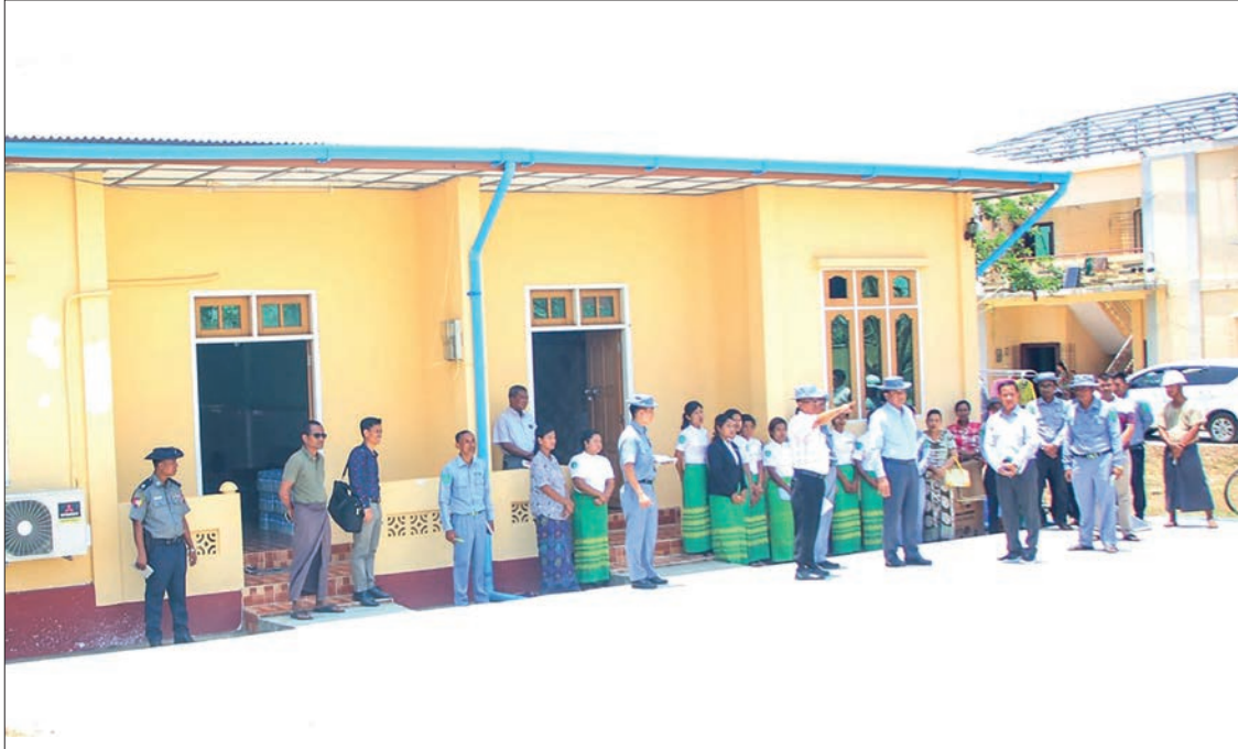
Union Border Affairs Minister Lt-Gen Tun Tun Naung is pictured inspecting rehabilitation measures in Sittway.

UNION Border Affairs Minister Lt-Gen Tun Tun Naung, accompanied by officials, inspected the construction of a one-mile concrete road with K260.948 million granted by the Ministry of Border Affairs for the 2022-2023 financial year on the 5/7 Mile village-to-village road of Kankawkyun- Zawmatet-Chaungnwe in Sittway Township, the 150-foot bridge over the Zawmatet Creek, which was built with an approved amount of K294.778 million in the 2020-2021FY, and the concrete road that will be implemented with an approved amount of K307.875 million in the 2023-2024FY.