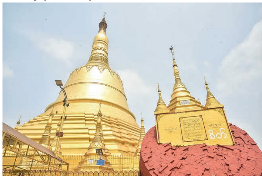
The Premier gives guidance for the systematic maintenance of the Shwemawdaw Pagoda yesterday.