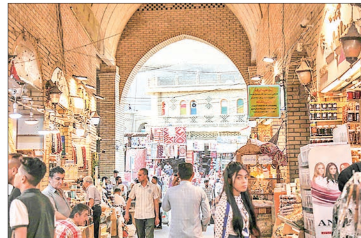
File photo shows people at a market in Arbil, the capital of the autonomous Kurdish region of northern Iraq.

But some Kurds in Iraq and across the border in Syria fear an Erdogan victory will see a military escalation in their home regions. — AFP