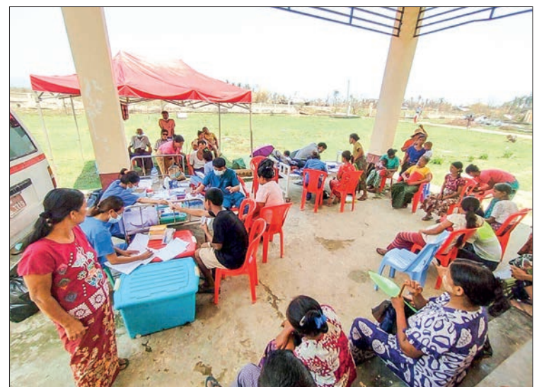
A makeshift healthcare centre is opened at the Kutoung Station hospital in Yathedaung.

Medical services were provided to 642 people in Aungthukha Village, 634 people in Myoyu Village, 391 people in Inn-din Village,