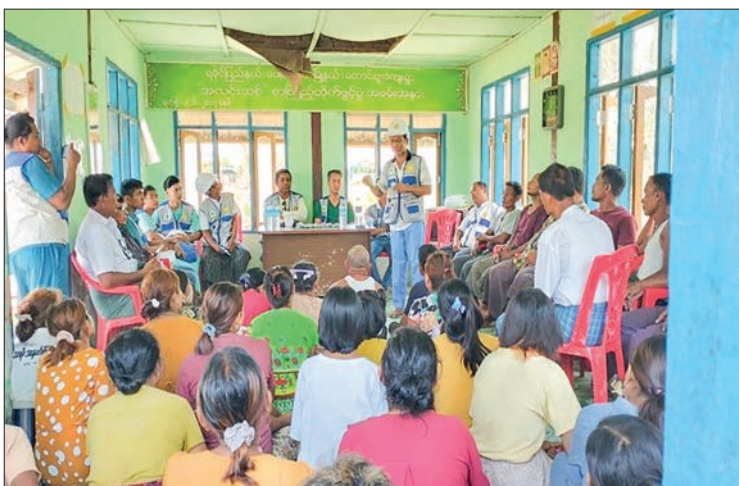
Health education activities are underway in Pauktaw Township.

Similarly, the roofs of a two-room medical storage building and a two-unit staff housing at Ponnagyun Township Hospital, which were damaged by Mocha, were repaired on 21 May. — MNA/KZL