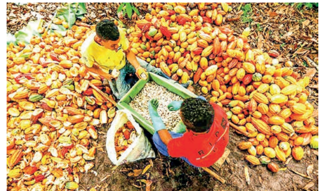
Brazilian farm workers cut cocoa fruits at the Altamira farm in Itajuípe, Bahia, Brazil.

In addition, in the past 12 months as of March, the indicator showed an increase of 3.31 per cent in the South American country. — Xinhua