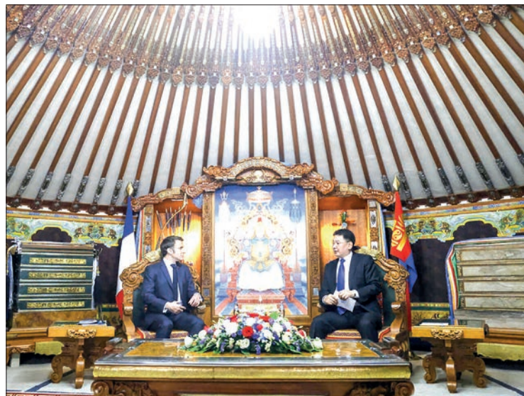
It was in a traditional yurt that Emmanuel Macron was received on Sunday 21 May for the first visit of a French president to Mongolia.

"The fact that Mongolia will be on the route back allows us to make this historic first (visit)