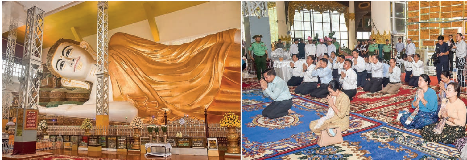
The Senior General and his wife pay homage to the Shwethalyaung Reclining Buddha Image yesterday.

The Senior General urged officials to continuously maintain the pagoda for long-term