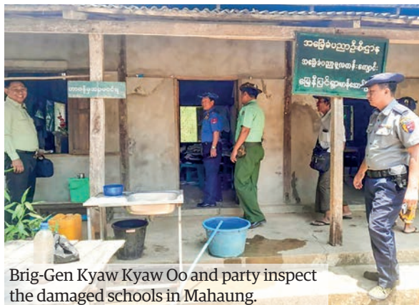
Brig-Gen Kyaw Kyaw Oo and party inspect the damaged schools in Mahaung.

BRIG-GEN Kyaw Kyaw Oo, who arrived in Manaung, Rakhine State to perform rehabilitation tasks on the damage caused by Cyclone Mocha, and officials inspected the schools damaged by the storm in the township at 9:30 am yesterday.