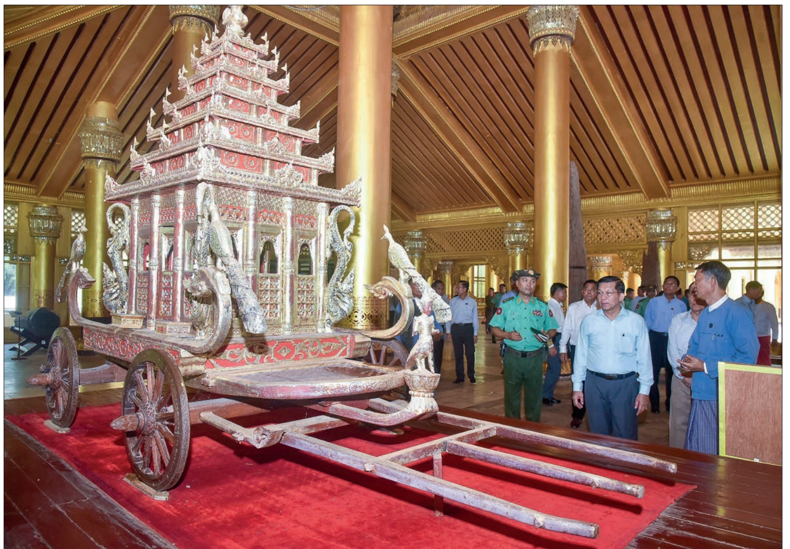
State Administration Council Chairman Prime Minister Senior General Min Aung Hlaing views round the museum of the Kanbawzathadi Palace in Bago on 22 May 2023.

renovation tasks at the pagoda and gave necessary guidance to officials.