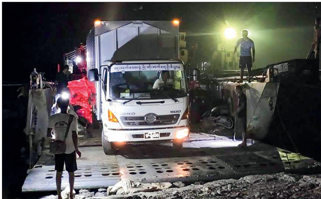
Relief supplies are seen being loaded onto the Tatmadaw (Navy) landing craft to transport them to Rakhine State.

Similarly, another landing craft carrying 114.6022 tonnes of timber left for Sittway yesterday. —MNA/KZL