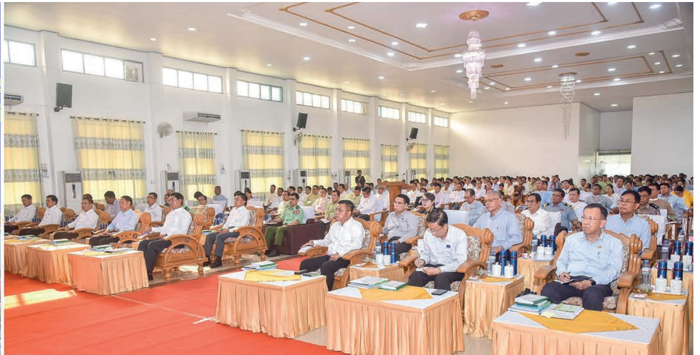
State Administration Council Chairman Prime Minister Senior General Min Aung Hlaing meets MSME business people from Bago Region yesterday.

T HE government will join hands with anyone if they can strive for the improvement of the State, said Chairman of the State Administration Council Prime Minister Senior General Min Aung Hlaing at the meeting with MSME businesspersons at the city hall in Bago yesterday afternoon. Individual reports on the progress of MSME businesses and requirements