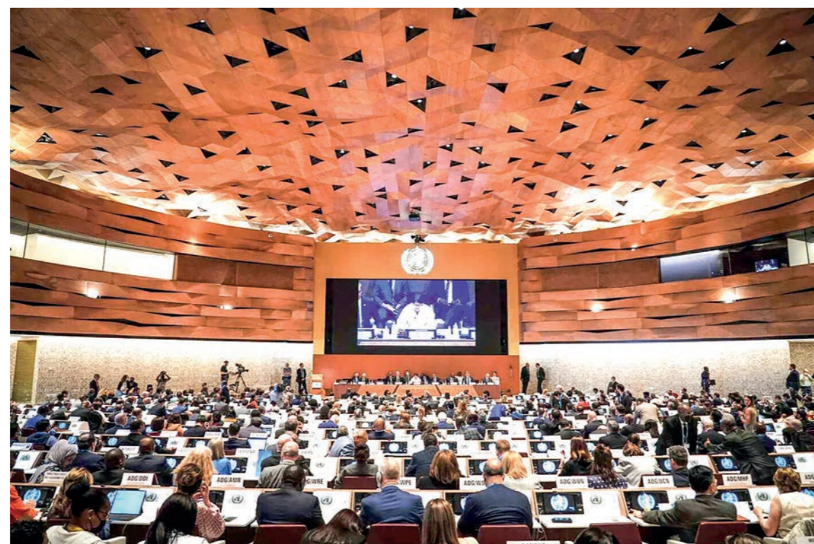
As the world faces ongoing health and humanitarian emergencies, the Seventy-sixth World Health Assembly (WHA), which will take place from 21-30 May, opened on 21 May at the Palais des Nations in Geneva, Switzerland.

"The pandemic accord that member states are now negotiating must be a historic agreement to make a paradigm shift in global health security, recognizing that our fates are