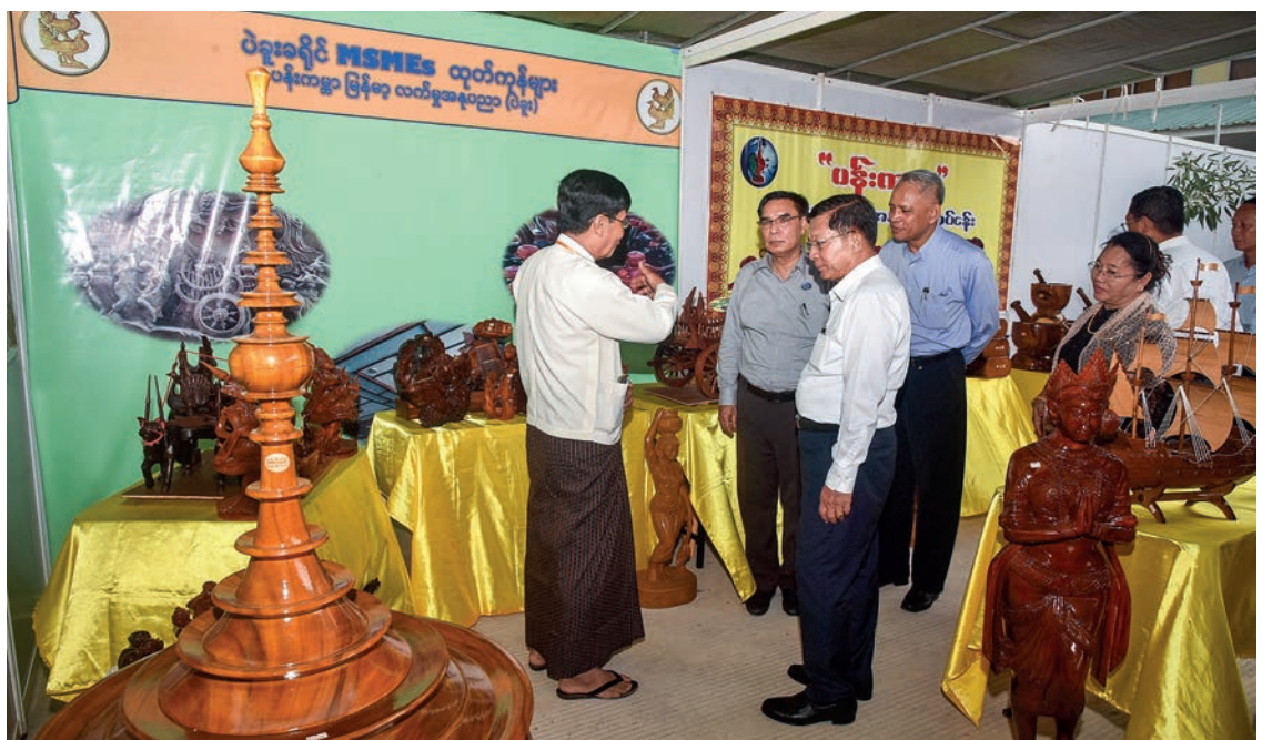
The Premier looks into the sculpture exhibition at the event yesterday.

Encouraging manufacturing industries based on agriculture and livestock