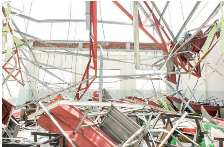
Deputy Prime Minister Admiral Tin Aung San views the debris at the Technological University (Sittway) yesterday.

First, they inspected the cleanup processes conducted by members of the Myanmar Police Force, Fire Brigade, departmental staff and social welfare organizations along Thattahtana Road of Pyitawtha