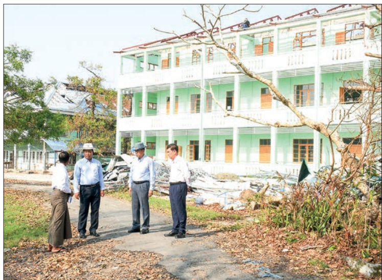
The Deputy Prime Minister looks round the BEHS No 4 in Sittway.