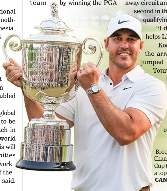
Brooks Koepka's victory at the PGA Championship made his case for the US Ryder Cup team and LIV Golf's case to be considered a top-flight golf league.

LIV events don't get world ranking points, causing concern that major qualifying will be difficult soon. Koepka's win helps make the case their players deserve consideration.— AFP