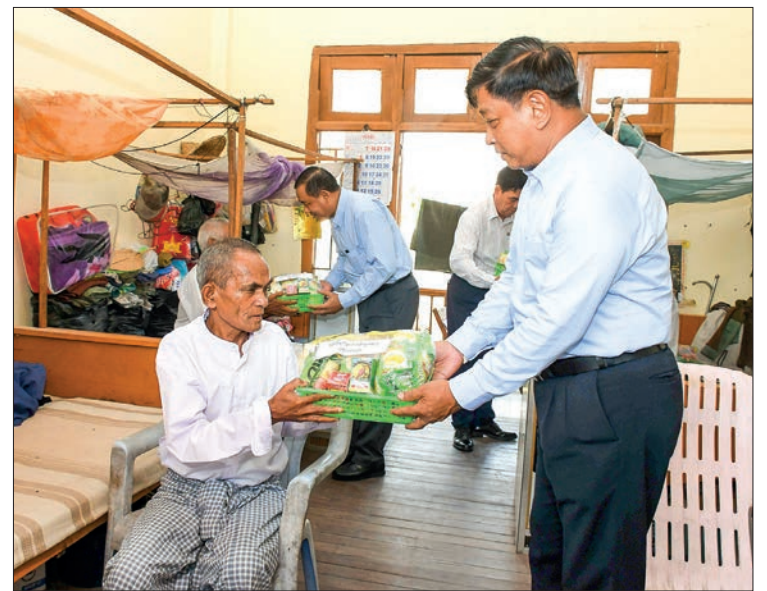
Deputy Prime Minister Admiral Tin Aung San provides foodstuffs to the elderly.

Moreover, Tatmadaw members and departmental staff sell basic foodstuffs, including noodles, biscuits and canned food produced by Tatmadaw factories, at fairer prices at U Ottama Park for cyclone victims in Rakhine State.