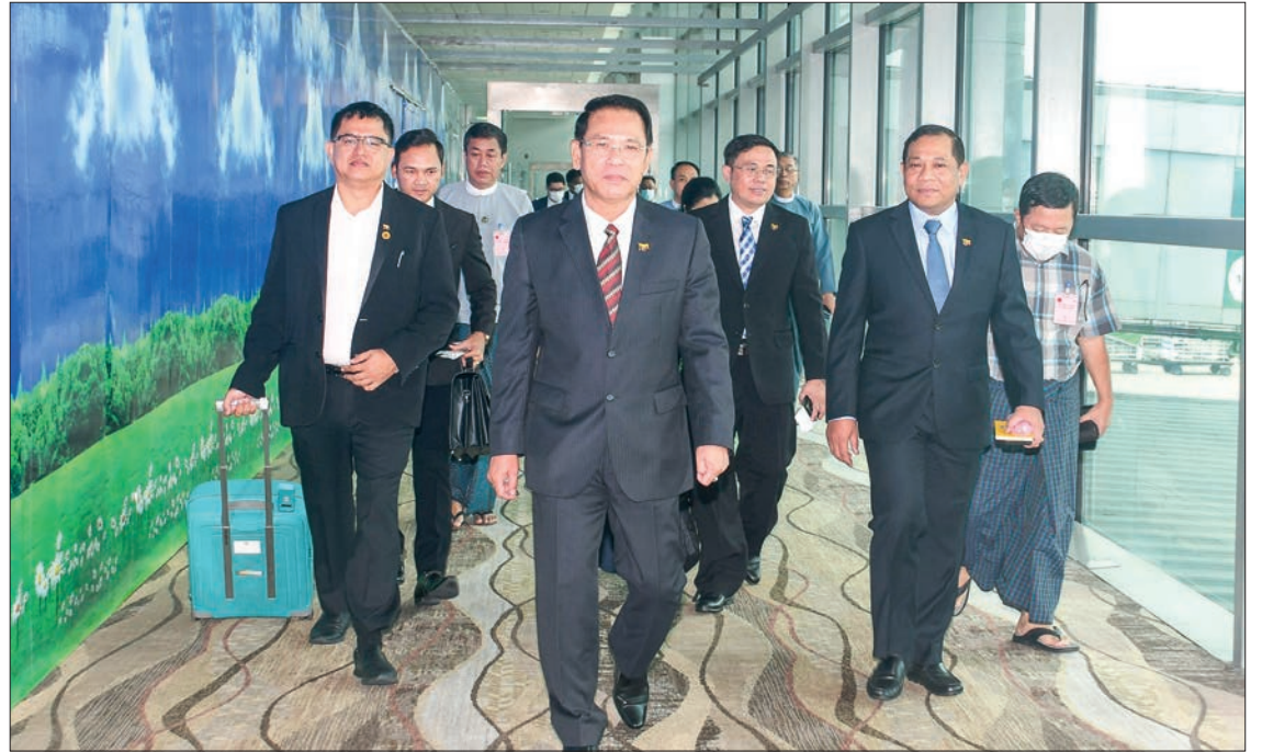
Union Minister U Maung Maung Ohn and delegation are seen on the departure to attend the 18 th Asia Media Summit in Bali, Indonesia.

AIBD member countries and their TV broadcasting or-