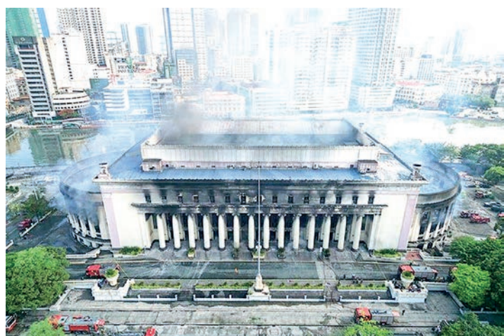
This 22 May 2023 photo shows the Manila Central Post Office after the fire was declared under control.

Originally built in 1926, the post office was once considered the "grandest building" in Manila, according to its website. — AFP