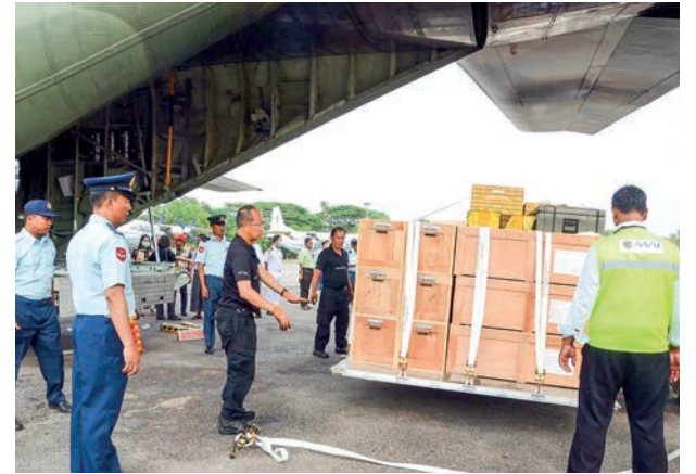
Humanitarian aid from ASEAN countries for Mocha victims are seen being unloaded from the plane at Yangon International Airport.

Response" principle, the humanitarian aid provided by ASEAN countries will be facilitated through the ASEAN Disaster Emergency Logistics System. The materials, stored in warehouses in Subang of Malaysia and Chainat of Thailand, will be transported by military aircraft from Thailand, Singapore and Indonesia 19 times. —MNA/KZW