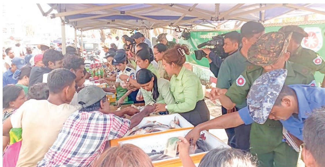
Residents are seen purchasing foodstuffs and vegetables in Sittway yesterday (above and below photos).

It is reported that the residents and the families of the departmental staff bought them in a body, and they are very grateful to the officials for selling them at low prices in times of difficulty. — MNA/CT