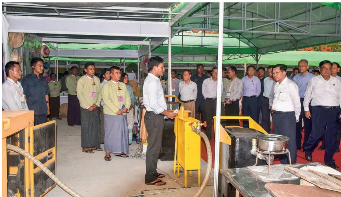
The Senior General views the MSME business displayed at the event yesterday.

The Senior General viewed round domestic products, foodstuffs, personal goods, industrial products, traditional products and clothes put on display and asked about market sharing of these products. — MNA/TTA