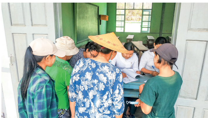
Wuntho, Kawlin District of Sagaing Region.