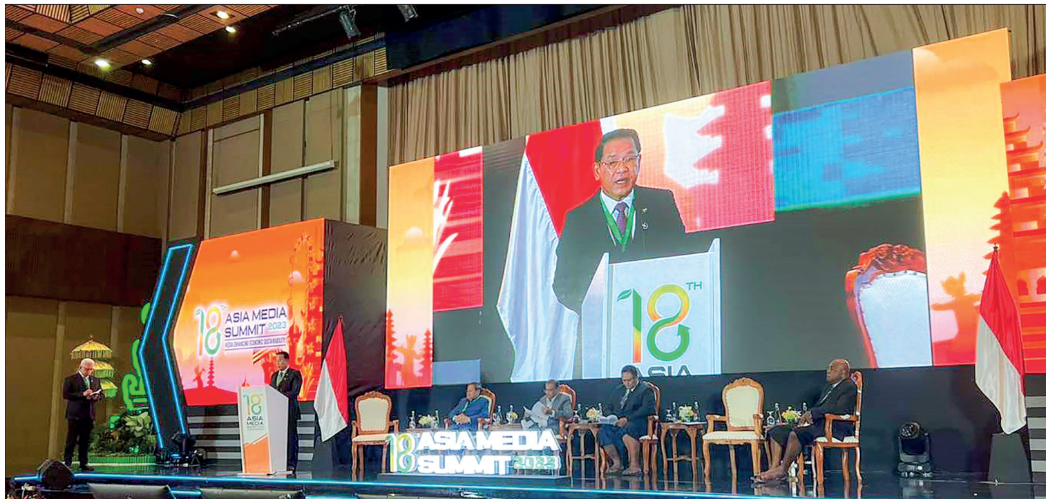
Union Minister U Maung Maung Ohn speaks on the opening occasion of the 18 th Asia Media Summit in Indonesia on 23 May 2023.

During the event, the Union minister said the Vaccination Management Information System was drafted systematically in Myanmar for COVID-19 vaccination processes for the public. The containment of the disease and public awareness campaigns were also conducted in a timely manner. The COVID-19 relief fund was established and disbursed low-interest loans