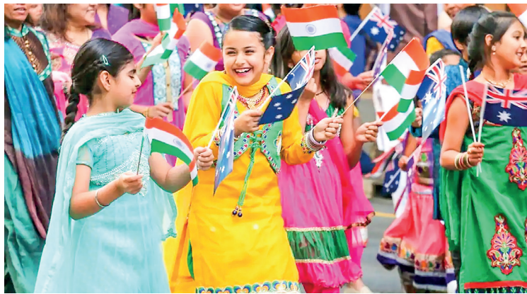
Indians are the second-largest diaspora community in Australia after the British, with 673,000 Indian-born citizens living in the country of 26 million.

INDIAN Prime Minister Narendra Modi flew into Australia on 22 May, aiming to strengthen economic ties by tapping into his country's fastest-growing dias-