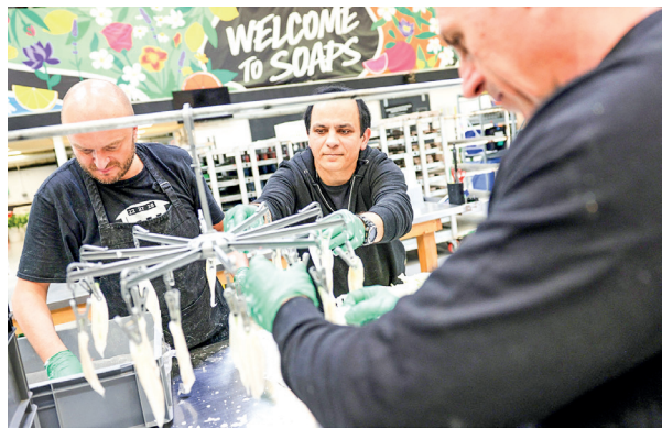
Workers dip orchid leaves into soap and hang them to dry in the soaps department at Lush cosmetic company in Poole, England, on 9 May 2023.

KNOWN for its colourful shampoo bars and fruity bath bombs, UK-based cosmetics brand Lush has opened the doors of its new Green Hub as part of efforts to expand its in-house circular recycling.