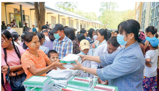
Minbu (Sagu) Township, Magway Region.