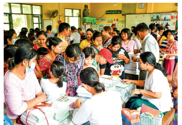
Pathein, Ayeyawady Region.