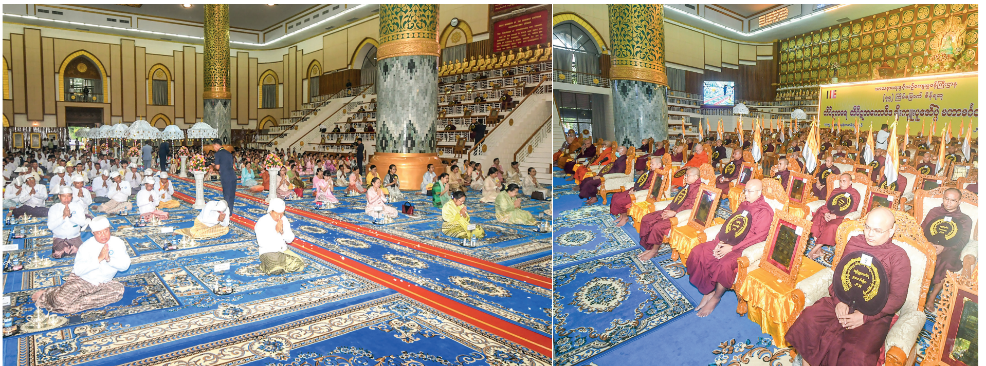
State Administration Council Vice-Chair Deputy Prime Minister Vice-Senior General Soe Win and the congregation take the Five Precepts from the Vice-Chairman Sayadaw of the Tipitakadhara Tipitakakovida Selection Ovadacariya Committee yesterday.

A CEREMONY to honour 152 members of the Sangha who passed the 75 th (Diamond Jubilee) Tipitakadhara Tipitakakovida Selection Examination organized by the Department of Religious Affairs was held in conjunction with the certificate presentation at Maha Pasana Cave on Thiri