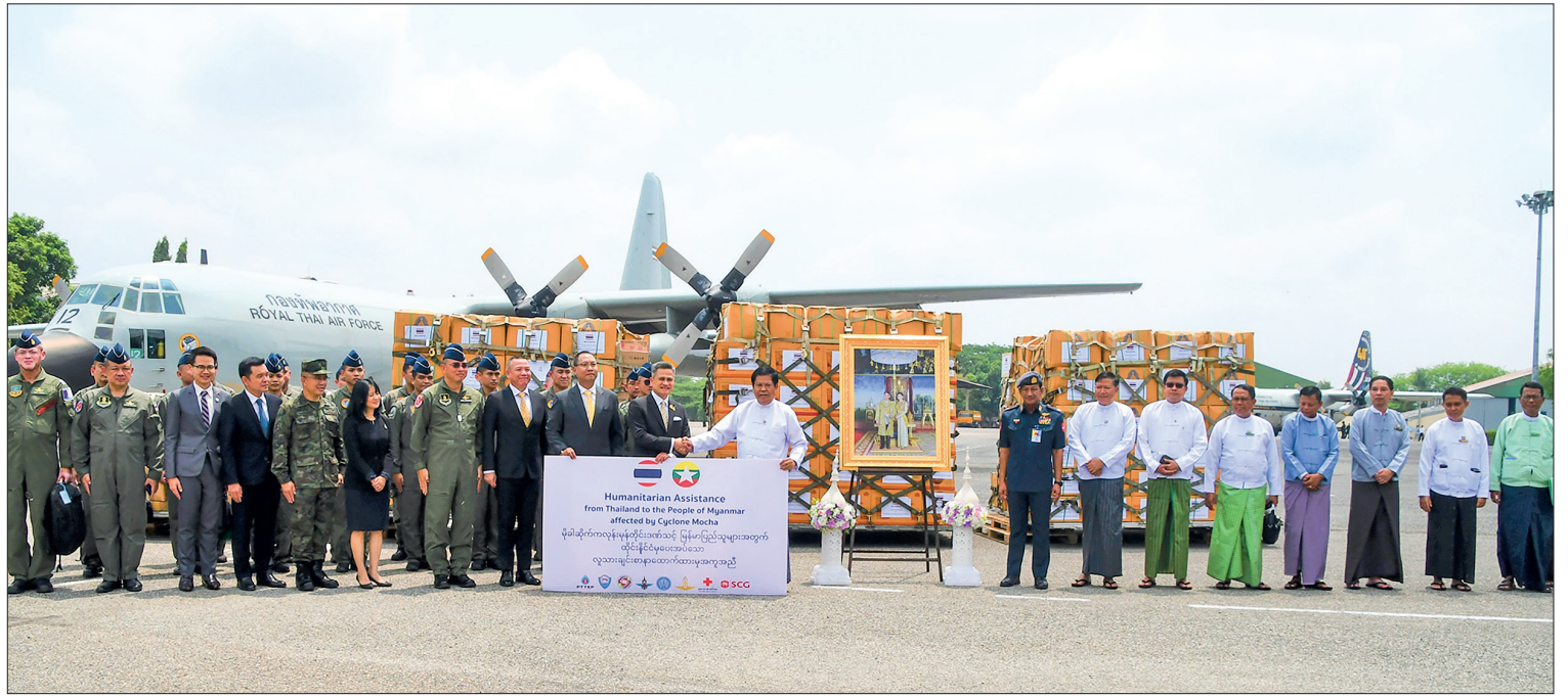
Union Minister U Than Swe receives the humanitarian aid from Thai Ambassador Mr Mongkol Visitstump at Yangon International Airport yesterday.

Yangon Region government's Minister of Social Affairs U Aung Win Thein and officials from the Disaster Management Centre and the Ministry of Foreign Affairs attended the hand-over event.