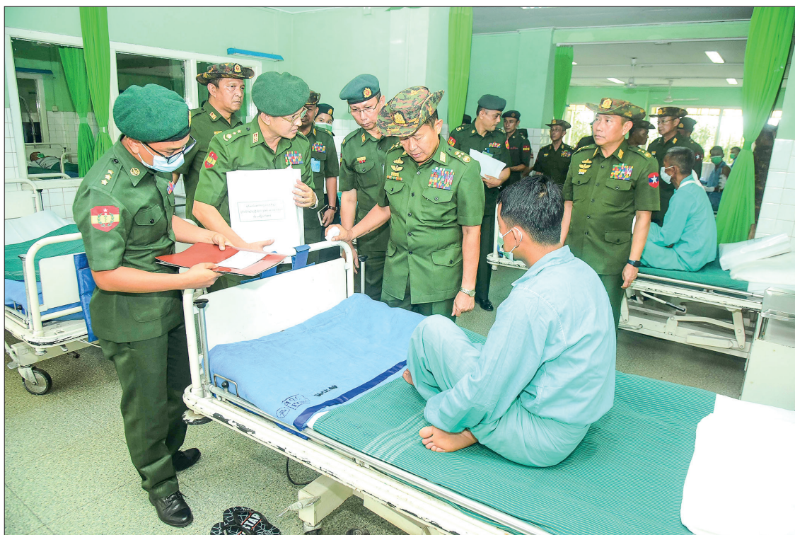
The Vice-Senior General comforts patients at the Defence Services Orthopaedic Speciality Hospital (500-bed) in Mingaladon Township.

advanced techniques for international Olympic sports events. Sufficient provision of nutritious foods for servicemen from the institute and trainees is very important to fully implement the objectives of the institute. Hence, manageable-scale livestock farming tasks must be done in line with the policies of the State.