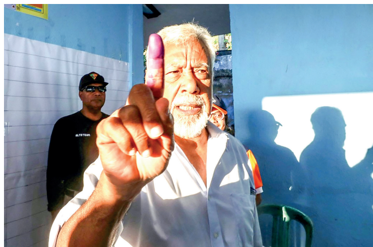
Former East Timorese leader Xanana Gusmao gestures after voting during the general election in Dili on 21 May 2023.