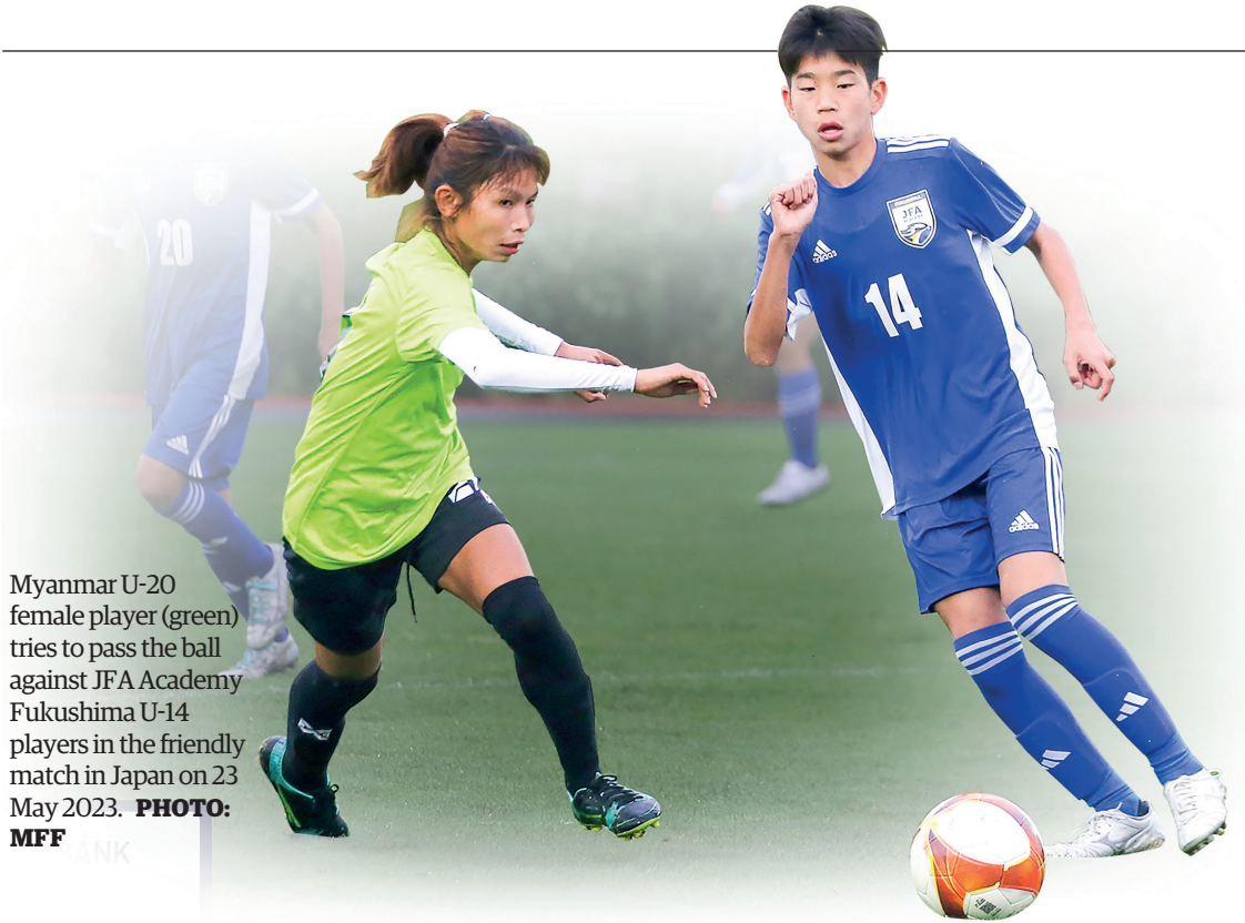
Myanmar U-20 female player (green) tries to pass the ball against JFA Academy Fukushima U-14 players in the friendly match in Japan on 23 May 2023.