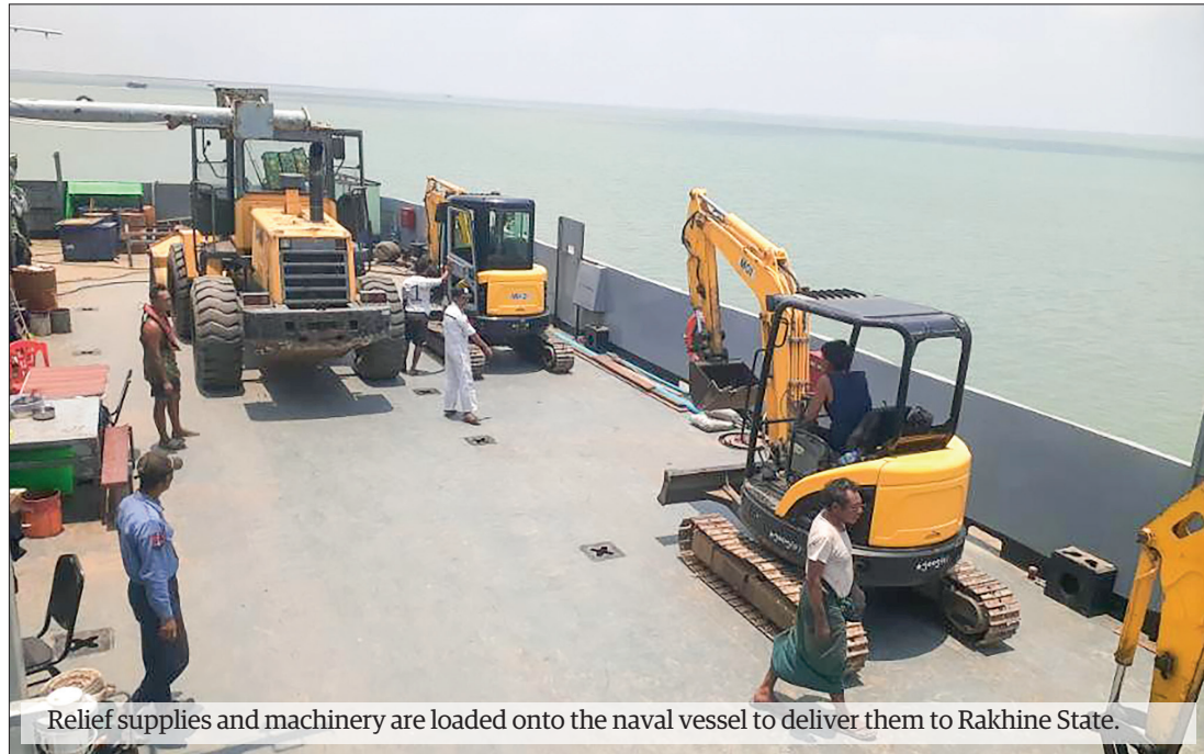
Relief supplies and machinery are loaded onto the naval vessel to deliver them to Rakhine State.

A 56-metre landing craft from the Tatmadaw (Navy) carrying 114.6022 tonnes of hardwood docked at the Essar jetty in Sittway yesterday morning to deliver the necessary relief materials to the areas affected by Cyclone Mocha in Rakhine