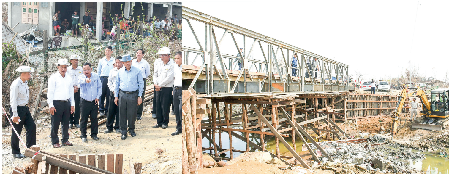
Deputy Prime Minister Admiral Tin Aung San inspects the construction of the Darpaing Bridge in Sittway yesterday.

These bridges were destroyed during Cyclone Mocha on 14 May and the Ministry of Construction saved the construction materials on 16 May. The ministry constructed the Thechaung Bridge as a 140-ft