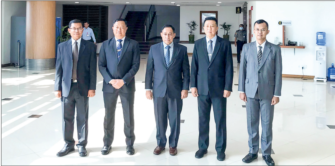
The Myanmar delegation headed by Lt-Gen Yar Pyae is seen at Yangon International Airport before leaving for the Russian Federation yesterday.

SAC Member Union Minister for the Ministry of the Union Government Office National Security Adviser Lt-Gen Yar Pyae led the delegation and left for the Russian Federation yesterday evening by air to attend the 11 th meeting of high-ranking officials on security issues to be held in Moscow from May 23 to 25 at the invitation of Russian Federation Security Council Secretary Mr Nikolay Patrushev. SAC Member Union Minister for the Ministry of the Union Government Office National Security Adviser Lt-Gen Yar Pyae and delegation were seen off by officials from the Ministry of the Union Government Office at Yangon International Airport. — MNA/TS