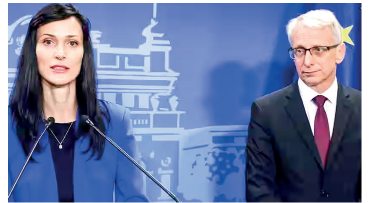
Bulgaria's Prime minister-designate Nikolay Denkov (R) of the anti-graft party We Continue the Change (PP) listens to the former EU commissioner for innovation, Bulgaria's Mariya Gabriel (L) from conservative GERB party addressing media during a joint news conference in Sofia on 22 May 2023.

"We all made a lot of concessions," Gabriel told a news conference in the capital Sofia. The 44-year-old ex-commissioner, who resigned from her post in Brussels last week, will initially be deputy prime minister, under the leadership of 60-year-old researcher Nikolay Denkov of the PP-DB coalition.—AFP