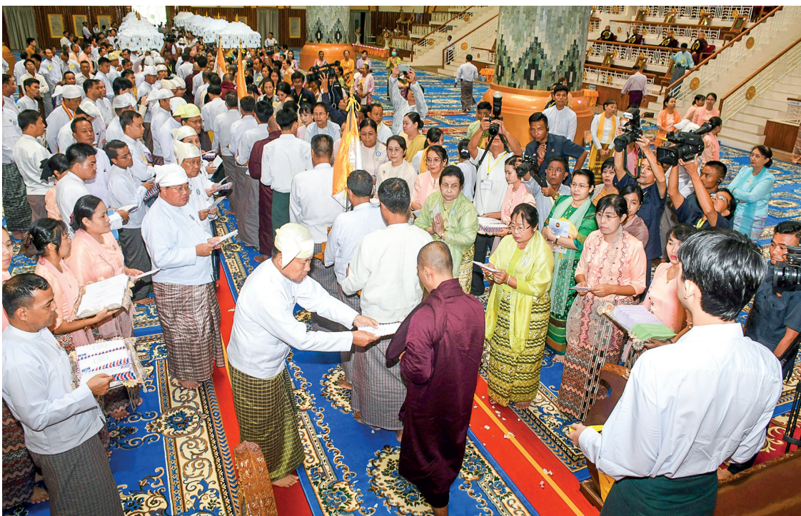
The Vice-Senior General, his wife and the congregation present alms rice and offerings to the recipient Sayadaws.