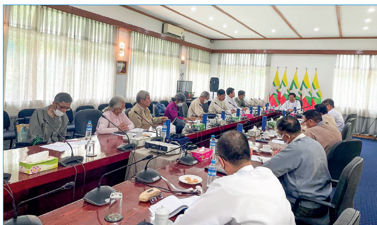
Union Minister U Than Swe holds talks with members of the MISIS boards yesterday in Yangon.

UNION Minister for Foreign Affairs U Than Swe delivered the speech at the meeting with the members of the Senior Advisory Board and the Executive Board of the Myanmar Institute of Strategic and International Studies (MISIS), which was held at the Myanmar Institute of Strategic and International Studies' Meeting Room in Yangon yesterday.