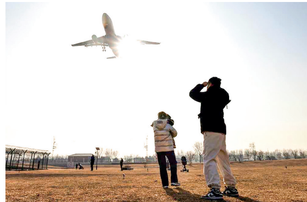
Air France already dropped certain short haul routes in exchange for state aid during the coronavirus pandemic.

The government had already secured Air France's compliance with the plan in exchange for a 2020 coronavirus financial support package.—AFP