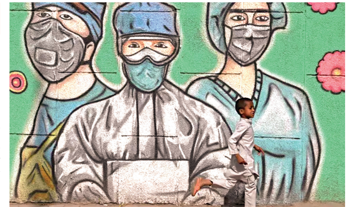
Shaken by the Covid-19 pandemic, countries agreed on the need to provide more reliable and stable funding. A child runs past a wall mural depicting healthcare workers wearing face masks along a road in New Delhi, India on 21 March 2021.