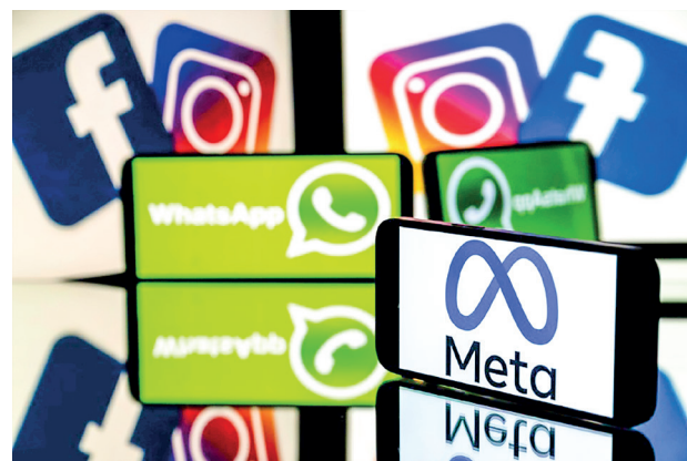
The European Union made a law called the General Data Protection Regulation (GDPR) five years ago to protect people's personal information.

Austrian campaign group NOYB said it had spent millions in a decade-long legal battle to force the Irish watchdog to tackle the case.—AFP