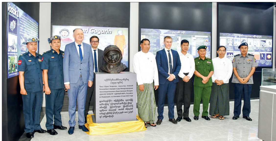
The documentary group photo of the opening event of the Aerospace Museum and the handover of the world's first cosmonaut Yuri Gagarin Bronze Statue.