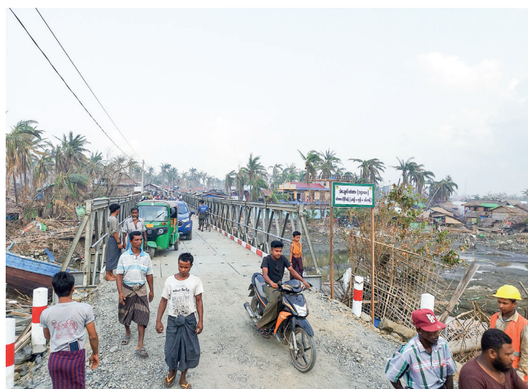
The Thechaung Bridge.

The Kaladan 4 vessel carries 198.7 tonnes of construction materials and foodstuffs to Kyauktaw and Ponnagyun townships while Kaladan 5 to Rathedaung