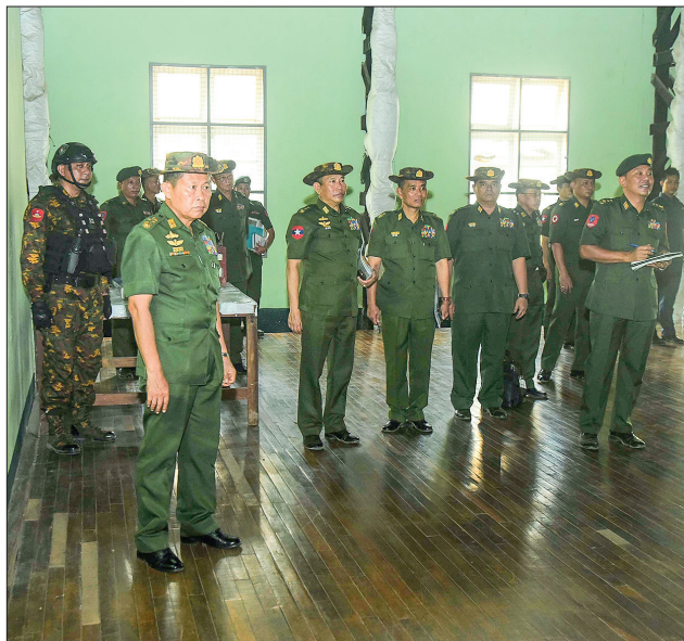
State Administration Council Vice-Chair Deputy Commander-in-Chief of Defence Services Vice-Senior General Soe Win views the training session in Taekwondo at the Defence Services Self-Defence and Sports Institute in Yemon Cantonment on 23 May 2023.

In his instructions, the Vice-Senior General said that conducting the training courses on basic and advanced sports and self-defence to Tatmadaw members from the Tatmadaw (Army, Navy and Air) aims to turn out selected Tatmadaw athletes and outstanding soldier