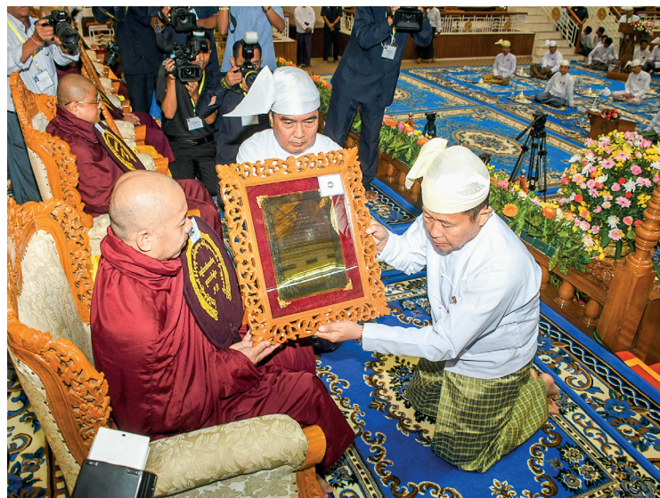
The Vice-Senior General offers the Mula Abhidhammika title.