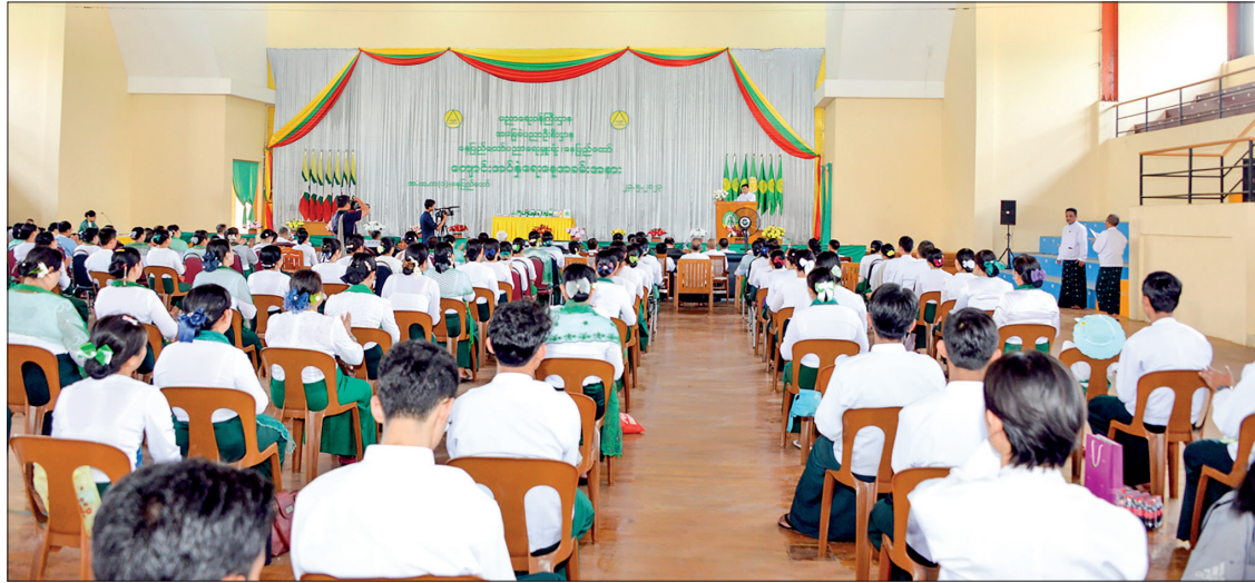
The school enrolment day ceremony for the 2023-2024 academic year in progress in Nay Pyi Taw yesterday, attended by Union Minister Dr Nyunt Pe.

Then, Union Minister for Education Dr Nyunt Pe, in his address, said that measures are being taken to ensure that all school-age children go to school, to turn out educated individuals equipped with