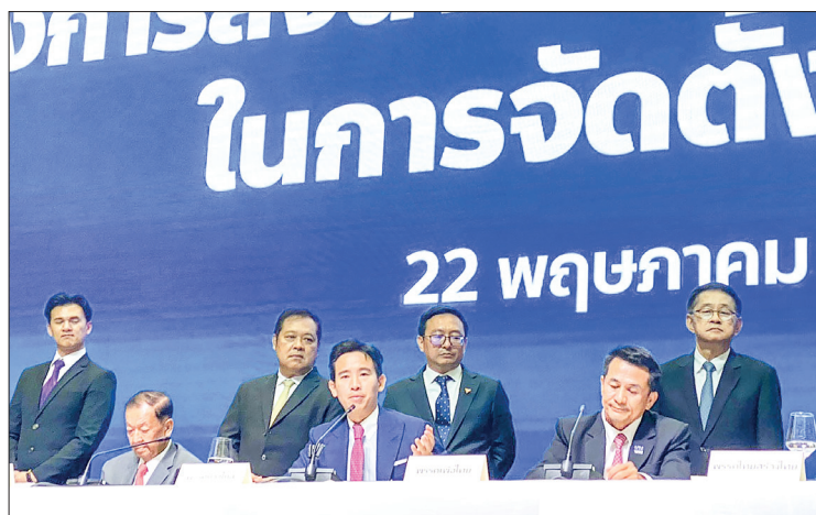
Pita Limjaroenrat (C), leader of Thailand's opposition Move Forward party, is pictured at a press conference in Bangkok on 22 May 2023.

Prime Minister Prayut Chan-o-cha, who leads the incumbent pro-military govern-