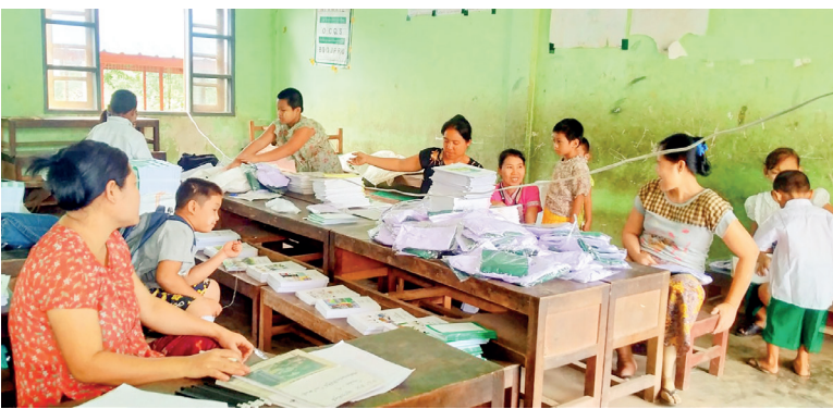
Hpa-an District, Kayin State.