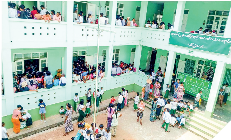
Zabuthiri Township, Nay Pyi Taw.