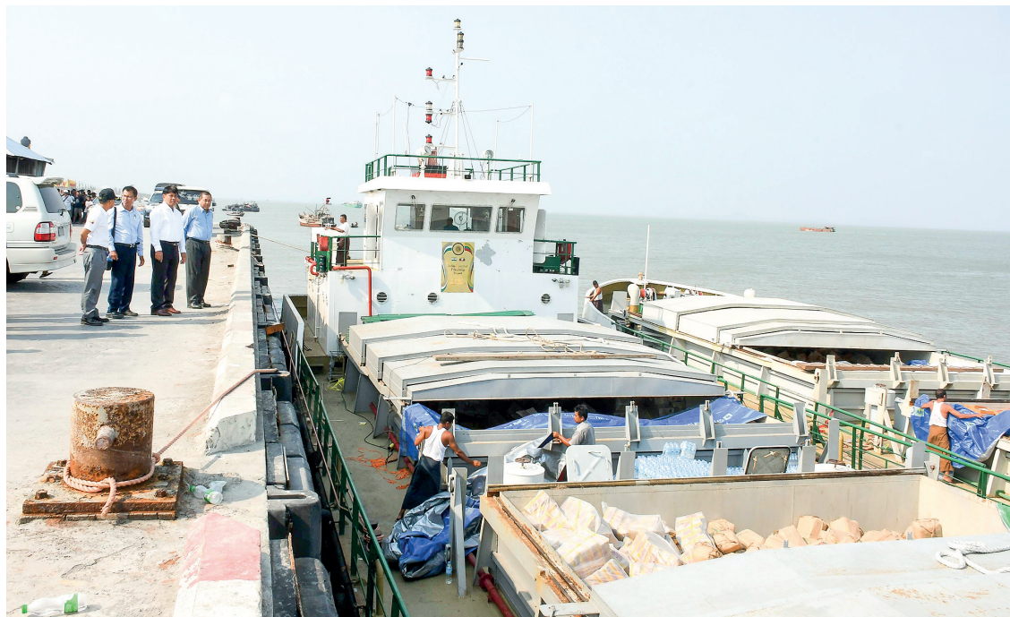
The vessel carrying relief supplies is seen ready for leaving for Rakhine State.

and Maungtaw townships with 195.6 tonnes and Kaladan 6 to Pauktaw, MraukU, Minbya and Myebon townships with 248.93 tonnes.