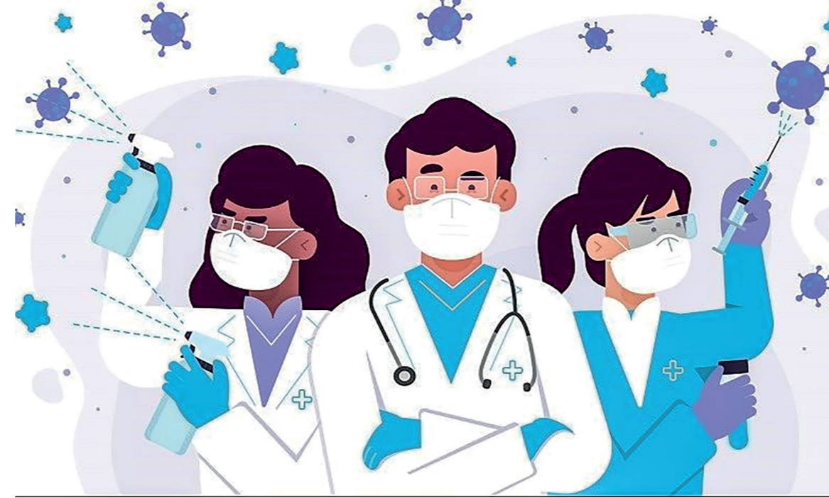
After four years, the virus was almost gone. People got vaccinated to stay safe and the World Health Organization declared the virus over. The world is now much better and safer.

Moreover, many people assume that the COVID-causing SARS-CoV-2 virus attacks only the respiratory tract because SARS means 'severe acute respiratory syndrome'. In practice, it attacks not only the respiratory tract but also the organs with