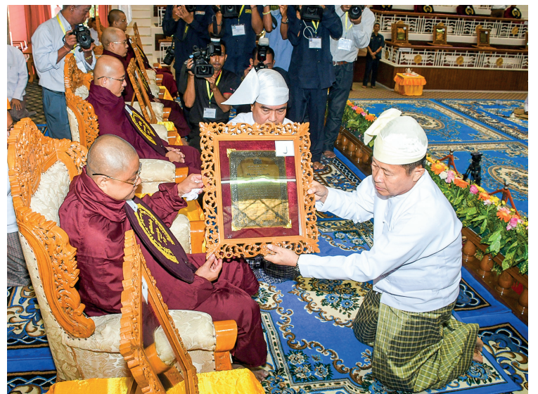
The Vice-Senior General offers the Mula Abhidhammika title.

donated rice and alms to the monks who passed the 75 th (Diamond Jubilee) Tipitakadhara Tipitakakovida Selection Examination.