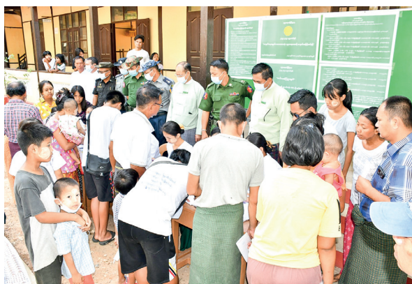
NyaungU, Mandalay Region.