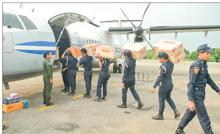
Relief goods are loaded onto the Tatmadaw aircraft to transport them to Rakhine State.

Sittway airport one time by Tatmadaw plane. The ATOM and MPT communication accessories, food, solar panels, batteries, clothes, generators and rescue equipment were also transported from Mingaladon Airport to Sittway Airport four times by Tatmadaw plane. Officials in the respective areas received relief supplies and will continue to distribute them to storm victims. — MNA/KZW