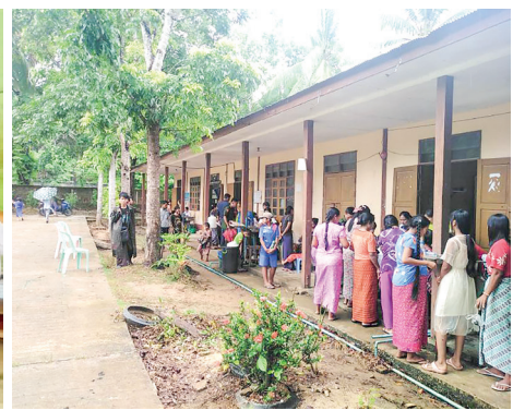
Khamaukkyi, Taninthayi Region.