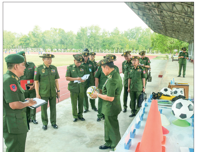
The Vice-Senior General views the training session in the football ground.

instructed the commandant to turn out selected national players via Tatmadaw (Army, Navy and Air) selected players for bringing honour to the State during his assigned term and to set records on his endeavours during the period. In turning out the selected players, it is necessary to conduct training for athletes to have systematic skills and techniques as well as