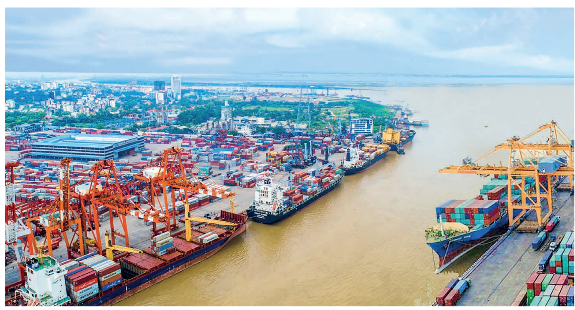
There is a strong market share of black grams and pigeons pea in India. Most of the growers also select them as main crops. The aerial picture shows container vessels loading and discharging export and import cargoes at Yangon Port.

hit a fresh new peak of K2.6875 million per tonne, according to the Bayintnaung Wholesale Commodity Centre.