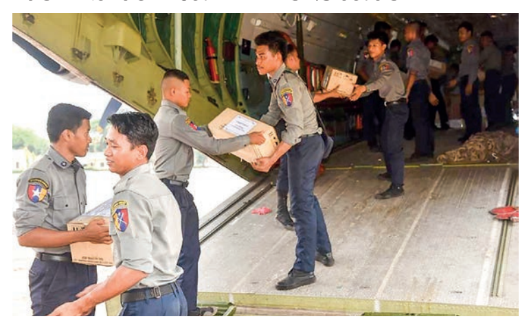
Relief goods are loaded aboard the Tatmadaw plane to transport them to Rakhine State

THE relief materials and food items contributed by the families of Tatmadaw (Army, Navy and Air) and well-wishers and relief supplies provided by the National Disaster Management Committee for local communities affected by the natural disaster in Rakhine State are being transported by Tatmadaw aircraft, helicopters and vessels.