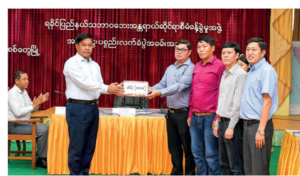
Deputy Prime Minister Admiral Tin Aung San accepts cash and kind donations in Sittway yesterday.

The Deputy Prime Minister and party inspected the free healthcare services of specialists in Pauktaw Township and comforted the patients. On arrival at the basic education high school of Pauktaw Township, they observed the repairing works and school enrolment processes for the 2023-2024 academic