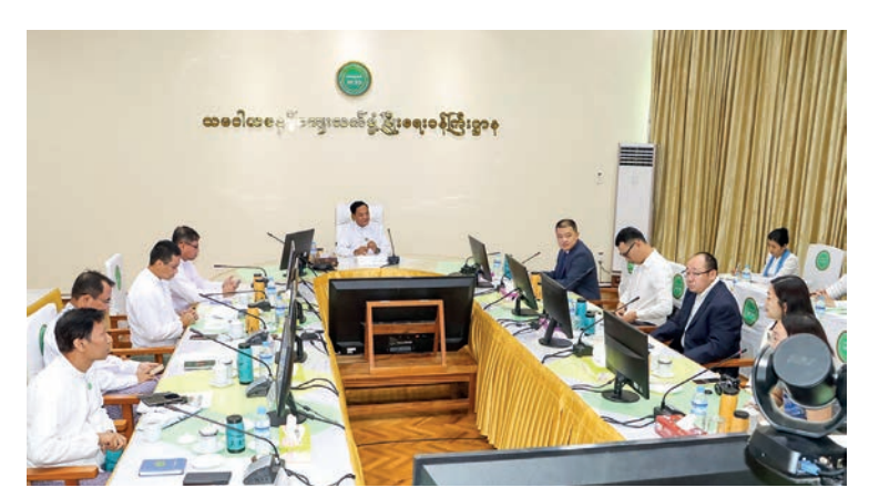
The provision of cash assistance to drill wells is underway, attended by Union Minister U Hla Moe.

Union Minister U Hla Moe received the cash assistance, expressed words of thanks and gave the certificate of honour to the Abbot.