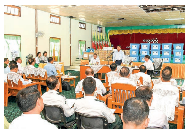
The Deputy Prime Minister provides relief items for disaster victims in Pauktaw Township.