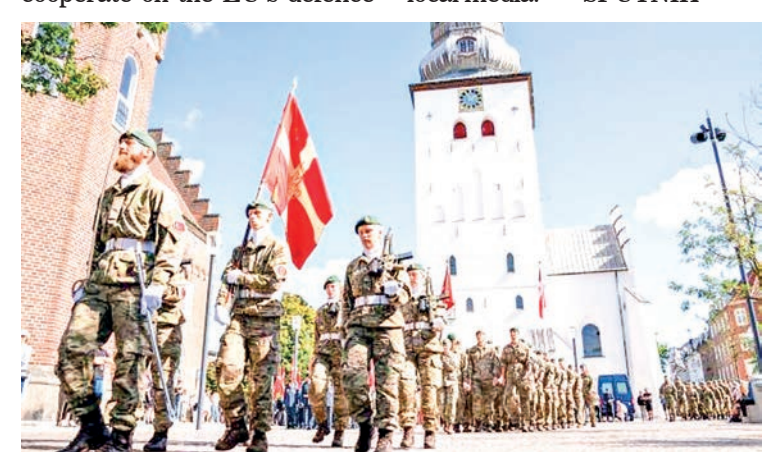
Soldiers carry the Danish flag (Dannebrog) as they parade through the city of Aalborg, Denmark, during the Flag Day for Denmark's emissaries, on 5 September 2021.

dimension. So it's a really good day for Denmark," Poulsen told local media.- — SPUTNIK