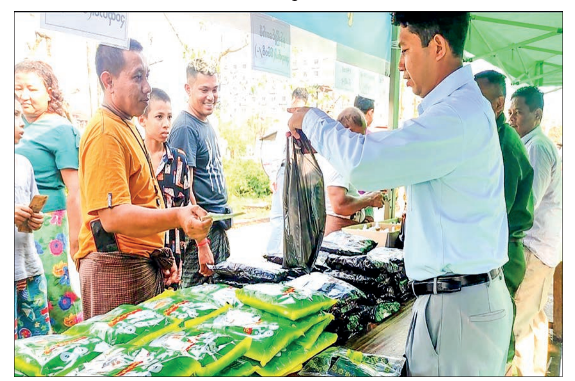
The photo shows foodstuffs being sold to Sittway \, residents \, at \, reasonable \, prices \, yesterday.

MEMBERS of the local battalians under the Western Command and officials are selling foodstuffs at low prices for the convenience of residents and departmental staff affected by Cyclone Mocha in Sittway, and to be able to buy the food they want at a fair price.