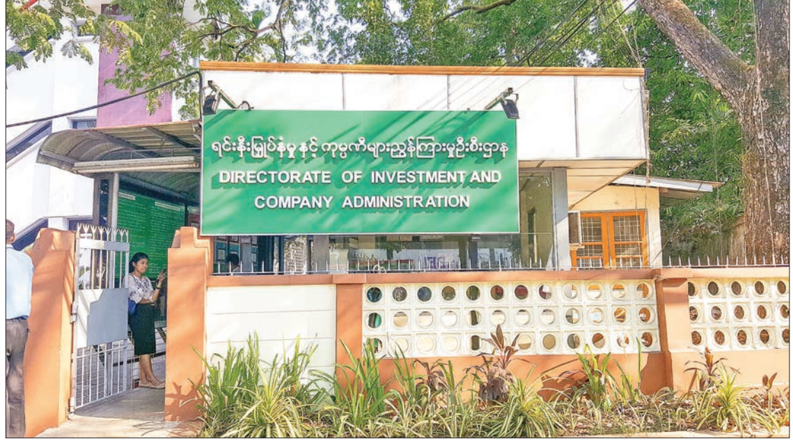
The office of the Directorate of Investment and Company Administration-DICA in Yangon.

Myanmar attracted foreign direct investments of $1.64 billion from 87 enterprises last financial year 2022-2023 (April-March). The majority of the investments were brought into the manufacturing sector, drawing $271.8 million from 64 enterprises. The agriculture sector drew $3.5 million from two projects. The power sector received $820.27 million from 11 projects, while one enterprise put $29 million in the real estate sector and five other foreign enterprises made an investment of $504 million in the service