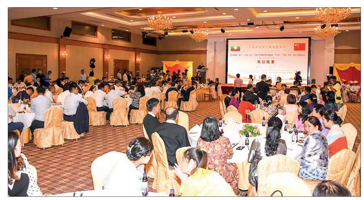
The dinner for the Myanmar-China (Lancang) Economic Expo that will be held from 25 to 28 May in Myanmar, in progress yesterday in Nay Pyi Taw.

During the dinner, Myanmar and Chinese artistes performed dances, and the Union Minister and the mayor of Lancang City honoured the artistes. About 300 businessmen from Myanmar and China were present at the dinner, and businesspersons of the two countries discussed business cooperation. — MNA/KZW