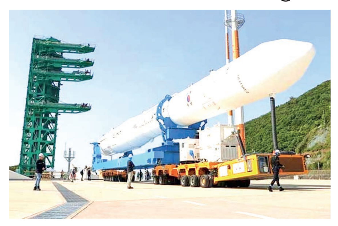
Nuri was transferred and erected at the launch pad on Tuesday.

SOUTH Korea was set to launch its homegrown Nuri rocket Wednesday and try to put a working satellite into orbit—potentially a key development for the country's burgeoning space programme.