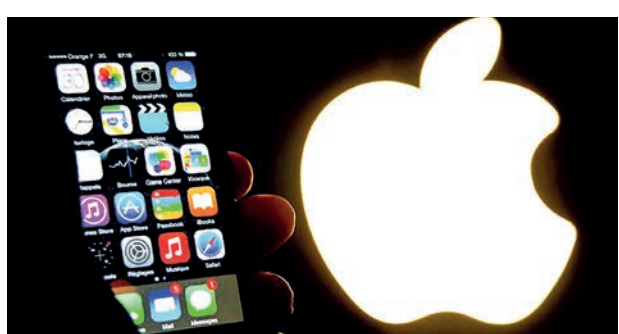
The EU alleged that Apple parked untaxed revenue earned in Europe, Africa, the Middle East and India in Ireland, which is a European hub for US-based big tech.

APPLE and Brussels butted heads in a top EU court on Tuesday as the bloc battled to overturn a ruling against its whopping 13-billion euro order on the iPhone-maker to pay Ireland in back taxes. The landmark case remains one