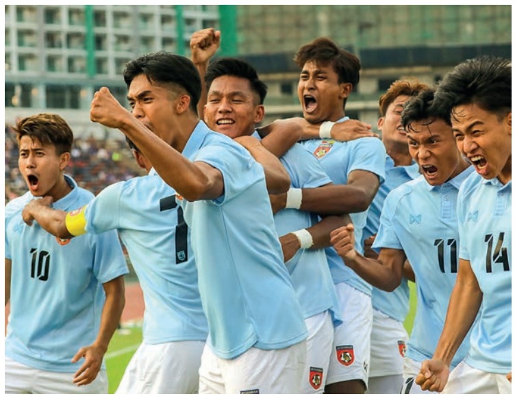
Myanmar team footballers are seen celebrating their victory in the previous XXXII SEA Games.

final stage of the 2024 AFC U-23 tournament, will compete in the qualifiers, but will not count towards qualifying.