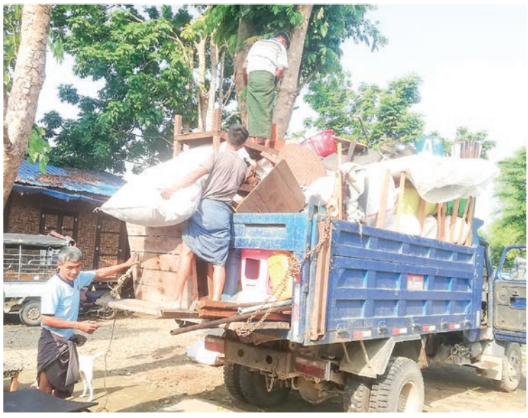
The photo shows IDP return to their homes in Myitkyina on 22 May.

In addition, the officials closed the Aungmingala IDP camp in Sinbo, Myitkyina township, because 15 IDPs of three households from that camp had moved to the Roman Catholic IDP camp in Aungmingala ward by their own arrangements.