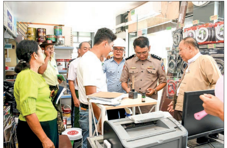
An on-site price-check is underway at the construction materials store yesterday.

Afterwards, the minister and party met merchants and entrepreneurs in Sittway to discuss the expansion of the Rakhine State Basic Foodstuff Price Supervisory Committee, speeding up the flow of goods, and setting reasonable prices for basic foodstuffs. — Tin Tun (IPRD)/CT