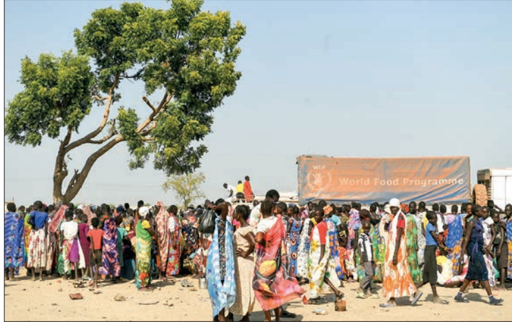
Internally displaced women wait for their food ration during a food distribution next to a World Food Programme (WFP) truck in Bentiu on 7 February 2023.

HAITI, the Sahel and Sudan now rank among the UN's highest alert areas for food insecurity, requiring "urgent" action from the international community, food agencies warned Monday.