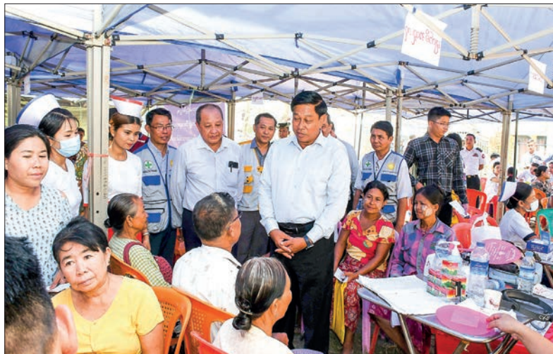
Deputy Prime Minister Admiral Tin Aung San and party look round the repair work and healthcare services in Sittway yesterday.