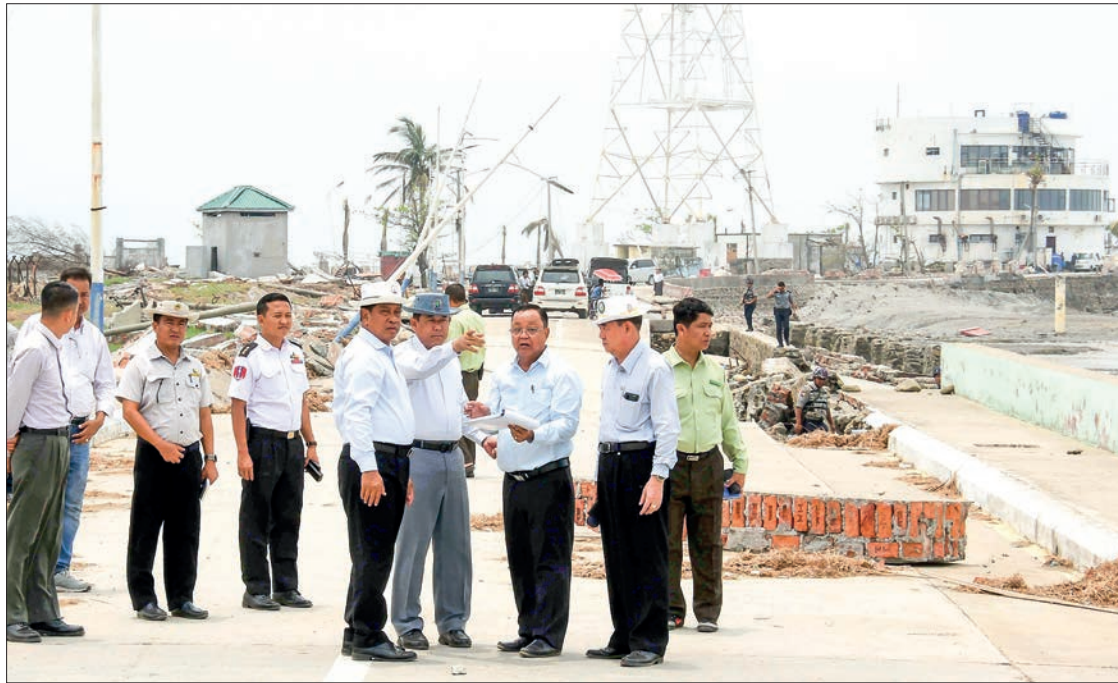
Deputy Prime Minister Admiral Tin Aung San inspects the rehabilitation efforts in Sittway yesterday.

Then, the Deputy Prime Minister and party inspected the public healthcare services and health awareness programmes at the regional health unit compound of Mingan ward