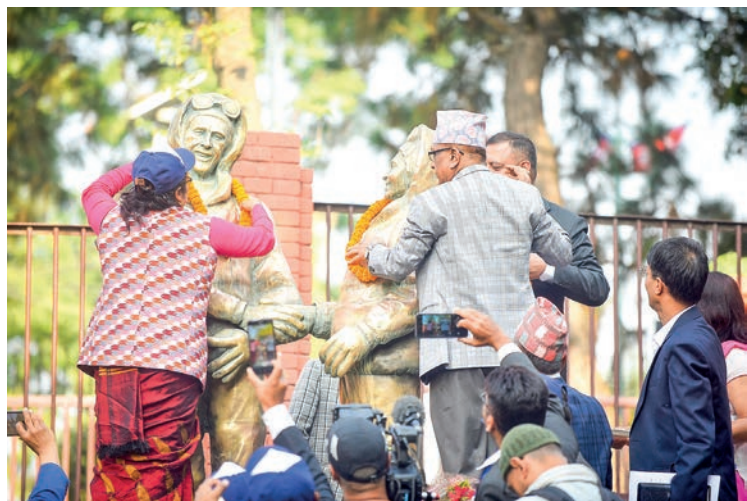
Nepali government officials place garlands on the statues of New Zealand’s Sir Edmund Hillary and Nepal’s Tenzing Norgay Sherpa to mark the 16th International Everest Day or a day to mark the 70 th anniversary of the first ascent of Mount Everest in Kathmandu on 29 May 2023. On 29 May 1953 New Zealand Edmund Hillary and Sherpa Tenzing Norgay became the first men to reach Mount Everest.