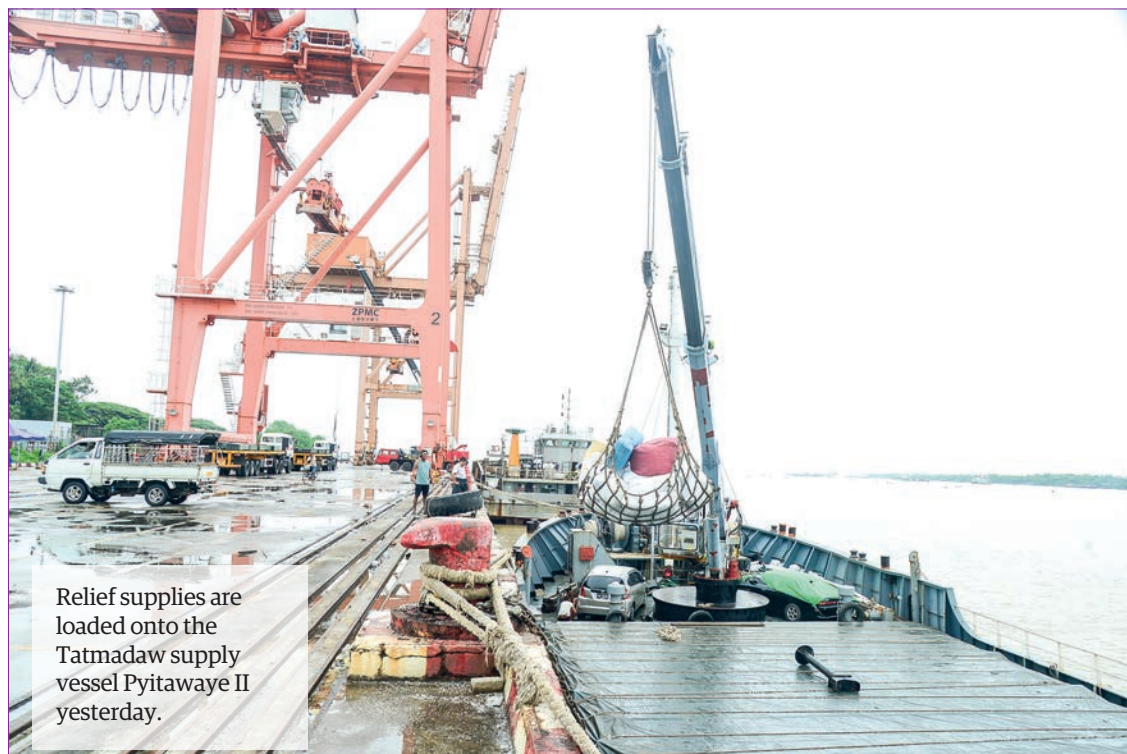
Relief supplies are loaded onto the Tatmadaw supply vessel Pyitawaye II yesterday.

livered about of 35 tonnes of consumer goods and clothes from Sittway Port to MraukU Port yesterday afternoon. — MNA/KZW