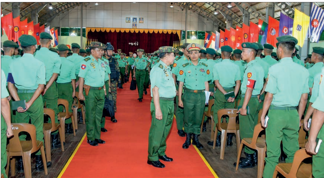
The Senior General cordially greets instructors and trainees at the meeting yesterday.

T RAINEES have the capacity to apply their skills in relevant professions at full capacity for building the capable Tatmadaw, Chairman of the State Administration Council Commander-in-Chief of Defence Services Senior General Min Aung Hlaing was quoted as saying at the meeting with officer instructors and trainees at the Military Computer and Technological Institute in Hopong Station yesterday morning.