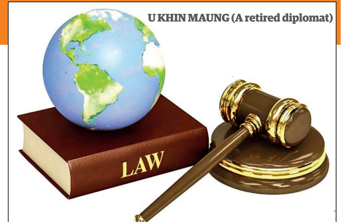
U KHIN MAUNG (A retired diplomat)

Ex parte means "from one side only". E.g. The arbitration was conducted ex parte because