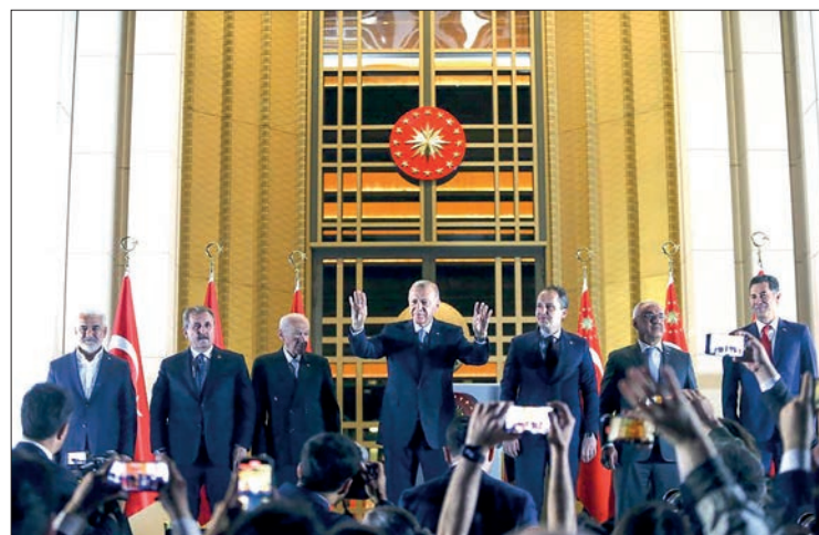
Turkish President Recep Tayyip Erdogan (C) waves to people in Ankara, Türkiye on 29 May 2023.

"We are planning an economy focused on financial man-