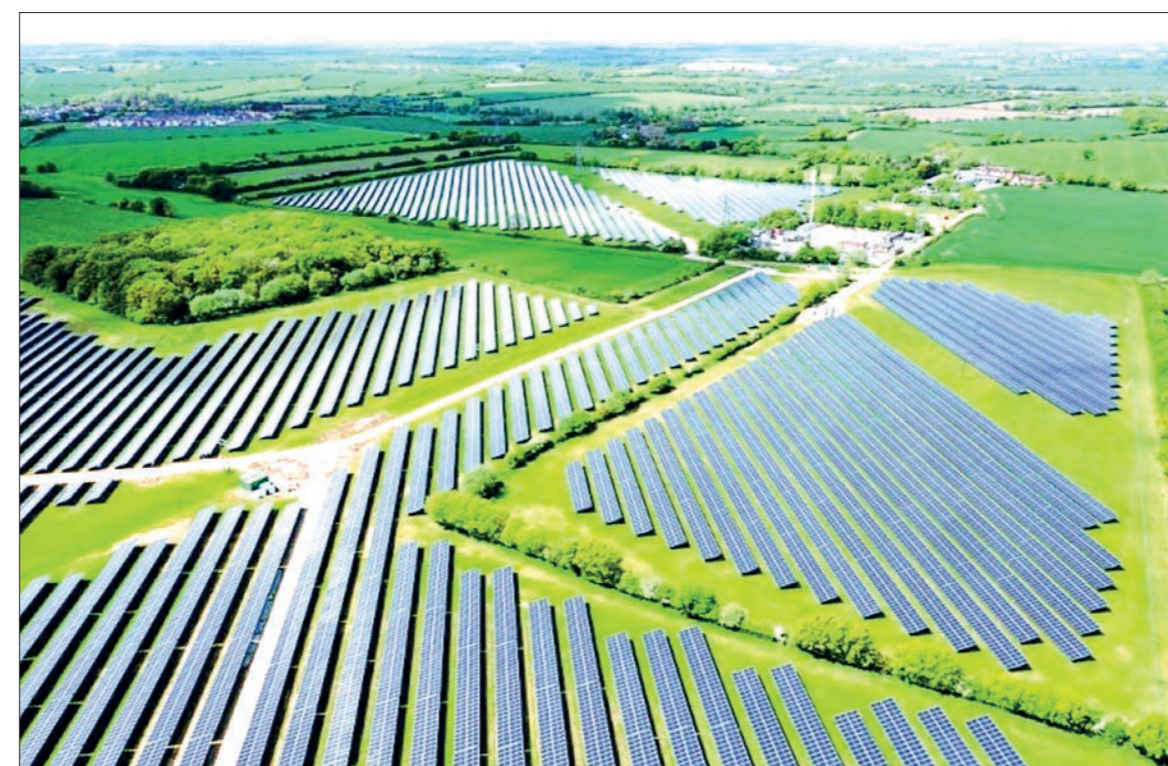
King Coal, make way for the Sun King. Investment in solar power is expected to overtake that for oil production for the first time ever this year.