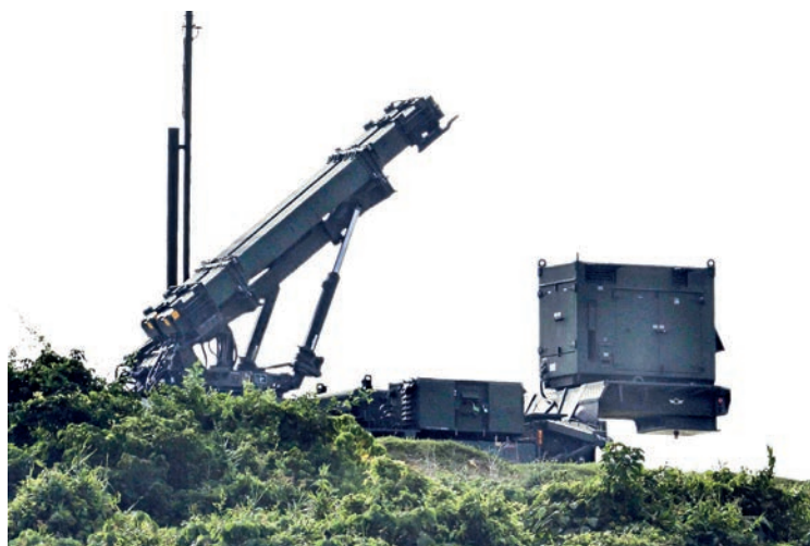
File photo taken on 5 May 2023 shows a Patriot Advanced Capability-3 surface-to-air missile interceptor deployed at an Air Self-Defence Force sub base on Miyako Island, Okinawa Prefecture.

Chief Cabinet Secretary Hirokazu Matsuno said North Korea’s decision to fire a missile poses a threat to peace and stability in the international community, describing the move as a “serious provocation”. — Kyodo