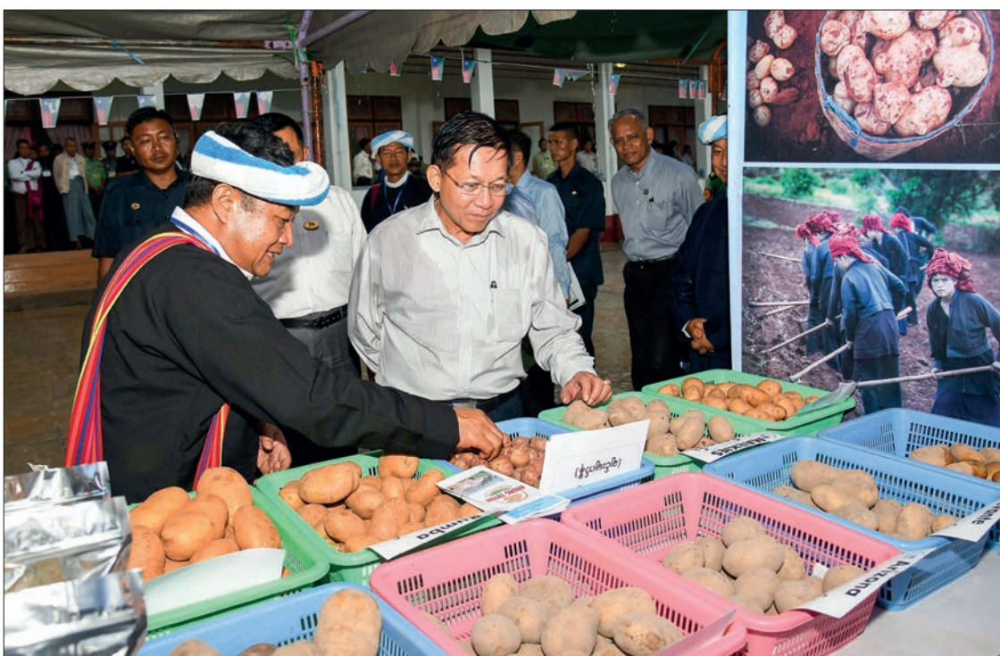
The Senior General looks into the local products displayed at the event yesterday.

On 28 May evening, the Senior General visited Culamuni Lawka Chantha Pagoda and Shwephonepint Pagoda in Taunggyi.