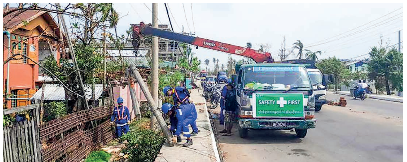
MoEP staff are seen in the repair and recovery efforts in the disaster-hit areas yesterday.

GLOBAL NEW LIGHT OF MYANMAR www.gnlm.com.mm www.globalnewlightofmyanmar.com