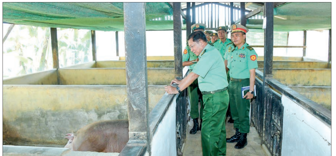
The Senior General views round the agriculture and livestock farms of the training school.

Yesterday morning, the Senior General comforted officers, other ranks, families and members of the Myanmar Police Force receiving medical treatments at the local military hospital in Taunggyi and presented foodstuffs. — MNA/TTA