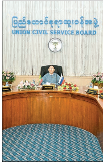
the permanent secretary, the director-general, rectors of the

The videoconference meeting was attended by members of the Union Civil Service Board,