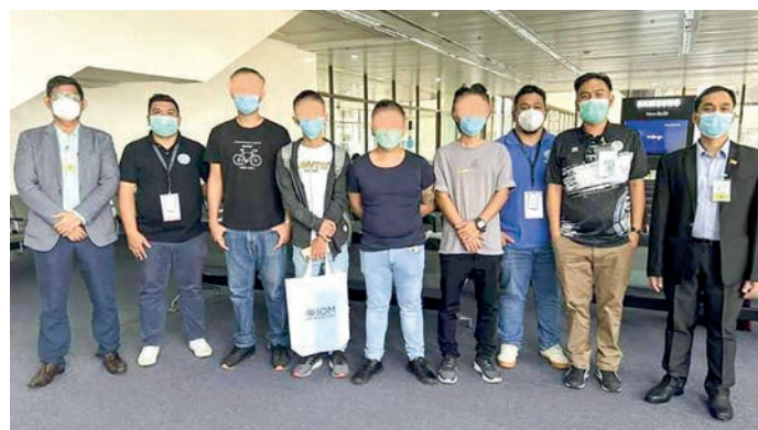
The photo shows the safe arrival back of 21 Myanmar nationals who were forced to work for an online game company in the Philippines last February 2023.

A total of 42 Myanmar nationals who were forced to work in an online gaming company near Mabalacat City in Pampanga Province, the Philippines, were rescued,