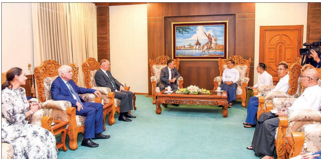
The Russian State Duma delegation calls on Union Minister U Ko Ko Hlaing yesterday.

U Ko Ko Hlaing, Union Minister for International Cooperation of the Republic of the Union of Myanmar met the Russian State Duma delegation led by Mr Sholban Kara-Ool, Deputy Chairman of the State Duma,