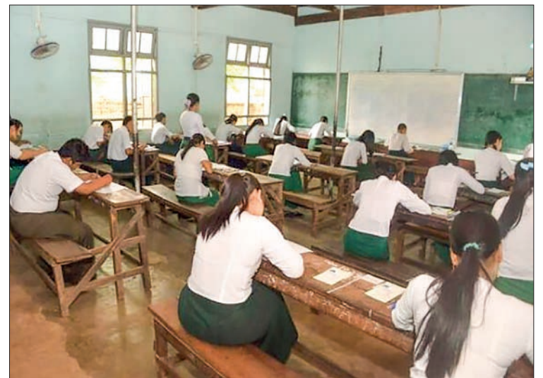
Students took the matriculation exam in 2022.

More than 280,000 students sat for the matriculation exam in 2022, and over 130,000 students passed, with a national pass rate of 46.88 per cent. There were reportedly nearly 180,000 applicants across the country for the old curriculum matriculation examination held in 2023. — TWA/CT