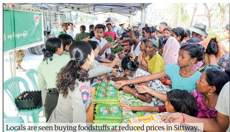
Locals are seen buying foodstuffs at reduced prices in Sittway.