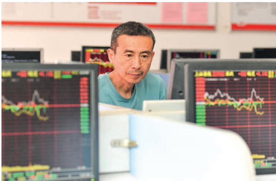
An investor looks at screens showing stock market movements at a securities company in Fuyang in China's eastern Anhui province on 29 May 2023.

“A default can most probably be avoided at this stage. Such default avoidance is still not a complete certainty; however it is now much less of a risk,” Bennett added.