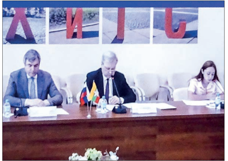
Civil Service Academy (Upper Myanmar) and the Civil Service Academy (Lower Myanmar), and officials.