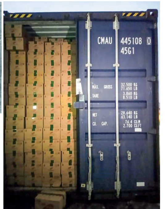
Confiscated illegal goods at MITT port terminal.

Therefore, eight arrests (estimated value of K743,705,200) were made on 24 and 26 May, according to the Illegal Trade Eradication Steering Committee. — MNA/MKKS