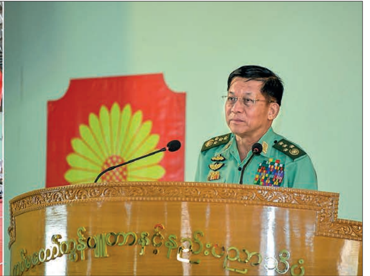
State Administration Council Chairman Commander-in-Chief of Defence Services Senior General Min Aung Hlaing meets officer instructors and trainees of the Military Computer Technological Institute in Hopong Station yesterday.