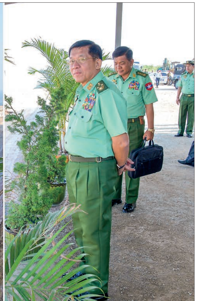
State Administration Council Chairman Prime Minister Senior General Min Aung Hlaing views the upgrade of the Pinpet-Naungka-Taunggyi-Shwenyaung-Thazi-Myingyan railway section project on 29 May 2023.

E FFORTS must be made for arranging all rail tracts to endure trains that can run at the speed of 100 kilometres per hour as the