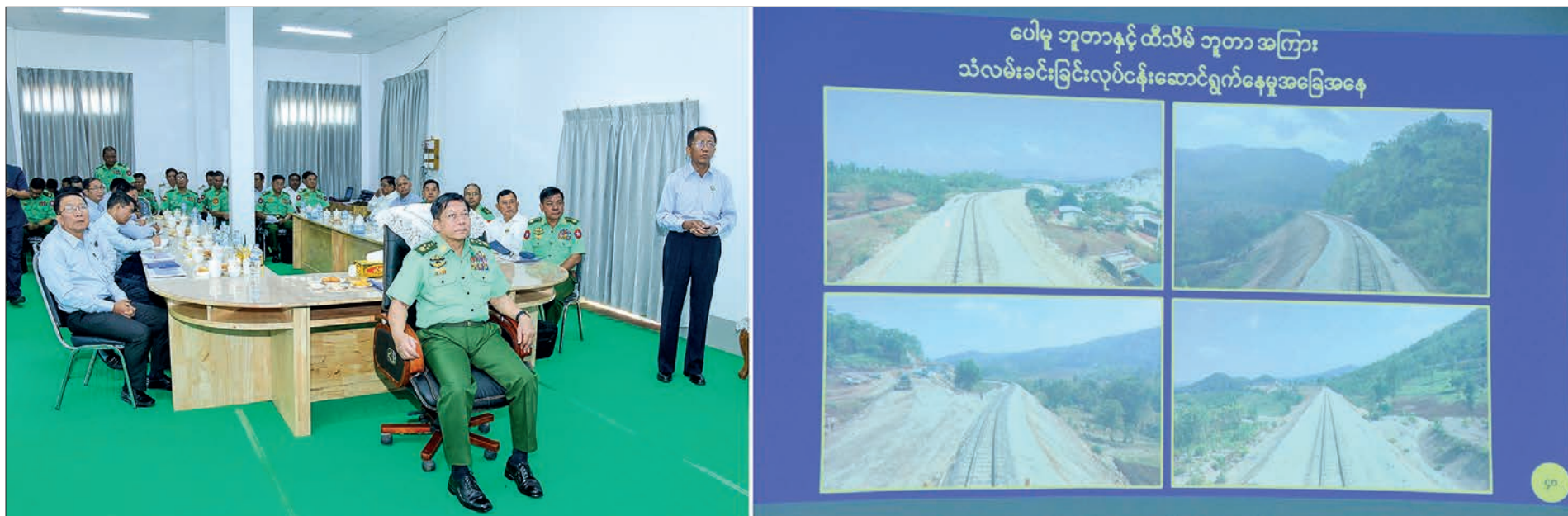
The Senior General hears the report on the Pinpet-Naungka-Taunggyi-Shwenyaung-Thazi-Myingyan railway upgrading project yesterday.

FROM PAGE-1 construction of the walls, retaining walls, conduits, drains and bridges, construction of Hthitsein station yard, placing rail tracts in Ayethaya and Pawmu station