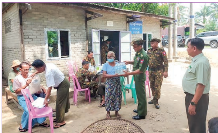
Foodstuffs are provided for disaster-hit victims.

UNDER Section 11 of the Natural Disaster Management Law, the State Administration Council declared the areas damaged by Cyclone Mocha as areas affected by natural disasters and appointed senior military officers to carry out rehabilitation work in the areas mentioned in the announcement.