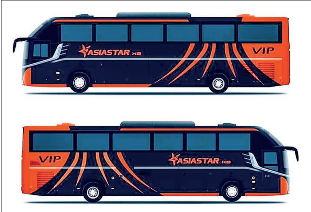
An EV express bus from Mandalay Min express bus line will run along Yangon-Nay Pyi Taw-Mandalay route.

THE Yangon Region Public Transport Committee (YRTC) is planning to replace low-model YBS buses with EV electric buses as a pilot project.