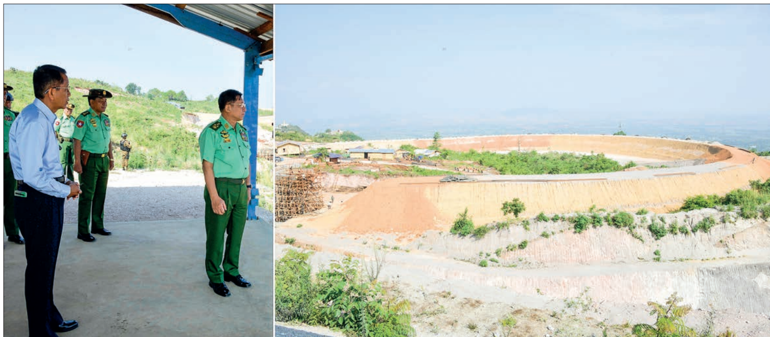
The Senior General inspects railway upgrading project site near Hthitsein station yesterday.

After inspecting the railway circular site near Hthitsein railway station, the Senior General gave necessary guidance and presented cash awards to project employees. The railway circular near Hthitsein station is in a similar shape to the eminent Bawa Thanthaya railway and viaduct in order to draw the attention of train passengers. — MNA/TTA