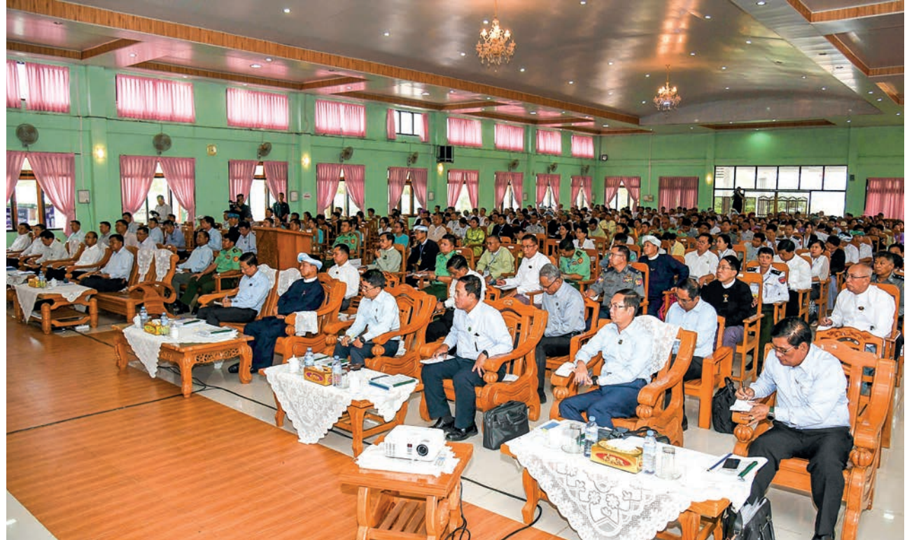
State Administration Council Chairman Prime Minister Senior General Min Aung Hlaing meets MSMEs in the Pa-O Self-Administered Zone on 29 May 2023.

ENCOURAGING MSME businesses aim to increase production, substitute import goods and export more products to foreign markets, said Chairman of the State Administration Council Prime Minister Senior General Min Aung Hlaing in his meeting with micro-, small- and medium-sized enterprises in Pa-O Self-Administered Zone yesterday afternoon. Individual reports on operating MSMEs and requirements