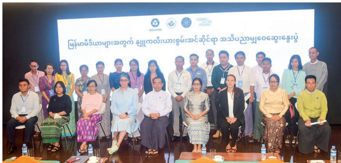
The documentary group photo of the event held yesterday in Yangon.

IN accordance with the "Memorandum of Understanding on Cooperation to achieve positive public opinion on nuclear energy" signed between the Ministry of Science and Technology and the State Atomic Energy Corporation of the Russian Federation "Rosatom" to cooperate for the purpose of peaceful use of nuclear energy, the knowledge-sharing seminar on nuclear energy for Myanmar media was held at the Nuclear Technology Information Centre in Hlaing Township, Yangon, yesterday morning.