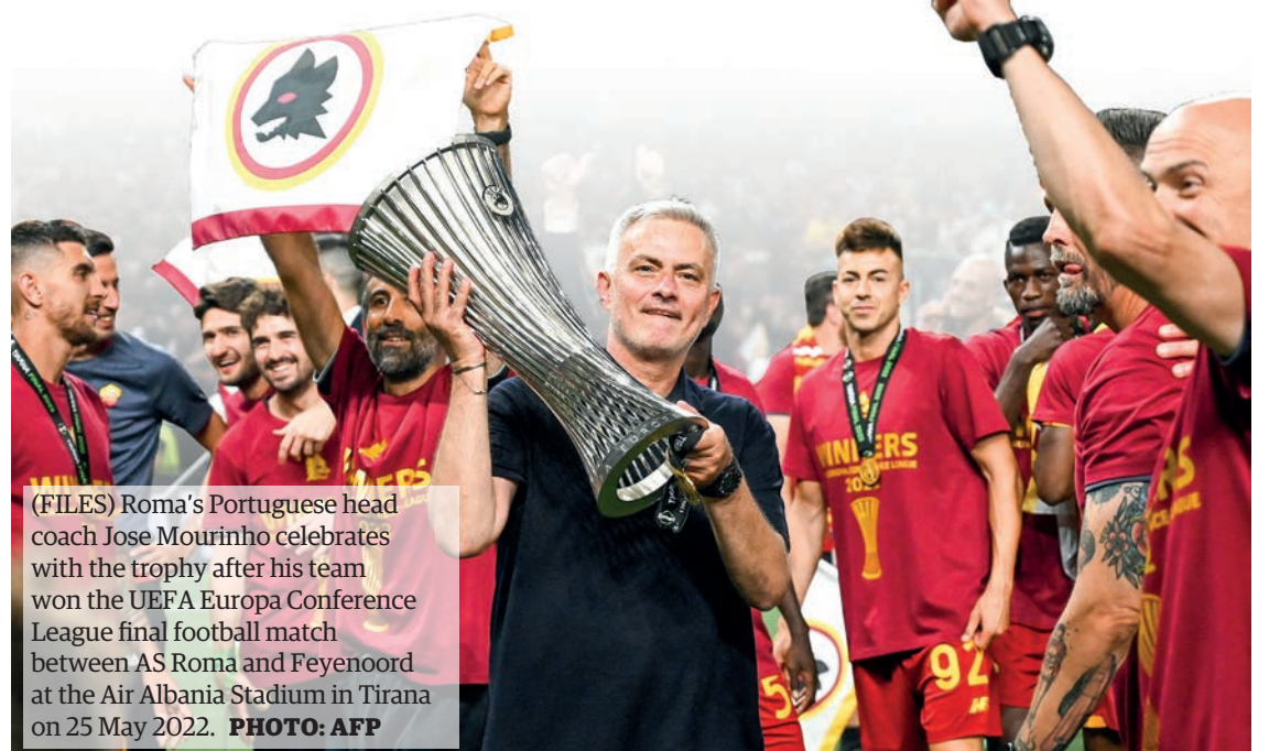
(FILES) Roma's Portuguese head coach Jose Mourinho celebrates with the trophy after his team won the UEFA Europa Conference League final football match between AS Roma and Feyenoord at the Air Albania Stadium in Tirana on 25 May 2022.

the supporters — who had waited since 2008 to see their team lift a trophy. — AFP