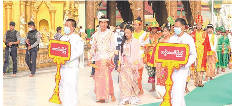
The Maha Samaya Day was convened at Shwedagon Pagoda in 2022.

THE Maha Samaya Day will be celebrated at the Shwedagon Pagoda on 2 June (Nayon full moon day), according to the Shwedagon Pagoda Board of Trustees.