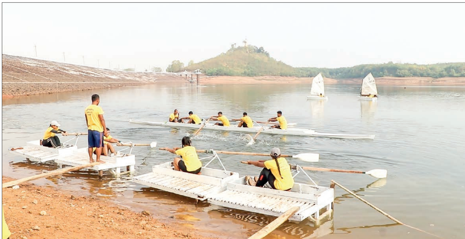
Students are seen in action at the maritime training courses (above and below right photos).

FOR new generation youth to develop knowledge, make the most of holidays, and follow their hobbies during the summer vacation, and to turn out the future generation of maritime and aviation experts for the state, basic and advanced maritime youth courses (senior level), and basic air youth courses (junior level) were opened at training camps in the respective townships at the same time by Tatmadaw (Navy) and Tatmadaw (Air) on 24 April.