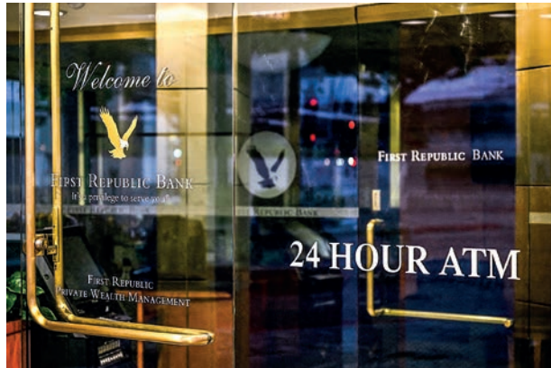
First Republic Bank signage is displayed outside of a bank branch in Beverly Hills, California on 1 May 2023.