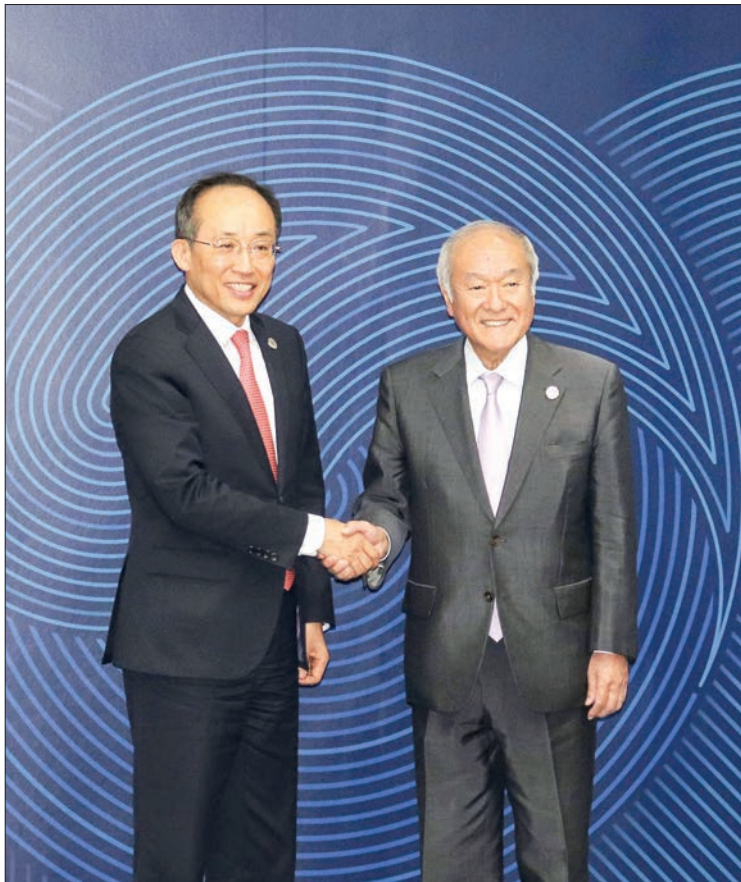
Japanese Finance Minister Shunichi Suzuki (R) and his South Korean counterpart Choo Kyung Ho shake hands as they meet for talks in Incheon, South Korea, on 2 May 2023.

JAPAN and South Korea agreed Tuesday to resume dialogue between their finance authorities, in the latest sign of improving bilateral relations frayed over