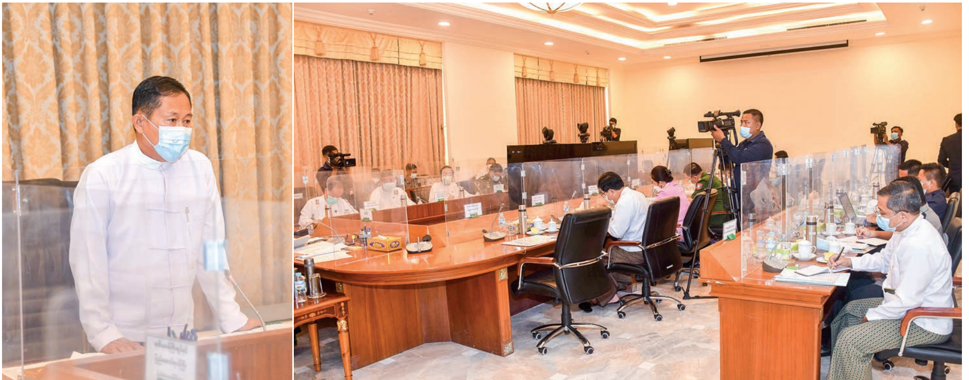
State Administration Council Vice-Chair Deputy Prime Minister Vice-Senior General Soe Win chairs the seventh coordination meeting of the COVID-19 Control and Emergency Response Committee in Nay Pyi Taw on 2 May 2023.

MEDICAL checkups must be conducted on those who entered from the border and those with positive results must be sent to the designated places for treatment, said Vice-Chairman of the State Administration Council Deputy Prime Minister Vice-Senior General Soe Win at the seventh coordination meeting of the COVID-19 Control and Emergency Response Committee at the SAC Chairman Office in Nay Pyi Taw yesterday afternoon.