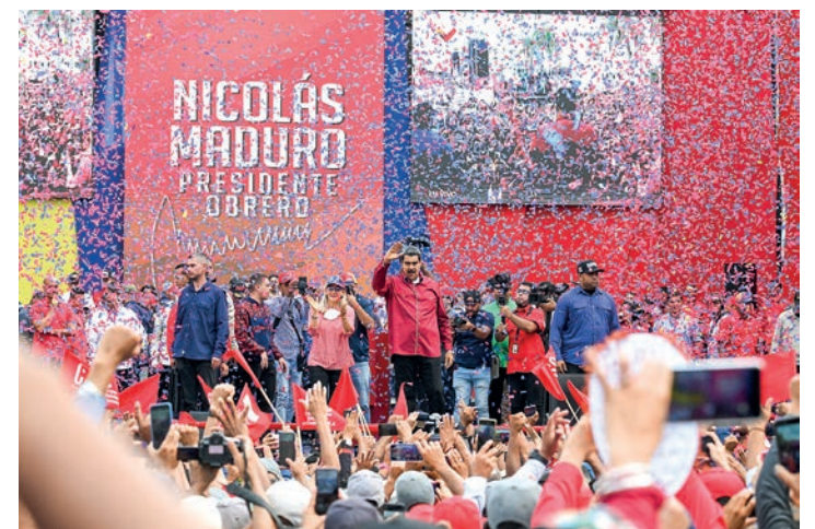
Venezuela’s President Nicolas Maduro (R) and his wife Cilia Flores wave to workers participating in a rally to commemorate May Day (Labour Day) in Caracas on 1 May 2023.

Maduro said he was outraged by the sacking of the US-based Venezuelan oil company that owns refiners, pipelines and terminals and supplies thousands of gas stations in the United States. “On behalf of all the people of Venezuela,” he said, “we indignantly reject and repudiate the theft of the Citgo company by the US government and by the Unitary Platform of Venezuela”, as the opposition alliance is called. — Xinhua