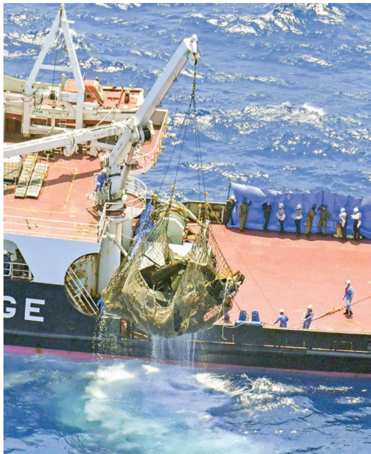
Photo taken from a Kyodo News helicopter on 2 May 2023 shows part of a Japan Self-Defence Forces helicopter that went missing in early April being brought up from the seabed by a private vessel in waters off of Miyako Island, Okinawa Prefecture.

A major part of the wreckage including the flight recorder of a Japanese Self-Defence Forces helicopter that went missing