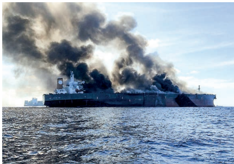
This handout photo taken on 1 May 2023 and released by the Malaysian Maritime Enforcement Agency on 2 May 2023 shows the tanker MT Pablo after the vessel caught fire off Malaysia's southern coast during its journey from China to Singapore. Malaysian rescuers were searching for three missing crew members from an oil tanker that caught fire off the country's southern coast. Thick, black smoke engulfed the Gabon-flagged ship when the fire broke out on 1 May 2023, the Malaysian Maritime Enforcement Agency (MMEA) said in a statement.

MALAYSIAN rescuers on Tuesday were searching for three missing crew members from an oil tanker that caught fire off the country's southern coast.