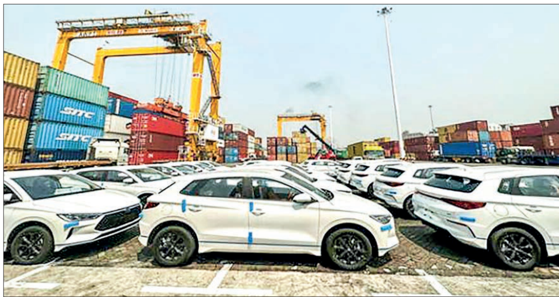
Electric vehicles (EVs) are pictured at the container yard of Yangon Port.

Types of BEVs include road tractors for semi-trailers, buses or motor vans for the transport of ten or more people including the driver, truck, motor vehicle for personal use, three-wheeled vehicles for the transport of persons, three-wheeled vehicles for the transport of goods, electric motorcycle, electric bicycle, ambulance, Prison vans and Hearses.