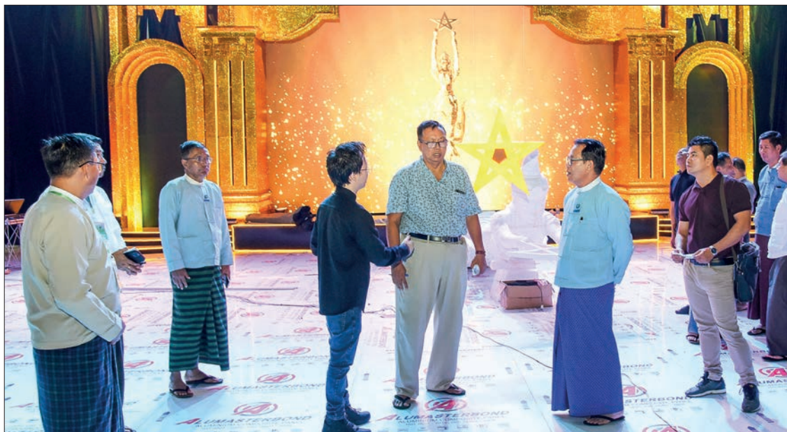
Union Minister U Maung Maung Ohn views round the preparatory work for the academy award event, yesterday.

Afterwards, the Union minister and party viewed round the preparatory work. — MNA/TS