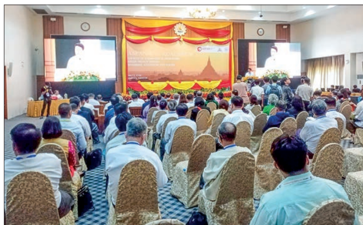
The business forum jointly conducted by the ASEAN-BAC and UMFCCI in progress yesterday.

The UMFCCI reaffirmed that it will work together with ASEAN Business Advisory Council (ASEAN-BAC) and participate in every sector in the economic order of international