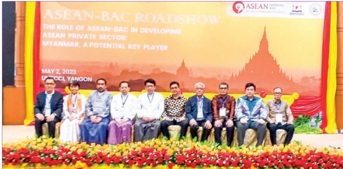
Above and below photos show the forum entitled “The Role of ASEAN-BAC in Developing ASEAN Private Sector: Myanmar, A Potential Key Player” held at UMFCCI.

“Myanmar is a key member of ASEAN. Through this roadshow, we would like to show our willingness to in-depth cooperation between Myanmar and ASEAN. I hope this linkage will enhance regional integration and contribute to regional stability and regional development,” he