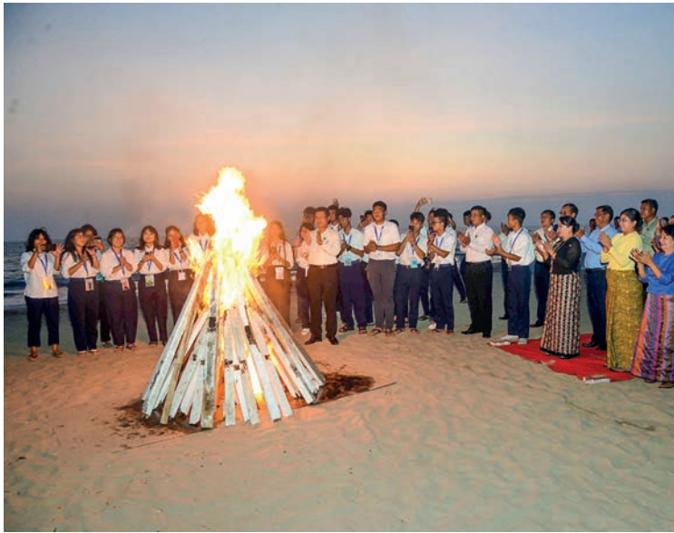
Outstanding students are seen enjoying the beach bonfire.

THE closing ceremony of the camp for Grade 11 outstanding students (Ngwe saung) of the 2022-2023 academic year was held at Yamonnar Oo Hotel at Ngwesaung Beach in Ayeyawady Region yesterday.