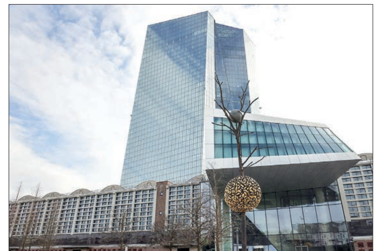
The European Central Bank (ECB) is pictured prior to a press conference on the eurozone’s monetary policy, in Frankfurt am Main, western Germany on 16 March 2023. PHOTO: AFP

The sector still faces a weakening economy and challenges from higher interest rates. — AFP