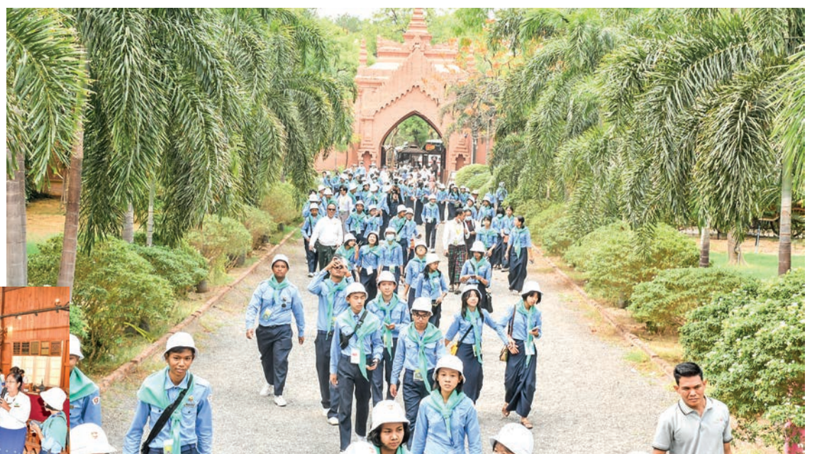
Outstanding students are pictured visiting the Bagan Archaeological Zone.