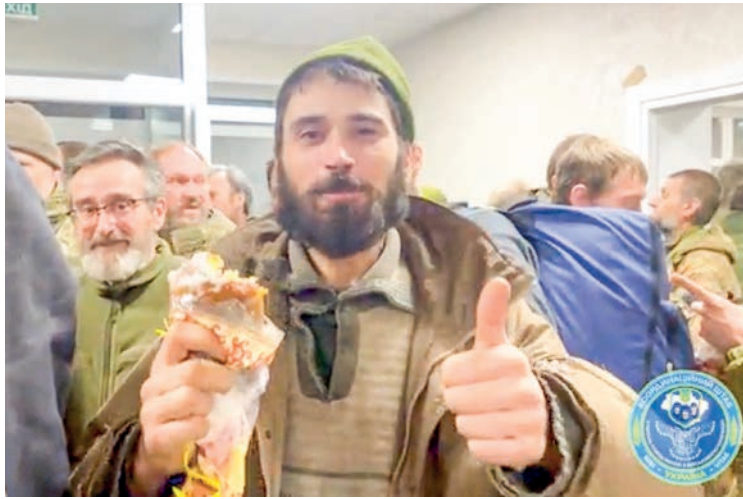
This video grab taken from footage provided by Coordination Headquarters for the Treatment of Prisoners of War on 16 April 2023, shows a freed Ukrainian prisoner eating a traditional Easter cake during his exchange in an unknown location in Ukraine.

THE projected “all-for-all” prisoner exchange between Ukraine and Russia will take place in several stages, Ukraine’s Coordinating Headquarters for the Treatment of Prisoners of War