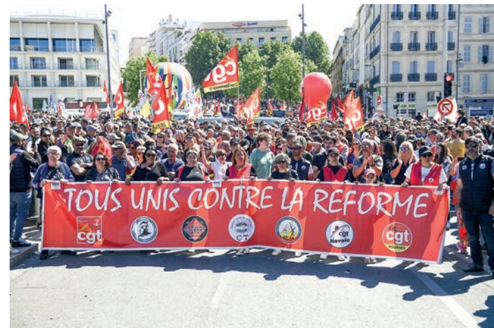
Protesters hold a banner reading "all united against the reform" with French union logos as they take part in a demonstration on May Day (Labour Day) to mark the international day of workers more than a month after the government pushed an unpopular pensions reform act through parliament, in Marseille, southern France, on 1 May 2023.

The unions said that while they would attend new discussions with cabinet ministers on issues ranging from boosting employment among older people to reforming vocational schools, they would "reiterate their refusal of the pensions reform". "There is deep defiance and dialogue can only resume if the government shows it is finally willing to take the unions' positions into account," they added. — AFP