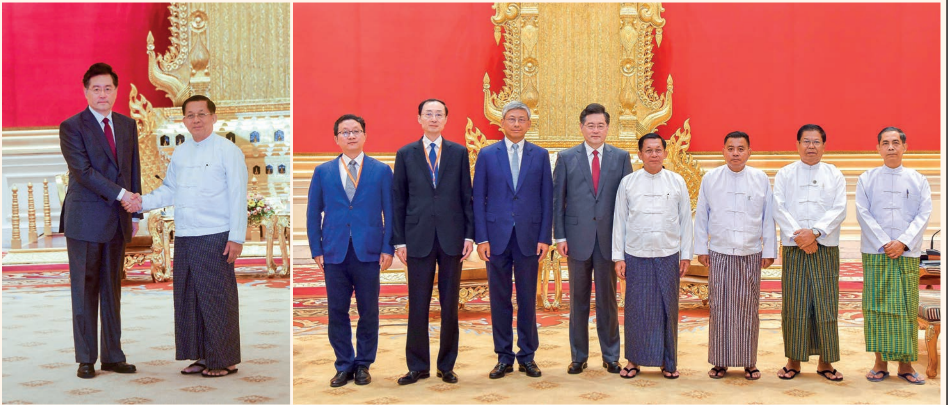
Left and Right: The Senior General greets the State Councillor and Minister of Foreign Affairs and poses for the documentary group photo at the event yesterday.