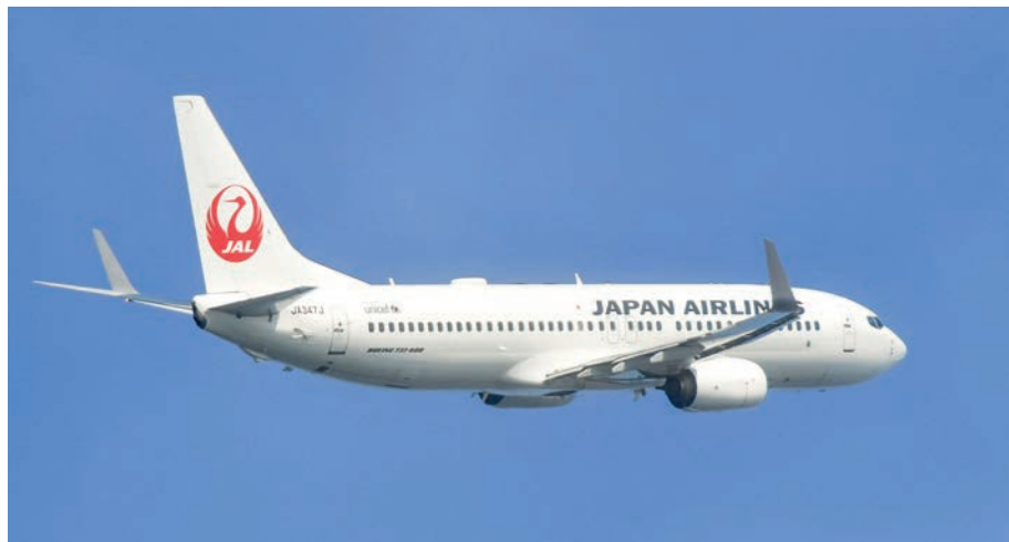
File photo taken on 4 February 2023 shows a Japan Airlines Boeing 737-800 plane.