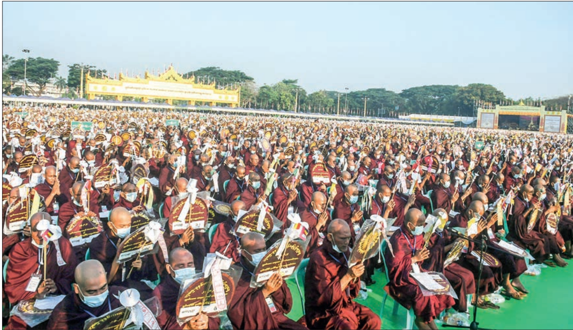
The consecration ceremony and rice alms offering event in progress yesterday (above and below photos).

THE Yangon Region government organized the consecration ceremony and rice alms donation ceremony for 11,111 members of the Sangha at the