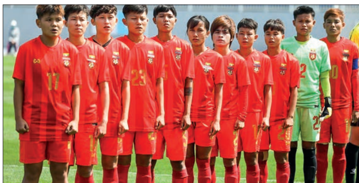
File photo shows Myanmar women's team players singing the national anthem before the international friendly match against Laos in Okinawa, Japan on 20 March.

two points for my team. To regain the self-confidence of the team members and make good use of our team's strengths is a must. We will try to compete with the best," he commented. — KZL