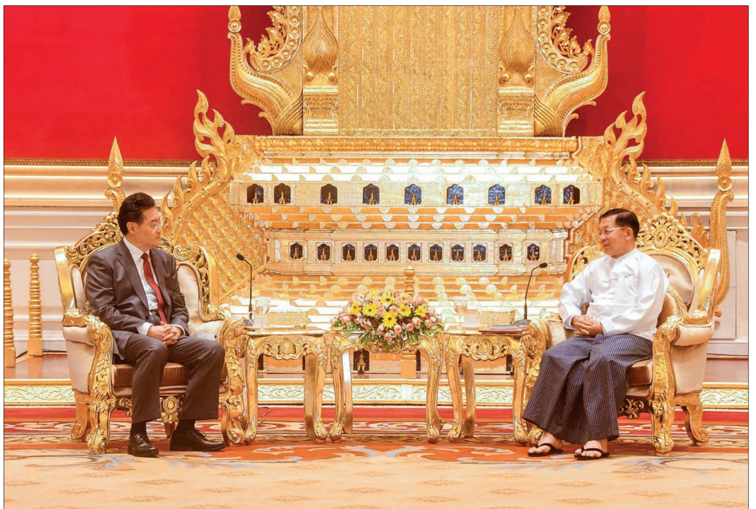
State Administration Council Chairman Prime Minister Senior General Min Aung Hlaing receives Mr Qin Gang, State Councillor and Minister of Foreign Affairs of the People's Republic of China in Nay Pyi Taw on 2 May 2023.

They frankly exchanged views on diplomatic relations and friendly ties between the two countries, further promotion of cooperation, political situations of Myanmar and endeavours for ensuring peace and stability as well as the development of the country, peace, stability and development of border region, undertakings for promotion of the border trade, cooperation in