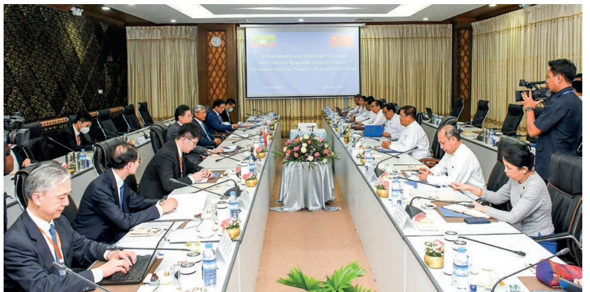
Union Minister U Than Swe holds talks with the Chinese delegation headed by State Councillor and Minister of Foreign Affairs Mr Qin Gang yesterday.

the recent developments in Myanmar and both sides cordially exchanged views on matters pertaining to the further consolidation of the existing Pauk-Phaw relations, acceleration of bilateral projects and implementation of projects under the China-Myanmar Economic Corridor (CMEC) and the Belt and Road Initiative (BRI), the maintenance of peace and stability along the border between Myanmar and China and closer collaboration between the two countries in regional and international arenas especially in the frameworks of ASEAN, SCO and the United Nations as well as on regional and international matters of mutual interests.