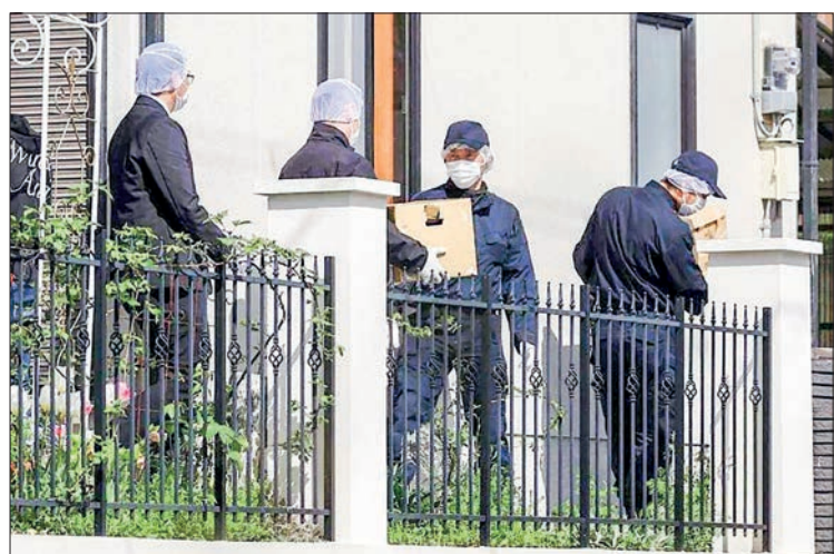
Police officers at the home of Ryuji Kimura, the man who on Saturday threw an explosive device at Japanese Prime Minister Fumio Kishida. National broadcaster NHK said suspected gunpowder, and pipe-like objects and tools were found at the home.

team, in an initial statement the experts hailed “various promising initiatives, including at the state level, that authorities have developed to combat racial discrimination.” — AFP