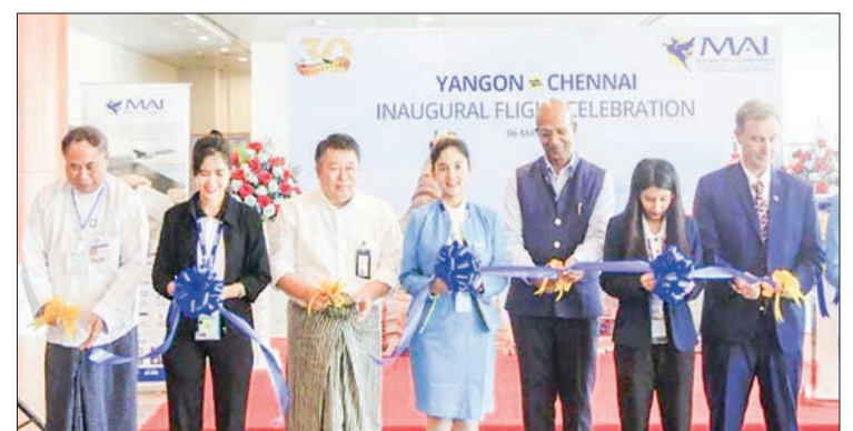
The inaugural flight celebration of Yangon-Chennai-Yangon in progress yesterday.

The Yangon-Chennai-Yangon flight will only operate once a week, exclusively on Saturdays. The flight is scheduled to depart from Yangon International Airport at 8 am and arrive at Chennai at 10:15 am local time. Departing from Chennai at approximately 11:15 am local time, it will reach Yangon International Airport at 3:15 pm. The ticket fare for the trip is US$239. — TWA/KZW