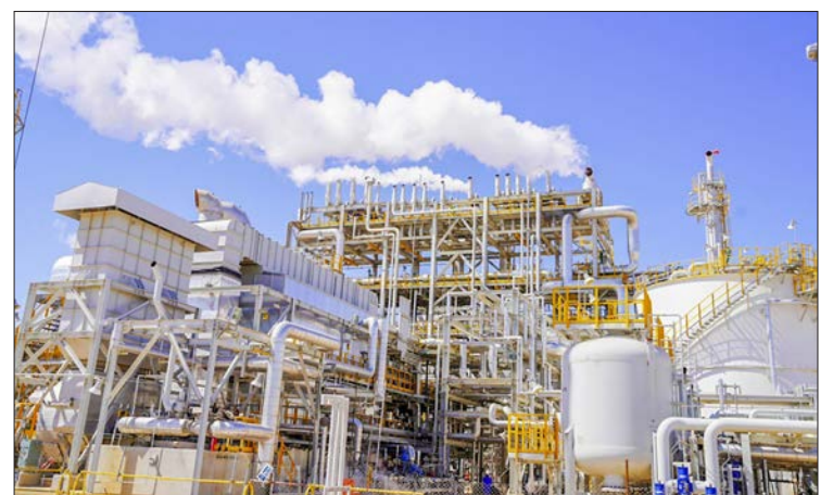
This handout photo released by the Iraqi prime minister's office on 1 April 2023 shows a view of installations at the Karbala oil refinery in the eponymous governorate, on the date it launched operations.

"If they invest in oil and gas companies that are not aligned with this target, they risk their reputation among climate-conscious asset owners while other investors may increasingly be concerned over exposure to energy transition risk." —AFP