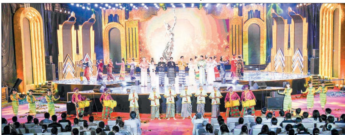
The Film Academy Award Presentation Ceremony for 2019, 2020 and 2022 in progress yesterday.