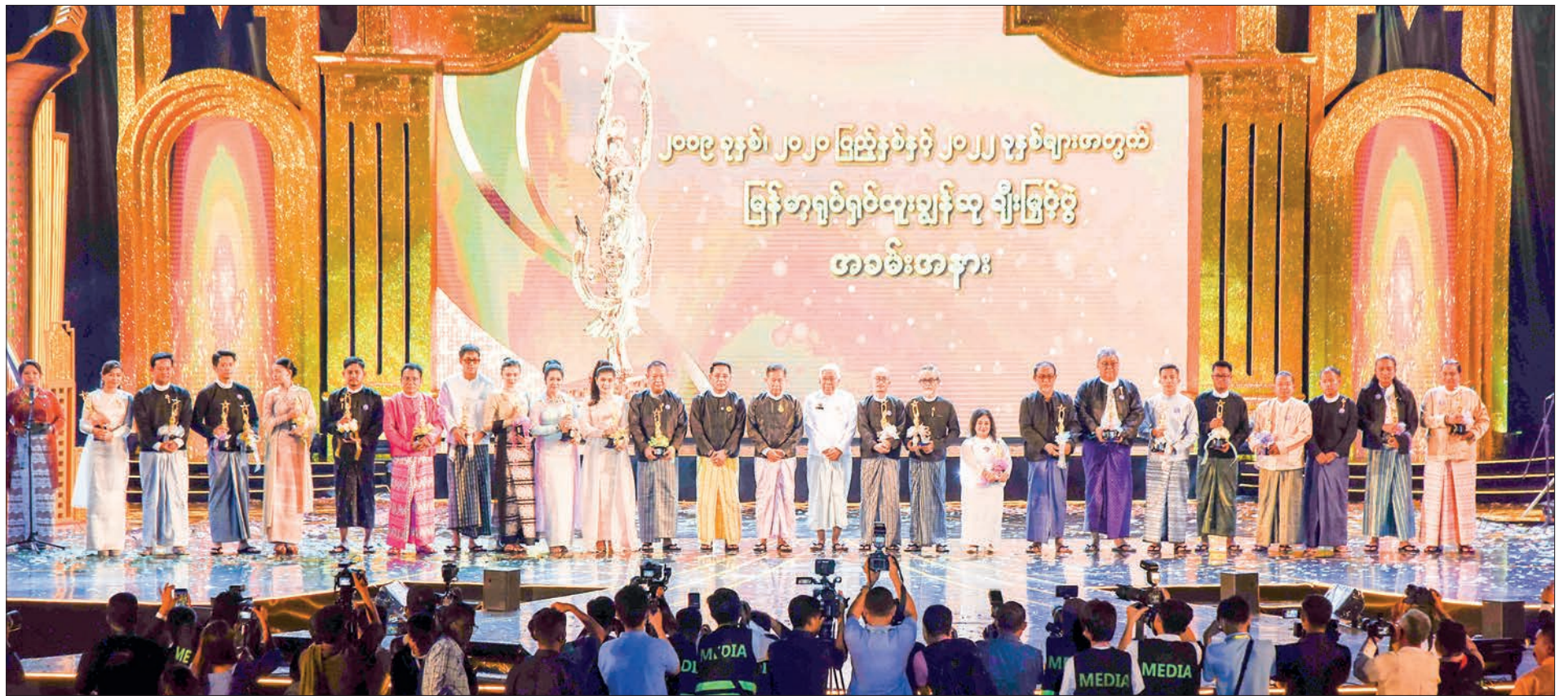
State Administration Council Vice-Chair Deputy Prime Minister Vice-Senior General Soe Win poses for the documentary group photo with dignitaries and Academy awardees at the event in Nay Pyi Taw on 6 May 2023.