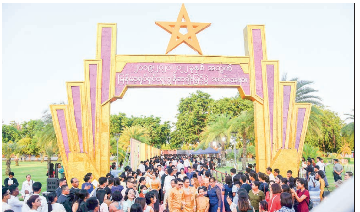
Film artistes are seen at the venue of the Film Academy Award Presentation Event (2019, 2020 and 2022).

THE GLOBAL NEW LIGHT OF MYANMAR www.gnlm.com.mm www.globalnewlightofmyanmar.com