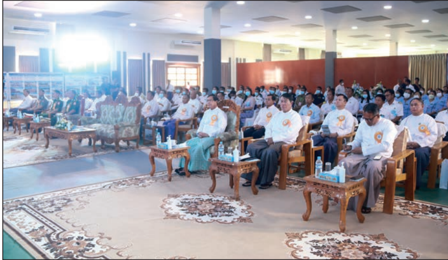
Deputy Prime Minister Admiral Tin Aung San speaks on the inauguration occasion of the new SetSan Staff Housing and Thiri Anawa Hall of Myanmar Port Authority in Yangon yesterday.

STATE Administration Council Member Deputy Prime Minister Union Minister for Transport and Communications Admiral Tin Aung San attended the opening ceremony of the new SetSan Staff Housing of Myanmar Port Authority and Thiri Anawa Hall in Kuutoseik Ward of Mingala Taungnyunt Township of Yangon Region yesterday.