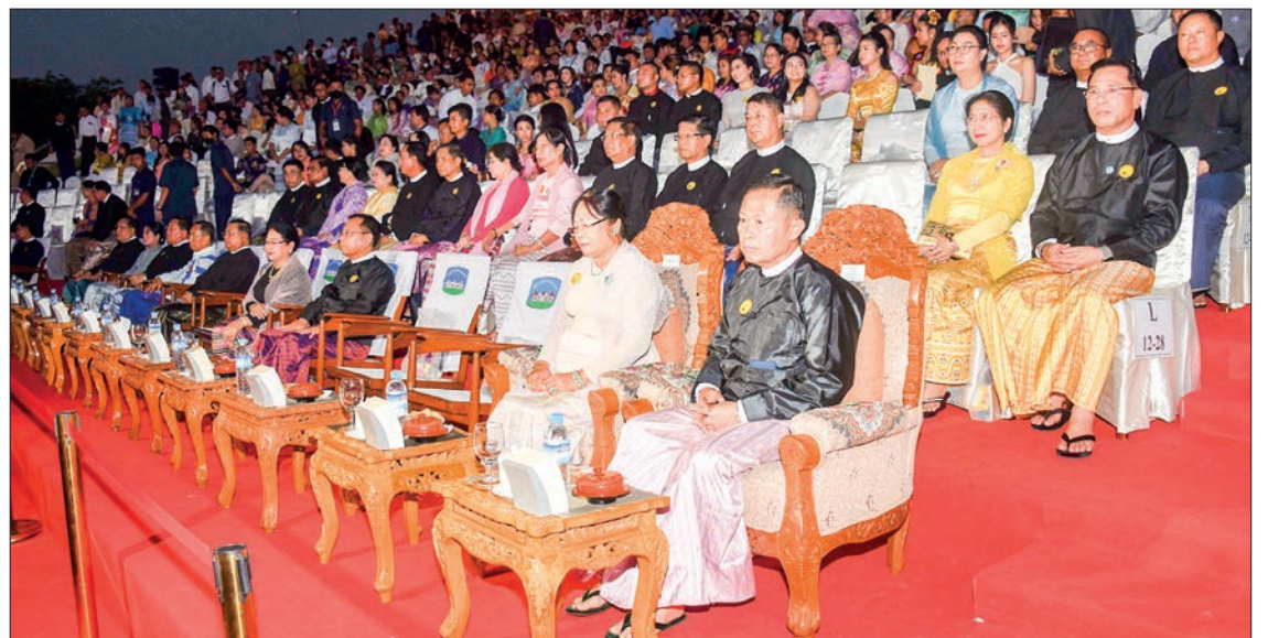
State Administration Council Vice-Chairman Deputy Prime Minister Vice-Senior General Soe Win, his wife and dignitaries attend the Film Academy Award Presentation Event in Nay Pyi Taw yesterday.