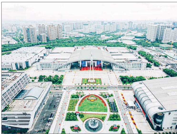
Aerial photo taken on 8 June 2021 shows the main venue of the 2nd China-Central and Eastern European Countries (CEEC) Expo in Ningbo, east China's Zhejiang Province.