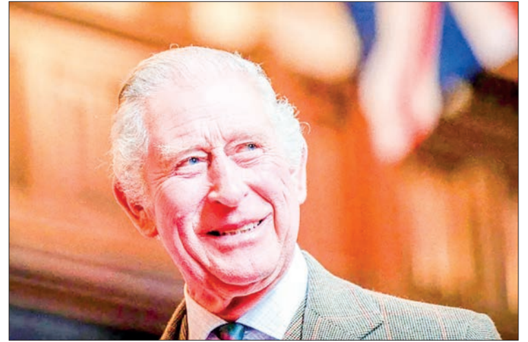
The United Kingdom’s King Charles 3 rd .

But there will also be a clear departure with the involvement of women bishops, minority faith leaders, and a more diverse and representative guest list of British society than the lords and ladies of old. So too is the environmental theme at the ceremony,