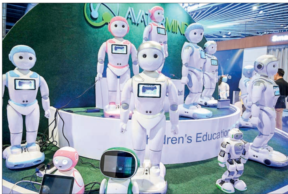
AI has potential to improve people's lives and tackle some of society's biggest challenges.

US Vice-President Kamala Harris told CEOs of leading tech companies at a meeting Thursday that they have a "moral" responsibility to protect society from the potential dangers of artificial intelligence.