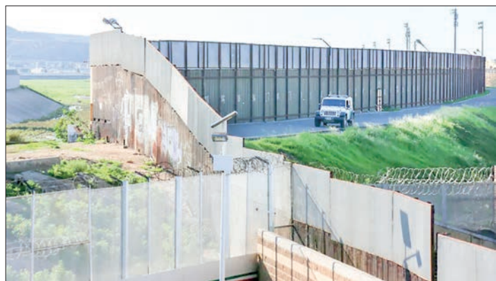
A Border Patrol vehicle sits along the US-Mexico border wall on 25 January 2017 in San Ysidro, California. PHOTO: AFP/FILE

The rule was imposed early in the Covid pandemic, ostensibly to prevent infected people entering the country, and allows border guards immediately to turn people away without even accepting their asylum applications. — Xinhua