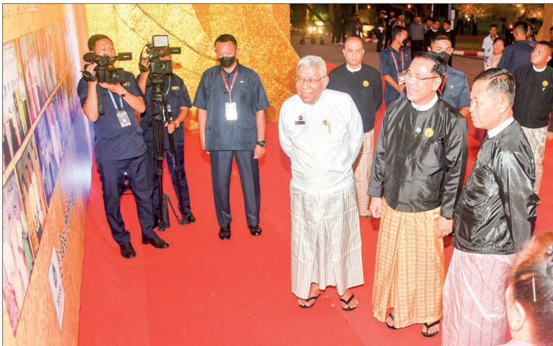
The Vice-Senior General views the documentary photos at the event yesterday.

Next, the State Administration Council Vice-Chairman Deputy Prime Minister Vice-Senior General and party pose for the documentary group photos together with the Myanmar Film Academy Award