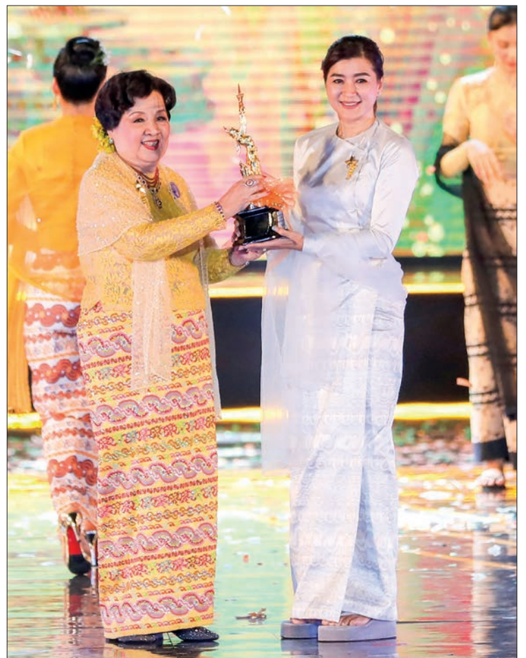
The best actress award is presented yesterday.