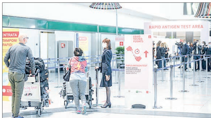
Italy was the first country outside China to suffer a major outbreak of Covid-19. Passengers undergo a rapid antigen swab test for COVID-19 at Malpensa Airport in Milan.

groups." Prime minister from June 2018 to February 2021, Conte was the head of government when the Covid-19 outbreak suddenly struck northern Italy in February 2020. — AFP