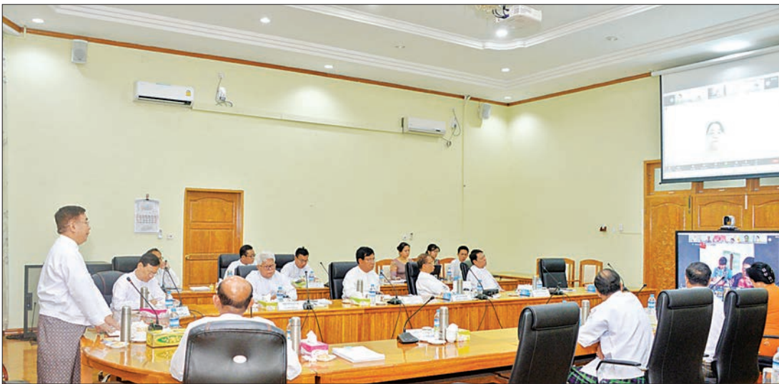
Union Education Minister Dr Nyunt Pe speaks on the inauguration occasion of the new curriculum central-level course on 4 May.

DURING the inauguration ceremony of the new curriculum central level course on 4 May, the MoE Union minister announced that in the upcoming academic year of 2023-2024, Grade-9 and Grade-12 classes would be instructed with new curricula.