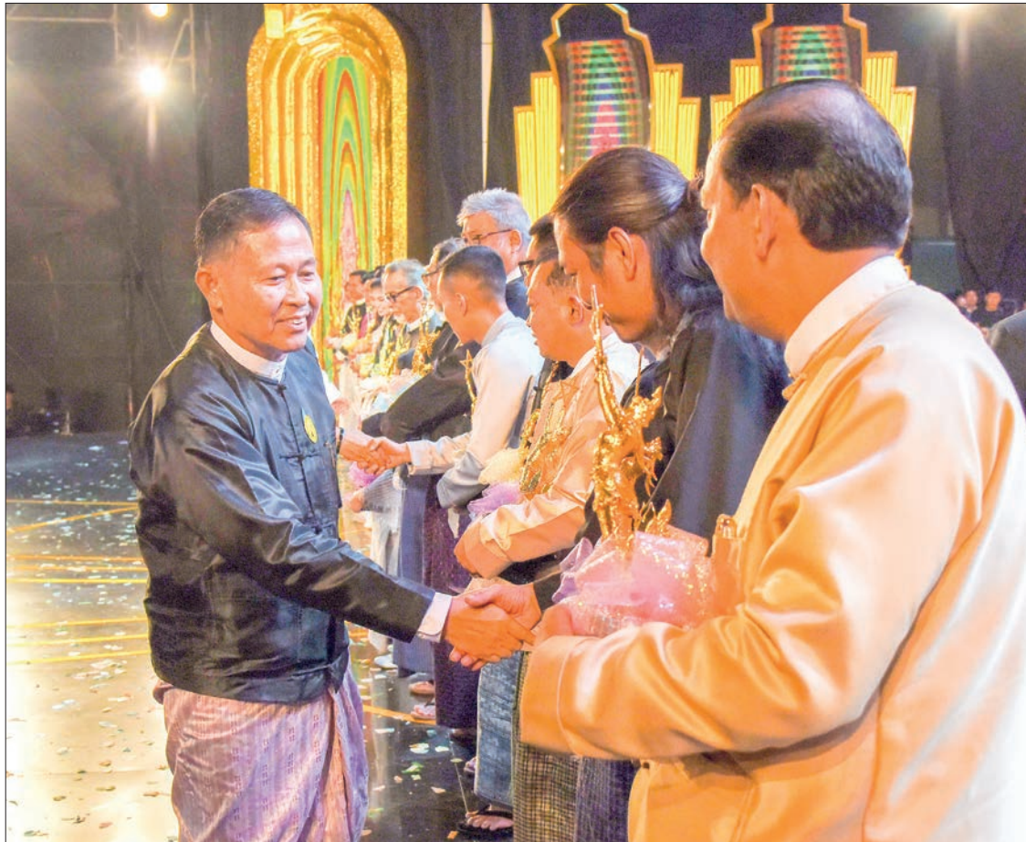
The Vice-Senior General cordially greets the Film Academy Award winners.

He went on to say that the successful holding of the academy award presentation ceremony is demonstrating that the people of the film industry are united. "As the covid pandemic is over now, it is the time to revitalize the film industry. Not only the film industry but also the music and the theatre industry are also required to be active again. And I am optimistic that the people from these industries will perform their roles in unity in the interest of the nation. It is found that a total of over 4,000 movies have been made as of 2022, and the academy awards have been