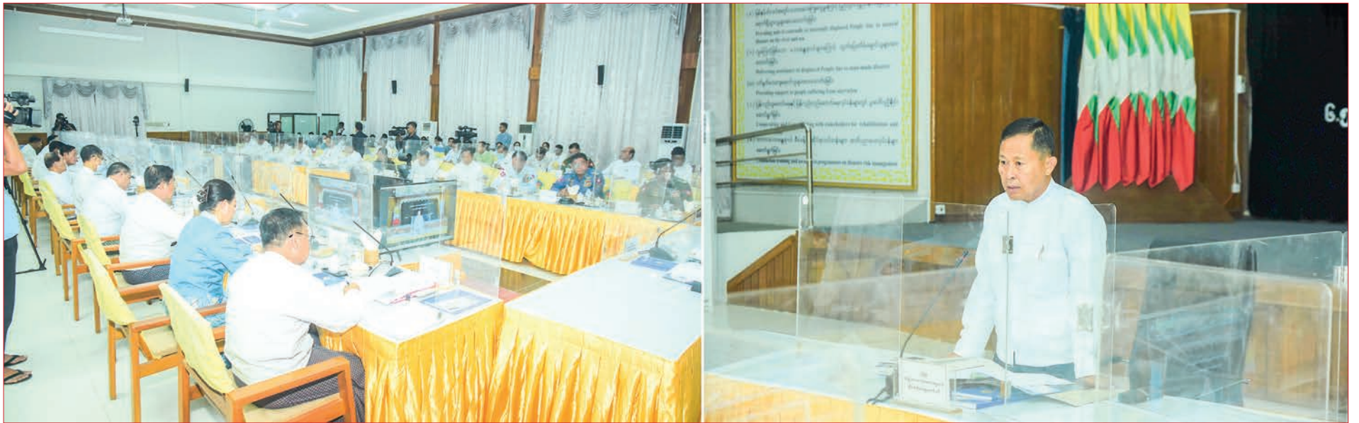
Vice-Chairman of the State Administration Council Deputy Prime Minister Vice-Senior General Soe Win addresses the National Disaster Management Committee's emergency meeting in Nay Pyi Taw on 6 May 2023.

VICE-CHAIRMAN of the State Administration Council Deputy Prime Minister Vice-Senior General Soe Win who is also Chairman of the National Disaster Management Committee-NDMC addressed the National Disaster Management Committee's emergency meeting yesterday.