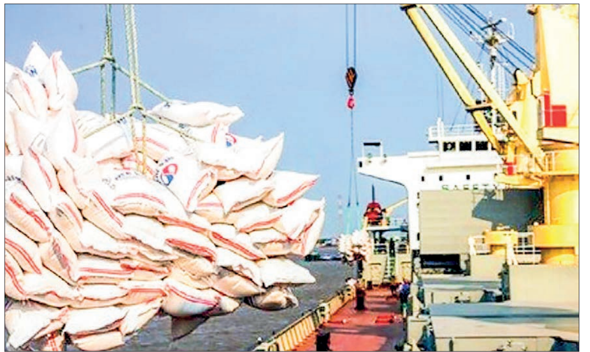
Rice bags are being loaded aboard the vessel for exportation to foreign markets.

Myanmar has been exerting concerted efforts to grow 10 per cent yearly in the rice export