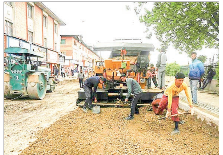
Labourers work on a road along a street under the Smart City project ahead of the G-20 meetings, in Srinagar on 26 April 2023.

There is precedent for international organisations participating in the G20, with the European Union also holding a seat. The then chair of the African Union, Senegalese President Mack Sall, was invited to the G20 meeting in Indonesia last year by the hosts. Scholz travels Friday to Kenya. —AFP