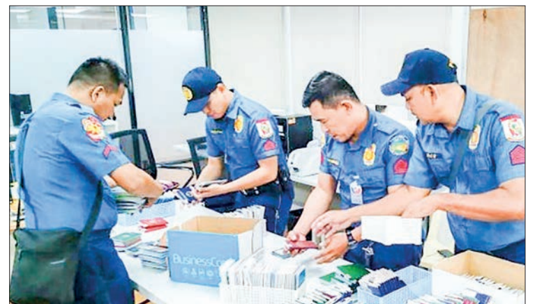
Policemen inspecting documents and passports after a raid inside a freeport zone in Mabalacat City, in Pampanga province, north of Manila. PHOTO: AFP

Sabino said the workers were trained to entice strangers into buying cryptocurrency or depositing money into bogus bank accounts after establishing fake romantic relationships. — AFP