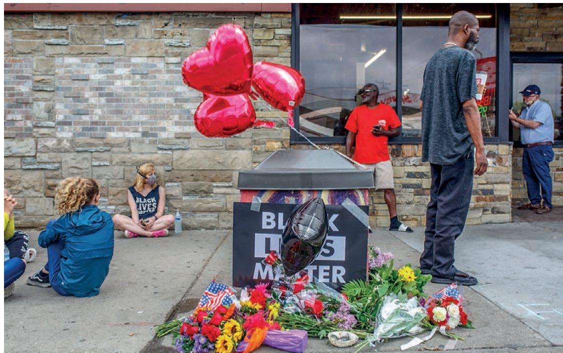
A memorial left for George Floyd at the scene where an officer pinned him down a day earlier in Minneapolis on 26 May 2020.

While a more in-depth report will emerge from the UN