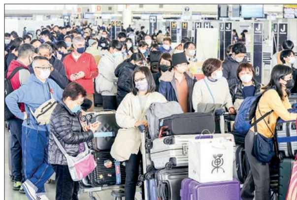
Photo taken on 4 February 2023, shows Fukuoka Airport's international terminal crowded with travelers.

The total was the highest since the country lifted its pandemic-prompted ban on individual, non-prearranged trips last October.—Kyodo