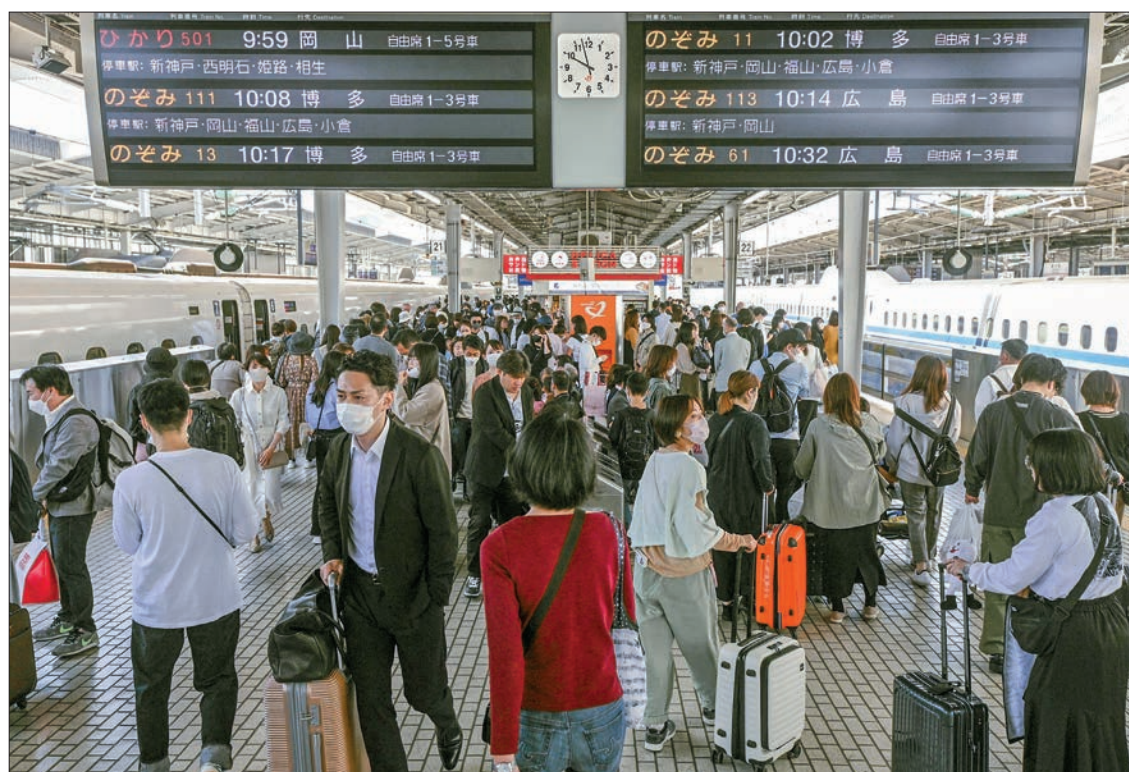
A shinkansen bullet train platform at JR Shin-Osaka Station in Osaka, western Japan, is crowded with passengers as Japan enters the second half of the Golden Week holidays on 3 May 2023.

Shin-Osaka Station in western Japan was also crowded.