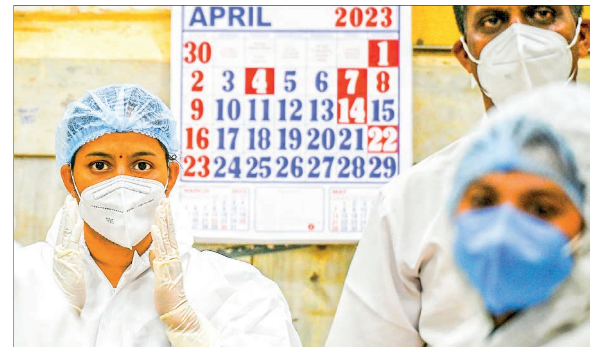
As of 23 April 2023, over 764 million confirmed cases and over 6.9 million deaths have been reported globally.