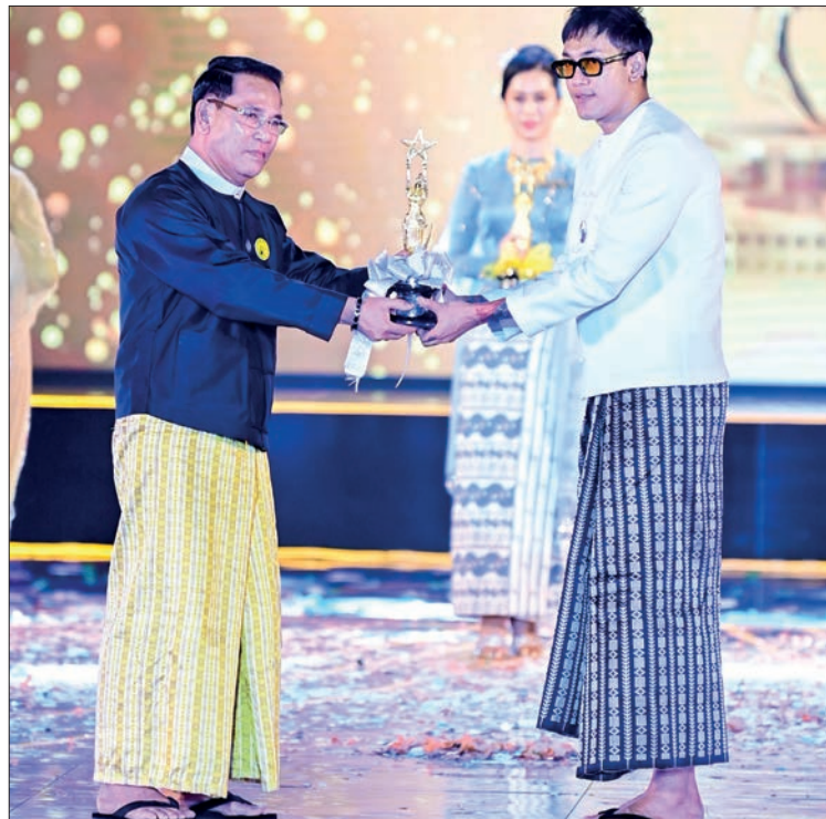
Union Minister U Maung Maung Ohn presents the best supporting actor award.