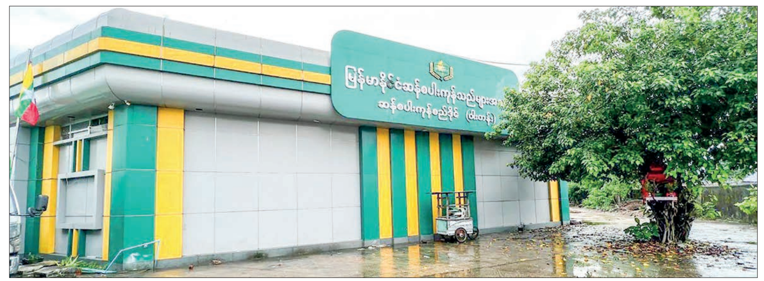
The rice depot (Wadan) of Myanmar Rice Federation (MRF).

STOCKPILES of reserve food and rice and the necessary arrangements have been prepared in advance, the Myanmar Rice Federation (MRF) notified.