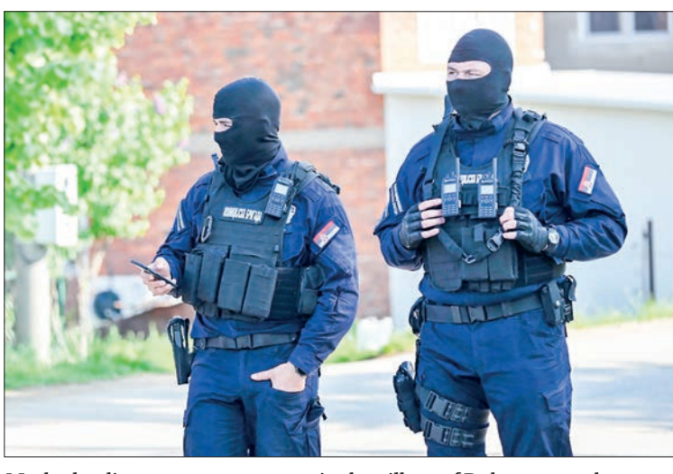
Masked policemen secure an area in the village of Dubona near the town of Mladenovac, about 60 kilometres (37 miles) south of Serbia's capital Belgrade, on 5 May 2023, in the aftermath of a drive-by shooting.

The pavement has been transformed into a makeshift