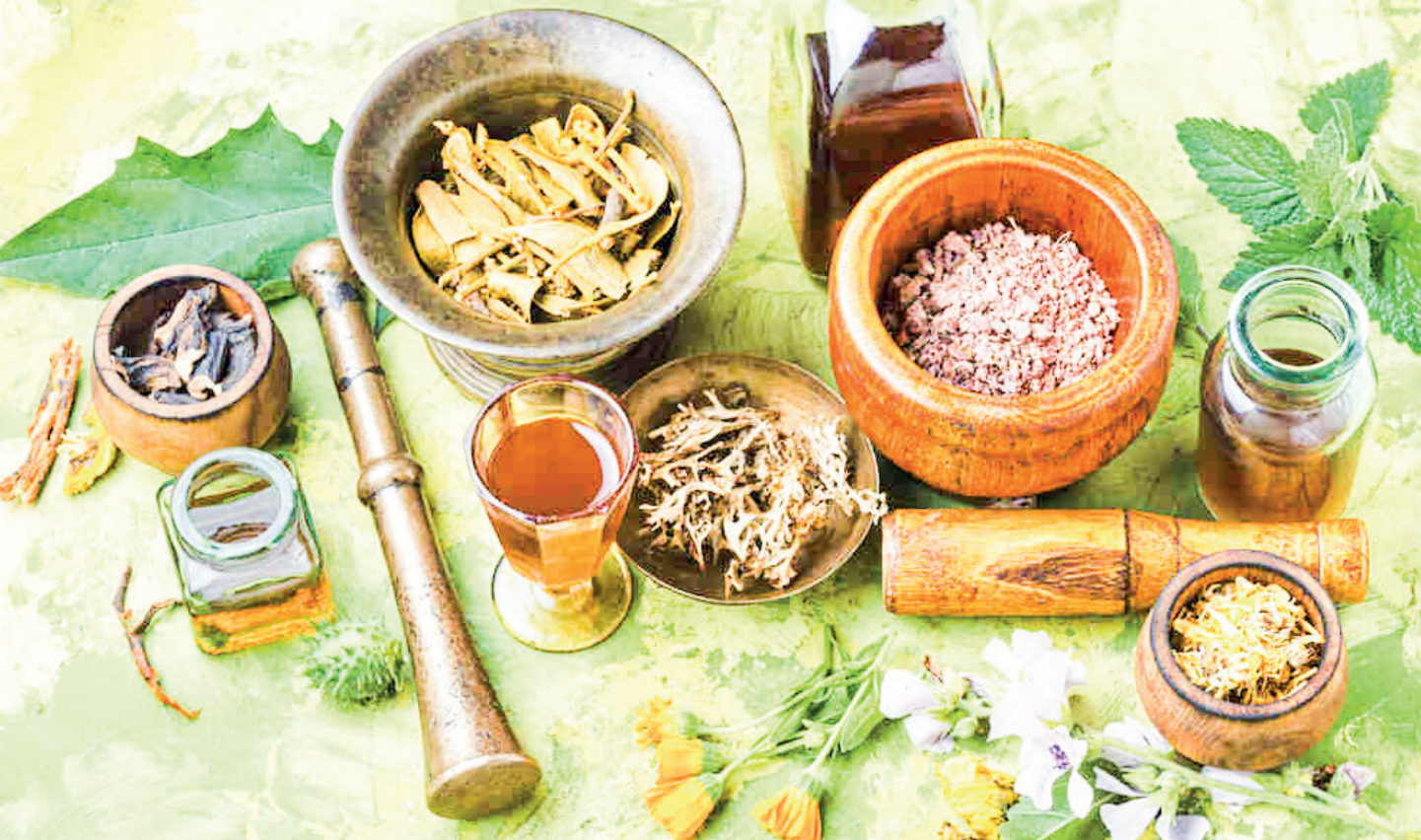
The integration of traditional medicine into the national healthcare system can bring several benefits, such as increased access to healthcare services, improved health outcomes, and reduced healthcare costs.

The integration of traditional medicine into the national healthcare system can bring several benefits, such as increased access to healthcare services, improved health outcomes, and reduced healthcare costs. Traditional medicine is often more affordable and accessible than Western