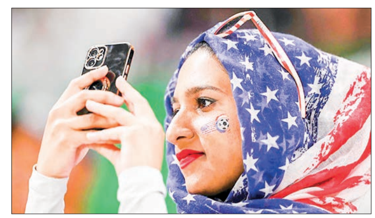
A USA fan looks at her mobile phone at the Al-Thumama Stadium on 29 November 2022.

Mobile phones emit low levels of radiofrequency energy, which has been linked with rises in blood pressure after short-term exposure. Results of previous studies on mobile phone use and blood pressure were inconsistent, potentially because they included calls, texts, gaming, and so on. This study examined the relationship between making and receiving phone calls and new-onset hypertension. The study used data from the UK Biobank. — ANI