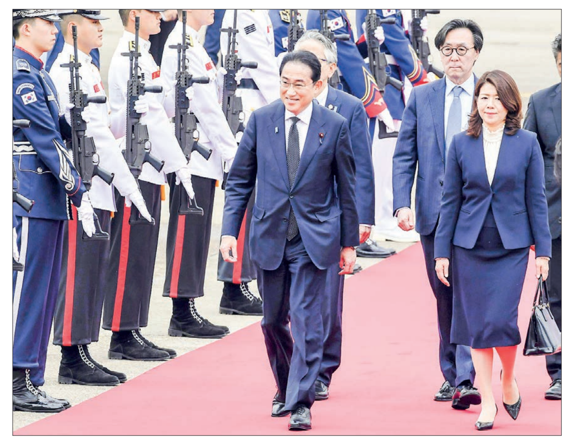
Japanese Prime Minister Fumio Kishida (L) arrives in South Korea as Seoul and Tokyo seek to mend ties in the face of nuclear threats from Pyongyang.

Yoon is expected to host a dinner party at the presidential residence — likely serving Korean barbeque — and he may even cook for Kishida, according to local reports. — AFP