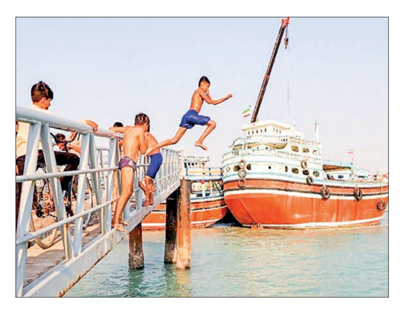
Merchants on Iran's Qeshm island, some 150 kilometres (93 miles) from the United Arab Emirates' commercial hub Dubai, are closely watching regional shifts since Tehran's March deal with Saudi Arabia.

YEARS of sanctions on Iran have have good relations with your taken their toll, but on the strategically located island of Qeshm, people can still find goods from major global brands otherwise out of reach.