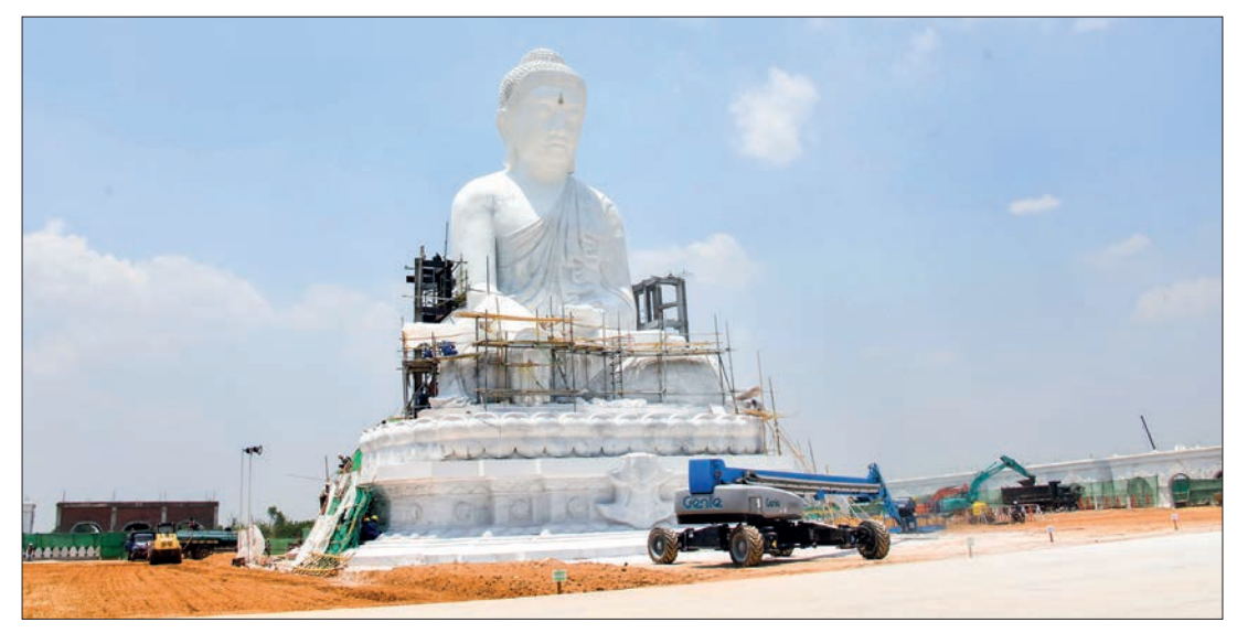
Carving of marble Buddha image Maravijaya seen in Buddha Park in Dekkhinathiri Township.

A delegation comprising veteran artistes and artistes of MRTV-4 series, who had attended the Myanmar Academy Awarding ceremony, visited the Buddha Park in Dakkhinathiri Township, Nay Pyi Taw, yesterday morning, to pay home to Maravijaya Buddha Image.