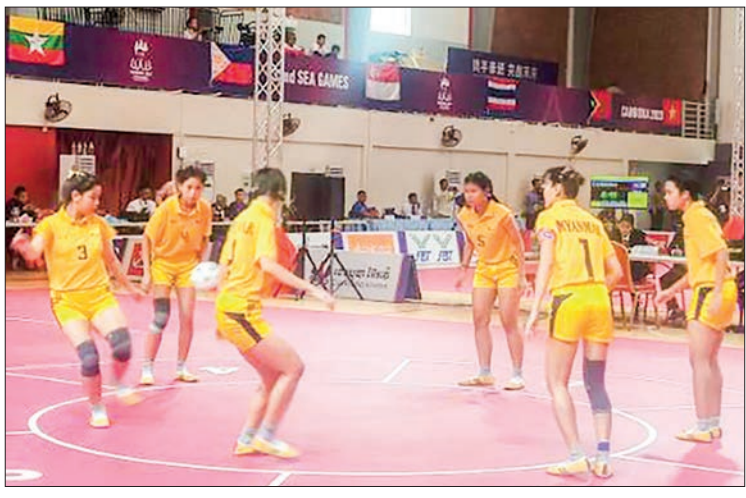
Myanmar Women's Chinlone Team compete in the XXXII SEA Games on 7 May 2023.

In this competition, the Cambodian team earned the silver medal with 182 points and the Lao team bagged the bronze medal with 125 points.