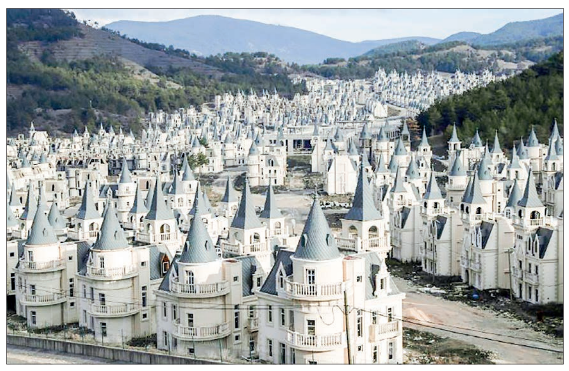
The latter years of Erdogan's rule have seen the growth of loss-making projects that went bankrupt. PHOTO:

THE earthquake's frightening rumble came deep in the night. Its ferocity killed thousands of people in their sleep and helped bring down a Turkish government.