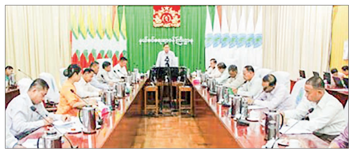
Union Minister for Border Affairs Lt-Gen Tun Tun Naung speaking at coord meeting on emergency work on natural disaster on 7 May.

He urged the rescue teams to carry out emergency rescue and relief works under the management of the ministry to cooperate with the affected