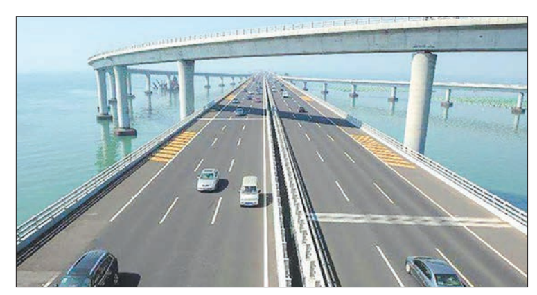
Vehicles run smoothly on the Jiaozhou Bay Bridge, the world's longest cross-sea bridge, in Qingdao, East China's Shandong province, 1 October 2012.

Over the past four decades, the bay, in the coastal city of Qingdao, has witnessed tremendous progress in its ecological environment preservation.