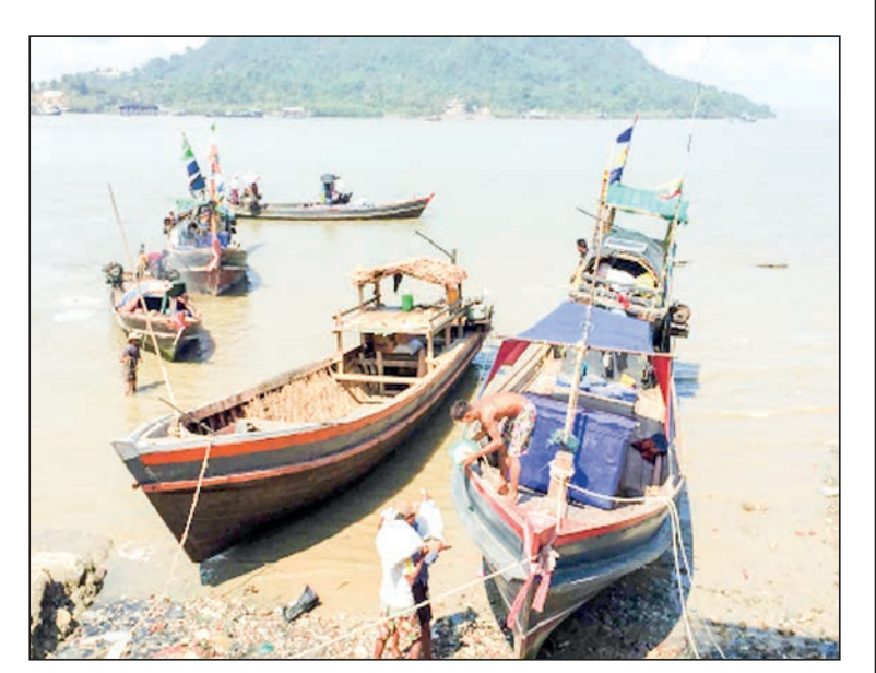
Some fishermen seen at a port.

The course also includes life safety measures, calculation, fire extinguishing and emergency measures for outbreak of fire. The officials are continuously doing educational activities to avoid throwing garbage into the sea. — TWA/KZW