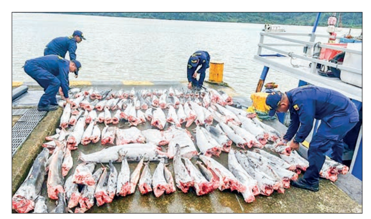
A Colombian National Navy photo of fish confiscated from illegal fishermen, 5 May 2023, on the island of Malpelo, Colombia. PHOTO: COLOMBIAN NATIONAL NAVY/AFP

Colombian law punishes illegal fishing with up to nine years in prison. — AFP