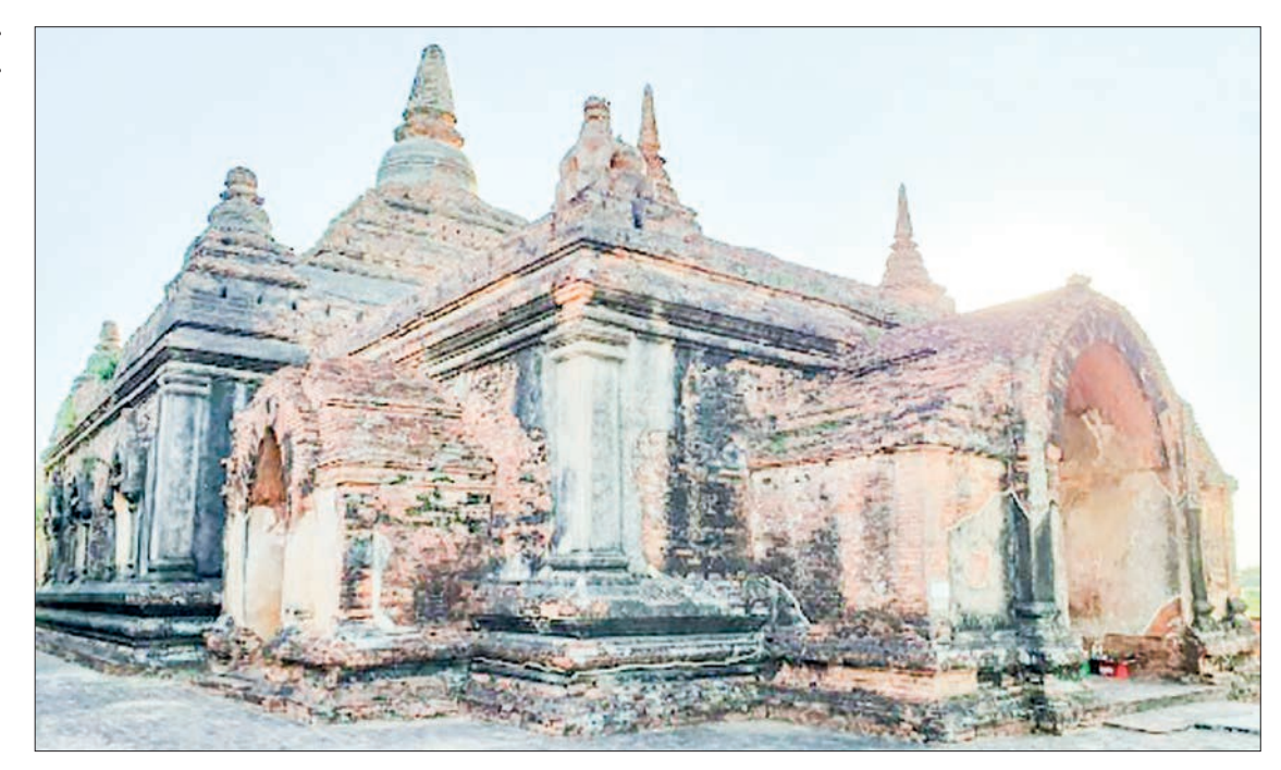
A Photo shows Apelyadana Temple in Bagan.

Travellers may pay visits to Nagayon Pagoda in the east of Apelyadan Temple, Soe Min Gyi brick monastery, Soe Min Gyi Pagoda, Kyaukmyethmaw Pagoda and Seinnyet Ama Pagoda in the south, Manuha Pagoda, Nan Pagoda, Myazedi Pagoda, Gubyaukgyi Pagoda and ancient pagodas in the north. They can visit 3,822 other stupas and temples in different cultural heritages in Bagan.