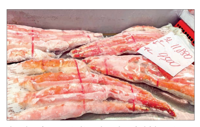
Photo shows frozen Russian king crab on sale at a fresh fish store in Tokyo on 2 May 2023.

Imports of pollack paste, the raw ingredient for "kamaboko" fishcakes, increased roughly seven-fold from the previous year