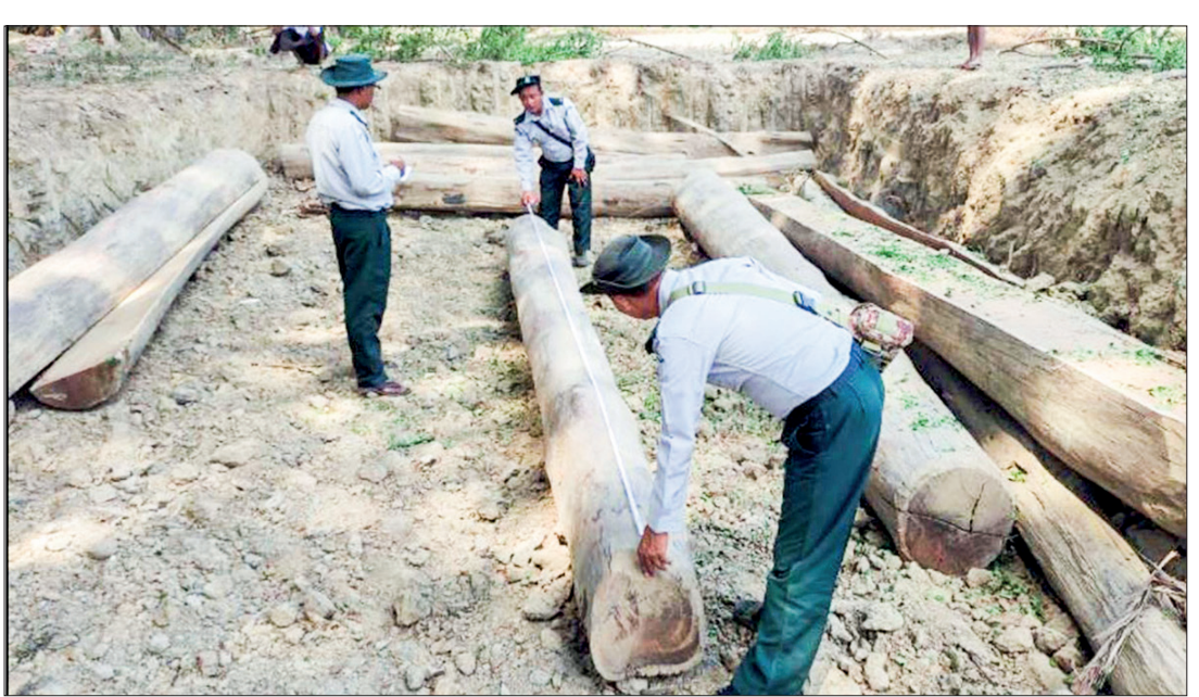
Seized illegal teak logs.

Therefore, 12 arrests (estimated value of K493,807,680) were made on 2, 4 and 5 May, according to the Illegal Trade Eradication Steering Committee. — MNA/MKKS