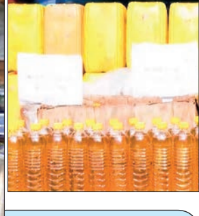
A palm oil retail outlet in the oil market.

ON 5 May, the delivery order (DO) price of palm oil was K5,900-K5,950 per viss in the Yangon edible oil market. On 6 May, wholesale palm oil was traded at K5,800–K5,850 per viss in the Nyaungpinlay oil market, Ko Swe Aung, an oil trader, told the GNLM.