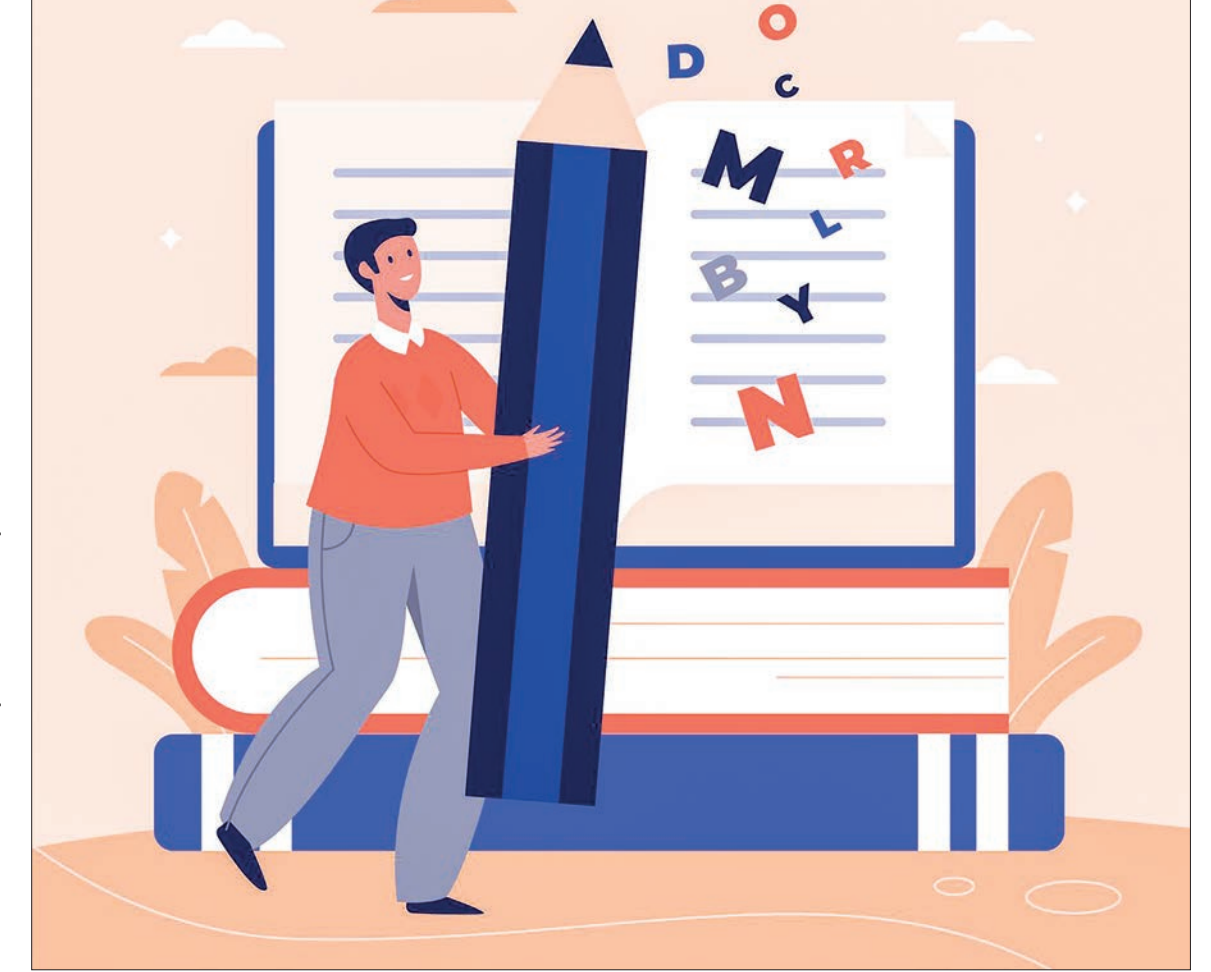
Literature and language are closely intertwined and often go hand in hand. Language serves as the primary medium through which literature is created, expressed, and understood. ILLUSTRATION: PIX FOR VISUAL

Secondly, the following paragraph is taken out from Wuthering Heights by Emily Bronte as a fine example of the writer's choice of vocabulary expressions, where a