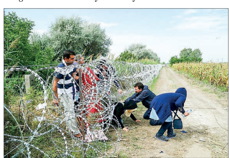
The priority is for EU countries to share the hosting of asylum-seekers, taking in many that arrive in nations on the bloc's outer rim, mainly Greece and Italy. PHOTO: REPRESENTATIVE IMAGE/EU.BOELL. ORG/AFP

The priority is for EU countries to share the hosting of asylum-seekers, taking in many that arrive in nations on the bloc's outer rim, mainly Greece and Italy.—AFP