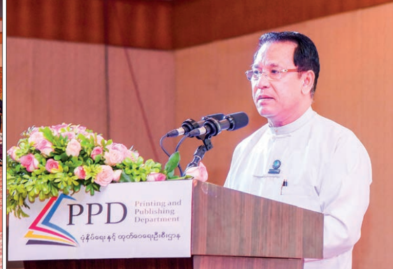
Union\ Information\ Minister\ U\ Maung\ Maung\ Ohn\ speaks\ on\ the\ award-presentation\ occasion\ of\ the\ Pakokku\ U\ Ohn\ Pe\ Literary\ Awards\ in\ Nay\ Pyi\ Taw\ yesterday.

THE 29th Pakokku U Ohn Pe Lifetime Literary Awards, Pakokku Literary Award, Scholarships and Pakokku U Ohn Pe Library Book Awards giving ceremony was held at Horizon Lake View Resort in Nay Pyi Taw yesterday.