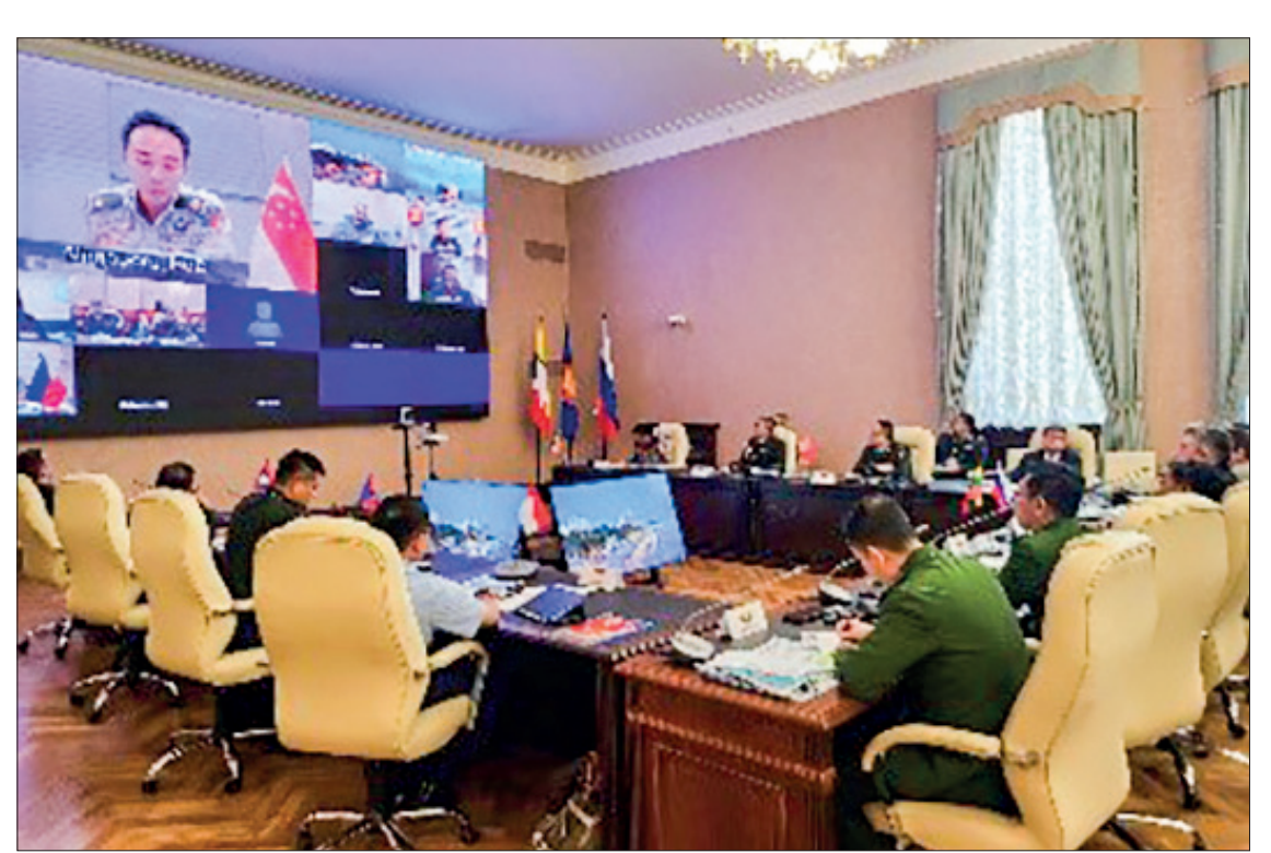
The Myanmar delegation attends the Planning Conference of ADMM-Plus Experts' Working Group on Counter-Terrorism on 6 and 7 June 2023 in the Russian Federation.

UNDER a three-year working plan of the ADMM-Plus Experts' Working Group on Counter-Terrorism, the Planning Conference of ADMM-Plus Experts' Working Group on Counter-Terrorism co-chaired by Myanmar and the Russian Federation was held via the hybrid system at Khabarovsk on 6 and 7 June 2023.