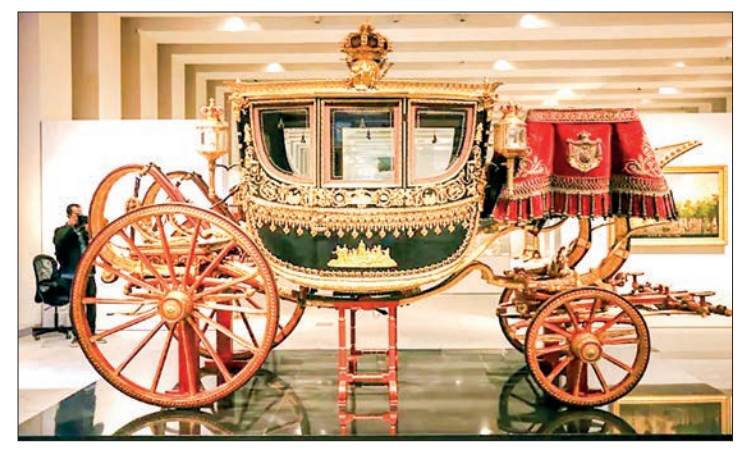
A carriage is among the items on display at a new Madrid museum showcasing treasures from Spain's monarchs.

Nearby is a massive 16th-century tapestry once owned by Spain's Queen Isabella which the culture ministry bought in February for one million euros ($1.1 million).—AFP