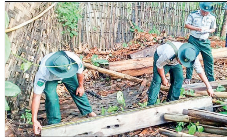
Officials are seen measuring seized illegal timbers.

Similarly, the combined team captured a total of 2.144 tonnes of illegal teak and illegal timbers (worth K792,192) in Bago district and a Plantana car (approximately K3.52 million) without official documents in Nyaunglebin township on 7 June. The action was taken under the Forest Law and Export and Import Law.