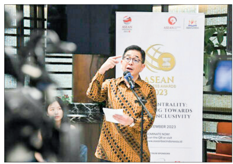
An undated photo shows a representative explaining about ASEAN Business Awards (ABA) 2023 in Jakarta, Indonesia.

For further details of qualifications to be eligible for the awards, please visit https:// aseanbacindonesia.id/event/ aba-2023/how-to-apply. They can submit the registration by 7 July, the UMFCCI notified. -TWA/EM