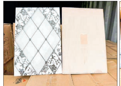
Confiscated illegal commodities.

AN on-duty team at the Myanmar Industrial Port container checkpoint impounded 224,875 ceramic tiles (worth K76,502,475) from a container on 6 June. The action was taken under Customs procedures.