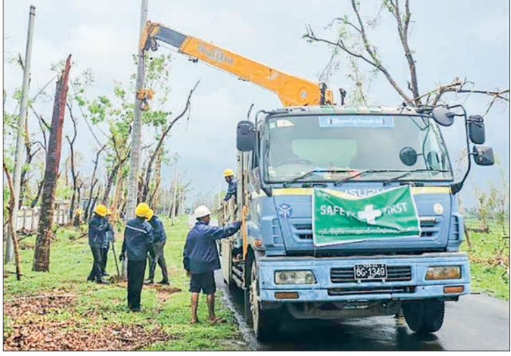
Clear-up measures are underway in Sittway yesterday.

To repair Mocha-battered buildings in Rakhine State, the