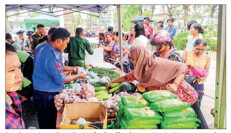
Locals are pictured purchasing foodstuffs at lower prices in Sittway yesterday.

The locals and the families of the departmental staff enjoyed buying foodstuffs and expressed thanks to officials for selling them at low prices during difficult times. — MNA/KTZH