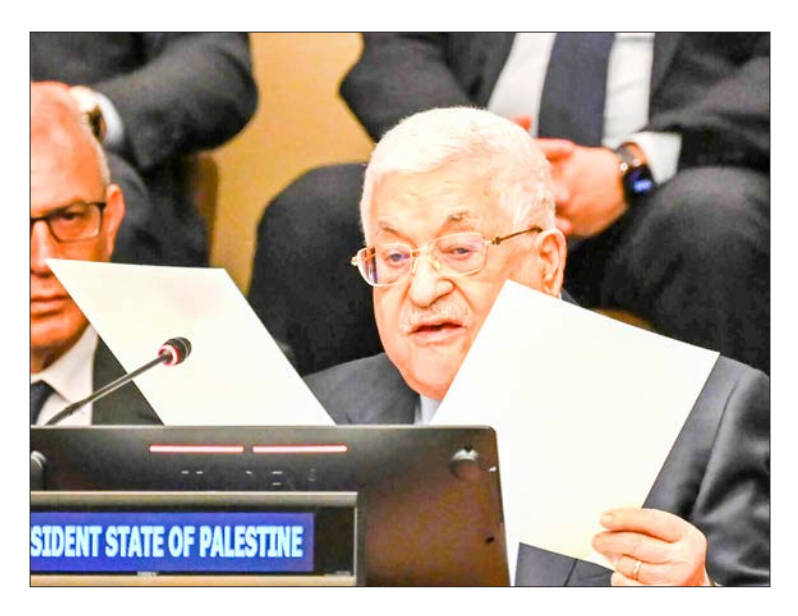
Palestinian president Mahmud Abbas will make a state visit to China next week. PHOTO: AFP

Abbas is an "old and good friend of the Chinese people", he added. "China has always firmly supported the just cause of the Palestinian people to restore their legitimate national rights." Beijing has sought to boost its ties to the Middle East, challenging long-standing US influence there — efforts that have drawn rebukes from Washington. — AFP