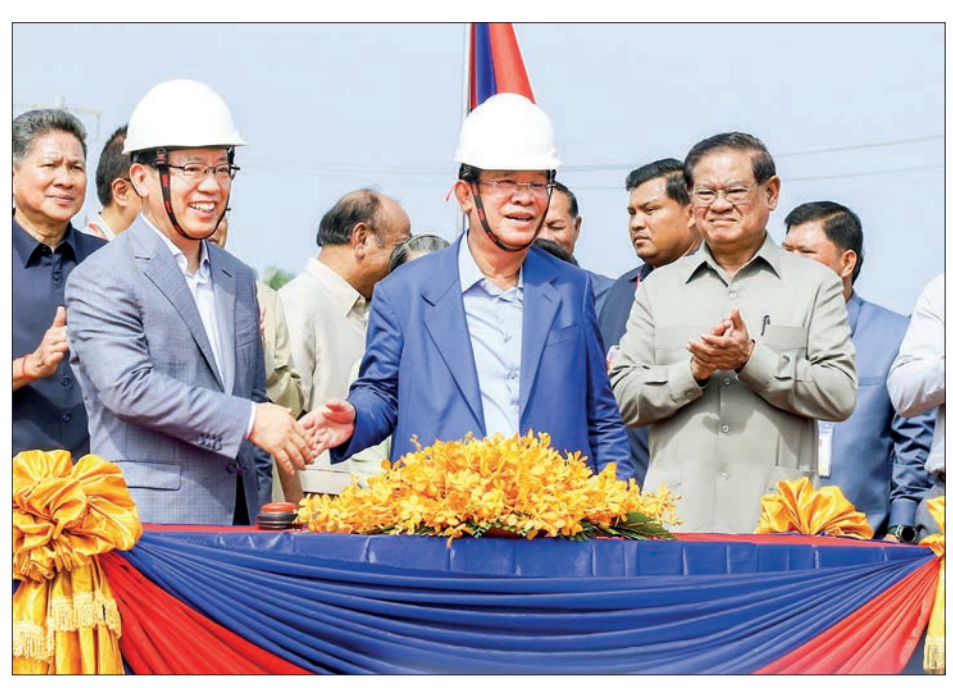
Cambodian Prime Minister Hun Sen (C) attends a groundbreaking ceremony on 7 June 2023 in Kandal Province, near Phnom Penh, for the construction of the country's second expressway, linking the capital to the Viet Nam border.

CAMBODIA has begun building its second express-