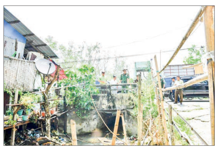
Senior military officers oversee rehabilitation work in Sittway yesterday.