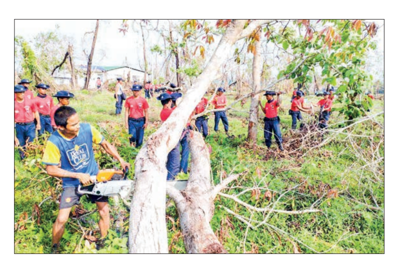
{\it Clear-up\ of\ fallen\ trees\ are\ carried\ out\ in\ Sittway\ yesterday}.

TO facilitate necessary relief and rehabilitation activities in areas affected by natural disasters, Tatmadaw has deployed relief teams consisting of local security forces. In cooperation with social relief organizations, they are actively assisting in the affected areas.