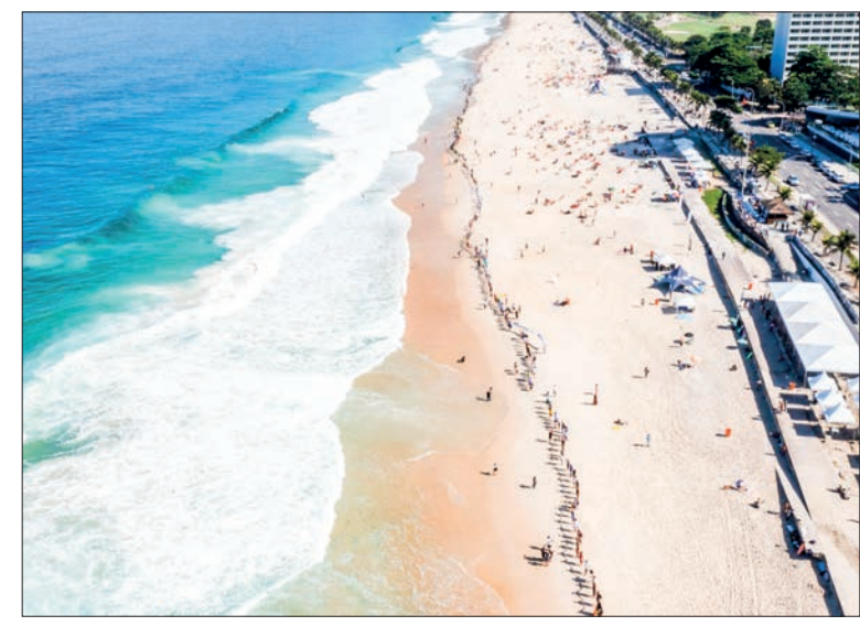
Volunteers from a Non-Governmental Organization hold hands after cleaning the Sao Conrado beach in Rio de Janeiro, Brazil, on 8 June 2023 in SOURCE: AFP the framework of the World Ocean Day. PHOTO: JOAO LAET/AFP

Copernicus also reported that temperatures in several parts of the world were higher than normal, including Canada, where wildfires over the last several weeks have so far decimated more than three million hectares (eight million acres). There are 413 wildfires are burning across the country from Pacific to Atlantic, including 249 deemed "out of control".