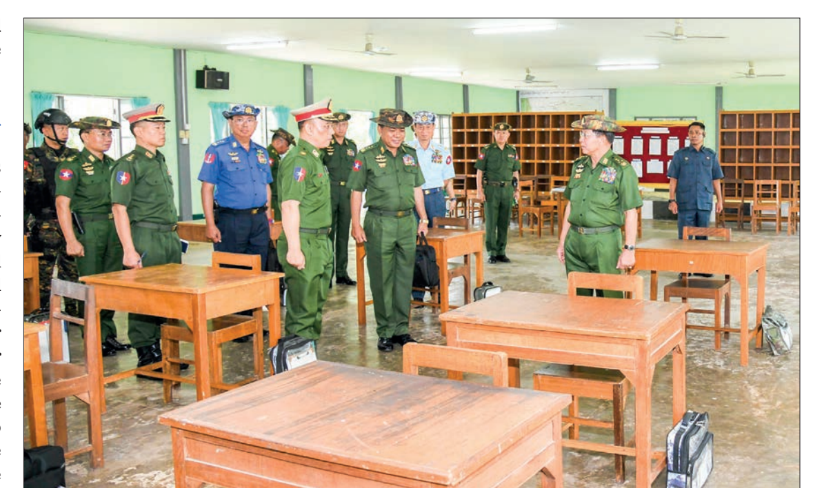
The Senior General pays inspecting tours round the training school in Hmawby yesterday.

Training schools have given training to them to become good Tatmadaw members. They have to firmly grasp the conviction