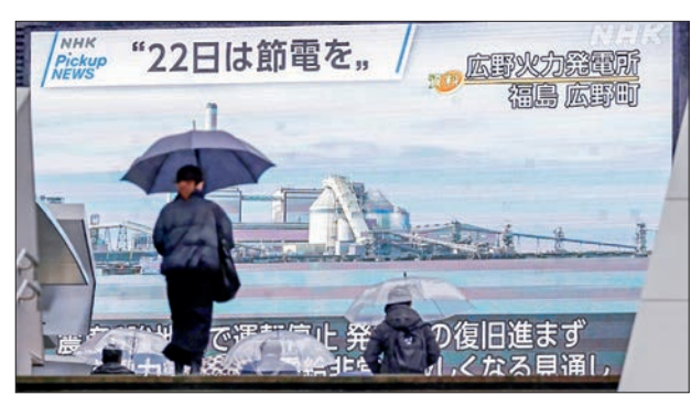
People walk by a huge monitor airing a news programme which calls for power saving, in Tokyo Tuesday, 22 March 2022.

THE Japanese government decided Friday to request households and businesses in the Tokyo area to save electricity in July and August, with the supply-demand balance forecast to become tight in the area this summer. The reserve power capacity ratio in the metropolitan area in July could drop to 3.1 percent, slightly above the lowest level for maintaining a stable supply, if a once-in-a-decade level of extreme heat grips the region served by Tokyo Electric Power Company Holdings Inc., the indus-