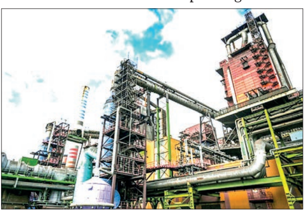
During economic downturns, countries within the Eurozone, including Germany, can be affected by the broader economic trends in the region.

that had predicted slight growth, after economic powerhouse Germany said last month it had fallen into recession. The worse-than-expected figures come as inflation and higher interest rates have curbed demand in Europe's largest econo-