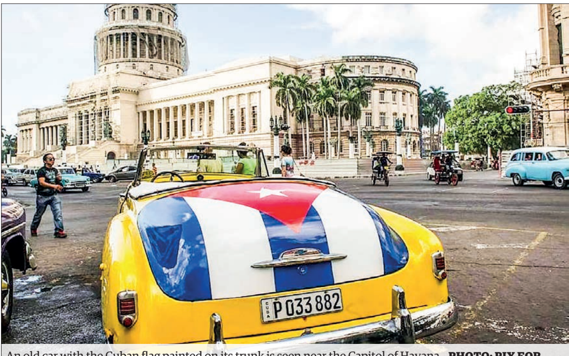
An old car with the Cuban flag painted on its trunk is seen near the Capitol of Havana.

The region includes the US Southern and Central Command