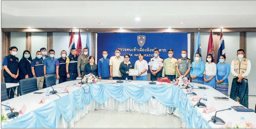
The picture depicts the handover ceremony of Myanmar victims of human trafficking who had been under the care of centres operated by the Ministry of Social Development and Human Security in Thailand on 15 June.

NINE Myanmar nationals who had fallen victim to trafficking in Thailand were repatriated to Myanmar through the Myanmar-Thailand Friendship Bridge No 1 on 15 June.