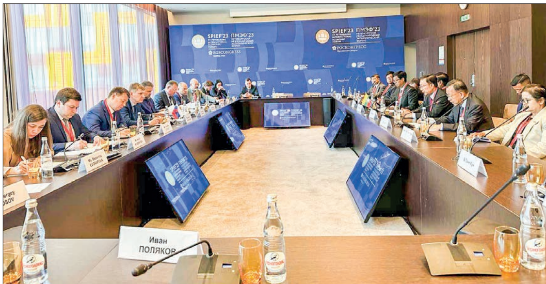
Deputy Prime Minister U Win Shein-led Myanmar delegation joins the 26 th St Petersburg International Economic Forum in the Russian Federation on 14-17 June 2023.

THE Myanmar delegation, led by Deputy Prime Minister and Union Minister for Planning and Finance U Win Shein, including Union Minister for Investment and Foreign Economic Relations (MIFER) Dr Kan Zaw, Union Minister for Electric Power U Thaung Han, and Governor of the Central Bank of Myanmar Daw Than Than Swe, attended the 26 th St Petersburg International Economic Forum (SPIEF'23) held from 14 to 17 June in St Petersburg, the Russian Federation.