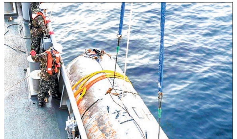
Images released by Seoul's defence ministry showed a long, white barrel-like metal structure with the word "Chonma" written on it -- possibly a shorter form of the rocket's official name, Chollima-1.

the national agency for defence development," the Joint Chiefs of Staff said in a statement. — AFP