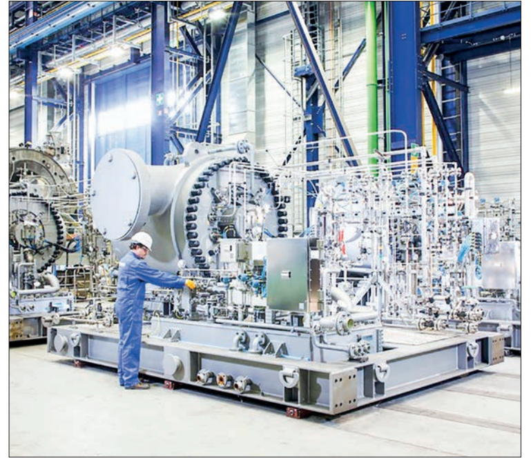
German industrial company Siemens has announced plans to invest two billion euros in expanding its manufacturing capacity. As part of this investment, Siemens will build a new high-tech factory in Singapore and expand an existing facility in China.

The group’s announcement came a day after the German government published its first National Security Strategy that took aim at China for acting against Berlin’s interests and values. — AFP