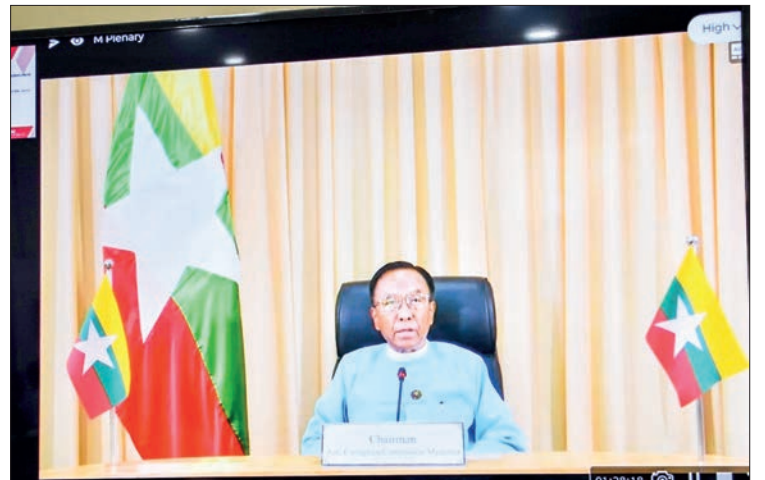
Chairman Dr Htay Aung of the Myanmar Anti-Corruption Commission attends the UN Meetings on Anti-Corruption virtually.

Representatives from other countries discussed various topics during the meeting, including the implementation of the United Nations Convention against Corruption (UNCAC), sharing good practices, experiences, and approaches to