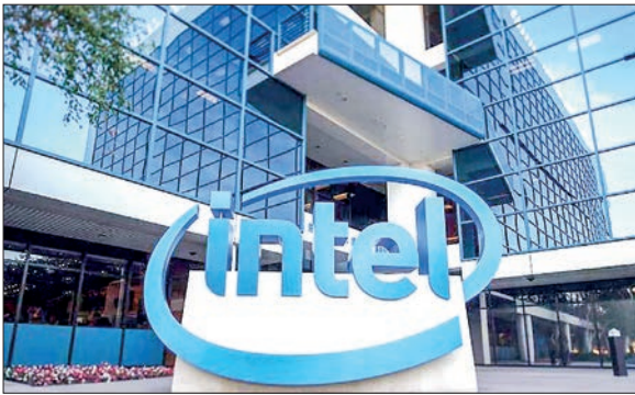
Intel is one of the world's leading semiconductor firms, making a wide range of products, including the latest-generation chips. PHOTO: AFP

Intel has said its European sites will help with cost efficiency in the EU's supply chain, and that it plans to produce 80 billion euros worth of chips in Europe over ten years. — AFP