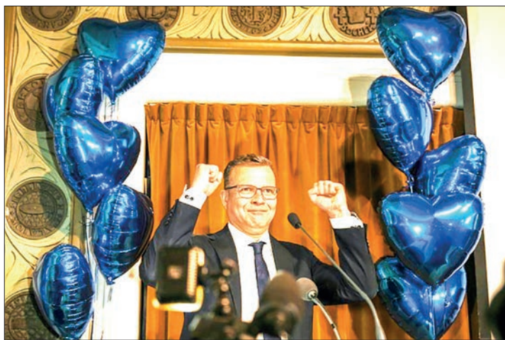
Orpo's level-headed and policy-oriented approach has served him well.

FINLAND'S next prime minister Petteri Orpo presents a stark contrast to his charismatic predecessor Sanna Marin, with his cool-headed demeanour and focus on reining in spending.