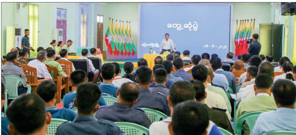
Vice-Senior General Soe Win meets departmental personnel, town elders, relief teams and Parahita teams at the General Administration Department in MraukU.