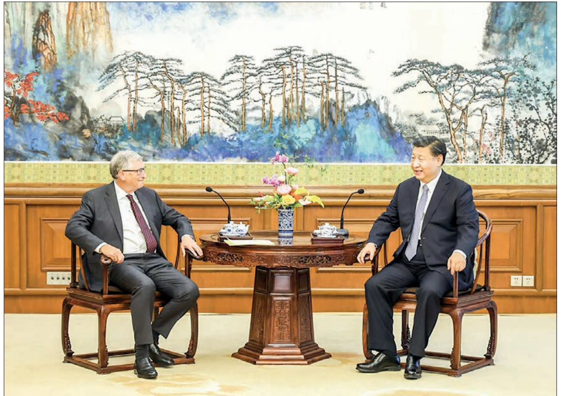
Chinese President Xi Jinping meets with Bill Gates, co-chair of the Bill & Melinda Gates Foundation, in Beijing, capital of China, 16 June 2023.

Xi said that China is ready to carry out extensive cooperation with all countries on scientific and technological innovation, and actively participate in and promote the response to global challenges such as climate change, the fight against the pandemic, and public health. — Xinhua