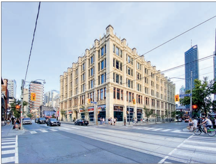
Bell’s CEO, Mirko Bibic, along with other executives, have written an open letter revealing the financial challenges faced by the company’s news operations and radio business.

CANADA’S top broadcaster BCE announced Wednesday 1,300 job cuts and the closure or sale of nine radio stations in a major reorganization, citing dwindling