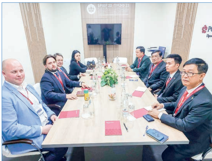
Union Minister U Thaug Han attends the second-day International Economic Forum 2023 on 15 June in the Russian Federation.

U Thaug Han, Union Minister for Electric Power, attended the second day of the International Economic Forum 2023 (SPIEF'23) on 15 June held in St Petersburg, Russia, along with U Lwin Oo, Myanmar Ambassador to the