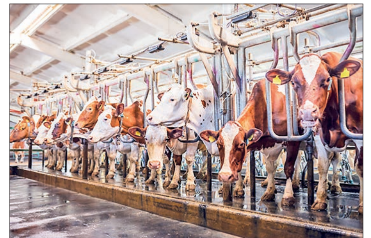
The New Zealand dairy industry is a significant sector of the country’s economy and plays a vital role in its agricultural landscape. Known for its high-quality dairy products, New Zealand is one of the world’s largest exporters of dairy products, particularly milk powder, butter, and cheese.

The government estimates it will cost up to NZ$15 million (US$9 million) to clean up the damage caused by the extreme weather. This is New Zealand’s first recession since 2020, when the pandemic shuttered borders and choked exports. With the economy shrinking, inflation running hot at 6.7 per cent and a 14 October election approaching, the centre-right opposition was quick to blame the government. — AFP