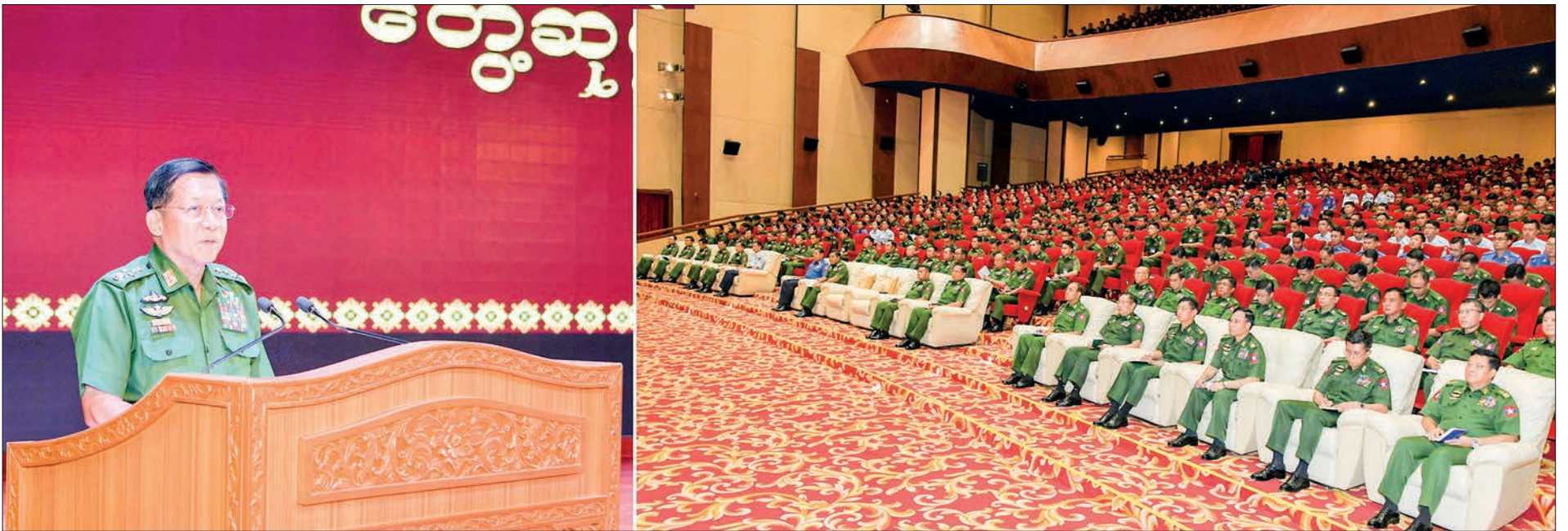
State Administration Council Chairman Commander-in-Chief of Defence Services Senior General Min Aung Hlaing meets junior officers serving at offices and departments of the Commander-in-Chief (Army) yesterday in Nay Pyi Taw.

I T is necessary to take lessons from the history of the country for benefiting the State, said Chairman of the State Administration Council Commander-in-Chief of Defence Services Senior General Min Aung Hlaing at the meeting with junior officers serving at offices and departments of the Commander-in-Chief (Army) yesterday morning.