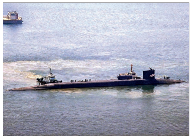
The nuclear-powered US Navy submarine Michigan makes a port call at Busan, South Korea, on 16 June 2023.

into the ocean off its east coast on Thursday night, with both projectiles landing inside Japan's exclusive economic zone, Tokyo and Seoul said. — Kyodo