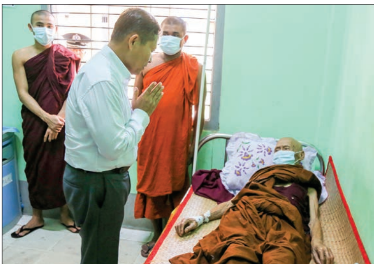
The Vice-Senior General comforts members of the Sangha at Kyaukpyu General Hospital.

The Vice-Senior General inspected local military battalions and police battalions in MraukU, Minbya, Kanni, Sittaw and Kyaukpyu and spoke words of encouragement to Tatmadaw members and families as well as police members and families.