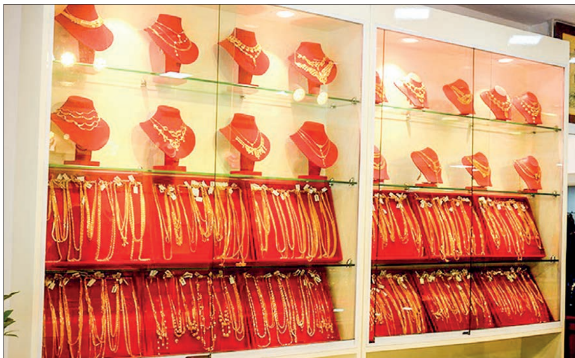
A supplied photo shows gold jewellery items being showcased at the gold outlet in Yangon.

IN a move to address the volatile gold market, the Mandalay Region Gold Entrepreneurs Association has announced the sale of gold bullion at K3,050,000 per tical (equivalent to 0.578 ounce or 0.016 kilo-