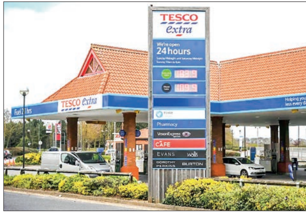
Tesco revealed that retail sales excluding fuel rose 9.3 per cent to £14.8 billion ($18.9 billion) in its first quarter to the end of May, from a year earlier.

"There are encouraging early signs that inflation is starting to ease across the market and we will keep working tirelessly to ensure customers receive the best