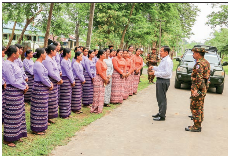
The Vice-Senior General cordially greets families of Tatmadaw members in Kanni.