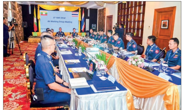
The 8 th Myanmar Air Force-Royal Thai Air Force Air Working Group Meeting in progress in Nay Pyi Taw on 12-16 June 2023.