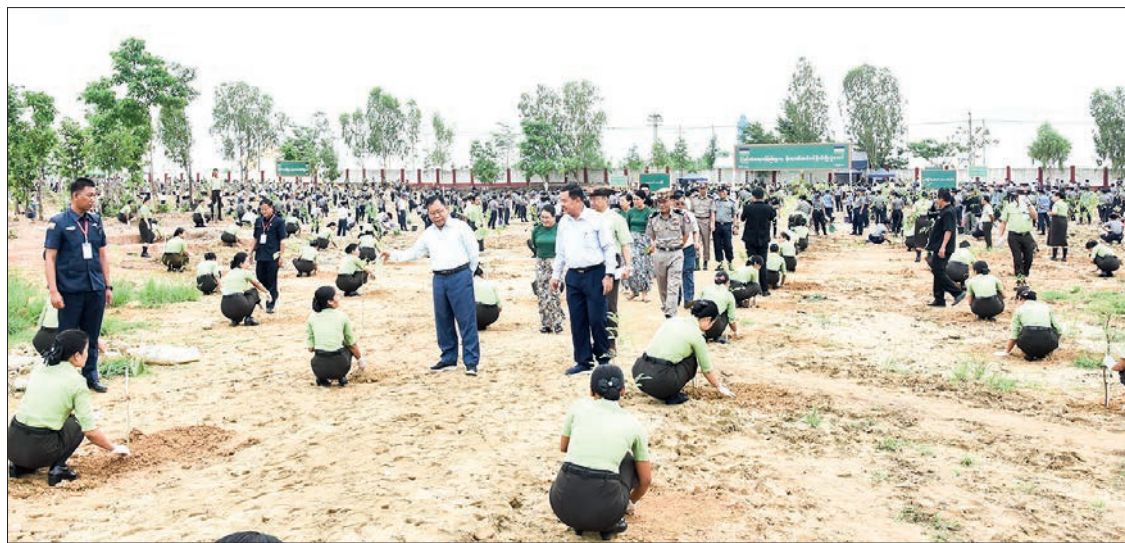
Union Minister Lt-Gen Soe Htut views round the monsoon tree growing ceremony 2023 in Nay Pyi Taw yesterday.

During the ceremony, the ministry successfully planted