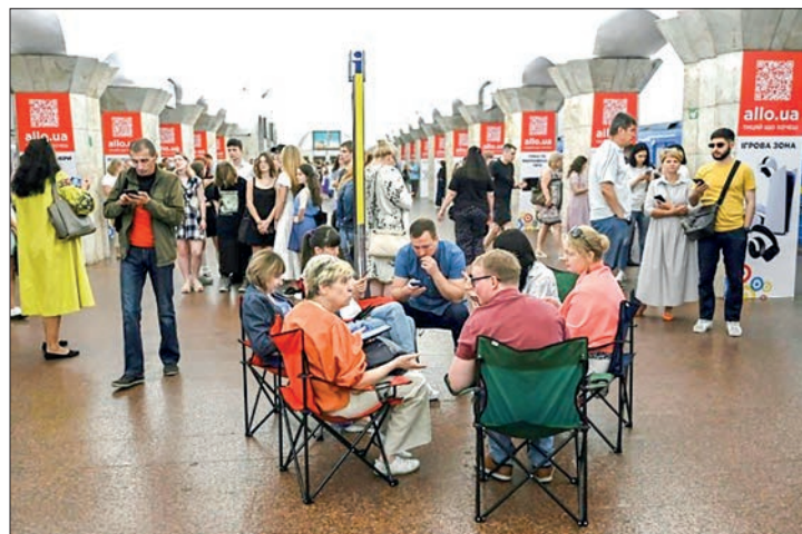
Air raid alerts sounded as African leaders were due to visit. PHOTO: AFP

The African delegation arrived by train from Poland on Friday morning and began their visit in Bucha. — AFP