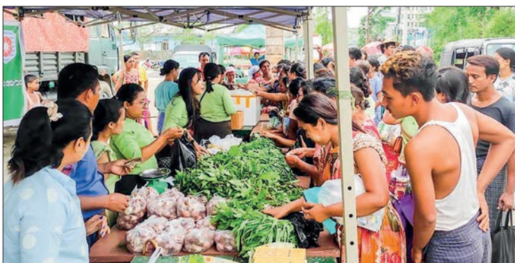
Sittway residents seen purchasing foodstuffs at reasonable prices yesterday.

Locals and families of departmental staff expressed their gratitude for being able to buy essential foodstuffs at affordable prices during this difficult period. They appreciated the efforts of the officials in providing relief and support through the provision of necessary goods. — MNA/KZW