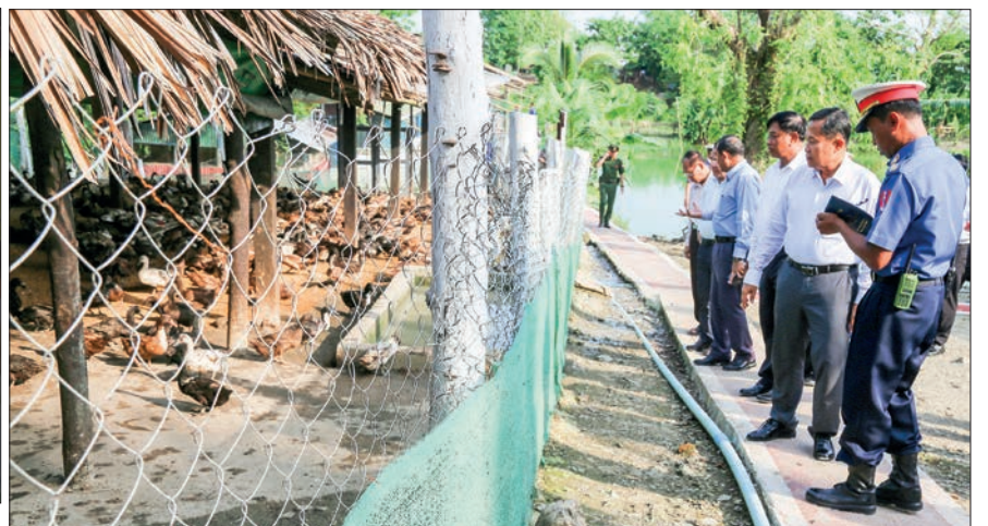
The Vice-Senior General views the agriculture and livestock sector in Sittway.

the Vice-Senior General said that as the towns severely affected by the storm faced loss and damage in manufacturing and services, other towns with minor