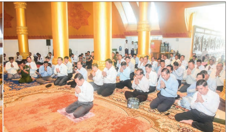
SAC Vice-Chair Deputy Prime Minister Vice-Senior General Soe Win and congregation observe the Five Precepts at the cash donation event for Mocha-hit monasteries, monastic education schools in Rakhine State yesterday.

and monastic education schools to Rakhine State Chief Minister U Htein Lin.