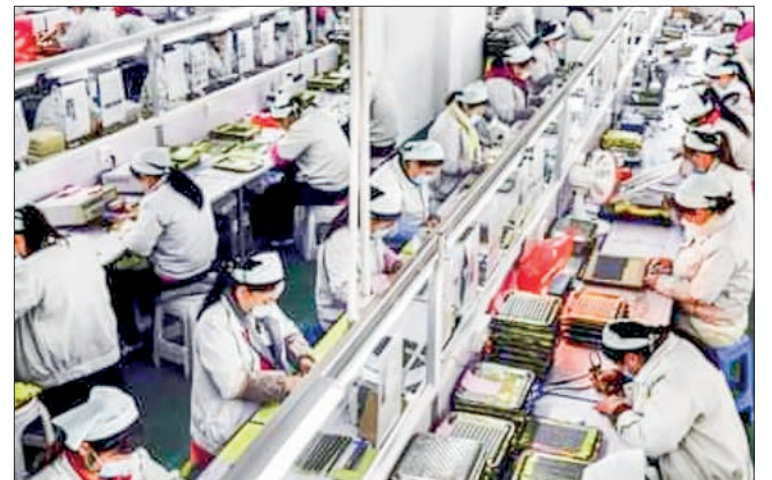
The picture depicts Myanmar workers in an electronics factory in Japan, diligently carrying out their duties.

While it is well-known that a significant number of Myanmar workers seek employment in Thailand, an increasing number are also reportedly finding work in other Asian countries such as South Korea, Japan, and the United Arab Emirates. —TWA/CT