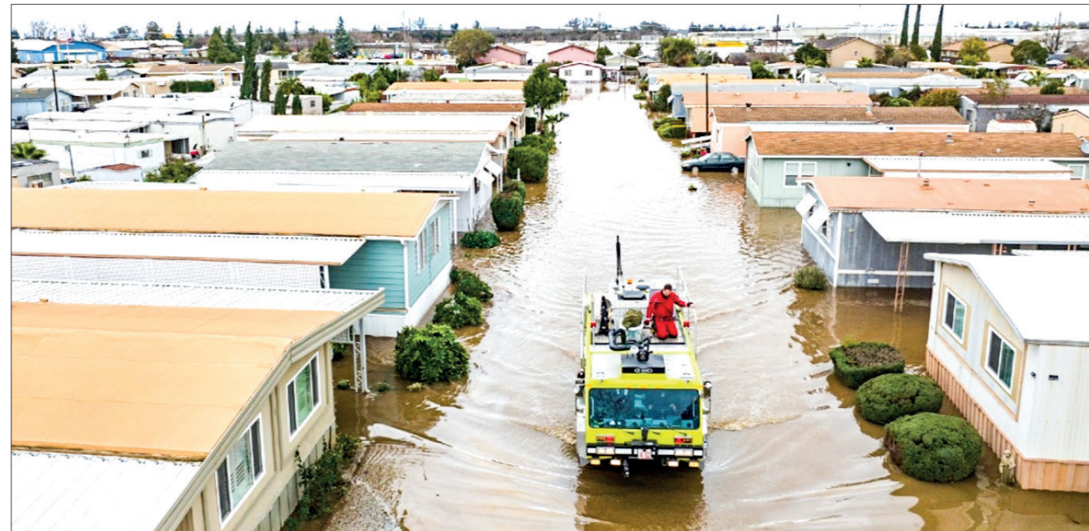
Humanity has the money and technology it needs to slash its greenhouse gas emissions but must act now to avert a full-blown climate catastrophe. Rescue crews assist stranded residents Tuesday in a flooded Merced neighborhood, California on 10 January 2023.

on Earth; without it, our planet would be cold and unlivable.