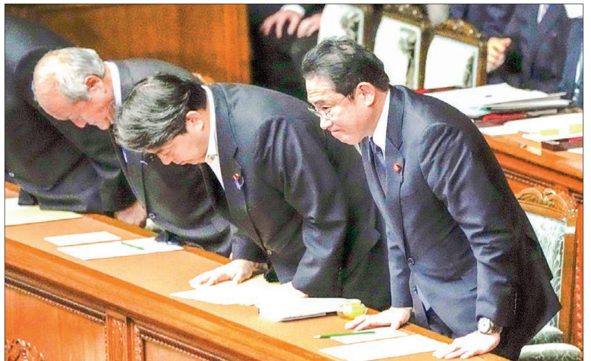
Prime Minister Fumio Kishida (far R) bows in parliament on 16 June 2023, after the House of Representatives voted down a no-confidence motion submitted by the main opposition party against his Cabinet.

was approved in the lower house, within 10 days or all Cabinet members would have to step down under a provision within Japan's Constitution. — Kyodo