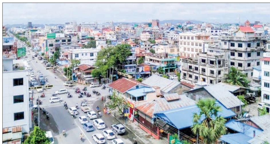
An aerial view of the landscape of buildings in Yangon.

AS the frequency of small-scale earthquakes continues to rise within the country, earthquake experts are sounding the alarm for increased vigilance regarding the movement of the Sagaing Fault, a significant fault line traversing