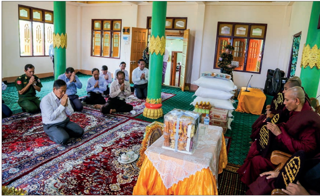
The Vice-Senior General donates rice and alms to the Minbya monastery.

it is necessary to lever up the meat and fish, agriculture and livestock sectors of the state.