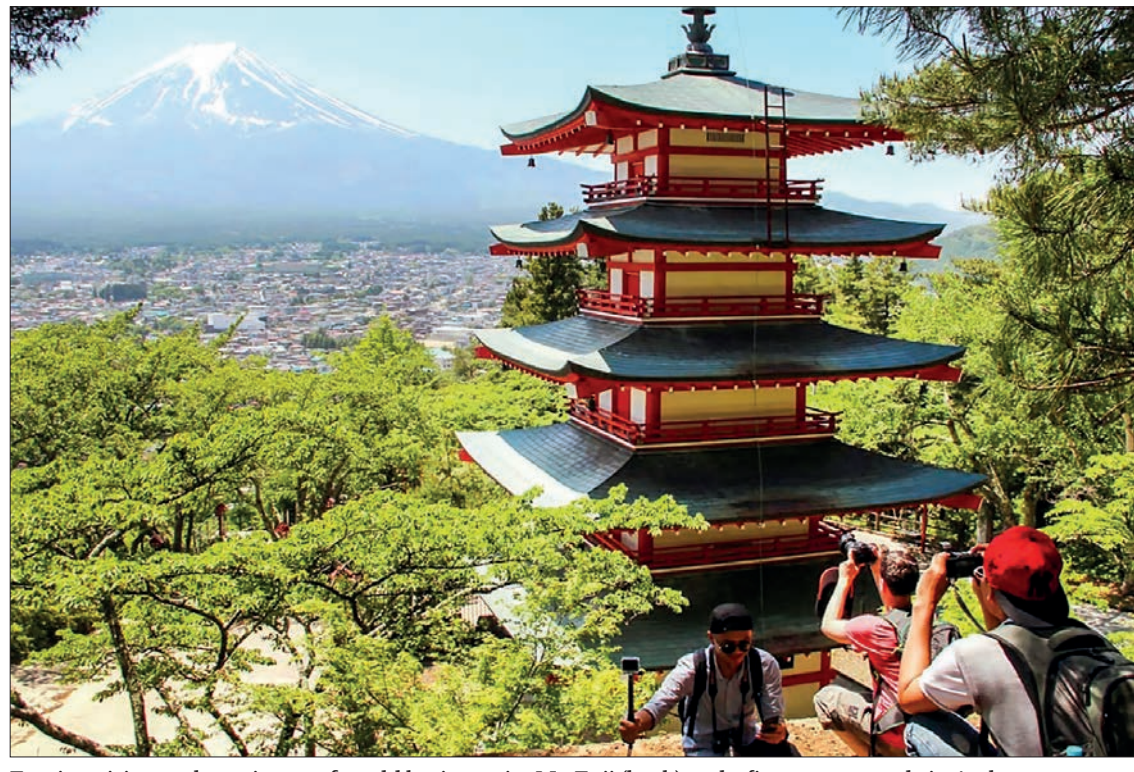
Foreign visitors take a picture of world heritage site Mt. Fuji (back) and a five-story pagoda in Arakurayama Sengen Park in Fujiyoshida.

As for Japanese guests, the April figure climbed to 37.24 million, up 12.5 per cent from a year