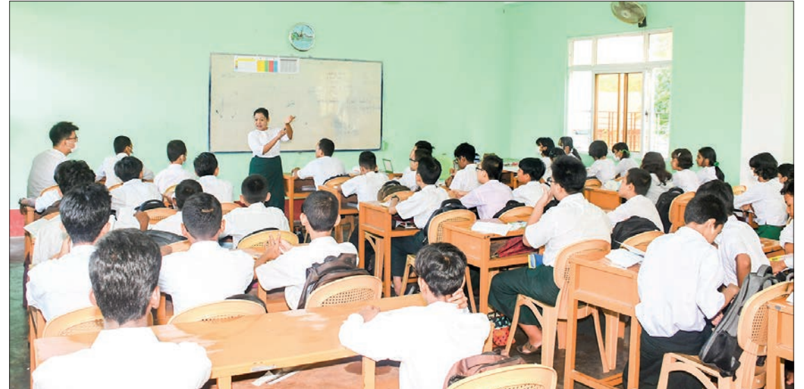
Schoolchildren are seen going to schools in Yangon yesterday.

Students are learning basic education in one classroom of the school in Yangon yesterday.