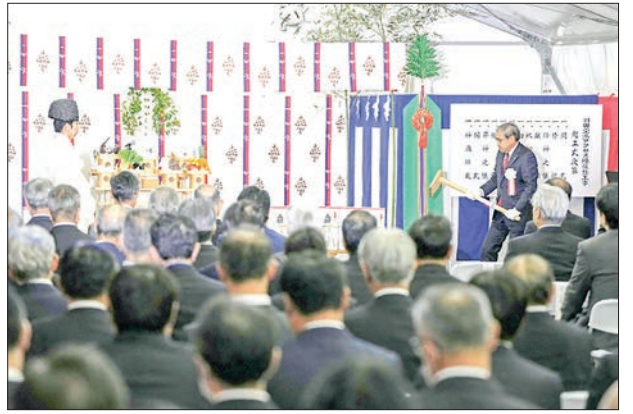
A ground-breaking ceremony is held in Tokyo on 2 June 2023 to mark the start of construction for a new train line connecting Tokyo Station and the capital's Haneda airport.

The new airport line, to be operated by East Japan Railway Co, will allow passengers to travel the approximately 14-kilometre journey in 18 minutes without the need to switch trains, compared with about 30 minutes on existing lines, according to the company. The company will build a new station in an underground area between the airport's Terminal 1 and Terminal 2, with the project to cost 280 billion yen ($2