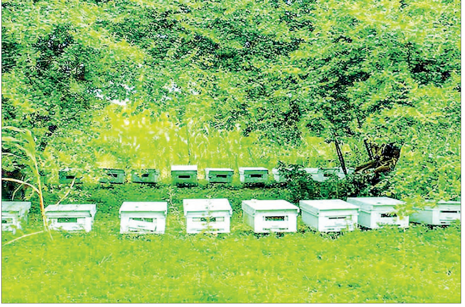
Beehives are seen in a row under plum plants. Myanmar exported 1,853.74 tonnes to foreign markets by sea and 63.44 tonnes to neighbouring countries through land borders.

MYANMAR shipped more than dalay Region, Magway Region and honey production busi-100 tonnes of honey worth and Shan State. US$0.15 million to foreign mar-