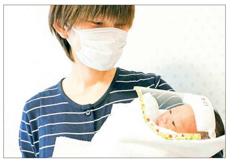
The fertility rate in Japan had recovered to 1.45 in 2015, but has been on a downward trend since 2016.

THE total fertility rate in Japan dropped for the seventh straight year in 2022, government data showed Friday, as the country continues to struggle with a rapidly declining birthrate.