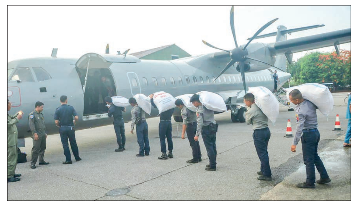
Rice bags are seen being loaded aboard the Tatmadaw aircraft to transport them to Mocha-battered areas yesterday.

THE Tatmadaw has sent a group of aid and relief teams to areas affected by natural disasters and is carrying out the necessary aid and relief operations.