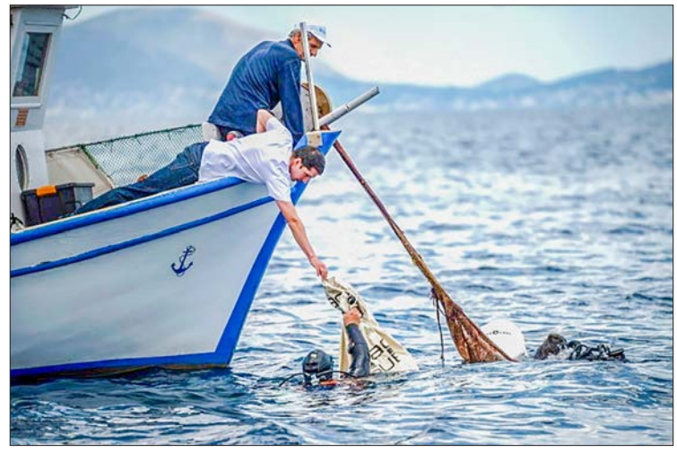
Volunteers collect ghost nets under the water during a clean-up operation.

THE fish market of Keratsini, west of Athens, is abuzz in the early morning, with trawlers disgorging crates of sardines and anchovies as trucks await nearby to be loaded.