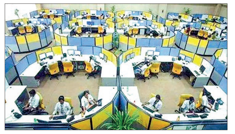
IT Support Centre in India.

The South Asian nation is the world's fifth-largest economy, and recently surpassed China to become the most populous country.