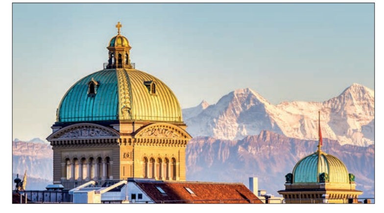
The dome of the Swiss parliament (Bundeshous) in Bern, with Mt. Eiger in the background.

SWITZERLAND'S lower house of parliament on Thursday voted against a proposal that would have specifically authorized the transfer of Swiss-made arms to Ukraine.