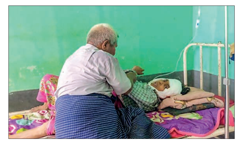
The injured is undergoing treatment at Mawlamyine General Hospital.