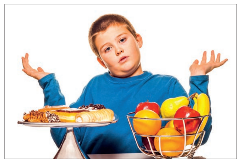
Unhapithy diate have been strongly linked to the development of

"We know many students consume high-calorie meals along with sugary foods and drinks and there is lots of evidence to show those kinds of eating behaviours can lead to obesity," says Bottorff. "These are not the only habits that lead to obesity, but they are important and can't be ruled out."