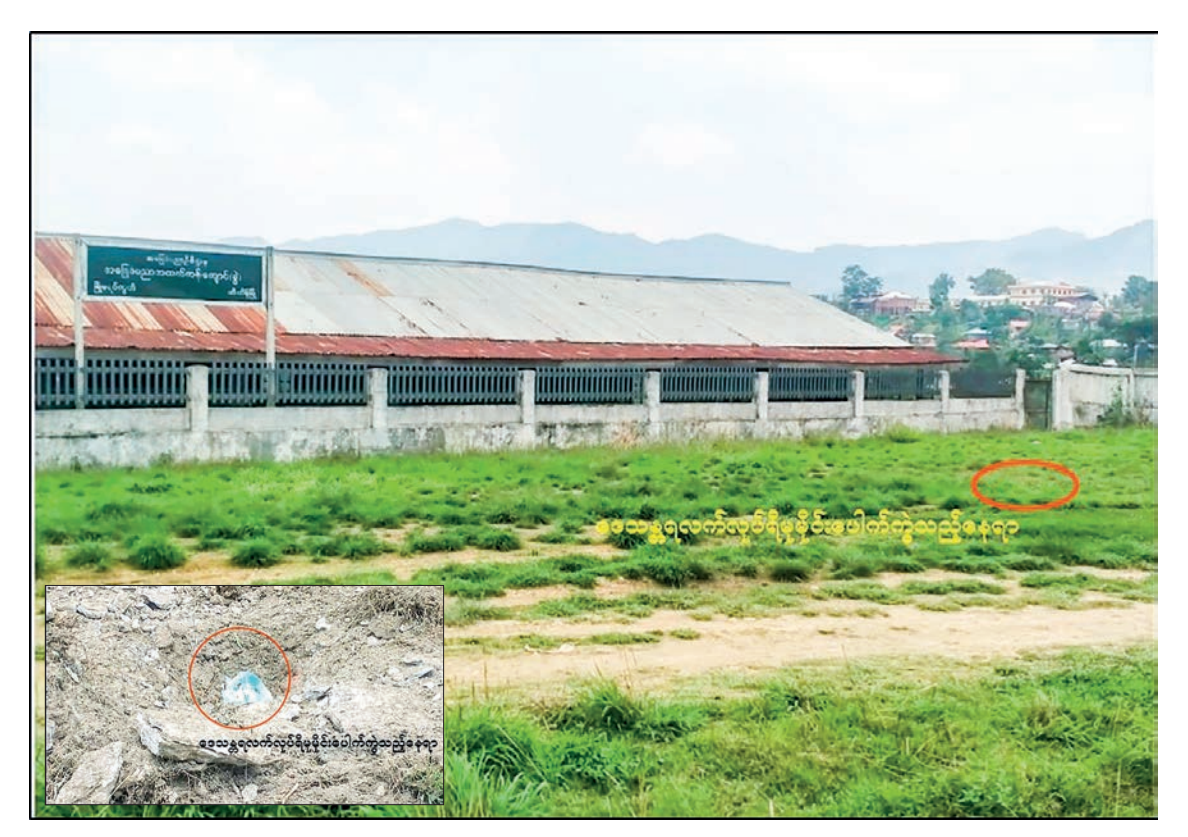
The photo shows the location site where two handmade mines exploded near the BEHS (Myoma) in Tiddim.

The security forces are working together with the public to arrest and identify those who detonated the mines to protect schoolchildren for their peaceful learning. — MNA/KZL