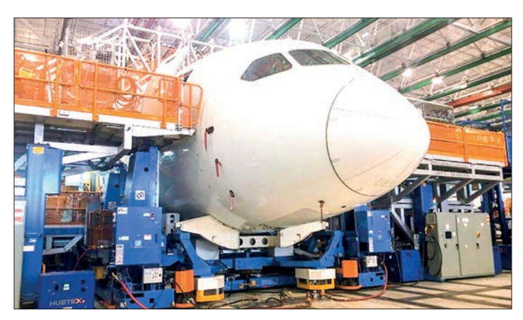
Boeing builds its 787 Dreamliner planes at a hanger in South Carolina.

AS airlines seek to fulfill customers' growing post-pandemic appetites for long-haul travel,