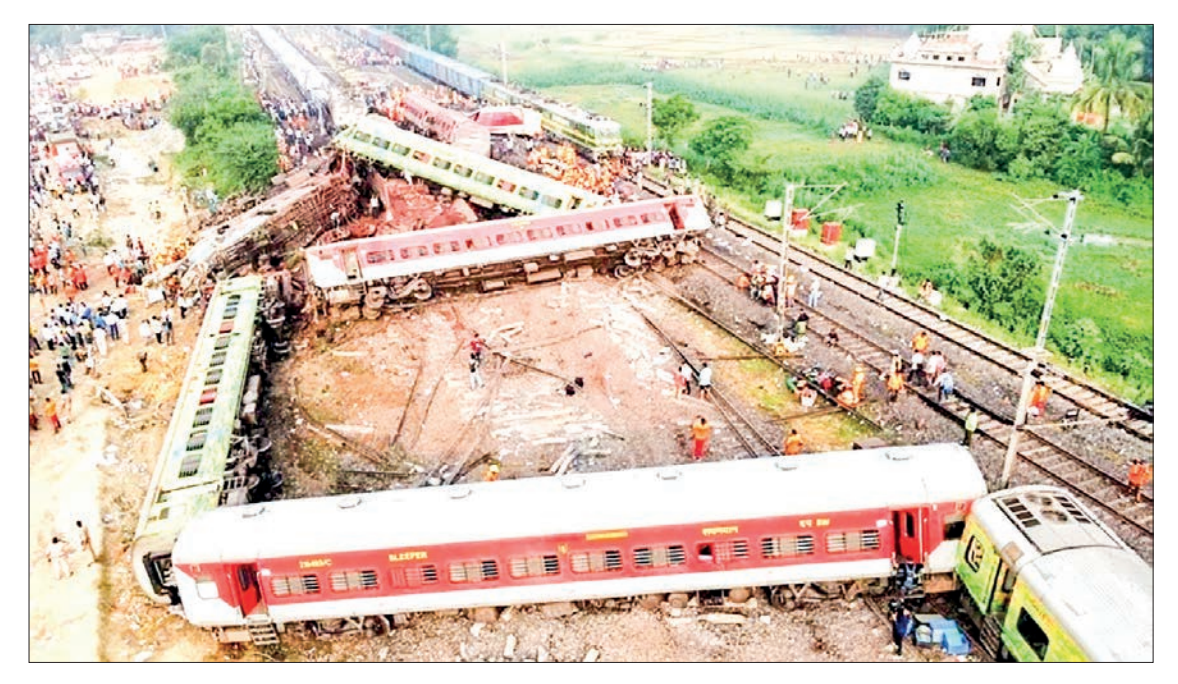
At least 288 people were killed and more than 850 injured in a horrific three-train collision in India.

INDIA'S Railway Minister said on Sunday the cause and people responsible for the country's worst train crash in decades had been identified, pointing to an electronic signal system without giving further details.