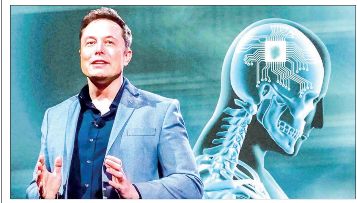
The aim of Neuralink implants is to enable human brains to communicate directly with computers.

LON Musk's start-up Neu-said in a post on Musk-run Twitter. to be extremely careful and cerralink on Thursday said it has gotten approval from