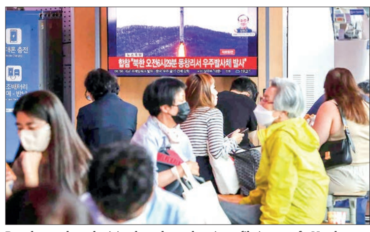
People watch a television broadcast showing a file image of a North Korean rocket launch at the Seoul Railway Station on 31 May in Seoul.

public of Korea, North Korea's formal name.