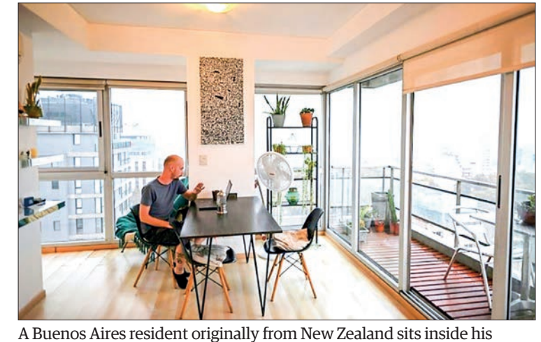
rented modern apartment in the sought-after neighbourhood of Palermo.