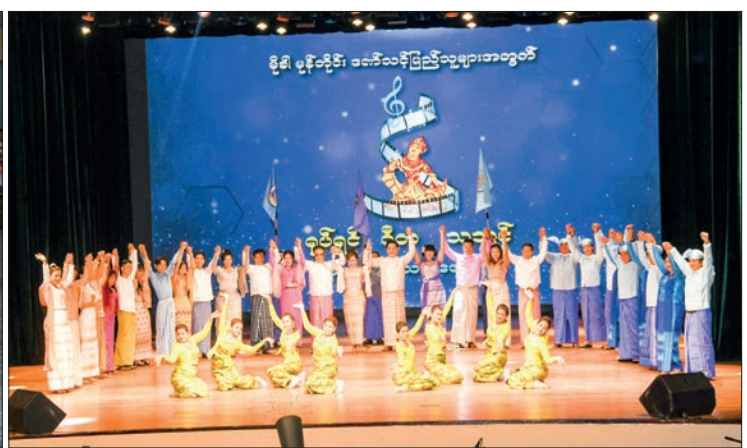
Artistes perform songs and dance entertainments at fundraising concert for Mocha-hit victims at National Theatre in Yangon on 4 June.

THE fundraising concert for Mocha victims has been held since 2 June, and yesterday, on the final day, a large crowd enjoyed the concert.