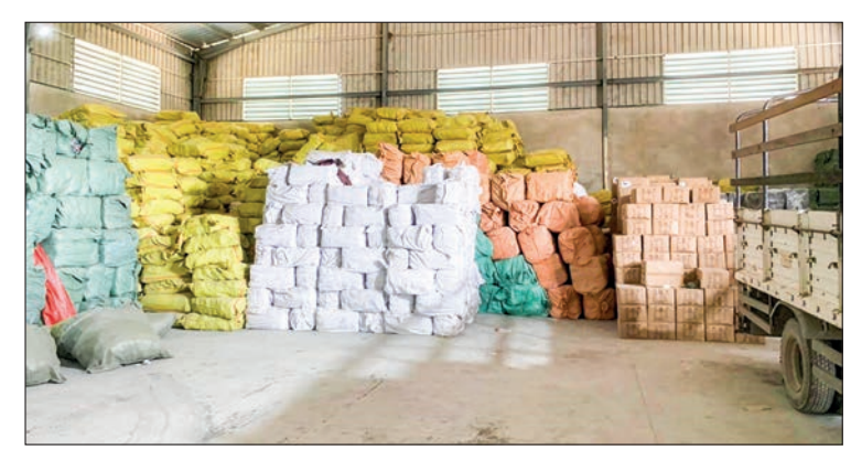
Illegal foodstuffs and consumer goods seized Mandalay-PyinOoLwin Road on 30 and 31 May.

Therefore, 10 arrests (estimated value of K265,448,505) were made on four consecutive days from 28 to 31 May, according to the Illegal Trade Eradication Steering Committee. — MNA/MKKS