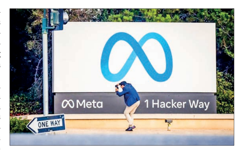
The situation surrounding the relationship between tech platforms and news publishers is constantly evolving, and specific regulations may vary by jurisdiction.

The bill is designed to support local news organizations, which have been decimated in recent years as ad revenue bled away to Google and Facebook, both advertising behemoths.