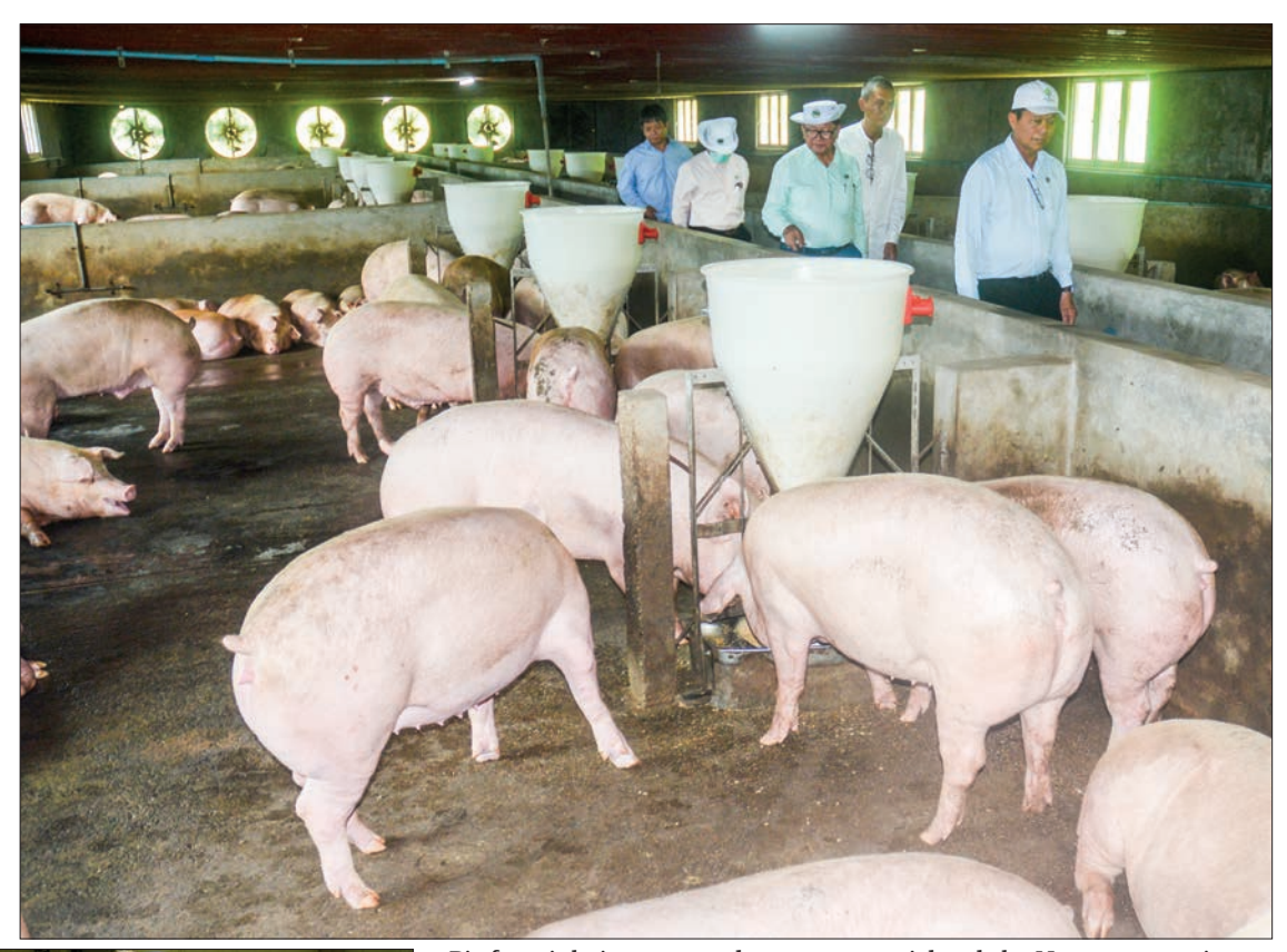
Pig farm is being operated on a commercial scale by Ngasutaung private pig farm in Yangon Region.

As part of efforts to meet the local livestock demand, Ngasutaung private pig farm in Yangon Region produces piglets and distributes pedigree species to local pig farmers. As an innovative measure, the farm generates electricity with the