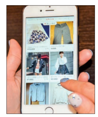
Flea market apps are mobile applications that provide a platform for buying and selling secondhand or used goods.

tions in February grew 3.2 times from a year ago due to the weaker yen and an increase in its partners operating e-commerce sites that overseas buyers can use to purchase goods listed on the Mercari flea market app. — Kyodo