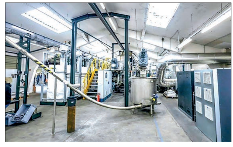
Biochar is produced by heating cocoa bean husks in an oxygen-free room to 600 degrees Celsius (1112 Fahrenheit).

AT a red-brick factory in the German port city of Hamburg, cocoa bean shells go in one end, and out the other comes an amazing black powder with