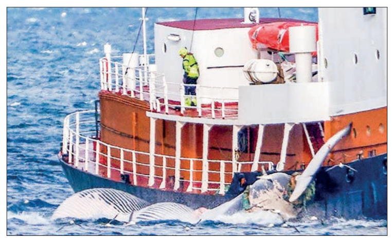
Iceland, Norway and Japan are the only countries that authorize whaling. PHOTO: AFP/FILE

The country's fisheries minister announced in February 2022 that the government planned to stop issuing whaling quotas as of 2024. — AFP