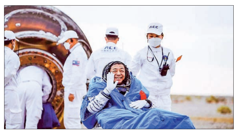
Taikonaut Deng Qingming waves as he leaves the capsule of the Shenzhou-15 spaceship after landing in China's Inner Mongolia on 4 June 2023.

China launched the manned spaceship Shenzhou-15 on 29