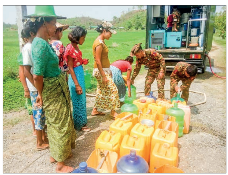
Purified drinking water being distributed to locals in Kyauktaw on 4 June.

Specialist medical teams, under the Directorate of Medical Services together with the local medical teams gave medical treatments to the locals in Sittway at the local medical battalion.