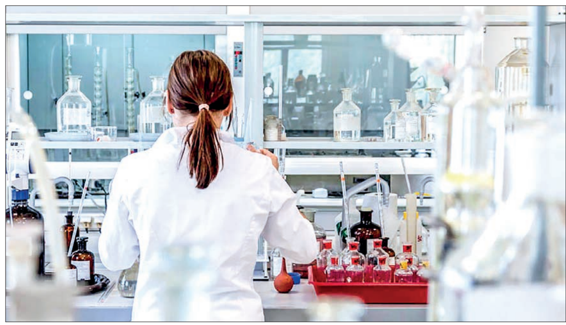
New technology, developed by a team at China's Guangdong University of Technology, takes advantage of a specifically designed bacteria to target and rapidly replicate itself within the tumors.

"The strong methionine requirement is almost a universal feature for all types of tumours, and cancer cell metastasis is the leading cause to shorten lives in