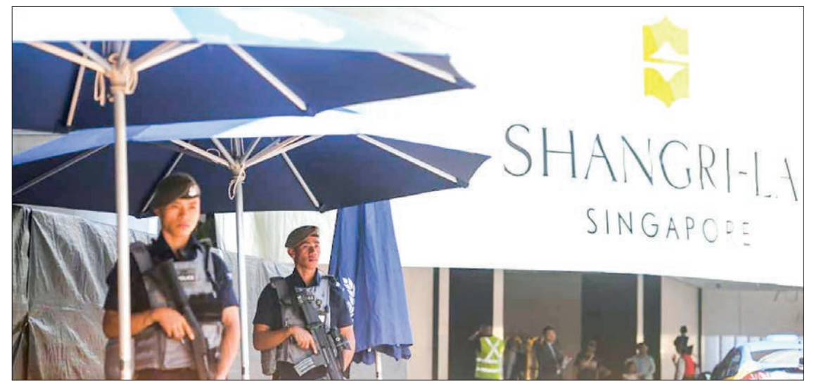
Policemen stand guard near the venue of the 20th Shangri-La Dialogue at Singapore's Shangri-La Hotel on 2 June 2023. The 20th Shangri-La Dialogue is to be held here from Friday to Sunday, with a focus on identifying challenges and exploring solutions to security across the Asia-Pacific region.

The Chinese defence minister put forward a four-point proposal on how to pursue security