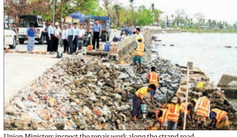
Union Ministers inspect the repair work along the strand road in Sittway yesterday.

The maintenance of the 230 kV power cable is completed by 93 per cent for the An-Mrau-kU-Ponnagyun section while 100 per cent for the 66 kV power cable of the Ponnagyun-Sittway section. Therefore, the electricity will be transmitted to Sittway