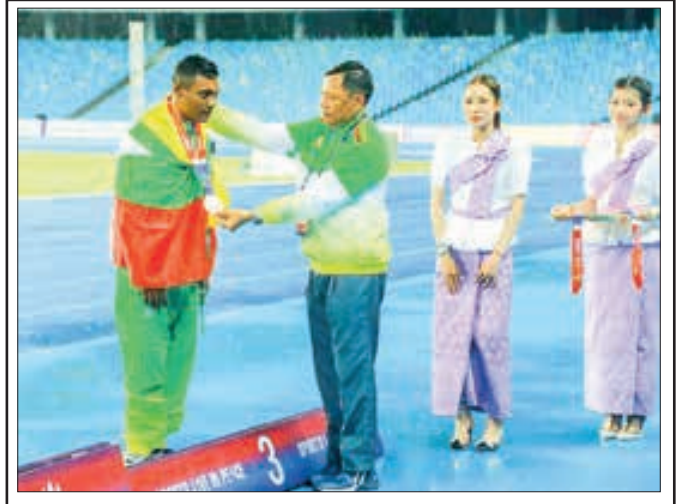
One of the Myanmar's gold medallists receives the medal in the XII ASEAN Paralympic Games.