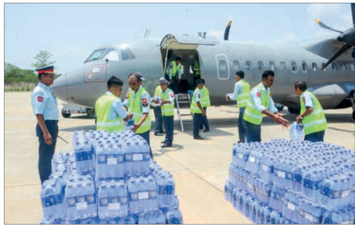
Relief goods are loaded aboard the Tatmadaw aircraft to deliver them to Mocha-hit areas yesterday.

Officials in the respective areas received relief items and will distribute them to storm victims.