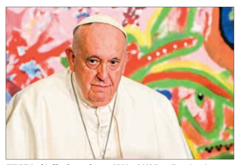
(FILES) In this file photo taken on 25 May 2023 Pope Francis arrives to take part in the "Eco-Educational Cities" conference organized by Scholas Ocurrentes and aimed at promoting education and sustainability on 25 May 2023 at the Augustinian Patristic Pontifical Institute in Rome.

POPE Francis visited a Rome hospital for a medical check-up