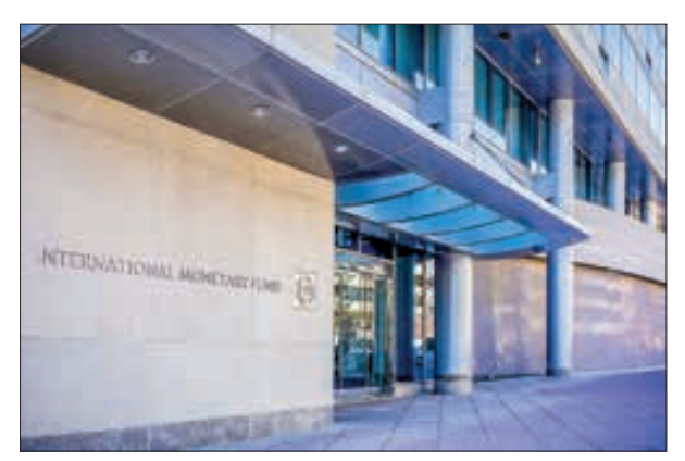
The International Monetary Fund (IMF) headquarters building is seen in Washington, DC on 11 March 2022. PHOTO: AFP

China's squeeze on civil rights in Hong Kong, which led to the UK relaxing entry rules for holders of British overseas passports, also had an impact. — AFP