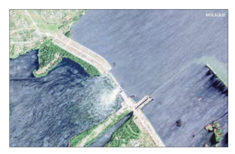
This handout satellite image shows an overview of the Nova Khakovka dam in south Ukraine, on 5 June 2023.

THE head of the International Atomic Energy Agency (IAEA) excluded immediate risk to the safety of the Zaporizhzhia nuclear power plant on Tuesday after the Kakhovka hydroelectric pow-