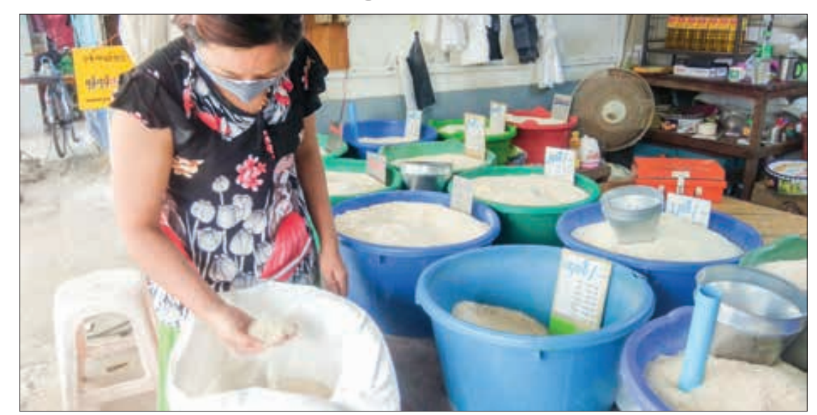
Varieties of rice are organized for sale at the rice outlet in Yangon.

THE price of Shwebo Pawsan rice continued to surge to K110,000 per bag following the rise in paddy price, according to the Wahdan Rice Wholesale Centre. Shwebo Paddy's price climbed to K3 million per 100 baskets.