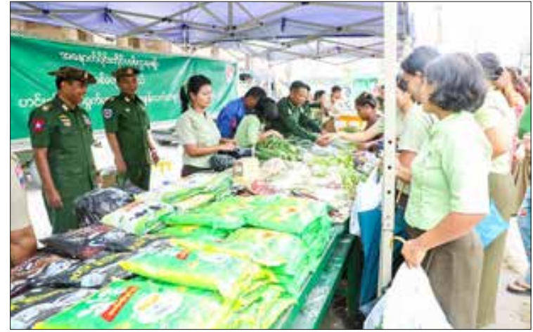
Sittway locals seen purchasing foodstuffs at fairer prices yesterday.

Lt-Gen Phone Myat from the office of the Commander-in-Chief (Army) and Commander of the West Command Maj-Gen Htin Latt Oo personally viewed the sale.