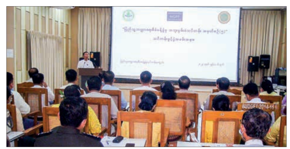
Deputy Prime Minister U Win Shein opens the Public Financial Management Special Refresher Course No 5 yesterday.

The No 5 Public Financial Management Special Refresher Course was attended by planning and finance in-charge persons at the central level and ministerial level totalling 40 trainees and training will last four weeks. — MNA/TS