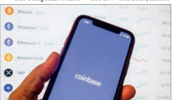
(FILES) This illustration file photo shows the Coinbase logo on a smartphone in Los Angeles on 13 April 2021.

on the heels of Securities and Exchange Commission (SEC) charges filed Monday against cryptocurrency exchange Binance and founder Changpeng Zhao for numerous securities law violations, includ-