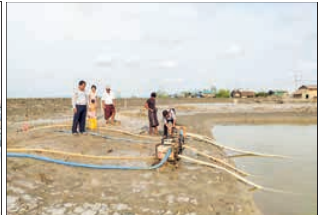
Relief and \ rehabilitation \ measures \ such \ as \ the \ repair \ of \ electric \ cables, \ distribution \ of \ purified \ water \ and \ desalination \ process \ at \ lakes \ are \ underway \ in \ Sittway \ Township \ yesterday.