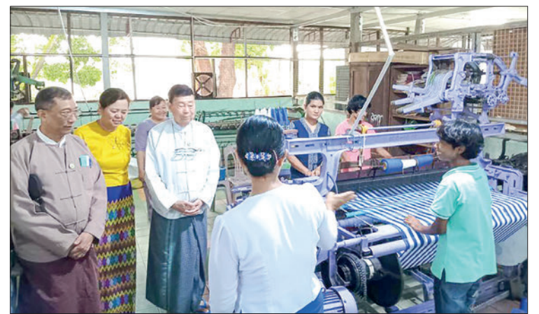
The MNHRC members view the activities of the Women Development Department in Yangon yesterday.

dormitories, issuance of citizen scrutiny cards, availability of clean drinking water, access to education, communication with family, right to family reunification, access to vocational education and protection of fundamental human rights such as religious freedom for the trainees under the care of the department. — MNA/KZW