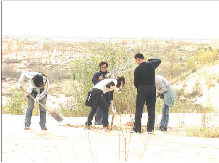
Japanese volunteers and local residents plant trees together in the Mu Us Desert in China's Inner Mongolia in October 2009.

A Japanese entrepreneur who once taught in a school in China's Inner Mongolian Autonomous Region has spent the past two decades helping local people tackle the problem of desertification through greening projects, aiming to give something back to a place he considers his "second home".