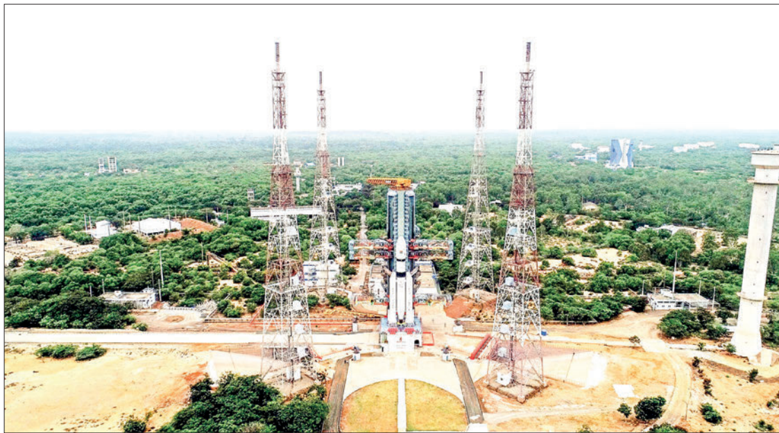
Indian Space Research Organization (ISRO) completes the 'launch rehearsal' for Chandrayaan-3, which will be launched from Satish Dhawan Space Centre, Sriharikota, on 14 July.

This time around, there is optimism that the Indian Space Research Organization (ISRO)