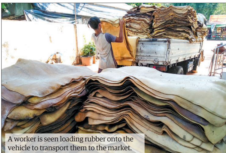
A worker is seen loading rubber onto the vehicle to transport them to the market.

Myanmar bagged more than US$449 million in revenue in rubber exports in the financial year 2020-2021. — NN/EM