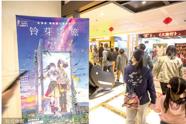
Moviegoers enter a cinema in Shanghai on 5 April, 2023.

box office earnings had amounted to 7.4 billion yuan thus far. The total revenue generated during the three-month period in 2022 and 2021 was 9.14 billion yuan and 7.38 billion yuan, respectively. Currently, the top two spots on China's summer box office chart belong to the Chinese suspense crime film "Lost in the Stars" and drama film "Never Say Never", also known as "Octagonal", with respective earnings of 3.18 billion yuan and 1.04 billion yuan to date. — Xinhua