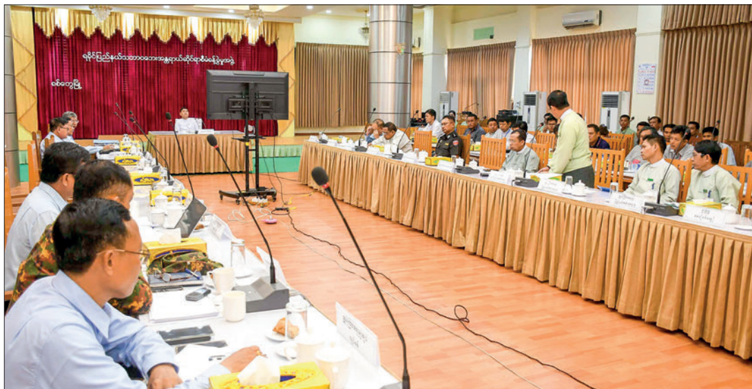
The coordination meeting on livestock farming development in Rakhine State underway yesterday in Sittway.

THE coordination meeting on livestock farming development in Rakhine State was held at the state government office yesterday morning in Sittway.