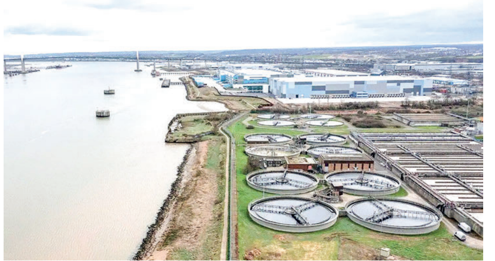
An aerial view shows the Thames Water Long Reach water treatment facility on the banks of the Thames estuary in Dartford, east of London, on 3 March 2023.

POLLUTING companies will be liable for unlimited fines as a result of a UK government decision to lift the current £250,000 ($320,000) ceiling on penalties.