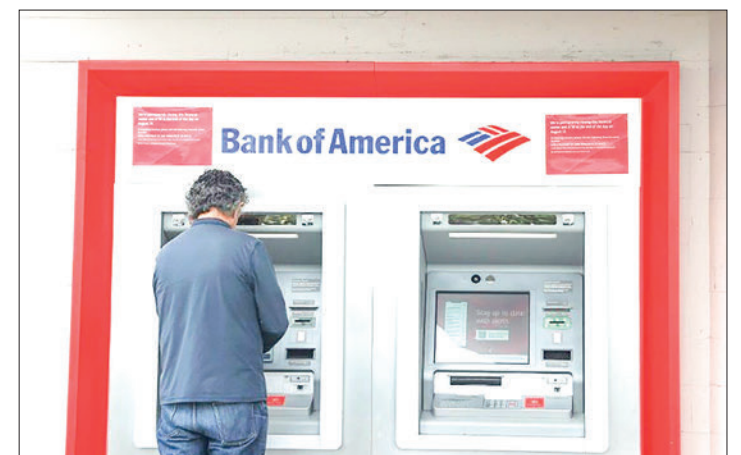
Regulators ordered $250 million in fines and restitution from Bank of America over violations of banking consumers. PHOTO: AFP/FILE

Nahel had Algerian roots, and the killing rekindled long-standing accusations of systemic racism in France. — AFP