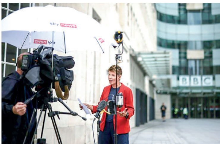
The scandal has now been frontpage news and the lead story on radio and television news bulletins for six successive days.

ca editor Jon Sopel, meanwhile, described the star at the centre of the scandal as “extremely angry” over how the story had unfolded. “It is fair to say that the presenter at the heart of this