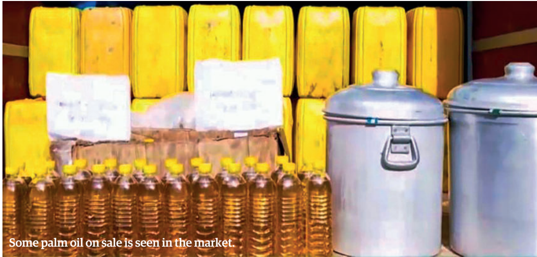
Some palm oil on sale is seen in the market.

SOME brokerage houses in the Bayintnaung market have resumed selling palm oil at the retail reference price, leading to daily queues of people eager to purchase it. However, U Win Soe from Yaytama Road mentioned that the queues had disappeared for several months due to a slight price difference between the retail reference price and the market price of palm oil.