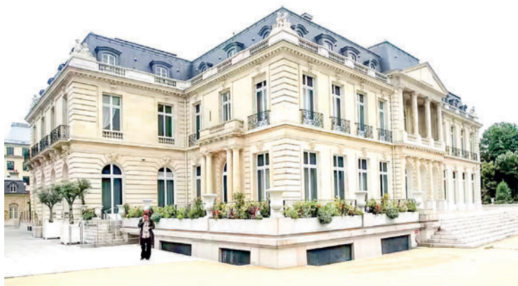
The Organization for Economic Co-operation and Development (OECD) is an intergovernmental organization with 38 Member countries, founded in 1961 to stimulate economic progress and world trade.