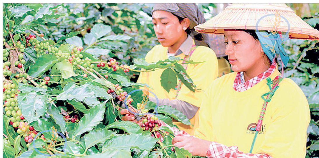
Two workers are seen harvesting coffee beans.

Myanmar's coffee export bagged US$2.5 million per year, the association stated. — TWA/EM