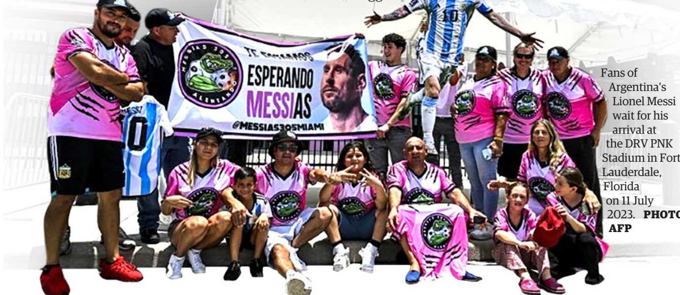
Fans of Argentina's Lionel Messi wait for his arrival at the DRV PNK Stadium in Fort Lauderdale, Florida on 11 July 2023.