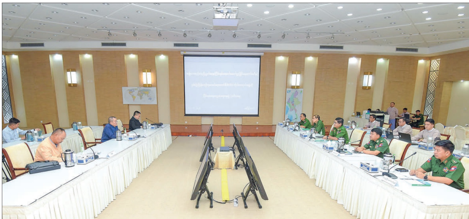
The second-day meeting between the National Solidarity and Peacemaking Negotiation Committee and the Restoration Council of Shan State in progress yesterday in Nay Pyi Taw.

THE second-day peace talks between the National Solidarity and Peacemaking Negotiation Committee-NSPNC and the delegation of the Restoration Council of Shan State-RCSS was held yesterday morning at the National