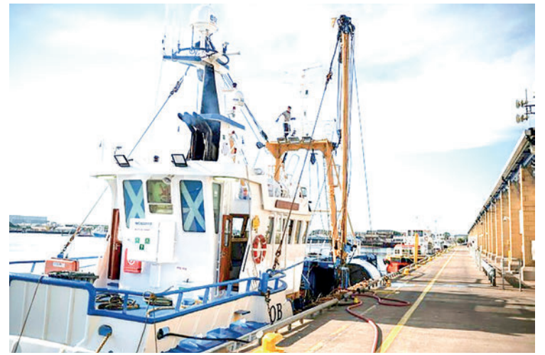
In the mid-20 th century, Grimsby was one of the world's leading fishing ports, until the fleets of trawlers began to disappear in the 1970s. PHOTO: AFP

"The French and the Spanish come to the UK, fish our fish, and then they take it home, process it and sell it back to us," he told AFP. — AFP