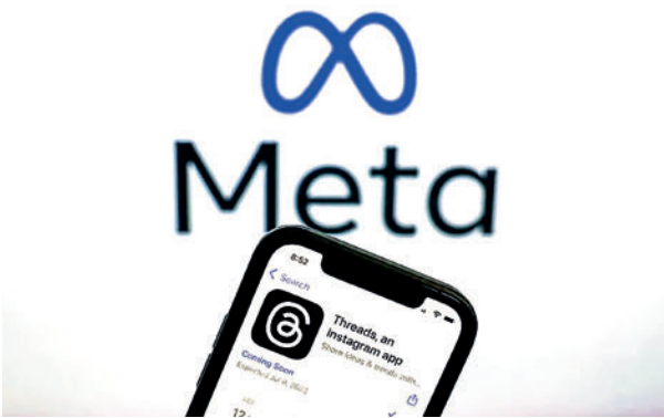
Facebook behemoth Meta officially will launch Threads, its text-based rival to Twitter.

the Digital Markets Act, an antitrust regulation that will not come into force until next year. — AFP