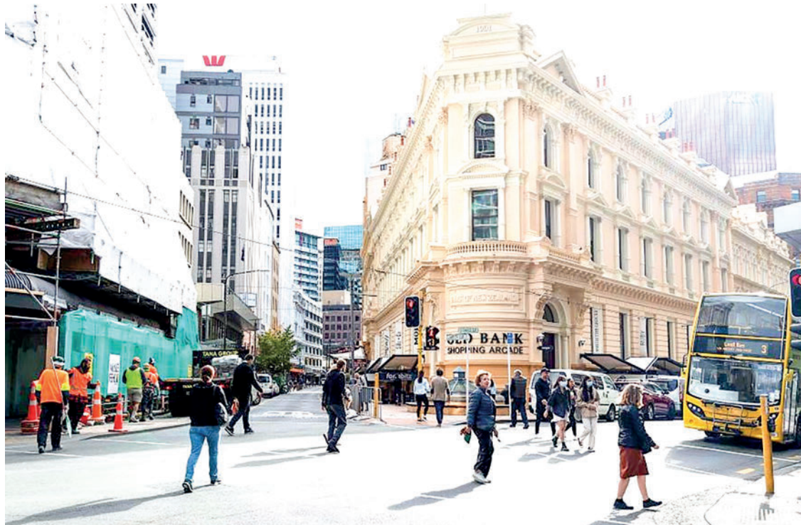
This is New Zealand's first recession since 2020, when the pandemic shuttered borders and choked exports.