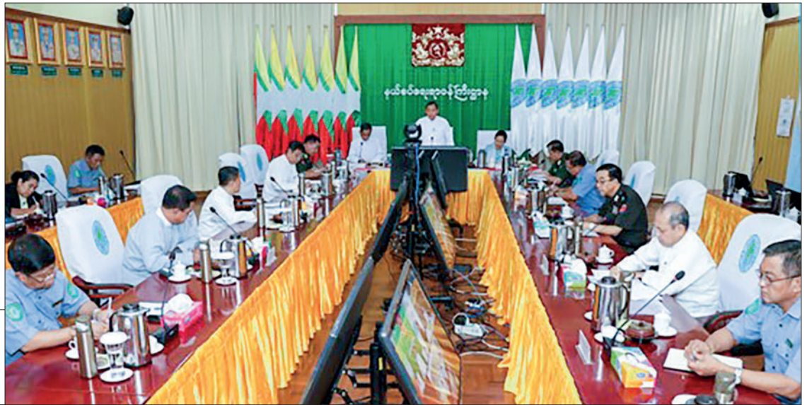
The meeting of Core Working Group of Rakhine State Stability, Peace and Development Work Coordination Committee in progress yesterday, chaired by Union Minister Lt-Gen Tun Tun Naung.

The committee chairman and vice-chairpersons offered instructions and concluded the meeting. — MNA/KTZH