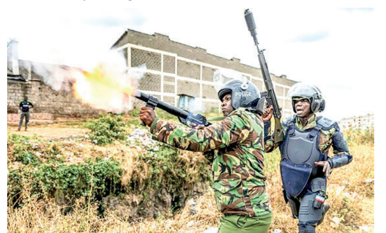
Tax demo: A police officer firing tear gas to disperse protesters in Nairobi.