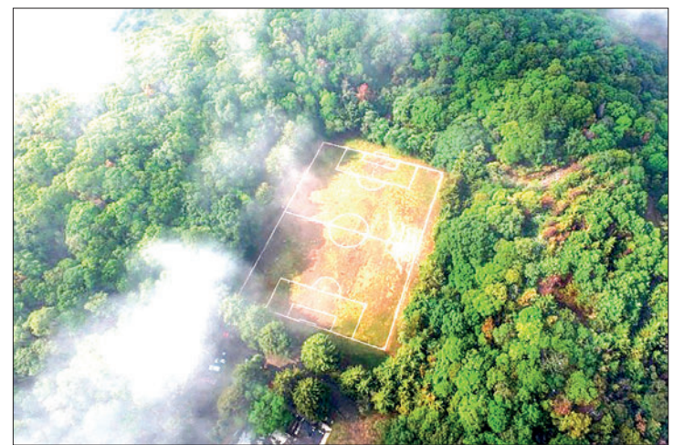
About 10 teams play football on weekends in the crater of the inactive Teoca volcano on the outskirts of Mexico City.

"They used to carry me up here when I was a child," he added. — AFP