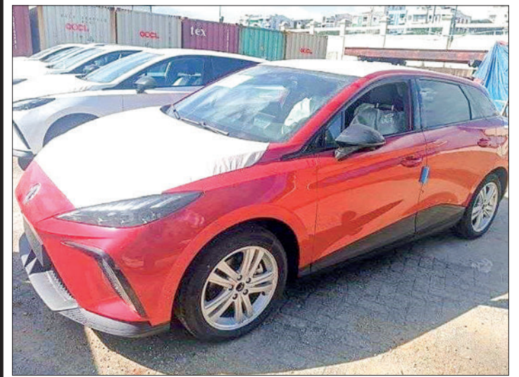
The photo shows new arrivals of battery electric vehicles (BEVs) at Yangon Port.

These vehicles were legal for claiming following the required procedures, and the import of these EVs is exempted from Customs duties.