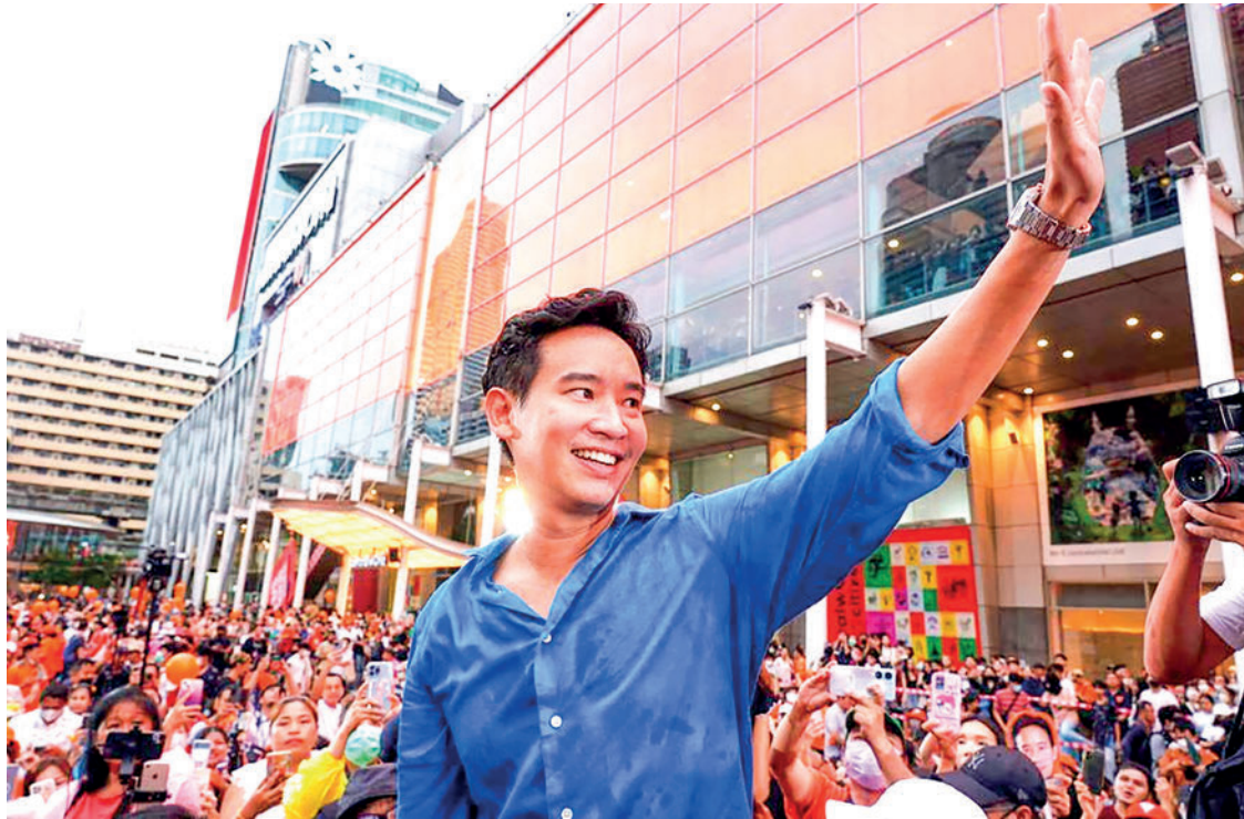
The recommendation is the latest hurdle thrown into the path of the progressive candidate, whose Move Forward Party (MFP) scored the most votes in May's election by tapping into Thais' appetite for change.

While popular among voters, Pita's bid for the premiership faces stiff opposition over his plans to amend Thailand's royal defamation laws, which protect King Maha Vajiralongkorn and his family. Following the commission's announcement, MFP