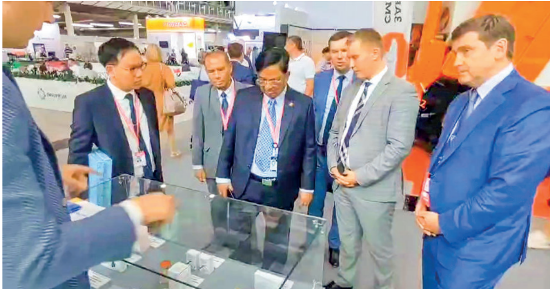
Union Minister Dr Charlie Than views the display at the Innoprom International Industrial Exhibition in the Russian Federation on 11 July.