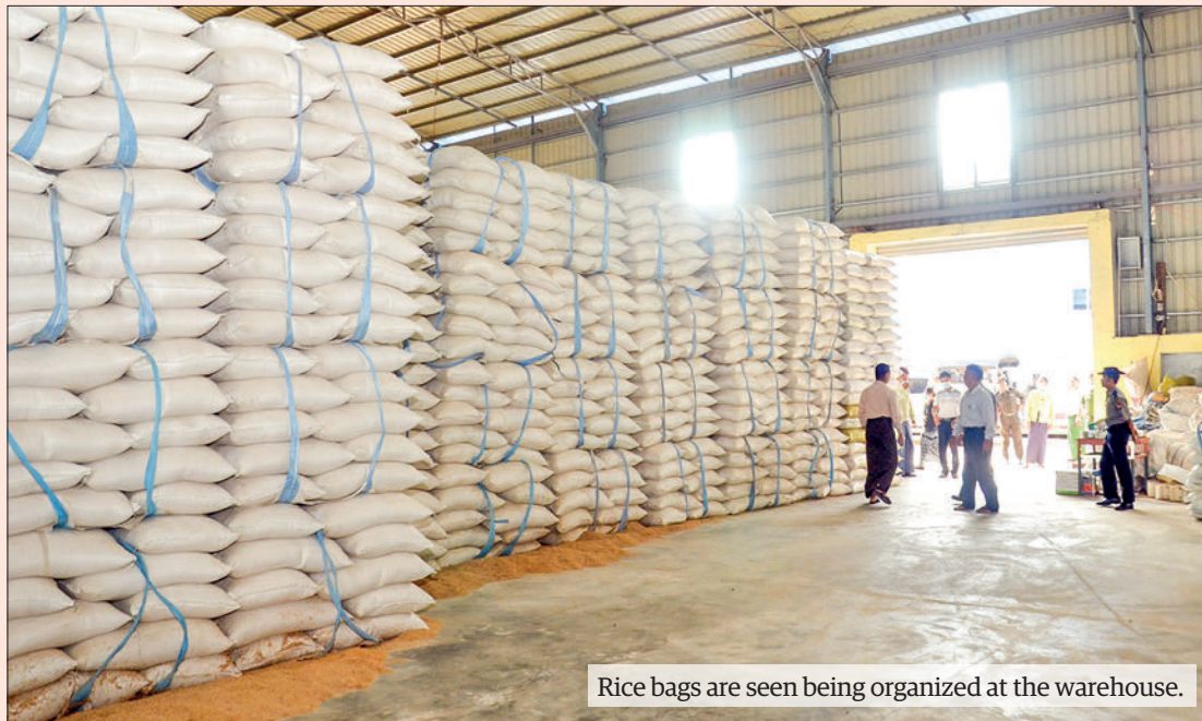
Rice bags are seen being organized at the warehouse.

“The export volume to China falls a little. But we are still exporting to China. It is very rare to export to Yunnan via the border. There are various reasons for such cases. The main reason is that the price is high locally. It can be due to 65-35 cases. But it is not just for that case. The local prices are on the rise and the local rice prices are high as the number of people who store the products are increasing. The number of hoarders is high as they intend to resell at high prices. It also exports to Guangzhou and other Chinese ports from Yangon via sea. Then, it is also in the rainy season. Normally, I think it can