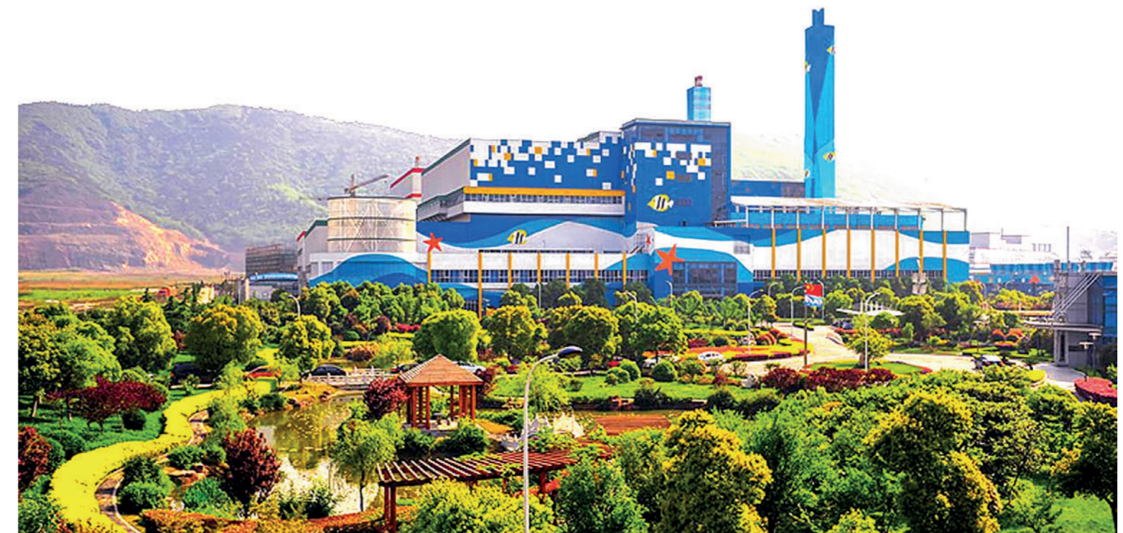
Turning municipal solid waste into energy through the waste-to-energy process is one of the popular strategies of solving the rise of generated waste. A waste-to-energy plant in Suzhou, People's Republic of China has helped create better living conditions in the city.

Mass burning or incineration is an example of combustion technology. Here, waste is burned at very high temperatures in special facilities. This creates energy for electricity and heating, as well as for the process itself. According to the United States Environmental Protection Agency, the country currently has 75 combustion facilities, located in 25 states. While in Denmark, bioenergy is "The most