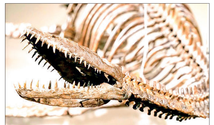
The mounted skeleton of a dinosaur called a plesiosaur is seen on display on 10 July 2023 at Sotheby's in New York.

With its small head, long neck and flippers, the plesiosaur lived in the Lower Jurassic period about 190 million years ago. "The history of the Plesiosaur is also intertwined with the elusive Loch Ness monster of Scottish folklore, as many have drawn morphological comparisons between the Plesiosaur and the infamous 'Nessie,' whose sightings stretch back to the sixth century," Sotheby's said in a news release. — AFP