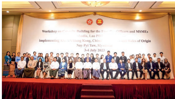
Participants of Workshop on ASEAN-Hong Kong (China) FTA Tariffs and Rules of Origin seen in group photo on 3 July.