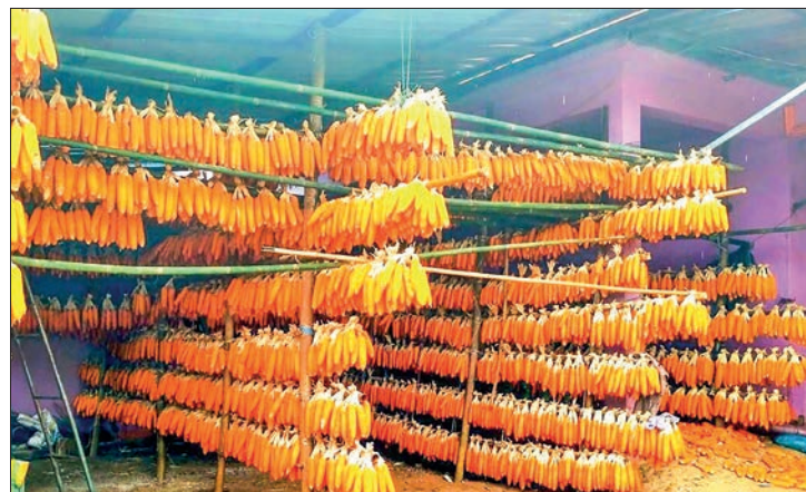
Corns are kept in warehouse for dryness.