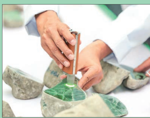
An assessor checks quality of jade stone.