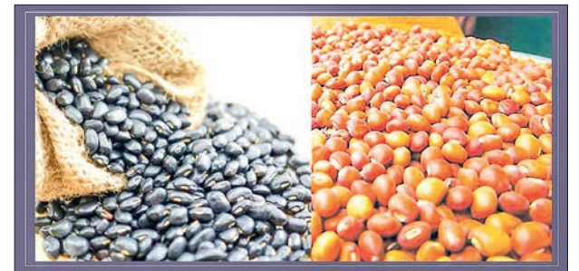
A photo shows sample of black gram and pigeon pea in Yangon's pulses and beans market.

As a result of this, the pulses demanded by India have grown. The pulses imported from eastern African countries will arrive in India in August. The price of pigeon pea (tur) was around Rs 12,500 per quintal. The FOB prices decreased to $935-955 per tonne of black gram (urad in India) and $1,180-1,200 per tonne of pigeon pea on 3 July. — TWA/EM