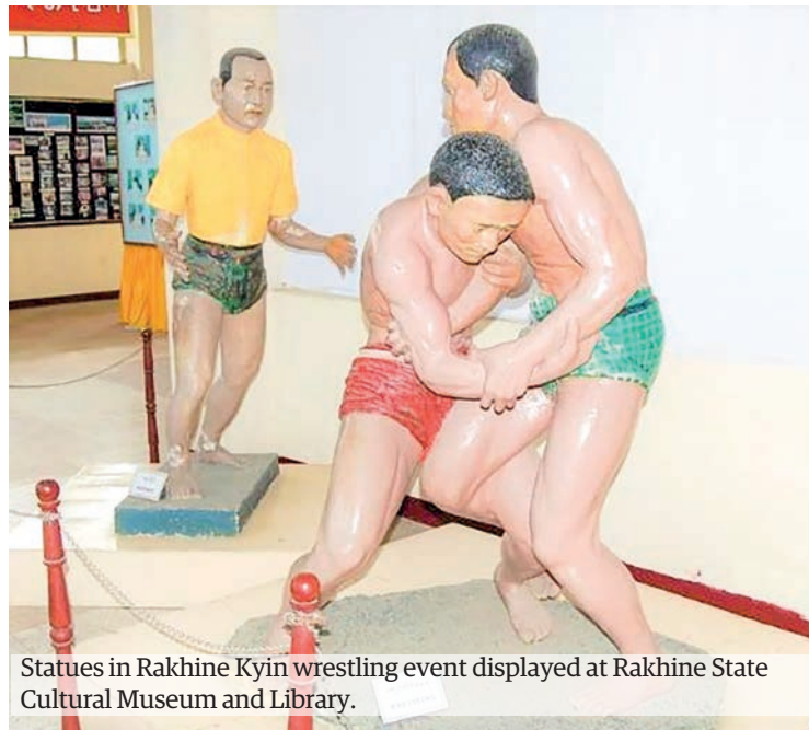
Statues in Rakhine Kyin wrestling event displayed at Rakhine State Cultural Museum and Library.

played at the booths of Rakhine ethnic people.