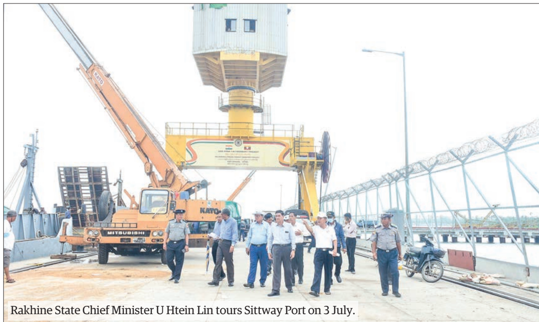
Rakhine State Chief Minister U Htein Lin tours Sittway Port on 3 July.