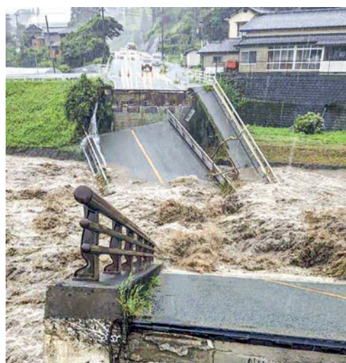
A bridge above a small river running through Yamato, Kumamoto Prefecture, collapses on 3 July 2023, due to heavy rain. (Photo courtesy of Yamato municipal government) PHOTO: KYODO

predicting a long stretch where daily temperatures would exceed 37 degrees Celsius (98 degrees Fahrenheit). — AFP