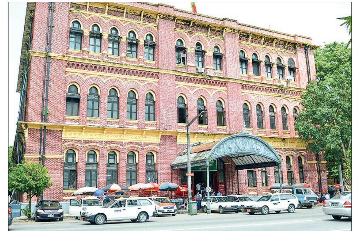
Yangon's General Post Office at the corner of Bo Aung Kyaw Street and the Strand Road. This building was built in 1908. The building has a Beaux Arts portico, and unlike most government buildings, visitors are allowed to enter freely and explore inside. Beaux Arts is a style of architecture that was popular in the late 19 th and early 20 th centuries.

With affordable prices, extensive reach and continuous quality improvements, Myanmar Post would continue to stay relevant for many years to come and be of use to everyone everywhere in Myanmar.