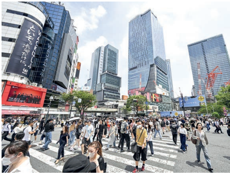
People walk across a scramble crossing in Tokyo's Shibuya district on 28 June 2023.

THE average land price in Japan rose 1.5 per cent in 2023 from a year earlier for the second consecutive year of increase, government data showed Monday, adding to signs of the economy recovering from the coronavirus pandemic.