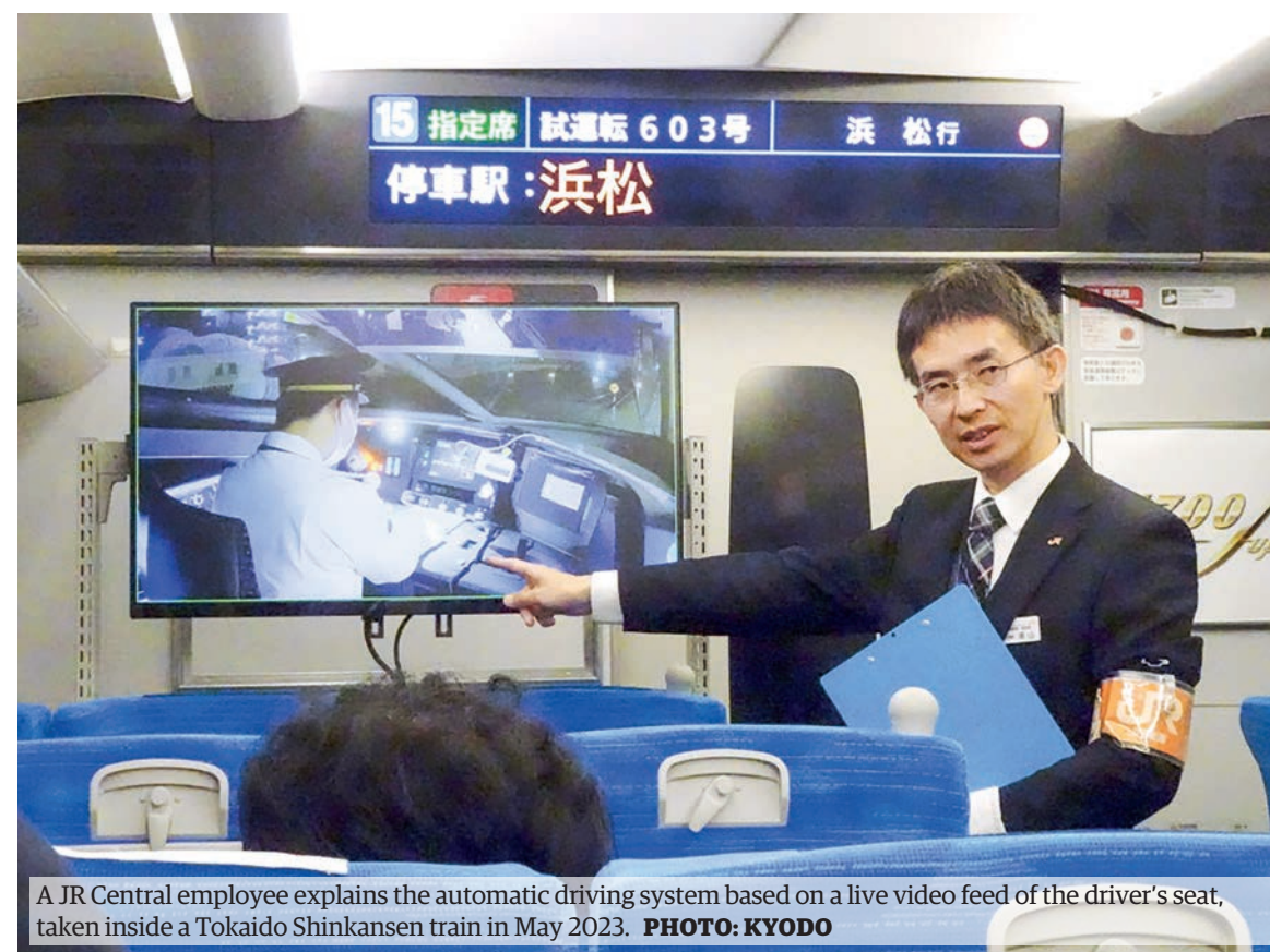
A JR Central employee explains the automatic driving system based on a live video feed of the driver's seat, taken inside a Tokaido Shinkansen train in May 2023.

A UTOMATICALLY operated shinkansen bullet trains could be right around the bend.