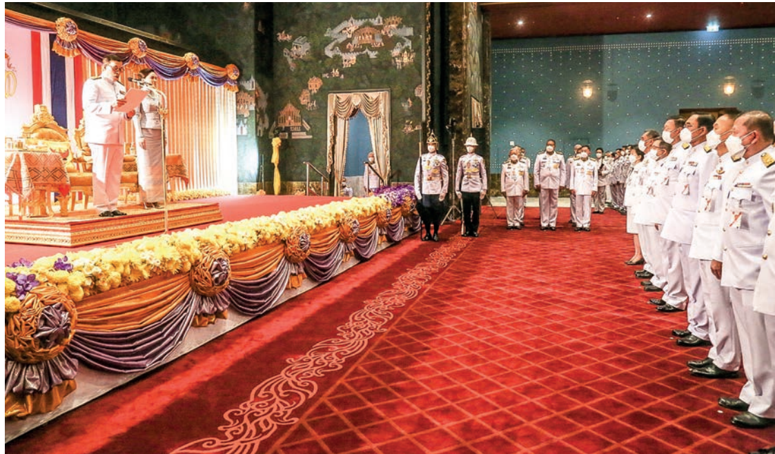
This handout taken and released by Thai Parliament on 3 July 2023 shows Thai King Maha Vajiralongkorn (L), alongside Queen Suthida (2 nd L), as he addresses rows of MPs during the official ceremony to open parliament at Thailand's Parliament in Bangkok.

Following the election on 14 May, Move Forward had hoped