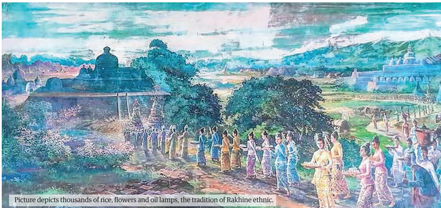
Picture depicts thousands of rice, flowers and oil lamps, the tradition of Rakhine ethnic.