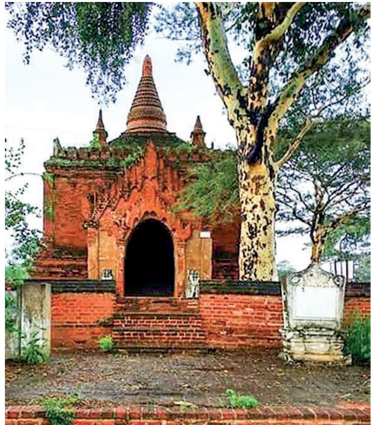
Temple of Thantawkyia Buddha image seen in Bagan ancient cultural region.

west and the temple faces west. It was called Thantawkyia temple as it was constructed at a place where everybody could hear the yawning of the King in the palace.