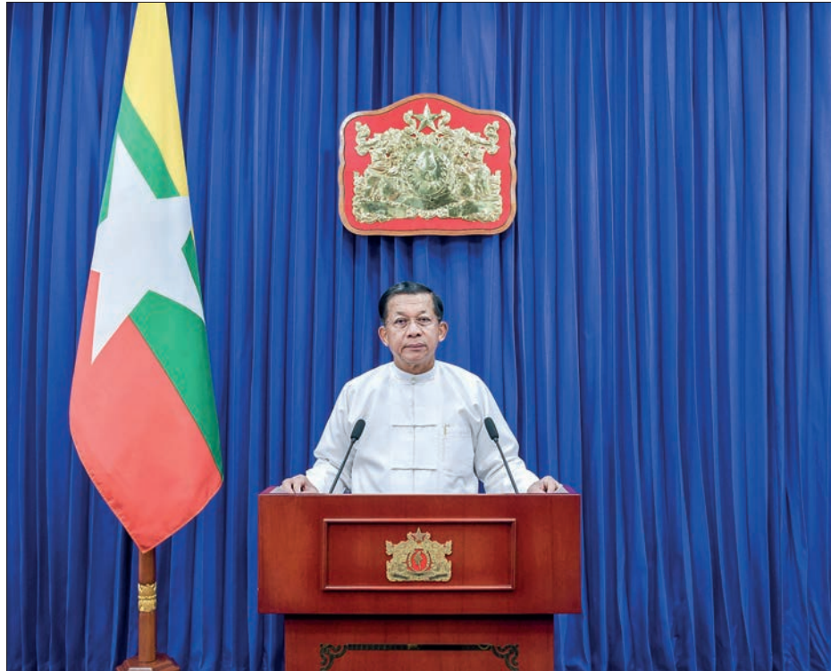
SAC Chairman Prime Minister Senior General Min Aung Hlaing delivers address at Myanmar Women's Day ceremony in video message on 3 July.

Furthermore, the message stated that efforts must be made for all inclusive women to complete learning of KG+9 scheme. The message underscored that a greater encouragement must be given to women for learning