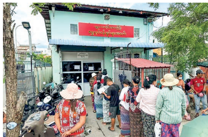
Buyers seen in a queue to purchase gold at MGEA in Mandalay.

With an aim of reducing gold price, the YGEA and Mandalay Region Gold Entrepreneurs Association sold gold bullion supplied by the executive members and the members as well. — NN/EM