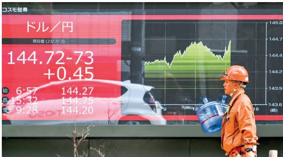
A worker walks past an electronic board showing the rate of the Japanese yen versus the US dollar after the closing session on the Tokyo Stock Exchange along a street in Tokyo on 3 July 2023.

News that the personal consumption expenditures (PCE) index — the Federal Reserve's favoured gauge — had dropped sharply provided some relief for traders after a series of forecast-beating indicators