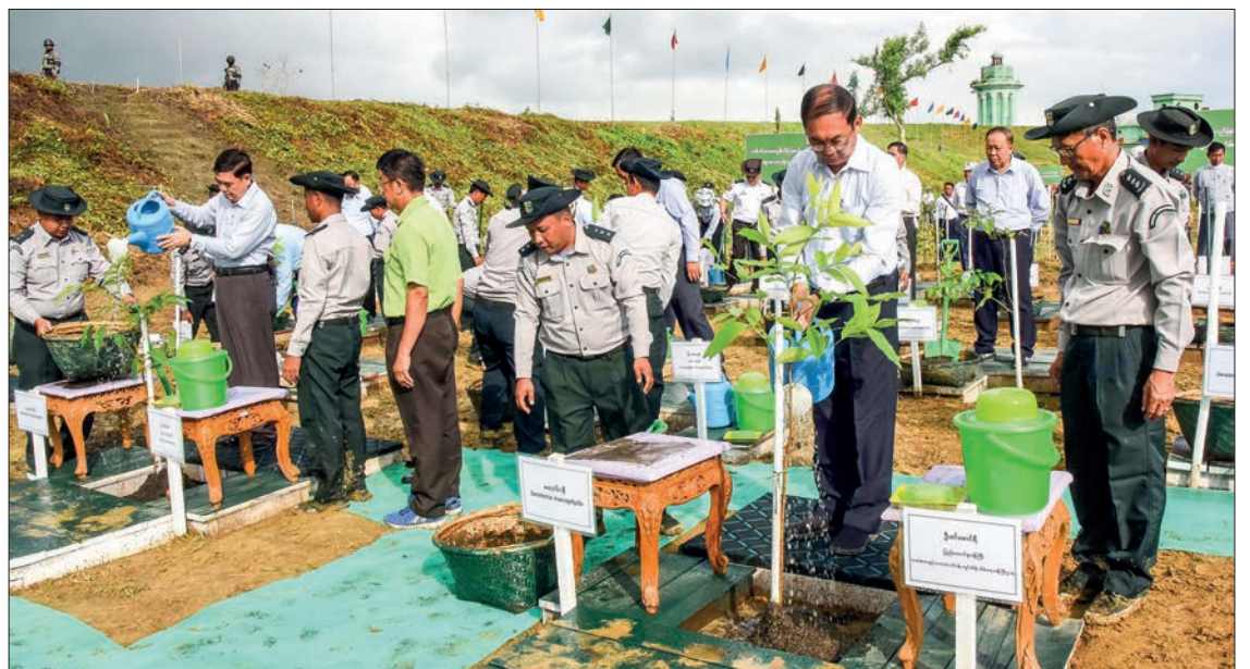
Union Minister U Khin Maung Yi and Rakhine State Chief Minister U Htein Lin join tree-growing ceremony at Kandawgyi Lake in Sittway yesterday.

He viewed the growing of 1,500 mangrove plants at Shukhintha beach in Sittway at the 2023