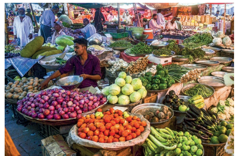
Vendors sell vegetables at a market in Karachi on 3 July 2023.

Pakistan struck a $3 billion standby deal with the International Monetary Fund on Fri-