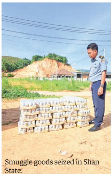
Smuggle goods seized in Shan State.

combined checkpoint, 1,200 cans of Singha beer worth K1.8 million and three kinds of goods worth K3,033,600 including 19 cartons of Fa Thai energy drink near Welayan combined checkpoint and five kinds of goods worth K3.75 million including 50 ownerless table fans near Meyang combined checkpoint. The action was taken under Customs Procedures.