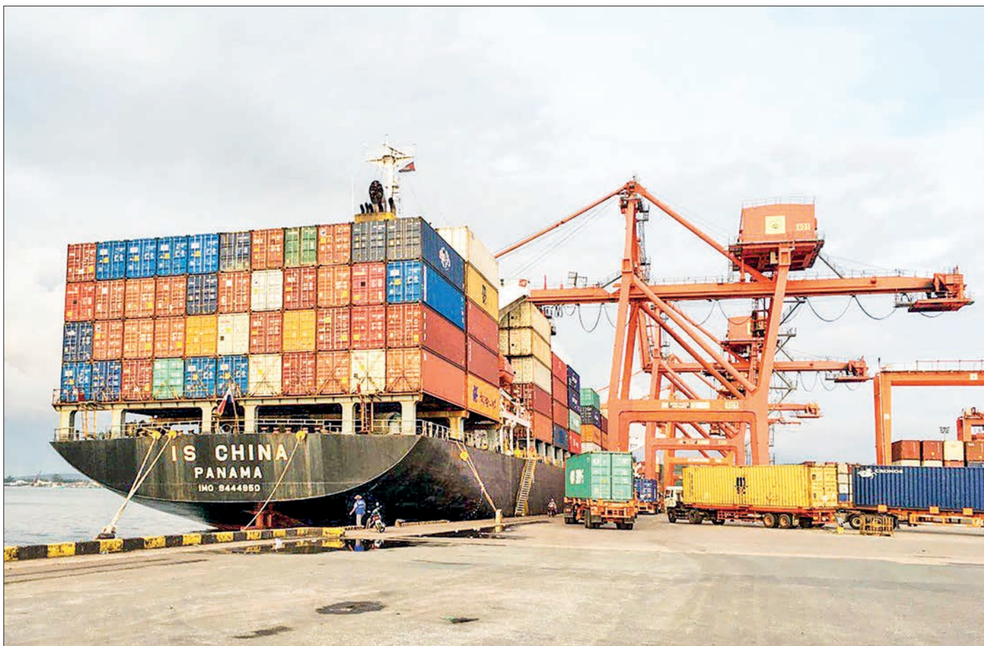
A photo shows unloading of containers from container vessel at Yangon Intl' Port.

M YANMAR'S external trade between 1 April and 23 June of the current Financial Year 2023-2024 tremendously amounted to US$7.37 billion, according to the Ministry of Commerce.