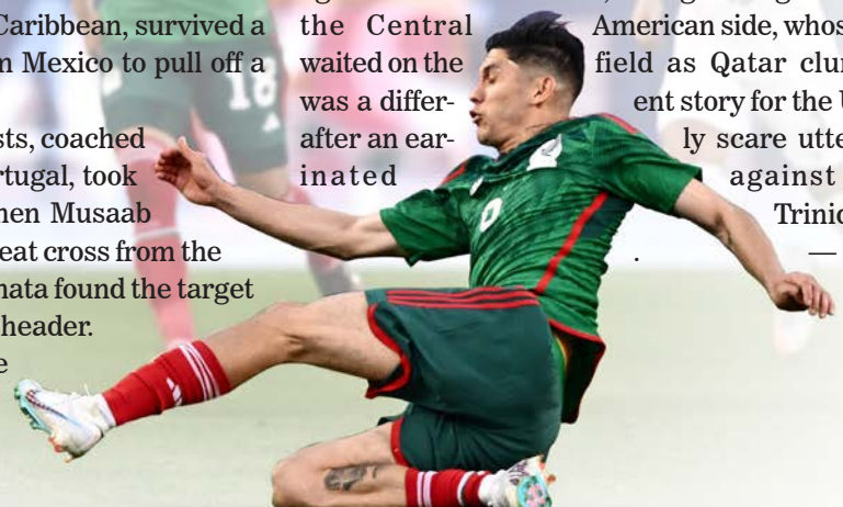
Qatar's midfielder Ali Asad (L) fights for the ball with Mexico's defender Gerardo Arteaga (2 nd R) during the Concacaf 2023 Gold Cup Group B football match between Mexico and Qatar at Levi's Stadium, in Santa Clara, California, on 2 July 2023.