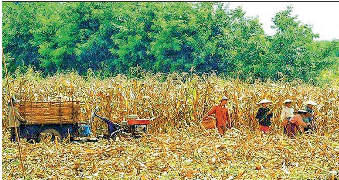
Farmers harvesting corns at their farms.

THE price of corn moved slightly down to K1,220 per viss following decline in FOB price, according to the Yangon Region Chambers of Commerce and Industry at Bayintnaung commodity centre.