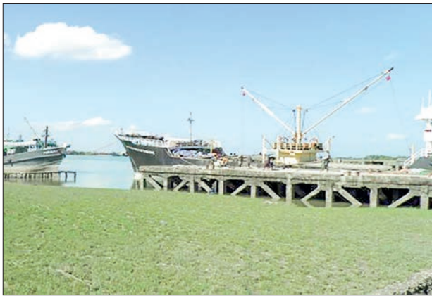
Some cargo ships docked at the port in Sittway Trade Camp.

At the Tamu trade post, there were exports of various groceries valued at US$ 0.028 million and cigarettes valued at US$ 0.395 million. The total trade volume amounted to US$ 0.423 million, with no imports recorded. — TWA/CT