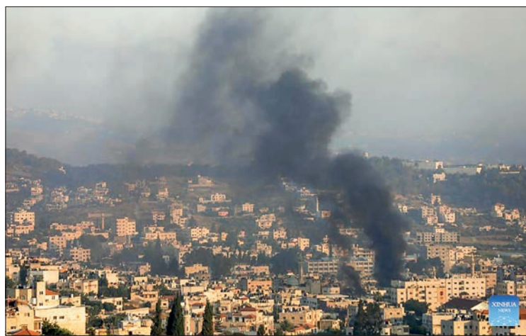
Smoke billows from a refugee camp during an Israeli strike in the West Bank city of Jenin on 3 July 2023.

The Israeli military said it struck a "joint operations centre" which served as a command centre for fighters from