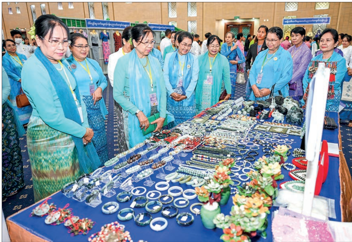
MWAF Honorary Patron wife of SAC Chairman Prime Minister Daw Kyu Kyu Hla views products displayed at the ceremony to mark Myanmar Women's Day on 3 July.

Then, Union Minister for Social Welfare, Relief and Resettlement Dr Thet Thet Khine, Chairperson of the Myanmar National Committee for Women's Affairs,