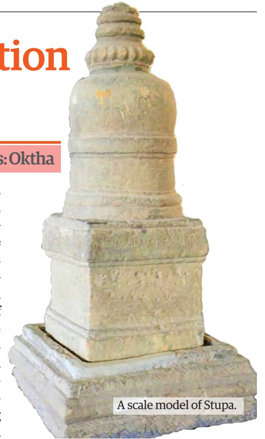
A scale model of Stupa.

(Marlakhun fiddle), Dulaung harp, Ozi, crocodile harp, bamboo harp, crocodile xylophone, various flutes, double trumpets, carved trumpet, and gourd flute of Mro people. Moreover, the scale models of Rakhine traditional house, tradition wedding event, traditional carriage pulling festival, Thanakha