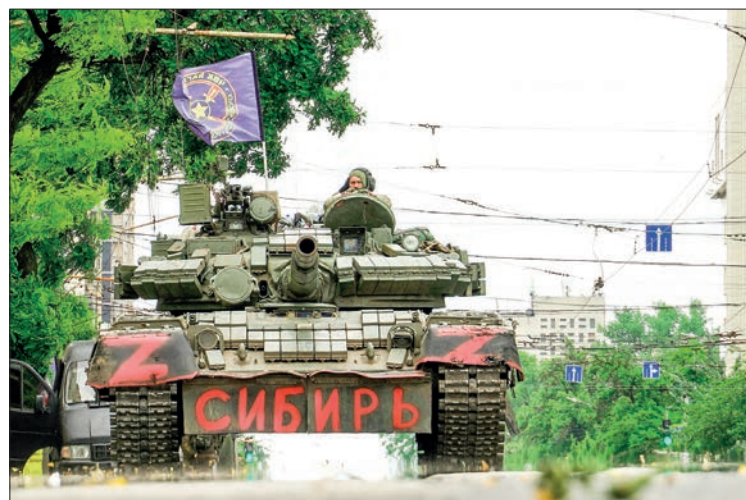
Members of Wagner group sit atop of a tank in a street in the city of Rostov-on-Don, on 24 June 2023. PHOTO: AFP

"As for replacing them (Wagner PMC) in the reserve, there is something and someone to replace them with." — AFP