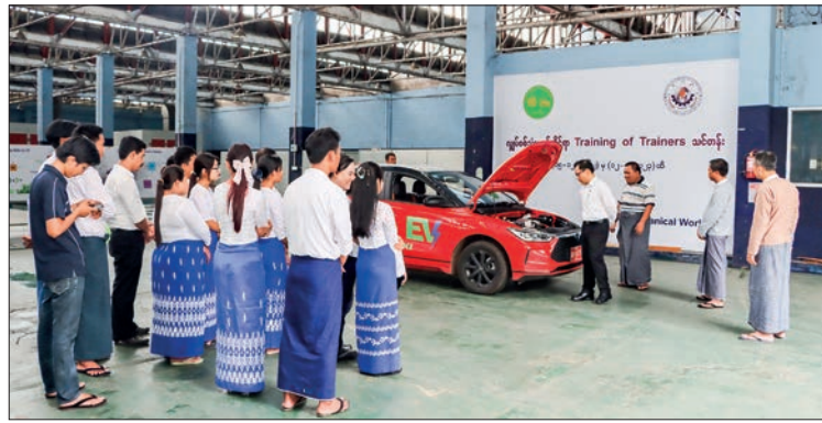
Deputy Minister for Science and Technology Dr Aung Zeya looks into the conducting of No 3 Training of Trainers Course on Electric Vehicles at the Government Technical Institute (Insein) on 1 July.

DEPUTY Minister for Science and Technology Dr Aung Zeya visited the Department of Technical, Vocational Education and Training at the Government Technical Institute (Insein) on 1 July and inspected the opening of No 3 Training of Trainers Course on Electric Vehicles.