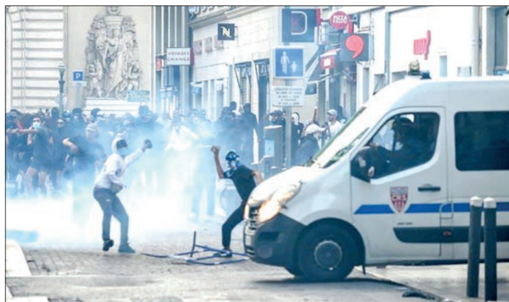
Protesters clash with riot police in Marseille.

The killing was captured on video, which spread on social media and fueled the anger over police violence against minorities, exposing severe racial tensions in France.