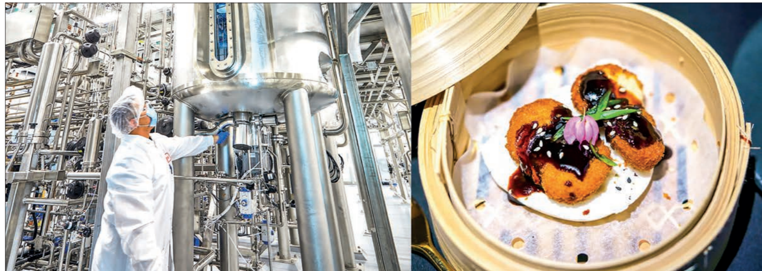
Upside Foods is a food technology company headquartered in Berkeley, California, aiming to grow sustainable cultured meat. (L); Chicken nuggets made from lab-grown meat in Singapore. (R)

tion to make cultivated meat a successful and accessible option.