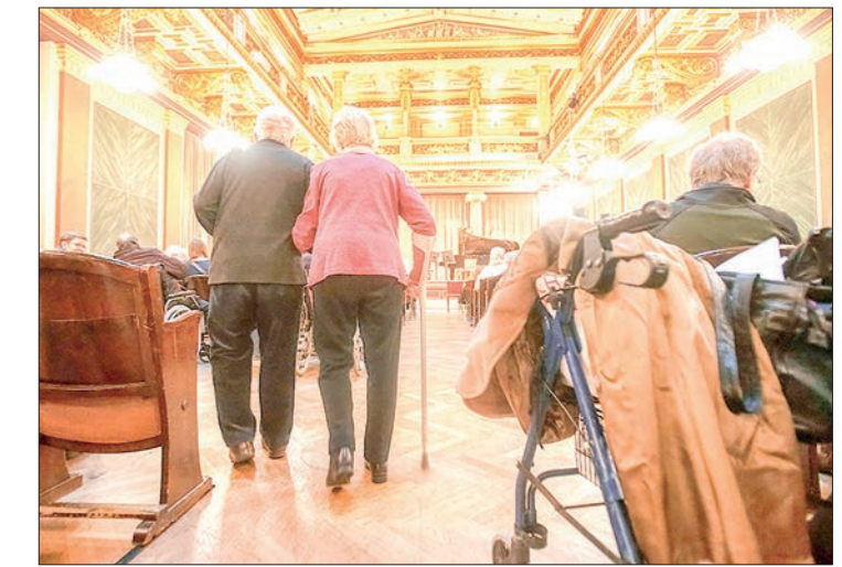
People with multiple sclerosis who inherited the genetic variant from both parents needed a walking aid almost four times faster, the study said. Elderly spectators needing a walking aid arrive to attend a concert specifically tailored to people living with dementia at the Wiener Musikverein in Vienna.