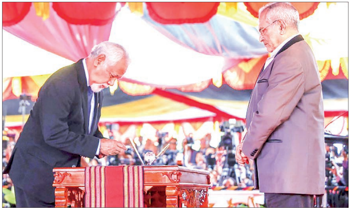
Timor Leste's President Jose Ramos Horta (right) witnesses the inauguration of the country's new Prime Minister Xanana Gusmao (left) at the presidential palace in Dili on 1 July 2023.

When he was captured by Indonesian forces in 1992, he continued to lead the struggle from jail in Jakarta.