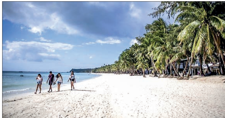
The Philippines, known for its white sand beaches and famous diving spots, is dependent on tourism.

The tourism ministry announced late Saturday that it