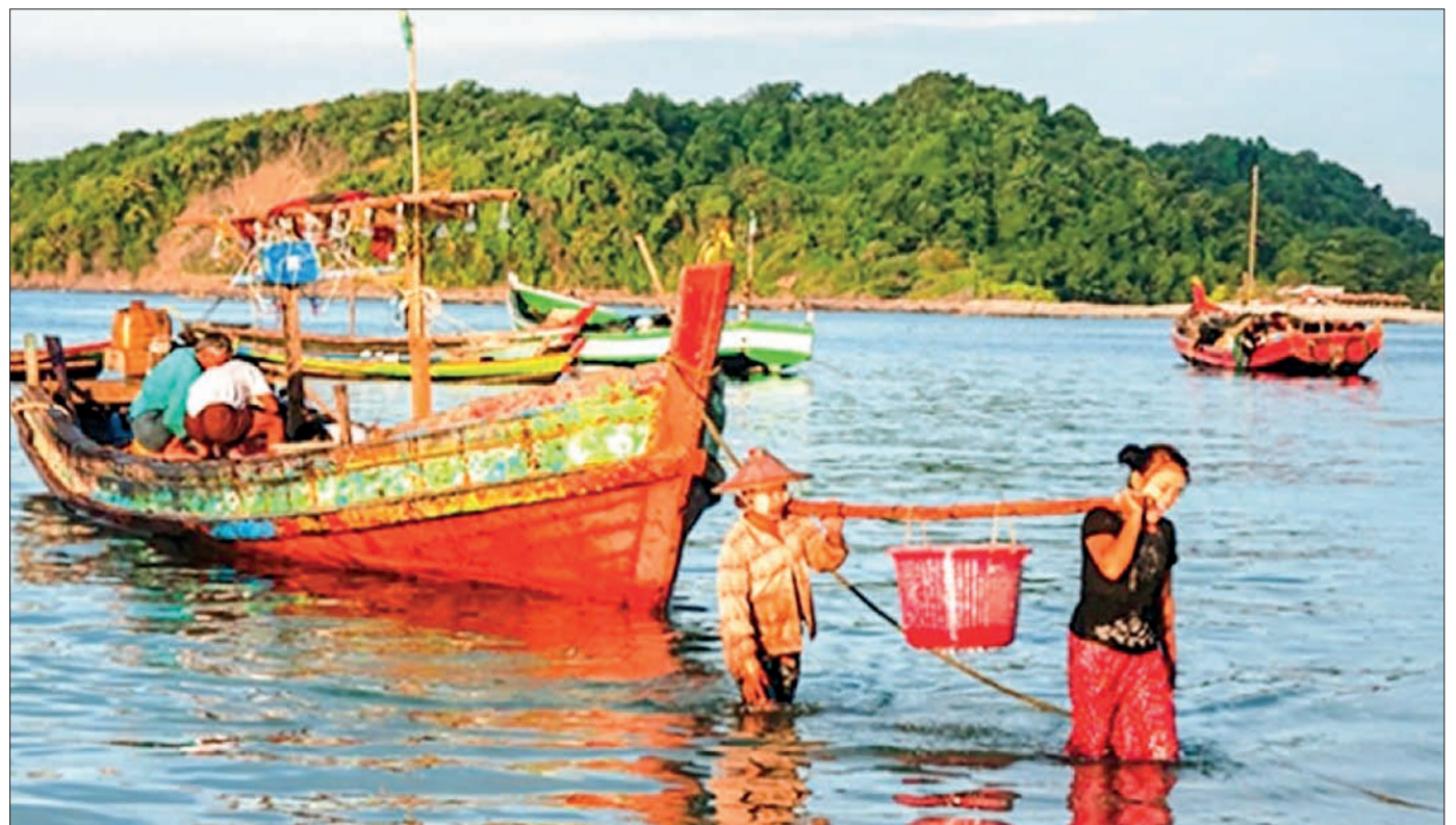
Some local fishermen seen at Myanmar coastal areas.