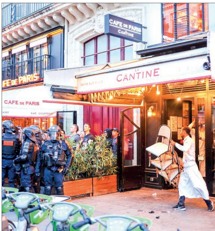
A waiter clears the terrace of a cafe during a demonstration in Paris on 30 June 2023.

ties to do "everything" to guarantee the safety of people in the hotel and catering industry in the world's most popular tourist destination.