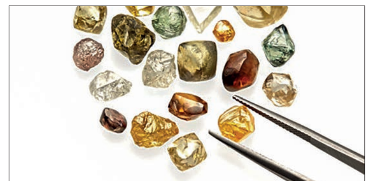
Botswana government and De Beers reached an agreement following Botswana's threat to cut ties with the company if talks were unfavourable for the country.

Under terms negotiated by the two sides in 2011, De Beers received 90 per cent of the rough diamonds mined, while Botswana had 10 per cent to sell itself. In 2020, Botswana's share had risen to 25 per cent. — AFP