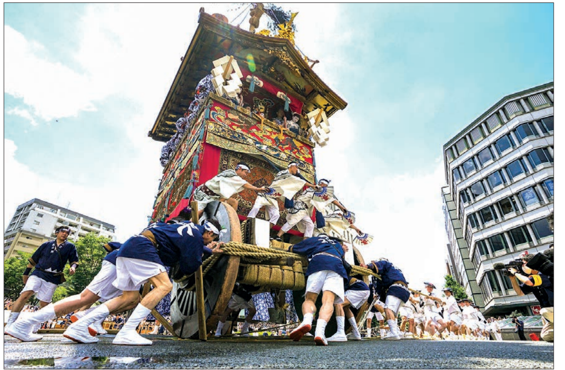
File photo shows a decorated float during the Yamahoko parade of the traditional Gion Festival in Kyoto, western Japan, on 17 July 2022.

“We wanted to offer a service that would add value to the experience of people from inside and outside Japan and help them understand the culture,” an official of the association said, adding profit from the festival will be used to preserve the tradition. — Kyodo