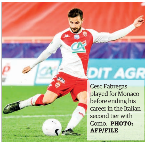
Cesc Fabregas played for Monaco before ending his career in the Italian second tier with Como.