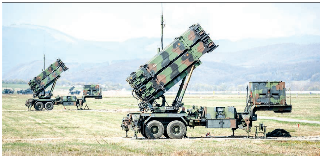
Patriot air defence systems.

"No European state can effectively defend its airspace against new dangers on its