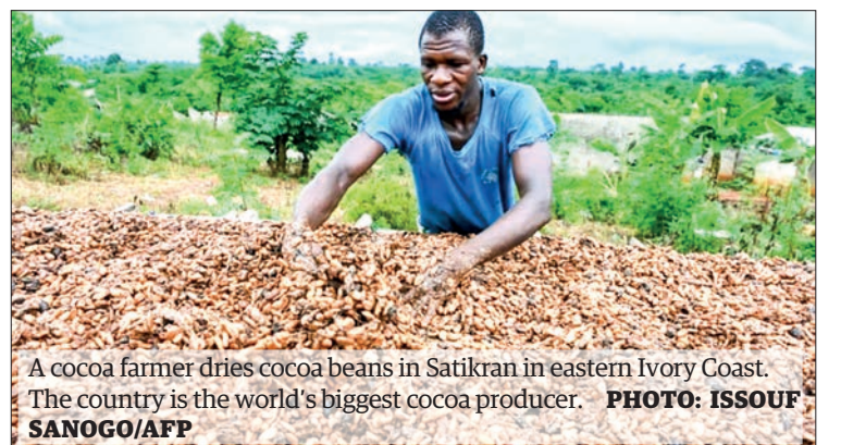
A cocoa farmer dries cocoa beans in Satikran in eastern Ivory Coast. The country is the world’s biggest cocoa producer.

The Nestle project was a partnership with the Ivorian government and the Earthworm Foundation, an NGO that led the project’s implementation. —AFP