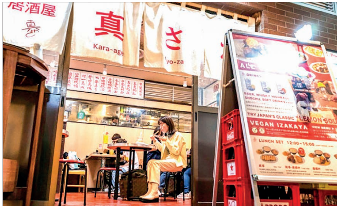
Vegetarian dining options aren't easy to come by in Japan, but that is beginning to change.

EVEN on a weekday, there is a queue at Tokyo's vegan Izakaya Masaka, including many tourists eager to try meat-free versions of Japanese classics like fried chicken and juicy dumplings.