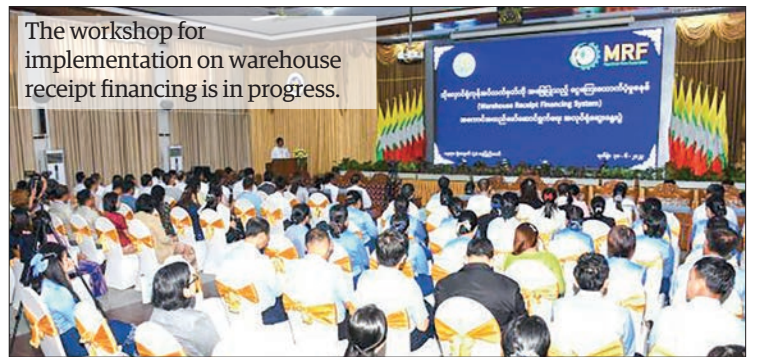
The workshop for implementation on warehouse receipt financing is in progress.

At the workshop, the MoC Deputy Minister stated that a warehouse receipt financing system is being implemented to prevent farmers from losing their profits. The warehouse receipt financing system is purposed for farmers to obtain loans from banks with the certificate of receipt received by depositing crops in storage warehouses as collateral. In this system, farmers are the owners of crops, warehouse