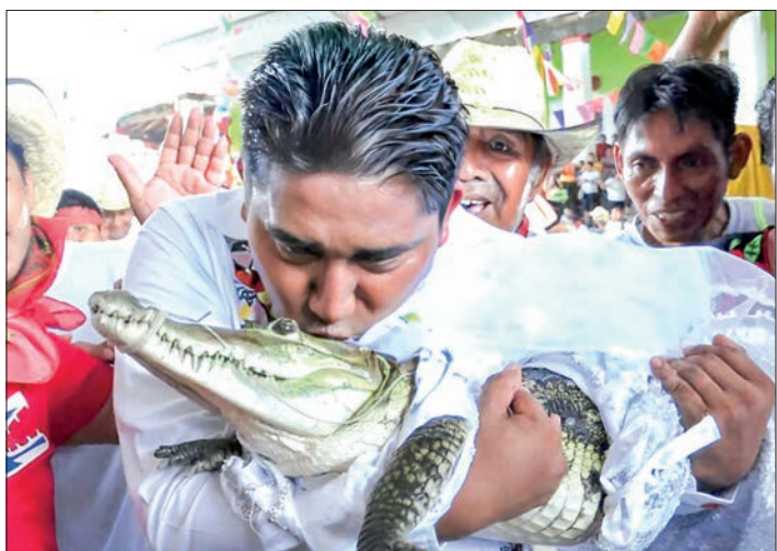
Victor Hugo Sosa, Mayor of San Pedro Huamelula, kisses a spectacled caiman (Caiman crocodilus) called “La Niña Princesa” (“The Princess Girl”) before marrying her in San Pedro Huamelula, Oaxaca state, Mexico on 30 June 2023. PHOTO: AFP

The Huave live along coastal Oaxaca state, not far from this inland town. — AFP