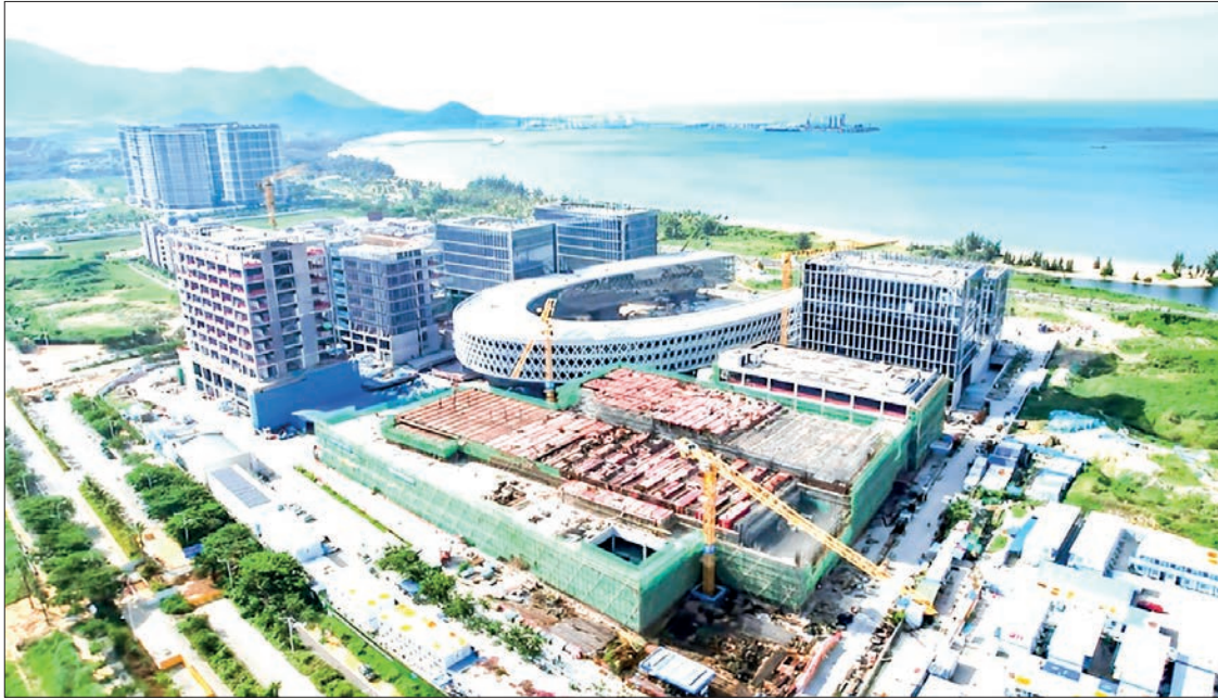
This aerial photo taken on 17 October 2022 shows the construction site of the deep-sea science and technology innovation public platform of Yazhou Bay Science and Technology City in Sanya, south China's Hainan Province.

THE scorching summer cannot stop the work in a seaside innovation park at the Yazhou Bay of Sanya City in south China's Hainan Province.