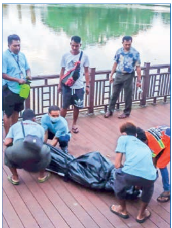
Preparations being made to send a male dead body to the mortuary of YGH.

THE body of a man who had drowned was found in the water near the Paganlon Island in Mingala Taungnyunt Township in Yangon Region at around 3 am on 1 July.