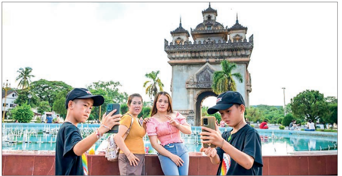
Tourists take photos in the Patuxay Park in Lao capital Vientiane on 30 June 2023.