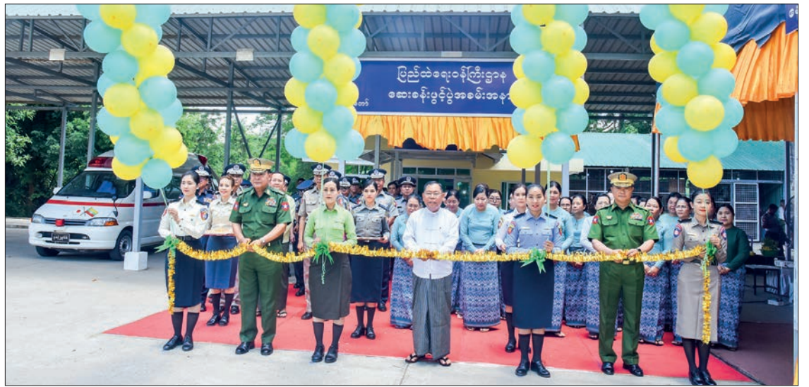
Member of the State Administration Council Deputy Prime Minister Union Minister for Home Affairs Lt-Gen Soe Htut and officials cut the ribbon of clinic opening event at the headquarters of Myanmar Police Force in Nay Pyi Taw yesterday.

Well-wishers donated cash to the trust-fund of the clinic