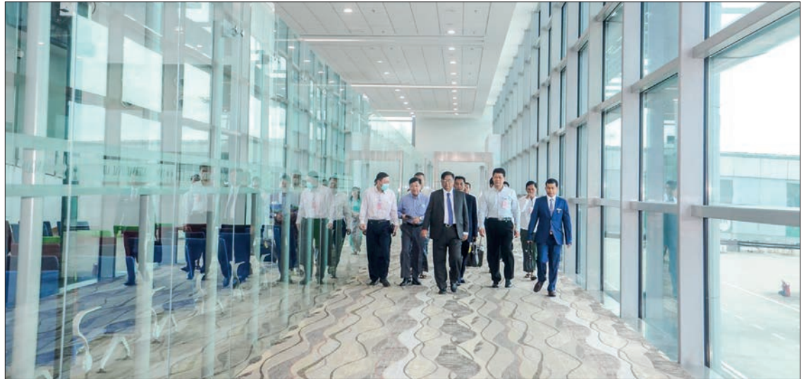
Union Minister for Industry Dr Charlie Than and delegation members seen off by officials from Ministry of Industry at Yangon International Airport on 2 July 2023.

Officials from People's Government of Guangdong Province, Ministry of Industry and Information Technology (MIIT) of China and officials from ASEAN Secretariat and ASEAN member countries, business organizations, industrial experts and researchers will join the forum. — MNA/KZW