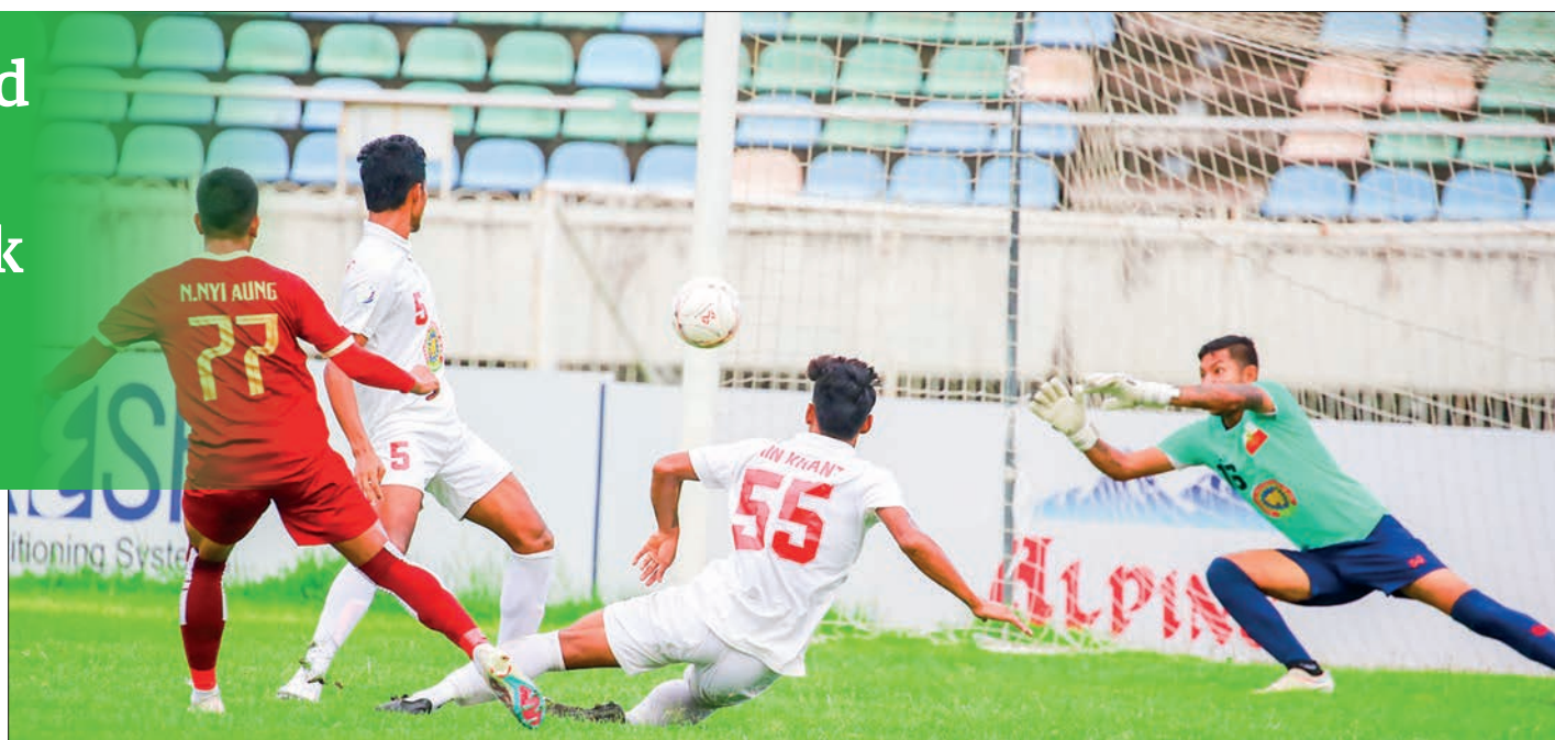
The players tussling the ball during the MNL football match between Ayeyawady FC and Rakhine FC, at the Thuwunna Stadium, Yangon, on 2 July 2023.