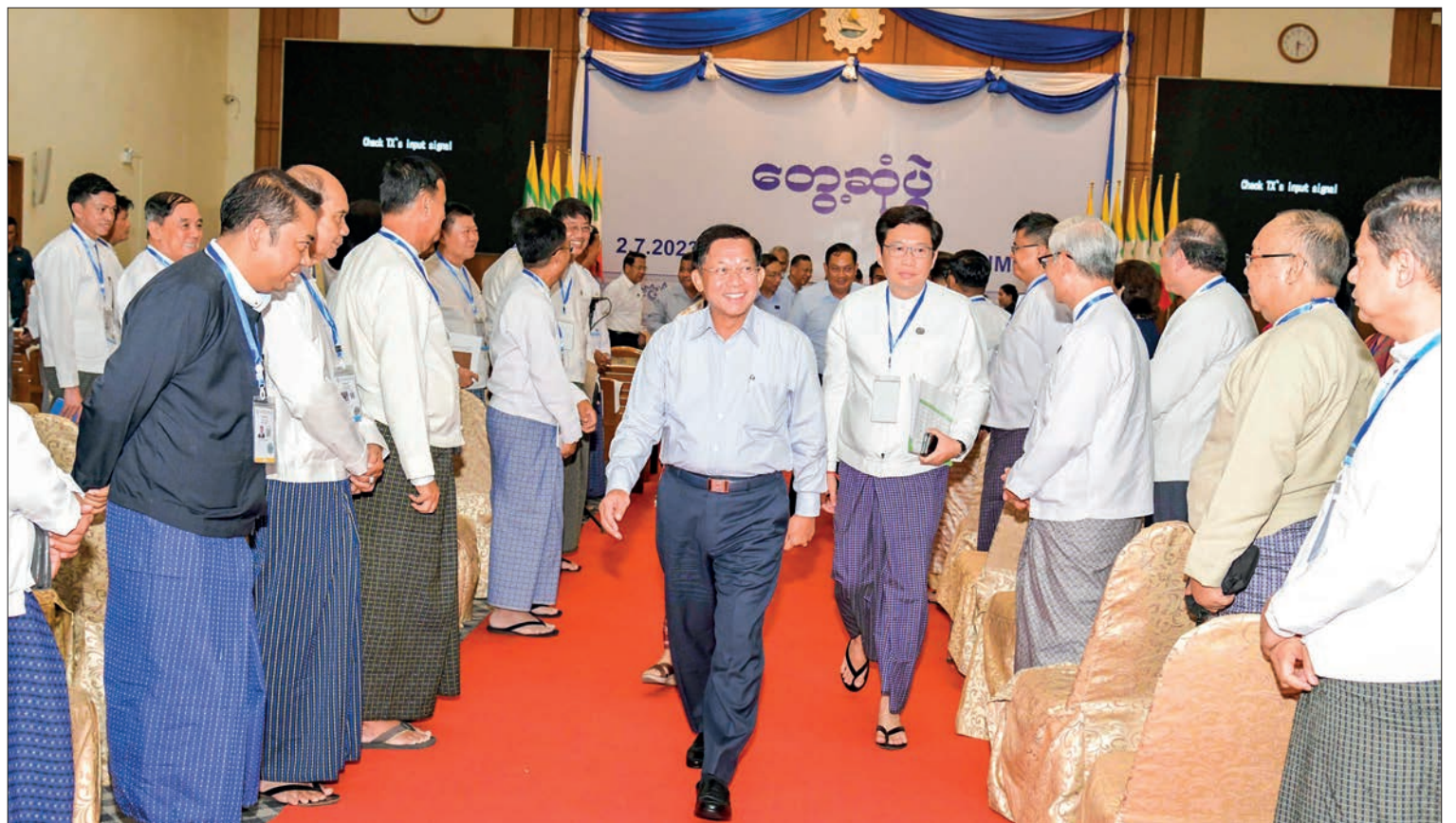
Chairman of State Administration Council Prime Minister Senior General Min Aung Hlaing warmly greets businesspersons from UMFCCI and its associate organizations at the meeting with officials from UMFCCI and associates at the UMFCCI Office in Yangon on 2 July 2023.

Agricultural and livestock production can initiate much improvement of industries and services. As such, people