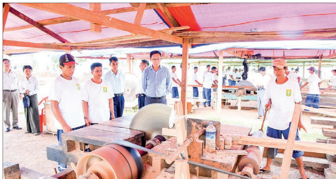
Union Minister for Natural Resources and Environmental Conservation U Khin Maung Yi inspects operating of saw mills in Sittway yesterday.

Speaking on the occasion, the Union Minister stressed the need to grow 204,200 saplings to successfully thrive in monsoon in Rakhine State as a special duty. As forest cover acreage declines in Rakhine State, natural forests and mangrove forests must be protected with growing more plants. The trees to be grown must not harm urbanization with