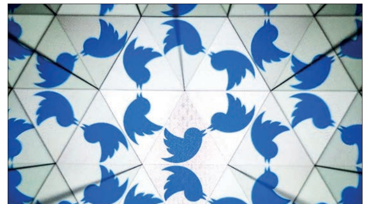
The twitter's logo is pictured on screen reflected by mirrors in Mulhouse, eastern France on 30 May 2023.

The day before, Musk had announced that it would no longer be possible to read tweets on the site without an account. Much of the data scraping was coming from firms using it to build their AI models, Musk said, to the point that it was causing traffic issues with the site. — AFP