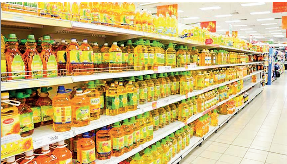
The edible oil sales counter of a shopping centre.

AROUND 20,000 tonnes of palm oil were expected to arrive from abroad in early July. Therefore, the demand for palm oil in the various regions, including Yangon, decreased remarkably on 1 July.