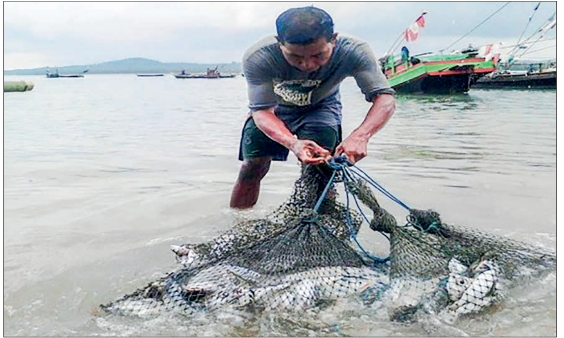
A fisherman netting fish at coastal area.

Myanmar set the hatchling season from April to June and the fishery season from July in the Myanmar Sea in the 2023-24 financial year.