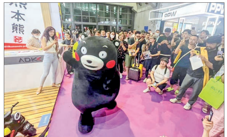
Kumamon, the official black bear-like mascot of Kumamoto Prefecture, southwestern Japan, takes part in an event in Shanghai on 28 June 2023.

self a "sales manager" tasked with bringing happiness to people, also handed out his "business cards" to event participants and promoted tourism to the