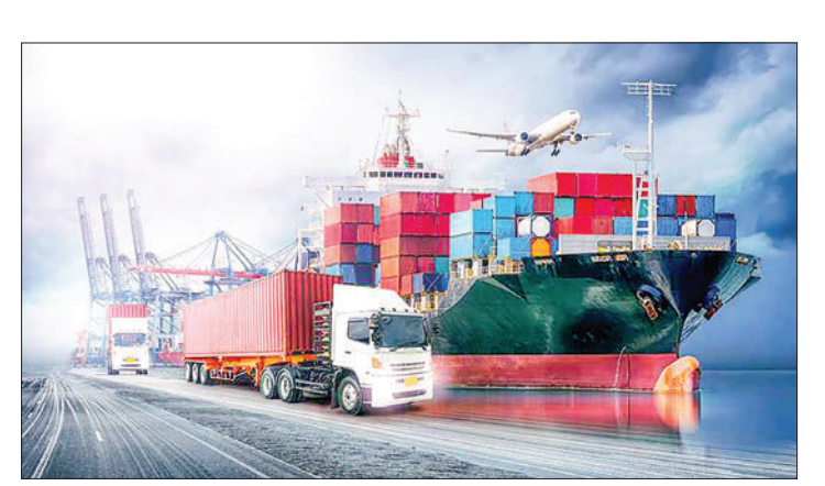
The Hong Kong Special Administrative Region (HKSAR) signed the first protocol to amend its free trade agreement (FTA) with the Association of Southeast Asian Nations (ASEAN) on Tuesday, aiming to strengthen economic and trade connections.

on Tuesday signed the first protocol to amend free trade