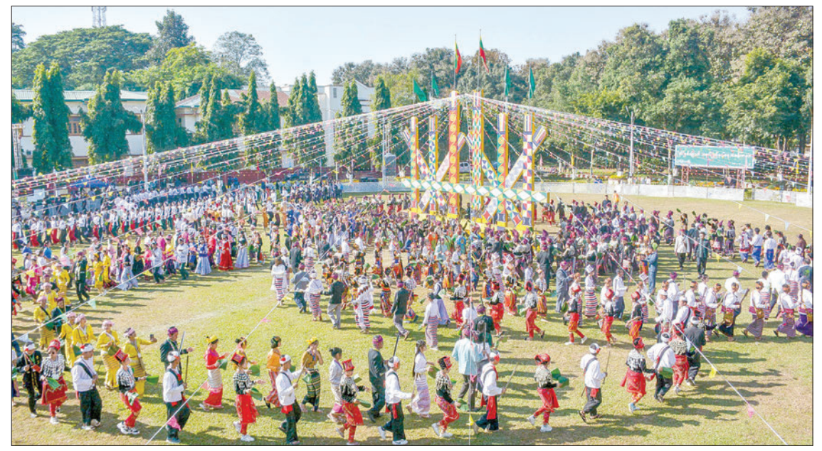
The ceremony for the 76^{th} Anniversary of Kachin State Day in progress on the lawn in front of the Kachin State government office in Myitkyina yesterday.

Union Minister for Border Affairs Lt-Gen Tun Tun Naung handed over 150 sets of 120-watt solar home system units for the