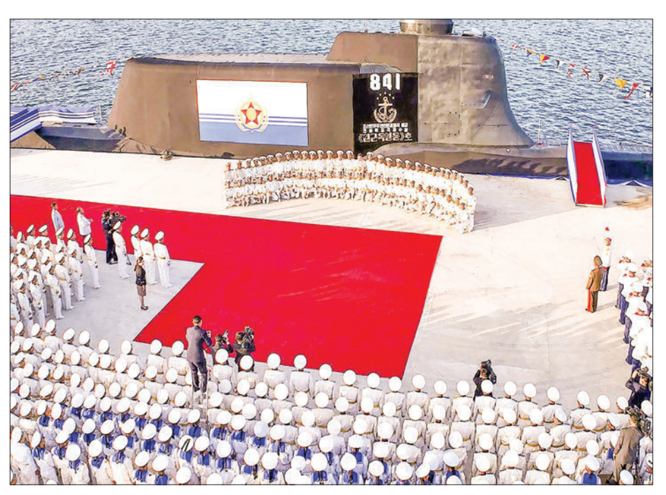
A launching ceremony of the Democratic People's Republic of Korea's first tactical nuclear attack submarine is held on 6 September 2023.

THE top leader of the Democratic People's Republic of Korea (DPRK) called South Korea a "principal enemy" and asked his country to bolster up self-defence capabilities, the official Korean Central News Agency (KCNA) reported Wednesday.