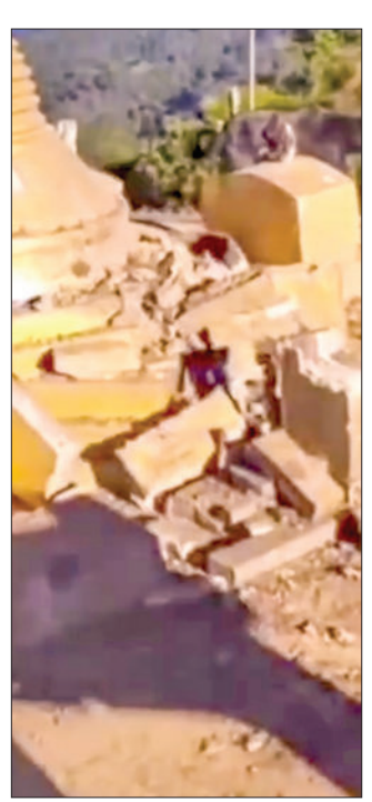
Photos show the pagoda and a terrorist destroying the pagoda in Laukkai Township.

Buddhists. This barbaric and despicable incident saddens all of us Buddhists. I am saddened. This action will shock Buddhists from not only Myanmar but from Thailand, Laos, Cambodia, Sri Lanka, India, and China, including Tibet region and Yunnan Province. They also bombed with driverless drones on the monastery in