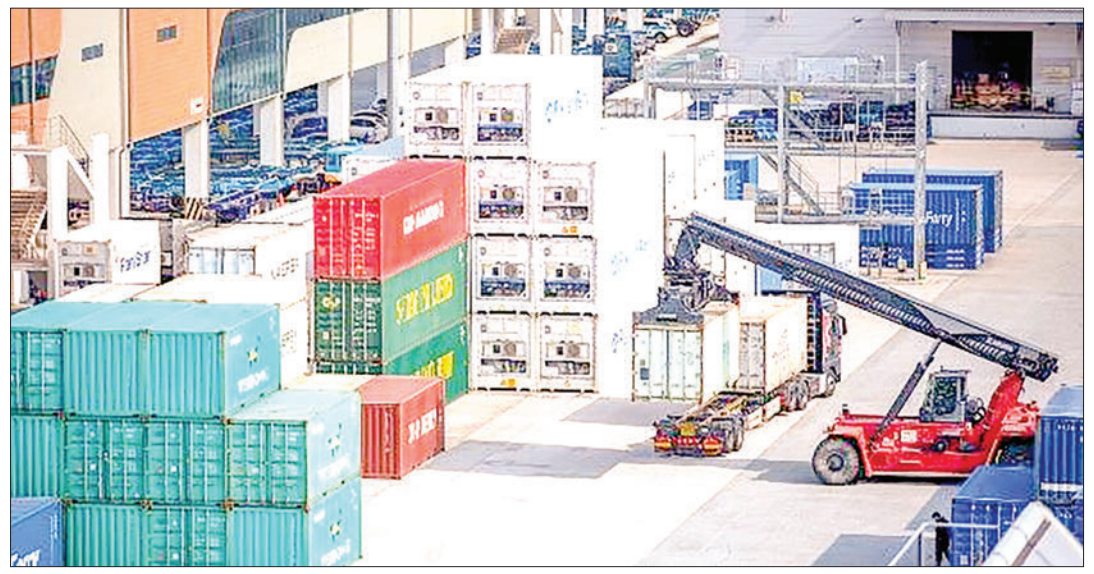
This photo taken on 7 March 2023 shows a container yard at the port of Busan, South Korea. The port of Busan is the largest seaport in the country.

South Korea achieved a current account surplus for the seventh consecutive month, driven by export recovery, with a surplus of US$ 4.06 billion in November 2023, as reported by the Bank of Korea.