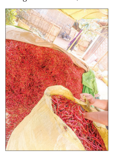
Shan Moehtaung's new chillies have recently arrived in the market.

On 10 January the red long chilli from the Salin area will be priced at K14,000 per viss, while the Shan long chilli (new) will be priced at K11,500/K11,800 per viss. The price of old long chilli from the Delta region, produced in the 2023 chilli harvesting season, is K7,000 per viss. Consequently, buyers prefer old and new long chillies over cold storage ones. — TWA/TMT