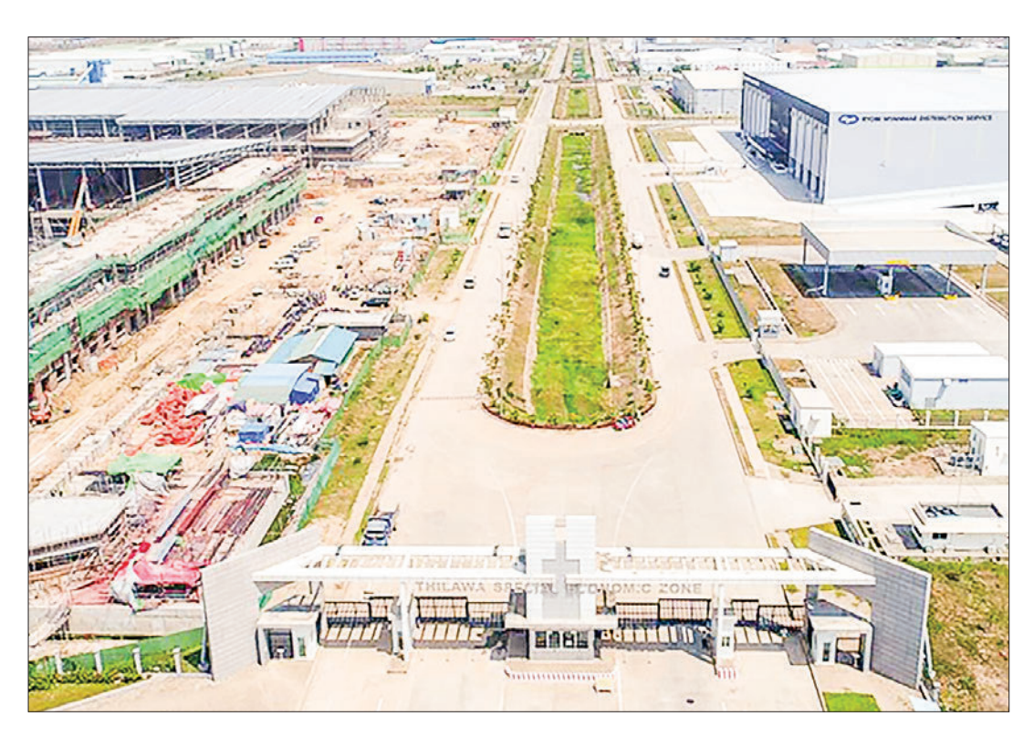
An aerial view shows factories in Thilawa Special Economic Zone in Yangon.

in the forex market, the gold price peaked at K4 million per tical in August 2023. — NN/EM