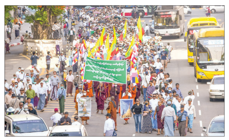
A rally takes place yesterday in Yangon, to denounce the acts of terrorists destroying and insulting religious edifices.

A protest against the terrorist insurgents who are destroying and insulting religious edifices that are not related to the military was held near Maha Bandoola Park in front of Yangon City Hall yesterday.