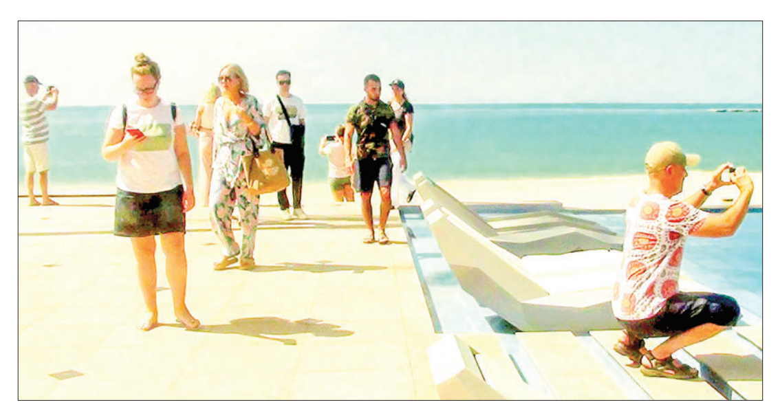
Overseas tourists were seen on the beach of Ngapali in October 2023.