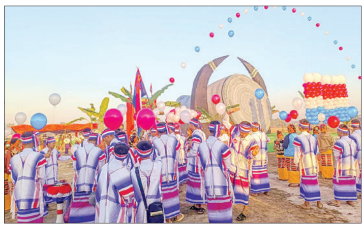
Unveiling image of Phasi (frog drum) to mark the Kayin New Year festival in Taungkalay village.

The upcoming festival in Taungkalay Village, Hpa-an Township, Kayin State, from 9 to 11 January, is expected to feature sports competitions and traditional Kayin ethnic dance competitions. — ASH/TKO