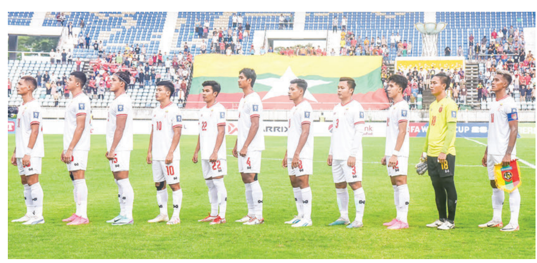
Myanmar team players are seen during an international football match.