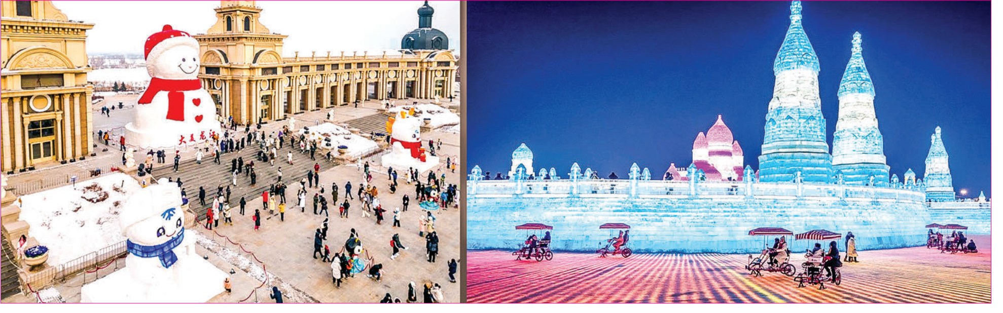
People visiting giant snowmen in Harbin. (L) Tourists have fun at Harbin Ice-Snow World in Harbin, northeast China's Heilongjiang Province, 2 January 2024. (R)

The Spring Festival, China's largest festival, falling on 10 February is a key window for observing economic vitality and consumer confidence. Experts predict that this year's holiday will be the most vibrant and prosperous in recent years, with an estimated 80 million passenger trips, a record high, during the travel rush from 26 January to 5 March.