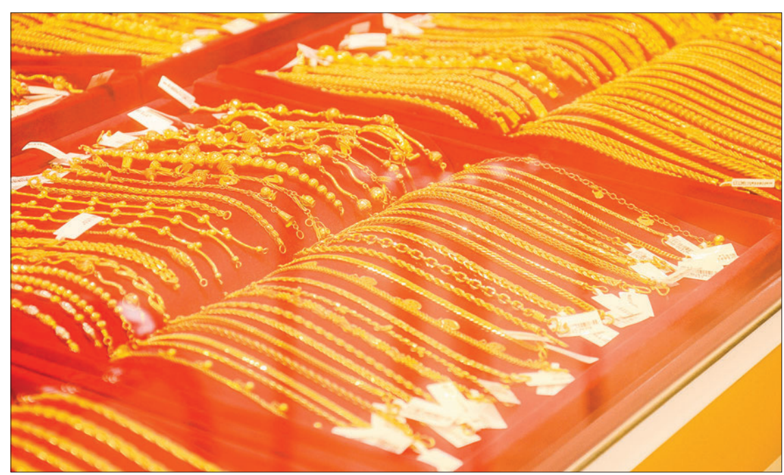
Varieties of gold ornaments are seen in the gold outlet in Yangon.

On 5 December, the Central Bank of Myanmar (CBM) allowed authorized dealers (private banks) to operate forex exchange transactions freely as per the market rate determined by the supply and