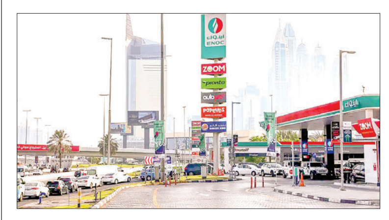
The World Bank projects the UAE's real GDP to grow by 3.4 per cent in 2023, with further increases to 3.7 per cent in 2024 and 3.8 per cent in 2025.

The report said that the growth rate in the Middle East and North Africa (MENA) region slowed down sharply to 1.9 per cent in 2023, as the region faced multiple headwinds, including oil production cuts, elevated inflation, and weak private sector activity in oil-importing economies. The report also expected the growth rate in the MENA region to pick up to 3.5 per cent in 2024 and 2025. — ANI