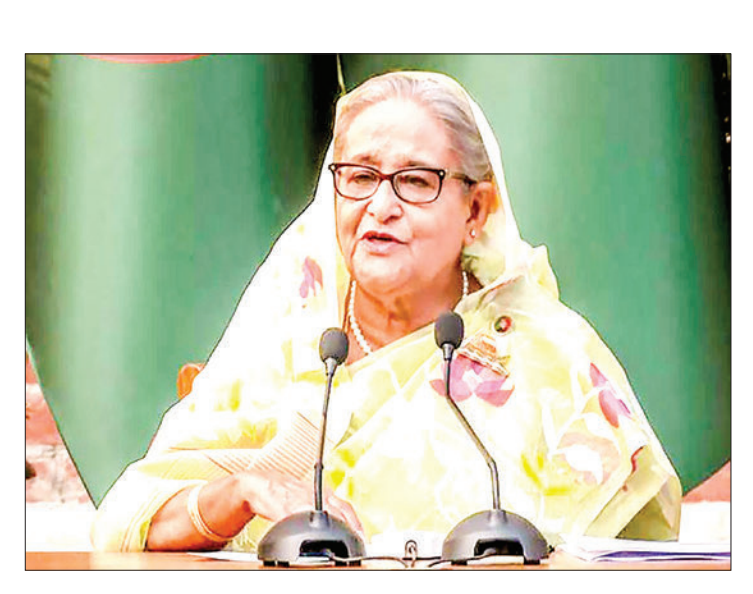
Bangladesh Prime Minister Sheikh Hasina, in her fifth term, outlined plans for the country's international relations and emphasized the strong bond with India.

The Prime Minister stressed the historical significance of India's support during the Bangladesh Liber-