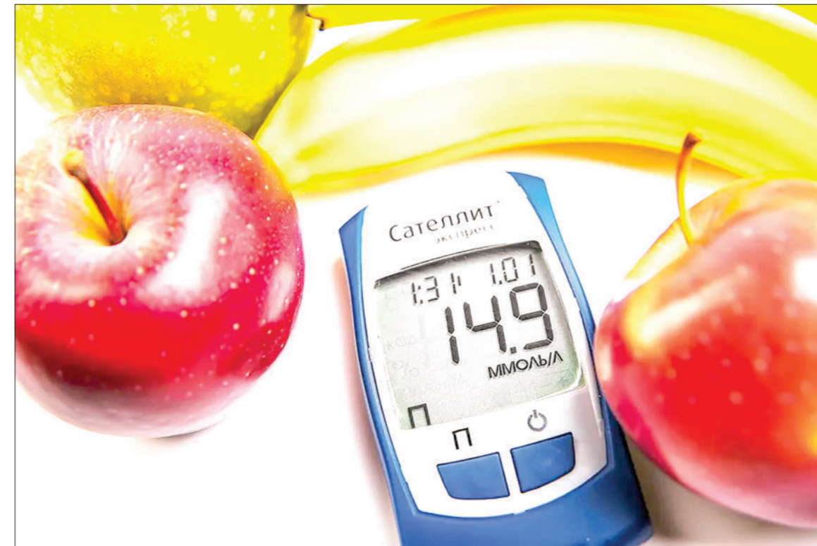
The research indicates that ICL in the elderly is primarily attributed to the loss of insulin-producing beta cells, potentially contributing to age-related diabetes and offering insights for the development of preventative medicines.

While there were no notable trends in the other cell types, it was found that the proportion of beta cells in the pancreas seemed to significantly decrease with ICL.