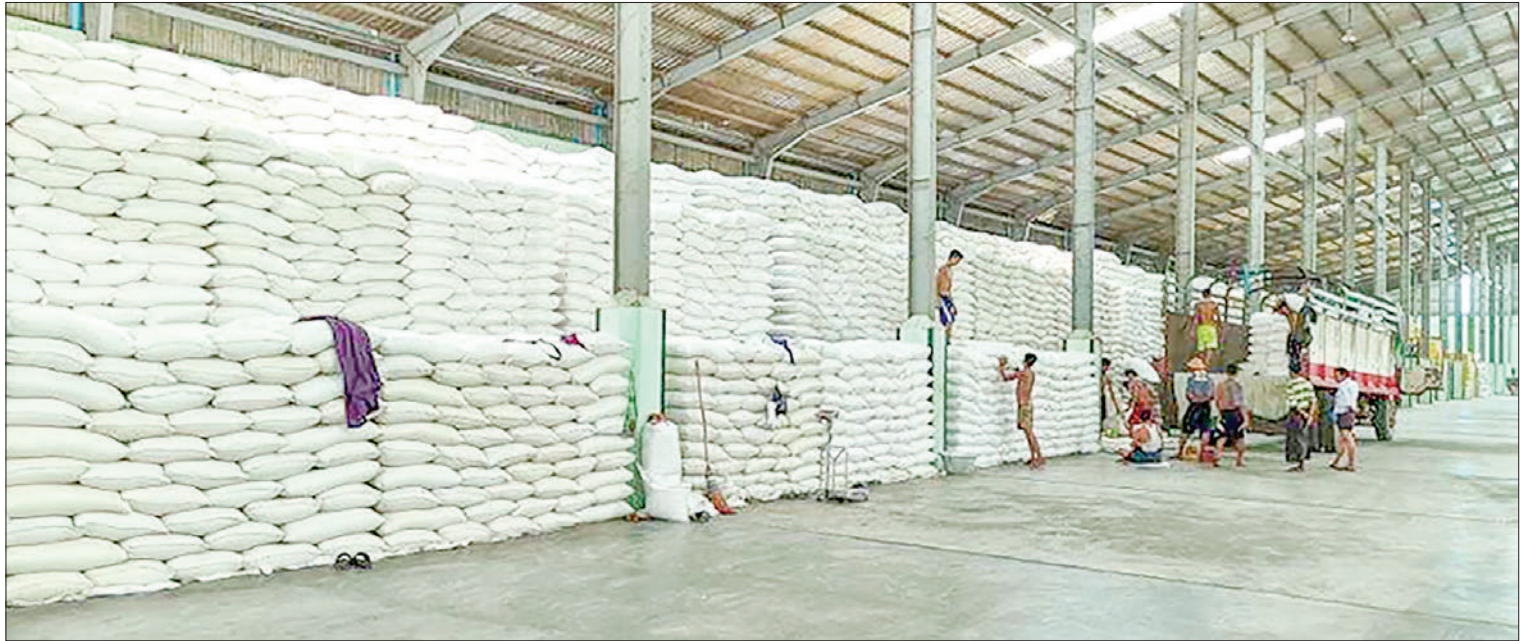
Bags of rice are stored in warehouse.

As of 13 January 2023, 193 warehouse facilities in Yangon, Ayeyawady, Bago, Mandalay, and Sagaing regions, Rakhine State, and Nay Pyi Taw Council Area have been registered. The feder-