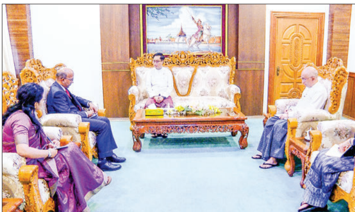
Deputy Minister for Foreign Affairs U Lwin Oo receives Mr Vinay Kumar, Ambassador Extraordinary and Plenipotentiary of India yesterday.

U Lwin Oo, Deputy Minister, Ministry of Foreign Affairs of the Republic of the Union of Myanmar, received Mr Vinay