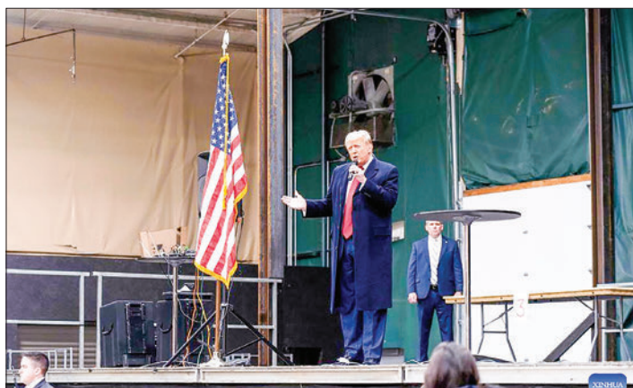
Former US President Donald Trump speaks at a caucus site in Clive, Iowa, the United States, 15 January 2024. Multiple US media outlets on Monday night projected former US President Donald Trump, who is the front-runner in the Republican presidential race, will win the 2024 Iowa Republican caucuses.

CBS News said Trump’s expected win proves his grip on the party even as he faces numerous felony charges in four criminal cases. CNN reported that the win cements Trump’s front-runner status in the GOP field.