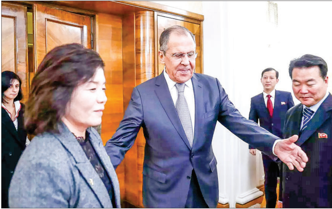
Russian Foreign Ministry, Russian Foreign Minister Sergey Lavrov shows the way to North Korean Foreign Minister Choe Son Hui. PHOTO: SPUTNIK

RUSSIAN Foreign Minister Sergey Lavrov said on Tuesday that he will discuss the situation on the Korean Peninsula with North Korean Foreign Minister Choe Son Hui.