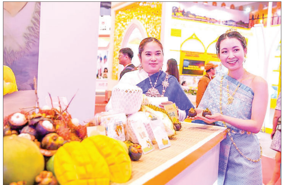
Exhibitors display fruits from Thailand during the 20 th China-ASEAN Expo at Nanning International Convention and Exhibition Centre in Nanning, capital of south China's Guangxi Zhuang Autonomous Region, 17 September 2023.

Han said that Thai durian has transformed from a niche fruit to a "top stream" product in the Chinese market. Chinese consumers favour Thai fruits, and the Chinese government supports Thai