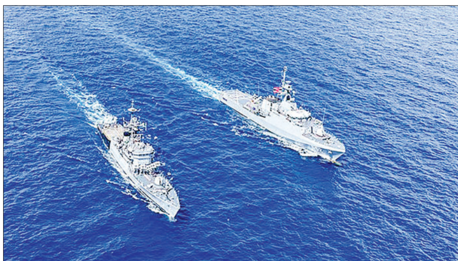
The Indian Naval ships Kulish and IN LCU 56 participated in the inaugural edition of the exercise.

THE Indian Navy and Royal Thai Navy (RTN) conducted a maiden bilateral exercise, named 'Ex-Ayutthaya', which symbolizes the significance of 'Ayodhya' in India and Ayutthaya in Thailand, which holds historic legacies and has rich cultural ties. The Indo-Thai Bilateral Exercise 'Ex-Ayutthaya' translates to 'The Invincible One' or 'Undefeatable', and "symbolizes the significance of two of the oldest cities, Ayodhya in India and Ayutthaya in Thailand, the historic legacies, rich cultural ties and shared historical narratives dating back to several centuries," the Ministry of Defence said in a statement.