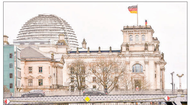
Vehicles run on a bridge in Berlin, Germany, on 15 January 2024. Germany slipped into recession in 2023, the country's Federal Statistical Office (Destatis) said on Monday.

Inflation in Germany gradually weakened last year, but picked up again at the end of the year, to 3.7 per cent in December. Compared to other European countries, consumer prices in the country normalized slowly, as the average value for the eurozone was already 2.9 per cent last month. Food prices in particular continued to rise at above-average rates, and were still up 4.5 per cent at the end of last year. Although real wages rose, consumption remained subdued. — Xinhua