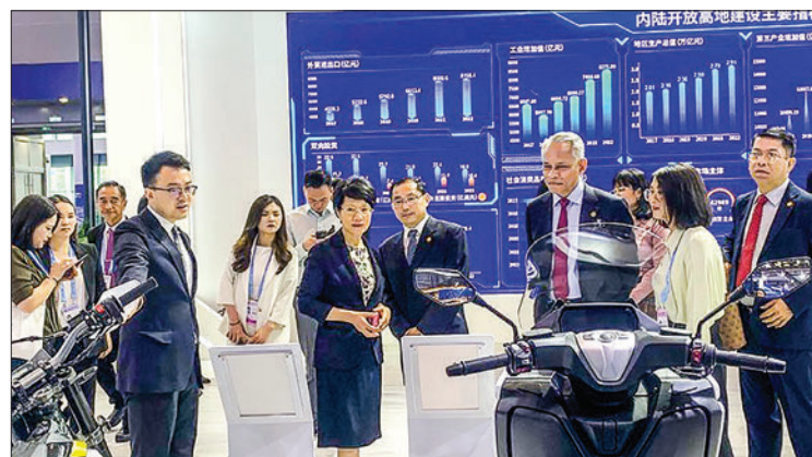
Western China International Fair: Union Minister U Aung Naing Oo attends 5th Investment and Trade Fair.

Myanmar shipped 10,850 tonnes of fisheries that week, with 3,070 tonnes destined for external markets via maritime trade and 7,780 tonnes sent to neighbouring countries (China and Thailand) at borders. — TWA/KK