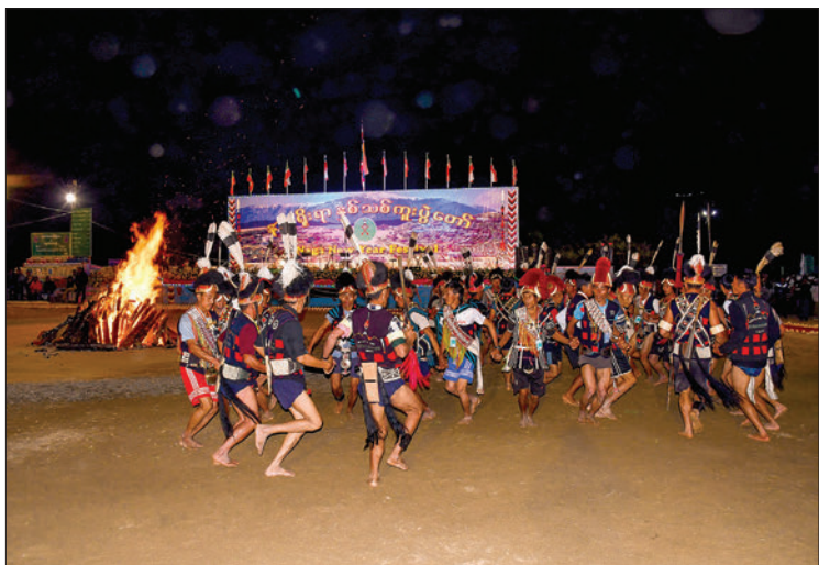
Naga ethnic people enjoying traditional bonfire in Leshi on 15 January.