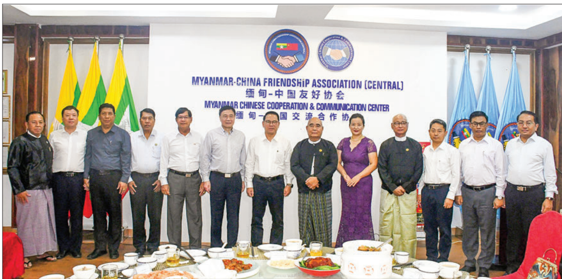
Union Minister for Information U Maung Maung Ohn poses for documentary photos at honorary dinner for Myanmar-China friendship in Yangon yesterday.

UNION Minister for Information U Maung Maung Ohn attended the honorary dinner for Myanmar-China Friendship organized by Myanmar-China Cooperation Centre yesterday.