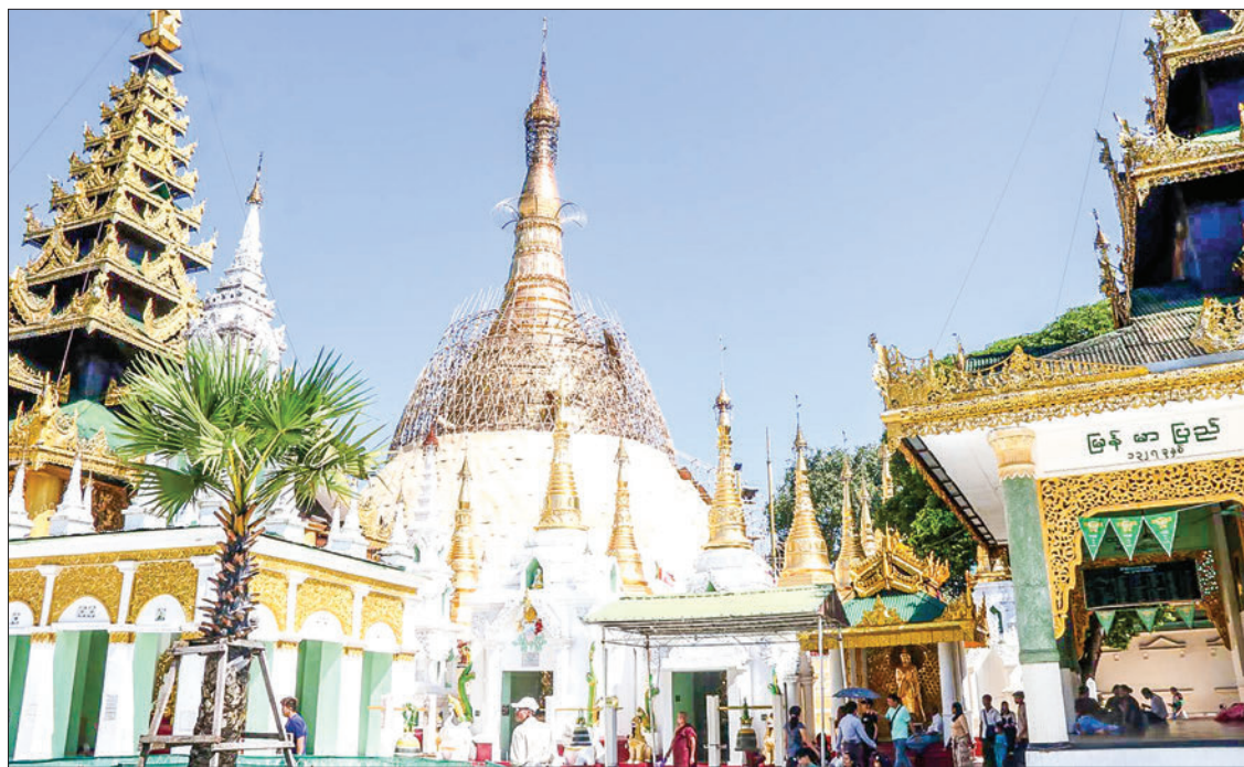
Witnessed the installation of scaffolding for the gold foils offering at Naungdawgyi Pagoda in December.

Tenders will be invited, commencing with the procurement of