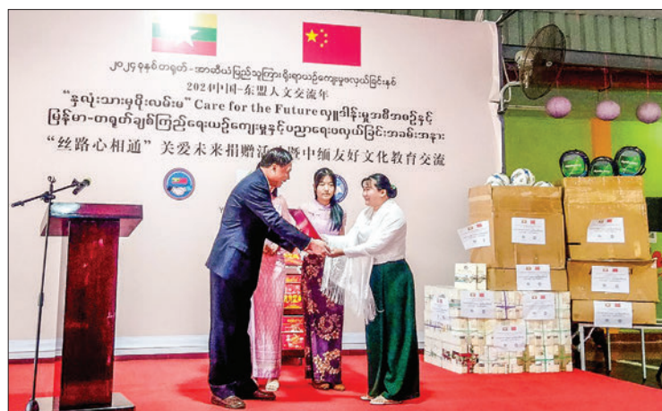
The donation ceremony of Silk Road from the Heart: Care for the Future in progress at MIEC in Yangon yesterday.

AS part of marking the Myanmar-China friendly ties, the Silk Road from the Heart: Care for the Future and Myanmar-China friendly culture and education exchange took place at Myanmar International Education Centre at Myanmar Sports Ho-