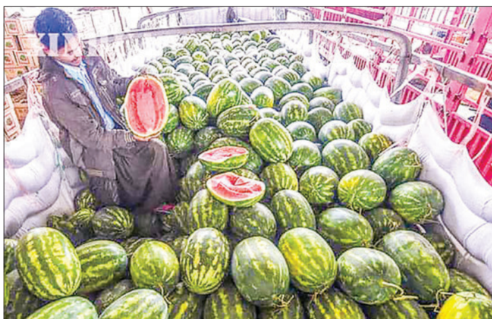
A photo shows a trader showcasing quality Myanmar watermelon before exportation to China.

As Chinese New Year 2024 approaches, the demand for Myanmar’s fruits is steadily growing. During the week ending 5 January, Myanmar shipped about 35,000 tonnes of watermelon, muskmelon, and bananas to China through Kengtung, Lweje, and Kam-