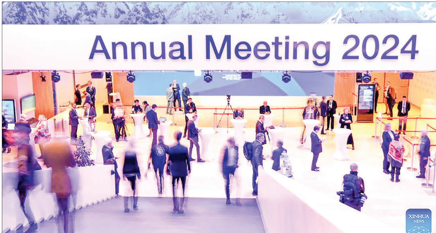
People attend the World Economic Forum (WEF) Annual Meeting 2024 in Davos, Switzerland, 15 January 2024. The WEF Annual Meeting 2024 opened here on Monday. In the face of escalating global division and uncertainty, the 54 th WEF Annual Meeting has assembled leaders from around the world for a week of dialogue aimed at enhancing cooperation and cultivating partnerships.

E CONOMIC optimism has more than doubled year-on-year but almost half of CEOs doubt the viability of their businesses as tech and climate pressures accelerate, a new PricewaterhouseCoopers (PwC) survey presented at the World Economic Forum (WEF) in Davos on Monday showed.