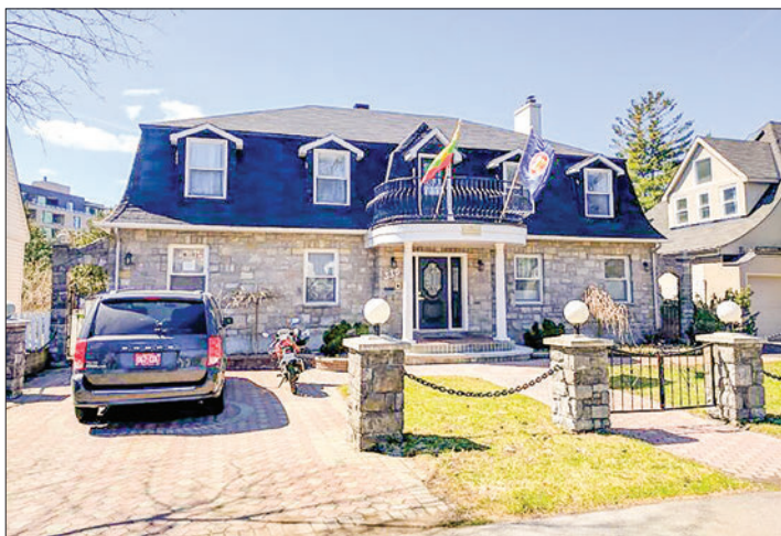
Myanmar Embassy to Canada in Ottawa.

MYANMAR Embassy to Canada announced that Myanmar nationals working legally in Canada can pay income tax for periods they want to pay on their monthly salary as of 15 January 2024.