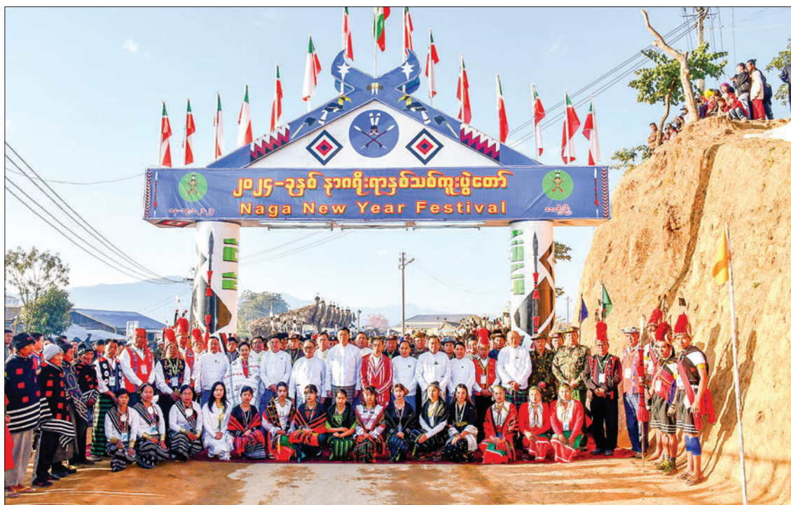
SAC member Deputy Prime Minister Union Minister General Mya Tun Oo poses for documentary photos at Naga Traditional New Year festival for 2024, yesterday.

The Deputy Prime Minister also discussed topics such as proper healthcare services in the Naga region, the responsibilities of government employees and local staff in enhancing the socioeconomic status of ethnic communities, agricultural matters, and the development programmes for Micro, Small, and Medium Enterprises (MSMEs), in addition to the agriculture and