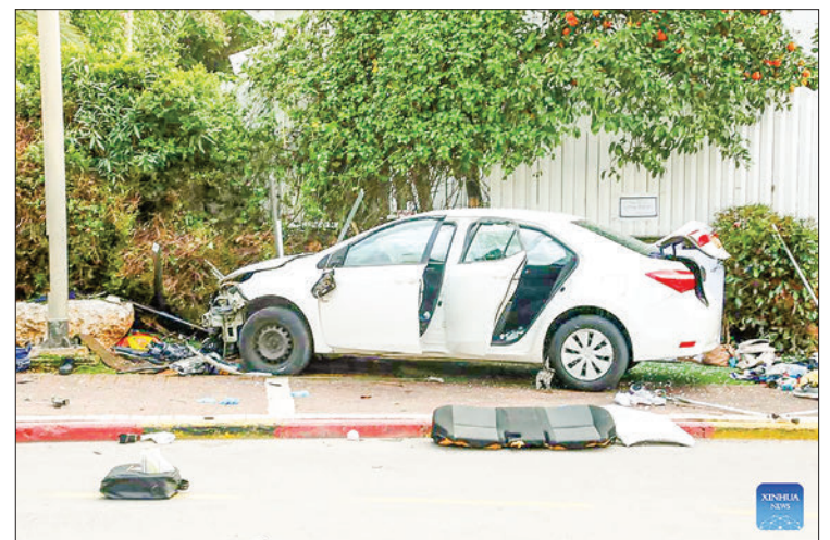
Photo taken on 15 January 2024 shows the scene of car-ramming and stabbing attacks in the central Israeli city of Ra’anana. Combined car-ramming and stabbing attacks carried out by two Palestinians killed an elderly woman and wounded 17 others in central Israel on Monday, Israeli authorities said.

Video footage on Israel’s Kan TV news showed personal belongings strewn across the road and a shattered bus stop, with at least four children reportedly injured in the attack, the report said. — Xinhua