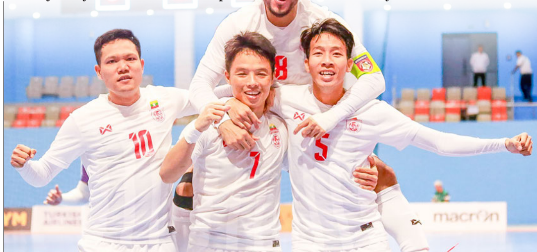
The Myanmar futsal team players are seen at the previous international futsal match.

A total of nine coaches will handle the Myanmar team consisting of 25 players. — Ko Nyi Lay/KZL