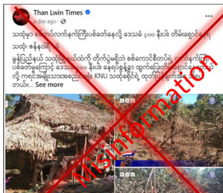
A screen-shot of misinformation from Than Lwin Times.

FALSE news is intentionally fabricated on social media, suggesting that nearly 400 local people from Thaton Township, Mon State, had to flee due to the explosion of heavy weapons fired by the Tatmadaw, despite no battle occurring. According to a security official, Tatmadaw security outposts did not shell heavy weapons. However, terrorists did fire at Tatmadaw security columns conducting security operations for regional stability with heavy