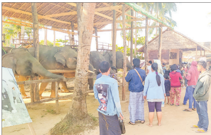
Some elephant camps seen in the Ayeyawady Region.

sized that the livestock farms and elephant camps are being strategically planned to augment tourism to the beaches and draw more visitors. Addi-