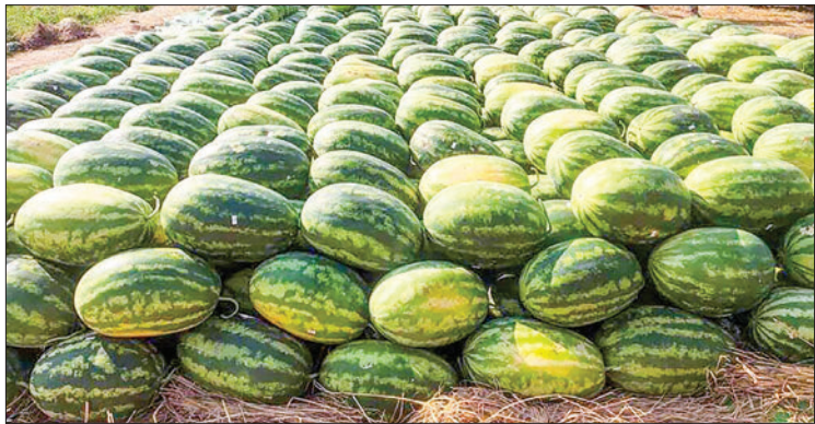
Quality watermelons seen in the market.

KHWANYO Fruit Depot recommends Myanmar exporters closely monitor supply and demand dynamics and market conditions before exporting to China.