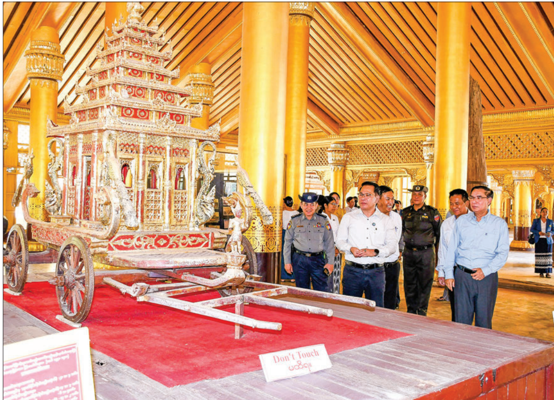
Union Minister for Information U Maung Maung Ohn visits Kanbawzathadi Palace in Bago yesterday.

During the meeting, the Union Minister acknowledged the development in Bago Region and highlighted the peace and prosperity of the entire nation, emphasizing the destructive actions of unscrupulous persons through the spread of misinformation and disinformation. He also underscored the need to consider the destructive actions of foreign countries-backed media outlets that broadcast false information. He encouraged participants to read newspapers, websites, and social networks of the Information Ministry for accurate news and learn from the 1988 case in which powerful foreign media outlets spread misinformation and disinformation aiming at the disintegration of national unity and