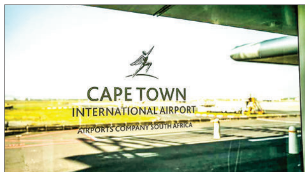
The file photo shows the logo of Cape Town International Airport on a window at Cape Town International Airport, South Africa, 6 August 2021.

"Additionally, the total two-way international passenger figures for 2023 have nearly doubled over the past decade from 1.5 million two-way international passengers recorded in 2013," read the statement. "This significant increase in passengers showcases the impressive growth in demand for Cape Town and the Western Cape as a premier travel destination." — Xinhua