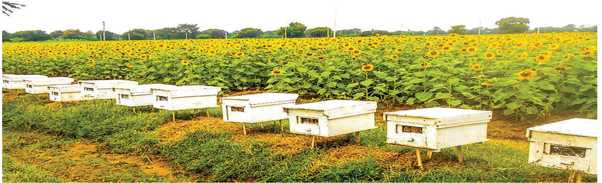
Beehives systematic placed besides sunflower plantation.

M YANMAR'S marketable honey is produced in hilly and plainland areas during the cold season. This year, the country is set to ship over 3,000 tonnes of honey to foreign countries, as reported by the Apiculture Division under the Livestock Breeding and Veterinary Department.