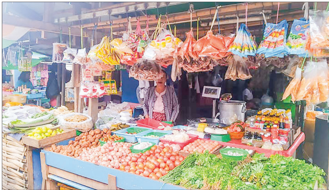
A photo shows a retail grocery shop.

Chinese potato prices fetched K2,600-K2,900 per viss