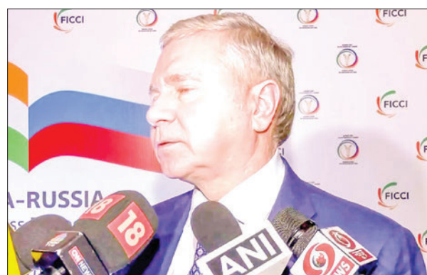
Cheremin launched Moscow's pavilion at the 31 st Convergence India and 9 th Smart Cities India Expo, expressing Moscow's interest in collaboration with Indian cities in developing smart cities.

Cheremin, who is the Head of the Department for External Economic and International Relations of Moscow, also launched Moscow's pavilion at the 31 st Convergence India and 9 th Smart Cities India Expo. “This is the first time we are participating in this event.