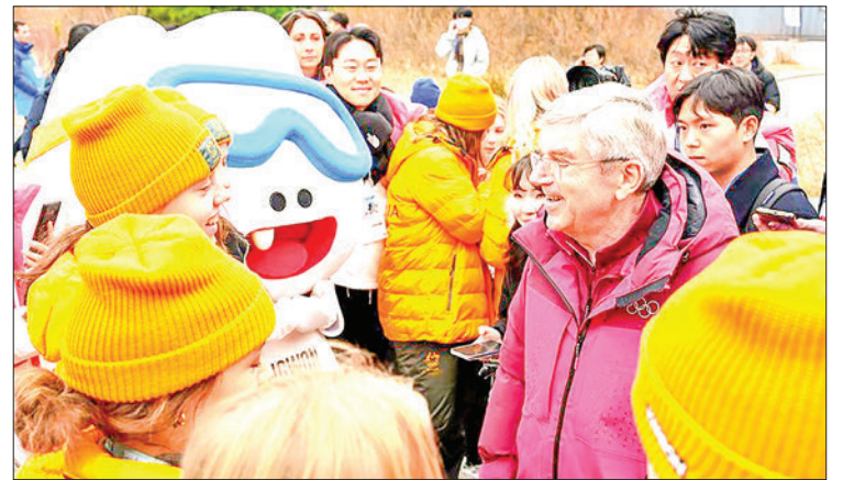
International Olympic Committee (IOC) president Thomas Bach (R) chats with athletes during his visit to the 2024 Winter Youth Olympic Games (YOG) Village, in Gangneung, South Korea 17 January 2024.

During his visit to the Athletes Village in Gangneung, South Korea, Bach praised the quality of accommodation and facilities, noting that athletes are very satisfied, and he affirmed that everything is set for a successful Games.