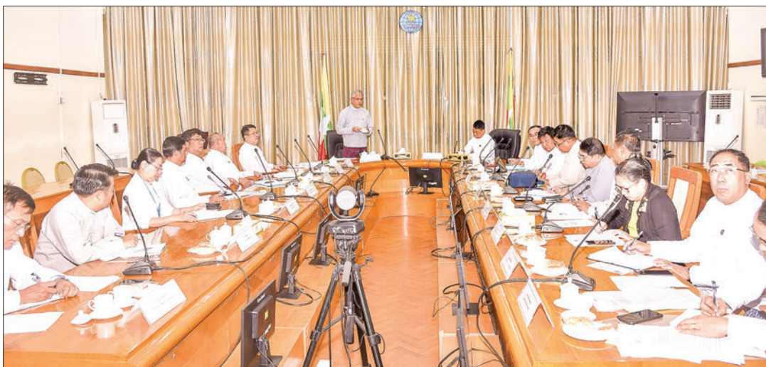
Union Minister U Aung Naing Oo speaking at meeting on implementation of infrastructure works of Kyaukpyu SEZ deep-sea port yesterday.

also serves as the Chairman of the Central Task Force on Myanmar Special Economic Zones, urged the timely completion of supportive work for the project by the respective ministries. — MNA/KZL