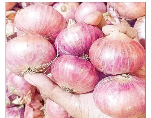
Some pieces of onion caught in a photo.

THE price of onions, a major ingredient in Myanmar's widely consumed dishes, is falling, and the market is still unstable, according to onion traders.