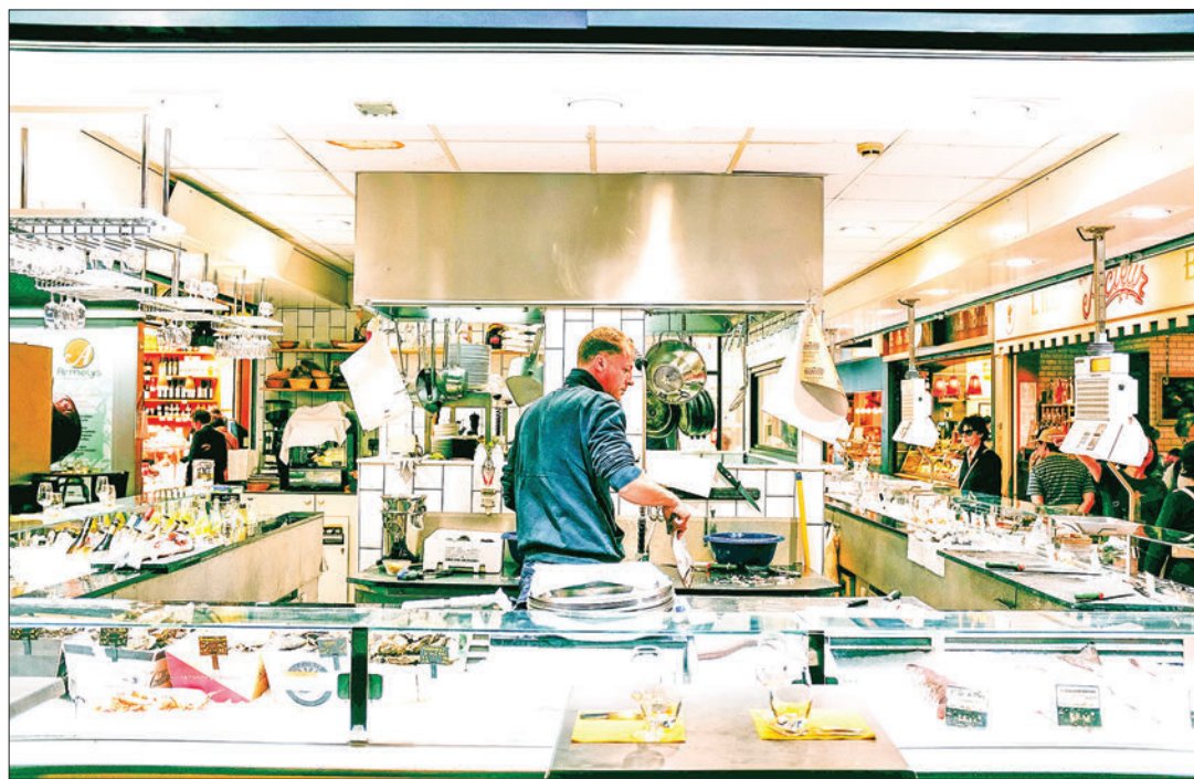
The transformation of the Miyako Fish Market reflects a combination of resilience in the face of natural disasters and an embrace of technology to enhance business operations and international trade.