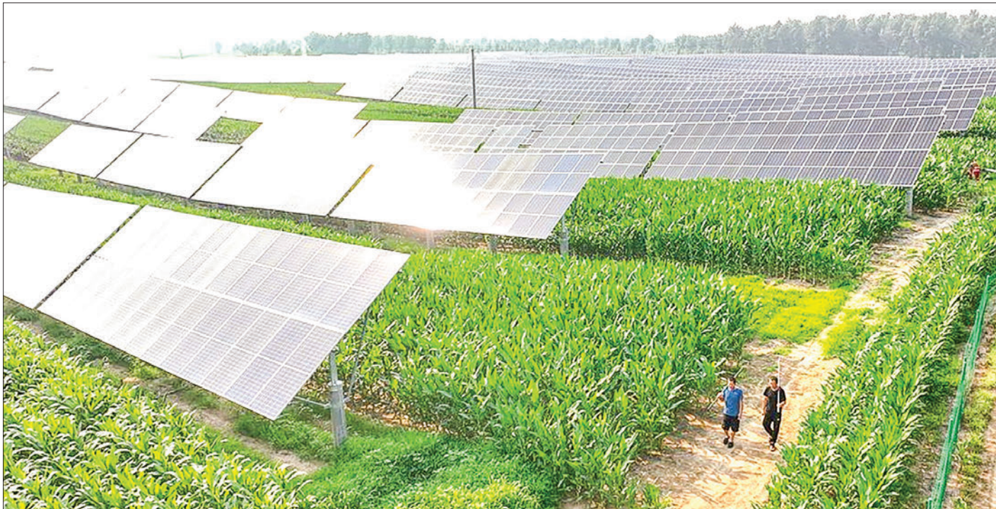
This aerial photo taken on 11 July 2023 shows photovoltaic panels in Zhangwu County in northeast China's Liaoning Province.