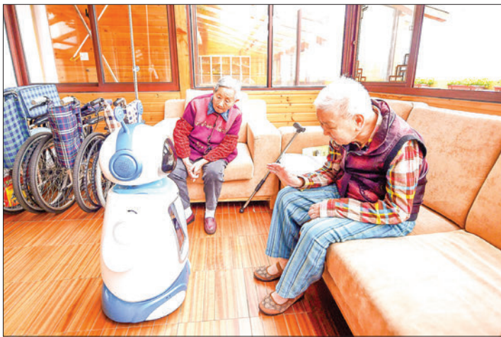
Robot nurses often incorporate advanced technologies such as artificial intelligence, machine learning, and sensors to interact with patients and adapt to changing healthcare needs.

Prioritizing senior citizens' well-being, efforts are urged to cultivate industry leaders, stimulate senior citizen consumption, and nurture new business models related to smart health and elderly care, including technologies like nursing robots and biotechnologies for age-related illnesses.