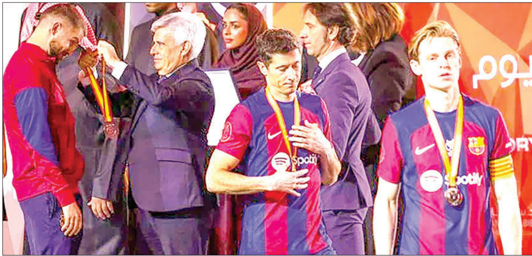
FC Barcelona and coach Xavi Hernandez face a crucial test in the Copa del Rey last-16 tie against Unionistas de Salamanca.

en's regu competition will secure K1.2 million, and the first-runners up will receive K800,000 in cash awards. — TWA/KZL