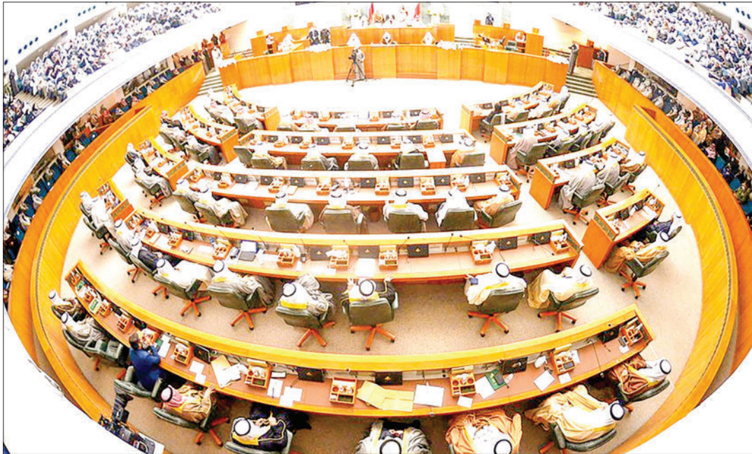
The National Assembly (parliament) in Kuwait City, Kuwait.

Emir Sheikh Mishal Al-Ahmad Al-Jaber Al-Sabah approved the nominated cabinet members.