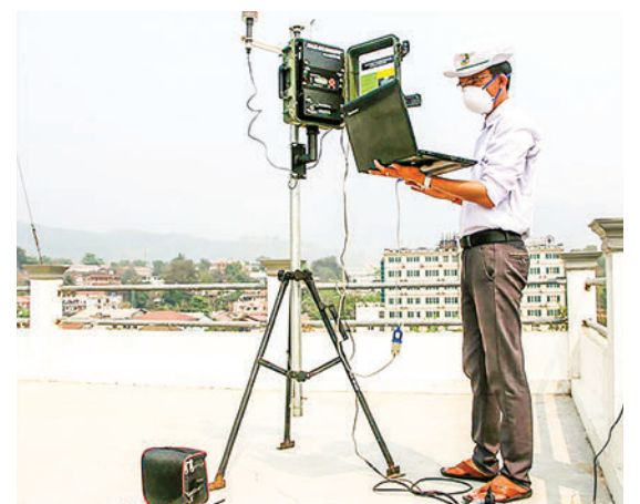
Air quality assessment in process.

The department uses the Environmental Perimeter Air Station (EPAS) - Haz-Scanner to