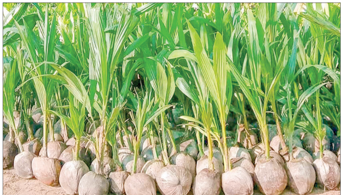
Young coconut saplings kept in nursery for sale.

The trainees have to practically make coconut crafts such as lamps, DIY lamp shades, curtains, necklaces, keychains, and earrings. They will receive a completion certificate. — NN/EM