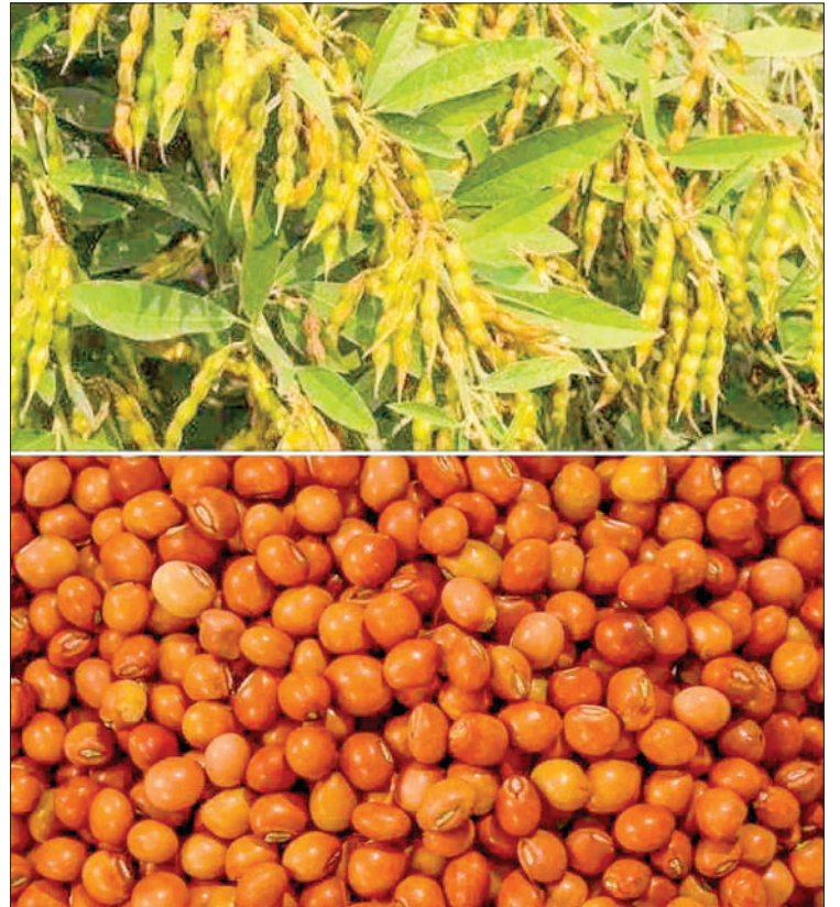
Pigeon plants bearing ripening pods.

Myanmar bagged $1.47 billion from 1.9 million tonnes of pulses exports last FY 2022-2023, according to the Ministry of Commerce's statistics. — NN/EMM