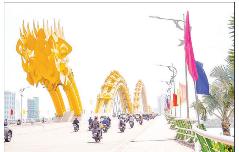
Photo taken on 27 July 2022 shows a view of Trong Mai Islet or Rock of “The Kissing Cocks” in Viet Nam’s northern Quang Ninh province.

According to the General Statistics Office, nearly 160,000 enterprises were established in Viet Nam in 2023, posting a record high and a surge of 7.2 per cent year-on-year. — Xinhua