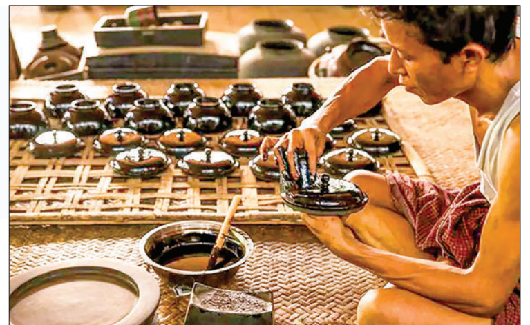
Crafting Myanmar lacquerware, a form of small-scale cottage industry.

From April to March of the 2023-2024 financial year, 2,890 registrations were planned, and currently, 2,380 of them have been completed. The 13 types of businesses include foodstuffs,