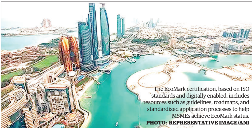
The EcoMark certification, based on ISO standards and digitally enabled, includes resources such as guidelines, roadmaps, and standardized application processes to help MSMEs achieve EcoMark status.

EcoMark status, covering document requirement guidelines and a roadmap to progress from basic to advanced levels of sustainability, and a standardized application process and complete eligibility criterion for accreditors in the participating countries. — ANI