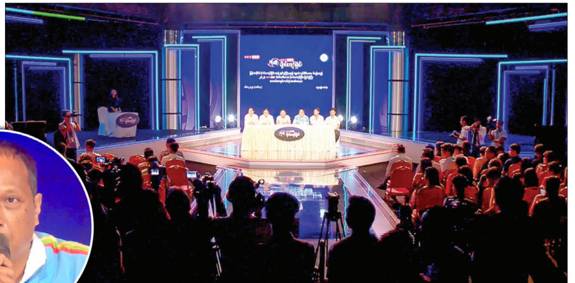
The press conference for 2024 Sky Net Sepak Takraw Invitational Tourney in progress.

4-person competition will receive K3 million, with the first-runners up getting K2 million. Similarly, the winners