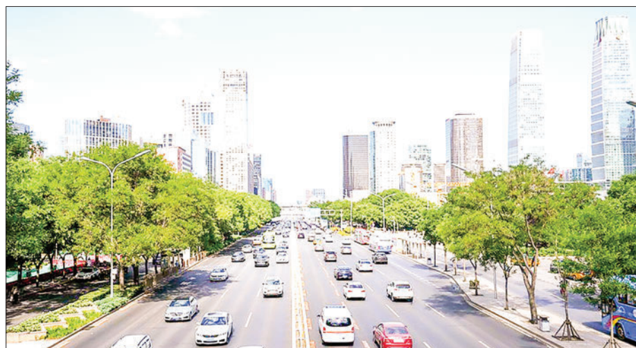
Vehicles run at the Central Business District (CBD) in Chaoyang District in Beijing, capital of China, 6 June 2022.