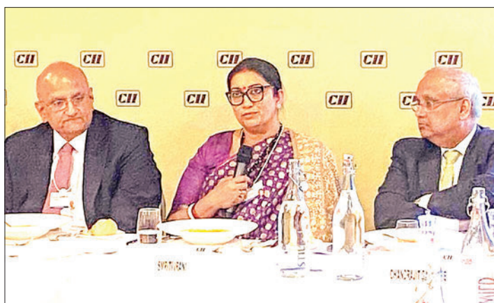
Union Minister Smriti Irani.

PM Modi brought it to the centre stage and implored