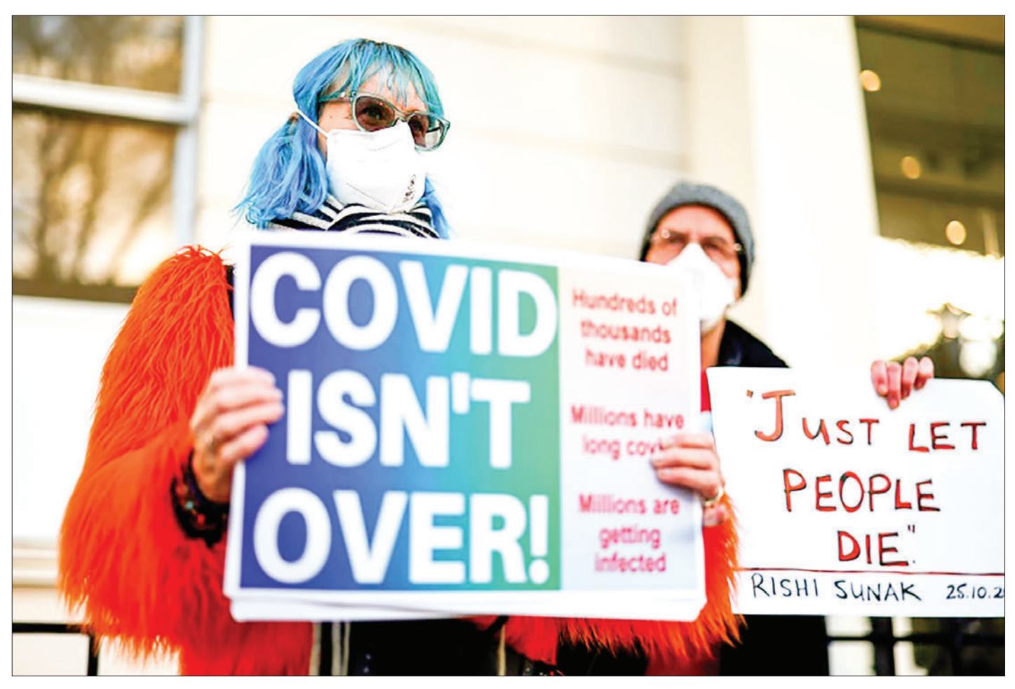
While many governments are still holding enquiries into their Covid-19 action they cannot agree international action to prevent a new pandemic.

AVERING world leaders were told Tuesday to speed up efforts to agree a global treaty on avoiding a new pandemic catastrophe — four years to the day since Covid-19 was declared an international emergency.