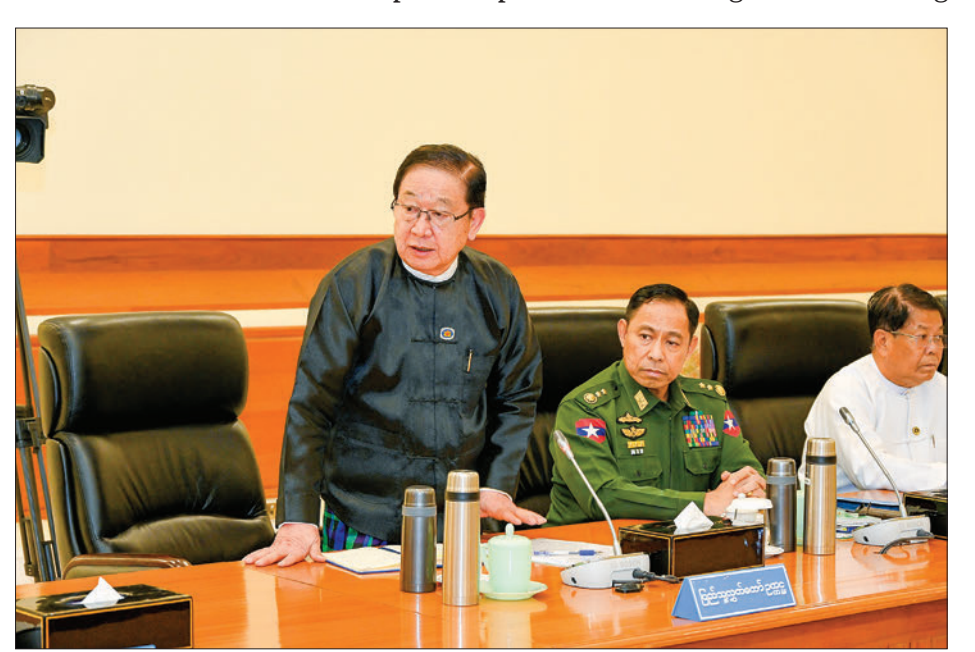
Speaker of Pyithu Hluttaw U T Khun Myat supports the six-month extension of the State of Emergency.

Insurgents and terrorists taking advantage of instability in the country produce narcotic drugs and commit drug