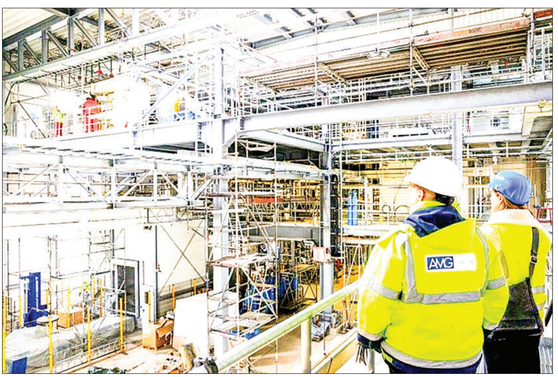
Germany's first large-scale lithium refinery is setting up in Bitterfeld-Wolfen.

Starting production in May, the plant's output is a crucial element in the EU's strategy to reduce dependence on foreign imports.