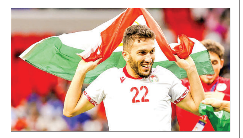
Tajikistan have reached the Asian Cup quarter-finals in their tournament debut. PHOTO: AFP

"Until this Asian Cup, we didn't have stars. Now all our players are stars," he told AFP in Doha. — AFP