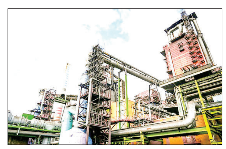
Germany's strengths, such as a robust industry, excellent infrastructure, and rich cultural heritage, were highlighted.

The German delegation, led by German Secretary of State at the Federal Foreign Office