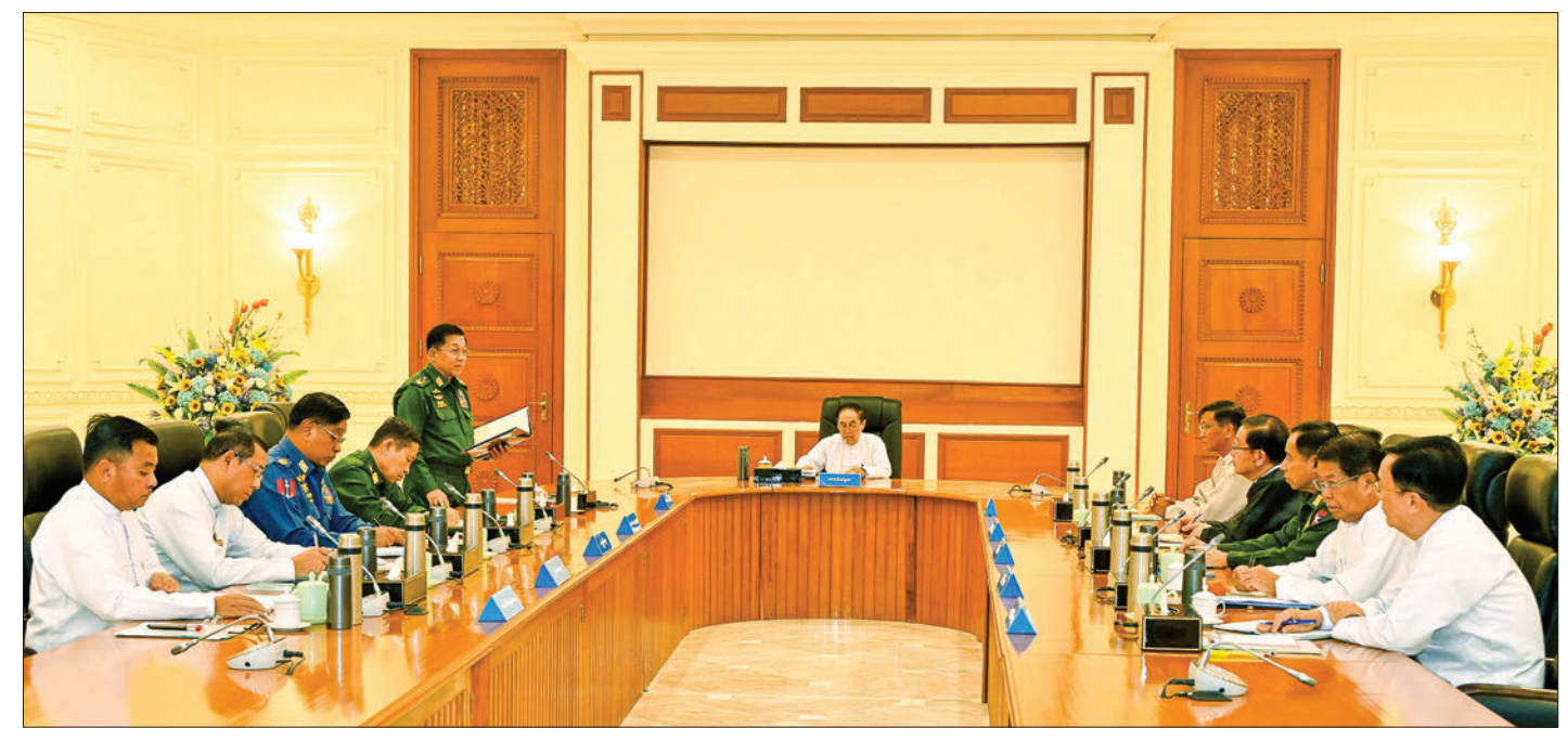
Senior General Min Aung Hlaing puts forward wide-ranging clarifications to the meeting 1/2024 of the National Defence and Security Council in Nay Pyi Taw yesterday.

MNDAA insurgents attacked Chinshwehaw and Kunlong, whereas its allied TNLA insurgents attacked Hsenwi on the Lashio-Muse route and disturbed Kutkai. TNLA insurgents attacked the Muse trade zone in 2016 and people's militia camps and security outposts in Muse in 2018. So, clashes happened between Tatmadaw and TNLA. TNLA continued attacks on Namhkam, Namhsam, Mantung, Namtu and Mongngaw regions. It aims to grasp the Palaung region. The Constitution sets the Palaung Self-Administered Zone for the Palaung region. TNLA commits attacks to seize the greater power. They extremely rob and destroy the property of residents and recruit new troops, causing plight to residents. So, tea production in the Palaung region has declined. All basic education schools were closed. Up to