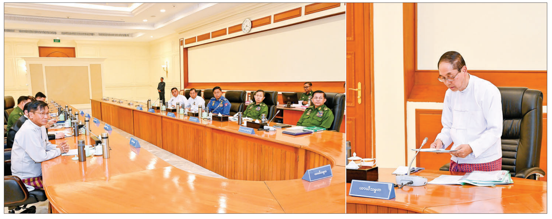
Pro Tem President U Myint Swe presides over the meeting 1/2024 of the National Defence and Security Council of the Republic of the Union of Myanmar in Nay Pyi Taw on 31 January 2024.