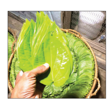
A customer checks betel leaves at the market.

There is an adequate irrigation water supply for