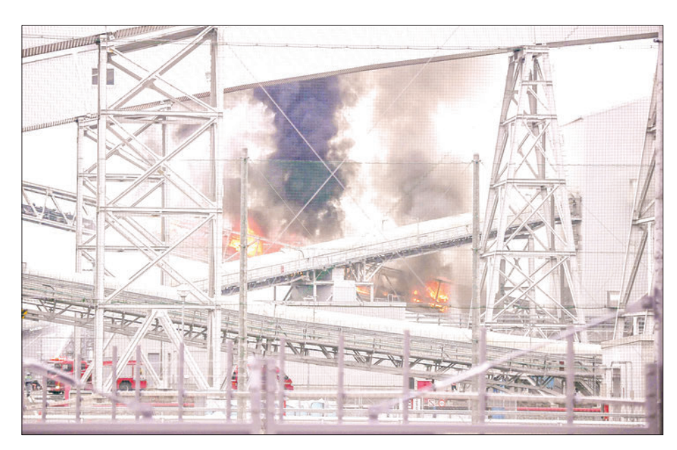
Black smoke rises from Jera Co's Taketoyo Thermal Power Station in Taketoyo, Aichi Prefecture, on 31 January 2024.

The explosion apparently occurred inside a boiler facility on the 13th floor of a building, according to the local fire department. A conveyor system used to transport fuel also caught fire. — Kyodo