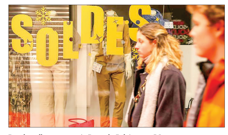
People walk past a store in Brussels, Belgium, on 5 January 2024.

Compared with 2022, the eurozone economy grew by 0.5 per cent in 2023. The rate is markedly lower than estimations from market observers at the beginning of 2023. — Xinhua