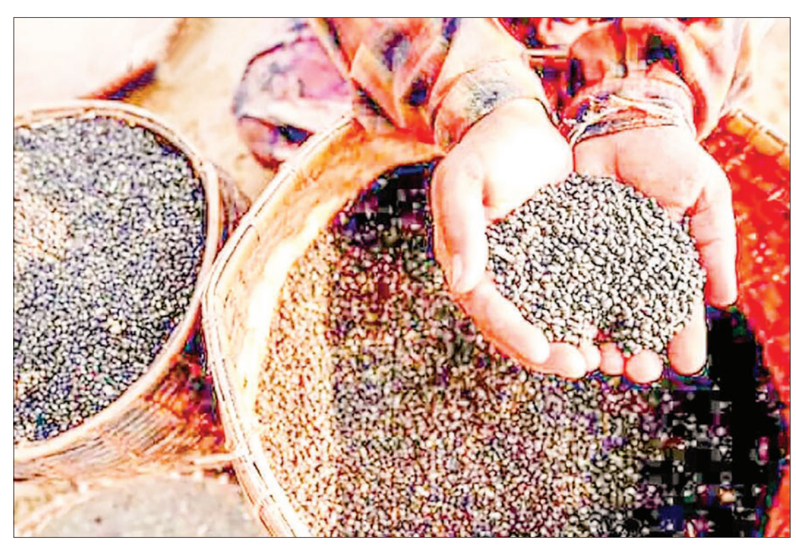
The picture shows the quality of black grams before being delivered to the market.

Myanmar mainly exports black gram, green gram and pigeon peas to foreign markets. Black gram and pigeon peas are