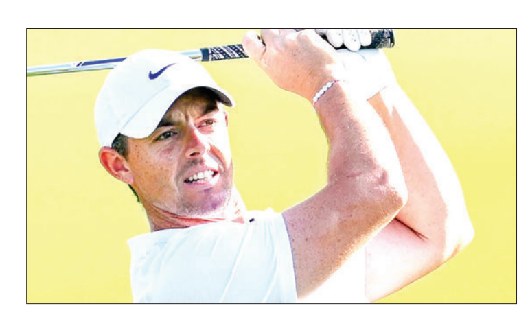
Rory McIlroy of Northern Ireland says PGA Tour titles are cheapened when many of the world's top players are banned after jumping to rival LIV Golf and merging the tours is more important than punishing defectors who seek a return.

And the four-time major champion from Northern Ireland says it's more important to complete a merger between