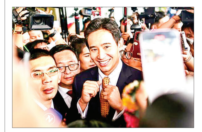
Pita Limjaroenrat was cleared last week of breaching Thai election laws.