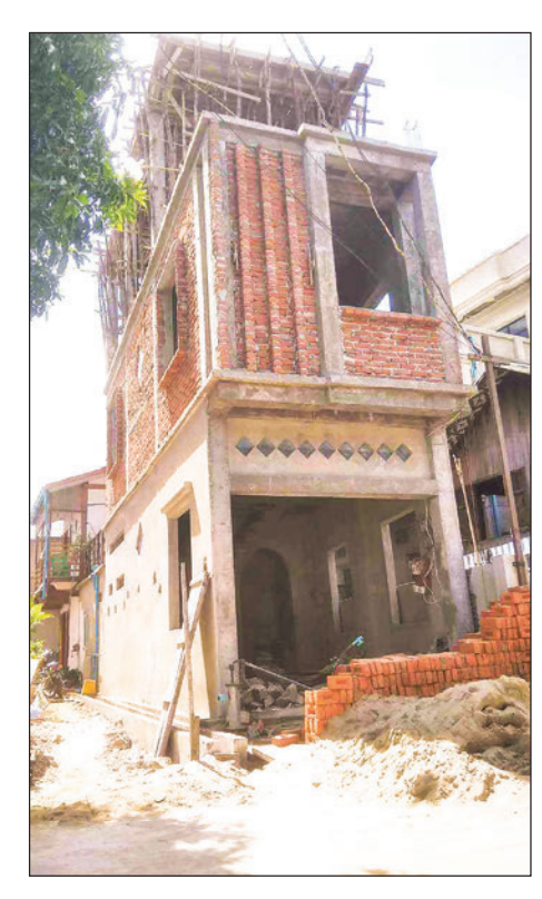
A building under construction within the municiple area of Yangon City Development Committee.

This week, licensed contractors will be invited to a meeting to get the BCC and install electricity meters for the buildings. Yangon Electricity Supply Corporation takes the responsibility of installing the electricity meters. — TWA/KZL