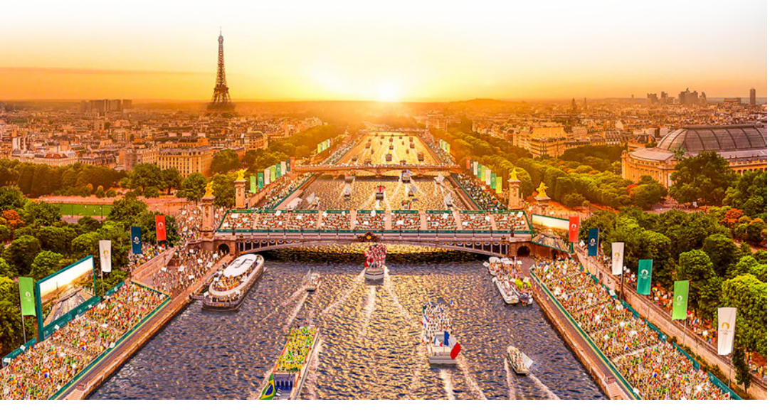
The traditional parade on the river Seine will host around 300,000 ticketed spectators on 26 July, a significant reduction from earlier estimates of 600,000.