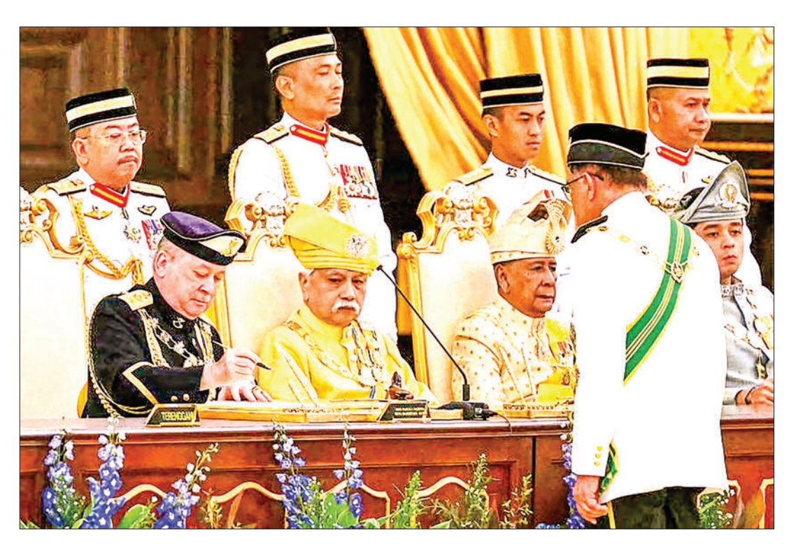
Sultan Ibrahim Iskandar (left) signing the documents received from PM Anwar Ibrahim (right) at the ceremony.