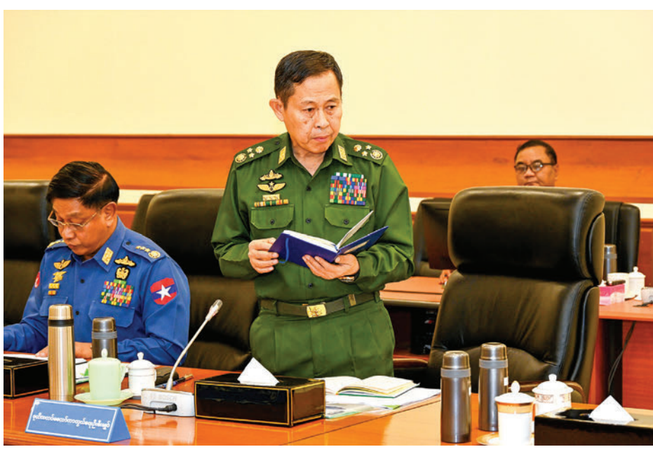
Deputy Commander-in-Chief of Defence Services Vice-Senior General Soe Win seconds the submission of the Commander-in-Chief of Defence Services.

Since its establishment, SAC has been implementing two political visions: strengthening a genuine, disciplined multiparty democratic system and building a union based on democracy and federalism. To do so, all citizens have to participate in the implementation process. All must avoid the acts of derailing from the democratic system and abide by existing laws under the Constitution. It is necessary to choose the appropriate system related to the democratic system and federalism in