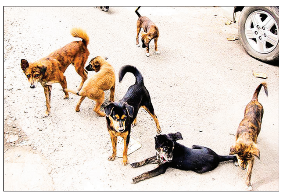
The photo shows stray dogs in Sangyoung Township.

of fatality for individuals. According to WHO, one person dies from rabies every 15 minutes globally. Annually, between 55,000 and 70,000 people succumb