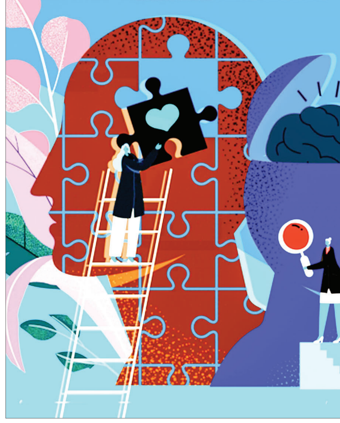
YOU'RE AFRAID TO TAKE Stephen Buckley from Mind emphasizes that mental health is as vital as physical health and requires attention.